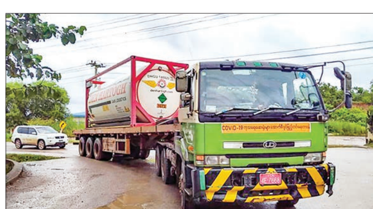
Imported liquid oxygen tank via the Myawady land border.