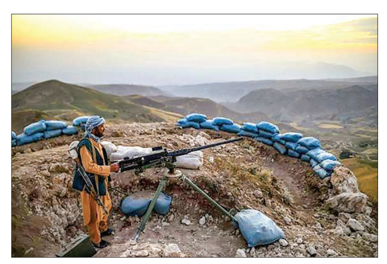
Afghanistan has seen a deadly surge in fighting in recent months.

MORE than a dozen diplomatic missions in Afghanistan on Monday called for "an urgent end" to the Taliban's ruthless military offensive, saying it was at odds with claims they want a negotiated settlement to end the conflict.