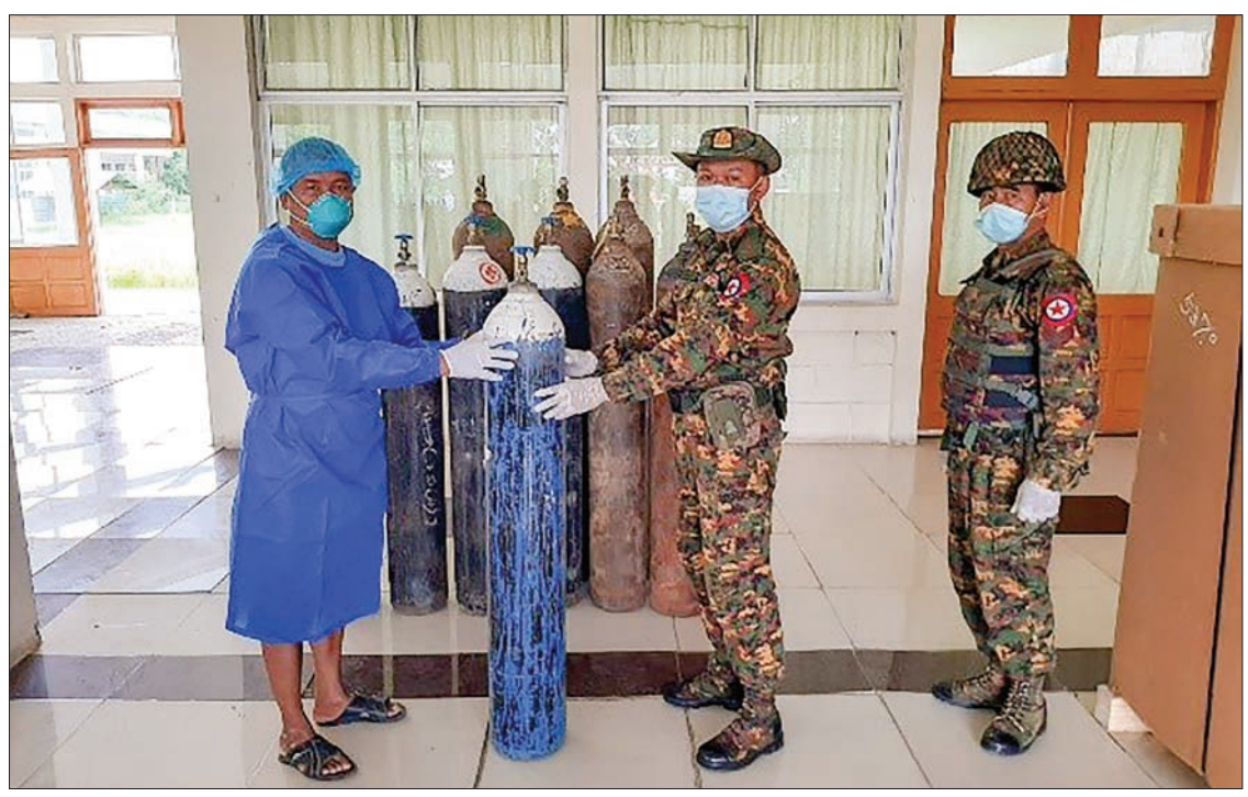
Oxygen cylinders are donated to the 300-bedded Hospital in Nay Pyi Taw.

In addition, 120 oxygen cylinders were donated to public hospitals, Tatmadaw hos-