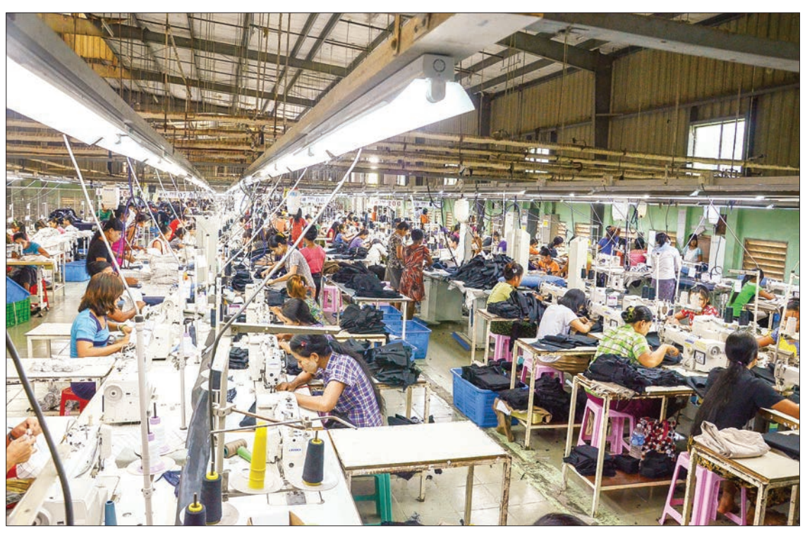
Myanmar's manufacturing sector is largely concentrated in garment and textiles produced on the Cutting, Making, and Packing basis. It contributes to the country's GDP to a certain extent.

The garment industry is facing cancellation of the order and a slump in output, new orders. However, The Swedish fashion retailer H&M is gradually placing orders from Myanmar again after it paused in March. Then, more