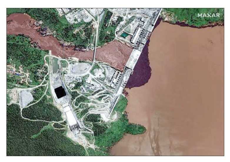
The Grand Ethiopian Renaissance Dam, pictured in a satellite image last July by Maxar Technologies /Satellite image ©2020 Maxar Technologies. PHOTO: AFP/FILE

The goal for this year's rainy season was to add 13.5 billion cubic metres. There is now enough