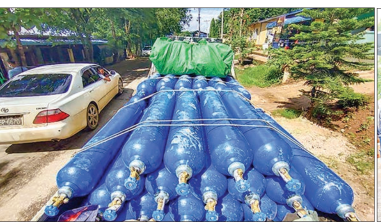
Imported oxygen cylinders via the Chinshwehaw land border.