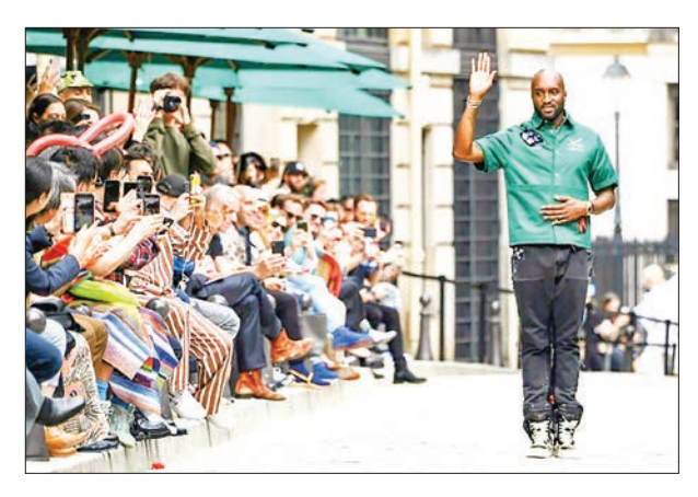
Virgil Abloh is the first black American creative director of a top French fashion house.

FRENCH luxury conglomerate LVMH said Tuesday it intends to take a majority stake in the luxury streetwear label Off-White created