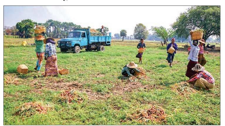
The high demand by foreign markets and a remarkable rise in price prompted the growers to expand the onion cultivation in 2020. Unfortunately, the market is getting worse amidst the COVID-19 negative consequences.

The onions are primarily grown in Mandalay, Magway and Yangon regions, Nay Pyi Taw and Shan State.