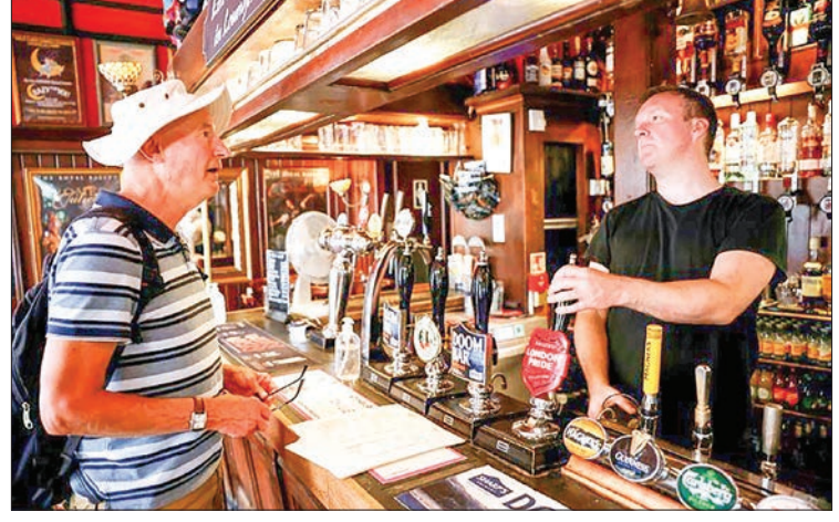
England lifts virtually all of its coronavirus restrictions, setting it at odds with the three other nations of the United Kingdom and sparking concern among scientists.

day" easing of Covid restrictions on Monday, even as many others saw little to celebrate.