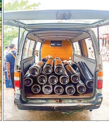
Imported oxygen cylinders via the Tachilek land border.

It has been announced that private companies should mention the name of the contact person, company name and the phone number in China in the application form for the materials and medical supplies to be delivered quickly from the Muse border, and in case of inquiries, responsible contact persons can be found on the Ministry of Commerce's Website commerce.gov. mm. - MNA