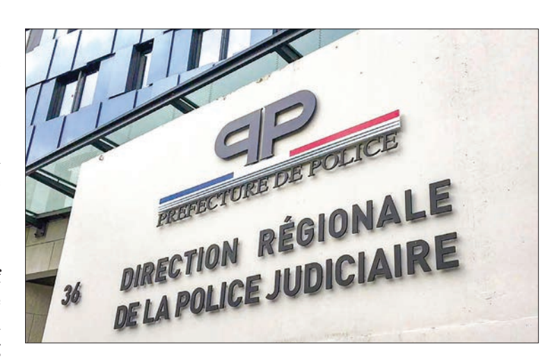
French police arrested another former far-left extremist from Italy's Red Brigades on Monday, three months after the detention of nine other suspected ex-members of the violent group from the 1970s and 80s.

years of a 14-year prison sentence over the attempted kidnapping of a senior police officer in Rome in 1982 who was left with