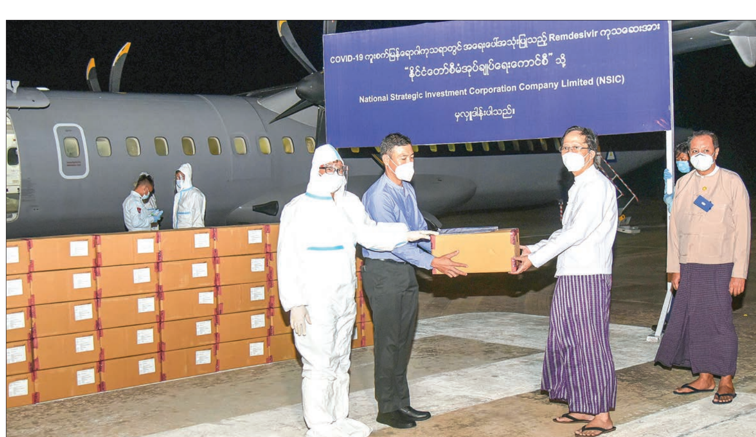
The MoHS Union Minister is receiving Remdesivir for the treatment of COVID-19 from the donor National Strategic Investment Corporation Co. Ltd (NSIC) at Nay Pyi Taw Airport on 20 July 2021.

The Remdesivir drugs are used for emergency treatment of COVID-19. It is the most effective medicine to reduce the death toll from the highly contagious COVID-19 virus worldwide. It was developed by Gileat Sciences Inc. in the United States of America and is FDA-approved in the US and Europe.