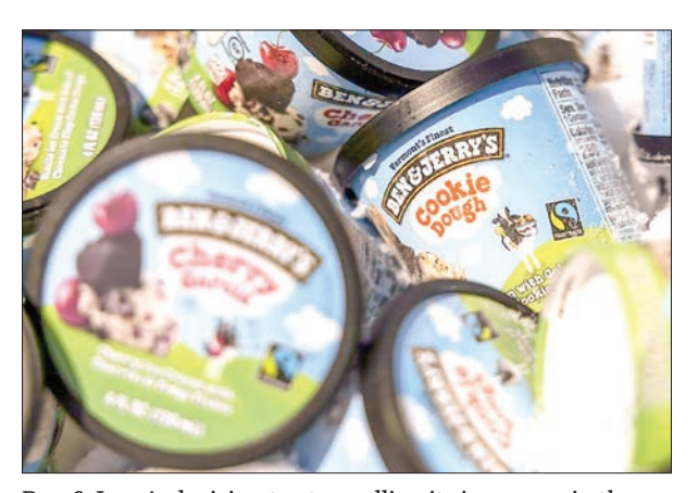
Ben & Jerry's decision to stop selling its ice cream in the occupied Palestinian territories drew the ire of Israeli political leaders.

Israeli political figures met the announcement with ire. with Prime Minis-