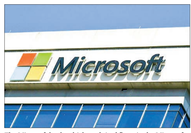
The Microsoft hack, which exploited flaws in the Microsoft Exchange service, affected at least 30,000 US organizations including local governments as well as organizations worldwide.

Russian government, is not doing this themselves, but are protecting those who are doing it, and may-