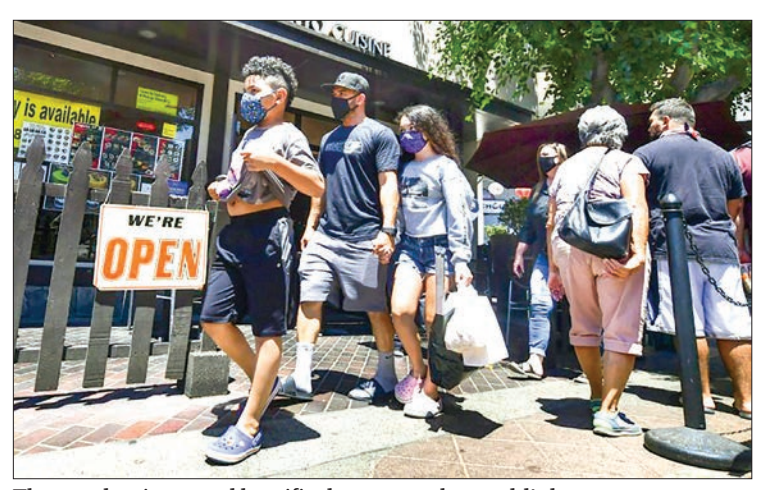
The pandemic caused horrific damage to the world's largest economy.

The president made the case that his administration's vaccination push and his sweeping domestic agenda, which includes the injection of trillions