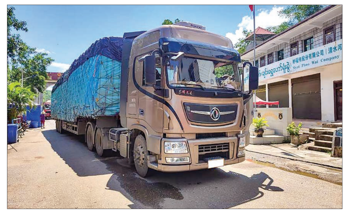
Imported medical supplies via Chinshwehaw land border.

It is reported that essential medical equipment including 11 home oxygen concentrators; 5,395 packs of masks and 280 boxes of the pill have already arrived at Chinshwehaw land border.