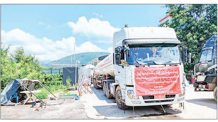
Imported liquid oxygen tank via the Muse land border.

The import of medical supplies, COVID-19 devices and Covid-related equipment, which are urgently needed by the people, have not stopped even on public holidays. Yesterday, 72 tonnes of liquid oxygen, 4 oxygen generators, 3,978 oxygen concentrators, 20,000 test kits and 55 tonnes of masks were imported. From 12 to 20 July, 441 tonnes of liquid oxygen, 62 tonnes of oxygen cylinders, 15,561 oxygen concentrators, 134,500 test kits and 420 tonnes of masks were imported.