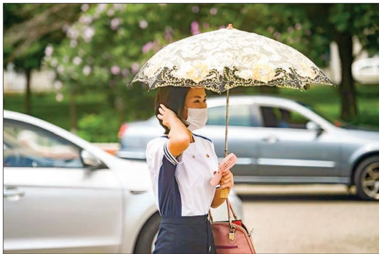
Pyongyang's residents are coping with higher-than-average temperatures.

"Officials and working people in all the fields and regions across the country have turned out in the campaign for preventing the damage from fierce heat and drought," the Rodong Sinmun newspaper said last week. The paper added that forestry officials should be on the lookout for wildfires, and agricultural workers should watch out for pests and other heat-related crop damage. A health official told state-run KCTV last week that North Korea expected another heatwave at the end of the month. —AFP ■