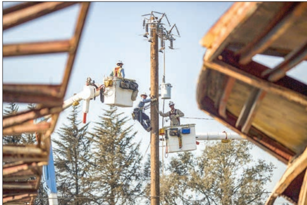
Pacific Gas and Electric Company crews work to restore power near fire-damaged Cardinal Newman High School in Santa Rosa, California on October 14, 2017.