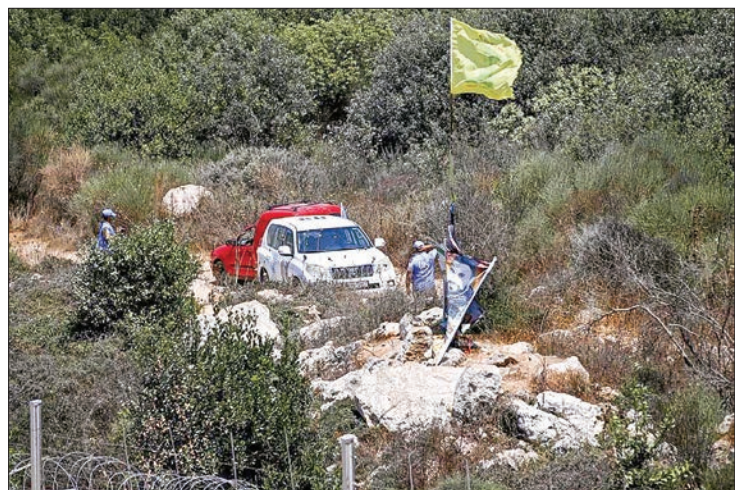
United Nations peacekeepers stand next to a Hezbollah flag raised on the Lebanese side of the border fence with Israel, near the northern Israeli settlement of Shtula.

ISRAEL shelled Lebanon early Tuesday in response to earlier rocket attacks, the Israeli army said, as the United Nations