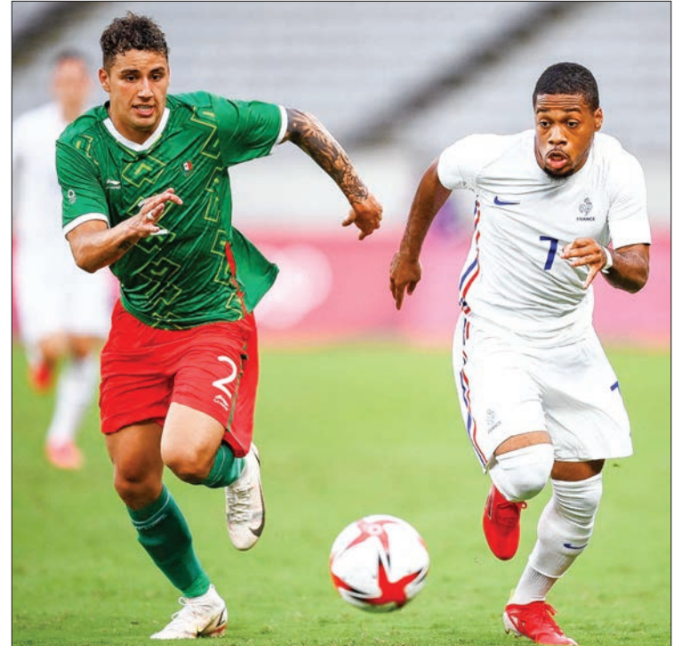
France's bid for men's Olympic football glory got off to a nightmare start with a 4-1 defeat by Mexico on Thursday, while a strong Spain side stuttered to a goalless stalemate with Egypt.

But all thoughts of a comeback were dismissed when Uriel Antuna and Eduardo Aguirre snatched up late for 2012 champions Mexico. France now faces an uphill task to emerge from Group A with a top two place, ahead of games against Covid-stricken South Africa on Sunday and