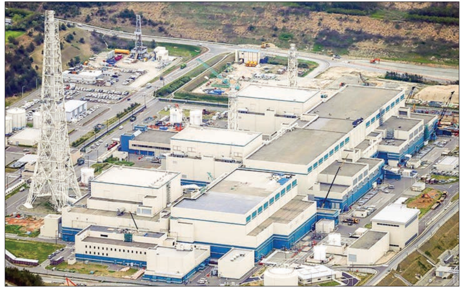
Reactors at Kashiwazaki-Kariwa nuclear power plant.

Touching on scandals that have recently come to light such as inadequate security measures at the Kashiwazaki-Kariwa plant in Niigata Prefecture, Kobayakawa underscored