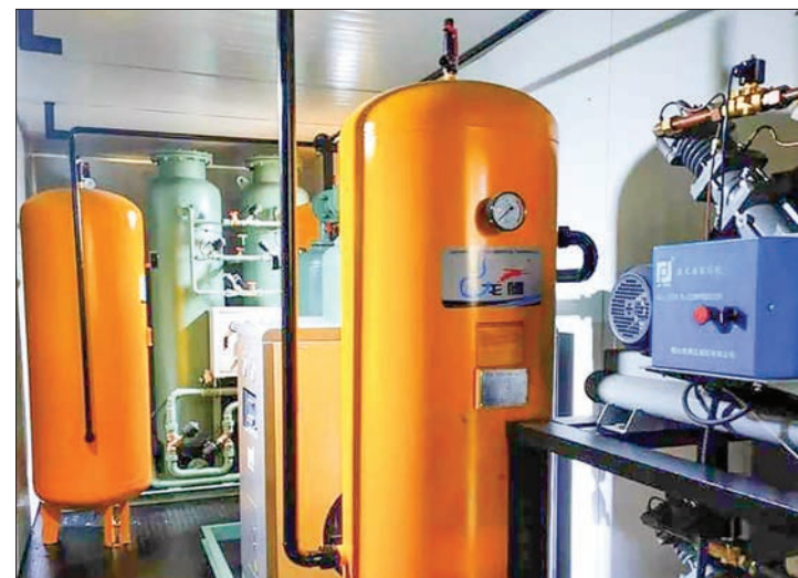
According to a member of the Kawlin Township Oxygen Implementation Committee, a deposit of US$23,500 has already been paid for the oxygen plant construction and equipment will arrive at the port of Yangon within 45 days of signing the contract and will be transported to Kawlin as soon as possible.

That oxygen plant will produce 80 cylinders (40L) per day. The people in Twantay are urgently searching for oxygen as Myanmar is running out of oxygen, for now, said a philanthropist from Twantay Township. — Maung Yin Oo