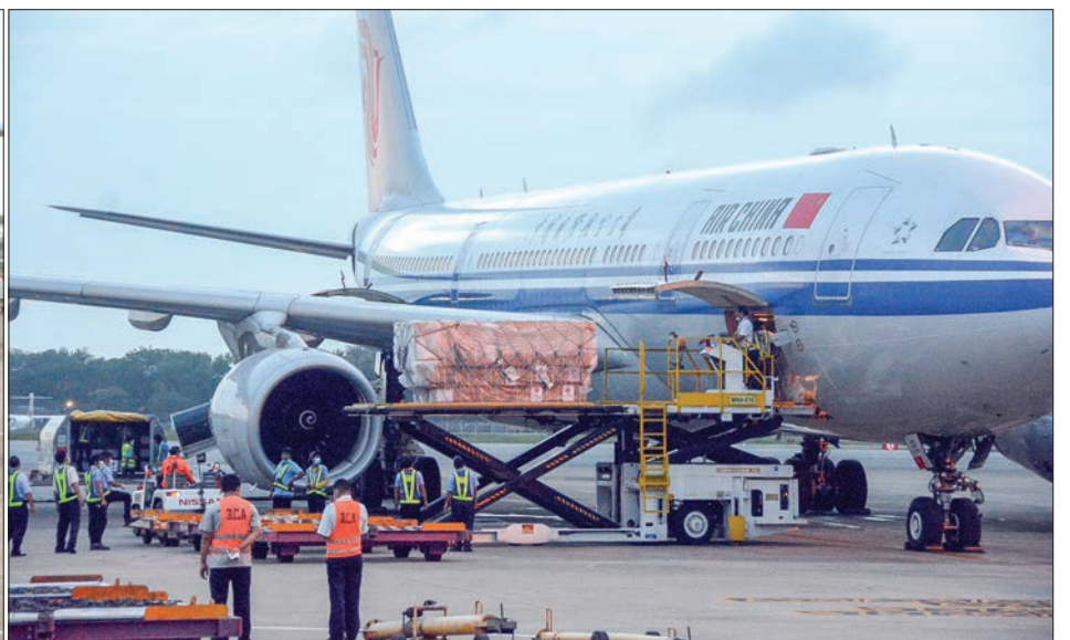
A total of 736,000 doses of COVID-19 vaccines and related materials manufactured by Sinopharm Company and donated from the People's Republic of China arrived yesterday at the Yangon International Airport.

between China and Myanmar and the development of practical cooperation against the pandemic. He added a special route has been opened through Yunnan Province to provide