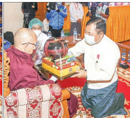
Lt-Gen Soe Htut.