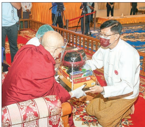
General Mya Tun Oo.