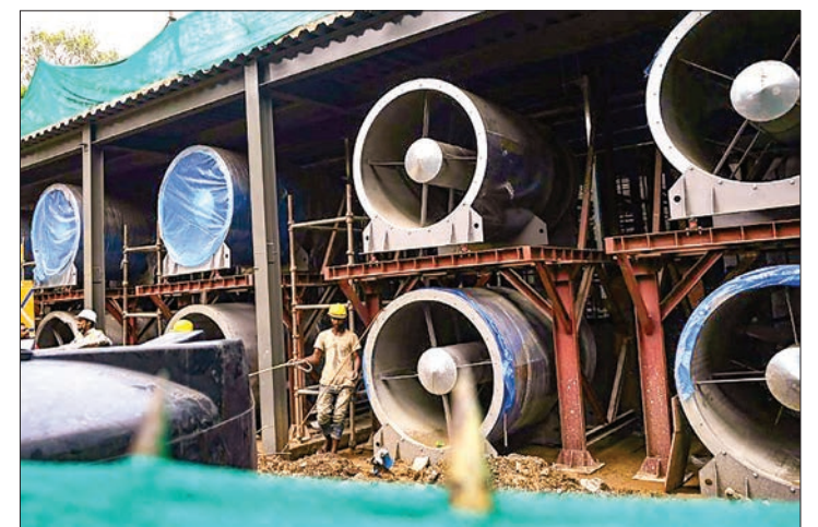
The fresh air tower's benefits are contested by environmental experts who say it will make little difference to the city's air quality.

A new attempt at purifying New Delhi's notoriously polluted air will see forty giant fans push out filtered air in the heart of the Indian capital's posh downtown shopping district.