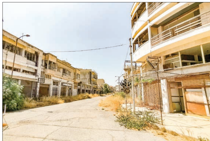
A view of the abandoned town Varosha (Maraş) in northern Cyprus, 2 Sept. 2019.

Cyprus has been divided since 1974 when Turkey invaded