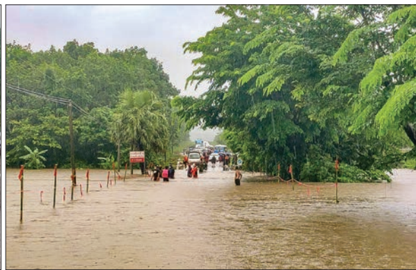
Flood impacted road transport at 1 pm on 20 July in Mudon Township, Mon State due to the continuous rainfall from 4 pm on 19 July. The heavy rainfall resulted in a flood on Mawlamyine-Thanbyuzayat Road between Hneepadaw village and Yaungdaung village in Mudon Township.