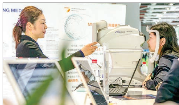
An exhibitor of Novartis examines a visitor’s retina at the Medical Equipment & Health Care Products area of the first China International Import Expo (CIIE) in Shanghai, east China, 7 Nov. 2018.

cy variations were stripped out. Increases in volumes would have implied a 13 per cent sales gain, but reduced prices and increased competition from generics reduced this figure to nine per cent. Of that, Novartis estimates four percentage points came from clients stocking up after cutting back orders last year at the height of the pandemic. While pharmaceutical companies might at first glance be expected to have benefited from the pandemic, companies like Novartis saw sales drop last year.