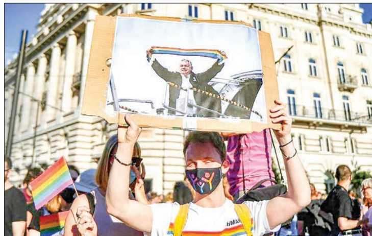
Hungary's Prime Minister Viktor Orban said Wednesday that a referendum would be held to gauge domestic support for a controversial LGBTQ law, after the European Commission launched legal action against Budapest over the measure.

referendum, which he presented as a list of demands that the