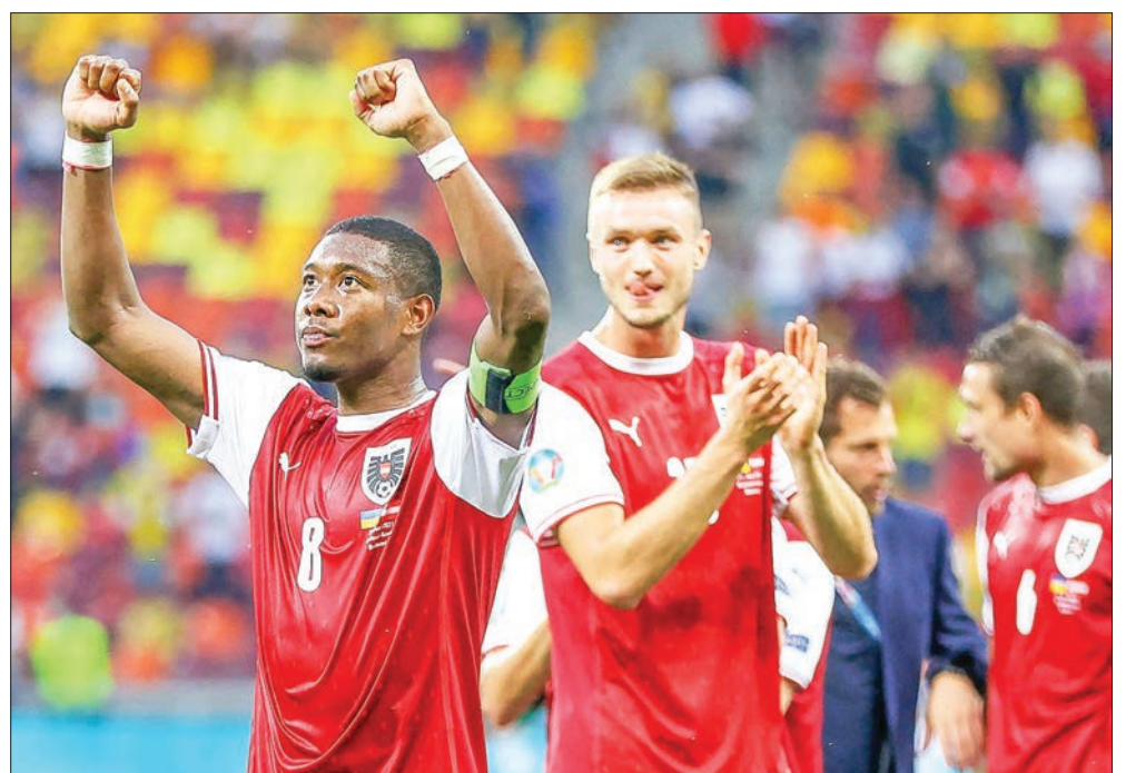
David Alaba has taken the shirt number worn by departed Real Madrid captain Sergio Ramos because, he said on Wednesday, the club told him it was the only one available.

"It's a dream come true for me, this is the best club in the world," he said of the move to the Spanish capital. Alaba said he had an "excellent relationship" with Carlo Ancelotti who was at Bayern for 18 months and has taken over as Madrid coach.— AFP ■