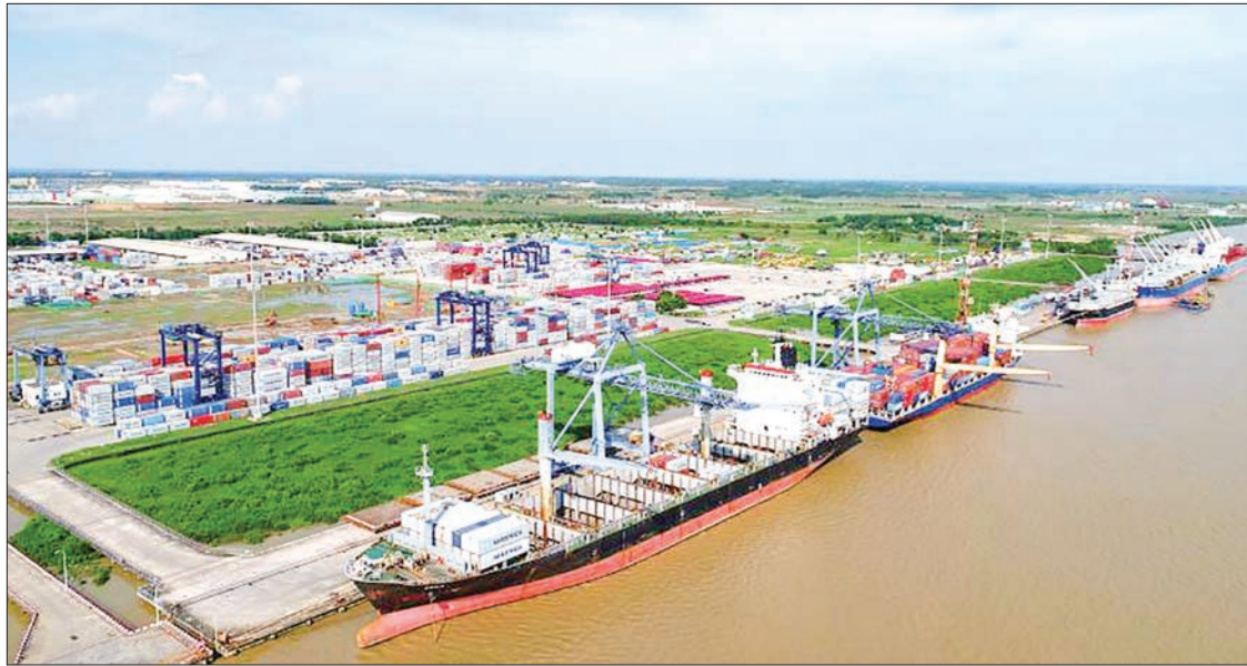
Myanmar International Terminal Thilawa (MITT).

Myanmar Port Authority ensures smooth freight flow with non-stop operation during the public holidays (17-25 July).