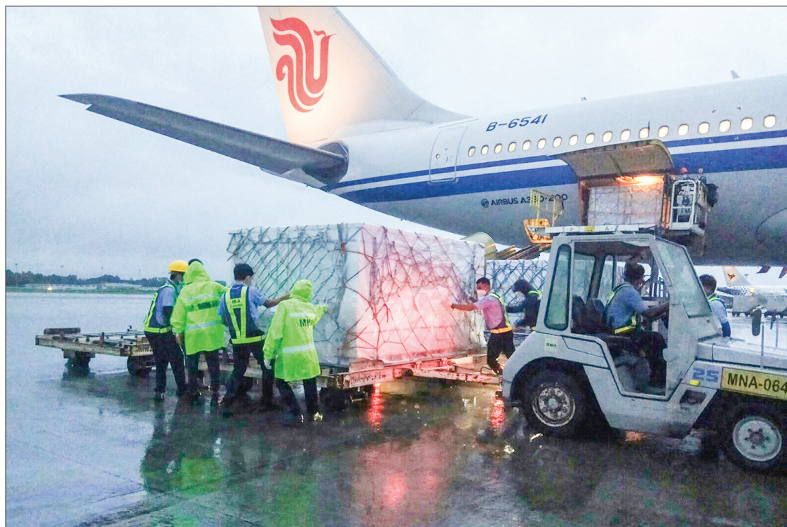
Anti-COVID-19 vaccines arrive at Yangon International Airport.

For the eighth month of the State Administrative Council, the gains in nation and state-building have been steady. The people, the government and the Tatmadaw will need to continue working together in a spirit of determination and reliance on national strengths to build on these gains and tackle the remaining challenges.