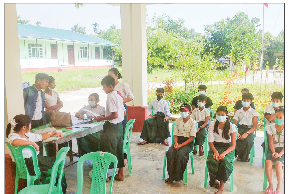
Students over the age of 12 are waiting for receiving COVID-19 vaccination in Yathedaung Township.

THE COVID-19 vaccination programme for the students over the age of 12 was implemented in Yathedaung Township, Rakhine state yesterday.