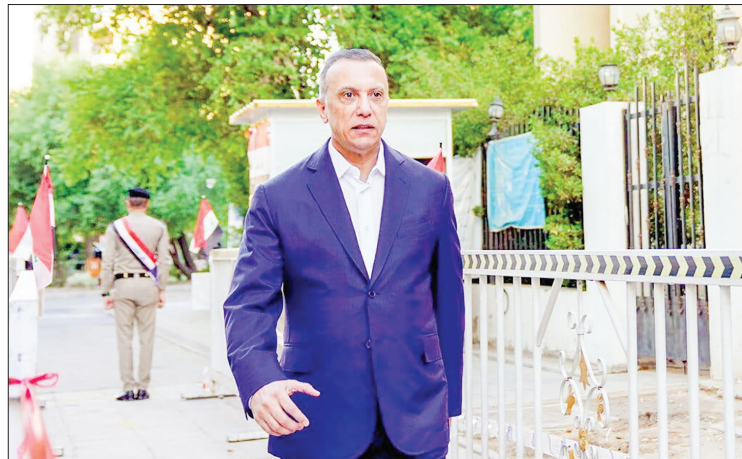
Prime Minister Mustafa al-Kadhemi at a polling station in Baghdad's Green Zone on Election Day last month.

The United States swiftly condemned the attack and said it was "relieved to learn the Prime Minister was unharmed". — AFP ■