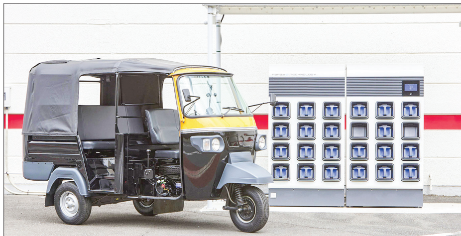
Supplied photo shows an electric tricycle taxi used in India parked in front of a station keeping Honda Motor Co.'s portable lithium-ion batteries.

HONDA Motor Co. will start a battery sharing service for electric tricycle taxis in India in the first half of 2022 as the world's third-largest carbon dioxide emitter steps up efforts to achieve carbon neutrality.