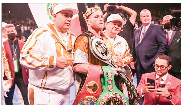
Saul Canelo Alvarez became the first Mexican and first super middleweight to hold all four belts simultaneously.

SAUL 'Canelo' Alvarez made history Saturday, knocking out Caleb Plant in the 11 th round to become the first undisputed world super middleweight champion, unifying all four major belts in less than 12 months.