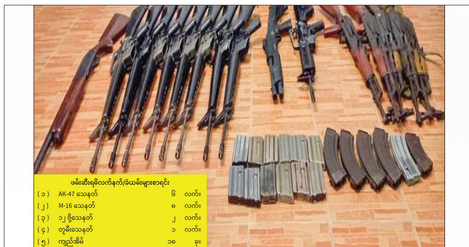
Photo shows seized arms and ammunition.

The people should inform the nearest security forces about the information of suspects.—MNA