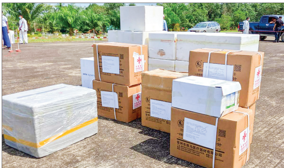
Boxes containing units of COVID-19 vaccines are already unloaded at Myeik Airport.

According to the Department of Public Health, the new vaccines will be given to the local people as a matter of priority.—Khaing Htoo (Myeik IPRD)/GNLM