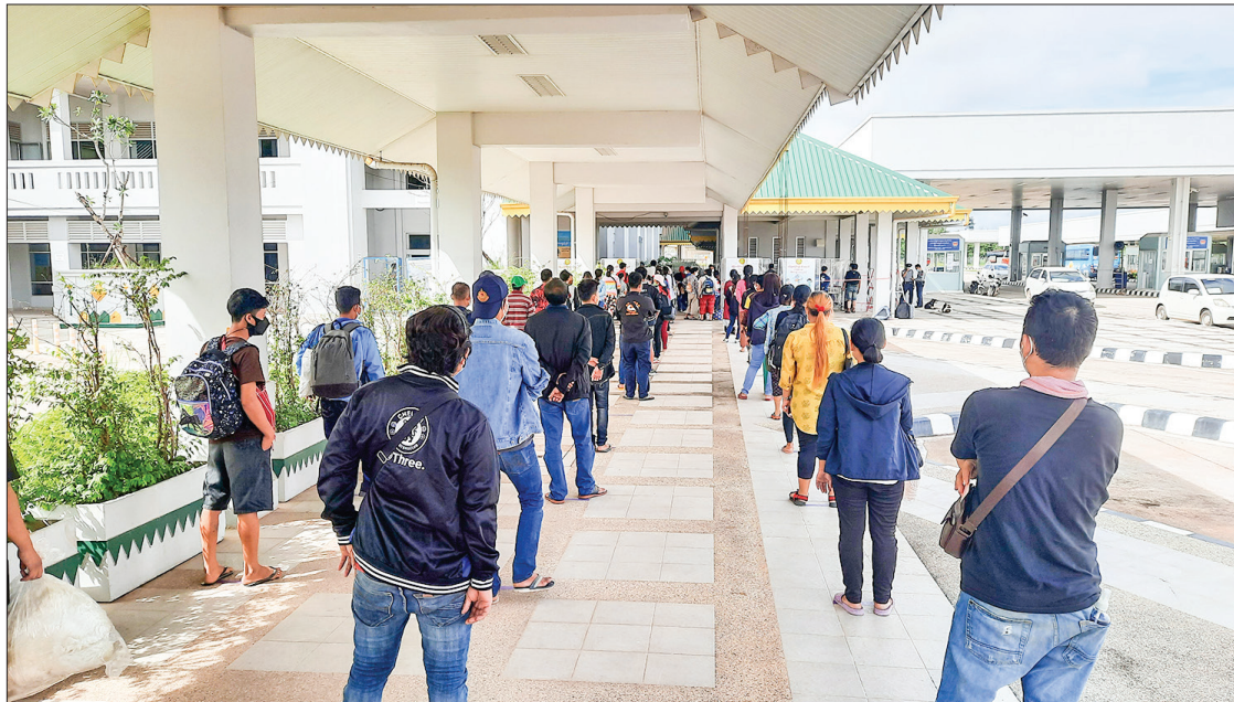
Myanmar returnees are seen in a queue for their turn of test at checkpoint.

On 27 September 2021, the Office of the Commander-in-Chief of the Myanmar Tatmadaw issued a statement on the ceasefire and peace process. The statement announced that in view of the upcoming 75 th anniversary of Myanmar's Union Day on 12 February 2022, the Tatmadaw would unilaterally extend the suspension of all military operations until 28 February 2022, except when other forces attack people's lives and property, transport networks, national defence and administration, and state security and governance. This would also enable more effective prevention, control and treatment of COVID-19 in the country, as well