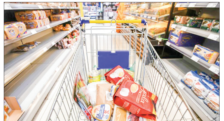
Food prices are soaring in Germany where the inflation rate currently stands at five per cent.

From energy and food, to paper and rent, prices have been marching mercilessly higher both in Germany and across Europe. Latest data put inflation in Europe's biggest economy at five per cent year-on-year, a level not seen in the last 30 years.