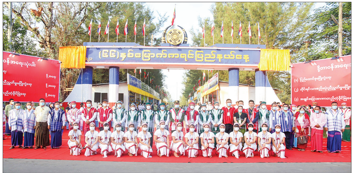
A group photo was taken in commemoration of 66 th Anniversary of Kayin State Day in Hpa-an.

The Acting Chief Minister and party then watched performance of the Kayin traditional don dance and the performers were presented with awards. The awarding ceremony, in commemoration of the 66 th Anniversary of Kayin State Day, was held at Zweekabin Hall in Hpa-an. A total of 60 awards were presented including Agricultural Excel-