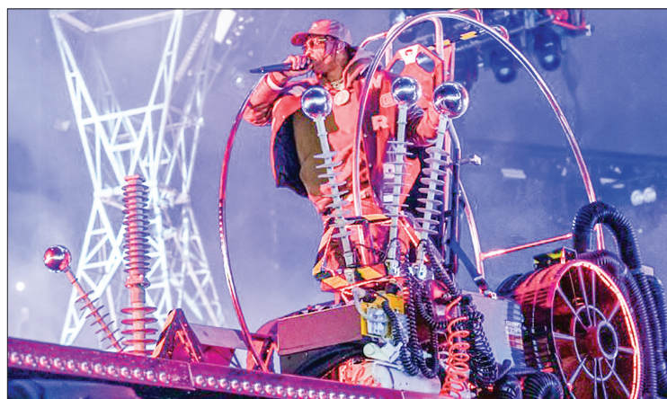
Travis Scott, 29, made his breakthrough in 2013 and has had six Grammy nominations.