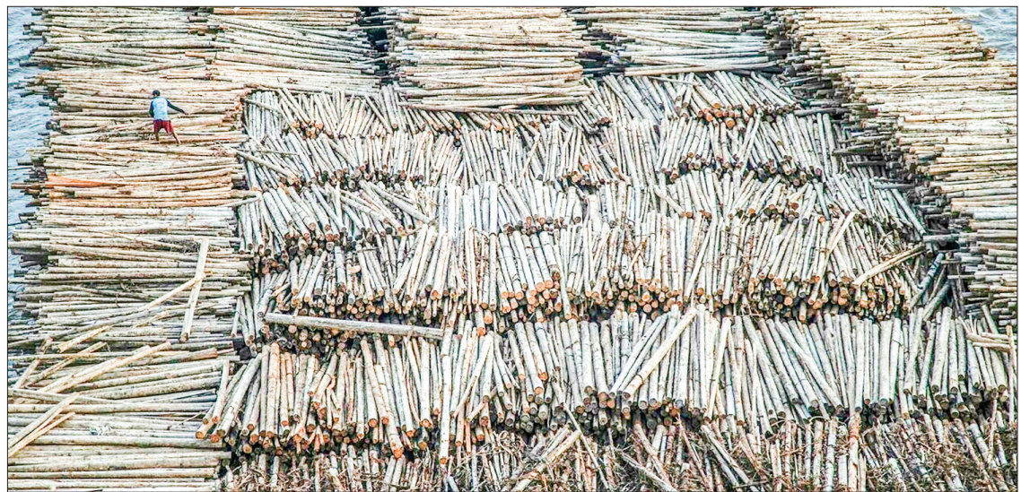
A barge filled with logged timber is pulled along the Mahakam river in East Kalimantan, Indonesia.

But two senior Indonesian politicians on Thursday threw Jakarta's participation into question. One said the deal did not call for a total end to deforest-