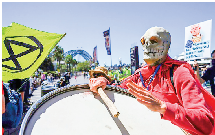
Protesters are calling for immediate action for communities already affected by climate change.

GLASGOW was on Saturday bracing for a second day of protests against what campaigners say is a lack of urgency to address global warming after Greta Thunberg labelled the