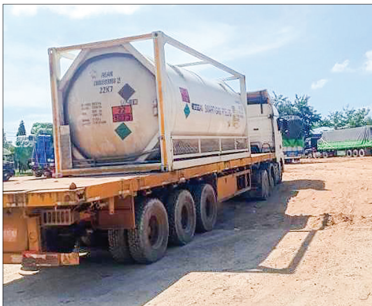
A bowser is carrying liquid oxygen from Myawady to Yangon.

It is reported that the Ministry of Commerce is giving priority to the import of essential medical supplies required in prevention, control and treatment of COVID-19 in accordance with the SOPs coordinated with the relevant departments in order to avoid delays, and announcements and notices related to the import of medicines and related products have also been made available to the public on the Ministry's website, commerce.gov.mm.—MNA