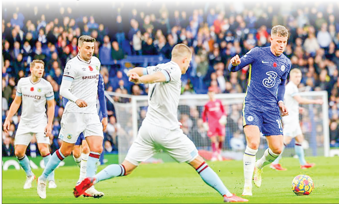
Chelsea midfielder Ross Barkley.

THOMAS Tuchel insists Ross Barkley can make an impact on Chelsea's bid to win the Premier League title after the midfielder came in from the cold in Saturday's 1-1 draw against Burnley.