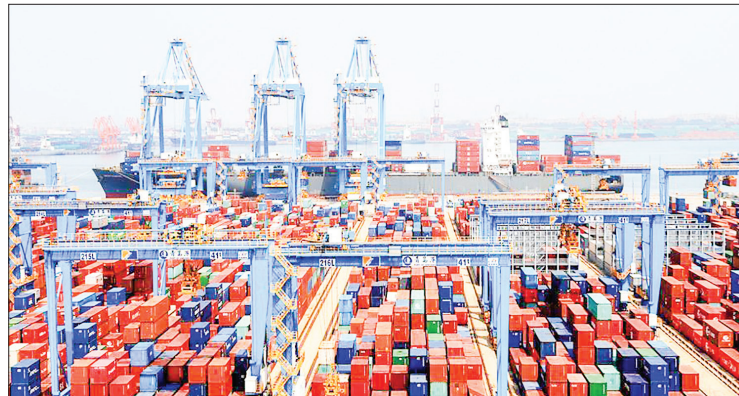
China's exports rose by a better-than-expected clip in October 2021. File Photo taken on 16 May 2018 shows an automatic container dock in Qingdao, east China's Shandong Province.

CHINA'S exports rose by a better-than-expected clip in October, official data showed on Sunday, with demand strengthening in some key markets such as the United States and Covid numbers easing overseas.