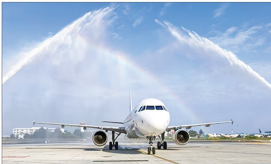
A new expanded west apron at the Velena International Airport (VIA) in Maldives has been officially inaugurated, general contractor Beijing Urban Construction Group (BUCG) said.

A new expanded west apron at the Velena International Airport (VIA) in Maldives has been officially inaugurated, general contractor Beijing Urban Construction