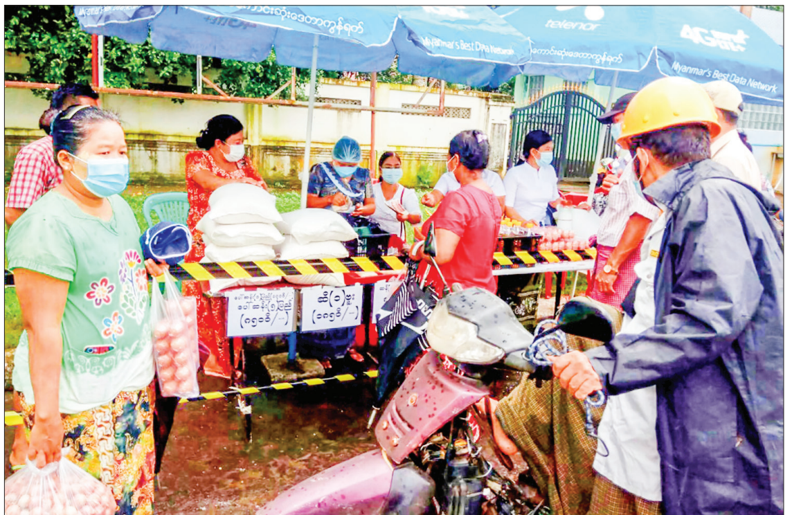
A mobile market sells rice, eggs and foodstuff to local people at fair prices.