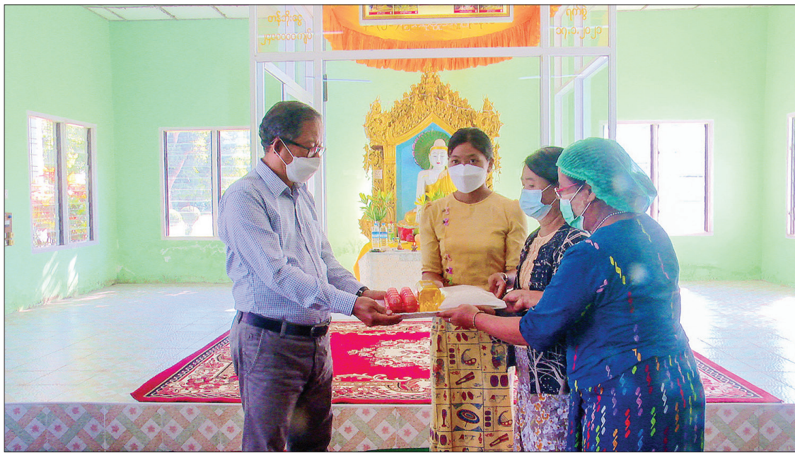
Union Minister U Tin Htut Oo presents rice and foodstuffs to faculty members of Pyinmana Institute of Agriculture.

UNION Minister for Agriculture, Livestock and Irrigation U Tin Htut Oo met with the principal and faculty members together with administrative staff at the golden jubilee hall of the Institute of Agriculture in Pyinmana yesterday.