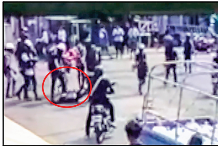
Youths of drug-users brutally killed a police officer in Mandalay city on 29 March 2021