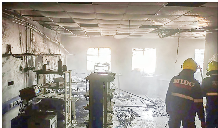
The hospital ward, which was left a charred wreck, had been newly built for coronavirus patients.

FIRE tore through a hospital in western India on Saturday killing at least 11 coronavirus patients, officials said.