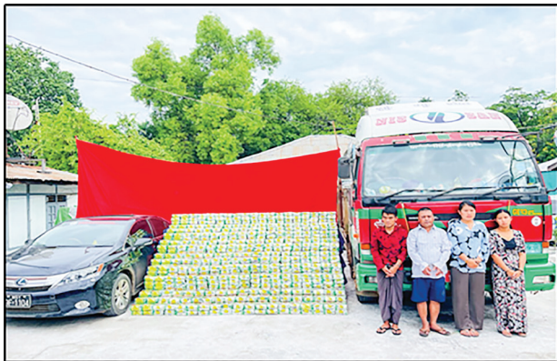
Four offenders arrested allowed with 860 kg of crystal meth (Ice) worth Kyat 12.9 billion in Ywangan Township

In fact, the peril of narcotic drugs for Myanmar is