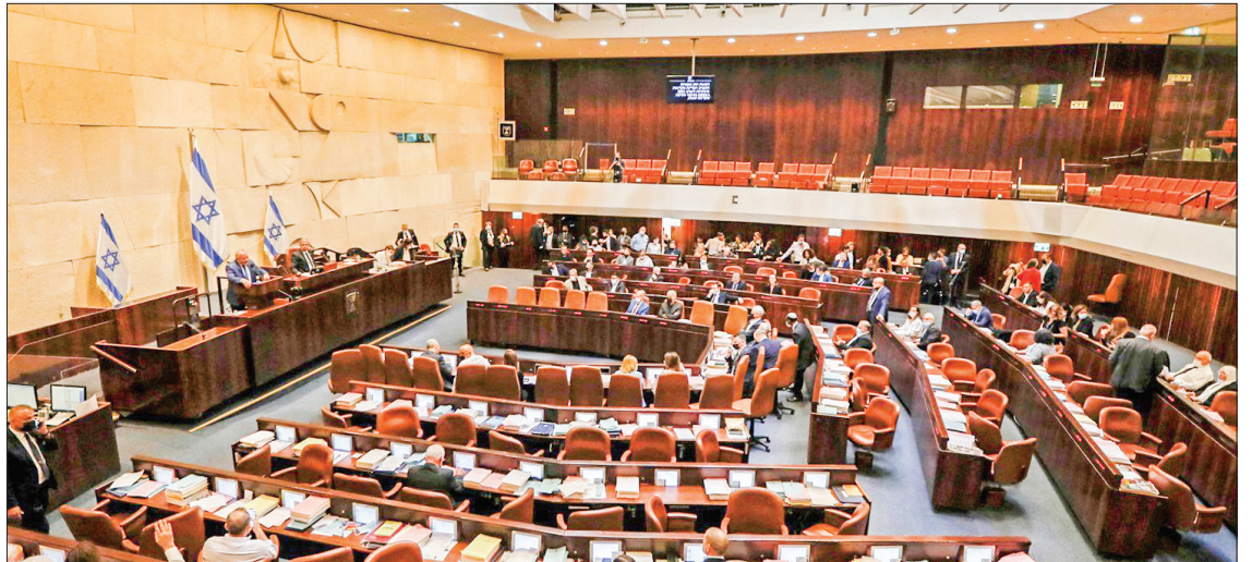
A general view of a plenum session and vote on the state budget at the Knesset (Israeli parliament), in Jerusalem, Israel, 3 November 2021.

The government will also work to solve a major housing crisis amid soaring property prices and to improve public transportation. — Xinhua ■