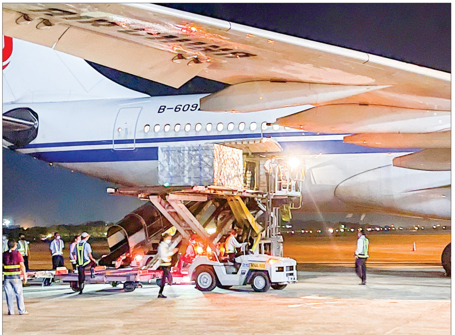
Four million doses of Sinopharm are being unloaded from airplane at Yangon International Airport.

As a measure to prevent and control the spread of COVID-19, the Ministry of Health is administering the COVID-19