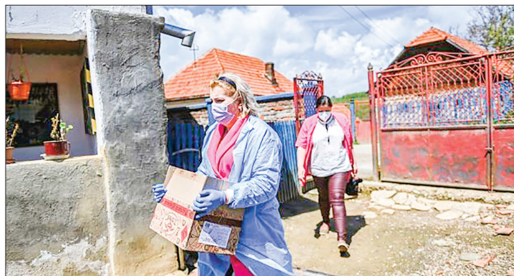
A nurse carries Pfizer BioNTech vaccines against Covid-19 in the remote village of Poienita Voinii, Romania in May.

So far, 1,693,532 COVID-19 cases have been confirmed across the country, 9,020 of