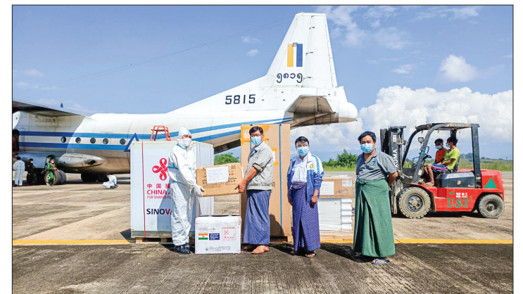
Tatmadaw airplane carrying Sinopharm and Sinovac vaccines arrives at Kengtung airport.

A Tatmadaw aircraft transported 14,900 units of Sinopharm COVID-19 vaccines and 3,008 units of Sinovac vaccines from Yangon to Kengtung in eastern Shan State yesterday.