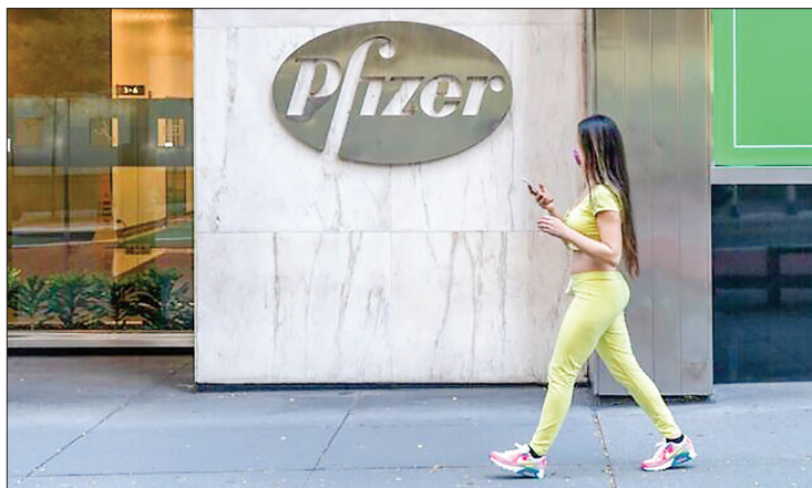
Pfizer headquarters in New York City, on 9 November 2020.

The main analysis of the data looked at numbers from 1,219 adults in North and South America, Europe, Africa and