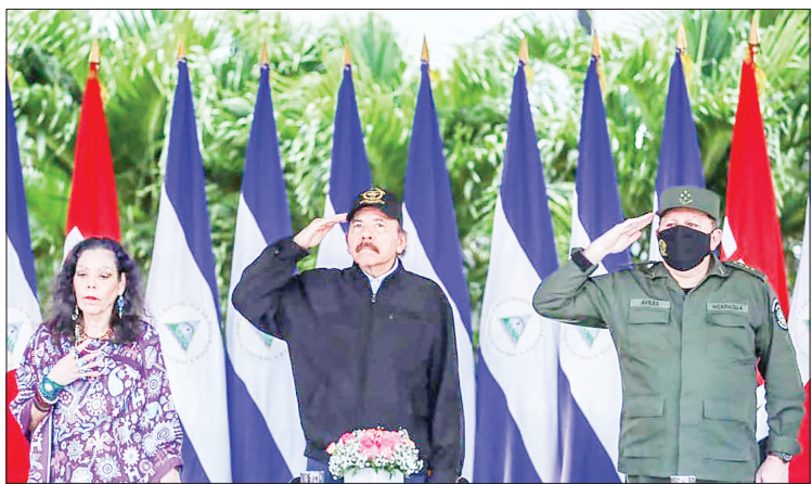
As Ortega, 75, prepared to claim a fourth consecutive term—his fifth overall—the United States described Nicaragua as a "cautionary tale" with a regime "determined to hold on to power at any cost."

NICARAGUANS go to the polls Sunday for presidential elections dismissed as a "sham" by the international community, with all viable challengers to long-term leader Daniel Ortega locked up or in exile.