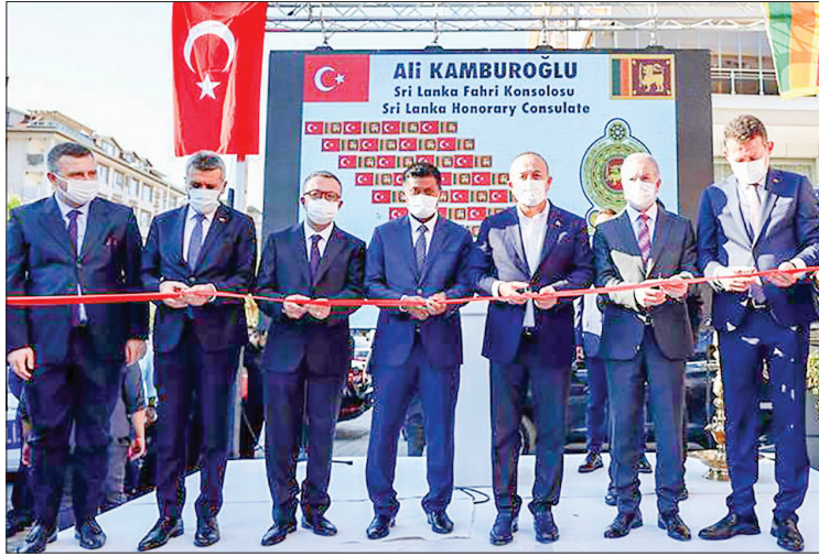
Inaugurating a new office of Sri Lanka's Antalya Honorary Consulate General in the town of Alanya, Mevlut Cavusoglu said Ankara desires to promote cooperation with Sri Lanka in fields such as economy, culture, and education.

THE Turkish foreign minister on Saturday said Turkey wants to develop holistic relations with Asia that has become the center of global economic power.