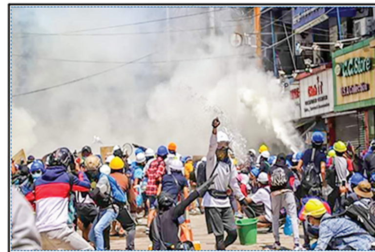
Actions of young protesters using drugs

Among the offenders detained for committing bombing attacks, murders, and terrorist acts, in checking some of offenders with abnormal behaviours, 80 per cent of them were found to be drug users. It can be concluded that the narcotic drug is the root cause of the reckless terrorist acts of the youths under the name of PDF and the riotous protests by the youths called General Z. Otherwise, it can also be observed that the using drugs or substance abuse significantly rise among the youths today because unscrupulous manipulators of protests and terrorist acts behind are arousing the intense emotions of the youths by using drugs. Such attempt to increase the drug use and addiction among the youths is very dangerous for them as well as a serious threat to the future of the State.