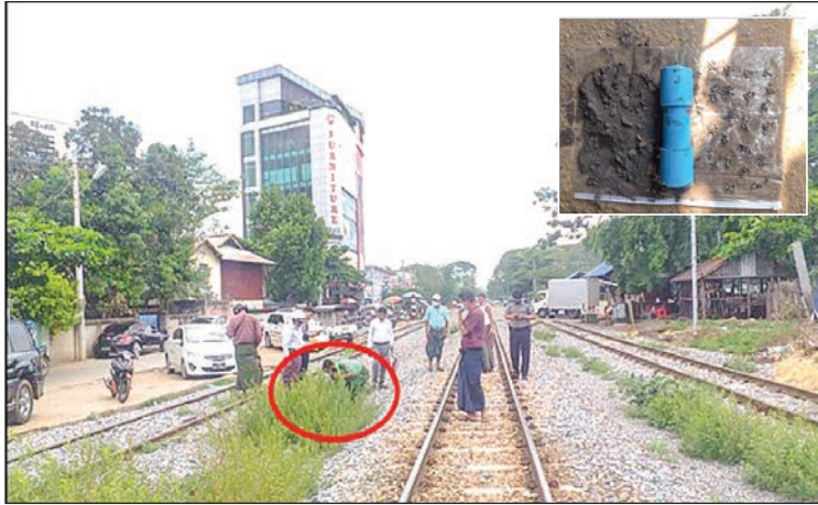
A handmade mine blast in Pinyinmana.

From 1 February up to 20 November, a total of 397 roads and bridges have been blown up or destroyed by fire by the terrorists.