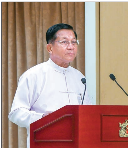
State Administration Council Chairman Prime Minister Senior General Min Aung Hlaing addresses the affirmation ceremony of the Myanmar Press Council yesterday.

It can be reviewed that the Senior General's meetings with the Myanmar Press Council showed his keenness to develop