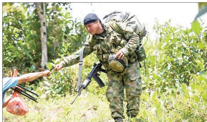
Soldiers still patrol Marquetalia, birthplace of the now-defunct FARC guerilla group.

On November 24, 2016, after negotiations in Cuba, the fearsome guerrilla group laid