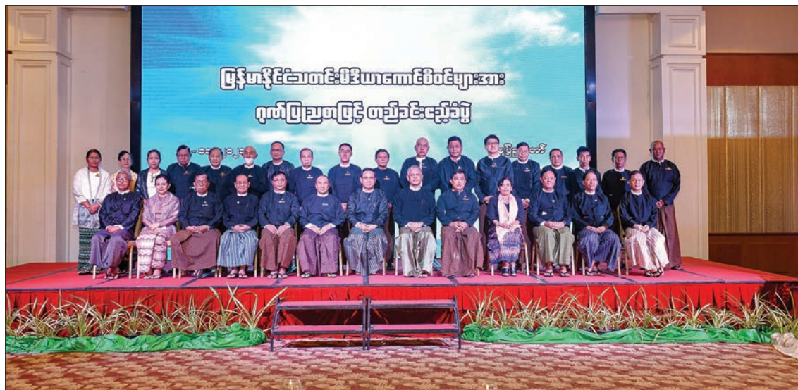
The MoI Union Minister poses for the documentary photo with the members of the Myanmar Press Council yesterday.

Afterwards, the attendees to the event posed for the commemorative photo and enjoyed the dinner together. — MNA