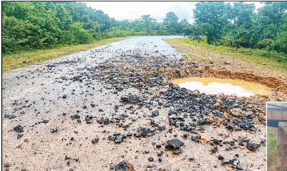
A handmade mine blast in Hpa-an Township.