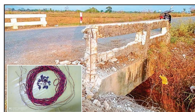
A handmade mine blast in Nyaunglebin Township.

The people are requested to secretly report to the nearest security forces if they found any movements made by terrorists and to cooperate with the authority for the peace and stability of the whole country. – MNA