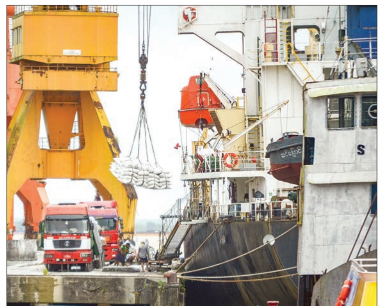
Myanmar exports agricultural products, footwear, textiles and clothing, minerals, and animal products to Singapore, while it imports plastics, fuel oil, capital goods, intermediate goods, consumer products, metals, and chemicals.

Myanmar's bilateral trade with Singapore has registered $3.8 billion in the 2019-2020FY, $3.5 billion in the 2018-2019FY, $1.99 billion in the 2018 mini-budget period, $3.83 billion in the 2017-2018FY, $2.96 billion in the 2016-2017FY, and $3.69 billion in the 2015-2016FY. — KK/GNLM