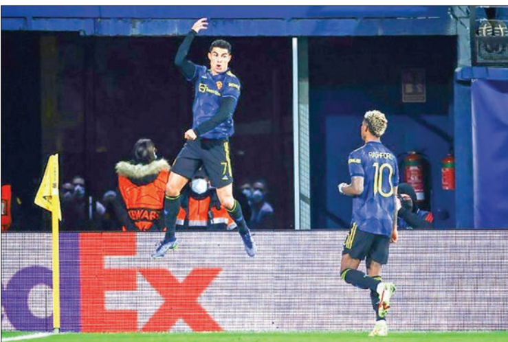
Cristiano Ronaldo scored his sixth Champions League goal of the season.

MANCHESTER United booked their place in the Champions League last 16 as Cristiano Ronaldo scored in a 2-0 victory at Villarreal on Tuesday, while holders Chelsea also reached the knockout phase by thumping Juventus.