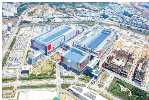
File photo of a Samsung semiconductor manufacturing facility.

SAMSUNG said on Tuesday it will build a microchip factory in Texas, a $17 billion investment that comes as semiconductor shortages are causing supply chain delays across many industries.