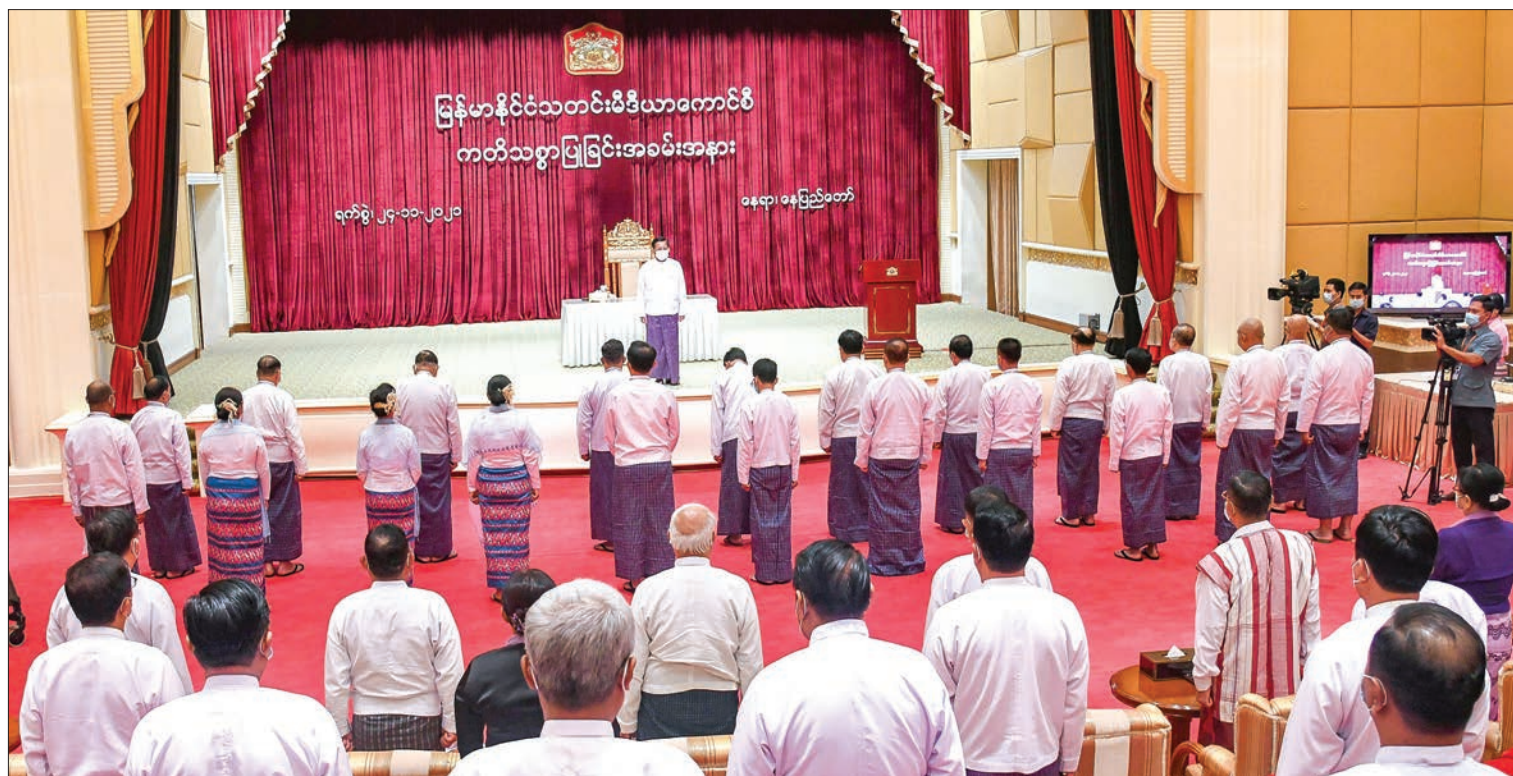
Members of the Myanmar Press Council take the oath in the presence of SAC Chairman Prime Minister Senior General Min Aung Hlaing yesterday.