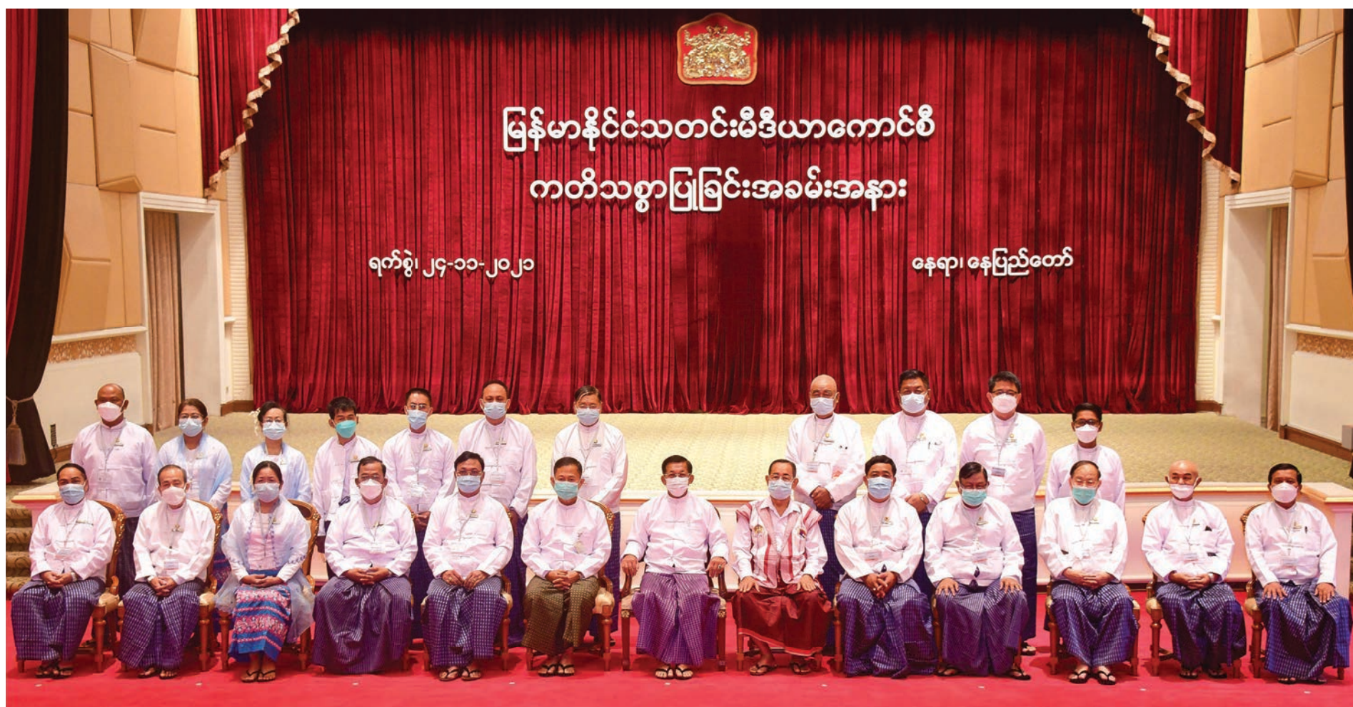
State Administration Council Chairman Prime Minister Senior General Min Aung Hlaing poses for the documentary photograph with the SAC members and MPC members at the oath-taking ceremony of the Myanmar Press Council in Nay Pyi Taw on 24 November 2021.

T HE media is a primary estate for turning out the educated generations with correct attitudes and ideologies to be able to lead the State's future as part of efforts