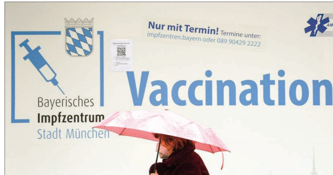
After a turbo-charged inoculation campaign in the spring, Germany's jab rate has struggled since the summer to climb to the 70-per cent mark.

"Meteorite iron is a medicine that we use in phase 2 of a Covid illness — when the first symptoms of sickness are show-