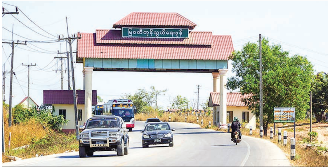
Myawady trading zone.

Myawady topped the list of border checkpoints with the most trade value of $293.28 million, followed by Hteekhee with $141.89 million.