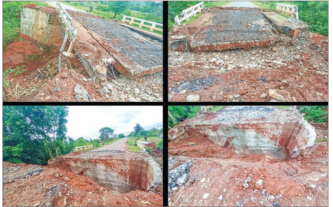
Ravages are seen in the aftermath of the attack in Pruhso Township.