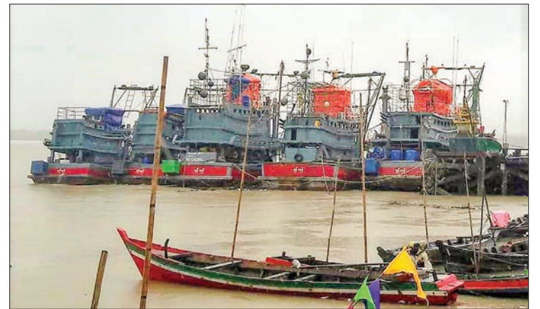
In a bid to conduct surveillance of the offshore fishing vessels in Kawthoung District, the VMS devices have been located in Myeik, Taninthayi Region, Yangon Region, Rakhine State and Mon State and Nay Pyi Taw.

During the 2020-2021FY, the companies and operators running 83 offshore vessels for fishing in areas close to the shore where only small boats are allowed, stopping the VMS device for more than four hours and not returning in the harbour, stopping the VMS device and fishing in offshore areas, and removing it without the approval of the department were taken legal actions. Furthermore, during the fishing banned season