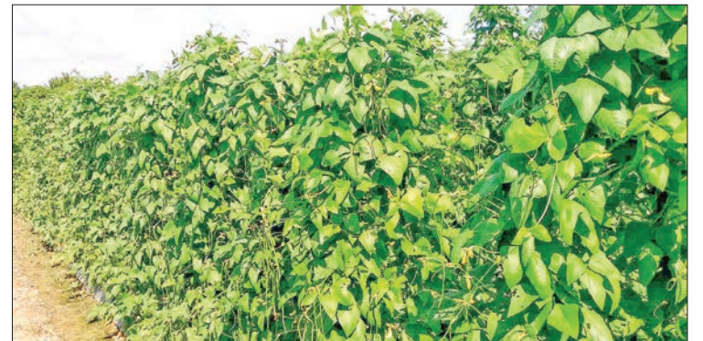
After cultivating for a month, the marketable long bean crops could be harvested.

THE local farmers from villages in Pwintbyu township, Magway region are growing vegetables on a commercial scale using the Mone creek water and underground water.