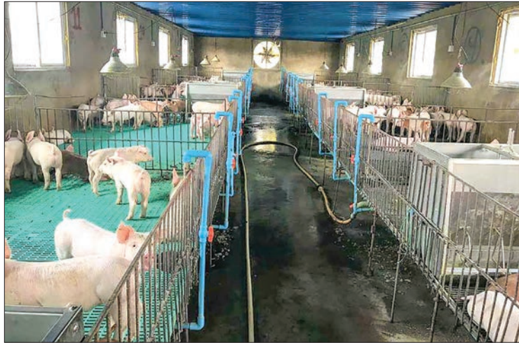
Yangon Region has self-sufficiency in meat production, accounting for 70 per cent of the overall meat production in the country.

Myanmar livestock sector plays a pivotal role in nutrition efficiency and food security of the people. There are discrep-