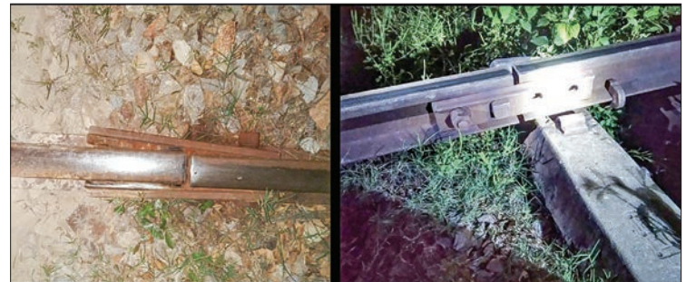
Disruption to rail services in Lewe.