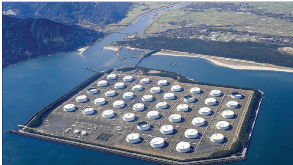
File photo taken in January 2019 shows the Shibushi national petroleum stockpiling base in Kagoshima Prefecture.