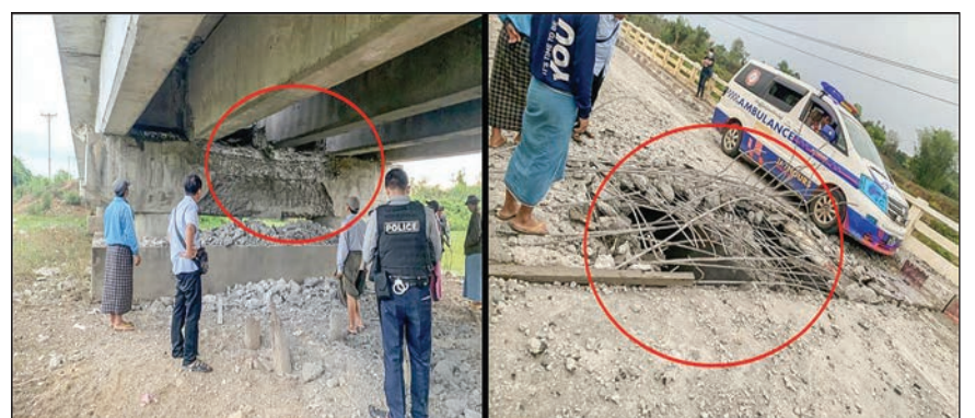
A mine blast in Indaw Township.