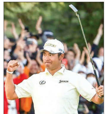
Japan's Hideki Matsuyama won the US PGA Tour's Zozo Championship last month. Now Europe's newly named DP World Tour is making its first foray into the Japan golf market with the ISPS Handa Championship next year.

The ISPS Handa Championship, with a purse of $2 million, will be co-sanctioned with the Japan Golf Tour (JGTO) and the inaugural event will be