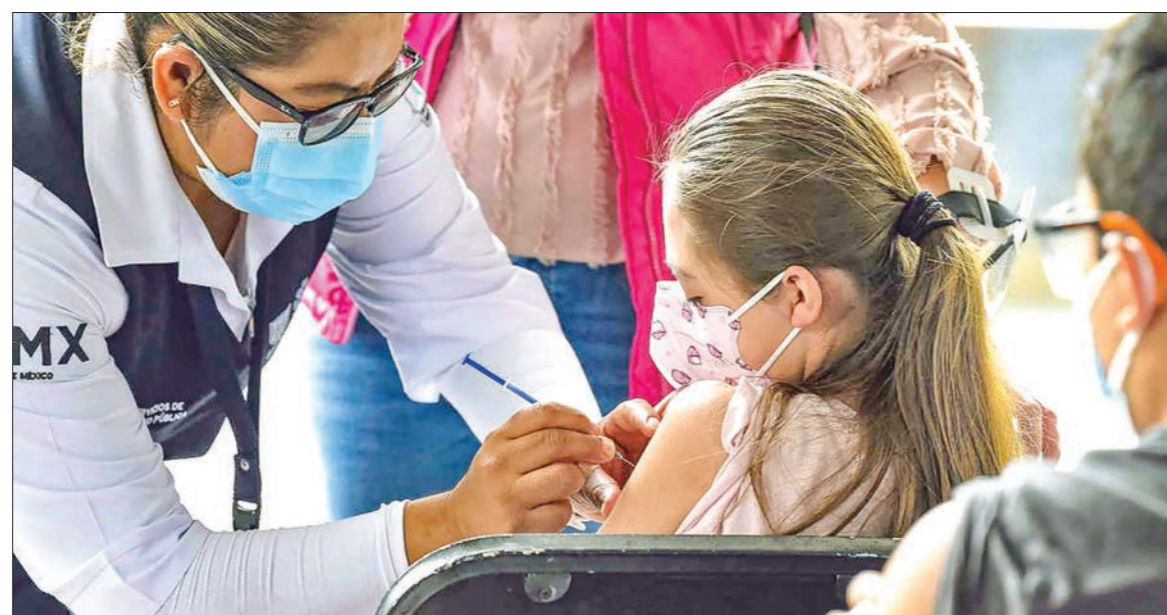
The United States (US) on 29 October authorized the Pfizer COVID vaccine for children aged five-to-11, paving the way for 28 million young Americans to soon get immunised. A child is inoculated with the first dose of the Pfizer-BioNTech vaccine against COVID-19 at the Vasconcelos Library in Mexico City on 25 October 2021.

PFIZER and BioNTech said Monday their Covid-19 vaccine remained 100 per cent effective in children 12 to 15 years old, four months after the second dose.