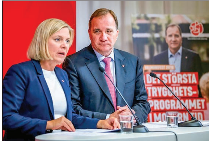
Andersson would replace Stefan Lofven (R), who resigned on November 10 after seven years as prime minister.

It has previously warned that it could withdraw its sup-