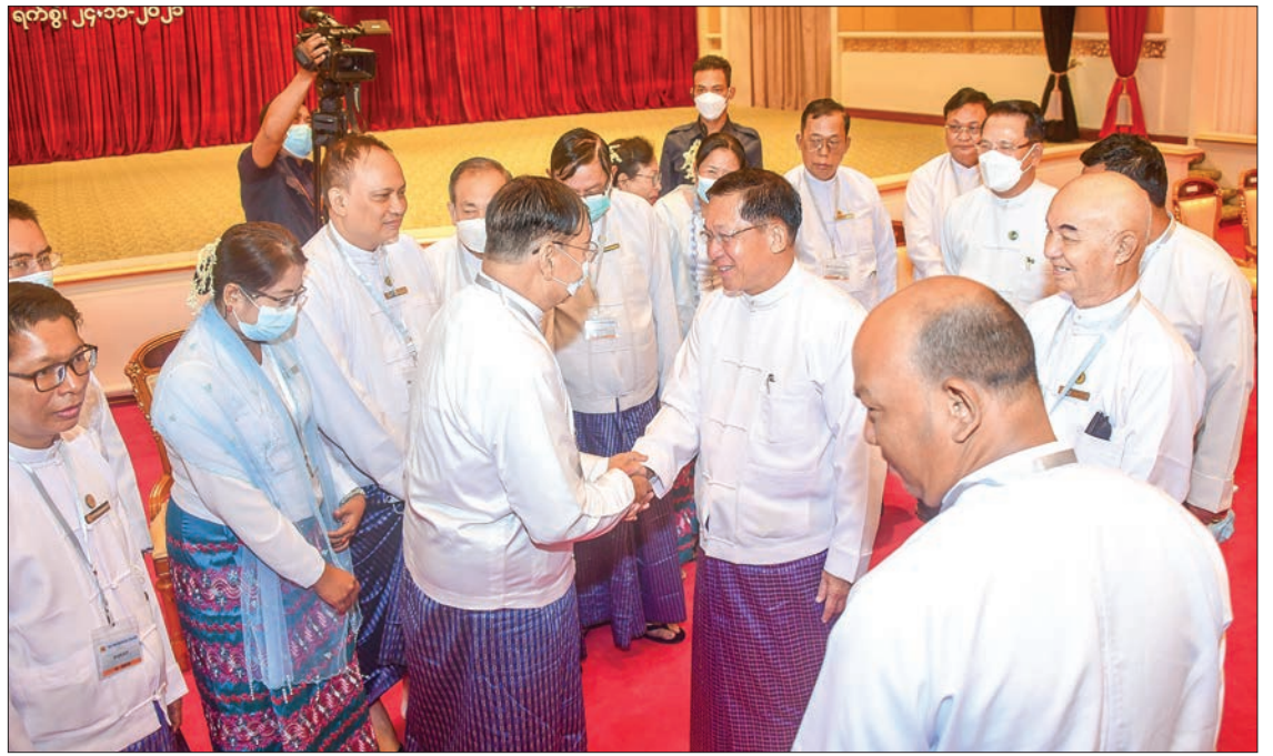
The Senior General cordially greets the Myanmar Press Council members.

The media is of great importance in the dissemination of knowledge and critical thinking about democracy to the people and paving the way for education for all youths to become educated youths. Now is very important for the State to en-