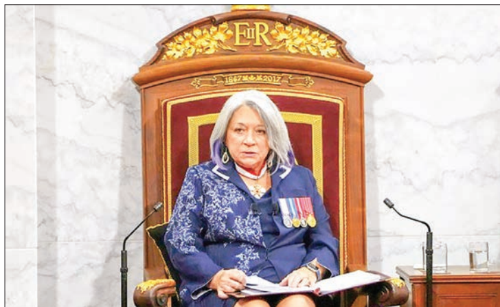
Governor-General Mary Simon delivers the Throne Speech in a joint session of the House of Commons and the Senate in Ottawa, outlining the government's policy priorities.

CANADA'S governor general opened parliament Tuesday in a speech partly delivered in her