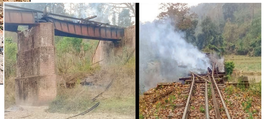
Disruption to rail services in Lewe.