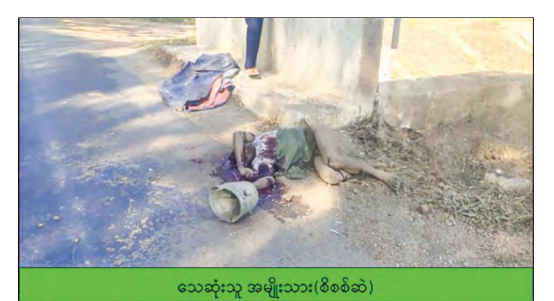
A terrorist dies nearby a concrete bridge on the YeU-Taze Road in Taze Township.

were taken to Taze Township public hospital.