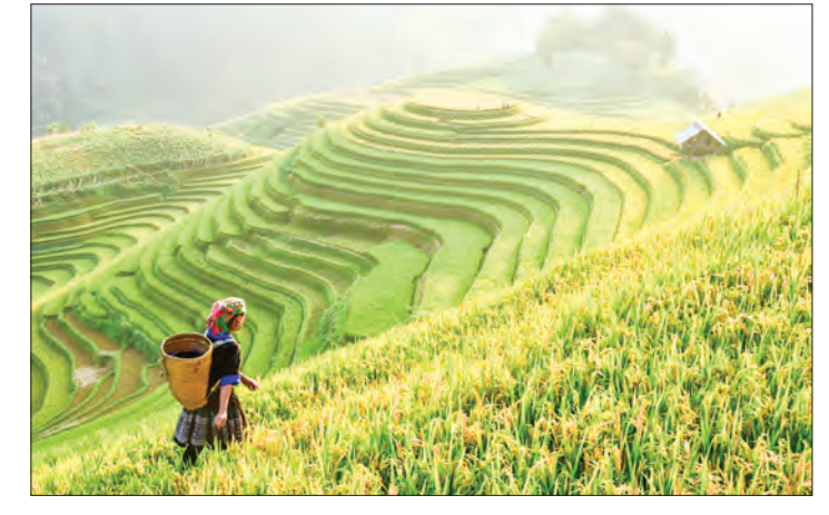
The terraces mostly belong to the Hmong, a minority group who make up most of the area's population.

"It's our only desire now that the virus is gone and we can resume our normal life," she added.—AFP