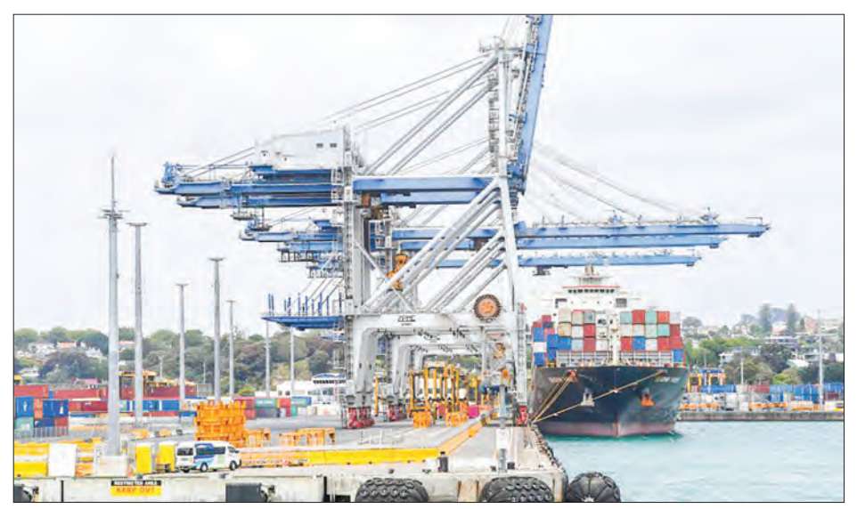
Photo taken on Dec. 18, 2020 shows a container port in Auckland, New Zealand.

NEW Zealand recorded a trade deficit of 6.3 billion NZ dollars (4.3 billion U.S. dollars) in the September 2021 quarter, following a surplus of 548 million NZ dollars (373.8 million U.S. dollars) in the June 2021 quarter, the statistics department Stats NZ said on Thursday.