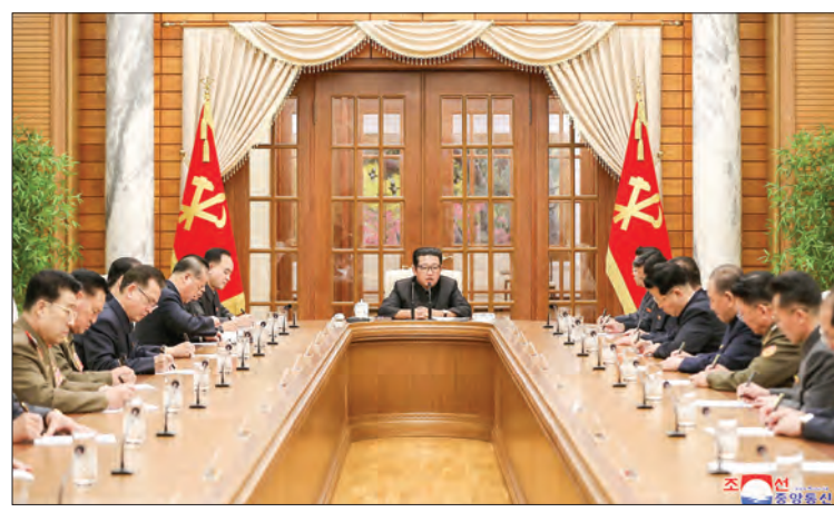
North Korean leader Kim Jong Un (C) attends a meeting of the Political Bureau of the Central Committee of the Workers' Party of Korea in Pyongyang on 1 Dec 2021.

NORTH Korea's ruling party will convene a plenary meeting of the Central Committee later this month to review its policies