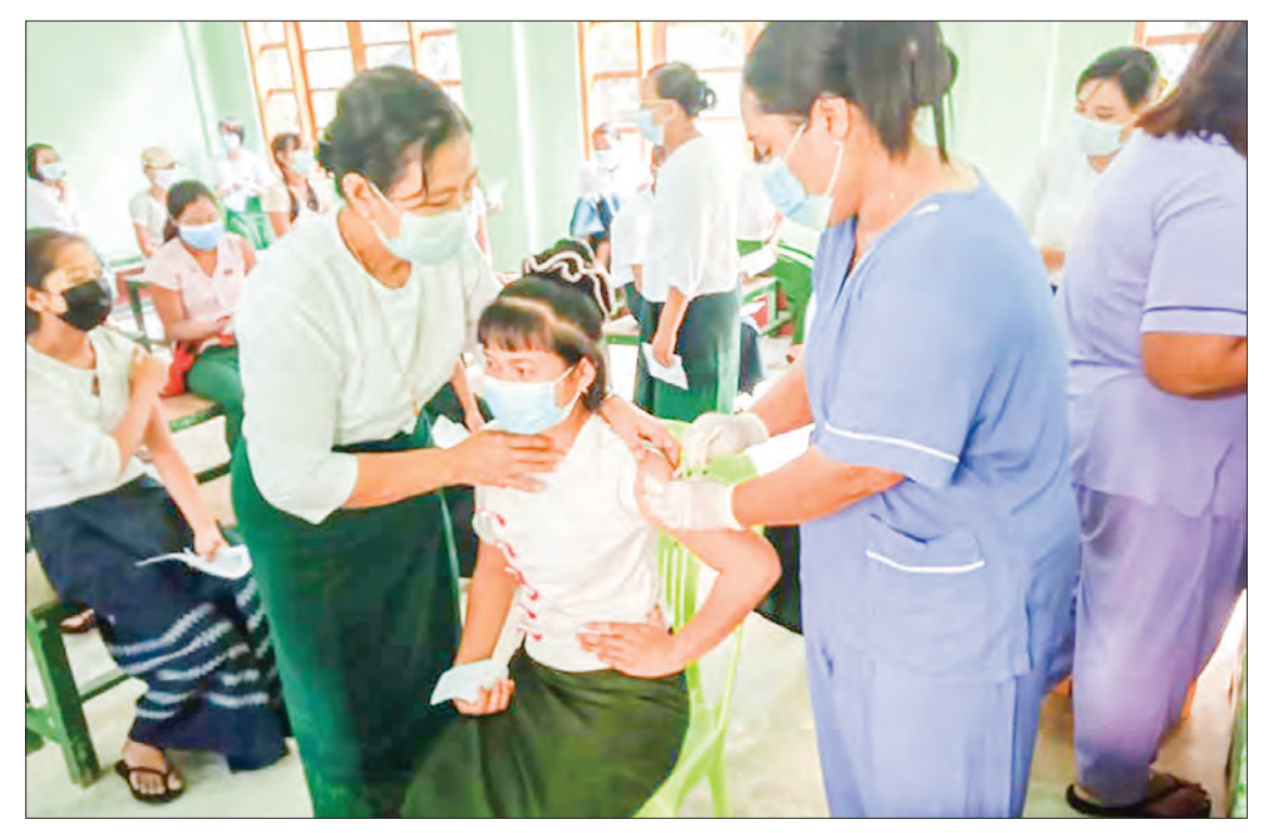
An over 12-year-old schoolgirl gets injected for Covid vaccine in Pantanaw, Ayeyawady Region.

THE Tatmadaw medics, health officials, nurses and health workers of public hospitals including volunteers conduct vaccination programmes in regions and states for monks, nuns, people aged over 40, inmates, people with disabilities, ethnic armed groups, patients with chronic disease, people at IDP camps and students aged over 12.