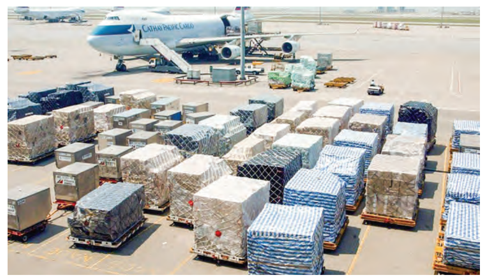
Hong Kong has the world's busiest cargo airport. PHOTO: AFP

For much of the pandemic Hong Kong has restricted inbound travel with as much as three weeks mandatory quarantine.—AFP