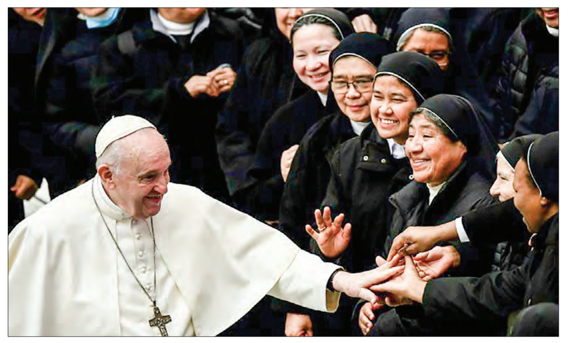
Pope Francis salutes nuns at the end of his general audience at the Vatican's Paul VI Hall on 1 December 2021, ahead of his departure for Cyprus.

On Friday afternoon Francis will hold an ecumenical prayer with migrants at a church which serves worshippers from dozens of nations near the "Green Line" that splits the city.—AFP