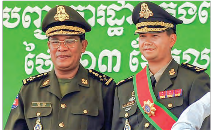
Cambodia PM Hun Sen (L) has backed his eldest son Hun Manet (R) to take over the top job in the country.

Critics say Hun Sen has wound back democratic free-