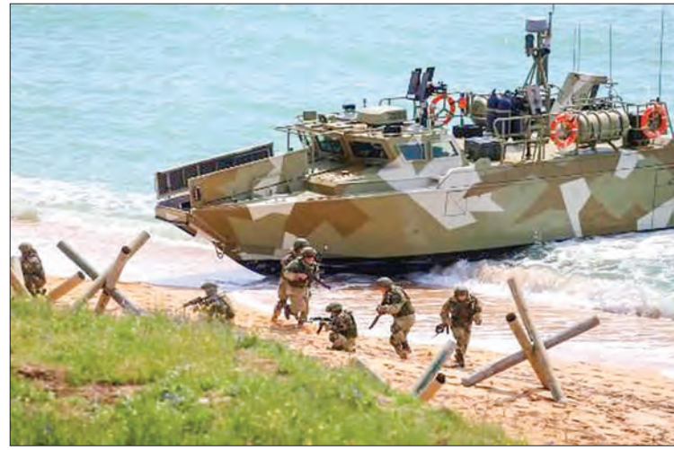
Russian forces conduct military exercises near Ukraine in April 2021.

UKRAINIAN President Volodymyr Zelensky on Wednesday called for direct talks with Moscow as tensions mounted over