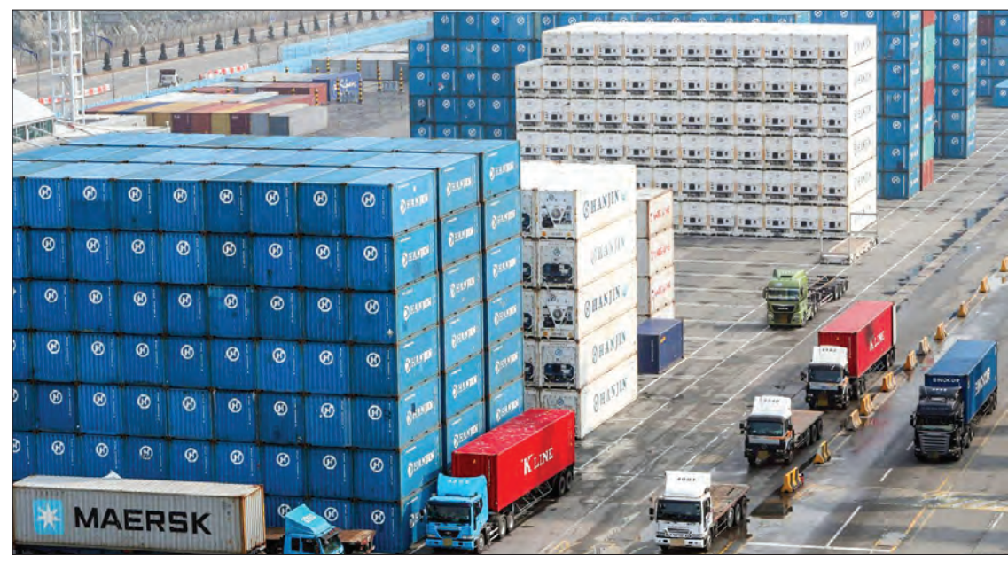
South Korea's export hit a new record high last month thanks to the continued recovery in global demand from the COVID-19 pandemic, a government report showed on Wednesday.

SOUTH Korea's export hit a new record high last month thanks to the continued recoverv in global demand from the COVID-19 pandemic, a government report showed on Wednesday. Export, which accounts for about half of the export-driven economy, reached 60.44 billion U.S. dollars in November, up 32.1 per cent from a year earlier, according to the Ministry of Trade, Industry and Energy. Import surged 43.6 per cent to 57.35 billion dollars last