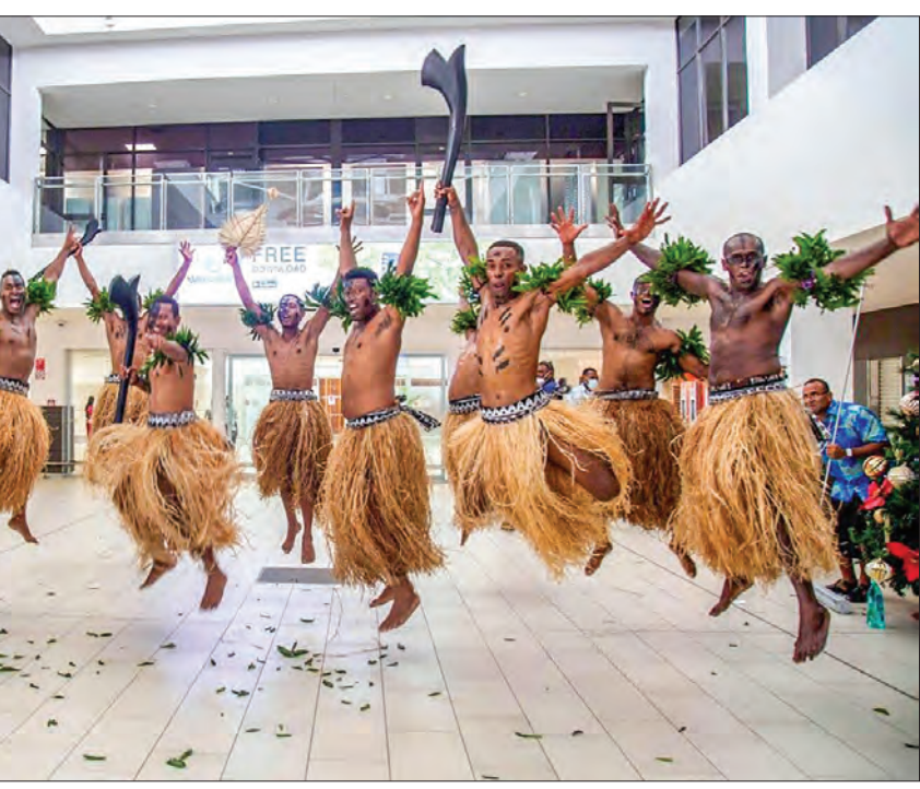
Fiji ended 615 days of international isolation on Wednesday and reopened to tourists. Traditional dancers in grass skirts welcomed waving holidaymakers as Fiji opened its borders to international travellers Wednesday for the first time since the Covid-19 pandemic swept the globe and devastated its tourism-reliant economy.

A more focused vaccine Pouton said this approach makes it a more focused vaccine with the important ability to rapidly adjust its composition in response to emerging mutations, including the new