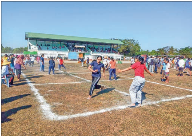
Kyaukto, Mon State.