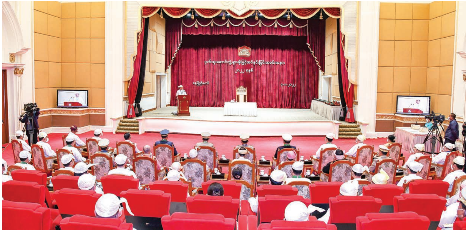
State Administration Council Chairman Prime Minister Senior General Maha Thray Sithu Min Aung Hlaing speaks on the occasion of the honorary title presentation ceremony in Nay Pyi Taw yesterday.

This year, the Thray Sithu title awarded in 2021 will be presented to one person, the Sithu title to 10 persons, the Thura title to one person, the Zeya Kyaw Htin title to 17 persons, and the Wunna Kyaw Htin title to two persons totalling 31.