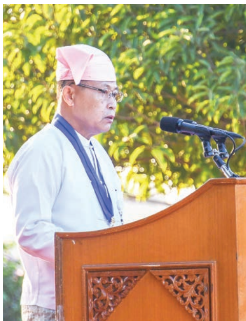
The State Administration Council Vice-Chairman Deputy Prime Minister Vice-Senior General reads out the message sent by the SAC Chairman Prime Minister Senior General at the event yesterday.

Afterwards, the Vice-Senior General read the message sent by SAC Chairman Prime Minister Senior General Min Aung Hlaing to the 74 th Anniversary Independence Day. — MNA