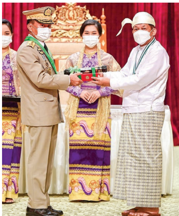
The Senior General presents 17 Zeya Kyaw Htin title recipients.

Honorary titles are the records for excellent performances of the recipients in serving the interests of the State and the citizens. As the title is a record of the government in recognizing the excellent performances of the recipients, new generations of the recipients who could not attend the ceremony should take pride in winning the titles. The Senior General on behalf of the State and the people took pride in winning the titles.