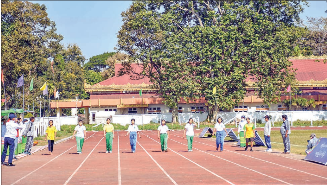
Myitkyina, Kachin State.