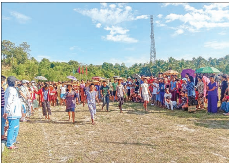
Kyunsu Township, Myeik District, Taninthayi Region.