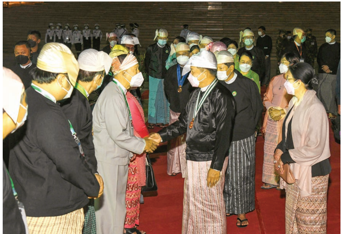
State Administration Council Chairman Prime Minister Senior General Min Aung Hlaing cordially greets the attendees at the 74 th Independence Day Reception and Dinner yesterday.