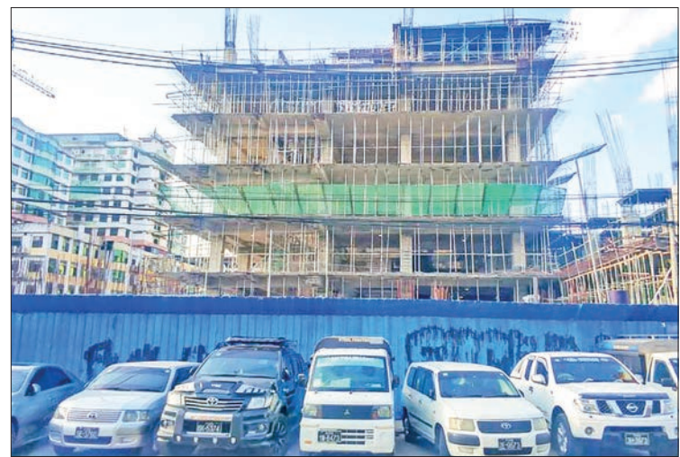
The new Mingala Market is seen under construction (40 per cent completed).

There will be a two-storey basement car park and the shop owners of the old market will be relocated from the first to the fourth floor and the other eight-storey (except for residential flat) will contain a car park,