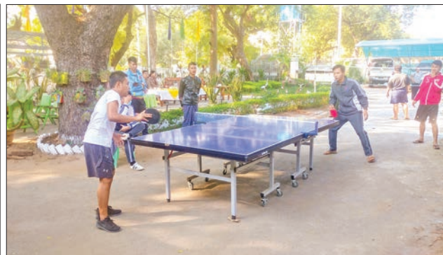
Myaung Town, Sagaing Region.