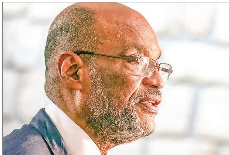
Haitian Prime Minister Ariel Henry has been de-facto running the country since the July 2021 assassination of president Jovenel Moise.

HAITIAN Prime Minister Ariel Henry told AFP in an interview Monday that he was targeted in an assassination attempt during weekend national day celebra-