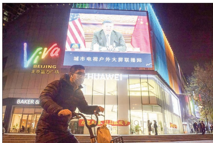
A screen on a street in Beijing shows on 16 November 2021, footage of Chinese President Xi Jinping who held a virtual summit with US President Joe Biden.

AN acceleration of Sino-US tensions may jeopardize the security environment in East Asia in 2022 ahead of key political events in the world's two major powers, making circumstances surrounding Chinese Taipei and North Korea