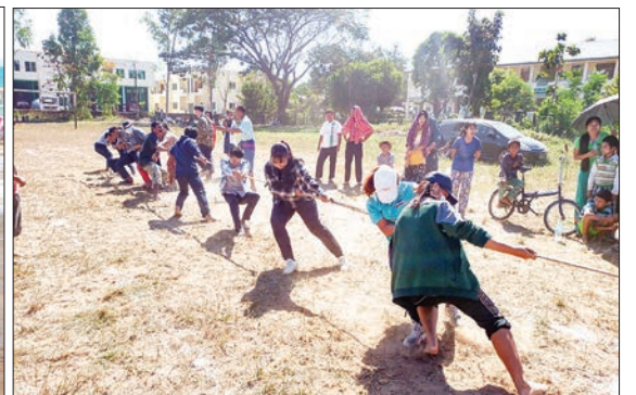
Hlaingbwe, Kayin State.