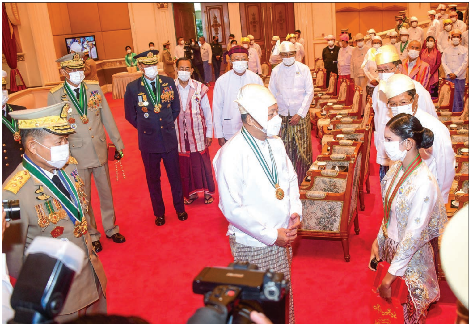
State Administration Council Chairman Prime Minister Senior General Maha Thray Sithu Min Aung Hlaing cordially greets the honorary title holders at the presentation ceremony to mark the 74 th Anniversary of Independence Day in Nay Pyi Taw on 4 January 2022.

As such, independence and sovereignty are the hearts of all