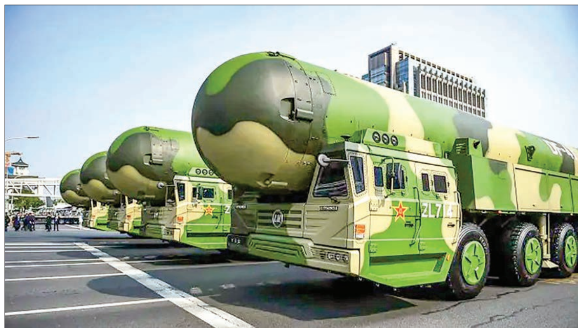
Beijing said it would continue to 'modernize' its nuclear arsenal, a day after joining the four other major nuclear powers in pledging to prevent such weapons spreading. Chinese intercontinental strategic nuclear missiles at a military parade in Beijing.

The United States has also said China is expanding its nuclear arsenal with as many as 700 warheads by 2027 and possibly 1,000 by 2030.