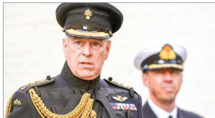
Prince Andrew has vehemently denied claims he had sex with Virginia Giuffre, and said he has no recollection of meeting her.

PRINCE Andrew's lawyers will use a court hearing Tuesday to urge a New York judge to throw out a sexual assault lawsuit brought against the British royal in the United States.