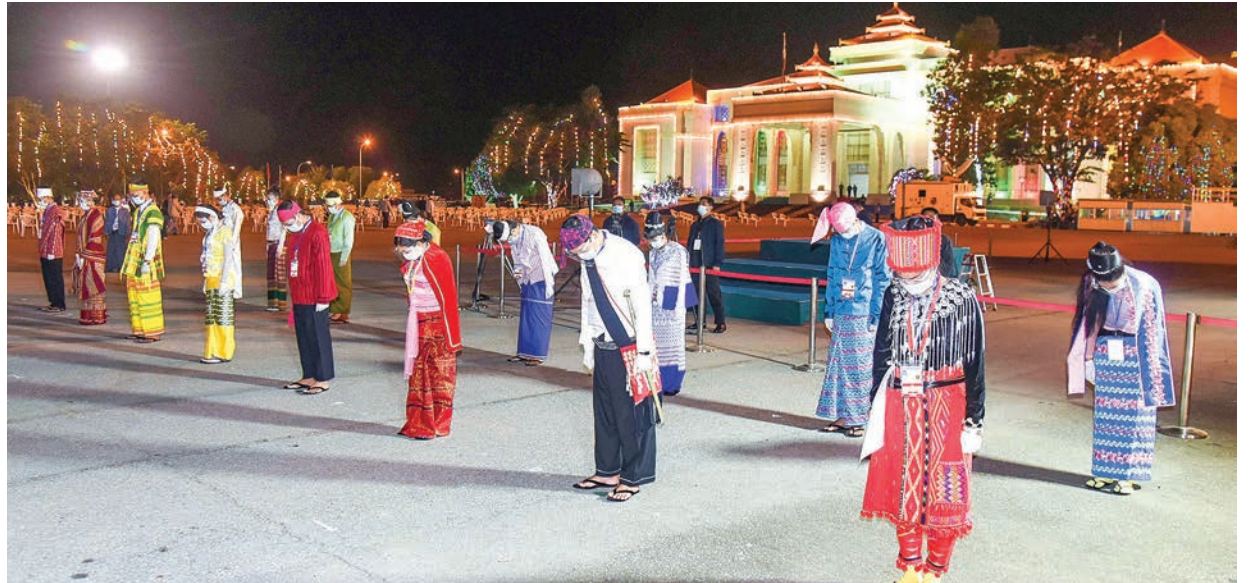
The national races are saluting the State Flag at the event in Nay Pyi Taw yesterday.

CEREMONIES to hoist and salute the State Flag to mark the 74 th Independence Day were held in Nay Pyi Taw yesterday.