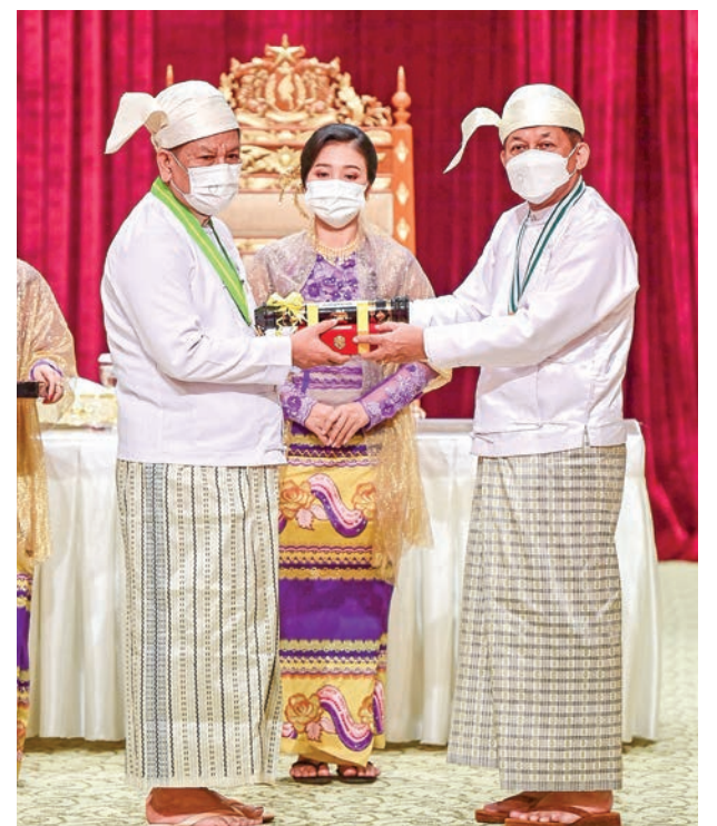
The Senior General gives two Wunna Kyaw Htin title awardees.

The Senior General posed for documentary photos together with title recipients and their families. After the ceremony, the Senior General cordially greeted the title recipients and their family members.