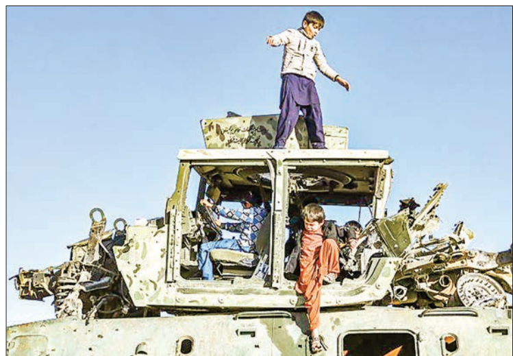
Hulks of destroyed American armoured vehicles are also on informal display on roads outside the city. PHOTO: AFP

"I knew I was taking a risk," Henry told AFP in a telephone interview.—AFP ■