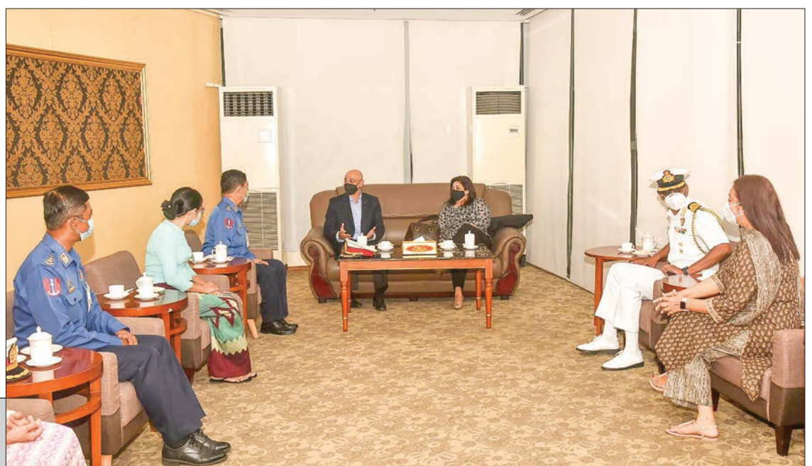
Senior officers from Tatmadaw Navy greet the delegation led by the Chief Hydrographer of the Indian Navy yesterday.

The delegation will spend five days in Myanmar until 8 January to attend the 1 st Joint Committee Meeting and visit places of significance in Yangon. —MNA