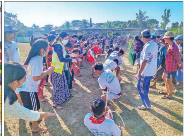
Wakema, Myaungmya District, Ayeyawady Region.