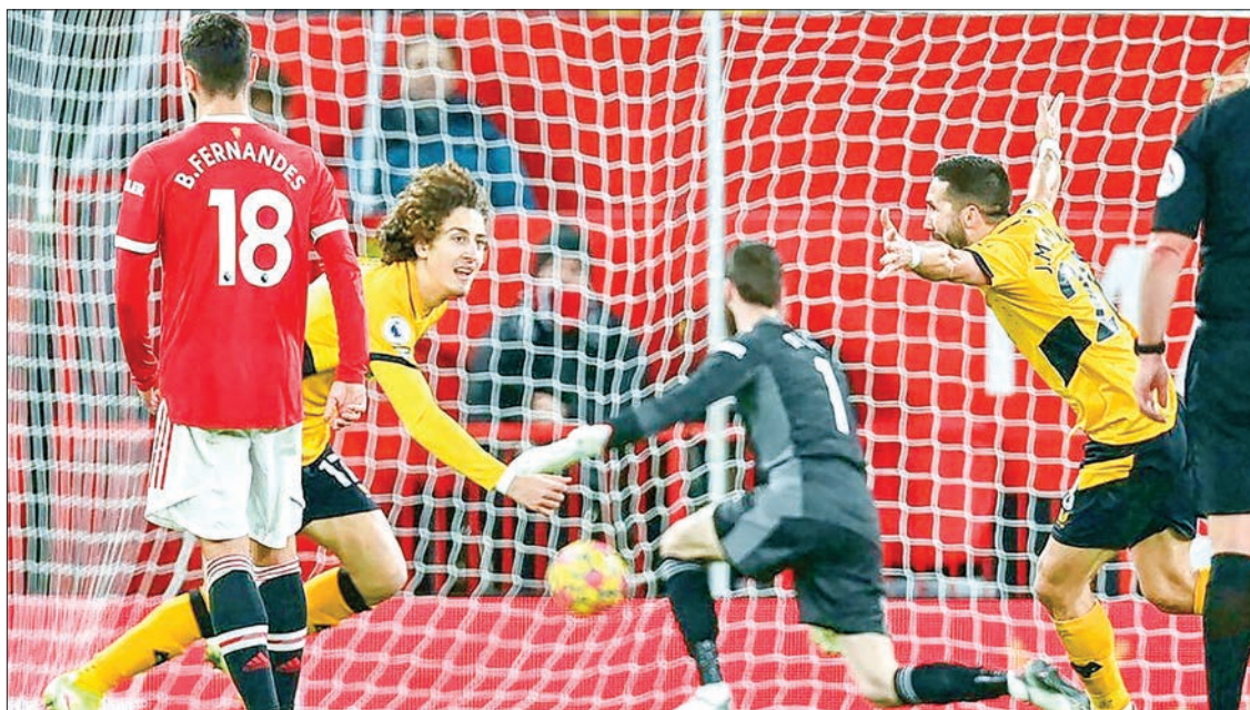
Joao Moutinho (right) scored Wolves' winner in 1-0 victory at Manchester United.

WOLVES ended Ralf Rangnick's unbeaten start as Manchester United interim manager on Monday as Joao Moutinho's strike earned a deserved 1-0 win at Old Trafford. A first home defeat to Wolves in 42 years leaves United still seventh in the Premier League table, four points adrift of the top four.