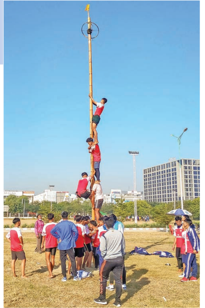
Mandalay, Mandalay Region.