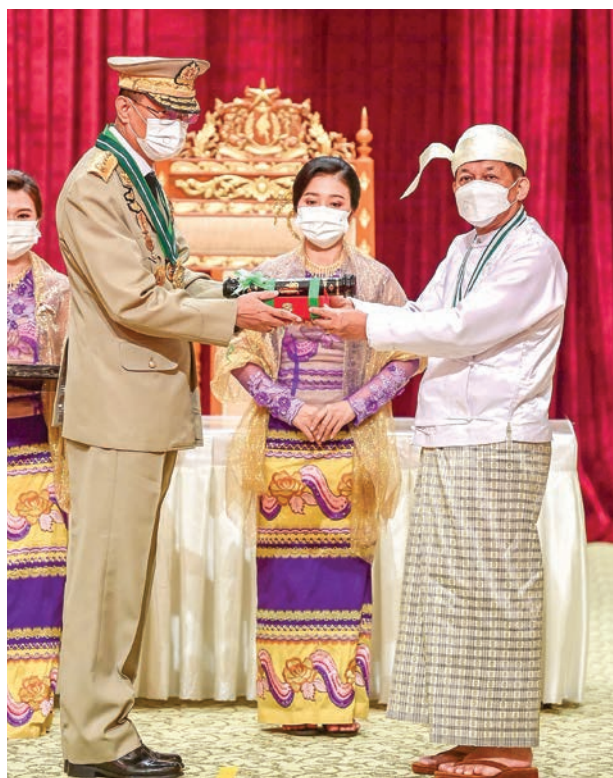
The Senior General offers ten Sithu titles.