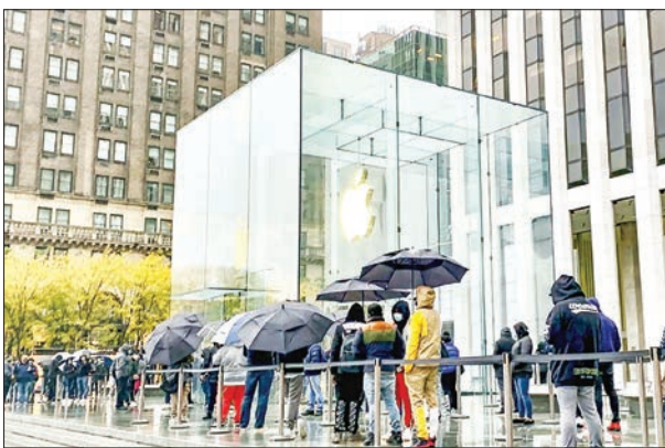
Apple Inc. became the first US company with a market value topping $3 trillion on Monday, aided by robust sales of iPhones and laptop products amid solid demand for remote learning and telework devices due to the coronavirus pandemic

The IT giant's current market value is roughly 10 times that of Toyota Motor Corp., the largest among