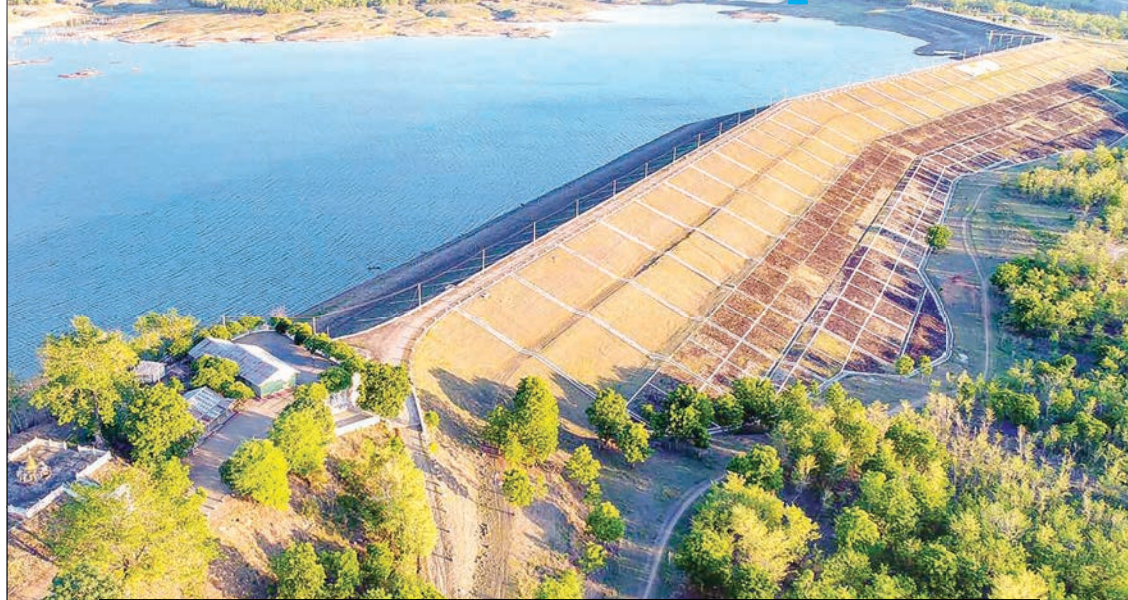
An aerial view of Mann Chaung Dam. Mann Chaung Dam can store water approximately to 83,250 acre-feet and will supply adequate irrigation to 18,760 acres of summer crops in Minbu Township, according to Irrigation and Water Utilization Management Department.

MANN Chaung Dam is ensuring adequate irrigation water throughout the year in the tropical Minbu Township, Magway Region. Mann Chaung Dam surrounded by evergreen forests is the heart of irrigated agriculture in the region.