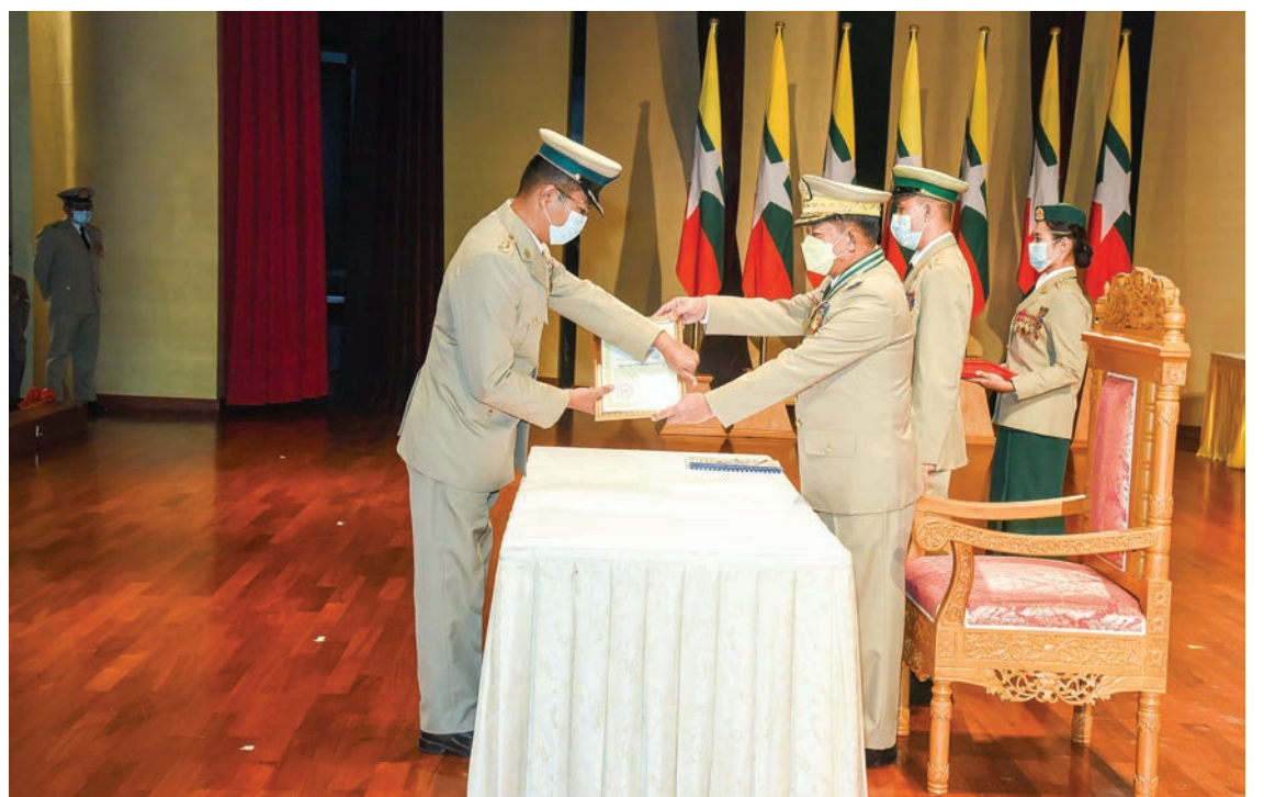
The Senior General confers the Excellent Medal in Science to six Lieutenant-Colonels.

With regard to the number of winners who secured the gallantry medals and certificates at the Tatmadaw till January 2021, there are six recipients in the Aung San Thuriya title, 50 in the Thiha Thura title, 546 in the Thura title, six in the Thiha Bala title, 1,860 in gallantry certificate, 2,018 in gallantry medal, 339 in the gallantry certificate of the Supreme Commander, 2,987 in gallantry certificate of the Commander-in-Chief of Defence Services, nine in the honorary certificate of the Supreme Commander and 1,901 in the honorary certificate of the Commander-in-Chief of Defence Services. — MNA