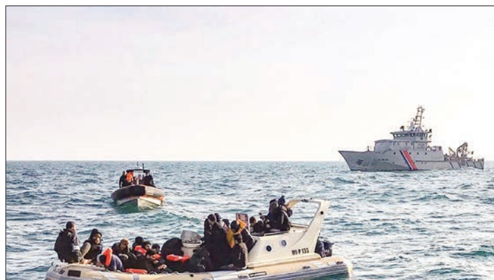
More than three times as many migrants have attempted to cross the English Channel from France in 2021. A handout image from France's Societe Nationale de Sauvetage en Mer on 18 February 2019, shows British rescuers (front) helping some 20 migrants on a semirigid boat trying make their way from France across the English Channel. PHOTO: AFP/FILE

The 27 victims were mostly men but also included seven women, a 16-year-old and a seven-year-old child.—AFP ■