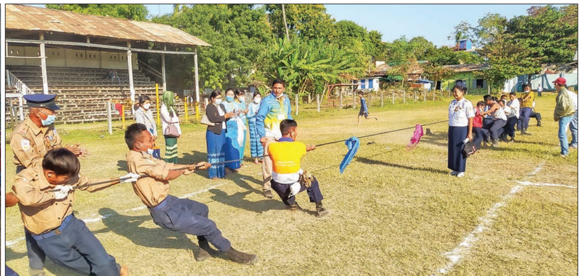
Pyay Town, Bago Region.