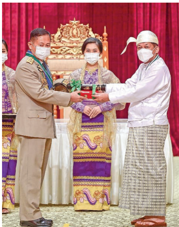
The Senior General presents the Thray Sithu title to the Vice-Senior General.