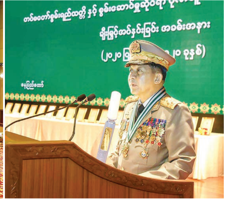
State Administration Council Chairman Commander-in-Chief of Defence Services Senior General Maha Thray Sithu Min Aung Hlaing addresses at the event to present medals and certificates for military gallantry in Nay Pyi Taw on 4 January 2022.

EVERYBODY knows many numbers of the people who sacrificed their lives in independence struggle comprise not only patriotic ethnic people but members of the Sangha, said Chairman of the State Administration Council Commander-in-Chief of Defence Services Senior General Maha Thray Sithu Min Aung Hlaing at the ceremony to present medals and certificates for military gallantry at Zeyathiri Beikman in Nay Pyi Taw yesterday afternoon.