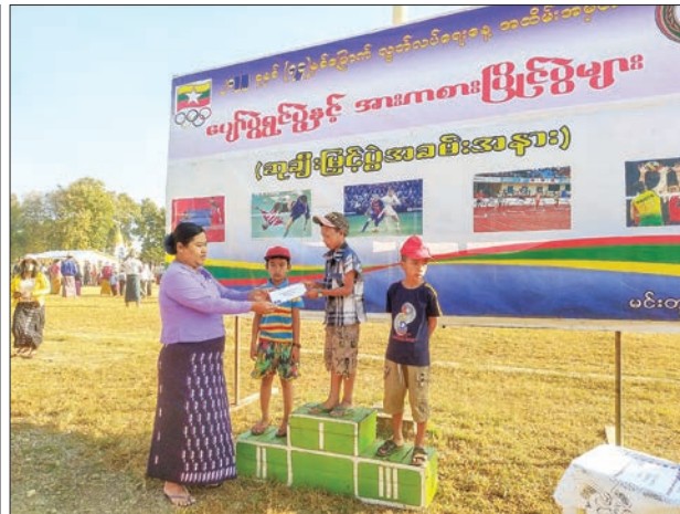
Mindon, Thayet District, Magway Region.