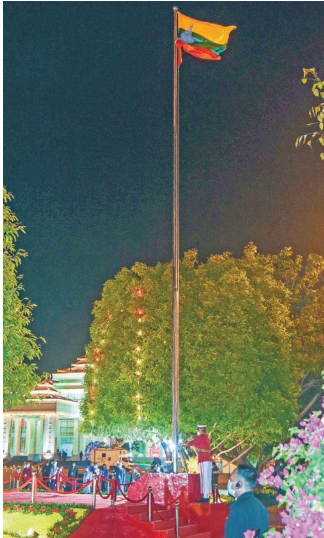
The hoisting of State Flag at 4:20 am in progress.