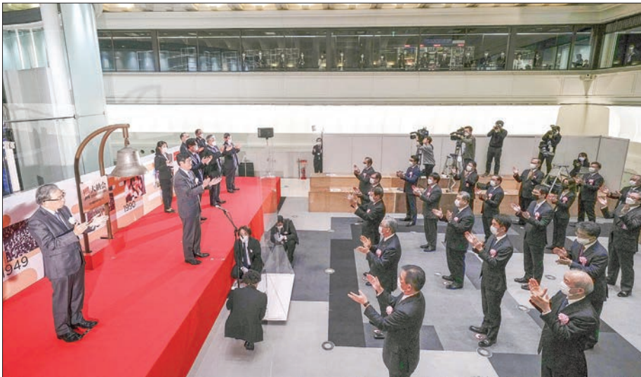
Market officials wearing masks for protection against the coronavirus make a ceremonial hand-clapping at the Tokyo Stock Exchange after the last trading session of the year on 30 December 2021.

The downside is expected to hold firm around 26,000. The Nikkei index advanced 4.9 per cent in 2021 to end at 28,791.71, a third straight year of climb but a narrower gain than the 16 per cent rise the previous year. Along with precision