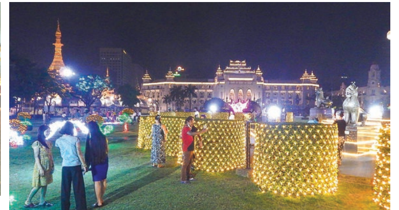
People at Maha Bandoola Park on Independence Day.