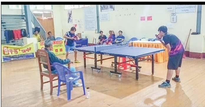
Loikaw, Kayah State.