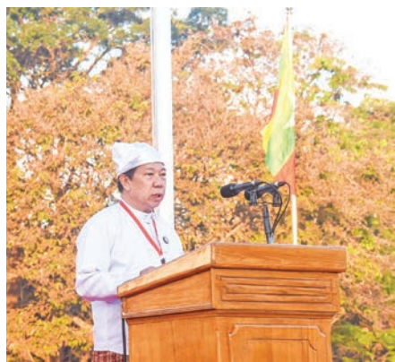
Yangon Region Chief Minister U Hla Soe read out the message sent by State Administration Council Chairman Prime Minister Senior General Min Aung Hlaing.

Those present at the ceremonies were Chief Minister of Yangon Region U Hla Soe, Commander of the Yangon Command Maj-Gen Nyunt Win Swe, Chief Justice of Yangon High Court and Region Ministers, Region Advocate-General, Region Auditor-General, senior Tatmadaw officers, departmental officials, representatives of the Myanmar