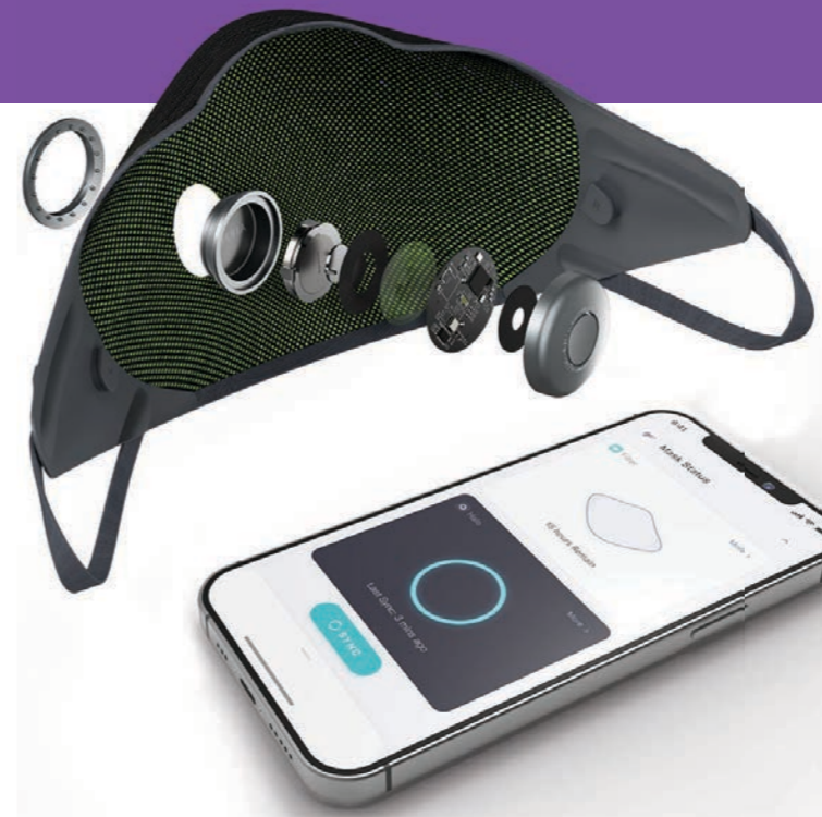
AirPop's Active+ mixes breathing sensors with air quality data. AirPop: The connected Halo sensor (just in the wearer's bottom-left) actively monitors user respiratory health stats and local air quality, providing feedback regarding breathing and mask performance through the companion app.

"Traditional masks are not 100 per cent airtight, air passes through the sides. Our mask is