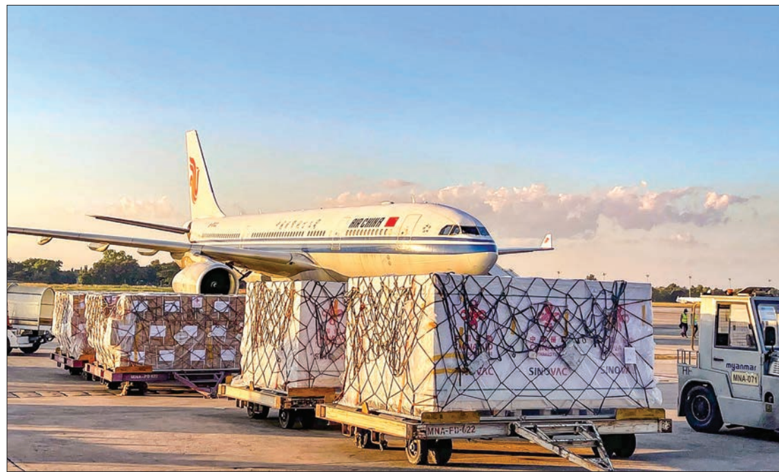
Packages of Sinovac COVID-19 vaccines donated by the People's Republic of China are being unloaded from plane of Air China airlines at Yangon International Airport on 21 November 2021.

To date, the steady progress in Myanmar's vaccination programme is based on vaccines purchased by Myanmar and the generous donations of vaccines and medical supplies from China, Russia, India and Cambodia. No vaccine has been received from the COVAX facility or its UN partners (WHO and UNICEF), although these UN partners have made various declarations on UN Country Team press releases.