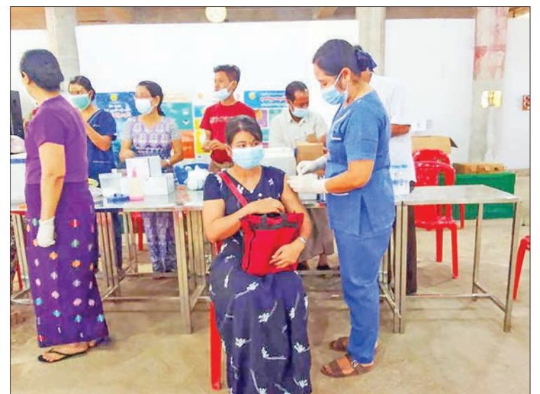
Yankin locals get inoculated against Covid-19.

TATMADAW has been working together with doctors, health workers and volunteers to carry out COVID-19 immunization to the people over the age of 40 including monks, nuns, religious leaders, civil service personnel, prisoners, persons with disabilities, people with chronic diseases, ethnic armed forces, people in IDPs camps and students over the age of 12 in regions and states.