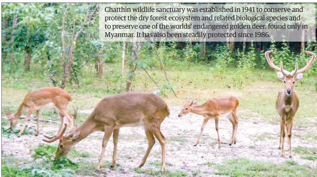
Chatthin wildlife sanctuary was established in 1941 to conserve and protect the dry forest ecosystem and related biological species and to preserve one of the worlds' endangered golden deer, found only in Myanmar. It has also been steadily protected since 1986.

The Chatthin wildlife sanctuary has a total area of over 66,000 acres. There were 1,501 golden deer in 2012, 1,126 in 2013, 671 in 2004, 506 in 2015, 480 in 2016, 728 in 2017, 889 in 2018 and 1409 as of April 2019.