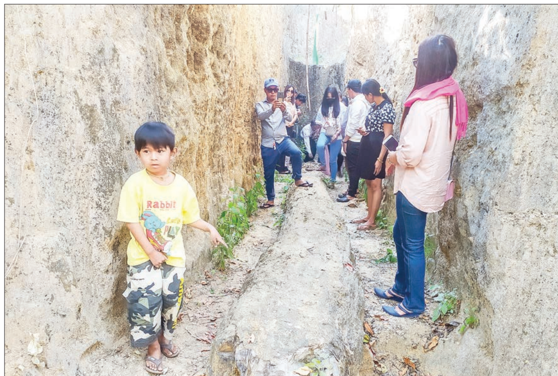
This fossil unearthed in Thanbo village was found 17 feet under the ground level and the length of this petrified wood cannot be confirmed yet as the digging has not finished. The petrified wood is estimated at six feet seven inches, for now.