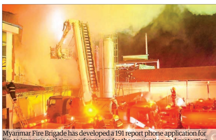
Myanmar Fire Brigade has developed a 191 report phone application for fire to improve real-time performance for the prevention and protection procedures of the lives and properties of the people and trust in the fire service.

Myanmar Fire Brigade has developed a 191 report phone application for fire to improve real-time performance for the prevention and protection procedures of the lives and properties of the people and trust in the fire service. People are encouraged to download the application and