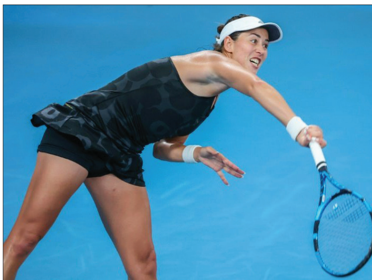
Garbine Muguruza made a winning start to her season.

AUSTRALIAN Open third seed Garbine Muguruza made a confident start to her season with a straight-sets win over battling Ekaterina Alexandro-