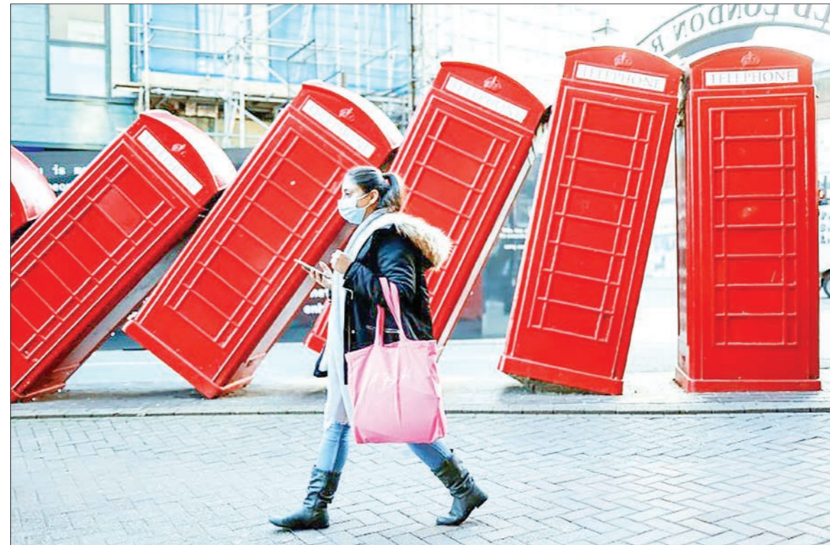
One WHO official spoke of a 'west-to-east tidal wave sweeping across' Europe.

The WHO's regional director for Europe Hans Kluge described a "new west-to-east tidal wave