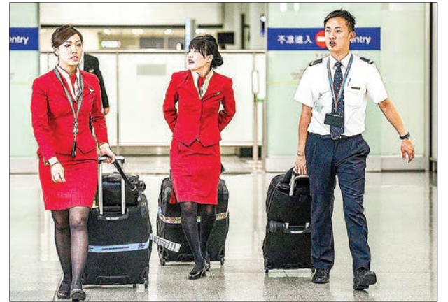
Cathay's cabin crew and pilots have already been observing a series of rostering and health measures to minimize their exposure to the virus.

rule-breakers should not overshadow Cathay Pacific's contributions to Hong Kong and that he believed the airline's crew arrangements were in line with government policy. Following China's lead, Hong Kong maintains a strict zero-Covid strategy that has kept cases low but largely cut the international finance hub off from both the mainland and the rest of the world for the last two years.—AFP ■