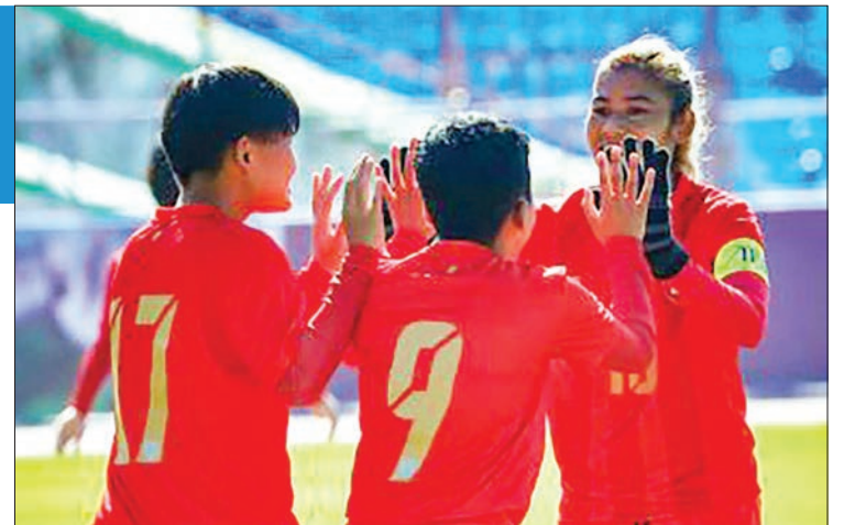
Myanmar team players celebrate after the winning goal in an international match.

Host India is included in Group A with China, China Tai-