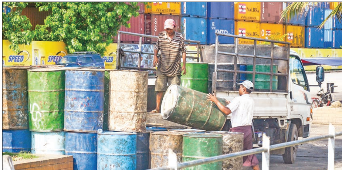
The association has already distributed the edible oil to the consumers at a cheaper rate through wholesalers, retailers and mobile market trucks as of the last week of November last year.

MYANMAR Edible Oil Dealers' Association (MEODA) will chronologically sell the palm oil to the wholesalers and retailers.