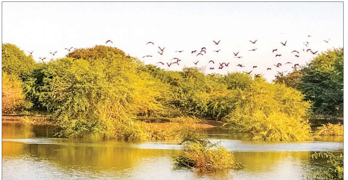
Winged tourists are seen at the Bagan-NyaungU World Heritage site.

Those ponds and lakes dried out in the previous years. This year, they stay full of water. The Black-headed Ibis, Glossy Ibis, common moorhen, Asian Openbill, Cormorant, blue whistling thrush, kingfisher and other resident