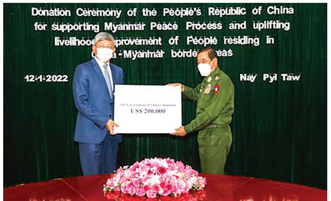
US$200,000 assistance goes to the Ministry of Border Affairs.

After that, Union Minister Lt-Gen Tun Tun Naung thanked for the donations and the two sides cordially discussed matters related to further cooperation in human resource development activities and the stability and development of border areas. —MNA