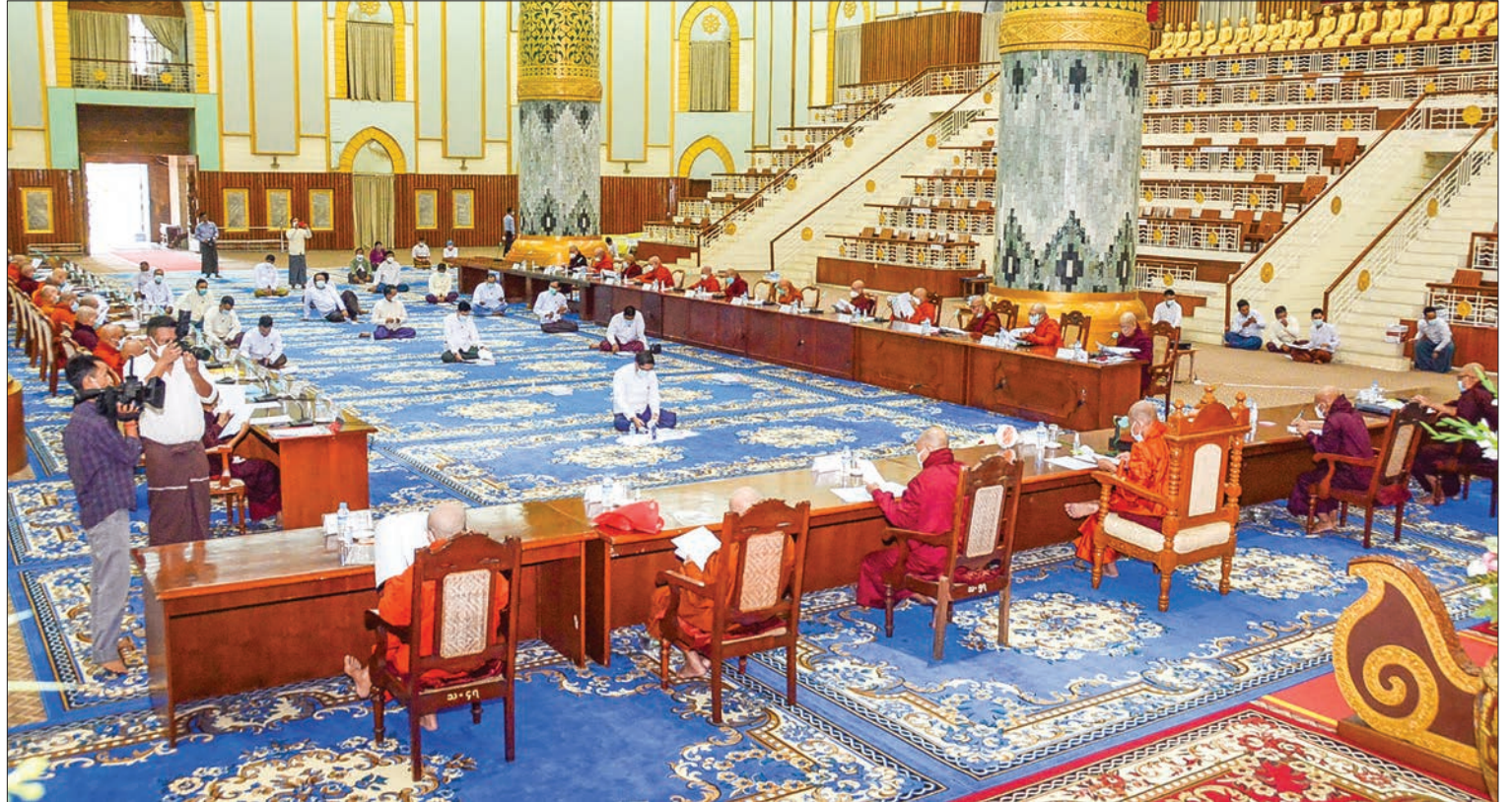
The second-day session of the 47-member eighth State Sangha Maha Nayaka Committee's Ninth Plenary Meeting in progress.

On 26 November, at the 20 th meeting of the National Seed-Related Committee, various experts in the Technical Working