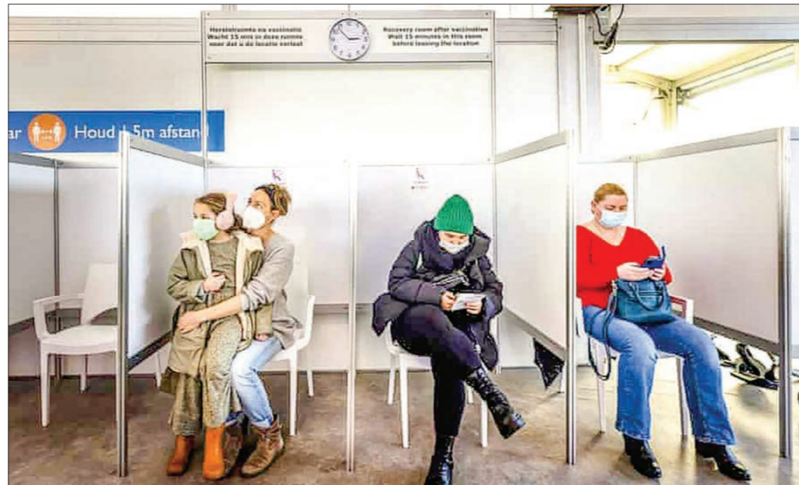
People sit in a waiting area after receiving Covid-19 booster in Schiphol, near Amsterdam.

(they) continue to provide WHO-recommended levels of protection against infection and disease by VOCs (variants of concern), including Omicron and future variants."