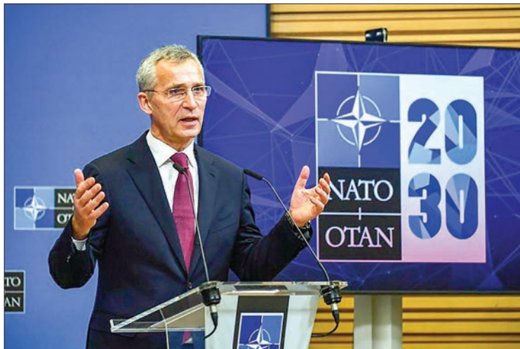
NATO Secretary-General Jens Stoltenberg gave a press conference with the Ukrainian foreign minister after their bilateral meeting at the European Union headquarters in Brussels on 16 December 2021.

spokeswoman insisted: "NATO'S relationship with Ukraine is a matter only for Ukraine and the 30 NATO allies, not for other countries to determine."