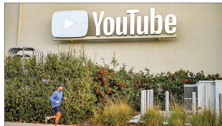
An exterior view of the YouTube Space in Los Angeles, California. YouTube Space LA is one of 10 facilities worldwide where content creators can produce video content, learn new skills, and collaborate with the YouTube community.

It also urged the platform to make sure its recommendation algorithm did not actively promote disinformation to its users. YouTube spokesperson Elena Hernandez defended the platform, saying that fact checking was a “crucial tool”, but just “one piece of a much larger puzzle to address the spread of misinformation”. — AFP ■