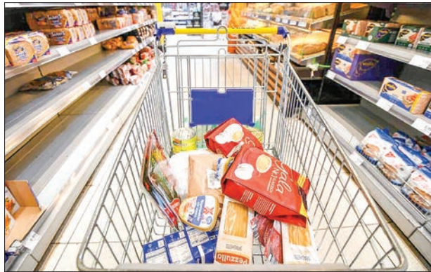
A supermarket in Ahlen, Germany. The reopening of economies from lockdown has caused prices for goods and services to climb.

"In any case, monetary policy must be on its guard," said Nagel, who has spent 17 years at the