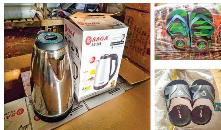
Seized illegal goods.

The officials take action against traffickers for the four commodities (K7,915,000) seized by the Mayanchaung checkpoint on 11 January