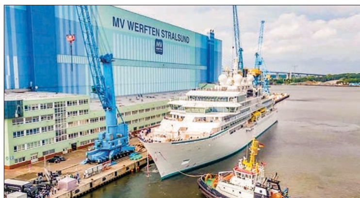
German-based cruise ship builder MV Werften said it will file for bankruptcy on Monday.

GERMAN-BASED cruise ship builder MV Werften said it will file for bankruptcy on Monday, as the coronavirus pandemic scuttled the subsidiary of Asian tourism and casino giant Genting.