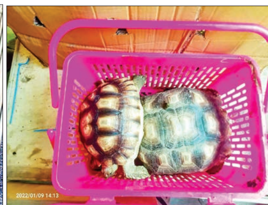
Confiscated timber and rare animals.