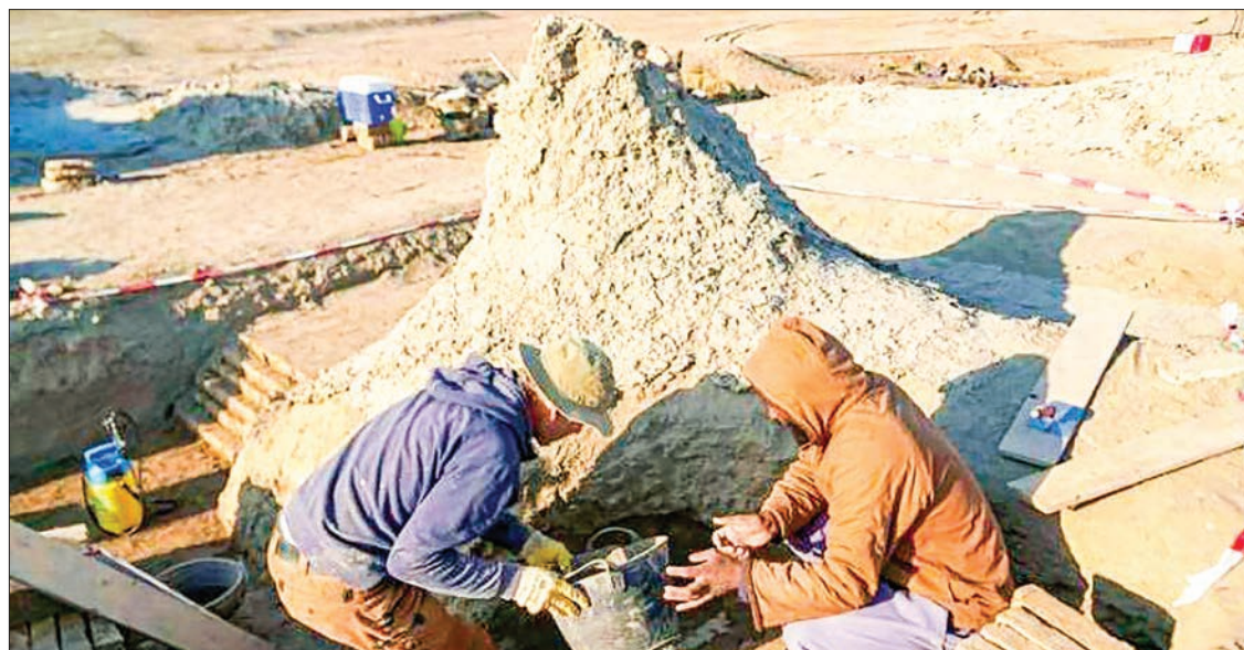
Members of a German-Iraqi archaeological expedition work on restoring the white temple of Anu in the Warka (ancient Uruk) site in Iraq’s Muthanna province, on 27 November 2021.

Behind him, a dozen other European and Iraqi archaeol-