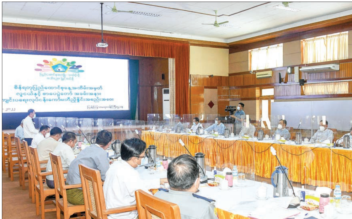
The coordination meeting on youth and literature festival for Diamond Jubilee Union Day in progress.

The festival will be held to widely reach the students across the country, in addition to those who come to the festival, said Deputy Minister U Ye Tint. He also urged the attendees to work together and