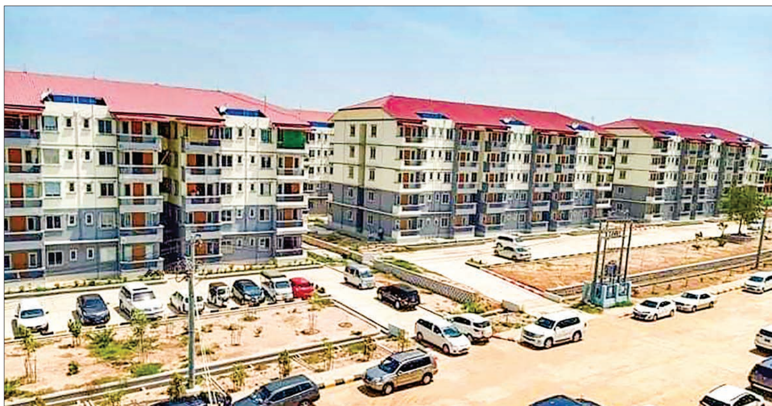
One of the public rental housing projects in progress.

The 10,000-unit Public Housing Project was first proposed by the Ministry of Construction in July 2020 and it was approved to