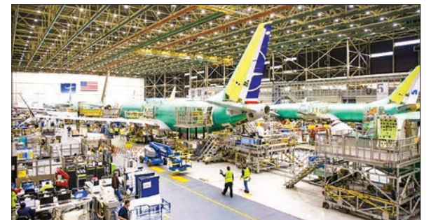
The US aviation giant, benefitting from the return of its 737 MAX jet in most leading markets, delivered 340 planes last year, up from 157 in 2020.

below Airbus' 611 deliveries in 2021. Deliveries are tied to company revenues and closely monitored by investors. The figures are the latest to point to Boeing's partial recovery from both the lengthy grounding of its 737 MAX model following two fatal crashes, and the downturn in the commercial plane business during Covid-19 that halted many new plane orders for more than a year.—AFP ■