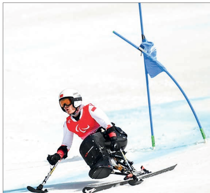
Jesper Pedersen of Norway competes during the alpine skiing men's giant slalom sitting of Beijing 2022 Winter Paralympic Games at National Alpine Skiing Centre in Yanqing District of Beijing, capital of China, 10 March 2022.

JESPER Pedersen of Norway grabbed his third gold medal of the Beijing Paralympic Winter Games in convincing fashion, winning the men's giant slalom sitting on Thursday.