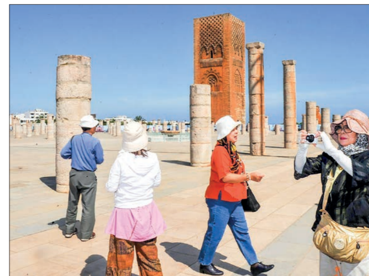
Tourists visit the Mausoleum of Mohamed V in Rabat.

Researchers surveyed 1,021 US residents who rated their travel desire on a five-point scale. Survey respondents with the highest travel desire also had the highest COVID-19 vaccination intentions, the study found.— ANI