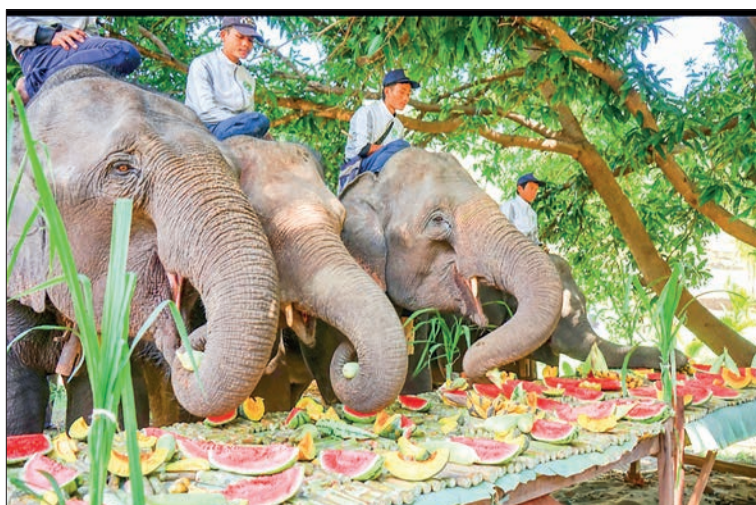
Elephants enjoy their buffet-feed.

Region. U Htet Naing Aung, in-charge of the elephant camp, said that the camp was based on tourism to make it easier for staff to work due to reduced logging activities. — Zeya Htet (Minbu)/GNLM