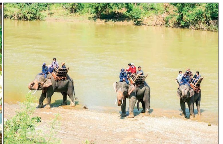
Visitors are seen riding on the elephants.