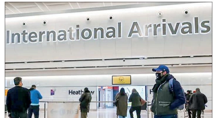
People wait for passengers at one of the International Arrivals halls at London Heathrow Airport in west London on 14 February 2021.

However, Prime Minister Boris Johnson has decided to scrap all pandemic legal curbs in England from Thursday, urging a shift from government intervention to personal responsibility.—AFP ■