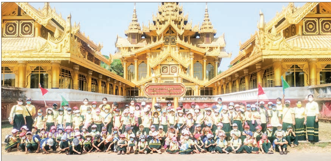
Students pose for the group photo at the front of the Kanbawzathadi Palace.