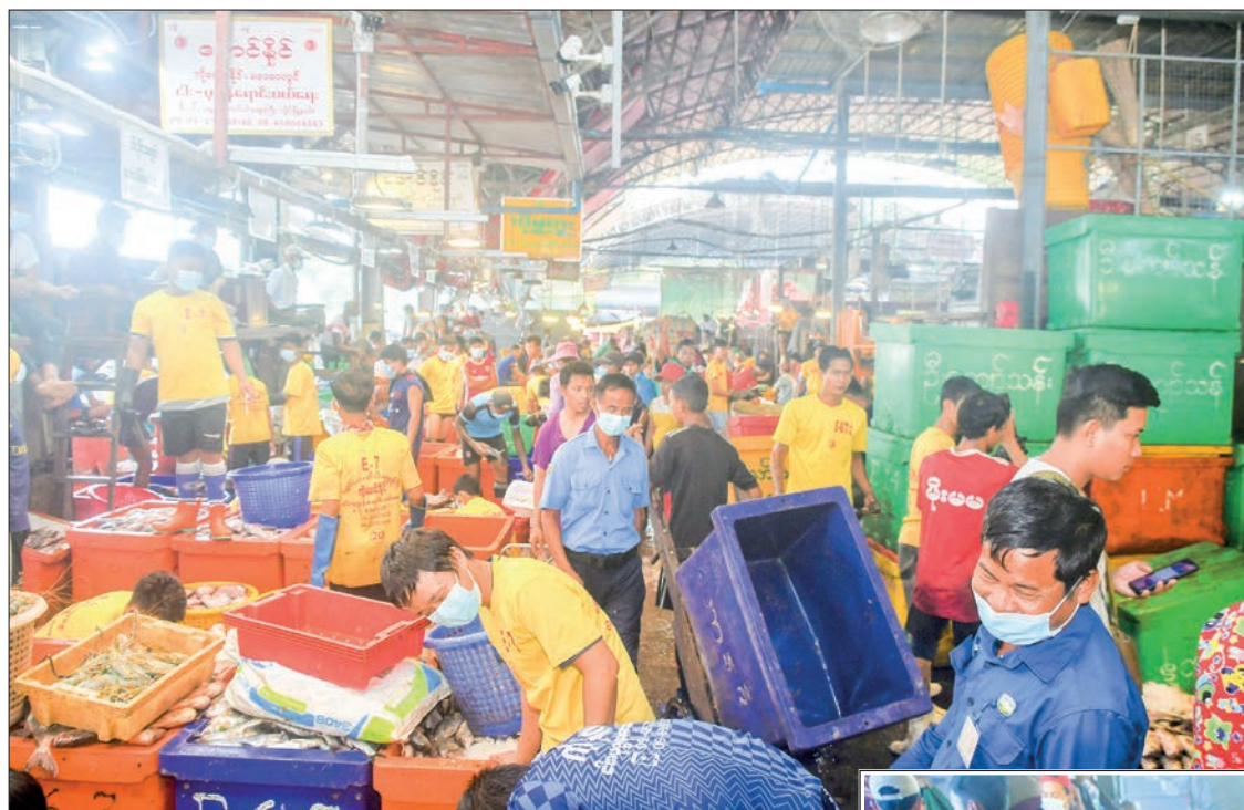
The Shwe Padauk Fish Market is in action. It was established in 2014, with a small number of stalls.

The saltwater fishery products that primarily came from Ayeyawady Region, Rakhine State, Mon State, Taninthayi Region and coastal areas are supplied to the Sanpya and Shwe Padauk fish markets with the use of vehicles and vessels. Moreover, freshwater fish and prawns from Ayeyawady, Bago and Yangon regions are flowing into the markets daily. Over 200,000 visses of freshwater fishery products such as rohu, mrigal fish, hilsa, big head carp, great white sheatfish, giant sea perch, whisker sheatfish, catfish, tilapia, striped catfish, striped snakehead, prawn, shrimp and others, and 14,000 visses of seafood enter the market every day, circulating about 300,000 visses of fishery products per day.