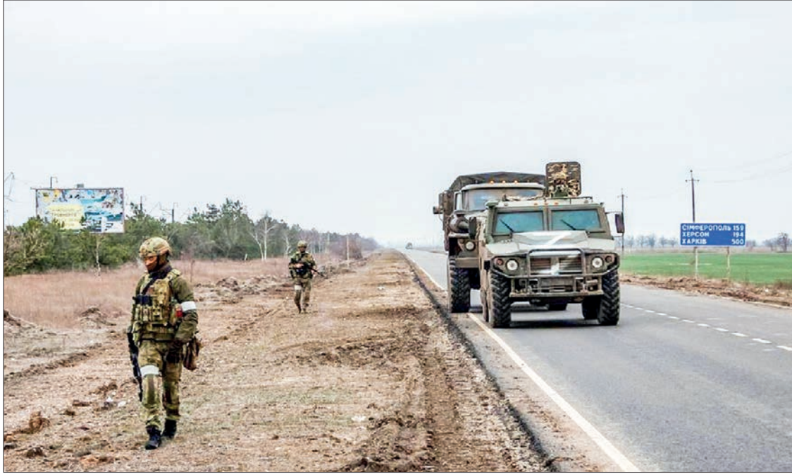
8 MARCH 2022: A Russian humanitarian convoy carries food supplies from Crimea to Ukraine.

RUSSIA will no longer participate in the Council of Europe, the country's foreign ministry said Thursday.