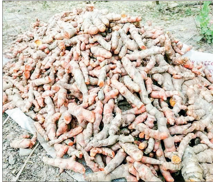
Of the kitchen crops, turmeric and ginger have penetrated the foreign market. The exports of kitchen crops such as turmeric, ginger, tamarind, onion and garlic have been growing.

Myanmar exported over US$11.147 million the worth of 18,614 metric tons of turmeric to its neighbouring countries in the financial year 2019-2020 and $7.7 million valued 13,553.49 MT of turmeric in the FY2020-2021, according to statistics released by Myanmar Customs Department.