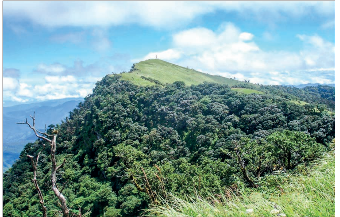
Picture shows an aerial view of the Zinghmuh Mountain.

Source : Ministry of Natural Resources and Environmental Conservation.