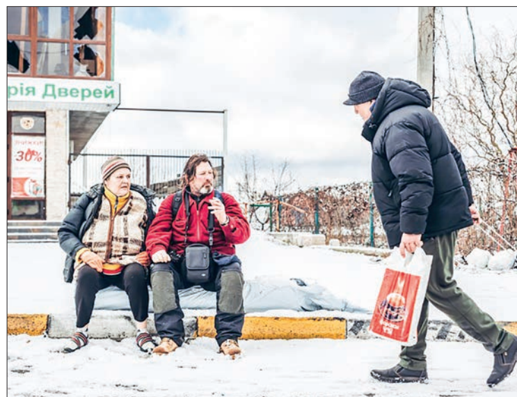
People rest by a road in Irpin, Ukraine, March 8, 2022.

Lavrov singled out the deliveries of portable air defence systems, saying that they could be used to create "risks for