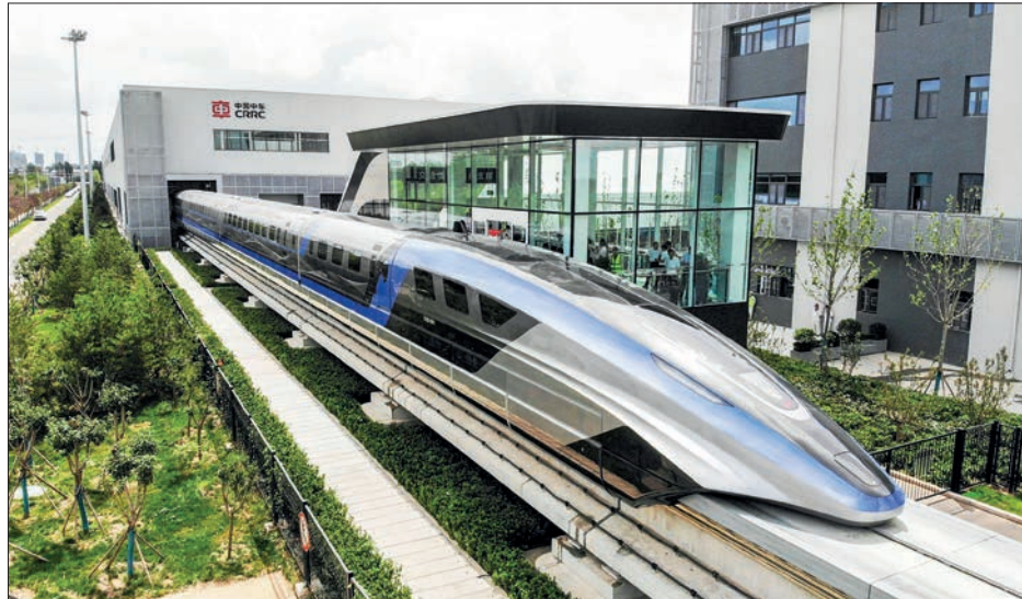
This 20 July 2021 photo shows China’s new maglev transportation system in Qingdao, east China’s Shandong province.

CHINESE manufacturer CRRZ Zhuzhou Locomotive Co., Ltd. said Thursday that tests have been completed for its next