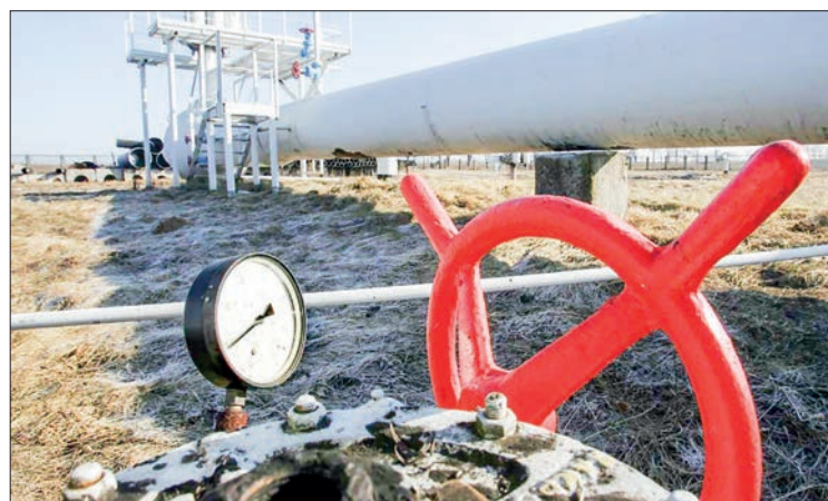
Ireland and the EU as a whole need to take the security of gas supplies more seriously as the Russian invasion of Ukraine highlights vulnerabilities.

THE International Monetary Fund is set to lower its global growth projection next month due to the impact of Russia's invasion of Ukraine, which has triggered massive economic sanctions on Moscow and is sending energy and food prices higher, IMF Managing Director Kristalina Georgieva said Thursday.