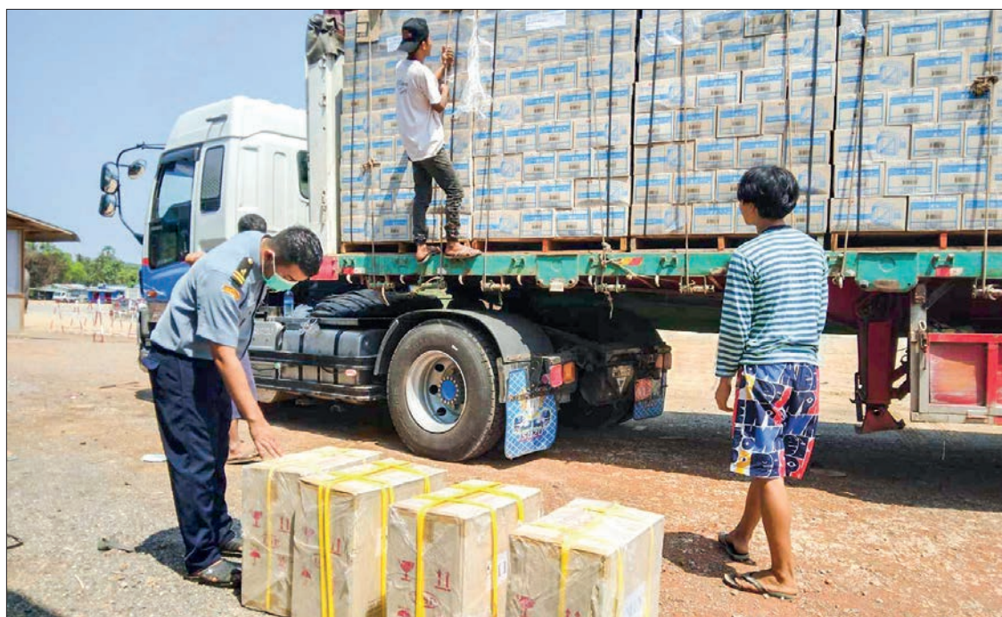
Confiscated illegal goods.

Therefore, three arrests (estimated value of K7,835,650) were made on 11 March, Anti-Illegal Trade Steering Committee stated. — MNA