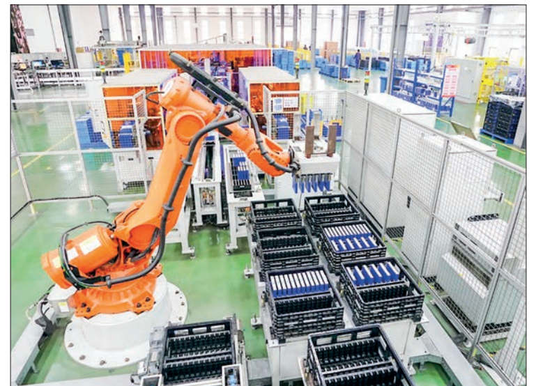
A robot works at a lithium battery factory in Tangshan, north China's Hebei Province, 29 Nov 2020.

"There are a lot of complexities and rising uncertainties" in the global sphere, Li said at the press conference. "It will be very hard for such a big economy to maintain a medium to