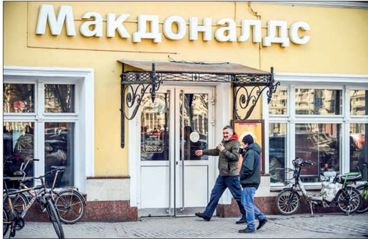
McDonald's has 850 restaurants in Russia. Many Western companies, like McDonald's, have said they will suspend operations in Russia.

Putin on Thursday however downplayed the massive sanc-