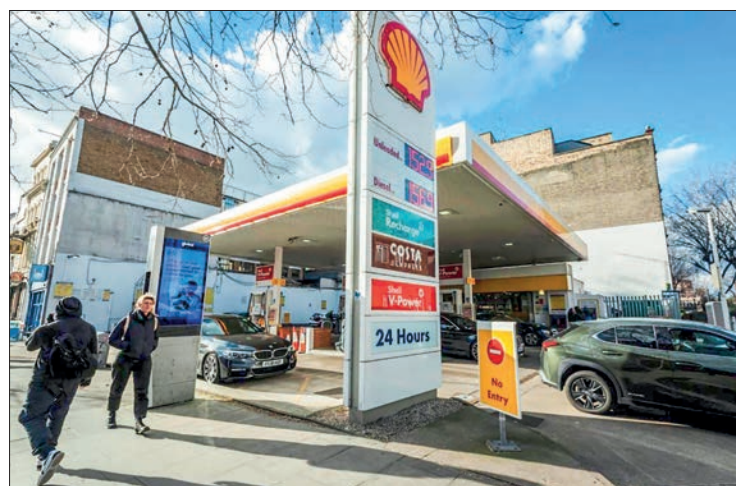
People walk past a petrol station in London, Britain, 25 February 2022. After days of bearish trading amid concern over the escalating Russia-Ukraine tension, a flare-up of the conflict battered major European markets on Thursday, bringing the stocks down to new lows.

A Chinese foreign ministry spokesperson said on Thursday the United States should not undermine China’s legitimate rights and interests in handling with ties with Russia, otherwise China will make firm and resolute responses.