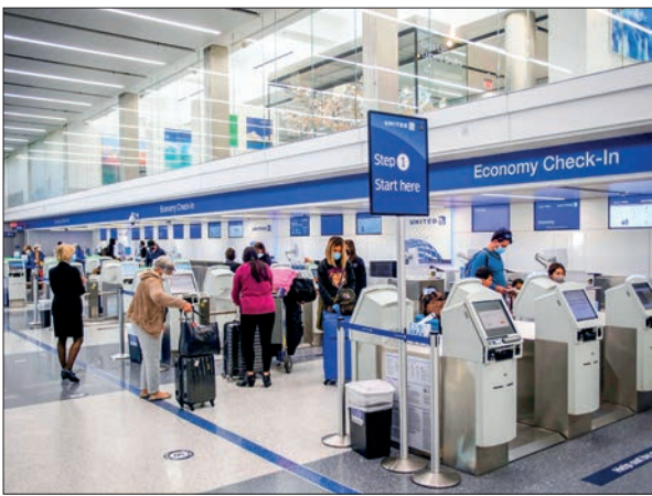
United Airlines airport check-in counters.

of constraints on financial institutions and exports including semiconductors. Japan had previously announced sanctions on Belarusian President Alexander Lukashenko. —AFP ■