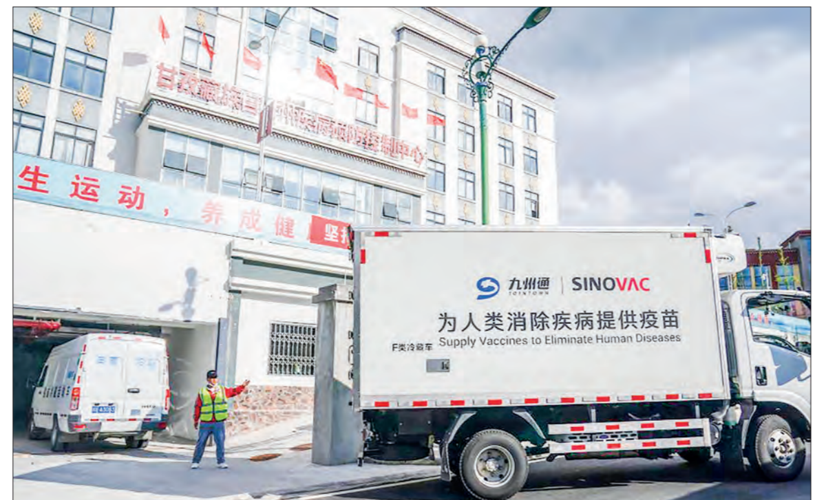
The refrigerated truck carrying COVID-19 vaccines arrives at the disease control center in Ganzhi Prefecture of southwest China's Sichuan Province, 22 July 2021.

Their major findings include that lineage A and lineage B of SARS-CoV-2, which caused the early outbreaks, are genetically too different from one another, thus the coronavirus must have evolved in non-human animals and