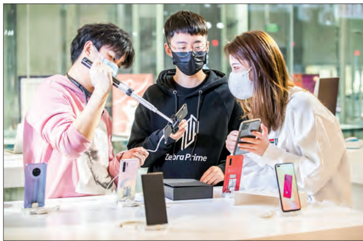
Sales people introduce mobile phone products to customers through livestreaming at a shopping mall in Zhengzhou, capital of Central China's Henan province, on 13 March 2020.

CHINA'S smartphone market saw steady growth in January with the sales increasing by 0.4 per cent year-on-year to reach