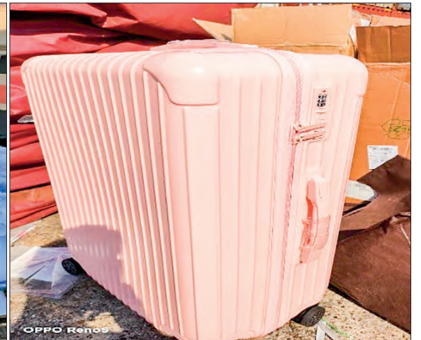
Confiscated illegal goods in Yangon Region.