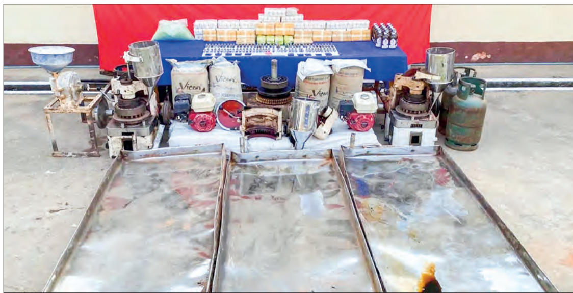
Seized pill-making machines and related items.

THE combined inspection team consisting of Anti-Narcotics Task Force members inspected the suspect Aung Naing Oo (aka) Ei Thein in Sandawut Village of Myeik Township on 11 March and seized 3,000 stimulant tablets. Then, they inspected the motorcycle driven by Min Htike on the Myeik-Taninthayi Road of Tharame Village in Myeik Township and found 20,000 stimulant pills from him and other 40,000 tablets from Zeya Htet who was