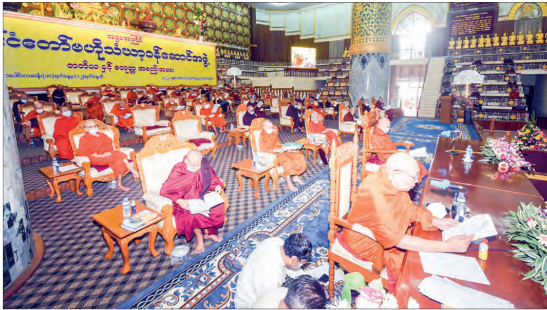
The first-day session of the fourth meeting of the eighth State Sangha Central Working Committee in progress.

reported on the number of attendees to the meeting and announced the event was successful as 86 per cent of Sayadaws joined the event.