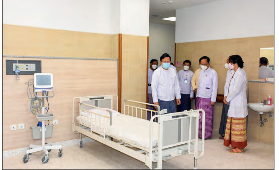
The SAC Secretary and party view around the new ward.