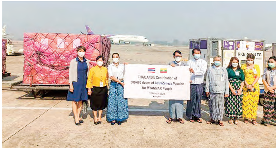
Covid vaccines donated by Thailand are received at Yangon International Airport.

The Ministry of Health accelerate the momentum in the vaccination programme as per the target groups and 24.7 million of people across the nation received the vaccines up to 12 March, while 21.4 million people have been fully vaccinated and 3.3 million people receive their first dose of vaccine. Therefore, a total of 47.01 million vaccines were delivered in the country until 12 March. If people have been fully vaccinated, the vaccines can help prevent serious illness and death.