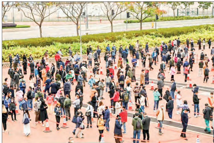
People queue at a mobile specimen collection station for Covid-19 testing in Hong Kong’s Central district on 7 February, as authorities scrambled to ramp up testing capacity following a record high number of new infections.

KATHLEEN Wong thought her 89-year-old mother was lucky to get a coveted spot in a government nursing home, but now she watches in horror as a coronavirus wave tears through Hong Kong’s elderly population.