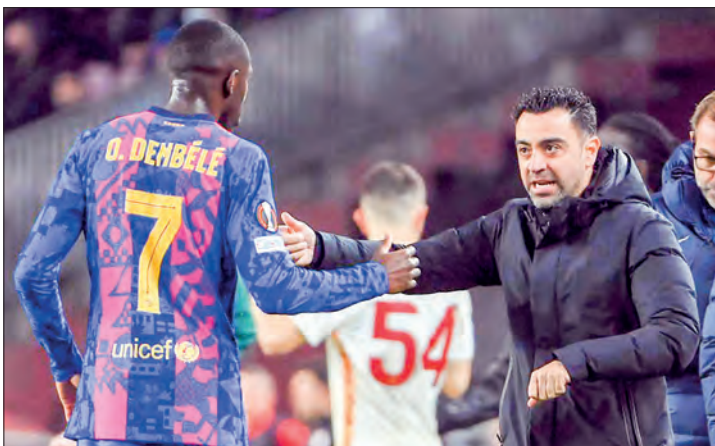
They still have seven points to overturn to reach second but Xavi Hernandez's side do have a game in hand, as well as a meeting with Sevilla to come next month at Camp Nou.

"Mathematics say that we can win the league, so why not?" Xavi said. "The others are failing but not Real Madrid. They have time on their side. It's very difficult, but not impossible." ■