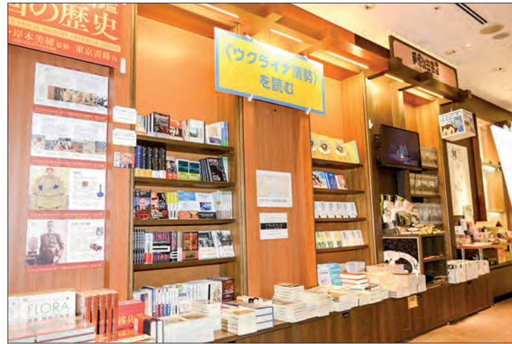
Photo taken on 9 March 2022, shows books about Ukraine and Russia on display in a special corner of a bookstore in Tokyo.