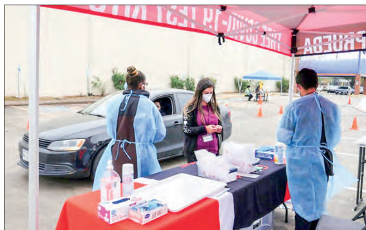
Health workers prepare as people arrive at a Covid-19 testing station in Houston, Texas, to receive a Covid test on 7 January 2022.

US researchers are conducting a clinical trial designed to help understand rare but potentially serious systemic allergic reactions to COVID-19 mRNA vaccines, the U.S. National Institutes of Health (NIH) announced on Wednesday.