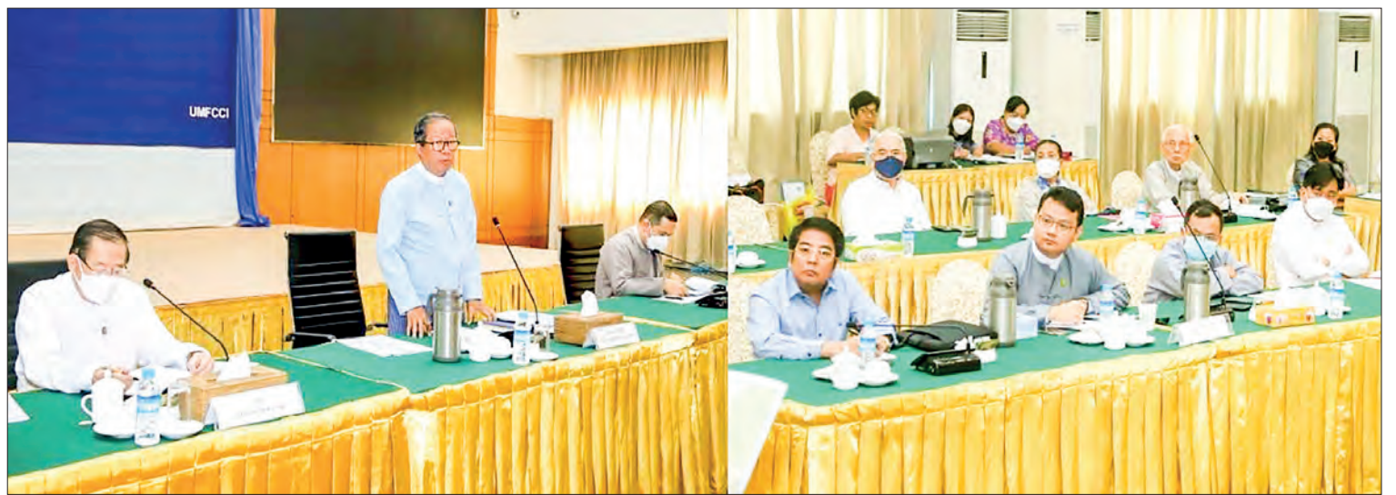
The MoALI Union Minister chairs the coordination meeting with edible oil dealers, oil millers and beans and sesame seeds merchants yesterday.

The local people mainly consume peanut oil and sesame oil and if the oil millers make investments in the high-quality oil mill industry,