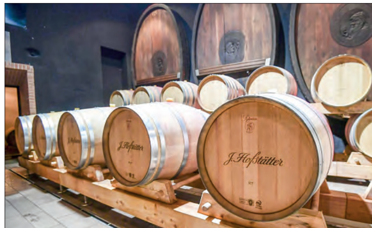
Wine barrels are pictured in a cellar of the Hofstaetter vineyards estate on 28 May 2020 in Termeno, Trentino-Alto Adige northern Italy.

ITALY'S wine sector hit a record 7.1 billion euros (7.8 billion US dollars) in exports last year, more than compensating for lower export totals in 2020 due to the worst period of the coronavirus pandemic, showed data released on Friday. According to an analysis by the Qualivita Foundation of data from Italy's National Statistics Institute (ISTAT), Italian wine exports grew by 12.4 per cent in 2021 compared to the previous year. This was compared to a 2.2-per cent year-on-year decrease in 2020.—Xinhua ■