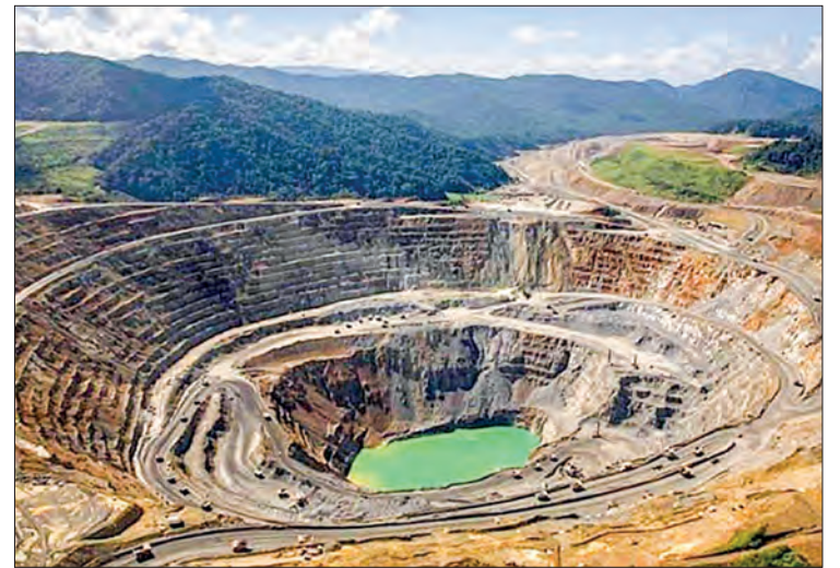
For illustrative purposes only. Open-pit mining is condemned by environmentalists internationally for its ecological and human cost, as well as its heavy use of cyanide. Honduran President Xiomara Castro has clarified her stand on open-pit mines.

That includes gold mines operated by multinational Aura Minerals in San Andres in the west of the country and iron oxide mines in Tocoa in the north-east.—AFP ■