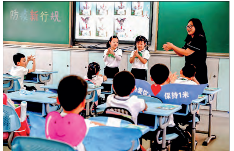
A teacher shows students the correct way to wash their hands at a primary school in east China’s Shanghai, 2 June 2020.

There were 1,369 cases across more than a dozen provinces, according to Friday’s daily official count. Jilin, which has reported hundreds of cases in recent days, is one of more than a dozen provinces facing upticks along with major cities like Beijing and Shanghai. Shanghai on Friday ordered its schools to close and shift to online instruction for the foreseeable future after dozens of cases emerged in the eastern economic hub in recent days.—AFP ■