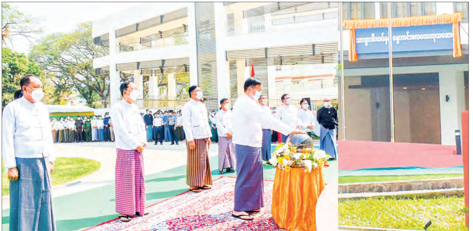
The SAC Secretary press the electric button to inaugurate the new three-storey maternity and newborn babies ward at Magway General Hospital yesterday.

Next, the new three-storey maternity and newborn babies ward was inaugurated. The