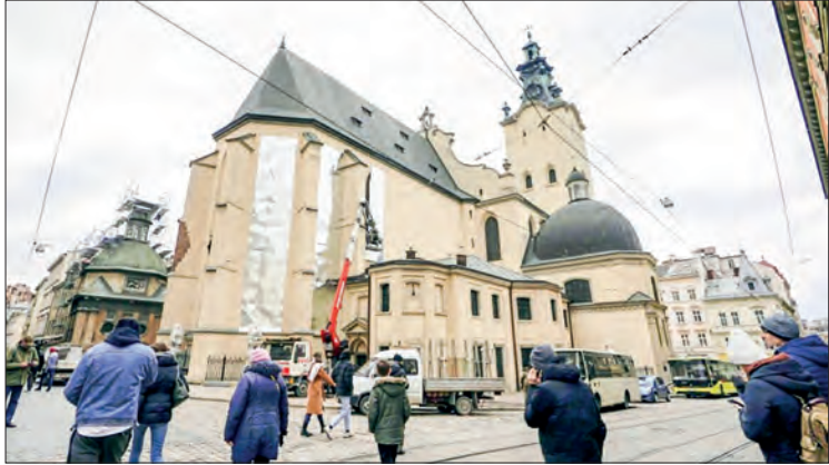
Photo taken on 8 March 2022, in Lviv, western Ukraine, shows a cathedral covered with protective iron plates amid the Russian invasion.

RUSSIAN President Vladimir Putin on Friday agreed to invite volunteers to participate in Russia’s “special military operation” in Ukraine. “If you see that there are