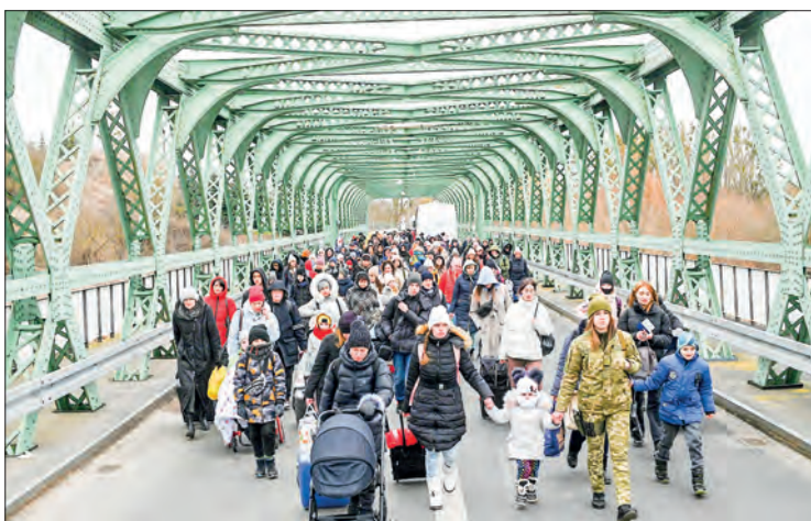
Ukrainian refugees walk across a bridge at the buffer zone of the Polish border in western Ukraine on 6 March 2022.

UKRAINE’S border guard service has said that Poland’s Warsaw and Krakow can no longer accept refugees from Ukraine. Since Russia’s military operation began in Ukraine, thousands and thousands of people of Ukraine are fleeing to different countries. Most of the border-sharing countries have warmly accepted refugees from Ukraine. Over the course of two weeks, about 100,000 Ukrainians have arrived in Krakow, and 200,000 in Warsaw. But now, both of the cities are not able to accept refugees.—ANI ■