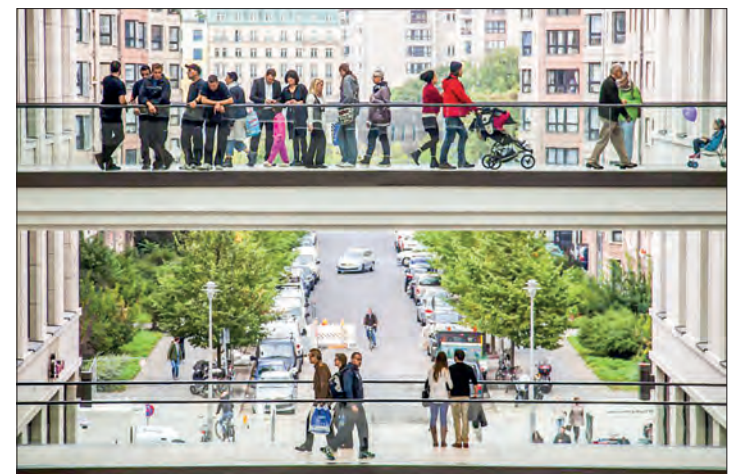
People stand on walkways at central square of LP12 Mall of Berlin.

“The current price increases, especially for mineral oil products, are not yet reflected in the results for February 2022,” he said. Prices for energy products rose by 22.5 per cent in February, significantly more than overall inflation, according to Destatis. While fuel prices increased by 25.8 per cent, prices for light heating oil and natural gas even jumped 52.6 per cent and 35.7 per cent, respectively.— Xinhua ■