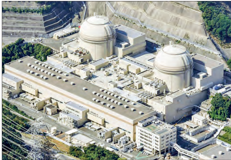
Japan's energy self-sufficiency rate was as low as 11.2 per cent as of fiscal 2020, and the resource-poor country is susceptible to the effects of political unrest abroad.

Following the suspension, the Japanese government introduced stricter safety rules and set a target for nuclear power generation to account for 20 to 22 per cent of the country's electricity supply by fiscal 2030, as