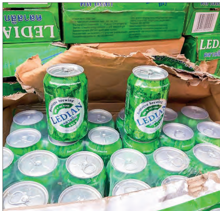
Seized items in Shan State.

er truck carrying the food items (estimated at K70,000,000) leaving Tangyang for Lashio were seized and action is taken under the Customs Law.