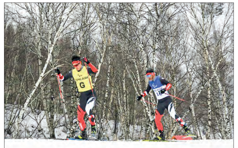
Canada's Brian McKeever (right) has won his 16 th Paralympic gold medal.

"To be perfectly honest, it doesn't mean a damn thing," McKeever said, laughing.