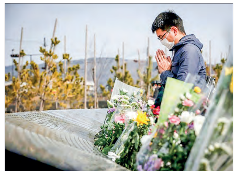
The 2011 tsunami wrecked entire coastal communities.

There was no state-funded national ceremony this year to