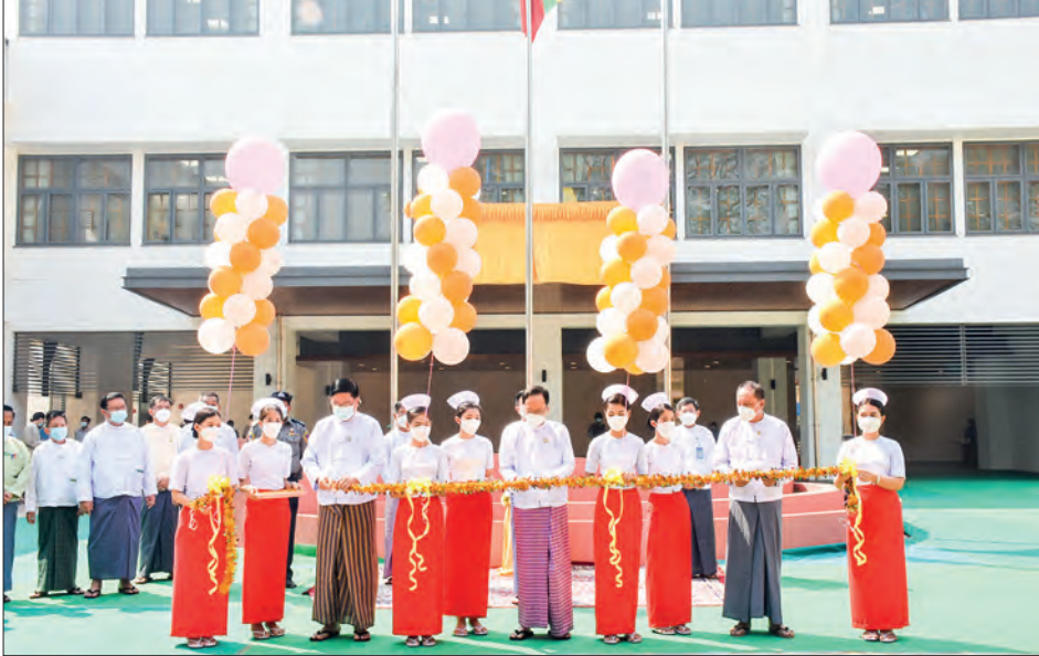
Dignitaries cut the ribbon at the inaugural event.