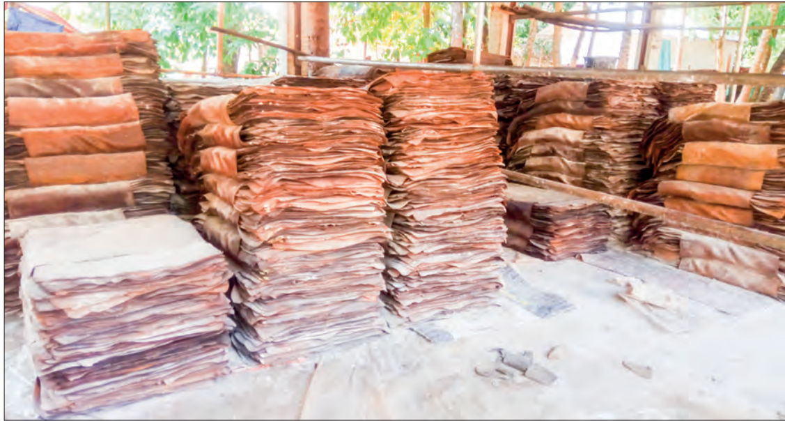
The domestic rubber was priced at below K1,000 per pound in late 31 December 2021. But the price of local 3 rubber slightly increases to K1,220 per pound while the local 3 ribbed smoked sheets (RSS) hit K1,240 per pound on 12 March 2022.

Consequently, although the resumption of the rubber plantation starting from last September and the availability of raw rubber in the market has increased, the price of rubber is unlikely to fall low-