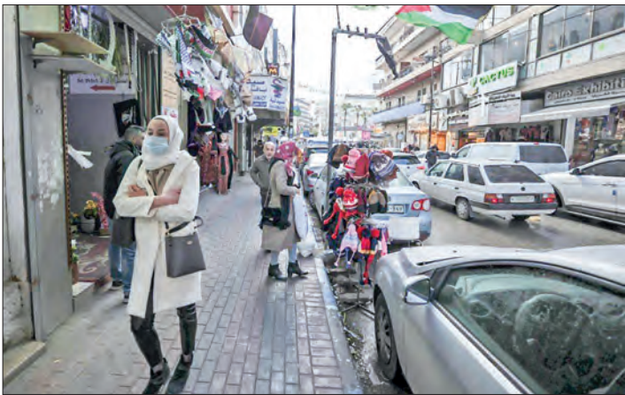
Palestinians walk past shops in the West Bank city of Ramallah in this 20 December 2021 file photo.

Bennett’s hawkish Yamina party allied with right-wing factions in the opposition to pass the legislation above protests of more liberal parties inside and outside government.—AFP ■