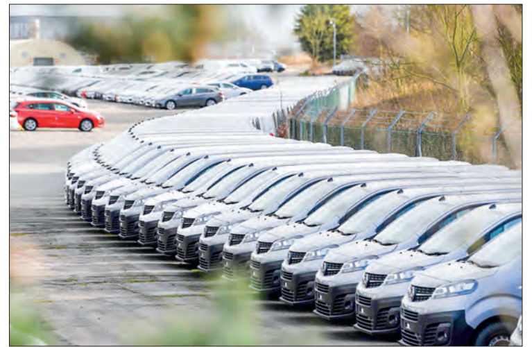
Carmaker Stellantis produces and sells the Peugeot, Citroën, Opel, Jeep and Fiat brands in Russia.

Commission Ursula von der Leyen said the new sanctions aim to further isolate Russia from the global economic system. She also announced a plan to find alternatives to Russian fuels by 2027 in order to reduce EU’s dependence on Russia.