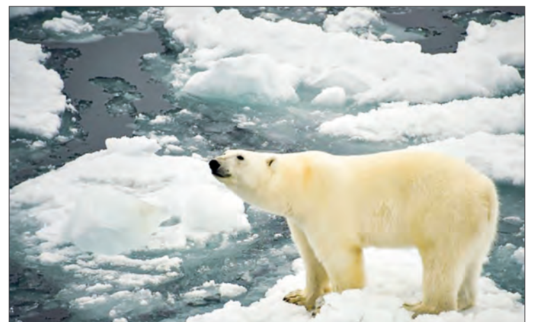
Experts fear Earth is facing an era of mass extinction.

called for a deal on halting biodiversity loss similar to what the