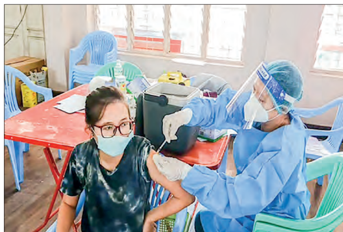
Inoculation is underway in Mon State.

DOCTORS and nurses from public hospitals, Tatmadaw medical corps, healthcare workers and volunteers are working hard to administer COVID-19 vaccines in different states and regions as the vaccination programme is one of the most important activities in the prevention, control and treatment of COVID-19 disease.