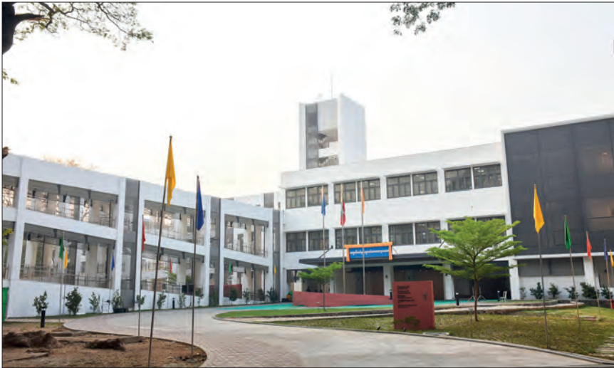
The outside and inside view of the new maternity and newborn babies ward.