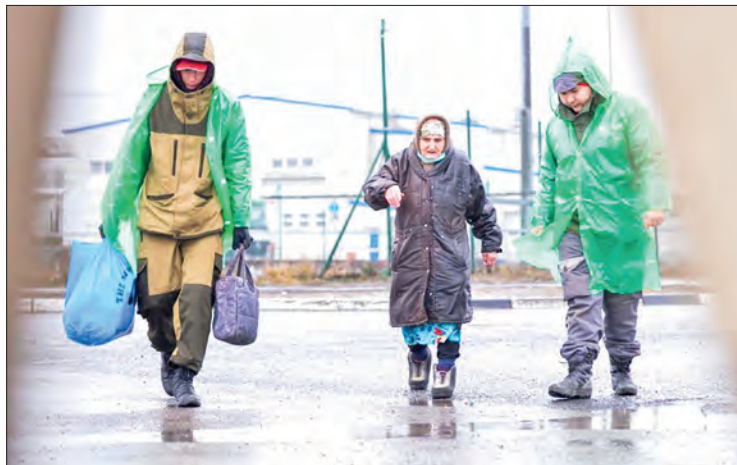
A woman from Donbass arrives at Rostov Region, Russia, on 24 February 2022

Japan will offer the assistance to relevant international organizations including the Office of the UN High Commissioner for Refugees and help fund the activities of Japanese nongovernmental organizations helping Ukraine, the Finance Ministry said. The amount is part of the emergency humanitarian aid worth $100 million that Prime Minister Fumio Kishida pledged last month.