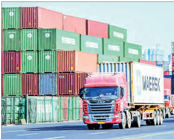
Containers stacked on the dock at Busan, South Korea’s leading port.

Services account balance, which gauges the flow of travel, transport cost and royalty, posted a deficit of 450 million dollars in January, down from a deficit of 930 million dollars a