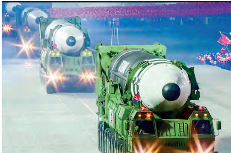
North Korea’s top priority is an intercontinental ballistic missile (ICBM) that can carry multiple warheads – the Hwasong-17, dubbed a “monster missile” and first unveiled at a parade in October 2020.