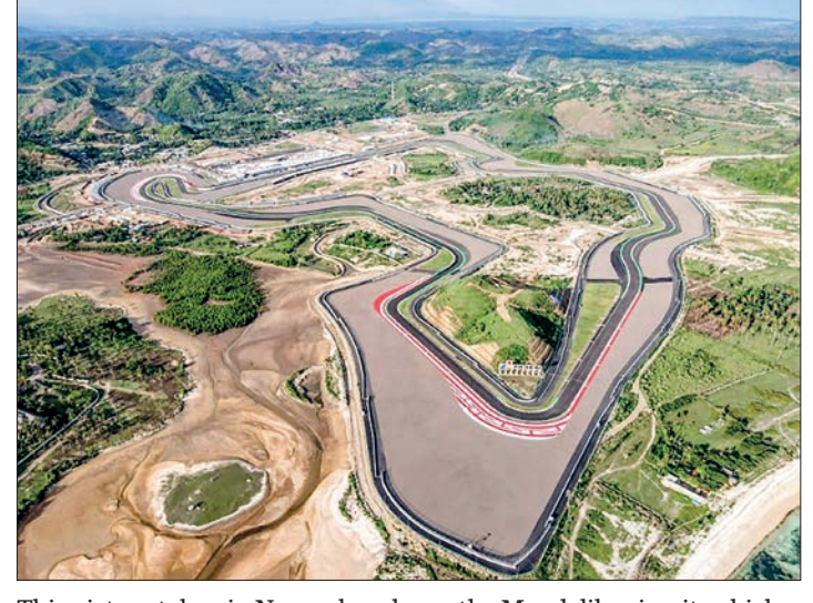
This picture taken in November shows the Mandalika circuit, which will host MotoGP this weekend.

The new 4.3-kilometre (2.7-mile) circuit hugs white-sanded coastline on the island of Lombok, which wants to rival its better-known neighbour, Bali, as a tropical holiday destination. The track complex is part of those ambitions.—AFP ■