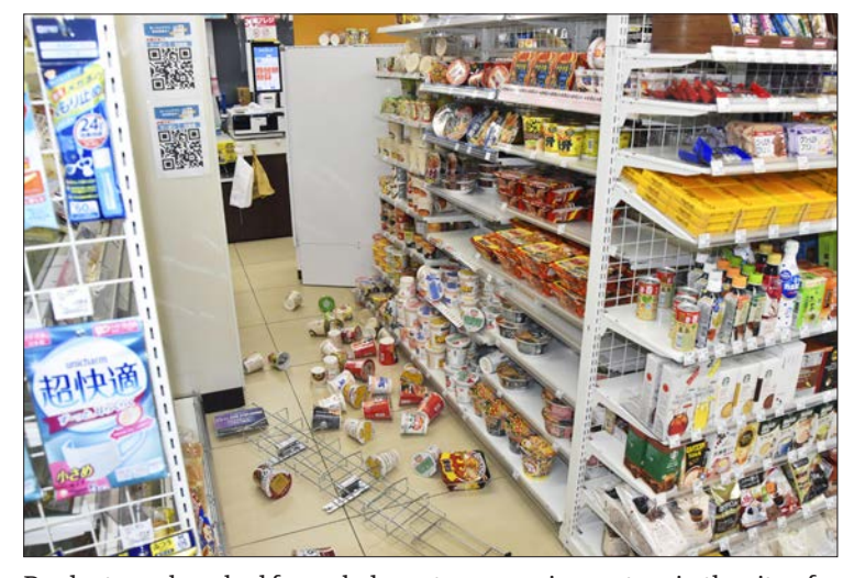
Products are knocked from shelves at a convenience store in the city of Fukushima during a powerful earthquake on 16 March 2022.

many people find it impossible to remain standing or move without crawling. The jolts are strong enough to toss people through the air, according to the agency.