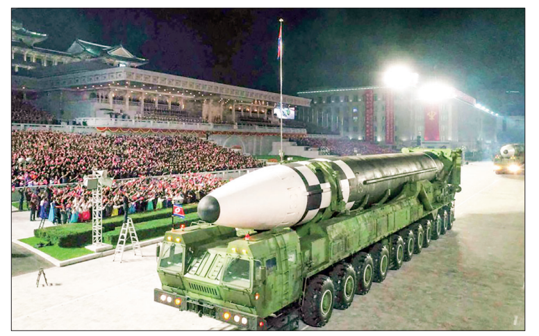
Photo taken on 10 October 2020, shows what appears to be a new type of intercontinental ballistic missile seen at a military parade in Pyongyang.

South Korea believes the projectile, which is presumed to be a ballistic missile, was unable to reach its targeted altitude in its early boost phase, but further investigation is needed to confirm the main reason for the failure, a