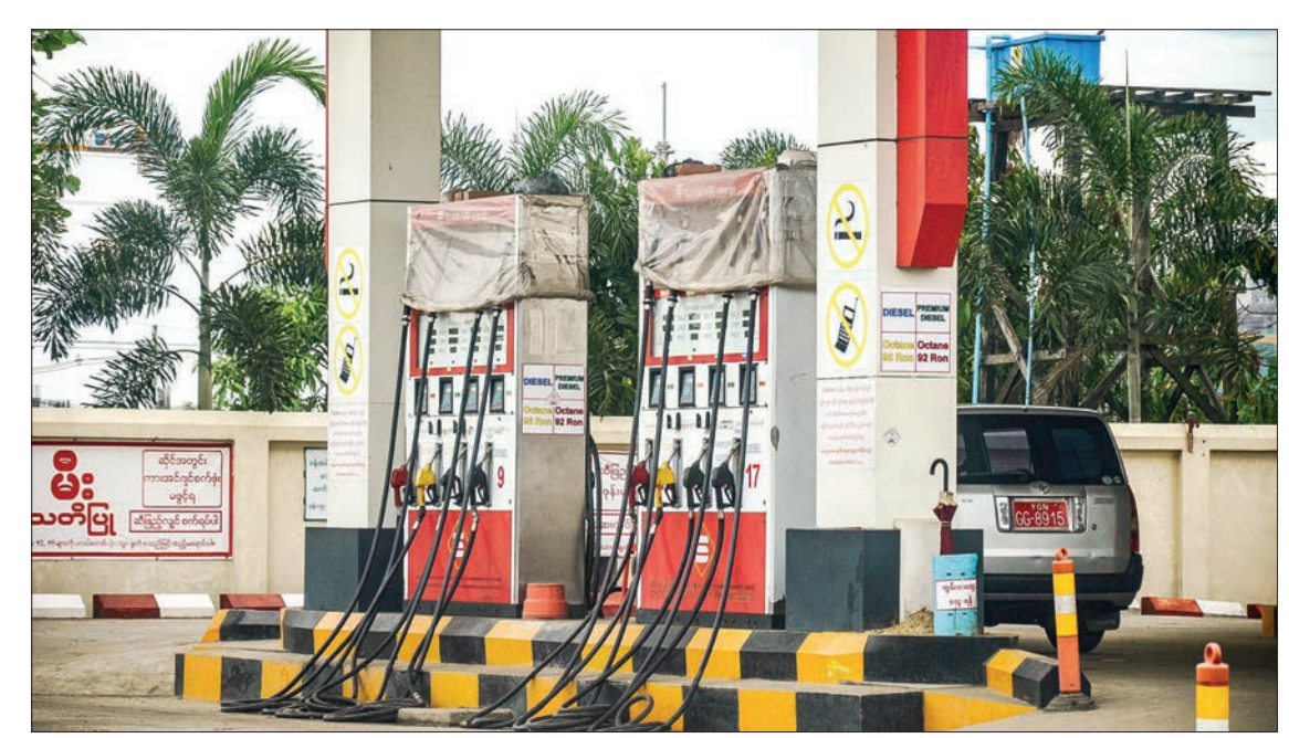
One of the petrol stations in Yangon.

Following the crude oil price rally in the global market and