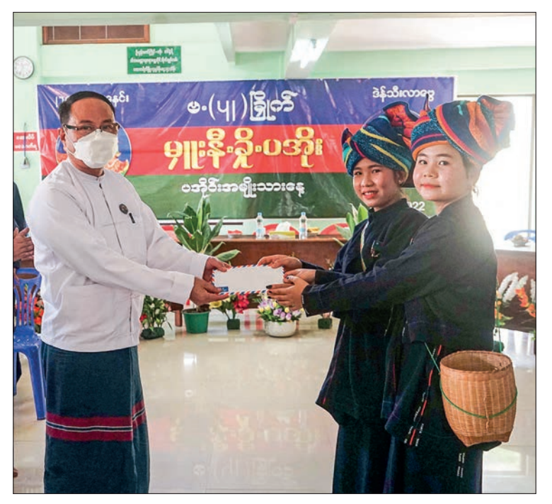
The 42<sup>nd</sup> Pa-O National Day event.

After the celebration, the Kan Khaye Village and Pa-O Cultural Groups and the Mithayoi Village performed traditional Pa-O dances, and the Chief Minister and officials presented cash prizes.