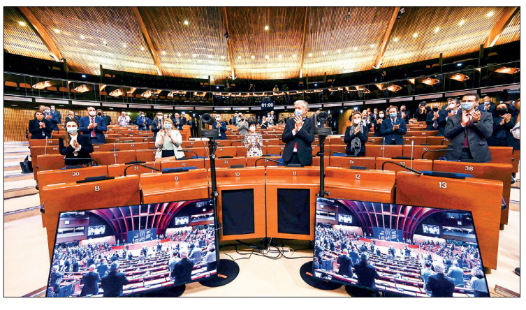
The body's parliamentary assembly was Tuesday also expected to pass a resolution urging the committee of ministers — the COE's main decision making body — to start a procedure to expel Russia.

Nevertheless, Russia reequal interaction with the mem-