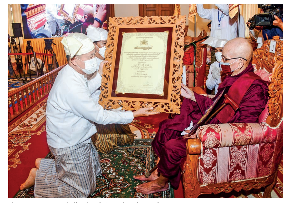
The Vice-Senior General offers the religious title to the Sayadaw.