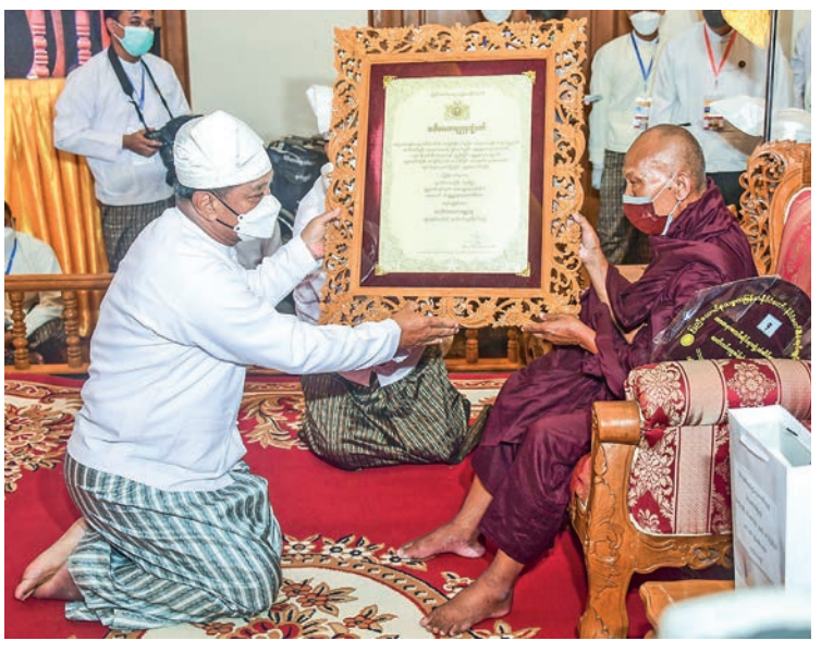
Admiral Tin Aung San offers the religious title to the Sayadaw.