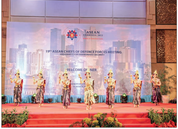
The welcome dinner hosted by the Commander-in-Chief of the Royal Cambodian Armed Forces in progress.

Forces gave a welcome address and the attendees enjoyed the