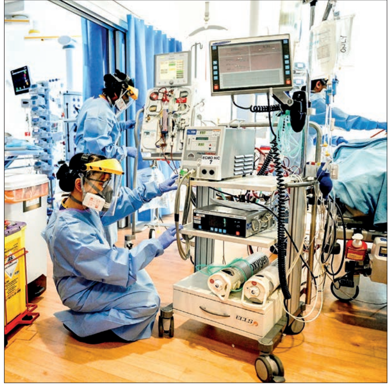
ECMO is a technology that has helped patients with severe respiratory failure, including when that's due to respiratory viruses such as swine flu (H1N1) in 2009 and again now with COVID-19.

membrane oxygenation (ECMO) might experience significant lung recovery and return to normal lives with meaningful long-term