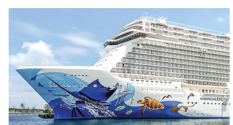
The Norwegian Escape ran aground off the coast of the Dominican Republic.

It can accommodate up to 4,200 passengers and 1,700 crew members.—AFP■