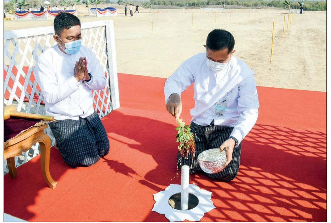
The Vice-Senior General sprinkles the scented water over the stake.

It is also reported that modern equipment will be used to inscribe the verses of the Pitakas on marble stones in Pali scripts and Romanize language, and the Sasana Beikmantaw will also be built with magnificent Myanmar handicrafts. — MNA