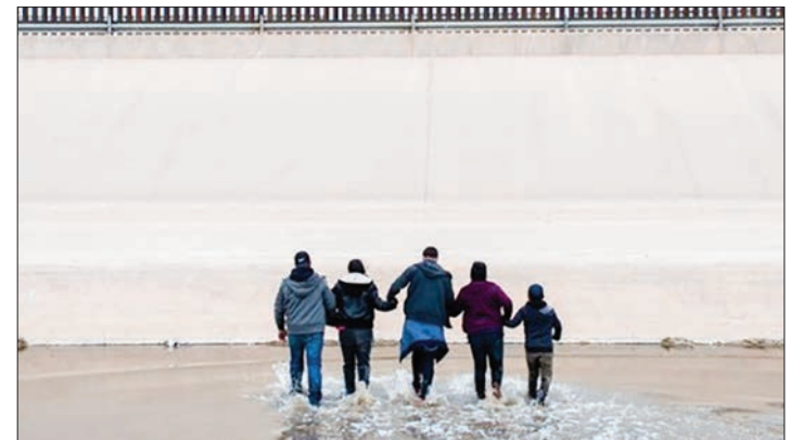
The US government is ending a public health order that has limited asylum at the border, which was introduced after the COVID-19 outbreak in 2020.

THE US government is ending a public health order that has limited asylum at the border, which was introduced after the COVID-19 outbreak in 2020, reported Xinhua.