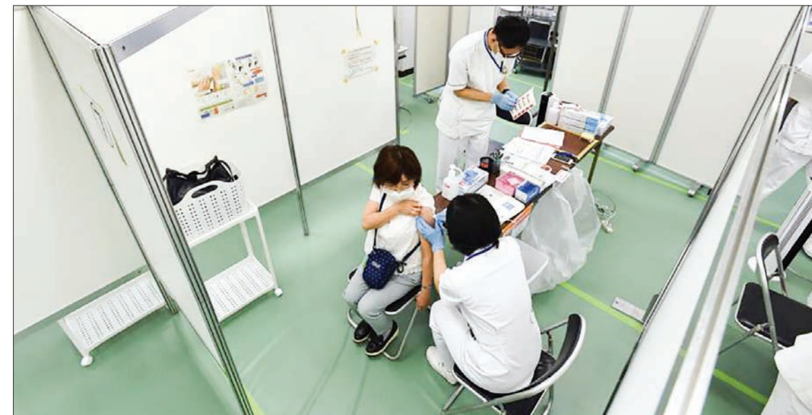
Japan has set an ambitious target of having safe and effective diagnostics, therapeutics, and vaccines ready to deploy within the first 100 days of a future pandemic threat. A senior citizen getting a Covid-19 vaccination shot at a large-scale inoculation centre in Osaka, Japan, on 24 May 2021.