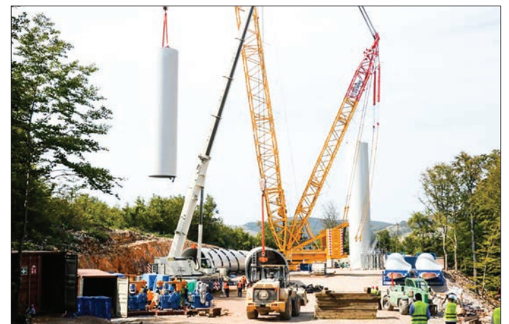
Photo taken on 16 September 2020 shows the lifting operation at the construction site of the Senj Wind Farm project in Senj, Croatia.

OFFSHORE construction of a wind farm is complicated. It is often described as a “moon landing” mission. That is even more so in the Mediterranean, one of the world's busiest waterways.