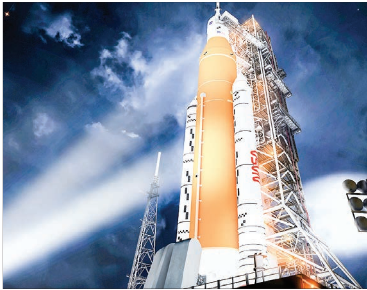
This handout illustration courtesy of Nasa released on 22 October 2020, shows Nasa's new rocket, the Space Launch System (SLS), in its Block 1 crew vehicle configuration that will send astronauts to the Moon on the Artemis missions. PHOTO: NASA/AFP

“The countdown is now underway,” NASA said in its Artemis blog at 5:00 pm Eastern Time (2100 GMT), confirming members of the launch control team had been issued their “call