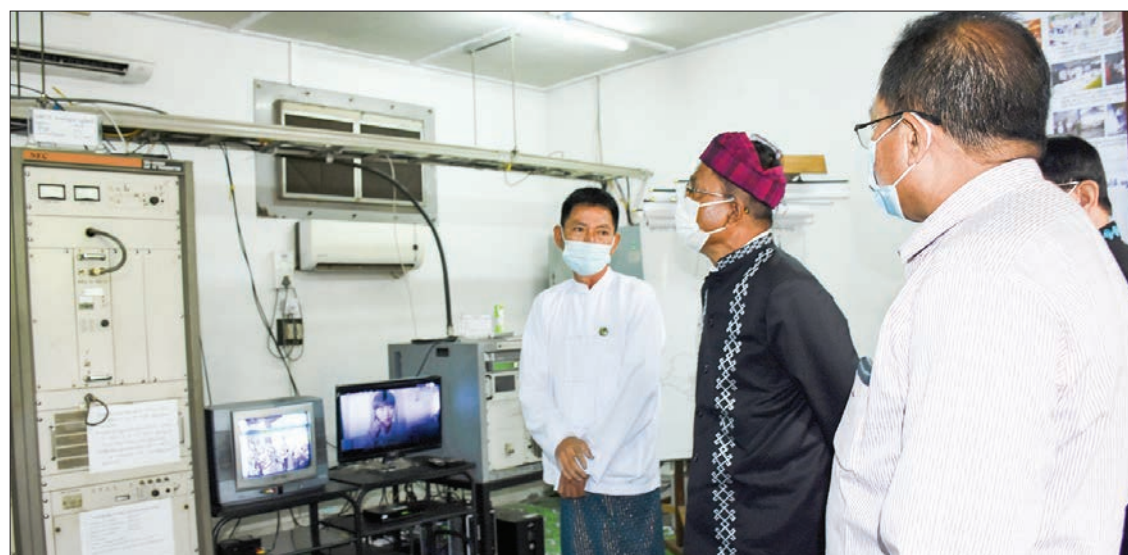
Deputy Information Minister U Ye Tint views machinery at Myitkyina MRTV Retransmission Station on 3 April.

During the meeting, the Deputy Minister urged the staffs to have a clear understanding of the real situation in their country