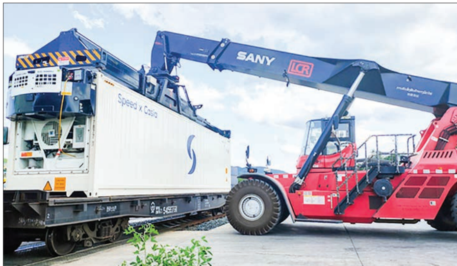
A container of fruits from Thailand is transported from China-Laos Railway cargo train to a truck at Nateuy Station in Luang Namtha province, Laos, 1 April 2022.

that Thai agricultural products have been transported to China by the China-Laos Railway.