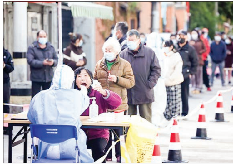
A medical worker takes a swab sample from a woman for nucleic acid test in Changning District of east China's Shanghai, 1 April 2022.

The current outbreak is also testing the patience of the Chinese towards tough restrictions, at a time when much of the world has re-opened. On Sunday, the 1.5 million residents of Baicheng in northeast China joined the ranks of tens of millions of other Chinese who have endured some