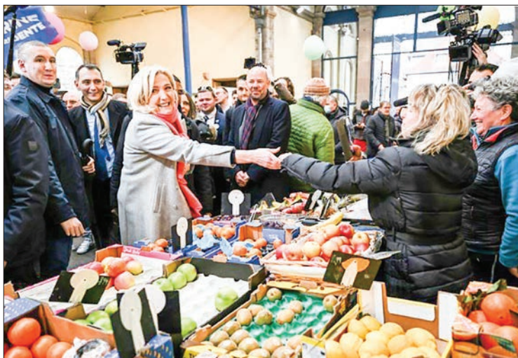
Le Pen lost to Macron in the 2017 polls.

Two new polls published Saturday suggested Macron and Le Pen would finish top in the first round on 10 April with Macron triumphing in the run-off on 24 April by 53-47 per cent. — AFP ■