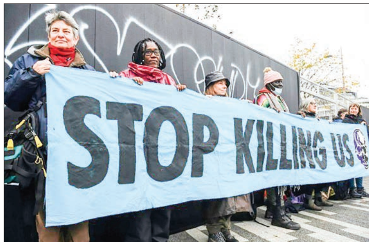
The COP26 climate summit in Glasgow last year saw a score of the group's members arrested.

The world has seen a crescendo of deadly extreme weather amplified by rising temperatures — heatwaves, wildfires, flooding, storms engorged by rising seas — and a torrent of recent climate science projects worse to come. Much of that research is distilled in periodic reports from the UN's Intergovernmental Panel On Climate Change (IPCC). — AFP ■