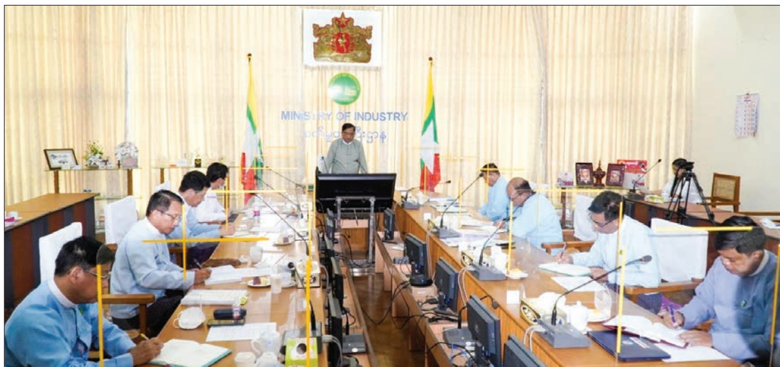
Union Industry Minister Dr Charlie Than attends the meeting to discuss implementation of projects in 2021-22 financial year on 2 April.

THE Ministry of Industry held a meeting to discuss the implementation of iron and steel mills in the 2021-2022 mini budget year