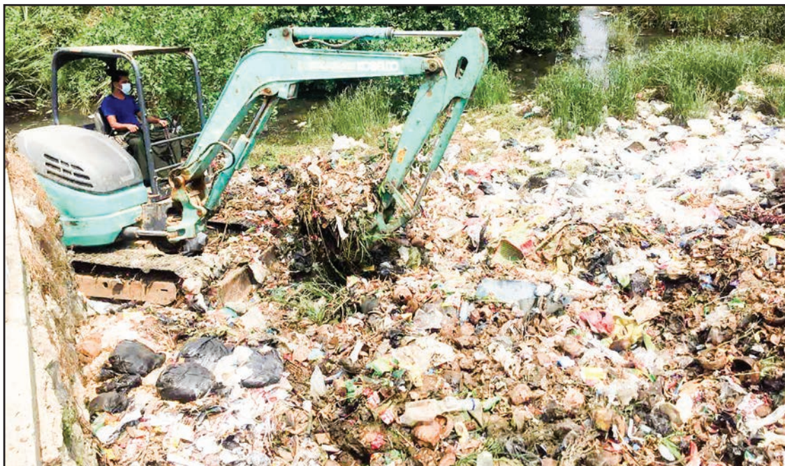
Heavy machinery is being used in waste clean-up campaign at MraukU Ancient Cultural Heritage Zone in Rakhine State on 2 April.