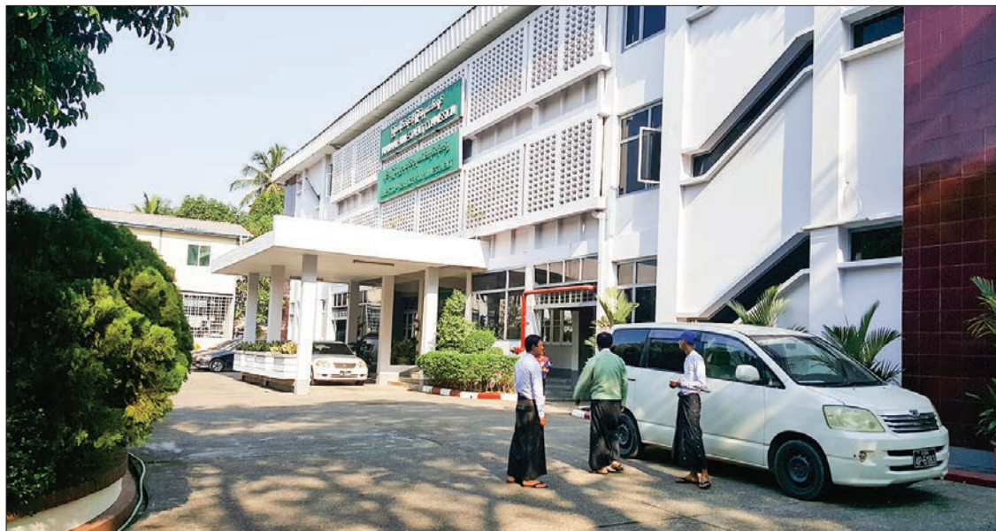
The photo shows building of Directorate of Investment and Company Administration in Yangon.

A total of 3,200 companies has been struck off the register as of 25 March 2022 since July 2021 as they failed to submit annual return (AR) on the online registry system, MyCO, according to the Directorate of Investment and Company Administration (DICA).