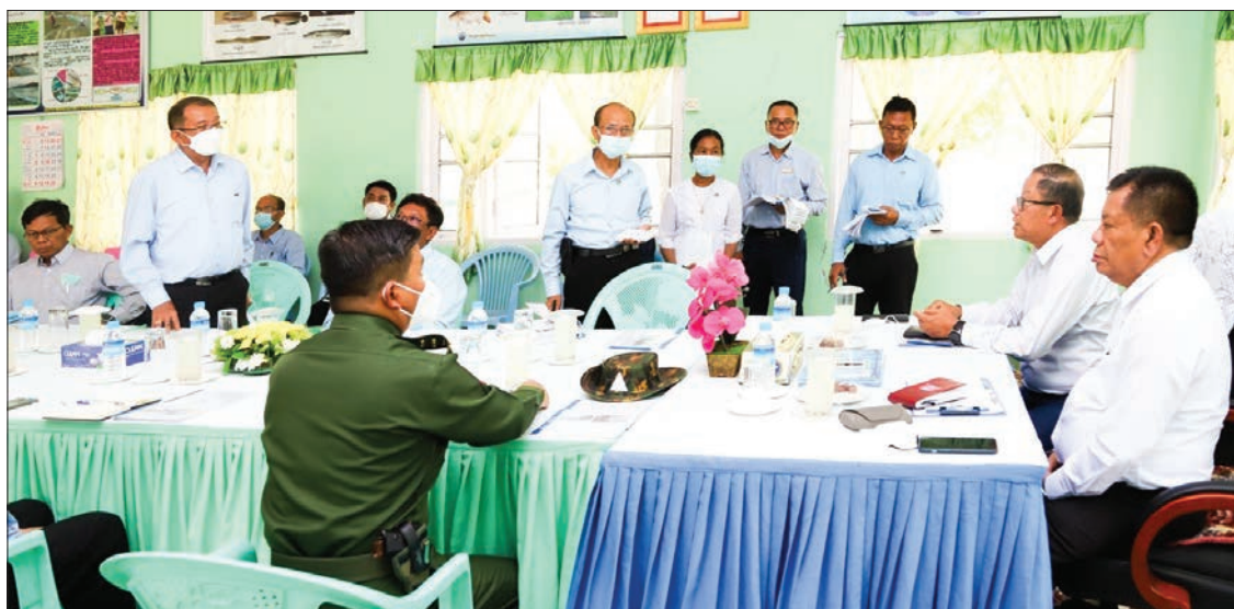
Union Minister for MoALI U Tin Htut Oo instructs officials to encouragement of turning out skilled human resources in Meiktila on 2 April.

UNION Minister for Agriculture, Livestock and Irrigation U Tin Htut Oo made a tour of inspection in Mandalay Region on 2 April.