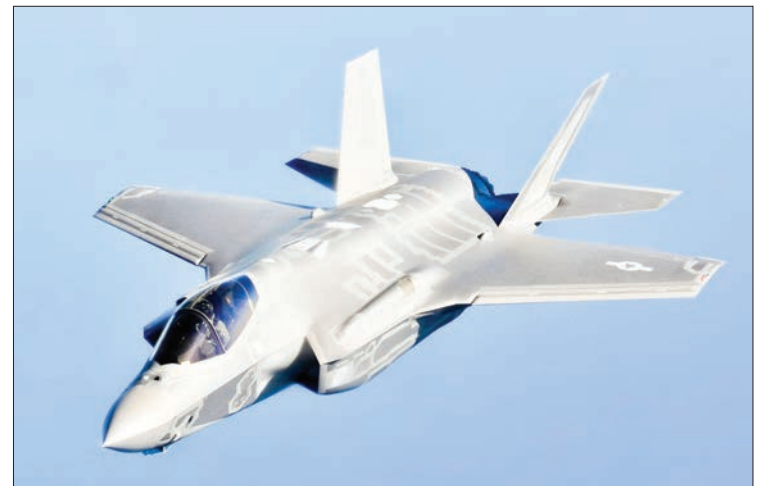
A Lockheed Martin F-35 aircraft.

"We are exploring options to more quickly replenish US inventories and backfill depleted stocks of allies and partners," the spokesman said.