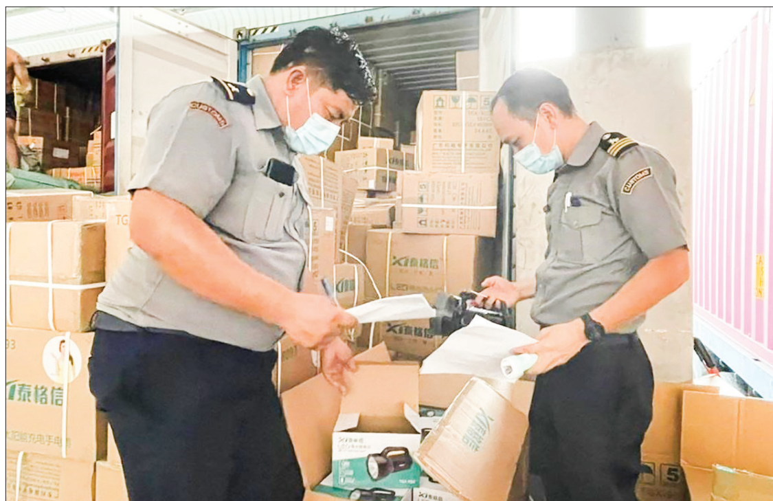
Customs officials check seized items.

Thus, a total of 10 arrests (approximately K160,934,900) were made, according to the Anti-Illegal Trade Steering Committee.—MNA