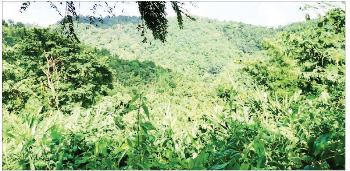
A scenic beauty with flora and fauna is seen in Nancho protected public forest in Pyinmana Township.

Natural Resources and Environmental Conservation