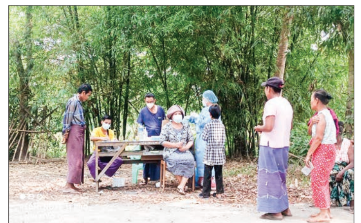
Health officials vaccinate local people above 18 in Twantay on 3 April.

People aged 18 years and older who have not been vaccinated received the vaccines in Takahle Village, Shantalin Village and Kayinchaung Village in order to control the incidence of COVID-19 disease and Omicron virus in the area.—Twantay Thar/GNLM