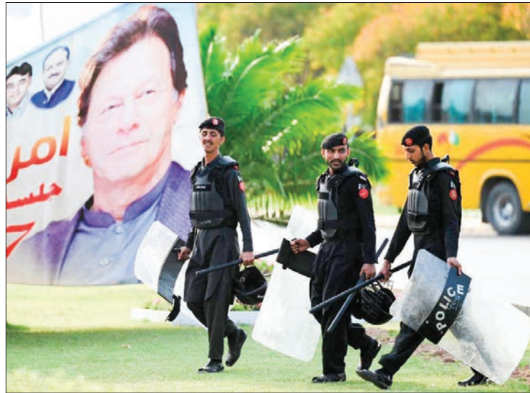
Security personnel walk past a banner featuring an image of Pakistan's Prime Minister Imran Khan near Parliament House building in Islamabad.

PAKISTAN Prime Minister Imran Khan looked likely to be booted out of office later Sunday as parliament gathered to vote on a no-confidence motion following weeks of political turmoil.