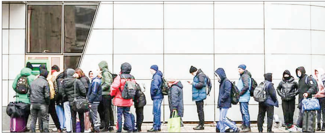
Ukraine People line up to withdraw money at a cash dispenser in Kyiv in the morning of 24 February 2022.

CHINA is calling for a de-escalation of tensions between Russia and Ukraine to minimize losses, Gao Zhikai, vice president of the Centre for China and Globalization, a Beijing-based non-governmental think tank, has said. “China has been very consistent in its position. China is calling for the de-escalation of the conflict and bringing it to an end as soon as possible through negotiation, with the aim of minimizing civilian losses,” Gao told Xinhua in an interview last week. In early March, Chinese