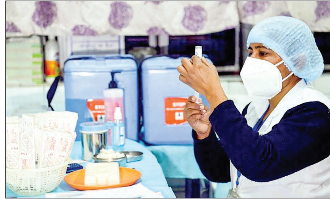
Hyderabad-based Bharat Biotech on Sunday issued a clarification that there is "no impact on efficacy and safety of the COVID-19 vaccine COVAXIN" after the World Health Organisation suspended it from its Covax facility.

For continuation of vaccination with alternative sources of COVID19 vaccines countries should refer to the respective SAGE recommendation," it read. On inspection by WHO, Bharat biotech said, "During the re-