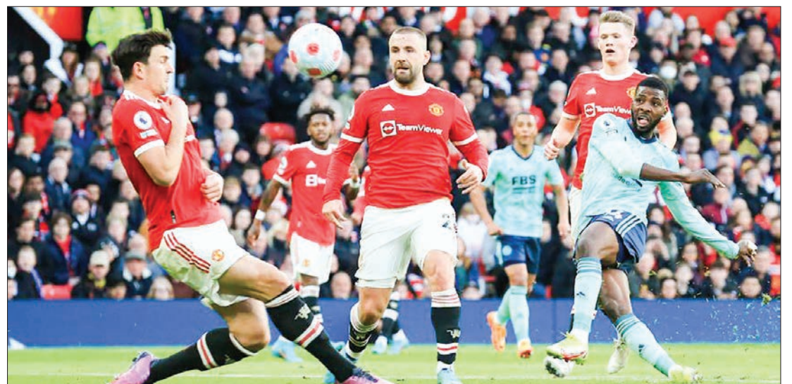
Manchester United dropped more valuable points as they drew 1-1 at home to Leicester on Saturday, slipping further off the pace in the battle to secure Champions League football for next season.

MANCHESTER United dropped more valuable points as they drew 1-1 at home to Leicester on Saturday, slipping further off the pace in the battle to secure Champions League football for next season.