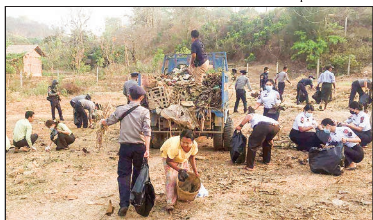
Departmental personnel participate in waste clean-up campaign in MraukU area on 2 April.

world heritage nomination will be discussed at the nearest session of World Heritage Committee in June 2023, and is an important part of the management process included in the nomination dossier for the MraukU Ancient Cultural Heritage Site to be inscribed on the World Heritage List.