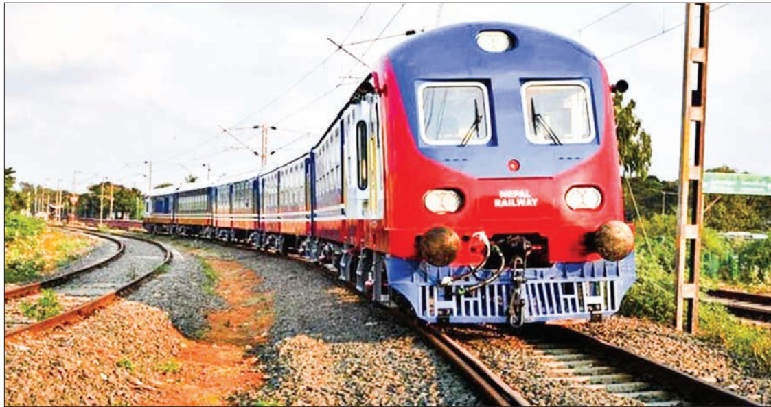
Indian Prime Minister Narendra Modi and Nepal's Prime Minister Sher Bahadur Deuba inaugurated a cross-border railway between Jaynagar (India) and Kurtha (Nepal) to improve ties between the two nations.