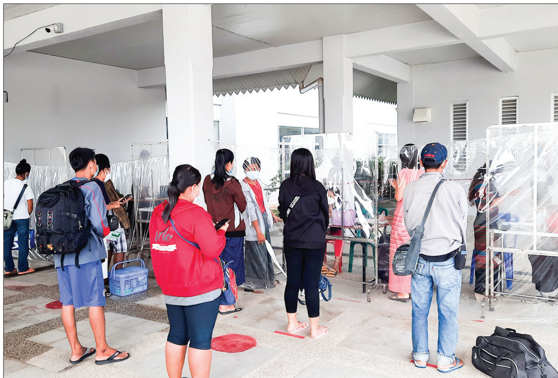
Myanmar returnees are seen in a queue at border point of Myawady to enter Myanmar on 2 April.

MYANMAR citizens from Thailand who came back through the Myanmar-Thailand Friendship Bridge 2 in Myawady are welcomed back starting from 1 August 2021. A total of 314 Myanmar nationals from Thailand—226 men and 88 women—arrived back home through Myawady, Kayin State on 2 April.