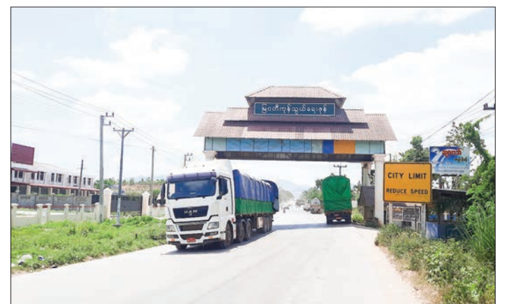
Cargo truck is heading to Myawady Border Trade Centre.

Myanmar primarily exports corn, natural gas, fishery products, coal, tin concentrate (SN 71.58 per cent), coconut (fresh and dry), beans, and bamboo shoots to Thailand. It imports capital goods such as machinery, raw industrial goods such as cement and fertilizers, consumer goods such as cosmetics and food products from the neighboring country.—KK/GNLM