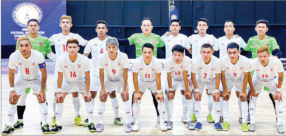
Myanmar national futsal team poses for a group photo at an international tournament.