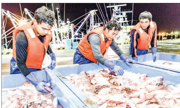
Ishinomaki Fish Market is the largest fish market in Japan, acting as a conduit for the Minami-sanriku coastal region.

JAPAN cannot avoid crafting a supplementary budget for fiscal 2022 as part of measures to mit-