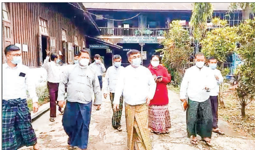
Union Minister for Education Dr Nyunt Pe views round Myitkyina Education Degree College on 3 April.

He also inspected No. 11 Basic Education Primary School, No. 5 BEHS, No. 7 BEMS, No. 3 BEHS, and No. 8 BEHS, and fulfilled the needs.—MNA