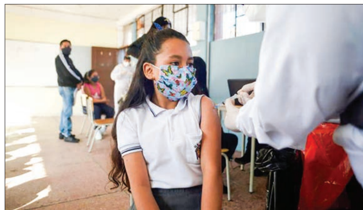
A health worker inoculates a child with the Covid-19 vaccine in Quito, Ecuador, on 18 October 2021.

Garzon's epidemiological report showed that in the last weeks the number of infections