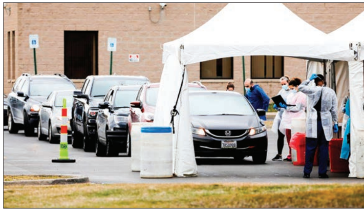
People were tested for coronavirus in Dearborn, Michigan. Early data from the state show that Black people represent 40 per cent of coronavirus-related deaths, though they represent only 14 per cent of the population.

RACIAL and ethnic disparities in COVID-19 infections, hospitalizations and deaths are likely to worsen if the US Congress does not approve billions in new pandemic funding soon, major news