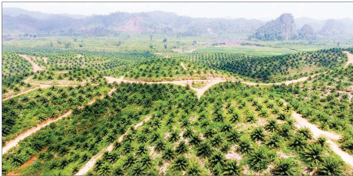
An aerial view catches thriving oil palm plants in Taninthayi Region.

“The mills in Myeik area has capacity limit and cannot mill all