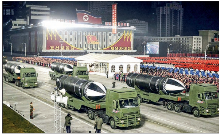
A military parade is held in Pyongyang on 14 Jan 2021.

THE sister of North Korean leader Kim Jong Un has threatened to use nuclear weapons against South Korea if Seoul opts for a military confrontation with Pyongyang, the North's official media reported Tuesday.