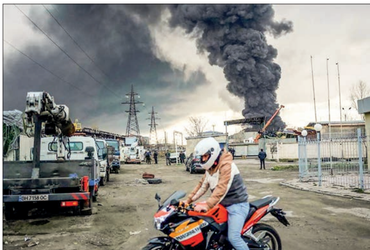
Smoke rises after an attack in Odessa.

The exceptional move by Japan of using a government plane to airlift foreign evacuees comes as people fleeing Ukraine face skyrocketing airfares since Russia's invasion of their homeland