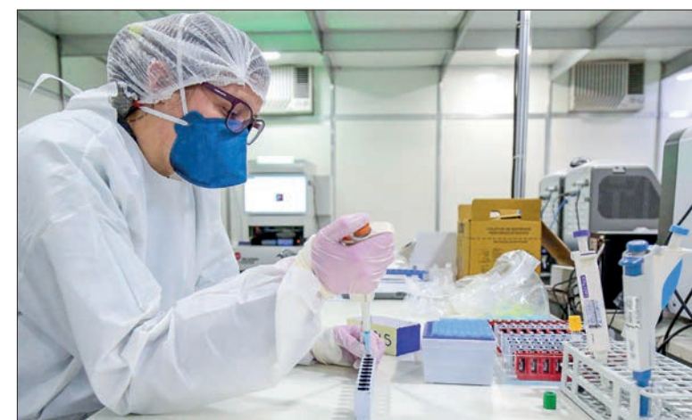
A health worker works with blood samples of COVID-19-infected patients in Sao Paulo on 1 July 2021.

RESEARCHERS have found that subjects infected with the SARS-CoV-2 virus displayed signs of severe brain inflammation and injury consistent with a reduction in blood or oxygen flow into the brain, neuron damage and small areas of bleeding. Researchers at Tulane University have explained how COVID-19 affects the central nervous system of human beings. The findings are the first comprehensive assessment of neuropathology associated with SARS-CoV-2 infection in a nonhuman primate