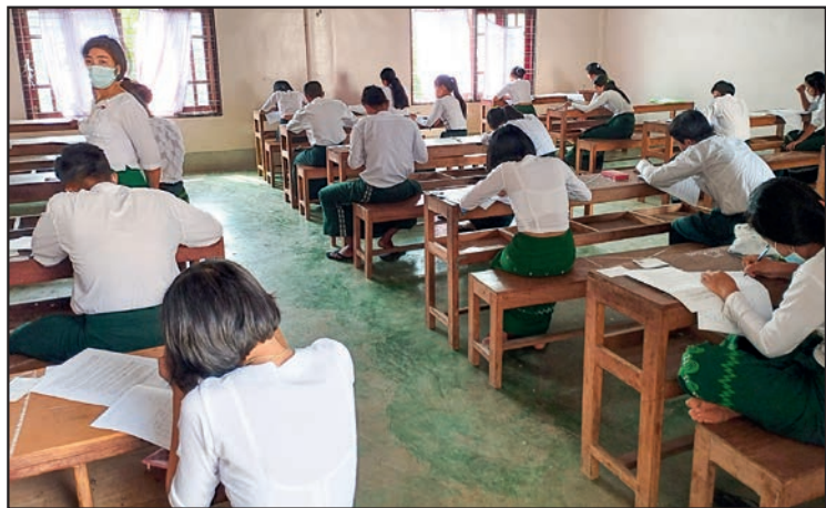
Maei Town, Taungup Township, Rakhine State

THE fifth day of the 2022 matriculation exam was held yesterday morning, with 227,682 students taking the examination for the physics subject nationwide.