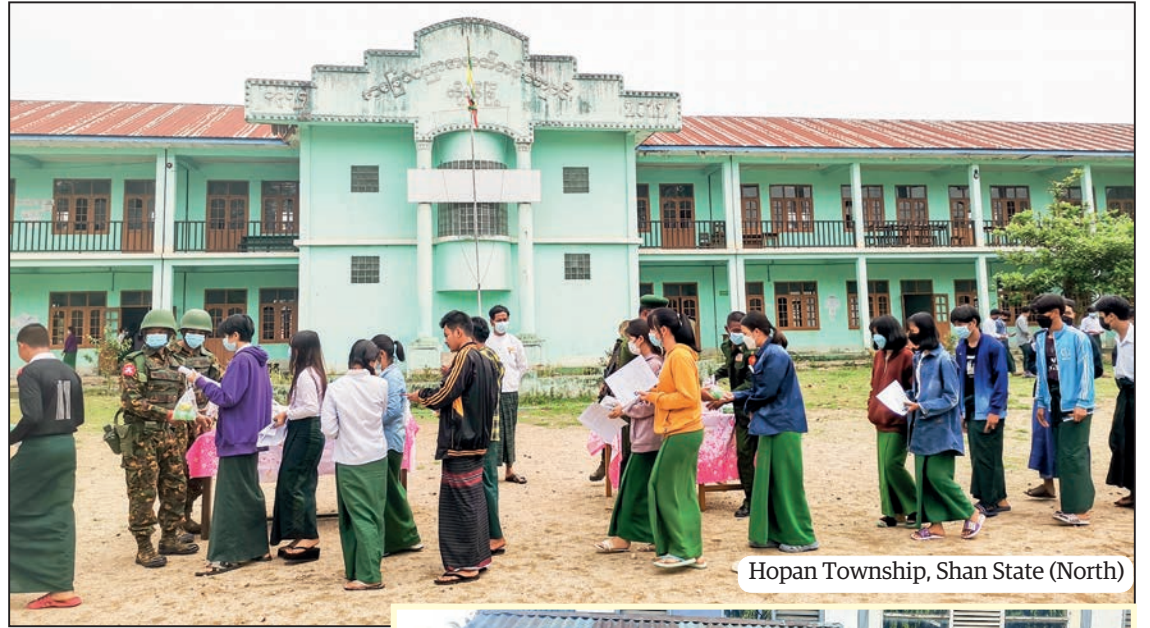
Hopan Township, Shan State (North)