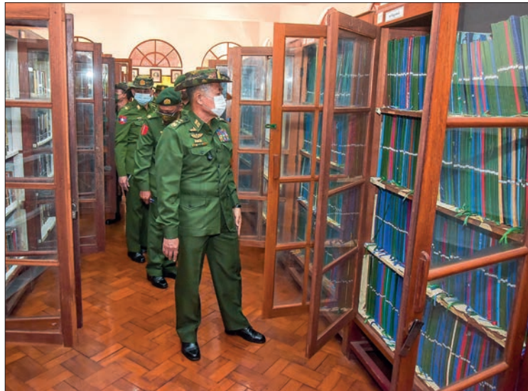
The Vice-Senior General views the Library.

they all must pursue the training lessons to have the skills for professionally applying the experiences in discharging the duties in the measures of the State. If so, they will have the skills to protect the life and property of the people safely. On the other hand, it is necessary to emphasize administrative and welfare measures for the sub-