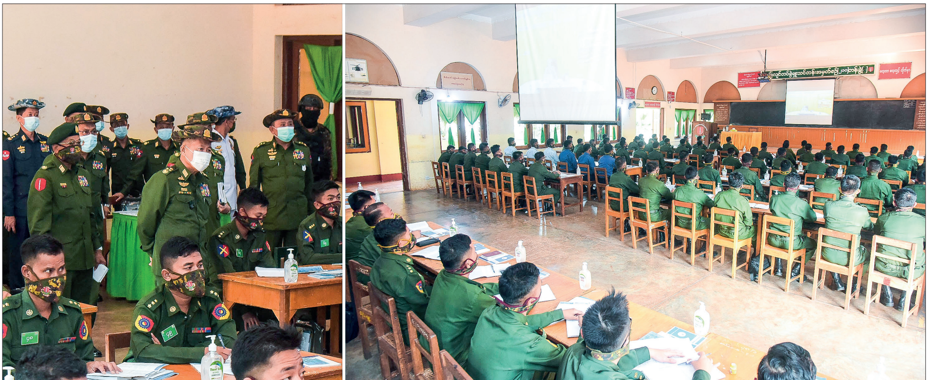
State Administration Council Vice-Chairman Deputy Commander-in-Chief of Defence Services Commander-in-Chief (Army) Vice-Senior General Soe Win inspects the Defence Services (Army) Combat Forces School in Bahtoo on 5 April 2022.

VICE-CHAIRMAN of the State Administration Council Deputy Commander-in-Chief of Defence Services Commander-in-Chief (Army) Vice-Senior General Soe Win inspected the Defence Services (Army) Combat Forces School (Bahtoo) yesterday morning.