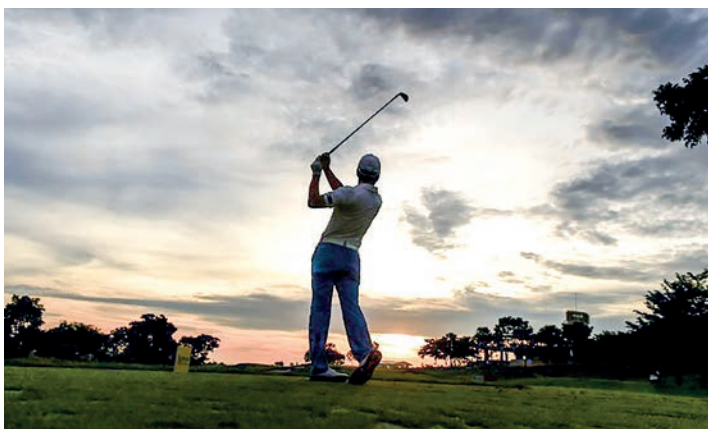
The Asian Mixed Cup takes place at Siam Country Club in Pattaya.

GOLF'S inaugural Asian Mixed Cup begins in Thailand this week with a host of international male and female hotshots on the same scorecard.