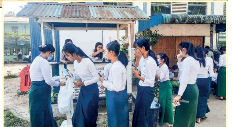
Myawady Township, Kayin State,

This year, 20 foreign examination centres and 1,232 local examination centres were opened in the country,