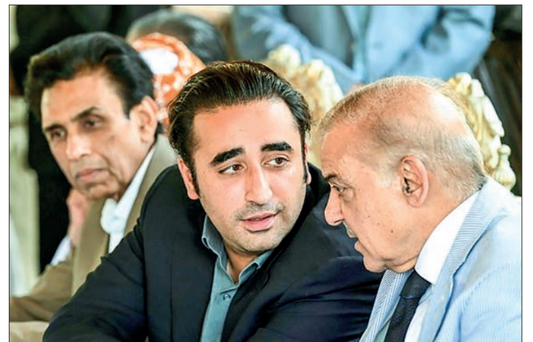
Bilawal Bhutto Zardari (left) chats to fellow opposition leader Shehbaz Sharif in Islamabad.

The move allowed Khan to get the presidency — a largely ceremonial role taken by a loyalist — to dissolve parliament and order an election, which must be held within 90 days. Had the vote taken place, Khan was certain to have been booted from office.