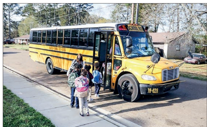
Children leave Wilkins Elementary school in Jackson, Mississippi, to use the bathroom at a neighbouring school because theirs lacks the water pressure needed to flush the toilets.

"The distribution lines are aging, and a master plan for pipe replacement... is not being implemented," the US Environmental Protection Agency (EPA) wrote in a 2020 report.—AFP ■