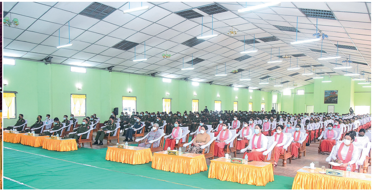
State Administration Council Vice-Chairman Deputy Commander-in-Chief of Defence Services Commander-in-Chief (Army) Vice-Senior General Soe Win meets the training instructors, officers, other ranks and family members at the Bahtoo Station yesterday.

THE defence strategy of the State is the people's militia strategy with all-inclusive of the entire people centring the Tatmadaw, so they all need to live in the harmonization of the people, said Vice-Chairman of the State Administration Council Deputy Commander-in-Chief of Defence Services Commander-in-Chief (Army) Vice-Senior General Soe Win in meeting with training instructors, officers, other ranks