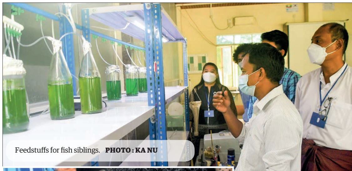
Feedstuffs for fish siblings.