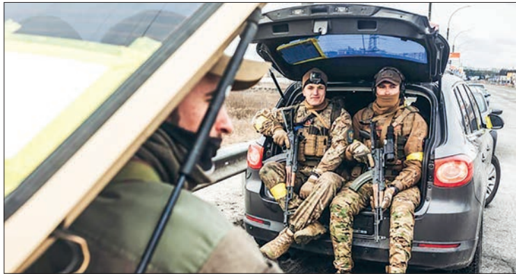
Ukrainian soldiers rest on a car in Irpin, Ukraine, on 4 March 2022.

"We know who gives such 'advice' to our Ukrainian neighbours. This is done with useless goals that have nothing to do with