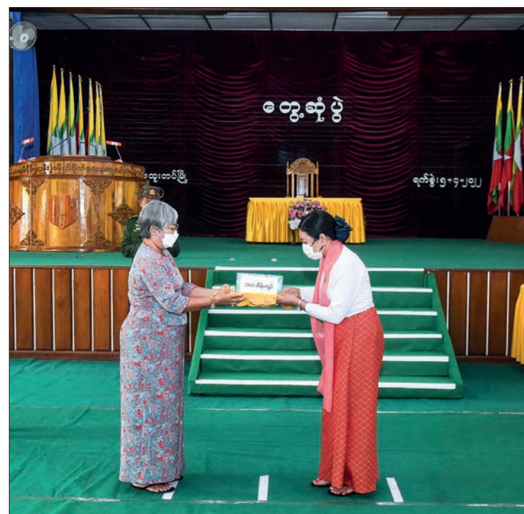
The wife of the Vice-Senior General gives cash assistance.