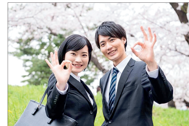
Image of new employees who joined companies on 1 April

It can be said that the time when companies with 300 or fewer employees have the same ratio of job-offers-to-applicants as a large company is just the time when Japan's economic power has improved in earnest. When will it come?