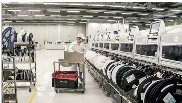
An employee works at an auto parts company in Anting Township of Jiading District, east China’s Shanghai, 26 March 2022. Local enterprises have been maintaining stable production under strict COVID-19 prevention and control measures.

SHANGHAI on Monday finished the basic collection of samples for nucleic acid testing from its nearly 25 million residents in the city’s latest effort to cut off transmission in communities and contain the latest COVID-19