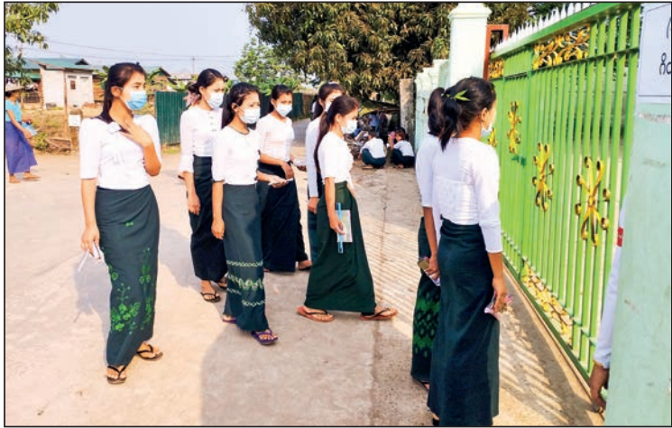
Maei Town, Taungup Township, Rakhine State