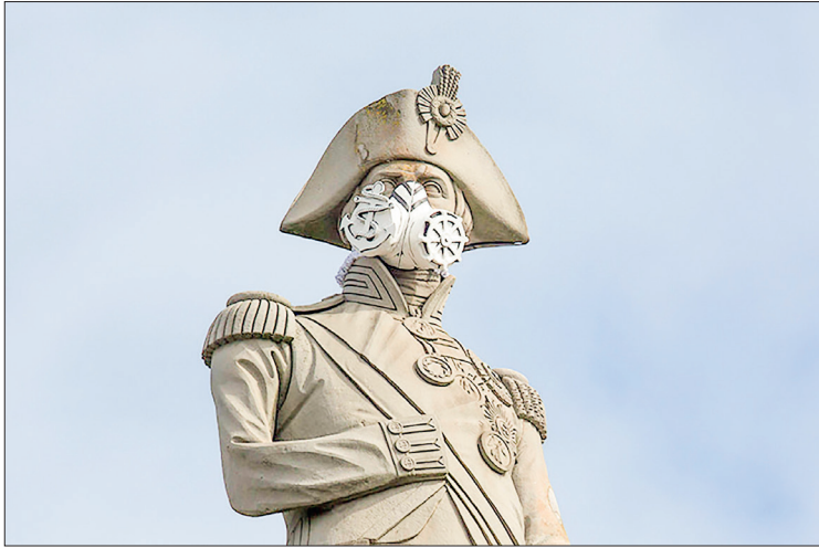
A nautical themed breathing mask is fixed to Lord Nelson's statue at the top of Nelson's Column in Trafalgar Square, central London on 18 April 2016. The stunt was part of a series that were carried out across the capital by Environmental protest group Greenpeace by adding masks to famous statues, to highlight air pollution in the capital

A full 99 per cent of people on Earth breathe air containing too many pollutants, the World Health Organization said Monday, blaming poor air quality for millions of deaths each year.