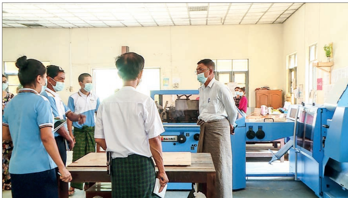
The MoI deputy minister meets the IPRD staff.

and checked the Sub-Printing House in Myitkyina Township on 4 April morning.