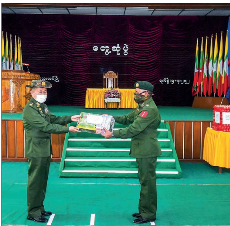
The Vice-Senior General presents foodstuffs.