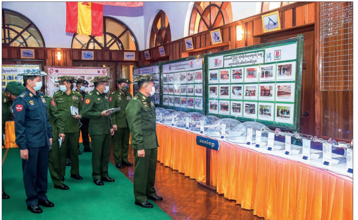
The Vice-Senior General look into the historical record photos of the Combat Forces School.

ordinates and families to serve the assigned duties conveniently. They all have to build mutual trust and understanding to supervise associates with goodwill.