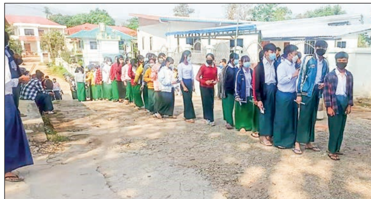
Kengtung Township, Shan State (East)

totalling 1,252 examination centres, with 252,441 students registered to sit the exam.