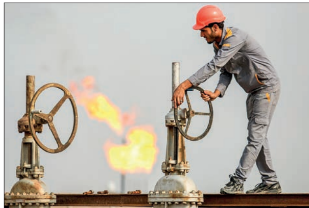
Due to the impact of sanctions on its exports, Iran is exempt from the existing deal between the Organization of the Petroleum Exporting Countries and allies, known as OPEC+, to limit oil supply.

by state news agency IRNA on Sunday. Iran is currently engaged in negotiations to restore the 2015 nuclear deal that would grant it much-needed sanctions relief, restoring Iranian oil exports, in return for major curbs on its nuclear programme. The US, under then president Donald Trump, unilaterally withdrew from the deal in 2018 and reimposed stringent