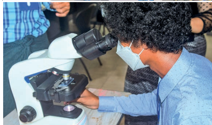
Microscopic check on the disease of fish/ shrimps.

THE Myanmar Fisheries Federation, the Aqua Myanmar and Fish/Shrimp Diagnostic Laboratory have taught the farmers the basics of fish/shrimp disease diagnosis and treatment for four days at the Myanmar Fisheries Federation in Yangon. The certificates of achievements were awarded yesterday evening.