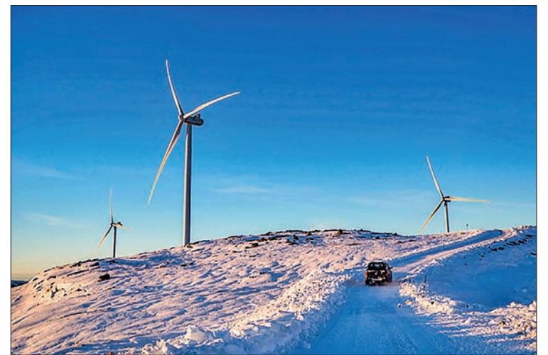
A car drives past wind turbines of the Storheia wind farm, one of Europe's largest land-based wind parks, in Afjord municipality, Norway.

Here are five key findings from the three reports: