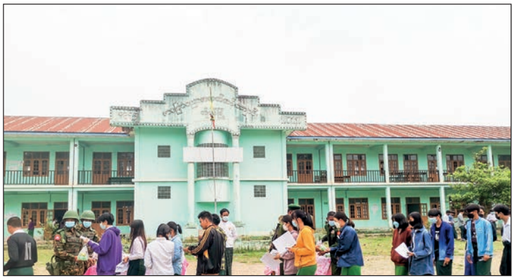
Katha Township, Sagaing Region