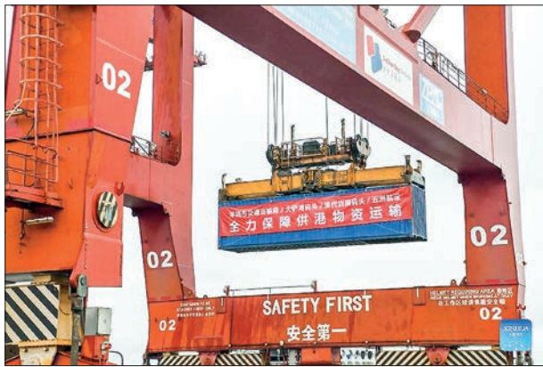
A container carrying supplies for Hong Kong is loaded onto a ship at Dachanwan wharf of Shenzhen port, south China’s Guangdong Province, 21 Feb 2022.

“Shocks emanating from the war in Ukraine and the sanctions on Russia are disrupting the supply of commodities, increasing financial stress, and dampening global growth,” said the World Bank’s newly released East Asia and Pacific Economic Update. “Just as the economies of East Asia and the Pacific were recovering from the pandemic-induced shock, the war in Ukraine is weighing on growth momentum,”