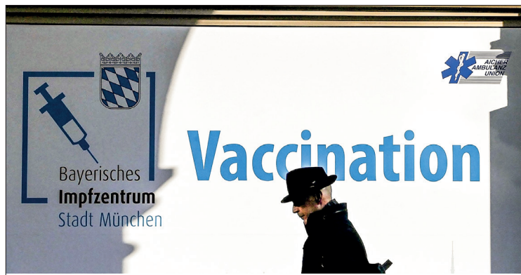
A man walks in front of a vaccination center in the city of Munich, southern Germany.

As a proposal to introduce mandatory jabs for over-18s was unlikely to win a majority in parliament, the government committee working on the plan has scaled down its ambitions to look at compulsory vaccinations for over-50s.—AFP ■