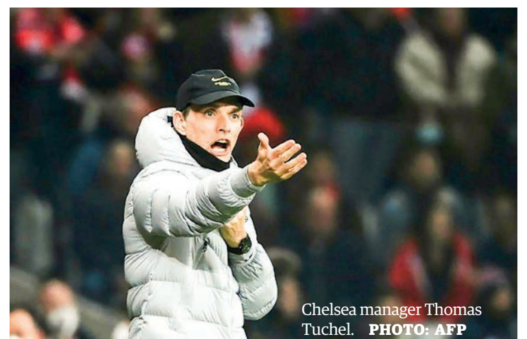
Chelsea manager Thomas Tuchel.

It was a winning streak that underlined Tuchel's best qualities as he deflected any pressure away from his players with intelligent, empathetic responses to questions about the war in Ukraine and the unintended consequences for Chelsea.—AFP ■