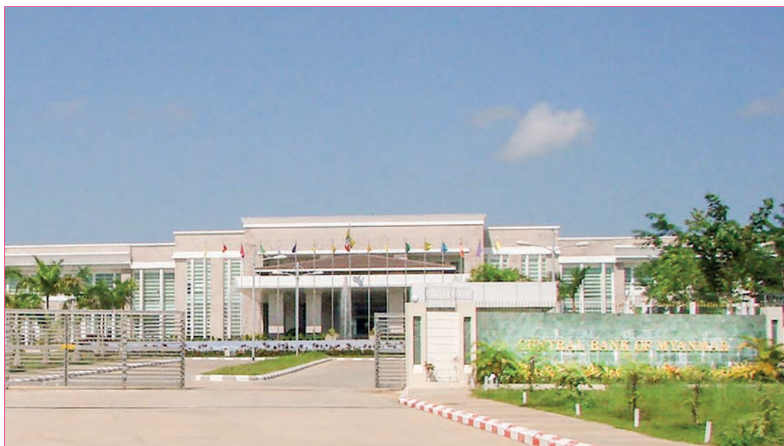
Central Bank of Myanmar (CBM).

According to the provisions stipulated in Sections 11, 12 and 13 of the Foreign Exchange Management Law, all the foreign currency earned by locals have to be exchanged for local currency at the CBM's reference rate of K1,850 by opening the accounts at the authorized dealers in the country within one working day, according to the notification released on 3 April.