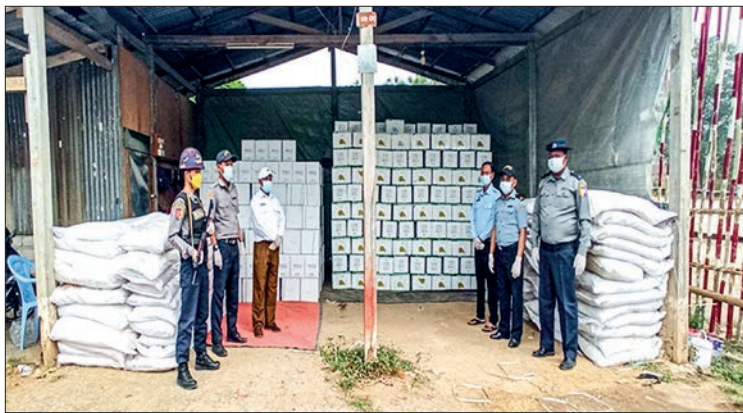
Officials confiscate illegal commodities.

MANAGED by the Anti-Illegal Trade Steering Committee, action is being taken against illegal trades under the law.