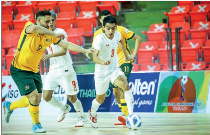
Myanmar players (white) put pressure on the Australian Team (yellow) during their group match of the 2022 ASEAN Futsal Championship in Bangkok, Thailand, on 5 April 2022.

The last goal was an own goal scored by an Australian player. In Group B, Myanmar and Viet Nam have earned