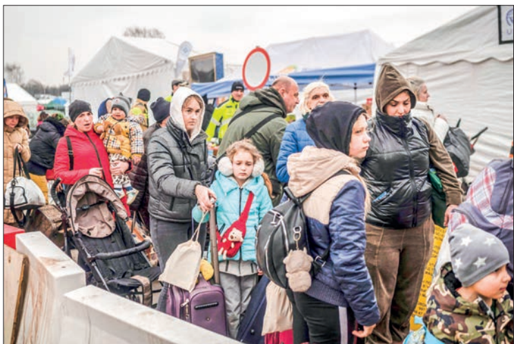
Ukrainian evacuees queue as they wait for further transport at the Medyka border crossing, after they crossed the Ukrainian-Polish border, in southeastern Poland, on 29 March.

CANADIAN Minister of National Defence Anita Anand announced Thursday that up to 150 Canadian Armed Forces (CAF) personnel could deploy to Poland on a humanitarian mission to support Ukrainian refugees, reported Xinhua.