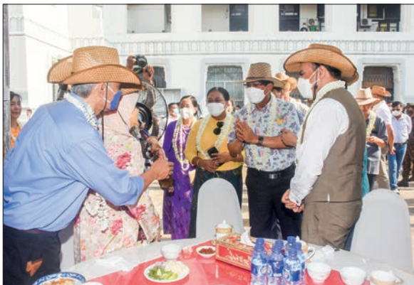
Families of foreign missions and embassies in Yangon.

the Akyat day of the Thingyan festival.