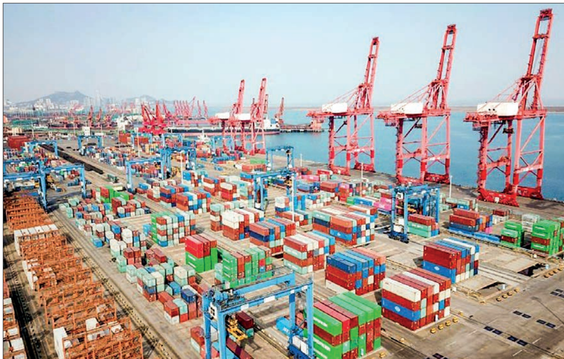
The economic costs of China's strict zero-Covid strategy have mounted.

Imports dropped 0.1 percent from a year ago, according to data from China's Customs Administration—the first such decline since August 2020, in the early phase of the pandemic. The figure was much lower than the forecast from a Bloomberg poll of economists,