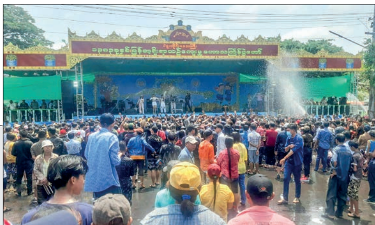
Myanmar traditional Thingyan festival goes into the third day in Bago Region.

dals till the fourth day of the festival tomorrow, it is reported. — Ko Tut (IPRD)/GNLM