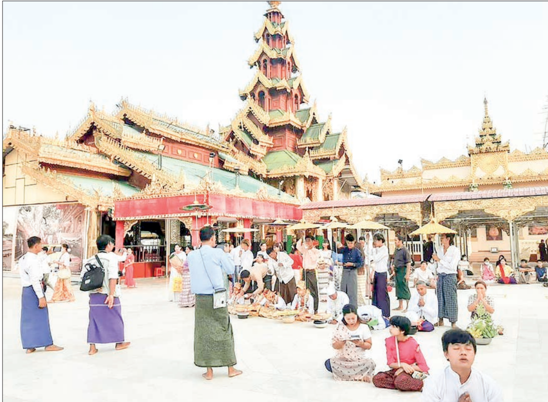
On the precinct of the Shwedagon Pagoda.

PILGRIMS peacefully visited the Shwedagon Pagoda on the Akyat day of the 1383 ME Thingyan festival.