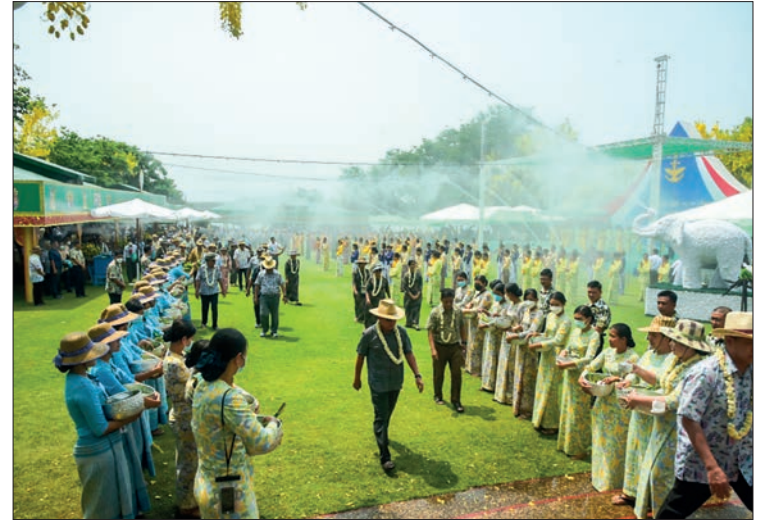
The Vice-Senior General goes around the Thingyan pandals in Nay Pyi Taw.