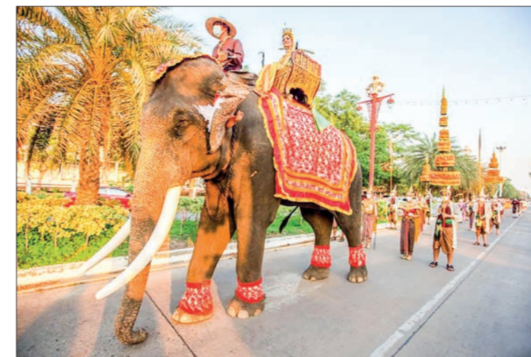
Performers participate in a street parade celebrating the Songkran Festival in Ayutthaya, Thailand, 13 April 2022. The Tourism Authority of Thailand held a street parade in Ayutthaya to celebrate the Songkran Festival.

"The best way to protect yourself is to get vaccinated and boosted when recommended. Continue wearing masks, especially in crowded indoor spaces. And for the