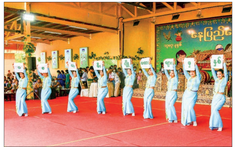
A choral dance demonstration.

THINGYAN revellers, Tatmadaw members and families joyfully enjoyed the water-throwing festivities at the pavilions in Nay Pyi Taw Council Area on the Thingyan Akyat Day of Myanmar's traditional Maha Thingyan Festival 1383 ME.