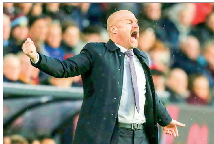
Burnley have sacked manager Sean Dyche.

RELEGATION-THREATENED Burnley announced on Friday they had sacked long-serving manager Sean Dyche with eight games of the Premier League season remaining.