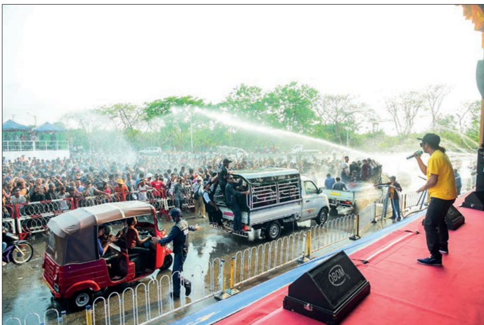
Nay Pyi Taw Mayor's Maha Thingyan Pandal.

and choral dances while the pavilions served the people with refreshments. — MNA