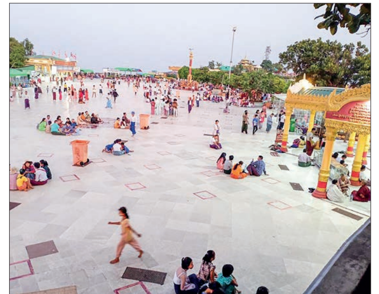
On the terrace of the Kyaiktiyoe Pagoda.

The pagoda board of trustees also provided awareness activities to follow the health rules of the Ministry of Health.