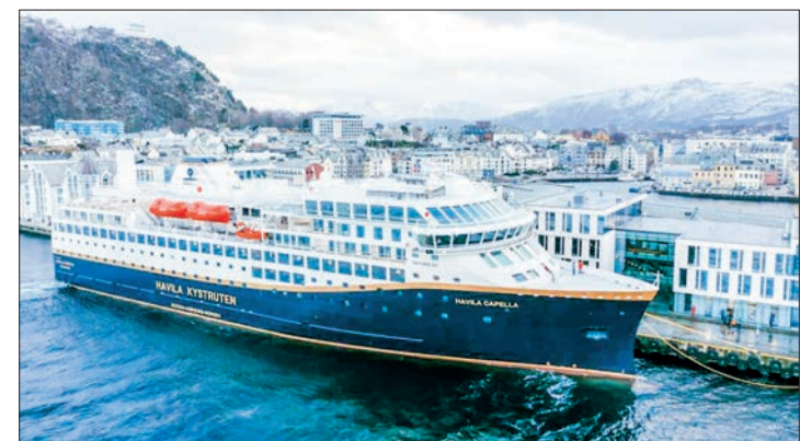
Havila Capella is a brand new ship on the Norwegian coastal route that provides caters for cruise passengers, residents travelling as foot passengers and also transports freight.

GTLK Asia is a Hong Kong-based but Russian-owned leasing company. Most passengers stayed onboard while the company tried to work out whether how it would be affected by sanctions as it was running a Norwegian flag, with a Norwegian crew and a Norwegian operating company.—AFP ■