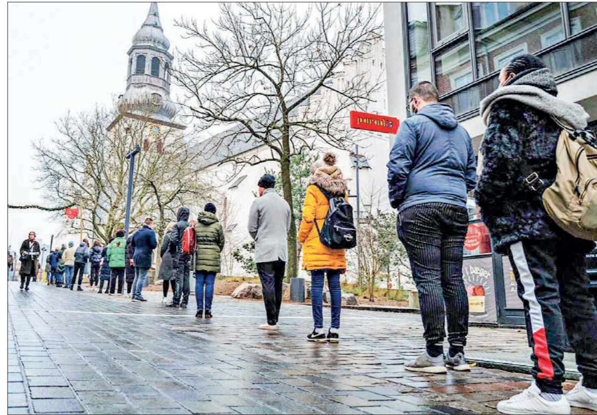
The latest sub-lineages BA.4 and BA.5 have been reported in a number of countries, including South Africa and some European nations. People queue for rapid coronavirus tests at a center set up at a church in Aalborg, Denmark, where a second omicron variant has fuelled a surge.

"There are less than 200 sequences available so far and we expect this to change... We are