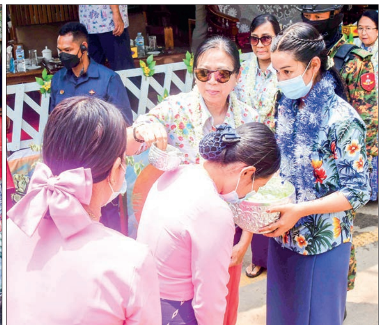
The Senior General and his wife take part in the water-splashing festivities in PyinOoLwin Station yesterday.