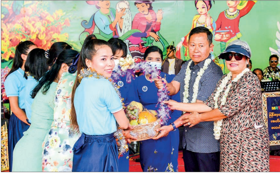
The Vice-Senior General and his wife present awards to artistes and choral dancers.