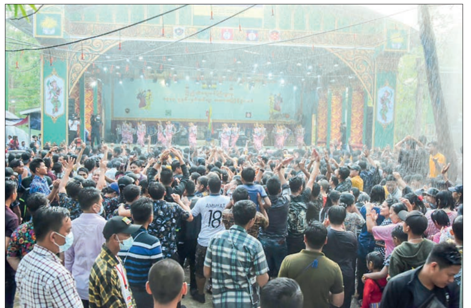
Ministry of Home Affairs' Maha Thingyan Pandal.