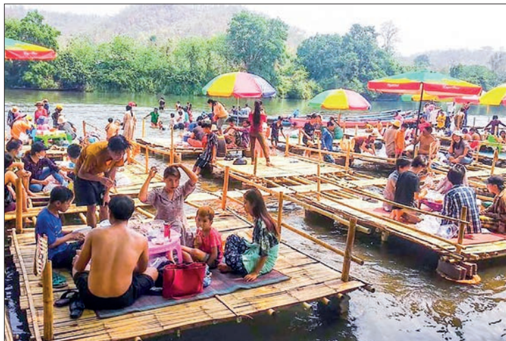
Hsipaw locals and visitors enjoy Thingyan festival at riverside floating restaurants.

BOTH locals and visitors who come from across Myanmar gathered in the special places of Hsipaw Township, Kyaukse District of Shan State (North), such as the Bawkyo Pagoda, the Namhunwe Waterfall, the Parami Bridge, Chaungson, Sanmalar Park, Hsipaw Chaungtha along the banks of the Dokhtawady River, the fourth-mile beach, Pan Cherry and San Ye Kyi riverside floating restaurants in Swathlan village, Honaung park in Naungkawgyi village on the morning of Thingyan Akyat day. — Khin Lay (Hsipaw IPRD)/GNLM