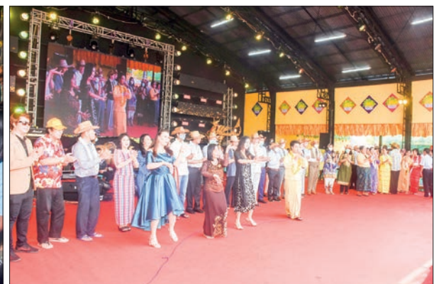
Families of embassies join the Thingyan singing.