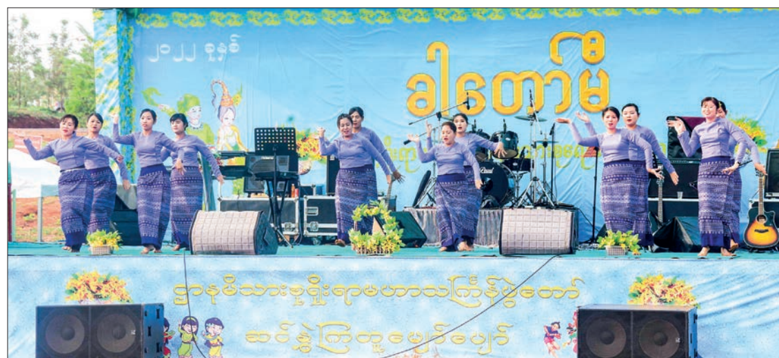
Senior General Min Aung Hlaing and wife Daw Kyu Kyu Hla view the choral dance performance at the event.

joyful participation of Tatmadaw members and families with songs and choral dances in the festival and doused them.