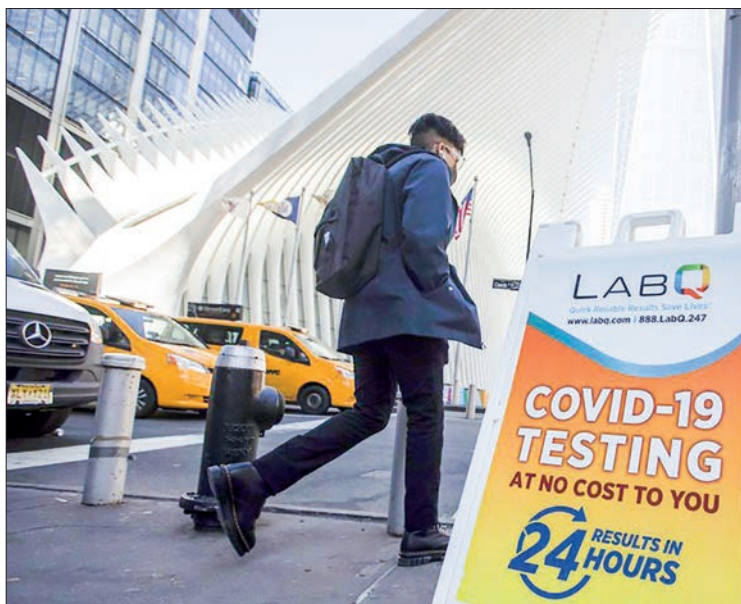
Pedestrians walk past a COVID-19 testing site near the World Trade Centre in New York, the United States, 29 March 2022.

The United States is followed by India and Brazil,