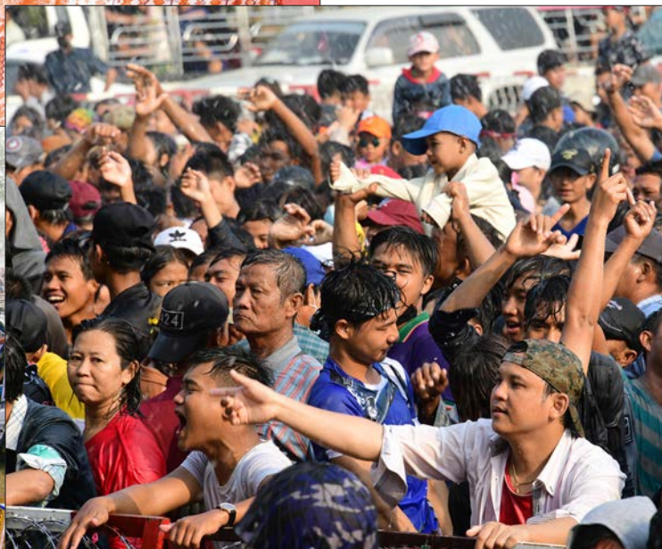
Thingyan's choral dance (top), merrymakers enjoy the Thingyan water festival (above and right photos).