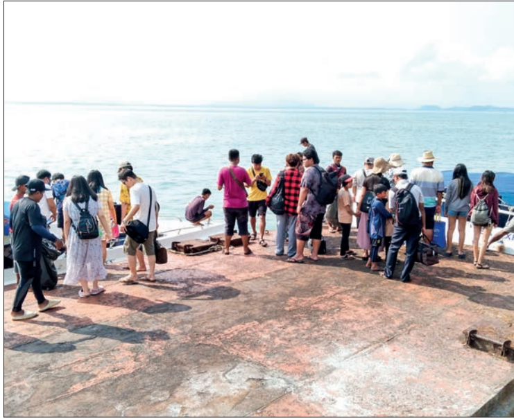
Beachgoers are ready to go to islands in Kawthoung.

The visitors also joined the Water Festival in Kawthoung during their trip to the beaches. The visitors enjoy fun sporting activities and relax on the beaches. They visit the NyaungU Phee Island, Saturn Island, Myinkhwa Island, Kyatmauk Island (heart-shaped island), Zardatgyi Island, Fork Island, Paradise Island and other islands. The majority of the domestic visitors enjoy a memorable beach vacation during the Thingyan Festival. — Kyaw Soe (Kawthoung)/GNLM