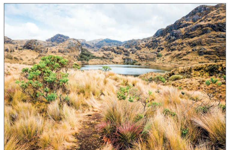
Ecuador said Wednesday it had begun pumping oil from a third field located partly on a protected nature reserve in the Amazon rainforest.

Then president Rafael Correa had tried to persuade the international community to pay Ecuador $3.6 billion not to exploit the ITT block — an ultimately failed initiative to protect the