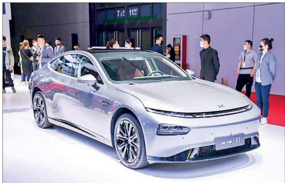
Chinese electric car maker XPeng has warned it may have to halt production if Covid lockdowns continue

CHINESE auto makers may have to put the brakes on production if strict Covid-19 curbs in Shanghai persist, said the founder of electric carmaker XPeng, as a prolonged lockdown of the economic hub menaces supply chains.