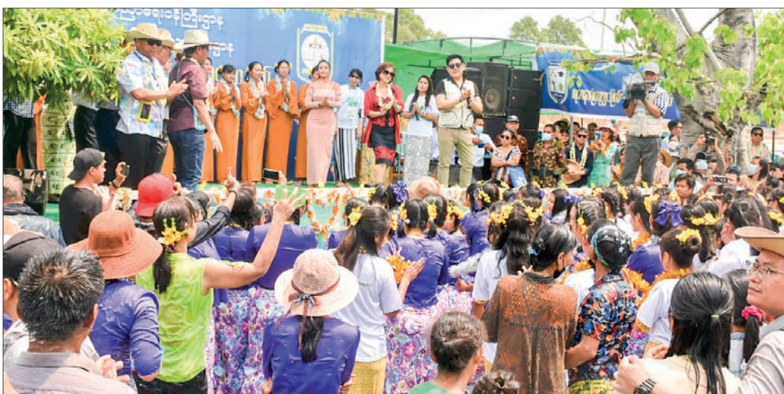
Revellers enjoy throwing water on another (top photos). Artists are entertaining the public at the event (above).

REVELLERS played water at the pandals along the southern parts of the moat. Several others went to the resorts to relax on yesterday's Myanmar traditional Thingyan Akyat day.