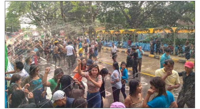
Bhamo residents revel in Thingyan festival.

THE third day of the Thingyan water festival was celebrated lively with traditional dances at the central pandal in Bhamo yesterday.