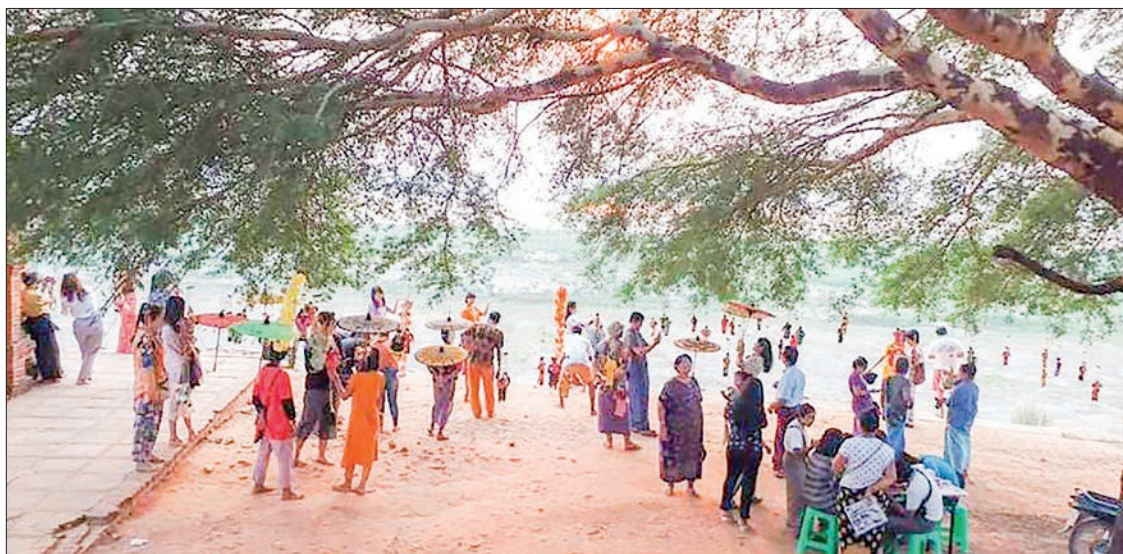
Local travellers are seen visiting one of the Bagan Cultural Zone's sites.

Out of those destinations, Kyaukmyatmaw Pagoda is