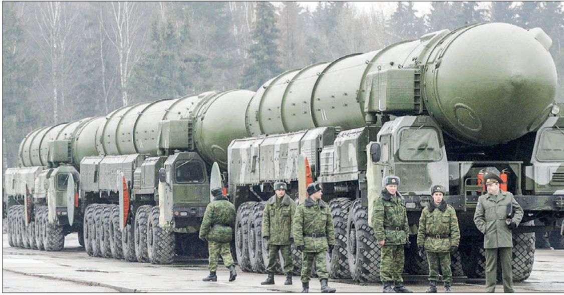
Representational Image: Former Russian president Dmitry Medvedev warned Thursday that Russia would deploy nuclear weapons close to the Baltic States and Scandinavia if Finland or Sweden decide to join NATO.

FORMER Russian president Dmitry Medvedev warned Thursday that Russia would deploy nuclear weapons close to the Baltic States and Scandinavia if Finland or Sweden decide to join NATO.