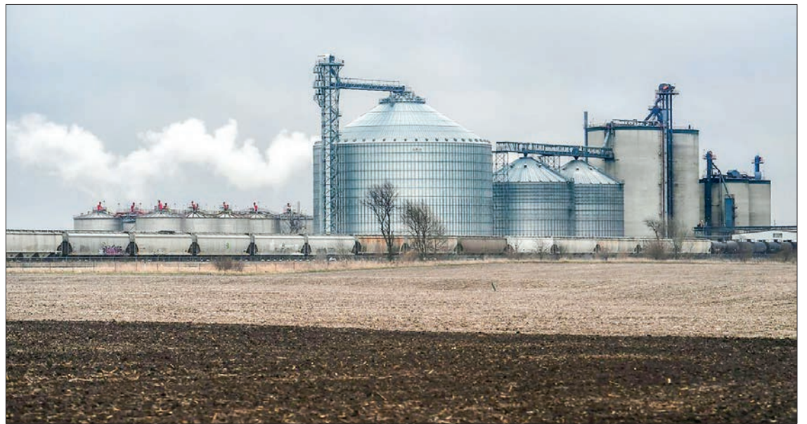
A biofuel production plant in Iowa.

IN an effort to ease Americans' pain at the gas pump, President Joe Biden has announced his administration will ease restrictions on the sale of E15 — gasoline that includes 15 per cent ethanol — and new investments in biofuels as a whole.