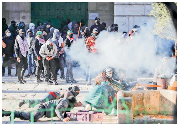
Palestinian demonstrators clash with Israeli police at Jerusalem's Al Aqsa mosque compound on 15 April 2022.

MORE than 100 people were wounded Friday in clashes between Palestinian demonstrators and Israeli police at Jerusalem's Al-Aqsa mosque compound, in fresh violence as Jewish and Christian festivals overlap with Ramadan.