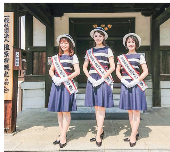
Supplied photo taken in August 2021 shows three individuals previously chosen to fulfil the Sarara princess tourism ambassador role in the Nara Prefecture city of Kashihara.

Previously the ambassadorship was recruited under the name of Kashihara Campaign Lady, but the title was changed in 2009. "We hope many people, regardless of gender, apply for the role so that we can spread awareness of the city's attractions," a board official said. The deadline for applications is 6 May. Three people will be chosen to fulfil the role at events taking place over about 30 days in a year. — Kyodo ■