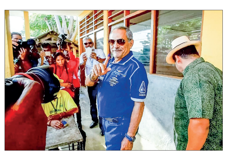
Jose Ramos-Horta was a critical figure in East Timor's independence struggle.

The election is seen as a chance to reset a political deadlock between the two main parties: the National Congress of the Reconstruction of Timor-Leste