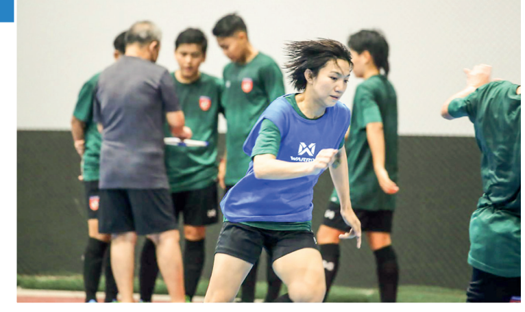
Myanmar Futsal Team take a special training ahead of the NSDF Futsal Invitation Championship 2022 in Thailand.

According to the fixtures, the Myanmar team will next play against the Thai All-Stars team on 23 April, the Indonesian national team on 24 April, and the Australian club South Perth on 26 April. —Ko Nyi Lay/GNLM