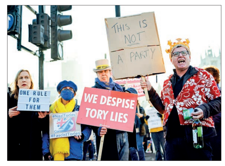
Demonstrators outside the House of Commons in London where Boris Johnson apologized for a lockdown party.

"The prime minister will have his say... and will outline his version of events and face questions from MPs," government minister Greg Hands told Sky News Monday.—AFP