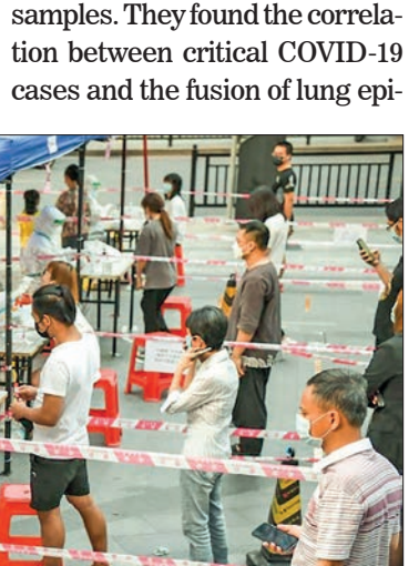
Medical workers take swab samples from residents for nucleic acid test at a community in Liwan District of Guangzhou, south China's Guangdong Province, 9 April 2022.

responses, thus triggering immune signaling cascades in the lungs, which are a major driver of lung damage in patients with severe disease. Scientists from the Chinese Academy of Medical Sciences and Peking Union Medical College and their collaborators analyzed postmortem patient samples. They found the correlation between critical COVID-19 cases and the fusion of lung epi-