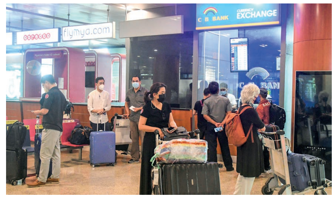
Foreigners are pictured at currency exchange counters at Yangon International Airport.

Upon arrival at Yangon International Airport, passengers