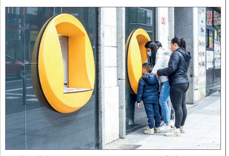
People withdraw money at an ATM counter in Madrid, Spain, 31 March 2022.

SPANISH government would lower its predictions for economic growth in 2022 from the 7 per cent rise in the gross domestic product (GDP) that was previously expected, Prime Minister Pedro Sanchez said on Monday.