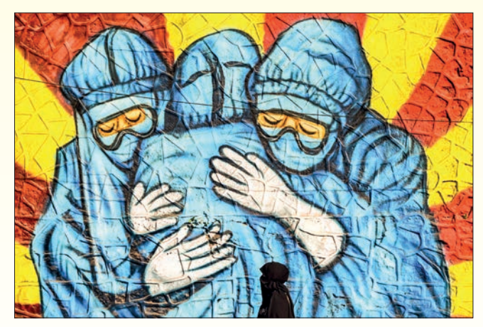
A pedestrian walks past a wall mural depicting health workers wearing Personal Protective Equipment (PPE) suits to spread awareness about the Covid-19 coronavirus in Mumbai on 29 January 2022.

INDIA has sharply criticized a forthcoming World Health Organization study which reportedly claims coronavirus killed four million people nationally, the latest analysis suggesting a significant undercount of the pandemic's death toll.