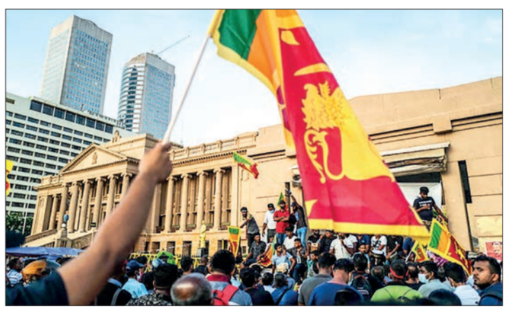
Protesters shout slogans during an ongoing anti-government demonstration near the president's office in Colombo on 18 April 2022, demanding President Gotabaya Rajapaksa's resignation over the country's crippling economic crisis.

SRI Lanka's embattled leader dropped two of his brothers and a nephew from his cabinet Monday, following public anger over the ruling family's mismanagement of a crippling economic crisis and calls for his resignation.