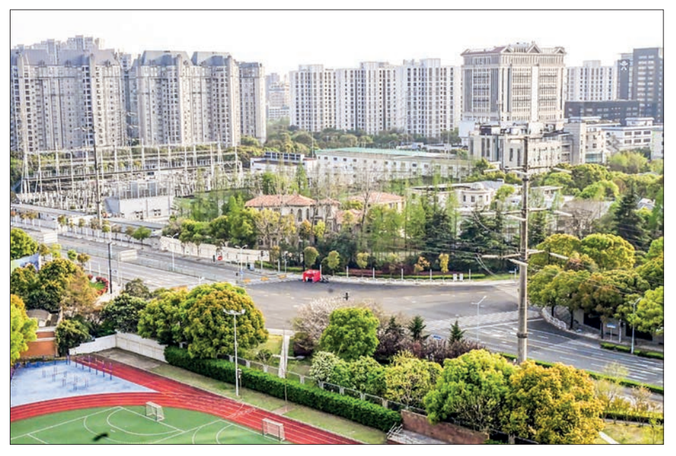
A lockdown continues in Shanghai on 6 April 2022, to curb coronavirus infections.

ers, Sony Group Corp., Mitsubishi Electric Corp. and Sharp Corp. have suspended operations at factories in the city for extended