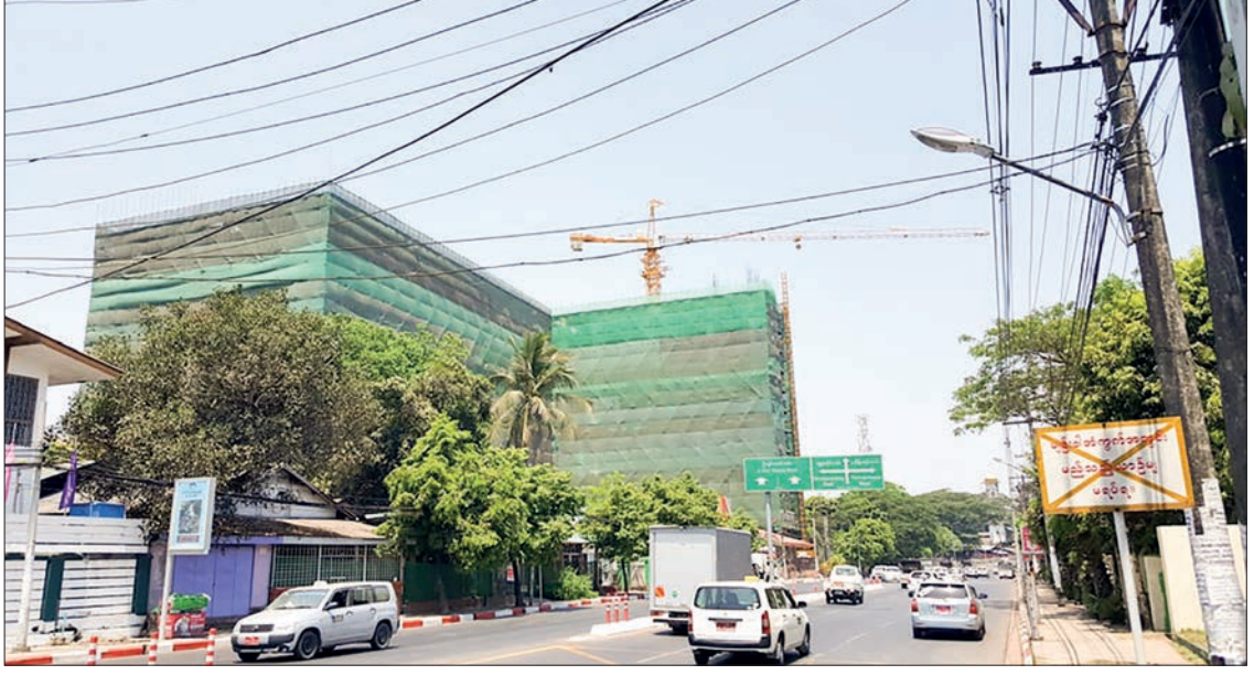
Between 1 October 2021 and 31 March 2022 of the past six-month mini-budget period, capital goods, such as auto parts, vehicles, machines and steel, with an estimated import value of $1.49 billion, were imported into the country.

Additionally, the COVID-19 negative consequences shut down some foreign investment enterprises and the condominium property market relying on foreign expatriates plunged by 70 per cent. As a result, the realtors are forced to reduce the rents. The rental market continued a downward spiral amidst the