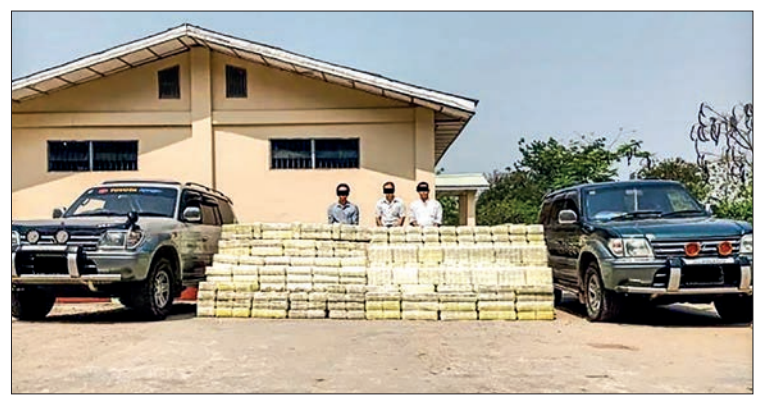
Three arrestees are seen along with seized drugs and vehicles.

They are prosecuted and perpetrators are still under investigation, according to the Police Force.—MNA