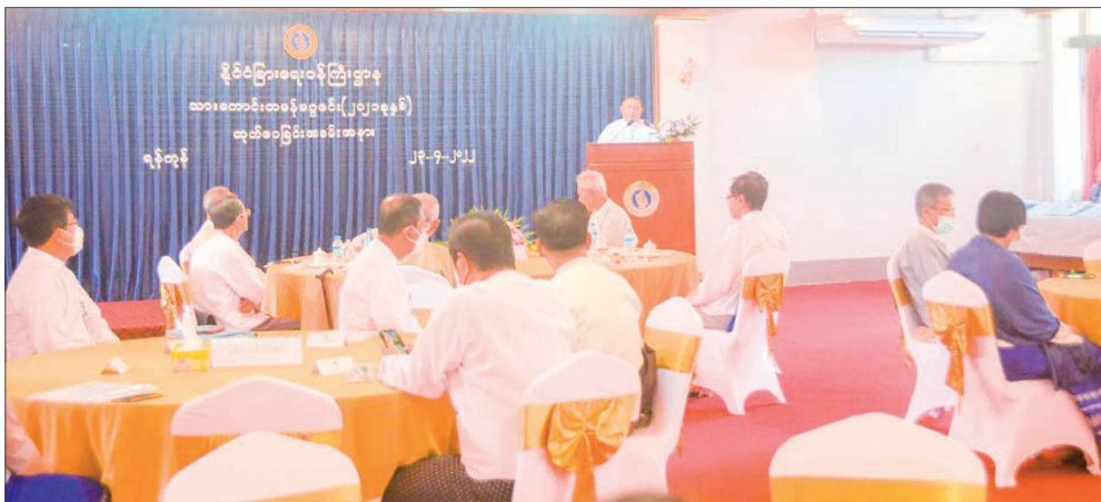
The launching event of the MoFA's Thar Kaung Taman Magazine for 2021 in progress.

The Ministry of Foreign Affairs issued its annual magazine in 1997, and the 2021 Thar Kaung Taman Magazine is the 23 rd magazine. The magazine covers the experiences, diplomatic affairs and international affairs encountered by senior diplomats, counsellors of the ministry, directors-general, retired diplomats, employees in current operations and external writers in both Myanmar and English languages. — MNA