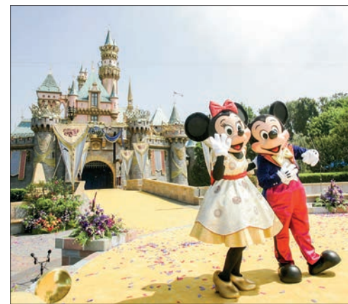
Mickey and Minnie Mouse in front of the Sleeping Beauty Castle during the 50th anniversary of the opening of Disneyland in Anaheim, California on 17 July 2005. PHOTO: AFP/FILE

The move was the latest episode in a dispute between DeSantis' Republican administration and Disney, after the company criticized the passage in March of a law banning school lessons on sexual orientation. There was no immediate response by Disney to the decision, part of a cultural battle waged by Republican leaders across the United States. —AFP