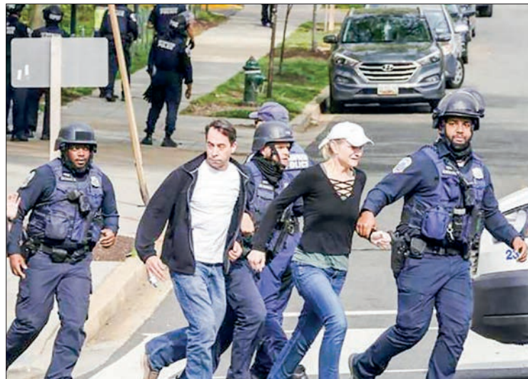
Policemen escort pedestrians to safety.