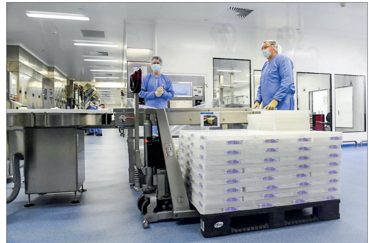
Employees are at work at the factory of US multinational pharmaceutical company Pfizer in Puurs, Belgium.

Several companies, many of which are covered by the licensing agreement, are in discussions with WHO Prequalification but may take some time to comply