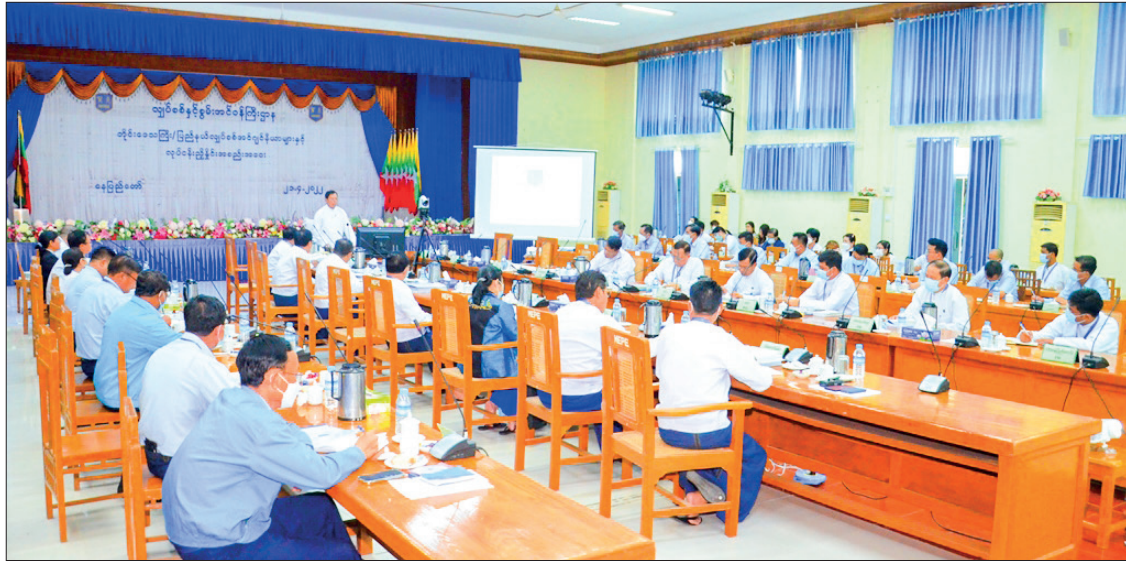
Union Minister U Aung Than Oo makes the speech at the meeting regarding the power distribution sector, held at No. 27 office of MoEE in Nay Pyi Taw on 21 April.

MINISTRY of Electricity and Energy will accelerate its short-term and long-term energy projects amid the power shortage as power supply plays a pivotal role in Myanmar's economic growth, said U Aung Than Oo, Union Minister for MoEE.