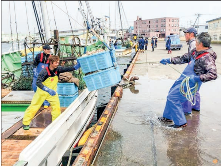
Salmon and trout drift-net fishing boats at the Habomai fishing port in Nemuro, Hokkaido, in April 2016.

JAPAN and Russia have clinched a deal on Tokyo's fishing quota for salmon and trout spawned in Russian rivers, Japan's Fisheries Agency said Saturday, reaching an agreement on the issue despite Japan's economic sanctions against Moscow over its invasion of Ukraine.