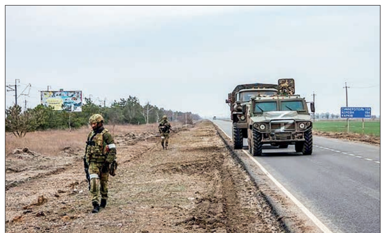
8 MARCH 2022: A Russian humanitarian convoy carries food supplies from Crimea to Ukraine.

“If such signs are found in any part of the Azovstal metallurgical plant, Russia’s Armed Forces... will immediately stop any hostilities and provide a safe exit,” it adds.—AFP ■