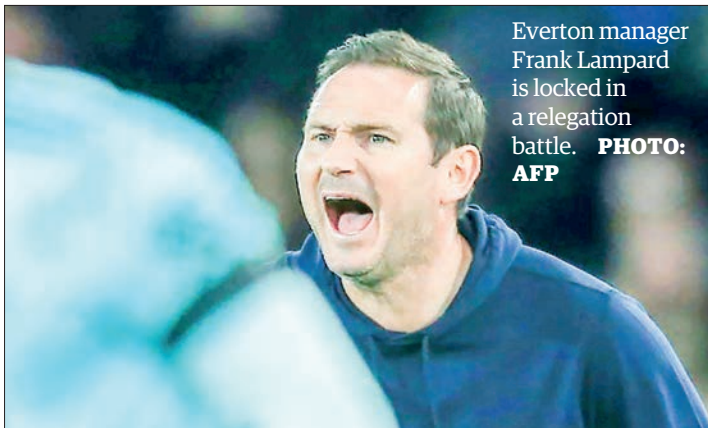
Everton manager Frank Lampard is locked in a relegation battle.

EVERTON manager Frank Lampard said Friday he would happily take a draw against "incredible" Liverpool even though his side desperately need points to survive. The Toffees, who have registered just six points on the road all season, could be in the bottom three by the time Sunday's game kicks off at Anfield.