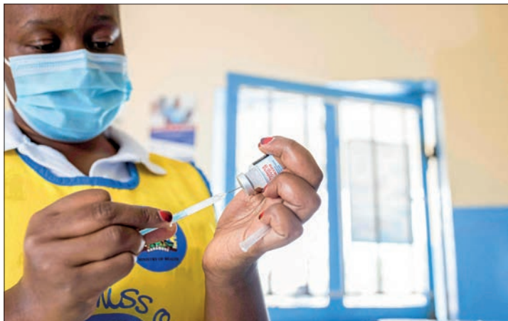
A nurse prepares a dose of the Moderna COVID vaccine at the Oltepesi Dispensary in Kajiado, Kenya.