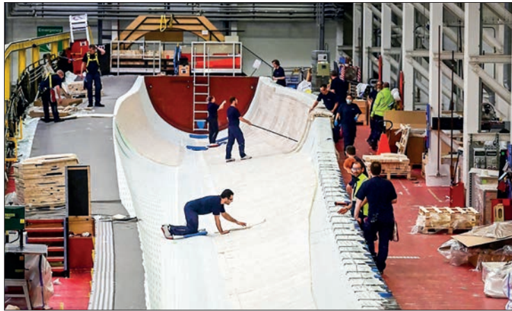
India and Britain signed several memorandums of understanding (MoUs) in the fields such as nuclear energy, education, wind energy, artificial intelligence (AI). A wind turbine blade is manufactured at the Siemens Gamesa blade factory in Hull, northeast England on 28 January 2022.

They also highlighted progress in negotiations on a