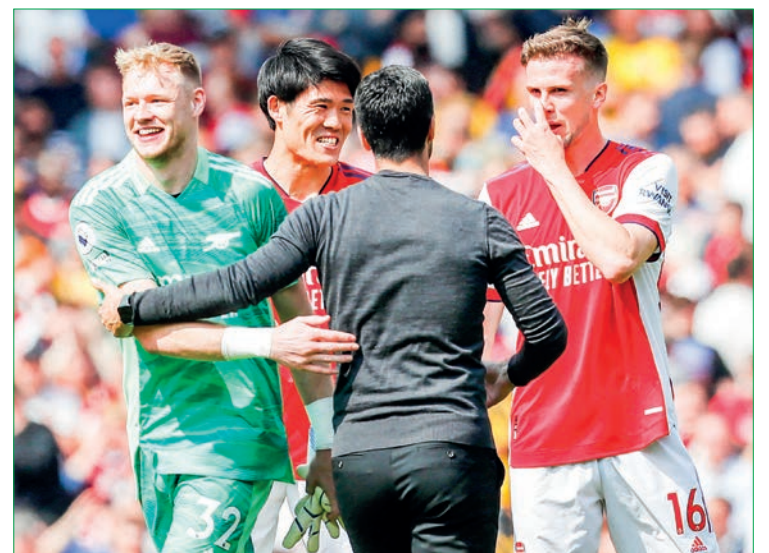
Arsenal's Spanish manager Mikel Arteta (C) celebrates with Arsenal's English goalkeeper Aaron Ramsdale (L), Arsenal's Japanese defender Takehiro Tomiyasu (2nd L) and Arsenal's English defender Rob Holding (R) on the pitch after the English Premier League football match between Arsenal and Manchester United at the Emirates Stadium in London on 23 April 2022.

Hassane Kamara's fine strike briefly gave Watford hope, but Rodri's stunning volley quickly restored City's two-goal cushion.—AFP