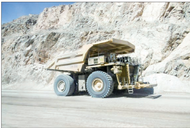
Chile's ongoing drought has affected mining production in the northern part of the country.

CHILE'S ongoing drought has affected mining production in the northern part of the country, causing a drop in output at Antofagasta Minerals, one of the world's largest copper producers, the company said Thursday.