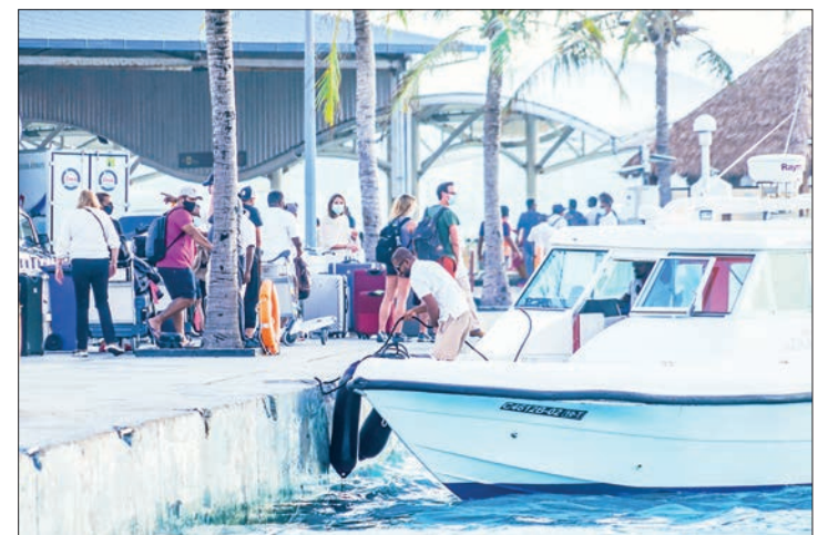
Tourist arrivals in the Maldives this year passed the 500,000 mark as of 20 April.

Official data also showed that the average length of stay of visitors in the Maldives was eight days, with the daily average of arrivals standing at 4,827.—Xinhua