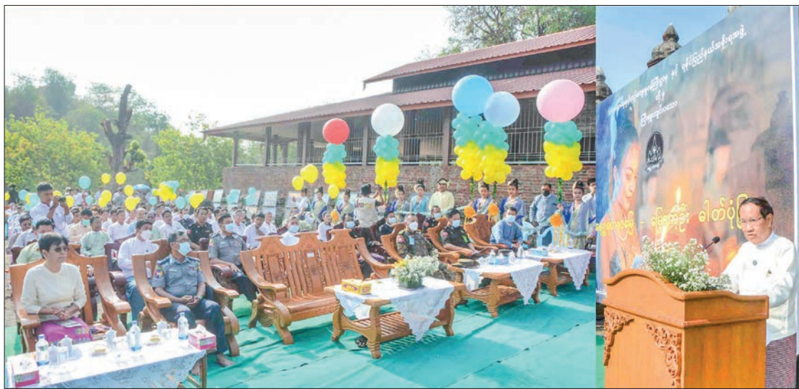
The MoRAC Union Minister opens the Anaga Yadana Myay-MraukU photo contest in MraukU Township yesterday.

Minister said the complete nomination dossier for MraukU cultural heritage zone was sub-