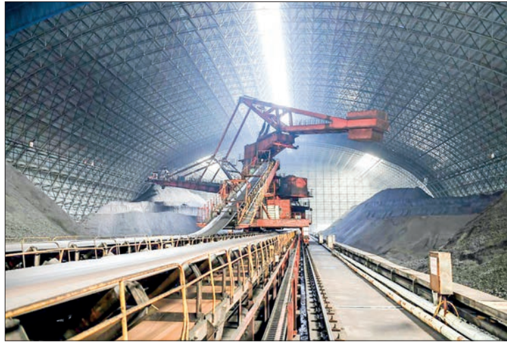
Photo taken on 21 October 2021 shows coal stored in the depository at Wenergy Hefei Electric Power Co., Ltd. in Hefei, east China's Anhui Province.

allowed Chinese developers to continue to build new coal power projects, it warned.