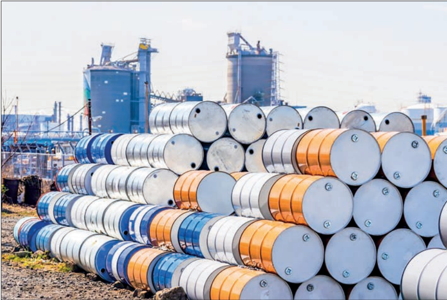
An auction will be held on 10 May for the almost 5 million barrels of crude oil.

The oil will be available to the winning bidder on June 20 or later, local media reported Friday.