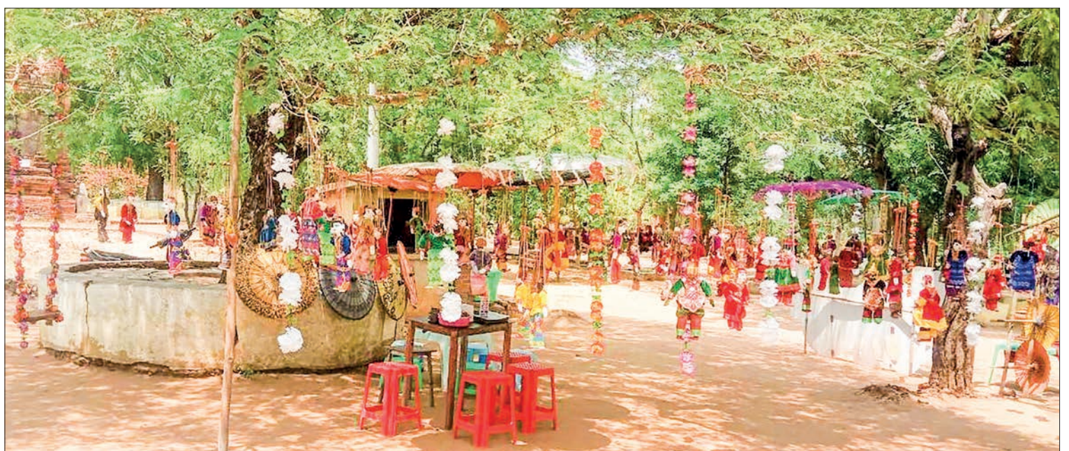
Marionettes – Myanmar traditional puppets are seen hanging from the trees.

"The most travellers visited on Thingyan Akyo, Akya, Atet and New Year day. No one expected that the region would host such numbers of visitors. The stalls, garments and regional product shops saw good sales worth about one million a day. We, hand painters, were also busy and earned a good income daily. The tourists came here, but it was just a few. The Bagan people get an unexpected economic opportunity during the Thing-