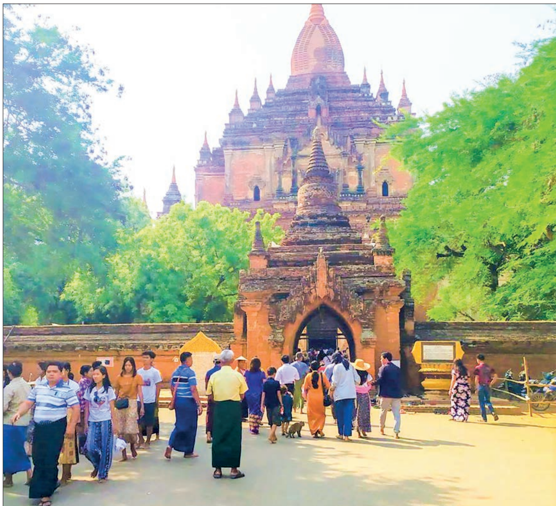
Travellers are pictured against the background of Myinkaba Pagoda in Bagan during the Thingyan holiday.

"There were between 4,000 and 7,000 visitors to Myinkaba pagoda per day in the Thingyan period. Unexpected Thingyan travels surged this year. It was more crowded than the previous Thingyan before the COVID-19 pandemic. There have been visitors so far since 12 April. This month is the final month of the travelling season and the Bagan, which was almost empty in tourism during the last two