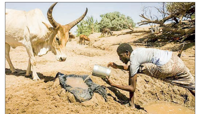
The climate-induced emergency across the Horn of Africa is the worst drought the region has seen in 40 years.