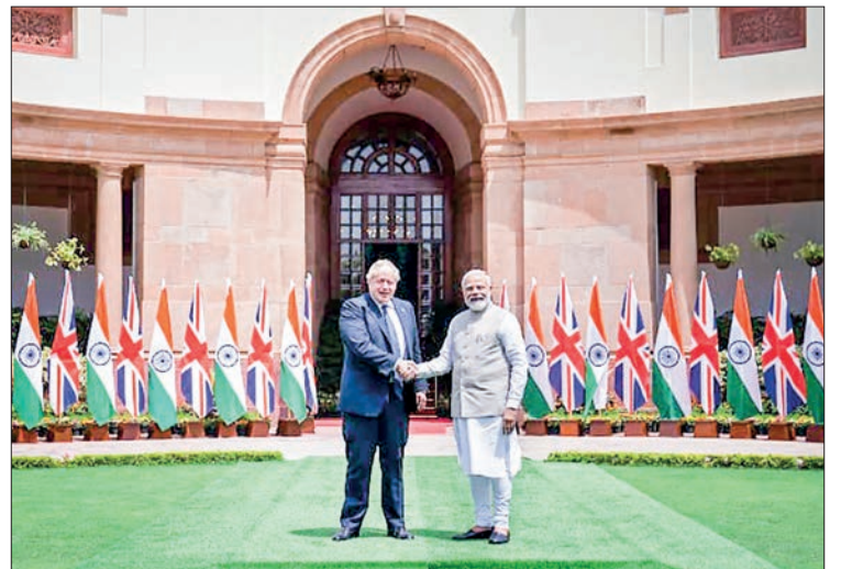
Britain’s Prime Minister Boris Johnson (L) shakes hands with his Indian counterpart Narendra Modi before their meeting at the Hyderabad House in New Delhi on 22 April 2022.

The new partnership was “a decades-long commitment”, he added, hailing the relationship between “one of the oldest democracies, and India, certainly the largest democracy”.—AFP ■