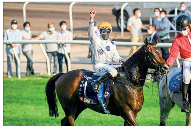
A rider in a face mask celebrates victory at Shatin race course in December.

“I understand that the club’s priority has been to keep racing going during a difficult time... but at a certain point it becomes a mental health issue,” Shinn was quoted saying in the South China Morning Post. Jockeys and trainers have been required to stay home during off-hours and avoid mixing with people outside their household. Shinn compared it to being in jail.—AFP