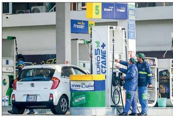
Pakistan's new finance minister has agreed to reduce fuel subsidies.

PAKISTAN'S new finance minister on Friday agreed with IMF recommendations to reduce fuel sub-