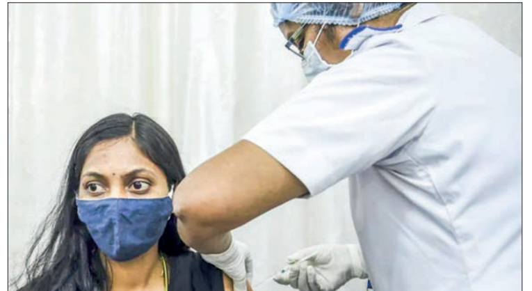
The precautionary or the booster COVID-19 dose will be available for free to all eligible beneficiaries aged between 18 and 59 years in all government vaccination centres.

A day before the administration of the precaution dose, the SII announced that it has revised the price of its COVID vaccine Covishield for private hospitals