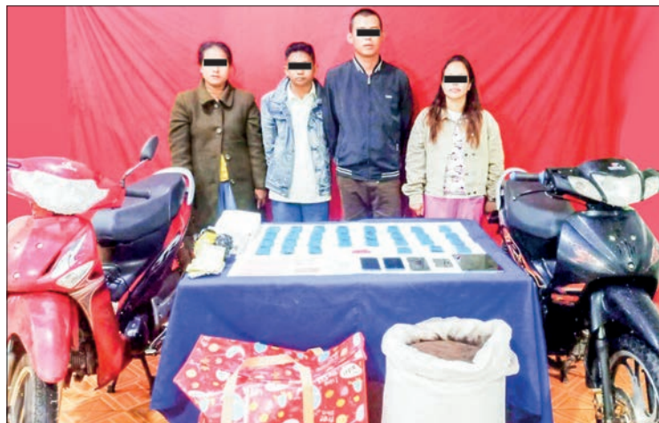
Four arrestees are pictured along with seized drugs and motorbikes in Myeik.

the Narcotic Drugs and Psychotropic Substances Law, the Myanmar Police Force stated. — MNA