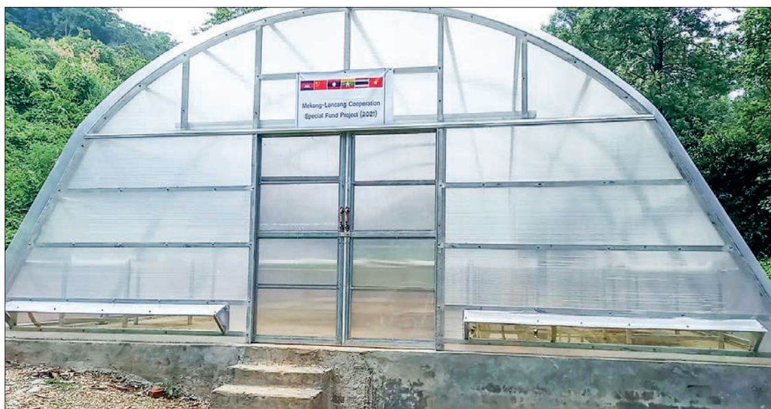
The completed solar dryer.

THE construction of a solar dryer to produce high-quality coffee in the hilly area has now been completed at the Coffee Technology Development Farm (Natyekan) in Ngaphe Township, which is under the Ministry of Agriculture, Livestock and Irrigation.