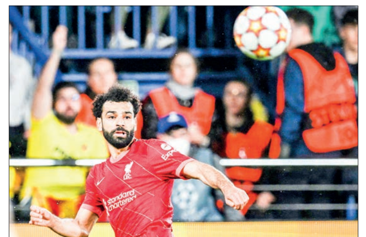
Liverpool's Mohamed Salah eyes the ball during the UEFA Champions League semifinal second-leg match against Villarreal, Villarreal, Spain, 3 May 2022.

“WE have a score to settle,” Mohamed Salah posted on social media moments after Real Madrid set up a re-match with Liverpool in Saturday's Champions League final. Salah's first appearance in European club football's showpiece game came to an agonizingly premature end in Kyiv four years ago. The Egypt forward made a tearful first-half exit after suffering a shoulder injury in a challenge with Real defender Sergio Ramos, who was accused of cynically slamming his opponent into the turf. Madrid went on to win 3-1 and Salah has never been able to shake the bitter memories of that night. “That was the worst moment in my career,” the 29-year-old said at Liverpool's pre-match media day this week. “I was really, really down in that time.” — AFP