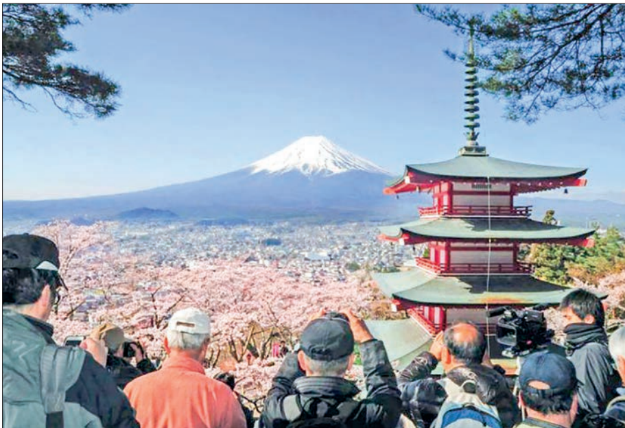
Mount Fuji is the single most popular tourist site in Japan, for both Japanese and foreign tourists. Visitors take photos of cherry blossoms in bloom around a five-storey pagoda with Mt. Fuji in the background at a park in Fujiyoshida, Yamanashi Prefecture, on 10 April 2022.

Japan will also expand the number of airports that accept international flights