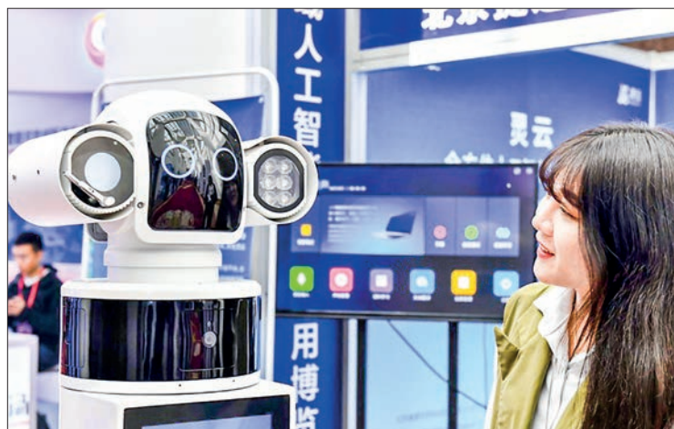
An attendee interacts with a robot during the 1st Summit of Jinan National Artificial Intelligence Innovation and Application (JNAIIA) Pilot Zone & the Exposition of Artificial Intelligence Innovation and Application on Yellow River Basin in Jinan, east China's Shandong Province, 19 April 2021.

Noting that the digital economy has bright prospects and a great role to play, Huang stressed the importance of promoting the full-chain digital