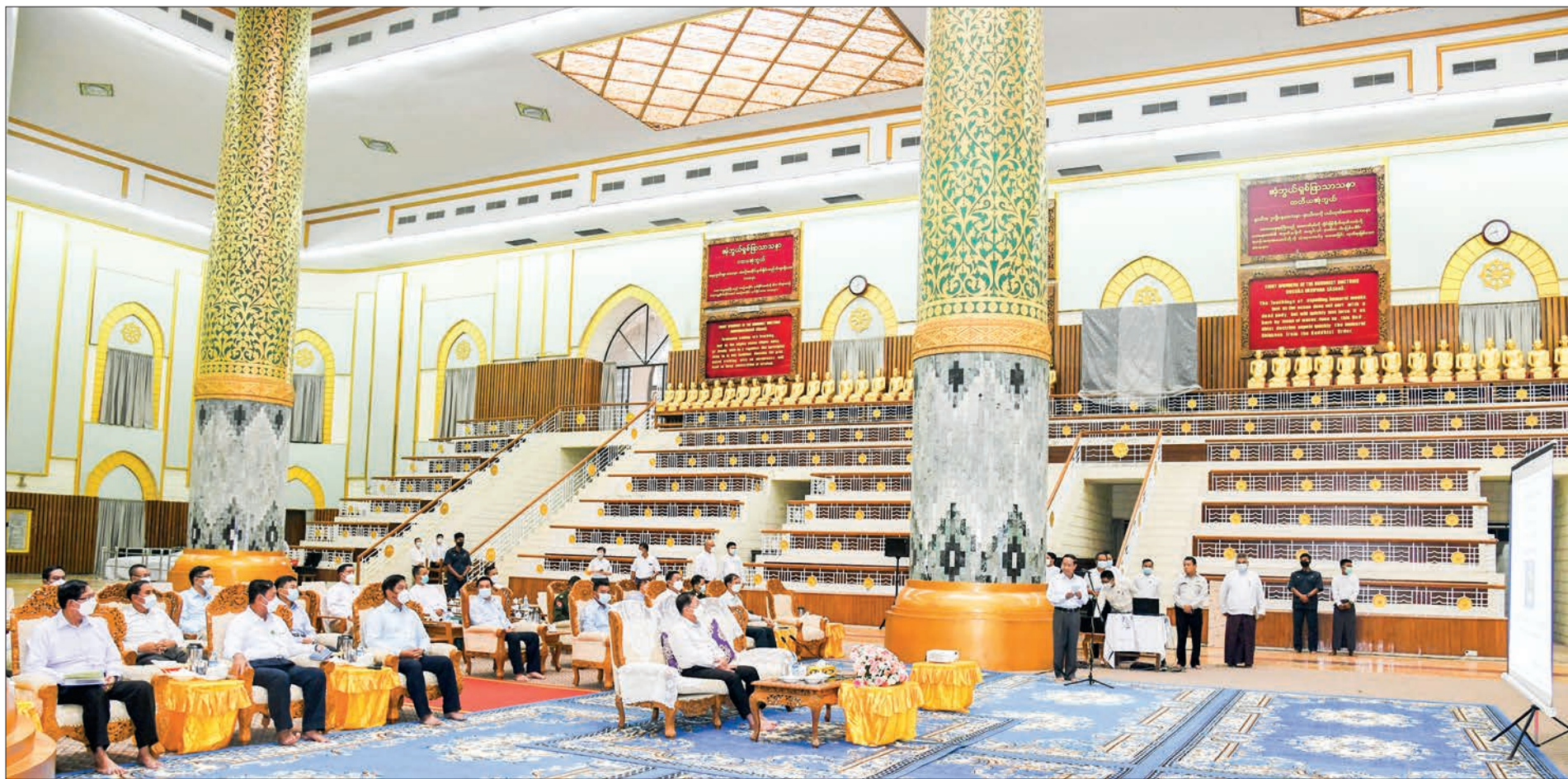
State Administration Council Chairman Prime Minister Senior General Min Aung Hlaing hears the report on major renovation at the Maha Pasana Cave on Kaba Aye Hill in Yangon yesterday.

MAHA PASANA CAVE, a historic building, needs systematic maintenance for long-term existence, Chairman of the State Administration Council Prime Minister Senior General Min Aung Hlaing was quoted as saying in inspecting the major renovation at Maha Pasana Cave on Kaba Aye Hill of Yangon Region yesterday.