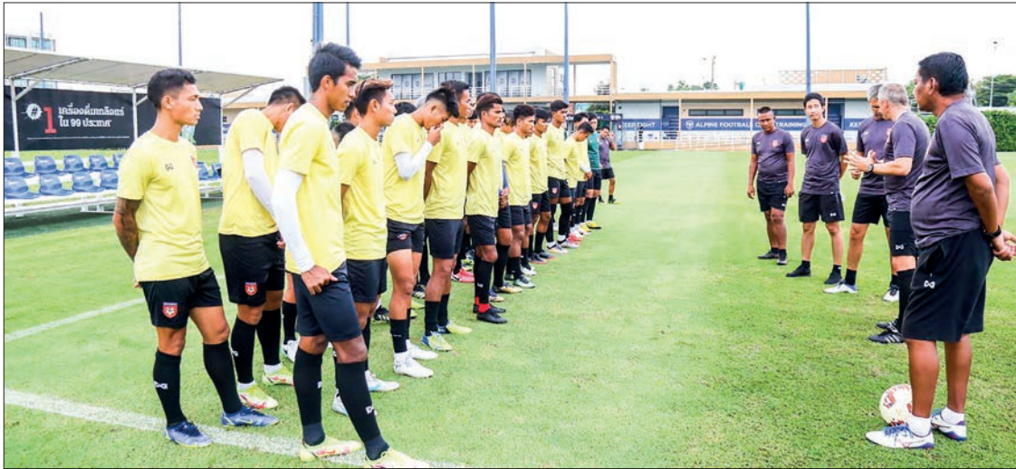
The Myanmar football players are keen to heed the instructions given by the coaching team in Thailand.

THE preliminary Myanmar squad will play two international friendlies in Bangkok, Thailand in preparation for the AFC Asian Cup 2023.