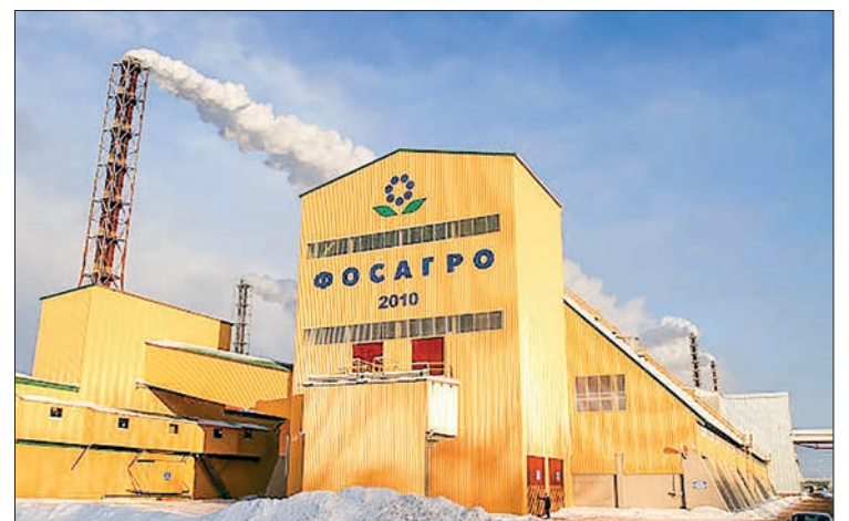
Russian President Vladimir Putin said he's willing to facilitate grain and fertilizer exports as global concern mounts about food shortages. A warehouse storing phosphate plant fertilizer for shipping is seen at the OAO PhosAgro plant in Cherepovets, Russia.

of humanitarian corridors for the exit of civilian ships from the ports of the Azov and Black Sea, which is impeded by the Ukrainian side". —AFP