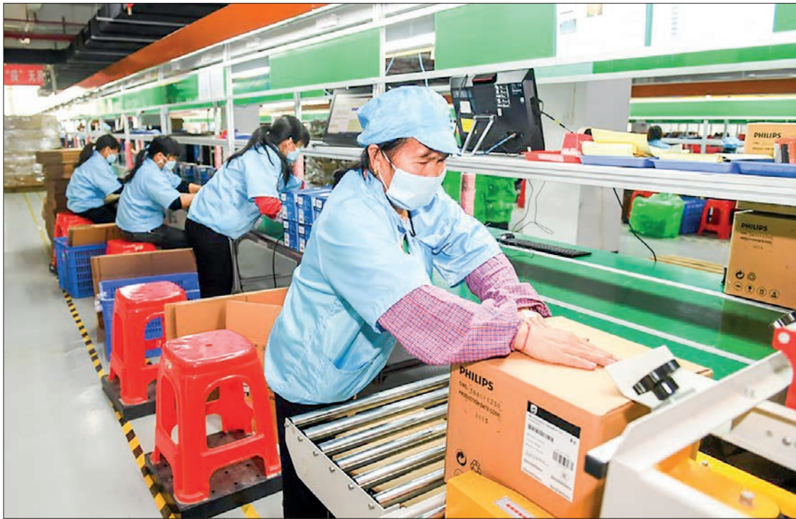
Workers make electronic products for export at a logistic zone of the China-ASEAN free trade zone in Pingxiang, south China's Guangxi Zhuang Autonomous Region, 15 April 2020.

DESPITE COVID-19 outbreaks and growing uncertainties, China sees unstoppable momentum in its cooperation with the Association of Southeast Asian Nations (ASEAN), and is ready to further deepen its strategic partnership.