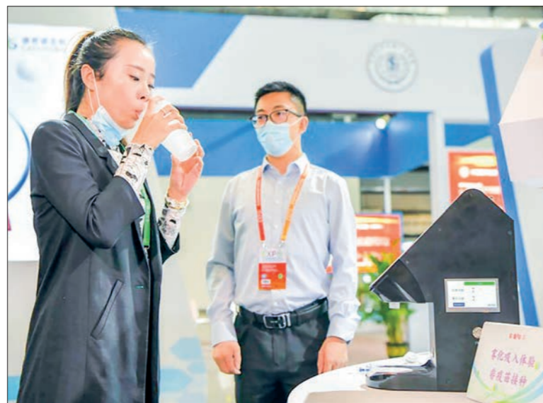
The inhalable COVID-19 vaccine is showcased at China International Health Industry Expo in Haikou City, Hainan Province, on 12 November, 2021.