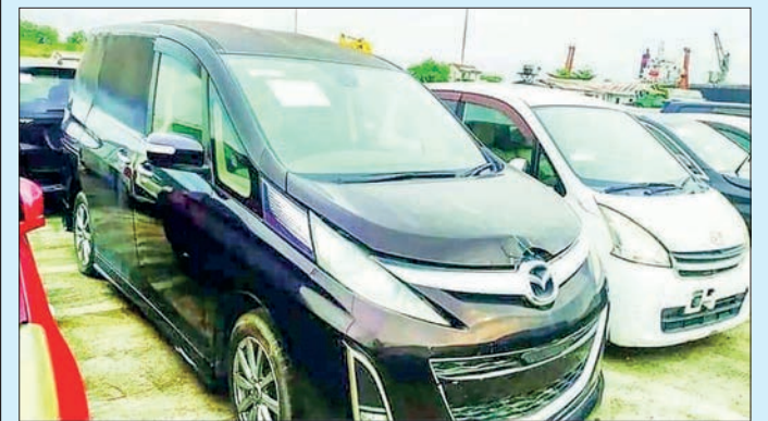
Some disowned cars are seen at Thilawa Seaport.

THE police seized 28 abandoned vehicles at Thilawa Seaport, according to the statement of the Illegal Trade Eradication Committee on 26 May.