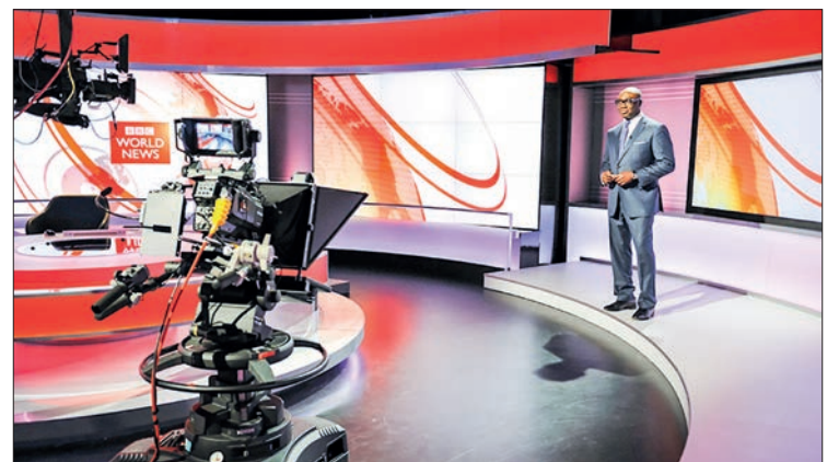
The World's Newsroom is a fusion of the BBC's international journalism and state-of-the-art technology, pulled together under one roof.

made a speech to BBC staff on Thursday in which he hailed "a fresh, new, global digital media organization which has never been seen before.