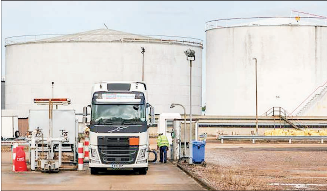
A tanker is refilled with crude oil at the BP oil refinery in Hamble, near Southampton, southern England on 4 October 2021.

BRITAIN'S finance minister Rishi Sunak on Thursday unveiled a sizeable support package for consumers hit by soaring energy bills, with help from a temporary windfall tax on oil giants.