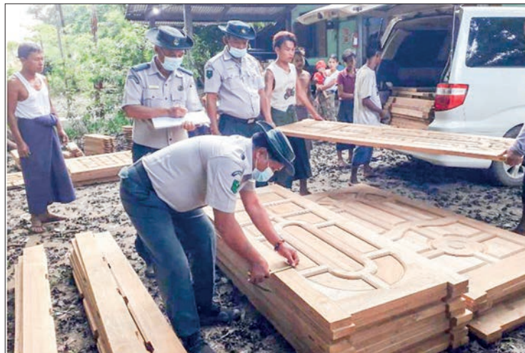
Officials confiscated illegal teak doors in Yangon.

SUPERVISED by the Anti-Illegal Trade Steering Committee, action is being taken under the law against illegal trades across the country.