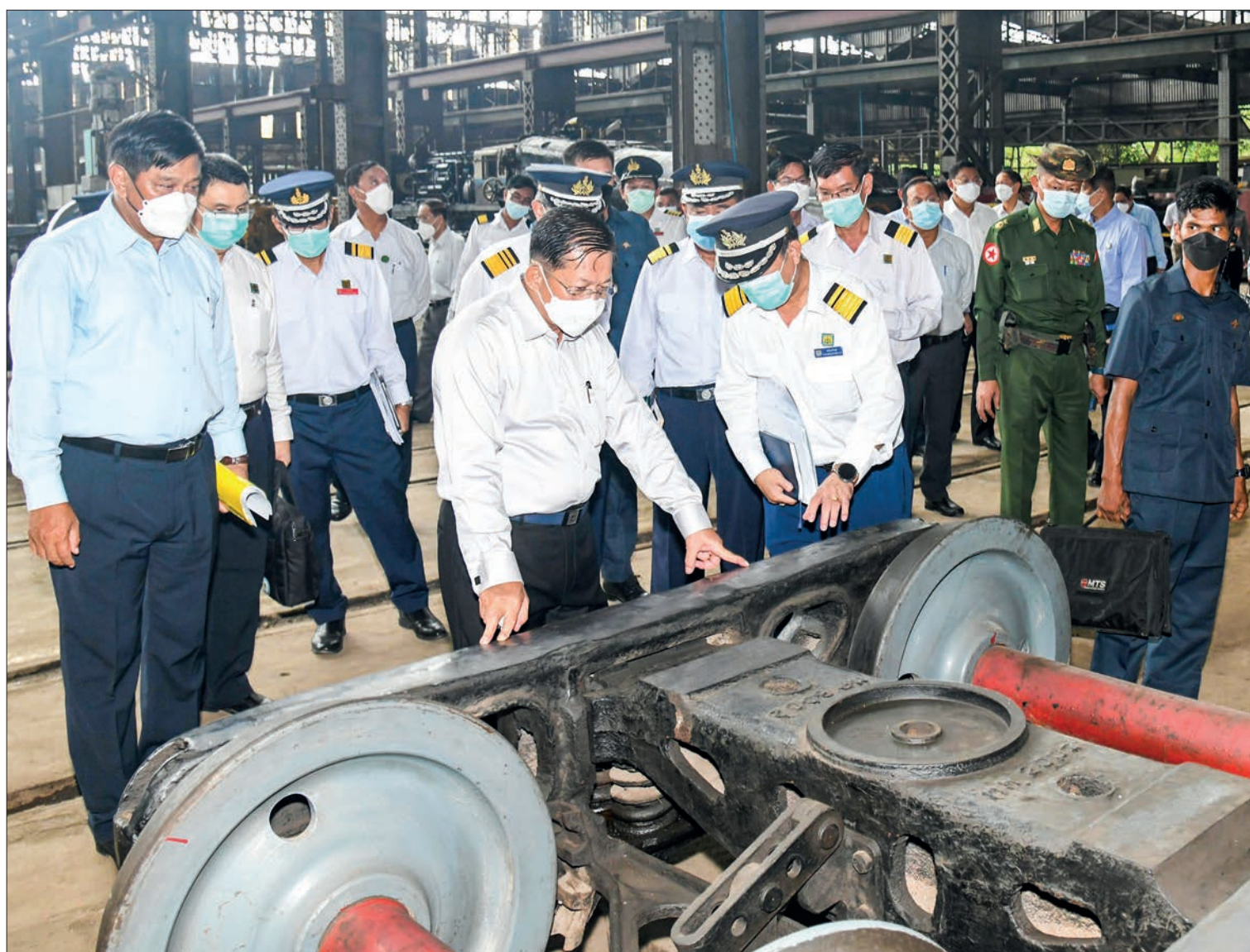
State Administration Council Chairman Prime Minister Senior General Min Aung Hlaing pays an inspection tour round the Locomotive Factory (Insein) in Yangon Region on 27 May 2022.

In his response, the Senior General said as locomotives are valuable, it is necessary to emphasize the best maintenance and upgrade of capacity as much as possible. Efforts must be made for running electric trains in Myanmar like that international, he added. The Senior General pointed out that preparations must be made for building diesel-electric multiple units (DEMU) assembled with