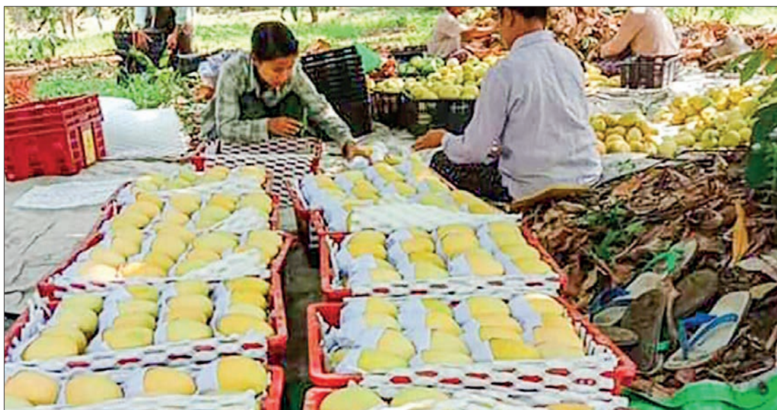
Farm workers are seen sorting out quality mangos.

“Quality plays a crucial role in exports. It is hard to deliver the