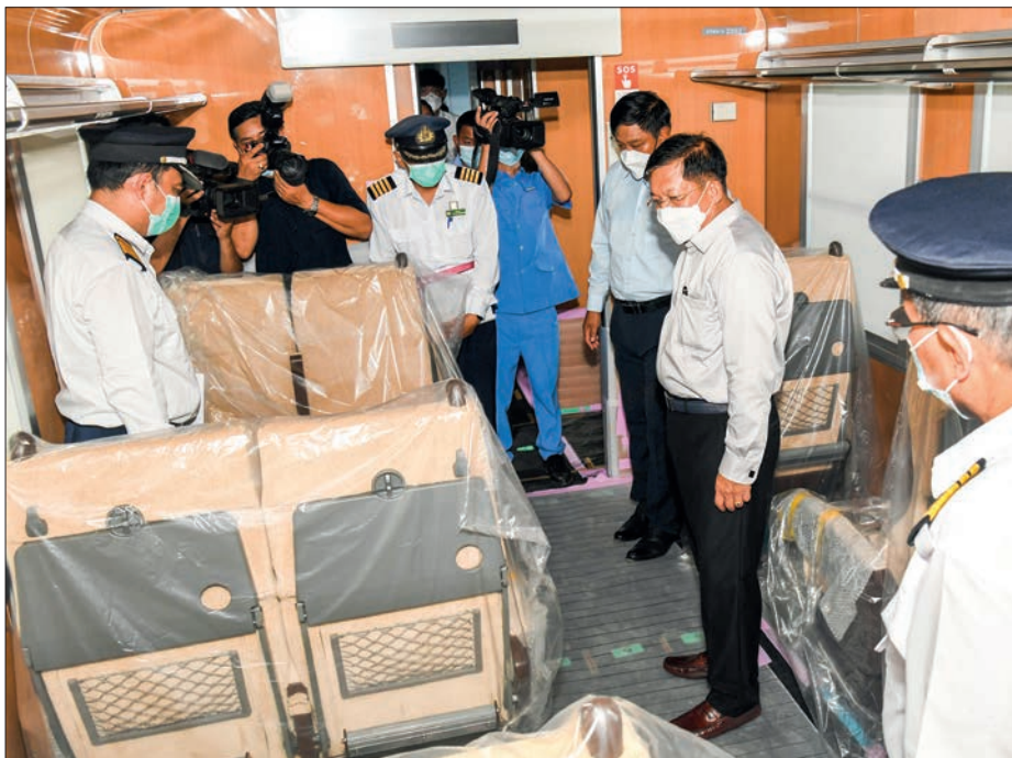
The Senior General looks into new DEMU coaches.