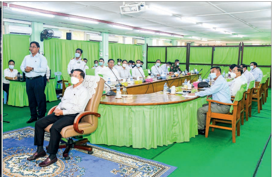
The Senior General hears the reports on the Locomotive Factory (Insein).