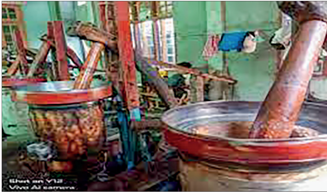
Due to the peanut prices and production rate, the price is only different K1,000 than the price of palm oil.

and production rate, the price is only different K1,000 than the price of palm oil. The oil was also sold to the customers by the end of November 2021,