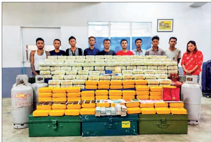
Ten arrestees are seen along with seized stimulant pills in Mingaladon Township.