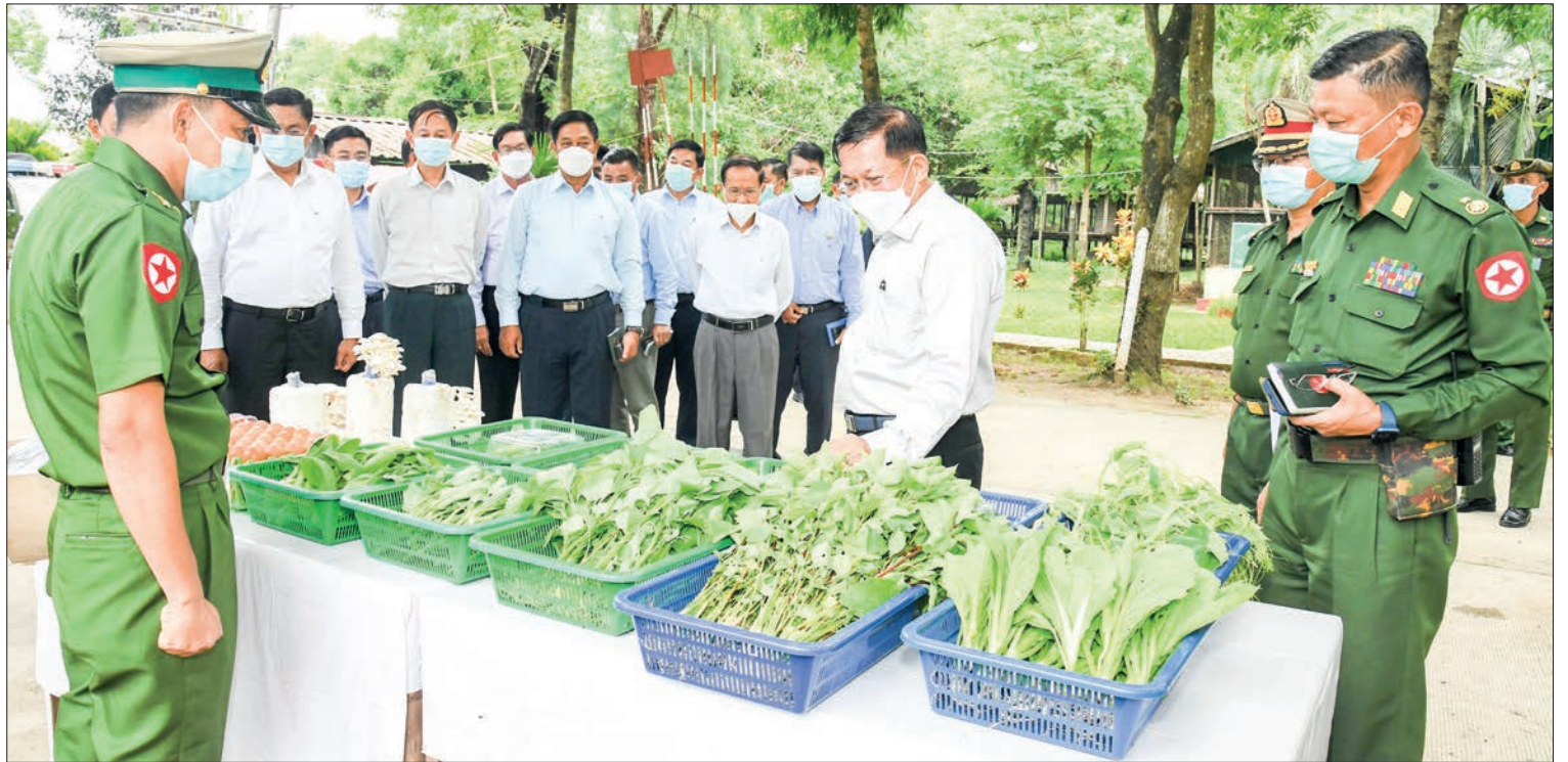
Senior General Min Aung Hlaing inspects vegetables, mushrooms and eggs produced from No 1 Agriculture & Livestock Farm at Yangon Command.

The Commander of Yangon Command reported on the progress of the agriculture and livestock farms, and sales of meat, fish, vegetables, eggs and milk to officers, other