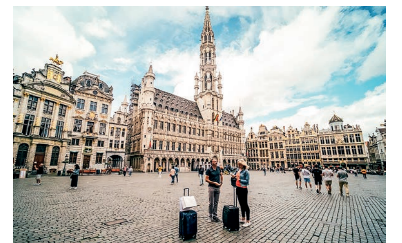
The increase was particularly notable in Europe, which welcomed almost four times as many arrivals as in 2021, an increase of 280 per cent. Tourists visit the Grand Place in Brussels, Belgium, on 28 June 2020.