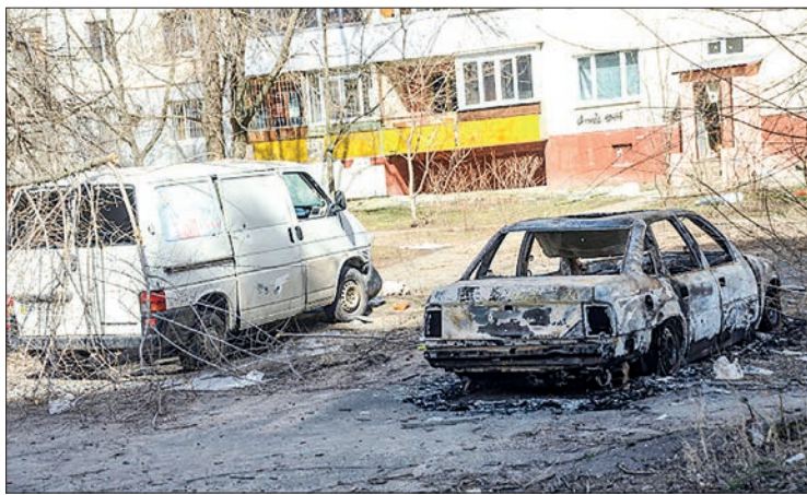
Destroyed vehicle after shelling in the city of Severodonetsk, Lugansk province, Ukraine in mid-March.

STREET fighting raged Tuesday for control of Ukraine’s flashpoint city of Severodonetsk, with the situation changing “every hour”, an official said, as Kyiv warned its troops were outnumbered by Russian forces. Just days ago, Moscow seemed close to taking the strategic industrial hub in the east but Ukrainian forces have managed to hold out. “Our heroes are holding their positions in Severodonetsk. Fierce street fights continue in the city,” Ukrainian President Volodymyr Zelensky said in a video address late Monday. Concerns about a global food crisis also grew as Zelensky warned of tightening grain supplies — Ukraine is a top producer of the commodity — due to what Washington described as