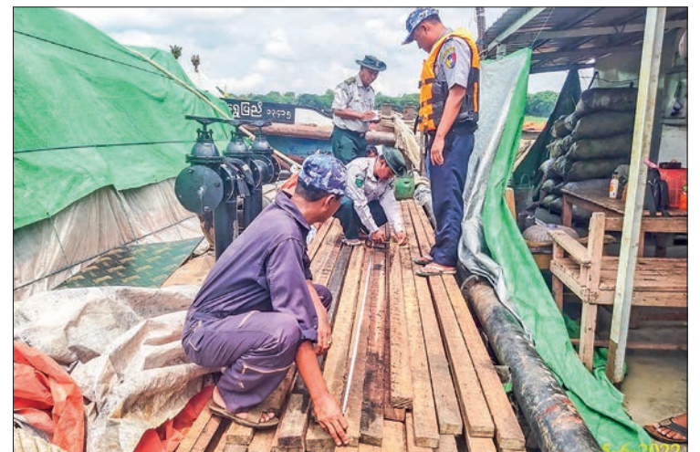
Officials confiscate illegal timbers.

Therefore, seven arrests at approximately K23,879,258 were made on 7 June, according to the Anti-Illegal Trade Steering Committee. — MNA