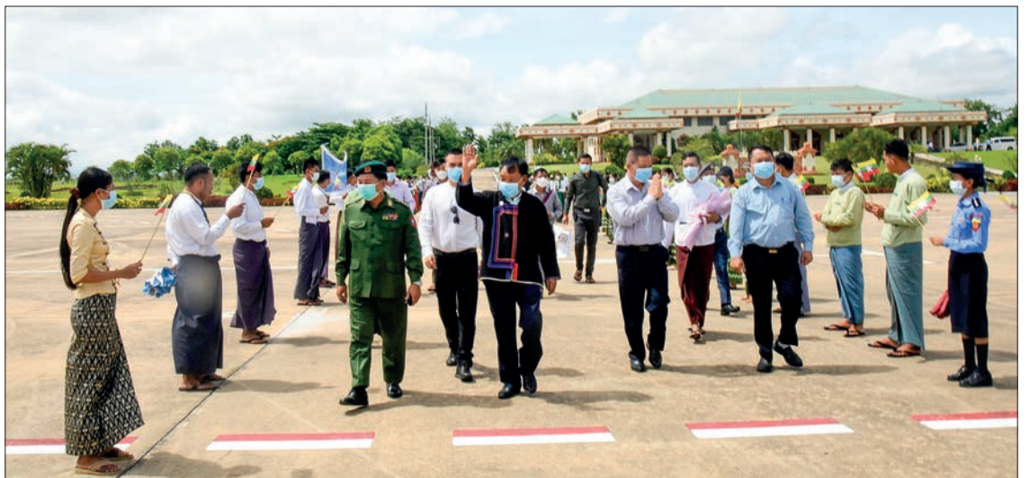
The NDAA (Mongla) vice-chairman-led peace delegation leaves for Kengtung yesterday.

On arrival at Kengtung Airport, it was welcomed by Commander of the Triangle Region Command Maj-Gen Myo Min Tun, township/district level departmental officials, political parties and the people who want peace. — MNA