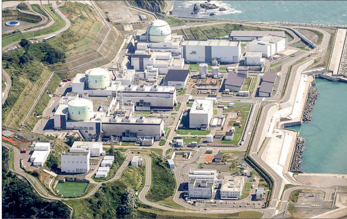
File photo shows Hokkaido Electric Power Co.'s Tomari nuclear power plant in Tomari, Hokkaido.

THE government said Tuesday it will ask companies and households across Japan to save electricity due to a possible power crunch in the summer and winter.