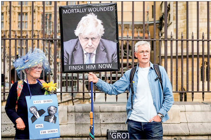
Tories on Monday night were met with calls for them to vote against the prime minister.

UK Prime Minister Boris Johnson convened his cabinet on Tuesday, vowing to “get on with the job” after surviving a confidence