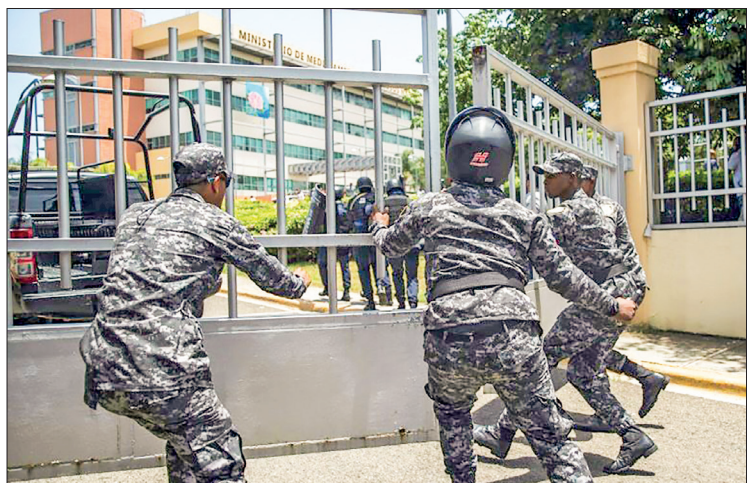
Police close the gate of the Dominican environment ministry headquarters after a shooting, in Santo Domingo, on 6 June 2022.