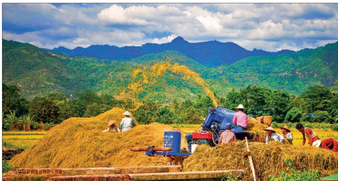
A rice combine harvester is pictured processing the grains.

The export rice prices (low grade) stand at K29,000 and K30,000 per 108-pound bag de-