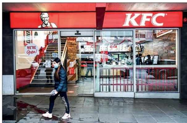
Australians are up in arms about local KFC outlets’ decision to use a cabbage mix on some menu items due to a lettuce shortage.

riencing a lettuce shortage. So, we’re using a lettuce and cabbage blend on all products containing lettuce