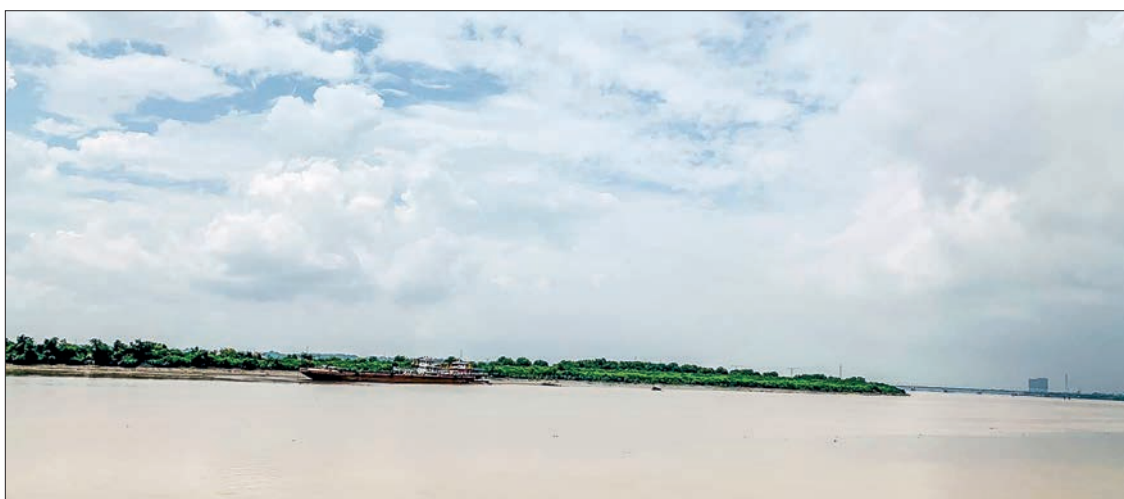
The Photo shows the location of the mid-water resort project in Yangon Region.

ARRANGEMENTS are being made to implement a mid-water resort project in Yangon Region to attract local and foreign travellers.