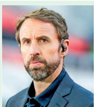
Gareth Southgate said Germany remain the benchmark for England as a result of their trophy-winning pedigree as he prepared his side for Tuesday's Nations League clash in Munich.

GARETH Southgate said Germany remain the benchmark for England as a result of their trophy-winning pedigree as he prepared his side for Tuesday's Nations League clash in Munich. England will look to bounce back from their surprise Nations League defeat to Hungary when they face the four-time World Cup winners in Munich.