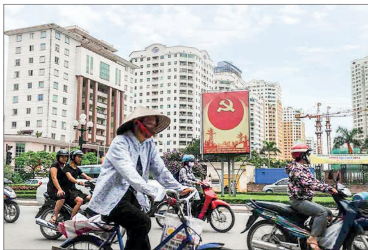
Motorcyclists and cyclists ride on a street inside a newly developed residential quarter in Hanoi.