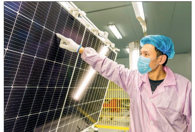
China is excluded as the Commerce Department investigates whether certain Chinese companies are circumventing US customs duties by assembling parts in the four countries. An inspection of solar photovoltaic modules used for small solar panels at a factory in Haian in Jiangsu province.

Monday's actions include invoking the DPA to force the manufacture of clean energy in key areas including solar parts like photovoltaic modules and module components.—AFP