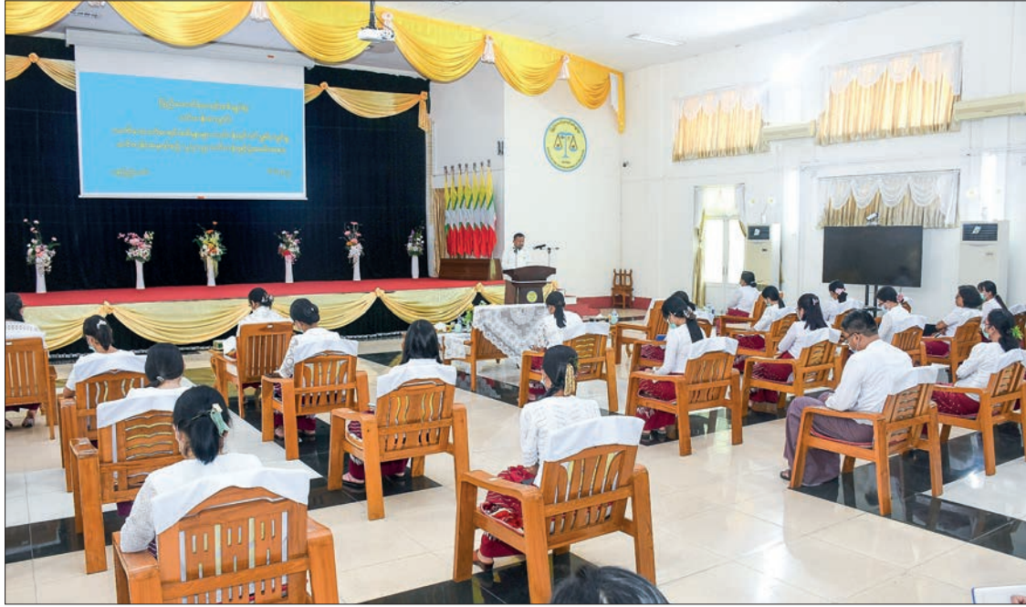
The fresher course 2/2022 for assistant senior auditors is in progress on 6 June in Nay Pyi Taw.

THE opening ceremony of the Fresher Course 2/2022 for Assistant Senior Auditors was held at 2 pm on 6 June at the Assembly Hall of the Office of the Auditor-General of the Union, Nay Pyi Taw, in line with COVID-19 rules and regulations.