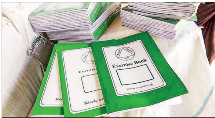
School uniforms and exercise books are seen at one outlet in Yangon.