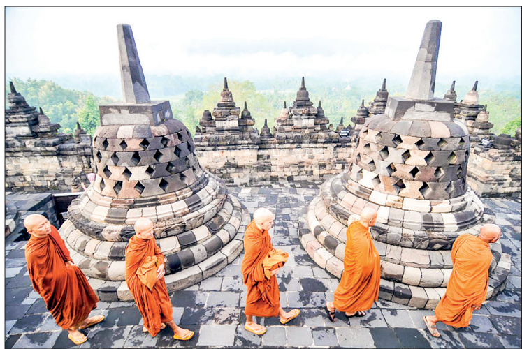
Buddhist monks pray at the Borobudur temple during the Vesak festival in Magelang, Central Java on 6 May 2012. Buddhist devotees in Indonesia celebrated the birth, enlightenment and the passing away of the Buddha.