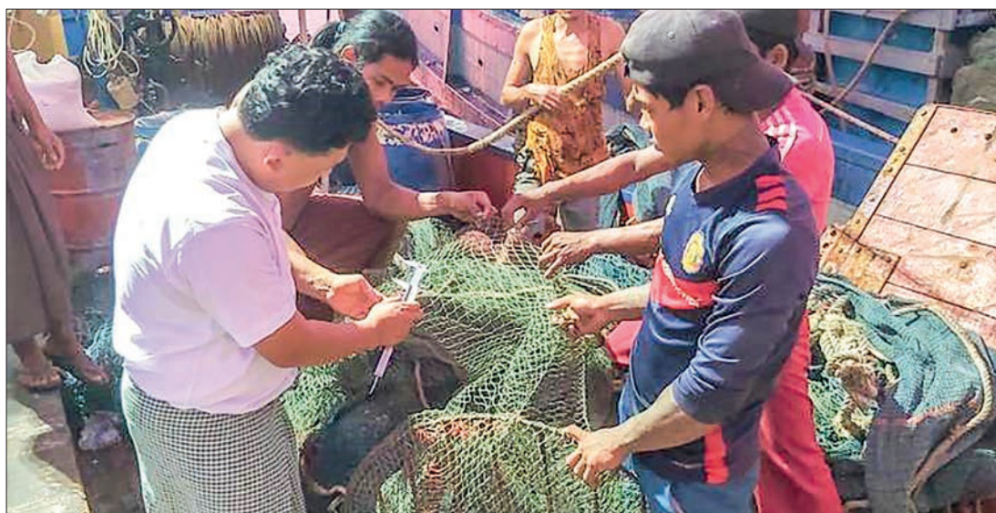
An official inspects the fishing net.

MYANMAR puts a three-month stop to the fishing season in the Myanmar sea and 30 per cent of fishing trawlers are ruled out one month earlier than usual for the local self-sufficiency and export markets. Therefore, fishing businesses that generate foreign income have resumed.