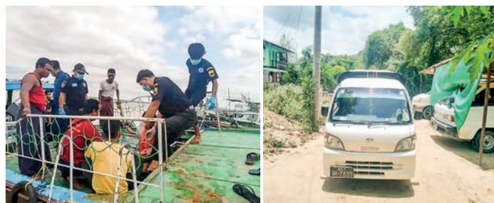
The social welfare volunteers are pictured assisting the victims.

PDF terrorists attacked a pilgrim vehicle for no reason on the way to the Tantkyitaung Pagoda in Pakokku Township, Magway Region, killing a pilgrim yesterday morning.