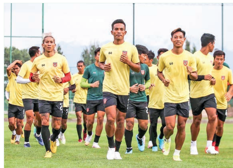
Myanmar team players are training ahead of the 3 rd Round of the Asian Cup Qualifiers in Tajikistan.

divided into six groups, with the top six teams from each of the six groups and the top five runners-up will advance to the next stage. — Ko Nyi Lay/GNLM