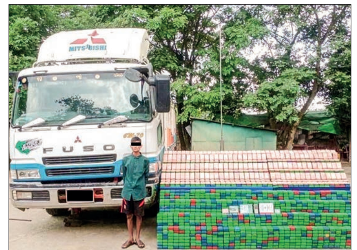
An arrestee is seen together with seized heroin and a lorry.

Narcotic Drugs and Psychotropic Substances Law, the Myanmar Police Force stated. — MNA