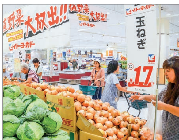
Supermarket chain Ito-Yokado Co.

JAPAN’S household spending fell a real 1.7 per cent in April from a year earlier for a second straight month of decline, government data showed Tuesday, hit by higher food and energy prices that have undermined consumer confidence.