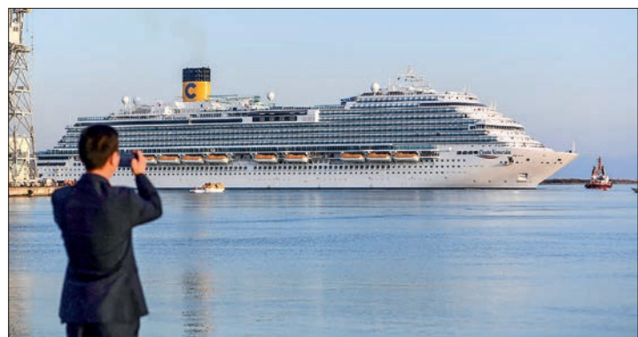
Prior to the pandemic, travel and tourism generated a $53.4 billion trade surplus and supported a million US jobs.

The five-year National Travel and Tourism Strategy will focus on increasing promotion of US destinations, especially to underrepresented sites, and improving communication about health status and requirements.—AFP