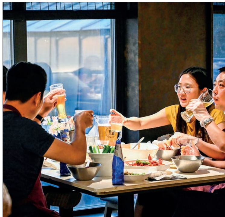
Beijing has relaxed Covid restrictions allowing dine-ins at restaurants after cases fell. PHOTO: JADE GAO/AFP

was initially locked down for two weeks but when she was finally allowed to leave, the nearby subway station was closed.—AFP