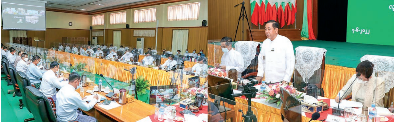
The Rakhine State Stability, Peace and Development Work Coordination Committee meeting 2/2022 is in progress in Nay Pyi Taw yesterday.

First, Union Minister Lt-Gen Tun Tun Naung stressed to accelerate repatriation for those who