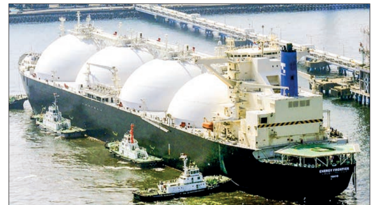
Russian oil and LNG imports account for 3.6 per cent and 8.8 per cent, respectively, of the total imports of oil and LNG, while the country imports 91.7 per cent of its oil from the Middle East, according to the white paper.

The CEOs of Universal Pictures and Fitch are also included in the list.—AFP