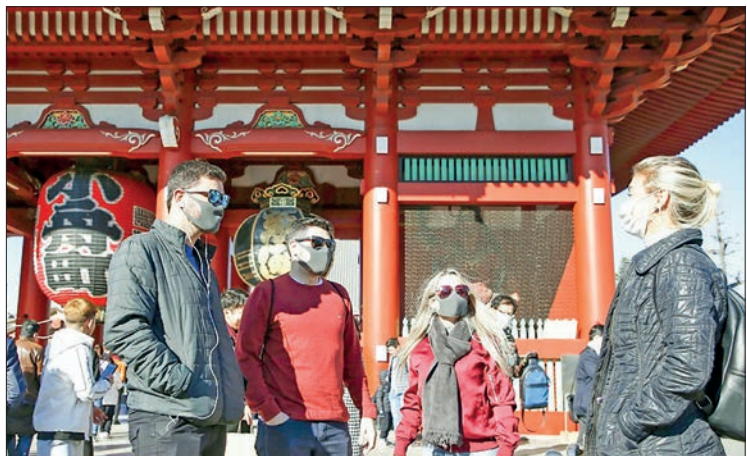
The government said Tuesday it will ask foreign tourists to wear face masks and take out insurance to cover medical expenses in the event they contract COVID-19.

THE government said Tuesday it will ask foreign tourists to wear face masks and take out insurance to cover medical expenses in the event they contract COVID-19 as Japan restarts accepting visitors in stages later this week.