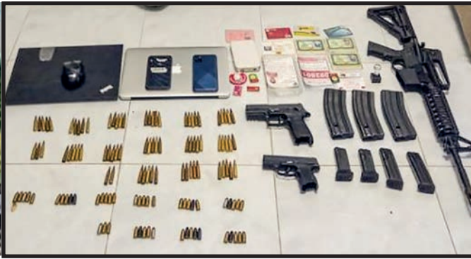
Seized weapons and ammunition.