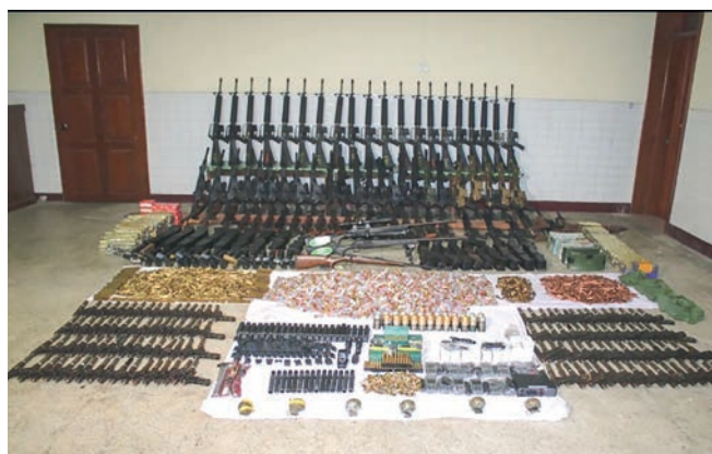
Seized arms and ammunition.