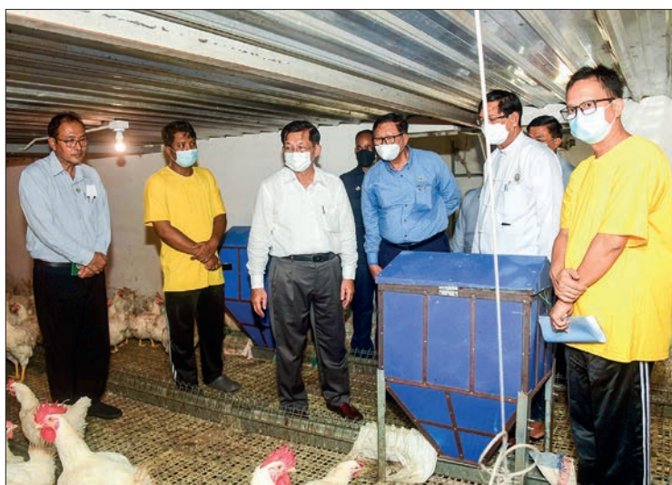
The Senior General views round the organic vegetable plantation and the poultry farm of the CJ Feed Myanmar.

The Senior General and party inspected an organic vegetable plantation being operated by the Agriculture Department and Sein Lan Cooperative Society in the zone and the poultry farm of the CJ Feed Myanmar.