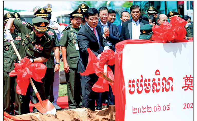
Cambodia's defence minister Tea Banh (L) and China's ambassador to Cambodia Wang Wentian (C) take part in the groundbreaking ceremony at the Ream naval base.

The project, paid for with a Chinese grant, also includes upgrading and expanding a hospital as well as donations of military equipment and repair of eight Cambodian warships, Tea Banh said. "There are allegations that the modernised Ream base will be used by the Chinese military exclusively. No, it is not like that at all," the minister told several hundred people including foreign diplomats at the ceremony.—AFP