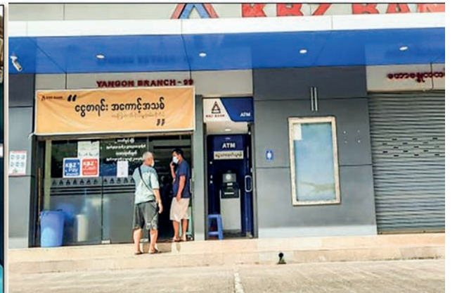
Robbery case at Kanbawza Bank.