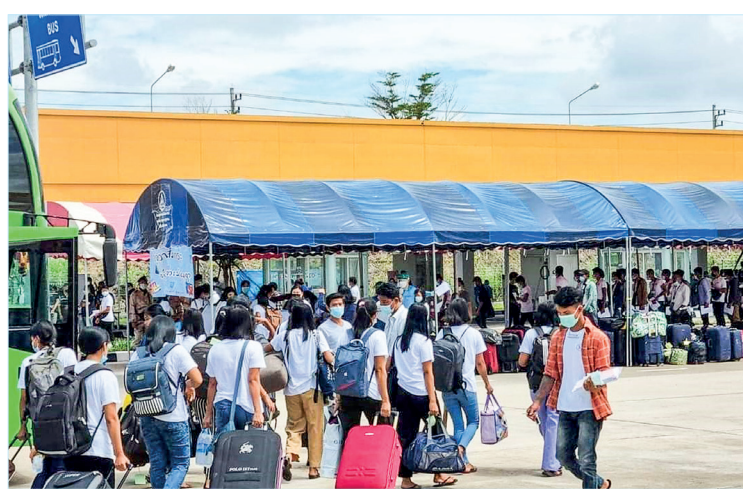
MoU workers are seen at the Myanmar-Thai border.

Although there are Myanmar workers who are entering Thailand through the MoU system, there are also Myanmar nationals who have been arrested for entering the country illegally. Those people came from