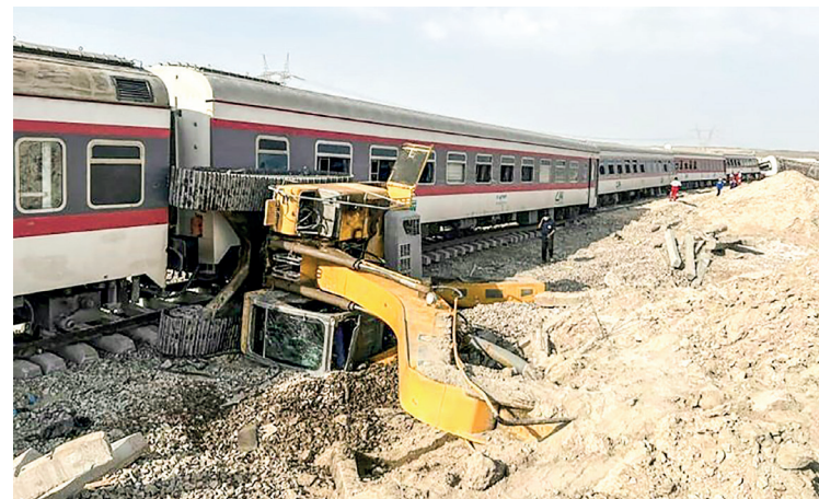
Iranian state media reported that the train derailed after hitting an excavator left too near the tracks.

Five of the train's 11 coaches came off the track in the 5:30 am (0100 GMT) accident, the Iranian Red Crescent's head of emergency operations, Mehdi Valipour, told state television.—AFP