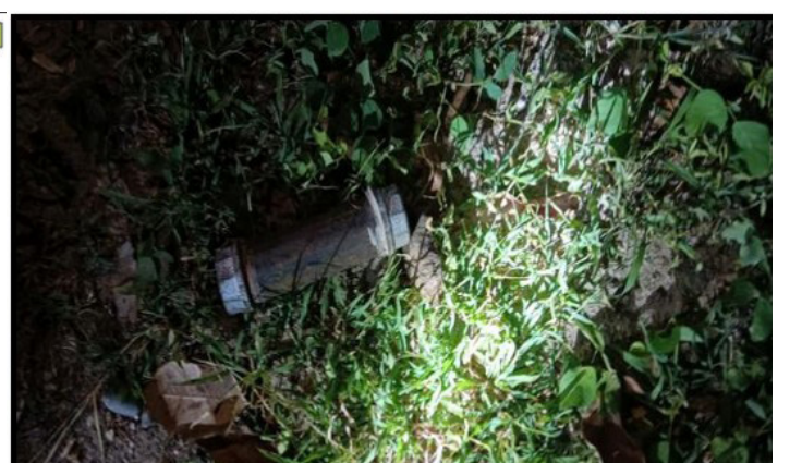
A handmade bomb.