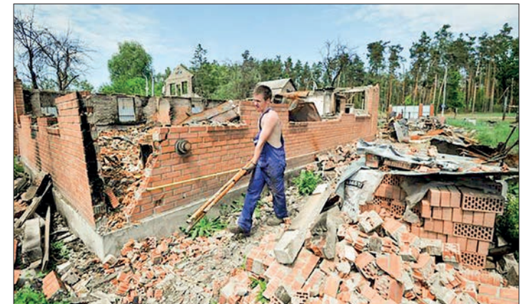
Vladimir Putin's troops have set their sights on capturing eastern Ukraine since Ukrainian forces repelled them from seizing Kyiv. A man cleans up debris of his house destroyed by shelling in the village of Moshchun, Kyiv region, on Thursday on the 99th day of the Russian invasion of Ukraine. PHOTO: AFP

There are also jars of halal borscht soup supplied to Muslim Chechen fighters enlisted by their leader Ramzan Kadyrov, a fierce Vladimir Putin loyalist.—AFP