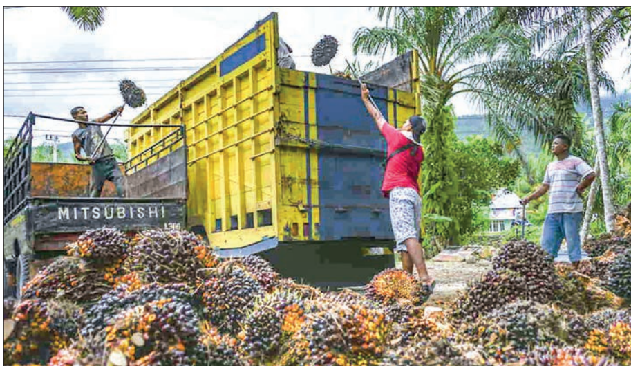
Millions of consumers and small business owners in the world's fourth most populous nation have been rattled for months by skyrocketing cooking oil prices. This photo taken on 16 August 2019 shows workers loading palm oil fruits onto a truck at a plantation in the Nagan Raya district in Aceh province.

But the 49-year-old mother of two would be