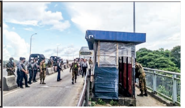
The security force's outpost was attacked on 22 August 2021.