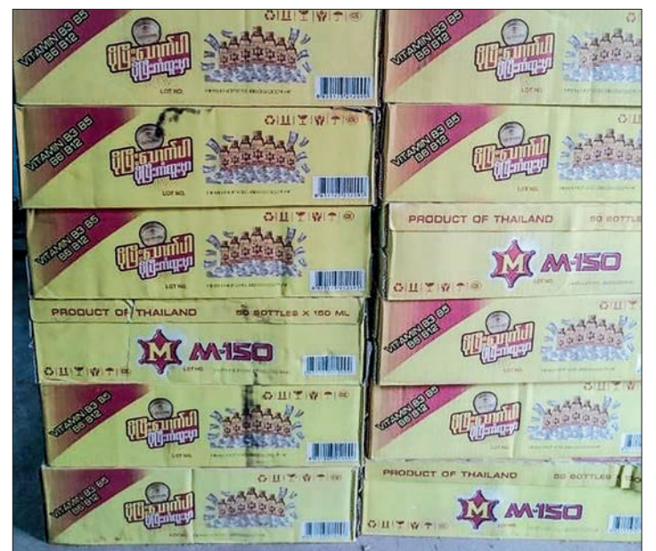
Confiscated commodities at the Mayanchaung Permanent Checkpoint.

Moreover, on the same day, a team led by Police Force captured an unregistered Honda Fit GD car (approximately K1,500,000) in Monywa township and an unregistered Nissan AD Van car at approximately value of K2,000,000 in