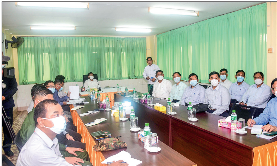
The Senior General hears the report on undertakings of agriculture and livestock farming works of the Nyaungnnapin Agriculture & Livestock Special Zone.