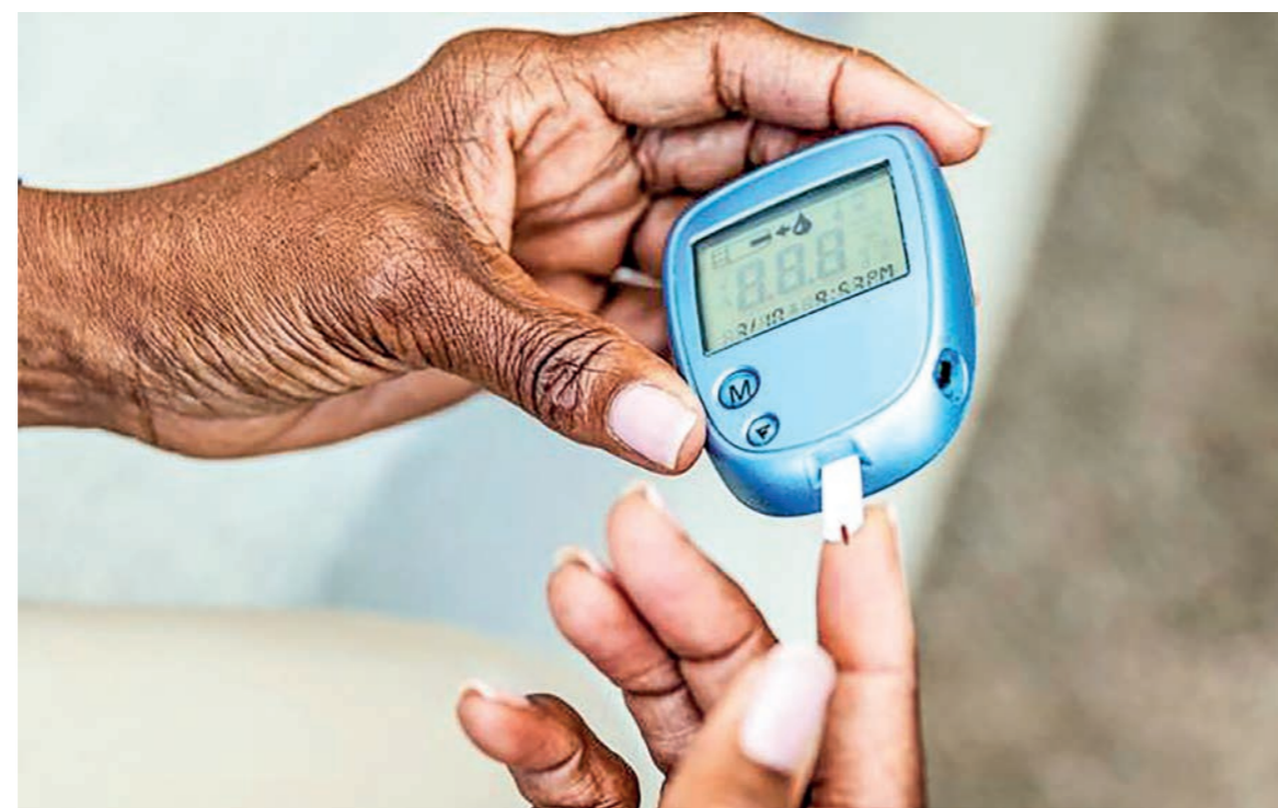
People of all ages can develop type 1 diabetes.

Among those things, being struck by lightning is the most terrible for a person in comparison with other natural disasters from my own viewpoint and therefore every phone user should take good care of thunder and lightning while it is pouring with rain. Lightning conductors must be put on the roofs of their houses for safety first as soon as possible. The danger of floods, storms, snakebites or fevers is found to break out during the rainy season every now and then. We had better keep our natural environment green and clean to prevent that danger as hard as we can afford it. Only if so, will we make our whole environment pleasant every rainy season in the future. I hope that we all look forward to the beautiful rain with the frogs' sweet song of 'Eun-oun' in years to come.