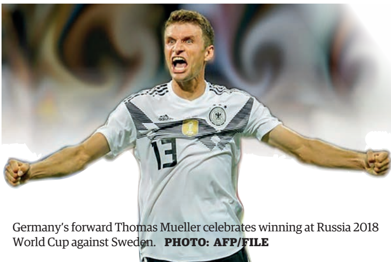
Germany's forward Thomas Mueller celebrates winning at Russia 2018 World Cup against Sweden.

THOMAS Mueller says Germany must be more consistent and score wins over the top nations if they are to be considered among the favourites for the looming World Cup finals. A Harry Kane penalty two minutes from time at Munich's Allianz Arena saw England snatch a 1-1 draw with Germa-