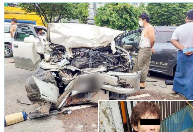
One damaged vehicle and one suspect are seen after the collision.

The South Okkalapa police station opened a case against the perpetrator of the accident. There are 2,849 non-compliance with traffic rules cases in Yangon Region in May. — TWA/GNLM