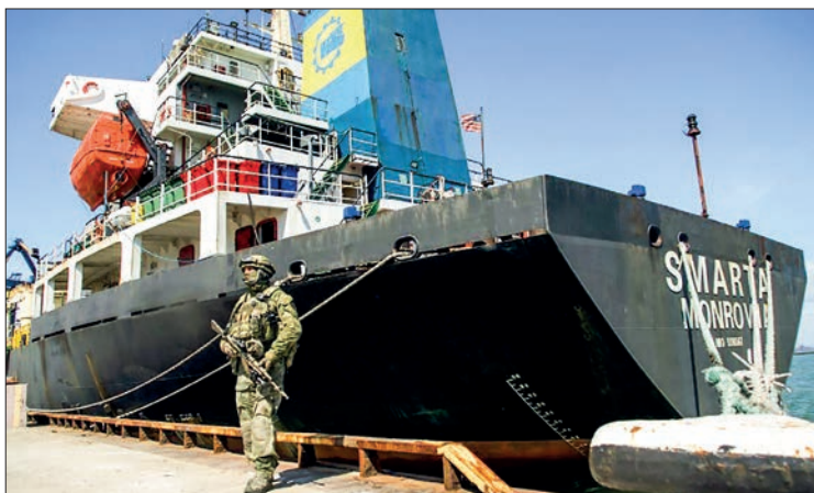
Russian serviceman stands guard in the port of Mariupol on 29 April 2022, amid the ongoing Russian military action in Ukraine.