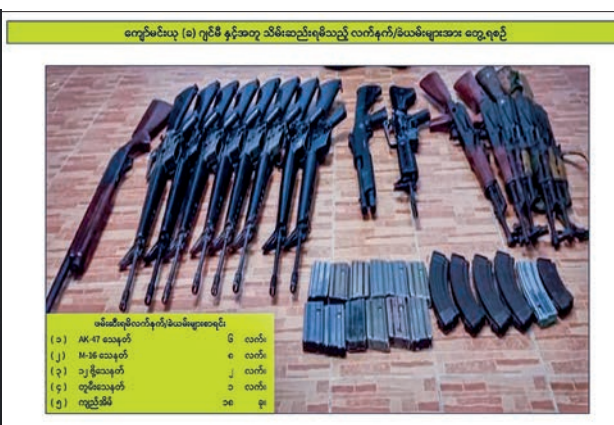
Seized weapons and ammunition.