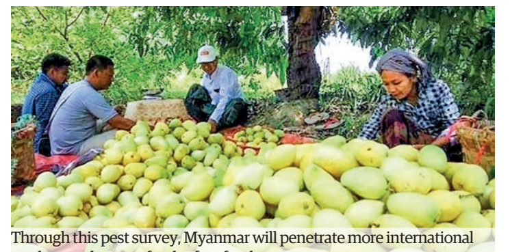
Through this pest survey, Myanmar will penetrate more international markets and ensure food safety for the consumers.

Through this pest survey, Myanmar will penetrate more international markets and ensure food safety for the consumers. If mango farms can achieve pest management in the coming years, mango quality will be improved.