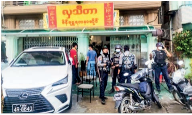
Robbery at the gold jewellery outlet.