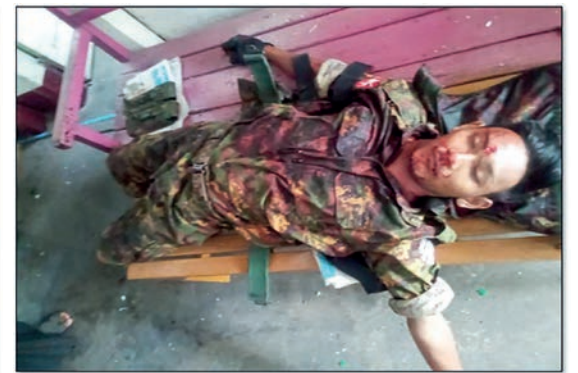
A security forces member was killed on 21 May 2021.