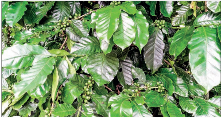
The Natyaykan coffee farm in Ngaphe Township produces 2.8 tonnes of coffee seeds and the private farms produce approximately 43 tonnes, totalling over 45 tonnes.

LOCALS engaged in Vietnamese highland coffee plantation (Arabica coffee) on 1,066 acres in Ngaphe Township, Minbu District, Magway Region, which is suitable to the climate, reap success.