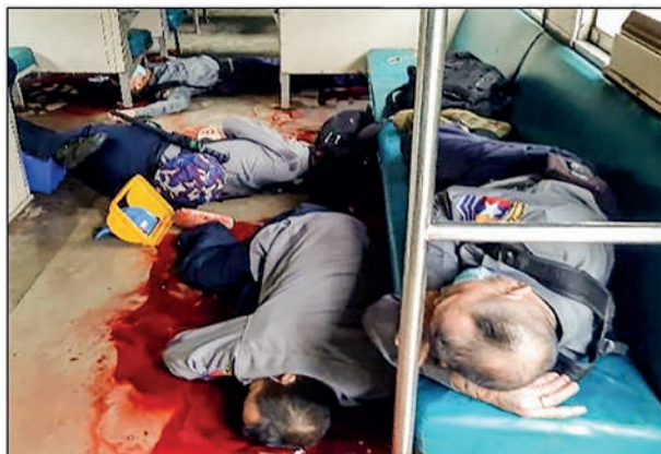
Police members were attacked on the circular train on 14 August 2021.