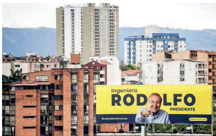
Rodolfo Hernandez will face leftist Gustavo Petro in a 19 June runoff for the Colombian presidency.

RODOLFO Hernandez, a millionaire businessman and ex-mayor under investigation for corruption, has made poverty and government graft the