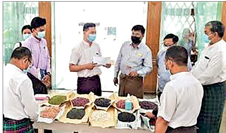
Pulses and beans traders are pictured evaluating beans and pulses.

Myanmar growers have a cost burden of agricultural inputs as the prices nearly doubled and tripled this year. As a result of this, only a small profit is generated for the growers. Despite the increase in the black gram demand, supply is pretty low at the moment. Consequently, the black