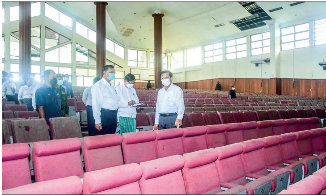
SAC Chairman Prime Minister Senior General Min Aung Hlaing inspects the Pyidaungsu Hall where National Convention was convened to draw the Constitution (2008) in Hlegu Township of Yangon Region yesterday.

After hearing the report, the Senior General said that these were historic buildings where the Constitution (2008) which is important for the State was drawn. These historic buildings