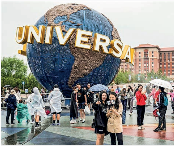
After more than a month of pandemic-related restrictions, Beijing began a return to normal on Monday. The Universal Beijing Resort said on 7 June it will resume operations on 15 June in a phased approach.

number of visitors at no more than 75 per cent of maximum capacity.