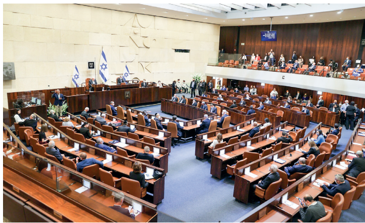
The Plenary Hall during the swearing-in ceremony of the 24th Knesset in Jerusalem, 6 April 2021.

Their rebellion does not for the moment call into question the continuation of Israeli law