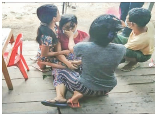
One innocent civilian was attacked on 5 August 2021.

He kept the arms and ammunition at houses, for CRPH, NUG and PDF which were declared terrorist groups with Order No (2/2021) of the Anti-Terrorism Central Committee of the Republic of the Union of Myanmar, launched bomb attacks in Yangon by leading 20 terrorist groups, instructed to attack security outposts, police stations, departmental offices and stations, kill the innocent civilians, and so the Martial Law tribunal was organized on 21 January 2022 and ordered the death sentence under the Counter-Terrorism Law Section 49 (a), 50 (i) and 50 (j). — MNA