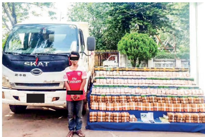
An arrestee is pictured along with seized drugs.

According to the investigation, the suspect admitted the seized drugs to be carried from Shan State (North) to Mandalay Region. Police are investigating and he is being prosecuted under the Narcotic Drugs and Psychotropic Substances Law, the Myanmar Police Force stated. — MNA