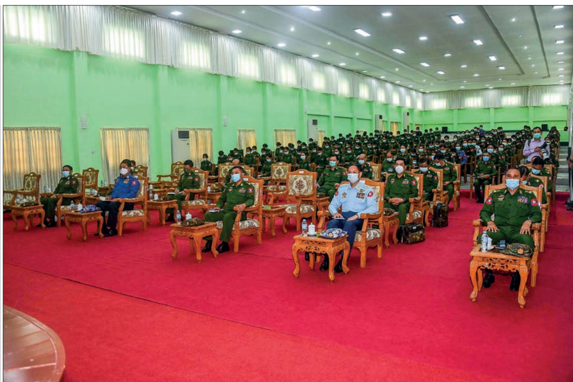
State Administration Council Chairman Commander-in-Chief of Defence Services Senior General Min Aung Hlaing meets senior officer instructors and female cadets from the Defence Services (Army) Officer Training School (Hmawby) in Hmawby Township of Yangon Region yesterday.

A LL the persons serving duties at the Tatmadaw of their own accord are discharging duties with patriotic spirit. As they joined the Tatmadaw of their own accord without exhortation of anyone, they have to take pride in their souls. As