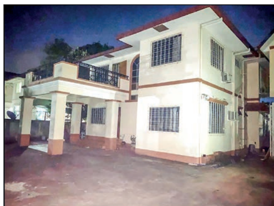
The residence where Jimmy was arrested.