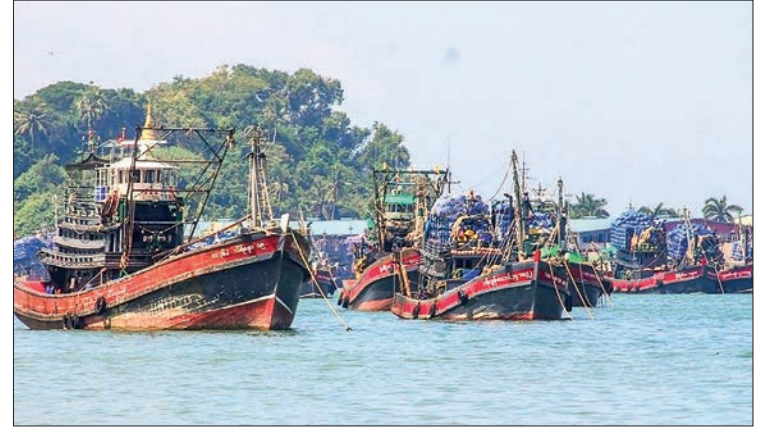
In a bid to conduct surveillance of the offshore fishing vessels in Kawthoung District, the VMS devices have been located in Myeik, Taninthayi Region, Yangon Region, Rakhine State and Mon State and Nay Pyi Taw.

“The fishing boats are allowed to go after the inspections. The inspection teams check the boatmen, boat, materials and other machines, especially TED and VMS. The onshore marine