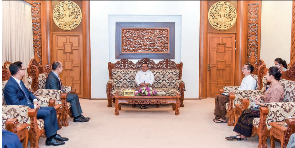
The MoFA Union Minister receives the Cambodian delegation in Nay Pyi Taw yesterday.

Dr Kung Phoak expressed Cambodia's view to have constructive engagement but not isolation on the issues of Myanmar upholding the principle of non-interference in one country's internal affairs. He then mentioned that Cambodia