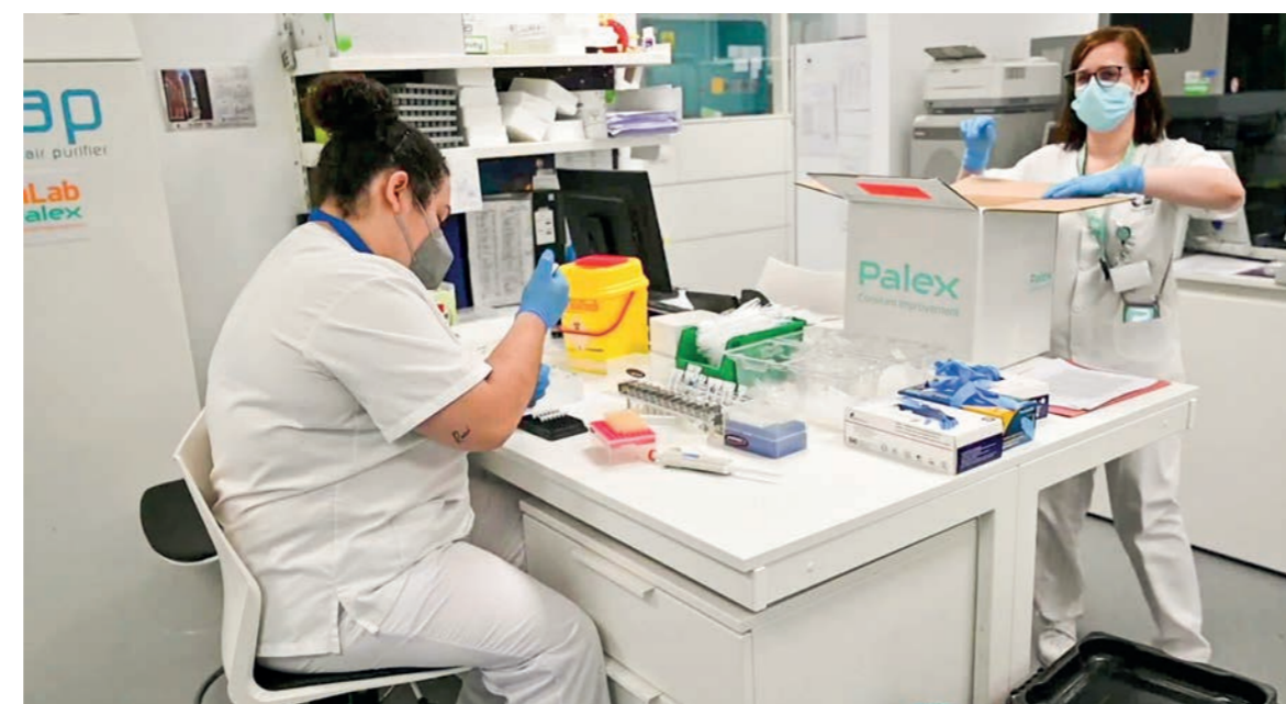
Madrid on 2 June 2022 begins PCR testing for monkeypox as cases peak.

"There are a few reports now of cases amongst women...at the moment there is still a window of opportunity to prevent the onward spread of monkeypox in those who