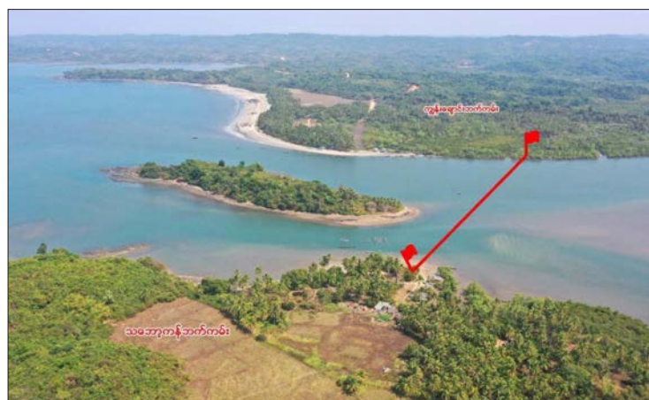
An aerial view shows the location of the Thabot Kan Bridge on Shwethaungyan-Magyizin section.

mini-budget period. In the 2022-2023FY, it will spend K1,000 million of the Union budget for the construction of Abutment A1Cap, Abutment Body, P1, P2, P3, P4 and P5 and Cap, said the in charge of the bridge project. The new bridge will bring a lot of benefits to the locals regarding their transport and trading of rice, paddy, meat/fish and crops. It can also develop trade flows and socio-economic status. Moreover, there will be easy access to Gawrangyi Island, Ngwe-saung, Chaungtha and Shwethaungyan beaches bringing new job opportunities to locals to increase their incomes, the Ministry of Construction.—Pwint Thitsa/GNLM