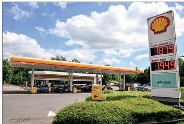
Johnson came under new pressure as the price of filling up the average family car surpassed £100.

The scale of the inflationary crisis hitting