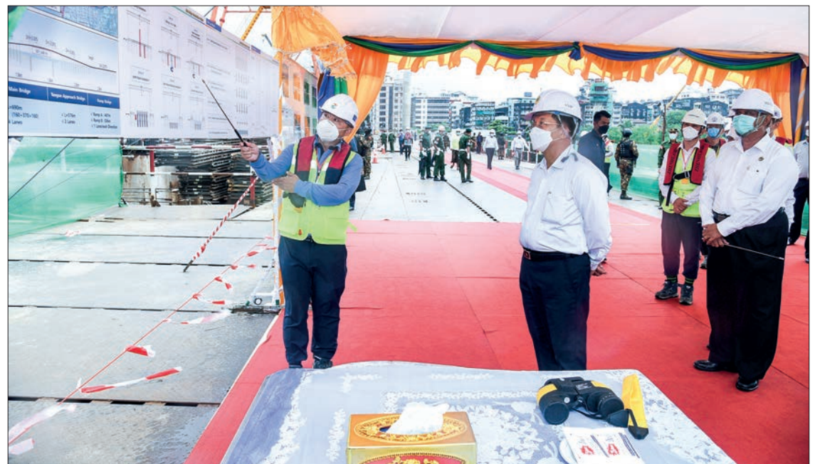
The Senior General hears the report on the progress of the project implementation.

In his goodwill visit to the Republic of Korea in 2012, President U Thein Sein discussed the implementation of a Myanmar-Korea Friendship Bridge construction project in Myanmar with his counterpart. The project commenced in 2013 and construction started in 2015. It will be on a cable-stayed bridge. Upon completion, the bridge will help local people from Yangon have easy access to Dala, Twantay, Kawhmu and Kungyangon townships, lessening the traffic congestion of Yangon to some extent. — MNA