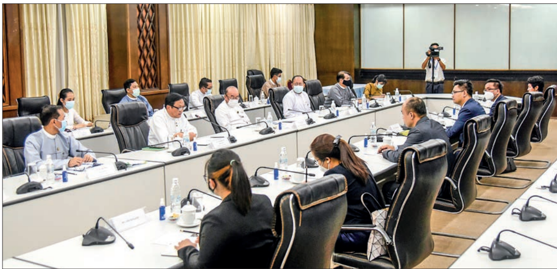
The meeting between the members of the Task Force and the Cambodian delegation is in progress.

MEMBERS of the Task Force for the facilitation of ASEAN Humanitarian Assistance to Myanmar through the AHA Centre; U Kyaw Myo Htut, Deputy Minister of the Ministry of Foreign Affairs, Dr Aye Htun, Deputy Minister of the Ministry of Health and U Aung Tun Khaing, Deputy Minister of the Ministry of Social Welfare, Relief and Resettlement met a Cambodian delegation led by Dr Kung Phoak, Secretary of State of the Ministry of Foreign Affairs and International Cooperation and Head of the office of the Special Envoy of the ASEAN Chair on 9 June 2022 at the Ministry of Foreign Affairs in Nay Pyi Taw.