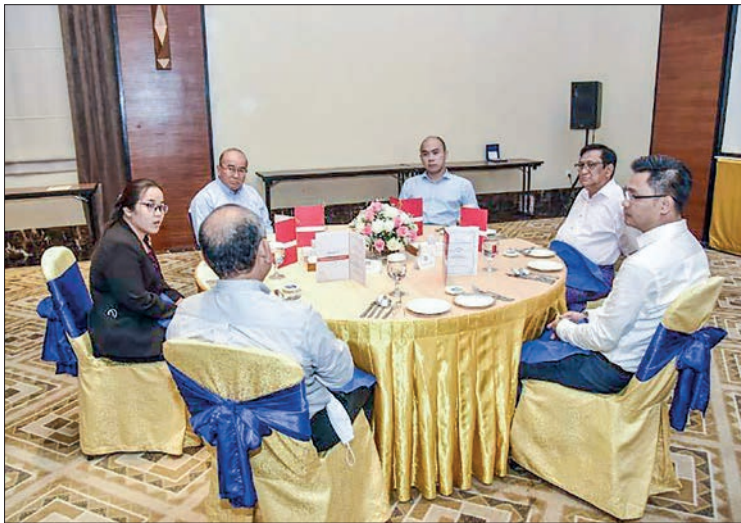
The Cambodian delegation attends the dinner hosted by the MoFA deputy minister.

U Kyaw Myo Htut, Deputy Minister of the Ministry of Foreign Affairs hosted dinner for the Cambodian delegation led by Dr Kung Phoak, Secretary of State of the Ministry of Foreign