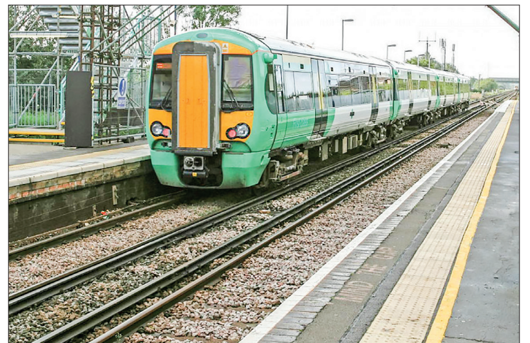
The strikes are planned for 21, 23 and 25 June, the biggest dispute on Britain's railway network since 1989, according to the RMT.

Countries around the world are being hit by decades-high inflation as the Ukraine war and the lifting of Covid-19 lockdowns fuel energy and food prices. Britain's annual inflation rate has surged