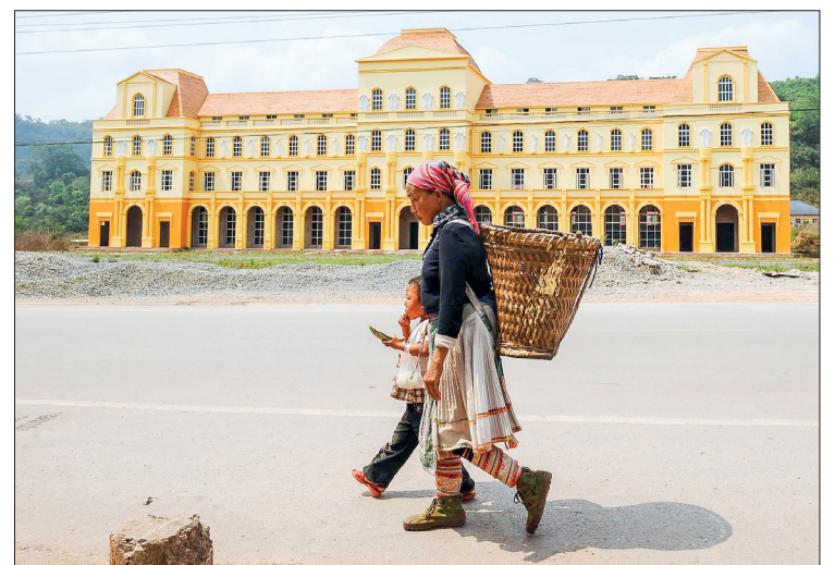
A Lao Hmong hill tribe woman and her daughter walk down a street in the Lao border town of Boten, a special economic zone being developed by China in the northern province of Luang Namtha.

The decision is aimed at ensuring the financial liquidity of the banking system and minimizing