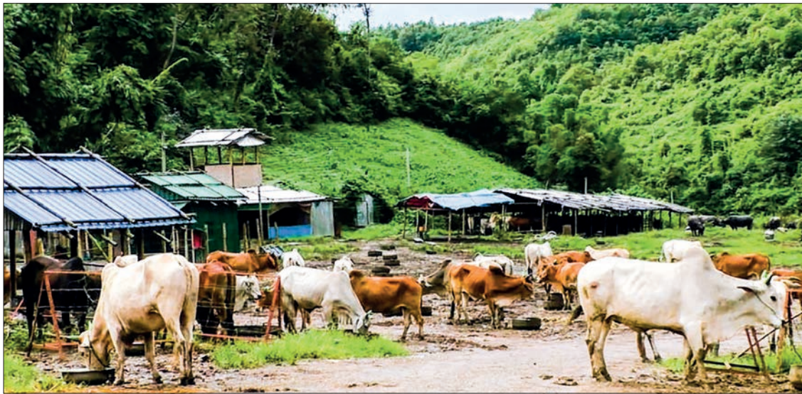
The value of animal product exports dropped by $100 million in the 2019-2020FY as against a year-ago period, following the negative impacts of the COVID-19.

For legitimate trade, China permits live cattle import only after ensuring the cattle are free from 20 diseases including foot and mouth disease, along with vaccination certificates, health