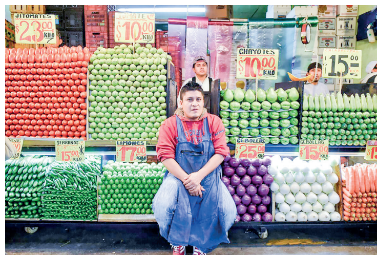
A fruit vendor poses for a picture at the "Central de Abasto" wholesale market in Mexico City.

Crude oil has now reached over 120 US dollars per barrel and energy prices overall are expected to rise by 50 per cent in 2022 relative to in 2021. Fertilizer prices are more than double the 2000-2020 average.—AFP