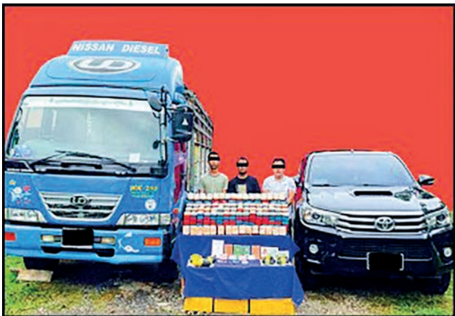
Three arrestees are seen along with seized drugs and vehicles.

MARIJUANA, opium and heroin were seized in Mohnyin, Botahtaung and Ywangan townships, according to the Myanmar Police Force.