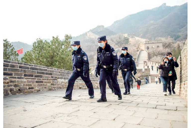
Members of the female police force of Badaling Police Station patrol on the Badaling Great Wall in Beijing, capital of China, 7 March 2021.

to fully mobilizing the enthusiasm of the general public to support and assist in national security work, widely rallying the hearts, morale, wisdom and strength of the people," a ministry representative told Legal Daily. Beijing has increasingly encouraged the public to be vigilant against perceived national security violations, including teaching children to be on the lookout for supposed threats to the country—AFP