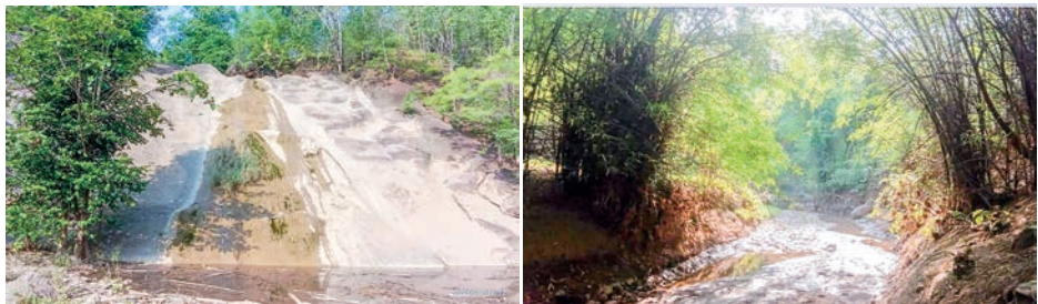
Kyaukgatin waterfall and pagodas, located near the Mann Shweseztaw Pagoda in Minbu (Sagu) Township, Magway Region, are going to capture tourists with delightful beauty.