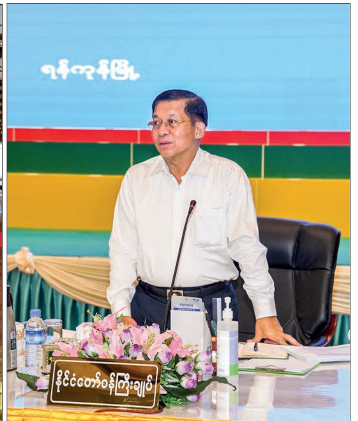
State Administration Council Chairman Prime Minister Senior General Min Aung Hlaing meets the Yangon regional cabinet ministers and officials in Yangon on 9 June 2022.

T HE prosperity of the nation and food sufficiency is a national vision of the country, said Chairman of the State Administration Council Prime Minister Senior General Min Aung Hlaing in a meeting