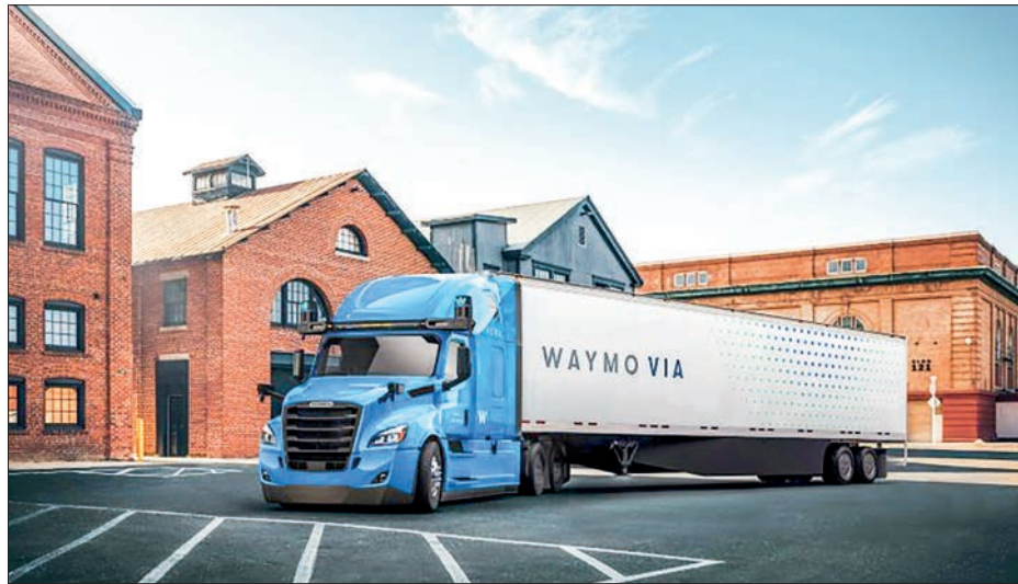
A vision for the future of logistics includes self-driving trucks like this one pictured by Alphabet-owned Waymo handling the long-hauls then ceding cargo to humans for the local legs to destinations.

work of shippers, carriers, and marketplace technology is a great match for the