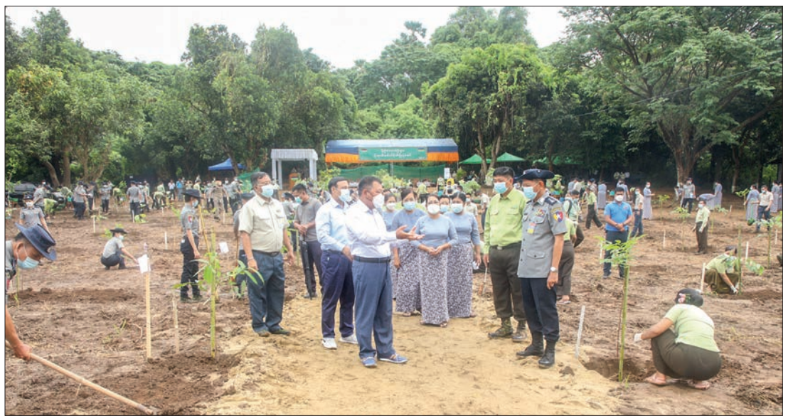
The MoHA Union Minister participates in the monsoon tree-growing ceremony 2022 in Nay Pyi Taw yesterday.

The ministry's affiliated departments grew a total of 42,099 perennial and shade plants in the office compounds across the nation to date. —MNA