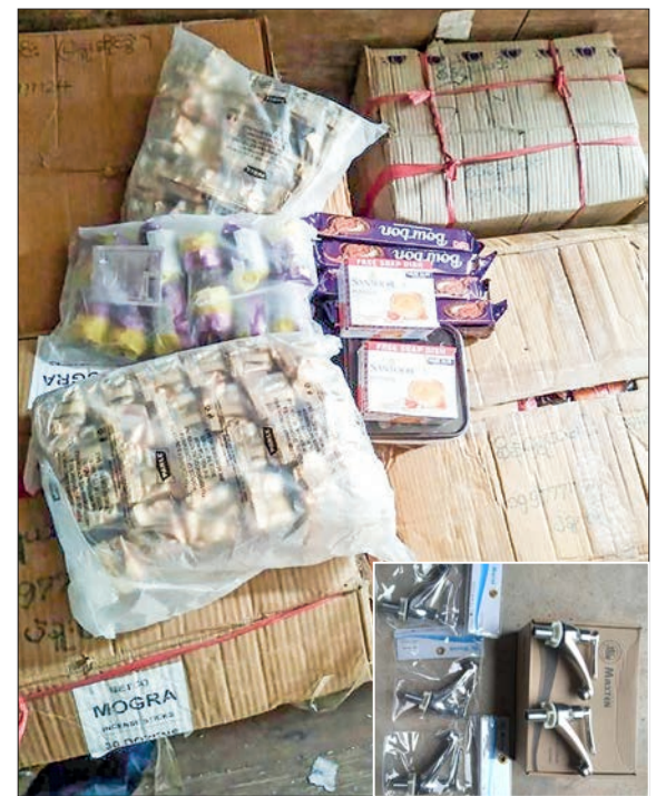
Seized illegal commodities.

Moreover, on the same day, a team led by the General Administration Department made inspections and confiscated illegal consumer