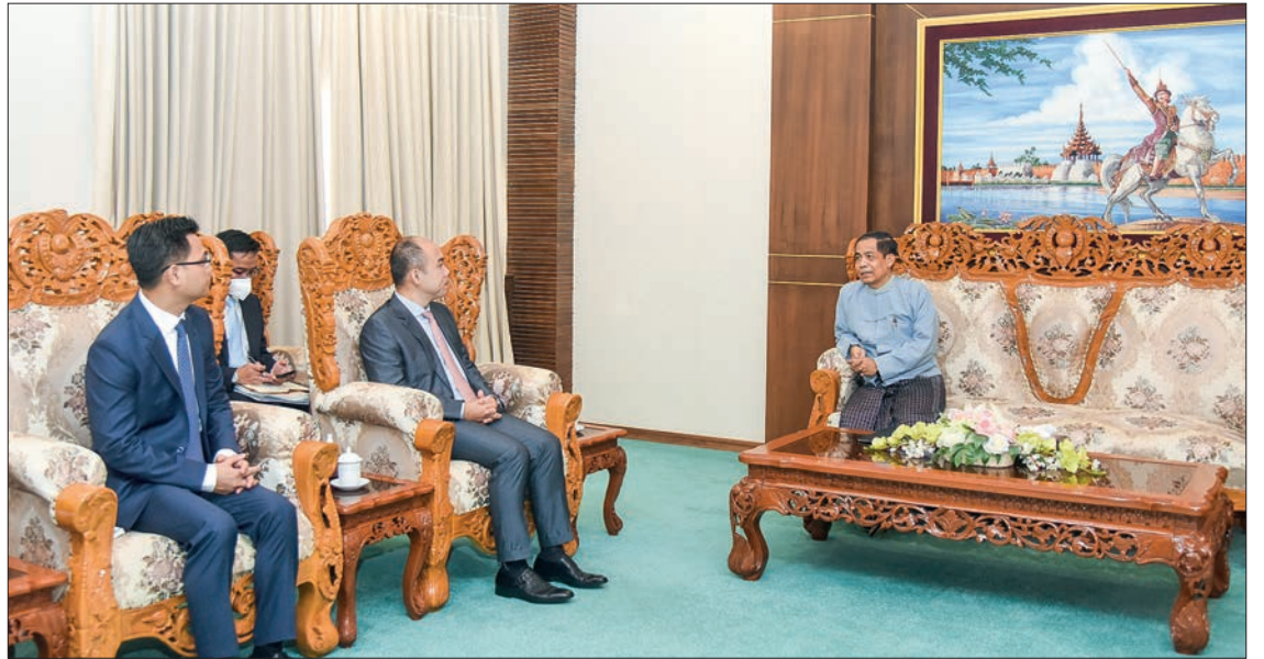
The MoIC Union Minister receives the Cambodian delegation.

The Union minister explained that the provision of humanitarian assistance to Myanmar is necessary to be feasible and implementable. He then reaffirmed Myanmar's commitment to realize the outcomes of the Consultative Meetings in accordance with the rules and regulations of the Republic of the Union of Myanmar as well as to facilitate the distribution of assistance to those needy people without discrimination including Ethnic Armed Organizations. — MNA