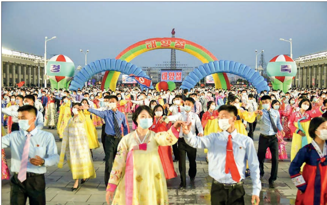
Students and youth attend a dancing party in celebration of the 110th birth anniversary of President Kim Il Sung, known as 'Day of the Sun', at Kim Il Sung Square in Pyongyang on 15 April 2022.

CHINA and Russia took aim at the United States during a landmark UN General Assembly session on Wednesday, accusing Washington of stoking tensions on the Korean Peninsula.