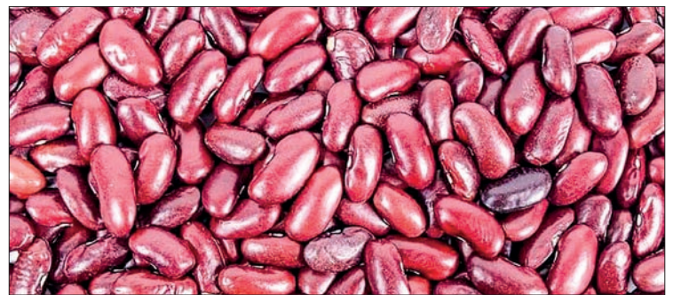
The red beans are cultivated both in monsoon and winter seasons. The cultivation of the beans has been moved to alluvial soil since four or five years ago to reap the high yield.

THE price of red kidney beans ( Phaseolus vulgaris ) increased by over K10,000 per basket in early June 2022 on the back of robust China demand. High price prompted the traders keeping the stocks of kidney bean in hands to sell them, said U Tin Ko Ko, a trader from Monywa city.