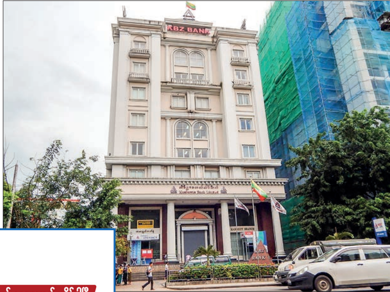
An advert of KBZ Bank ATMs reopening for the withdrawal of banknotes.

The announcement also said that the list of the expanded ATMs which can issue cash will be announced in a timely manner.