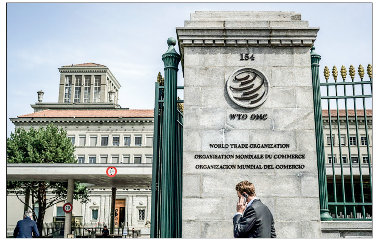
Ministers from World Trade Organization member states are gathering in the global trade body's home city of Geneva, Switzerland hoping to breathe new life into the crippled organisation.