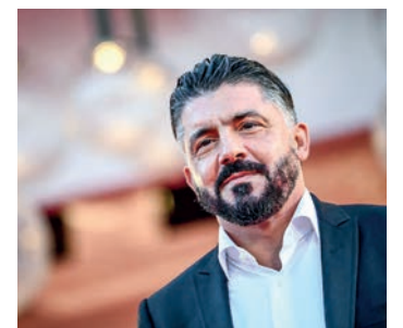
Gennaro Gattuso has been confirmed as the new coach of Valencia, the La Liga side announced on Thursday.

He was sacked as Napoli boss at the end of the 2020-21