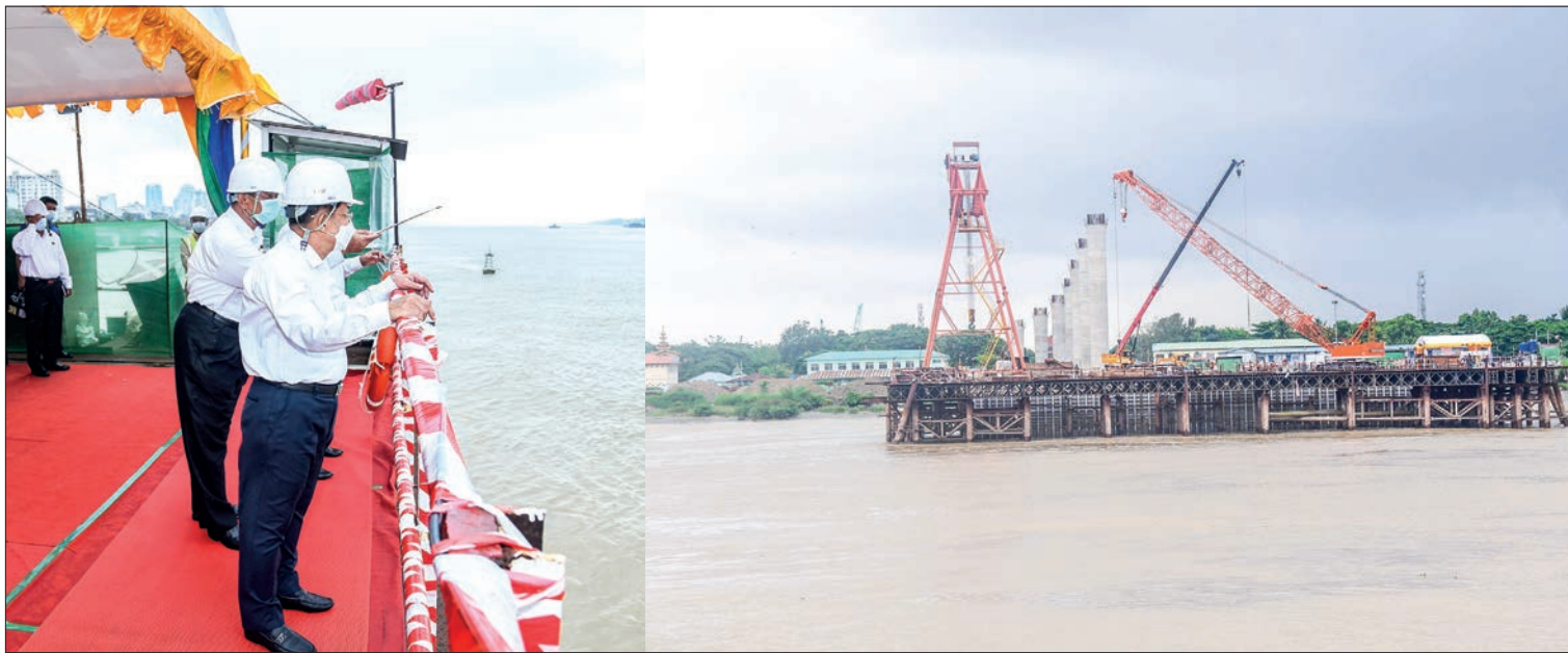
The Senior General inspects the construction of main bridge pylon 2 on Yangon bank of the project site.