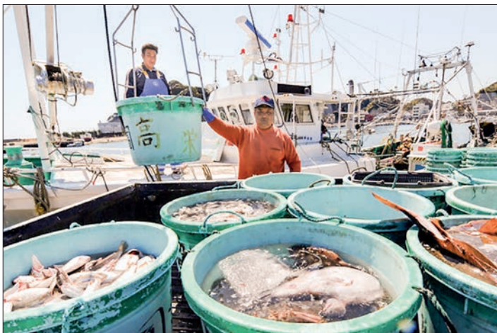
Fishermen unload their catch at the Hirakata fish market in Kitaibaraki, Ibaraki prefecture, Japan.

JAPAN has lodged a protest against Russia for suspending a safe fishing agreement to prevent Japanese fishing vessels from being seized by Russian authorities in seas near disputed islands off Hokkaido, a government official said Wednesday.