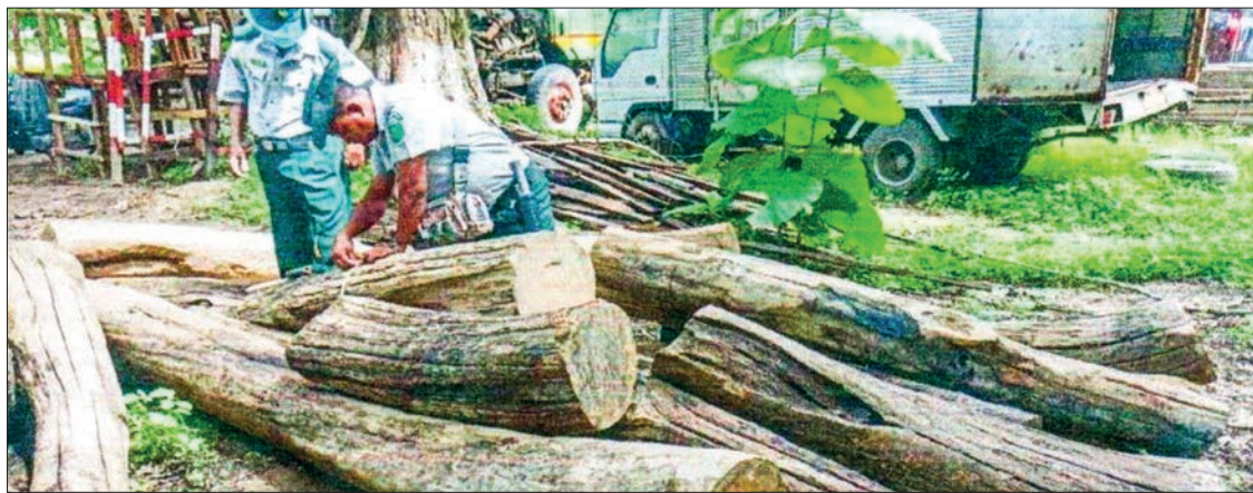
Officials confiscate illegal teak logs.

tonnes of illegal Taungthayart timbers at an estimated value of K300,132 from a truck (approximately K30 million) were