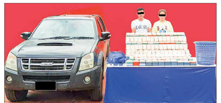
Two arrestees are pictured along with seized drugs and vehicle.

On the same day, a combined team consisting of members of the Anti-Drug Police Force stopped and examined a Mazda Familia passenger vehicle at the Thanywa Checkpoint near Kin Village, Kyauk-