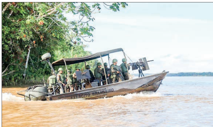
Brazilian soldiers participating in the search for Phillips and Pereira on Tuesday.