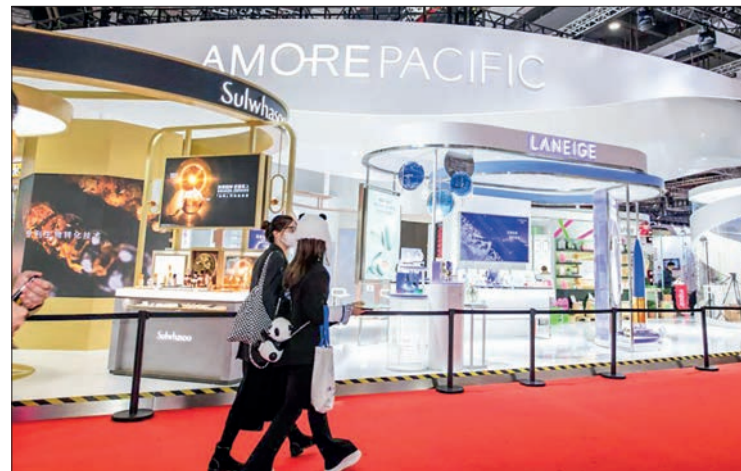
Photo taken on 8 November 2021 shows the booth of Amore Pacific of South Korea at the 4th China International Import Expo (CIIE) in east China's Shanghai. Amorepacific Corporation is a South Korean beauty and cosmetics chaebol, operating more than 30 beauty, personal care, and health brands including Sulwhasoo, Laneige, Mamonde, Etude, AMOREPACIFIC and innisfree.

SOUTH Korea's overseas direct investment more than doubled in the first quarter due to the alleviated COVID-19 pandemic, finance ministry data showed