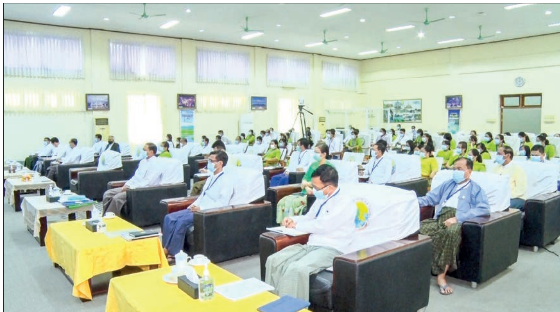
The launching event of the Travel Safe Application is in progress.

Speaking at the event, the Union minister said the international flights were allowed to resume on 17 April and the business visa applications on 20 May. The safety and health issues of travellers are cru-