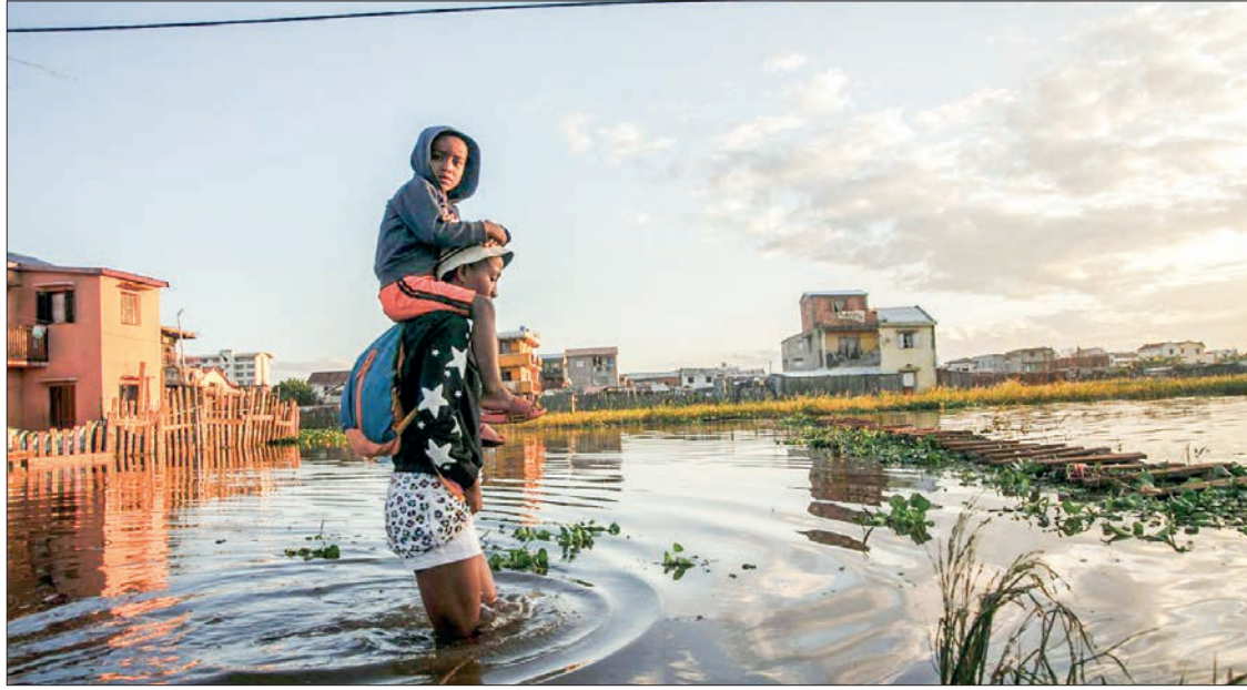
Campaigners say the poorest are shouldering the greatest economic burden for the impacts of climate change. Residents walk in a flooded area of the 67-hectare Ankasina neighbourhood in Antananarivo, Madagascar, following a severe storm on on 28 January 2022.

DEVELOPING countries voiced “disappointment” as climate talks in Germany ended Thursday with frustrations flaring over a lack of momentum on helping vulnerable nations cope with the impacts of warming.