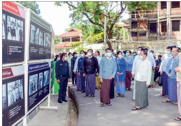
MoRAC Union Minister U Ko Ko inspects the preparation work.

The Union minister and party inspected the preparations being carried out at City Hall, the Secretariat (former Ministers' Office), Bogyoke Aung San Museum and Martyrs' Mausoleum. —MNA