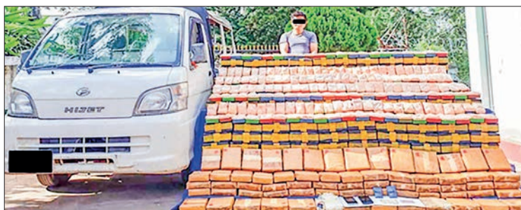
The suspect is pictured along with seized drugs.

He is prosecuted under the Narcotic Drugs and Psychotropic Substances Law and Police are carrying out the investigations to seize the traffickers, the Myanmar Police Force stated. — MNA