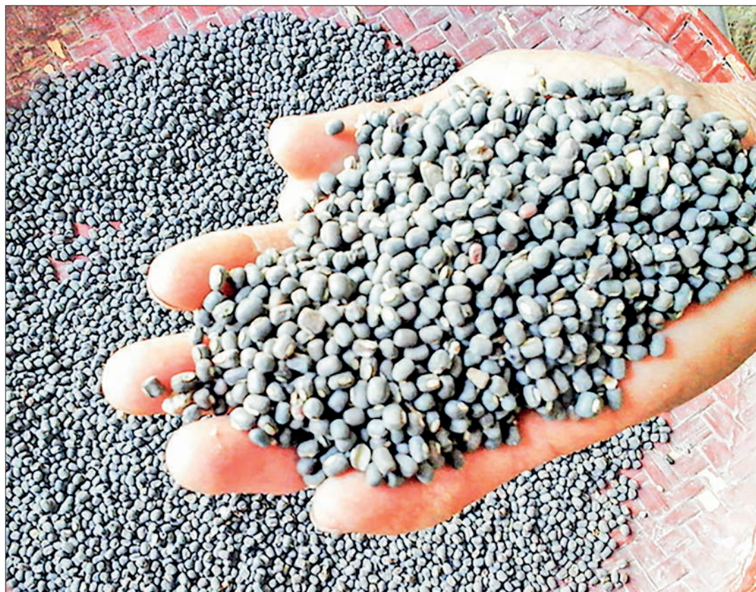
Black gram (Urad Dal) is being sold in the market.

crops among the summer paddy, chilli and black gram after the harvesting period of monsoon paddy, the merchants said. — TWA/GNLM