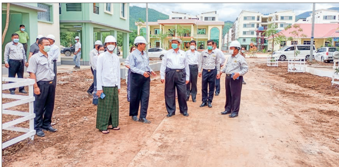
MoC Union Minister U Shwe Lay and party inspect the Mingala Yankin Public Rental Housing Project in Mandalay Region yesterday.

Ninety per cent of the 91 buildings are completed, officials said. —MNA