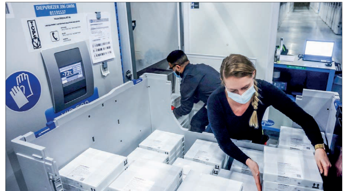
Employees put Pfizer-BioNtech COVID-19 vaccines in a freezer at the Pfizer factory in Puurs, Belgium, on 22 February.

And while vaccine doses were scarce early in the pandemic, that is no longer the case.