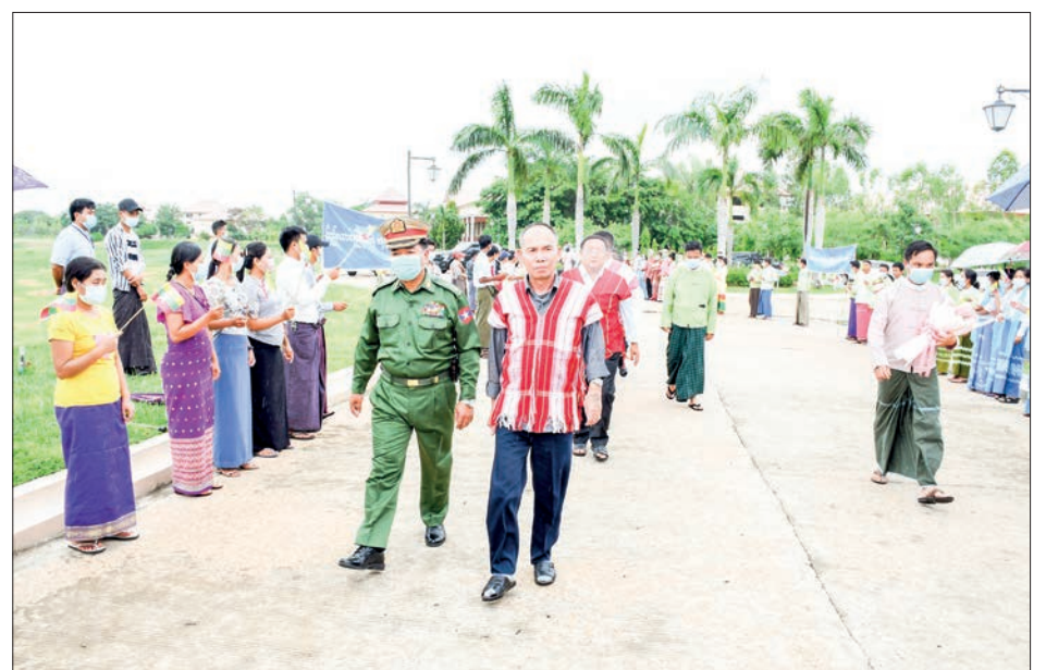
The DKBA peace delegation is welcomed on arrival at Nay Pyi Taw.

of the National Solidarity and Peacemaking Negotiation Committee and ethnic people from the Department of Fine Arts, Ministry of Religious Affairs and Culture, department staff, and local people who want peace holding Myanmar miniature flags and placards bearing, "Perpetual peace is the real aspiration of the people", "Achieving peace is the true desire of all citizens", "Let's hold talks for peace in the Union", "Only the ethnic nationalities are in unity, stability, peace and tranquillity will be achieved". — MNA