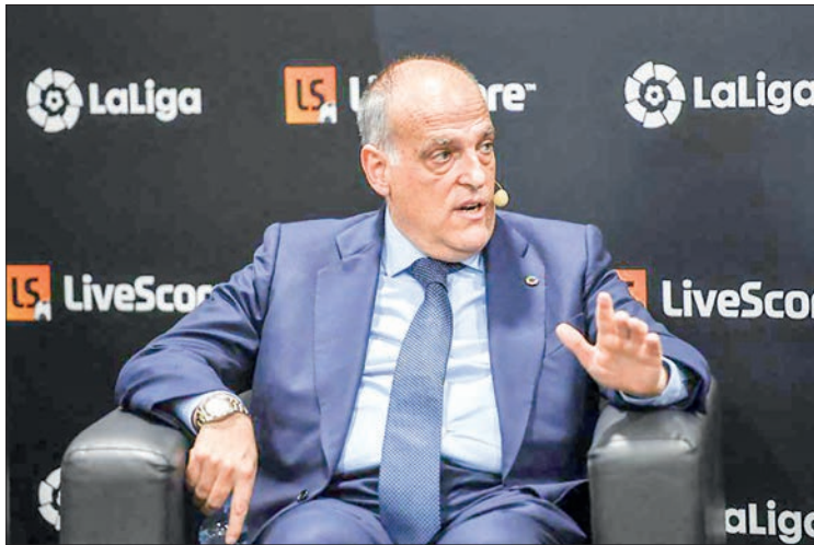
La Liga confirmed on Wednesday it has filed complaints to UEFA about Paris Saint-Germain and Manchester City “continuously breaching the current regulations of financial fair play”.

La Liga confirmed on Wednesday it has filed complaints to UEFA about Paris Saint-Germain and Manchester City “continuously breaching the current regulations of financial fair play”.