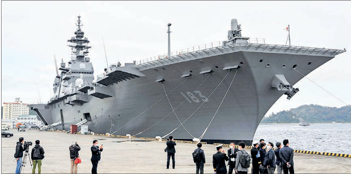
Photo taken 8 November 2021, shows the Izumo helicopter carrier at the Japan Maritime Self-Defence Force's base in Yokosuka, south of Tokyo.

JAPAN has dispatched a Maritime Self-Defence Force flotilla on a deployment to 11 Indo-Pacific countries and one foreign