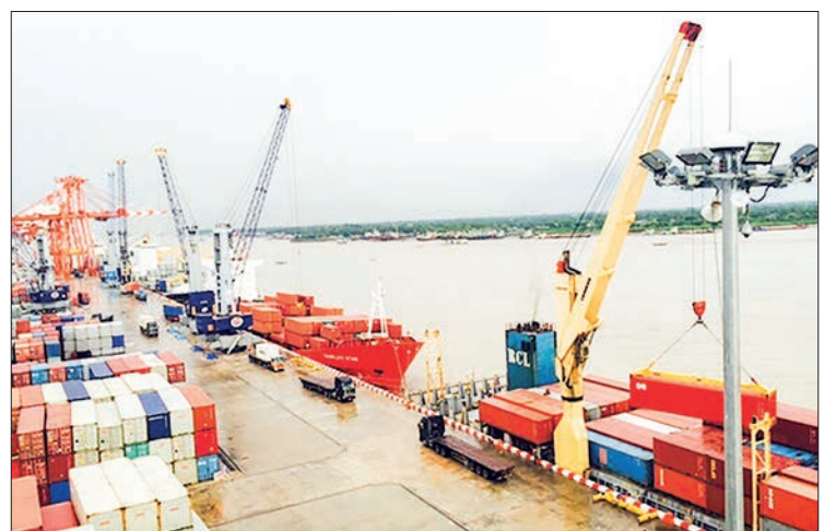
Container vessels are seen at Yangon Port.

Maritime trade increased while cross-border trade declined due to the COVID-19 outbreak.