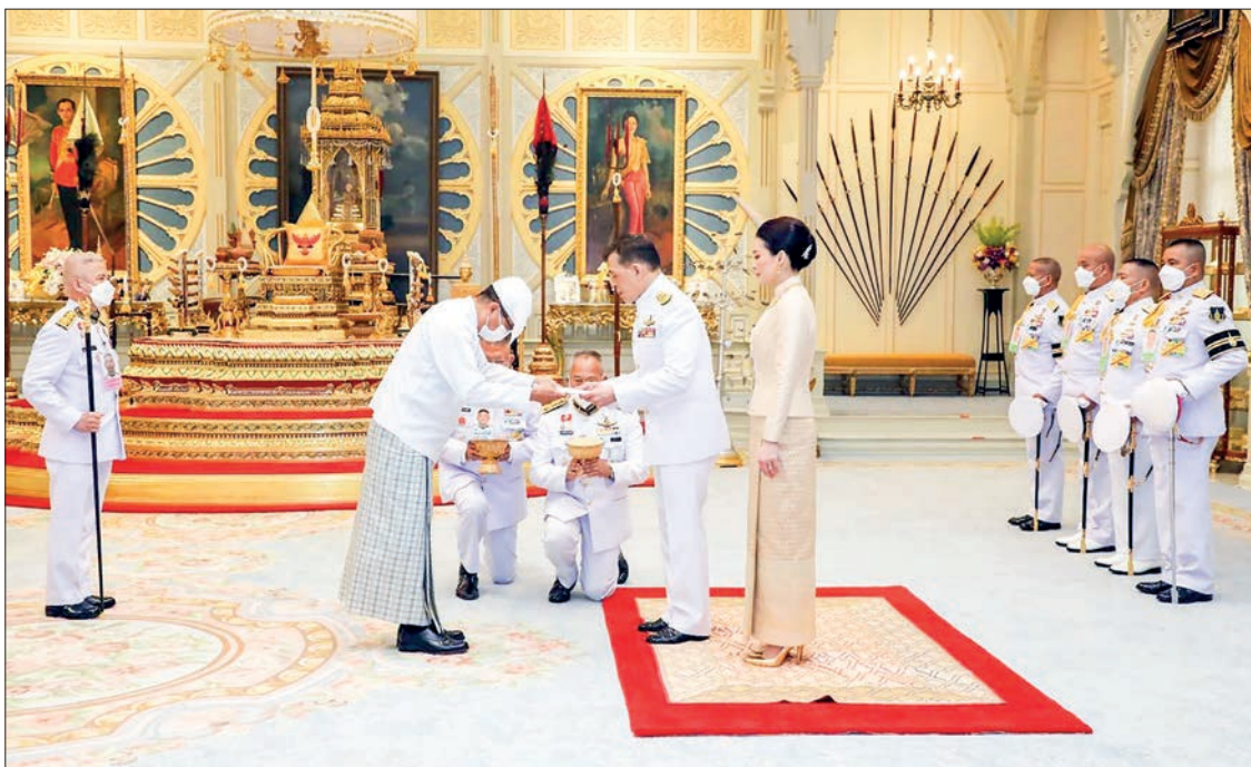
U Chit Swe, Ambassador Extraordinary and Plenipotentiary of the Republic of the Union of Myanmar to King of the Kingdom of Thailand, presented his Credentials to His Majesty King Maha Vajiralongkorn Phra Vajiraklaochaoyuhua, King of Thailand on 17 June 2022 in Bangkok.

11 new cases of COVID-19 reported on 18 June, total figure rises to 613,485