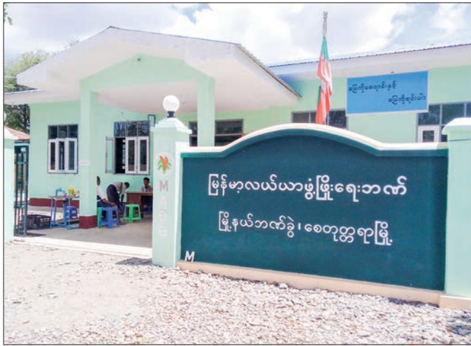
A branch office of the Myanmar Agricultural Bank.

The Myanmar Agricultural Development Bank is cooperating with JICA to provide agriculture loans to farmers starting in 2017. — TWA/GNLM