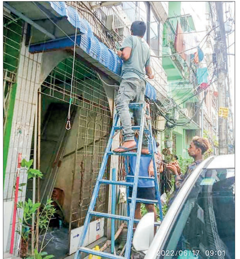
Technicians are seen installing smart meters.

Some buy white power cables for high-power-consuming