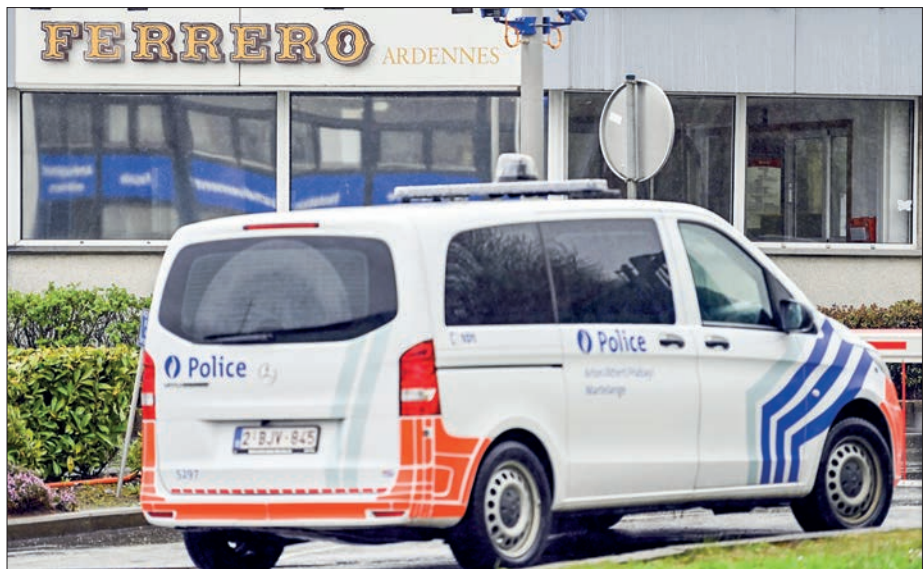
Illustration picture shows a police car in front of the Ardennes Ferrero factory in Arlon, Friday 8 April 2022.

A factory in Belgium behind a Salmonella contamination in Kinder chocolates sold in Europe can