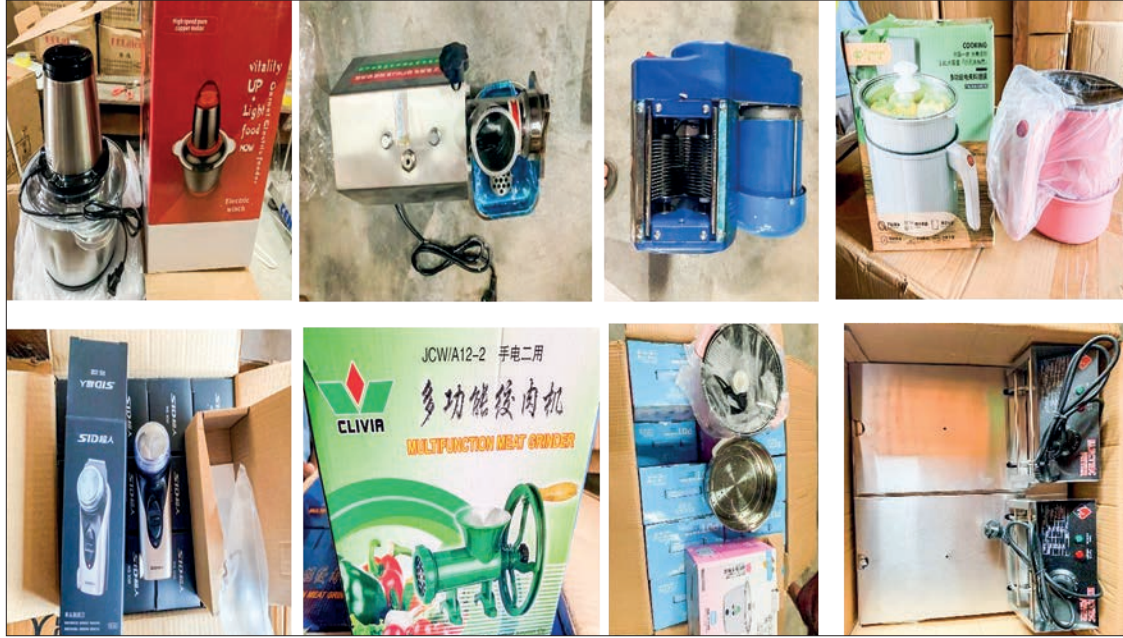
Seized appliances and electronics.