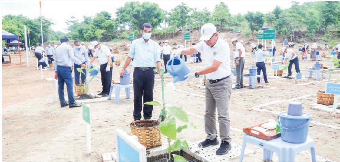
The MoALI monsoon tree-growing event is in progress in Nay Pyi Taw yesterday.

First, attendees added Rohu fingerlings, swamp barb