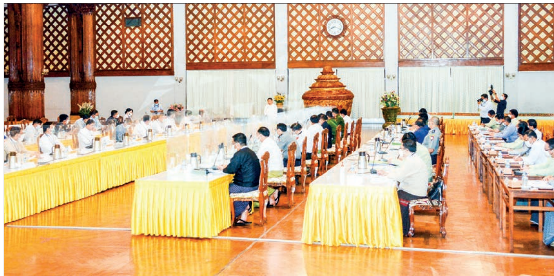
The second coordination meeting of the Central Committee on Organizing the 75 th Martyrs' Day is in progress.

THE second coordination meeting of the Central Committee on Organizing the 75 th Martyrs' Day was held in Yangon Region yesterday.