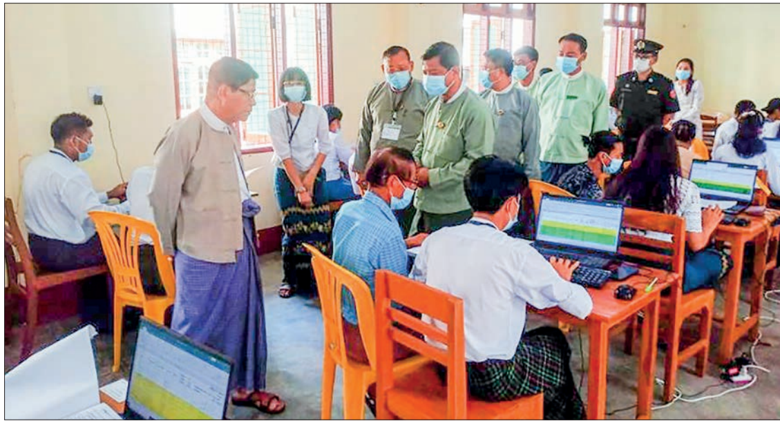
UEC Chairman U Thein Soe and members view the verification process for voter list on the ground.