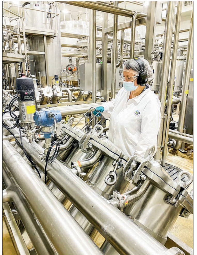
This photo shows the Fonterra Hautapu dairy factory near Cambridge in New Zealand's Waikato region, known for its fertile land and dairy industry. Staff at Hautapu are gearing up to process milk supply.

Finance Minister Grant Robertson said the decline reflected a "volatile global situation", adding that the relaxing of border restrictions and influx of skilled workers and tourists "will help business and the economy rebuild."