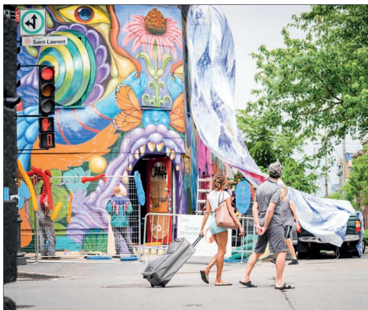
The Public Health Agency of Canada says 141 cases have been reported in Quebec, 21 in Ontario, four in Alberta and two in British Columbia as of Friday. People watch artists at work during the Mural festival in Montreal, Quebec on 16 June 2022.

CANADA'S Chief Public Health Officer Theresa Tam confirmed a total of 168 cases of monkeypox in the country as of Friday.