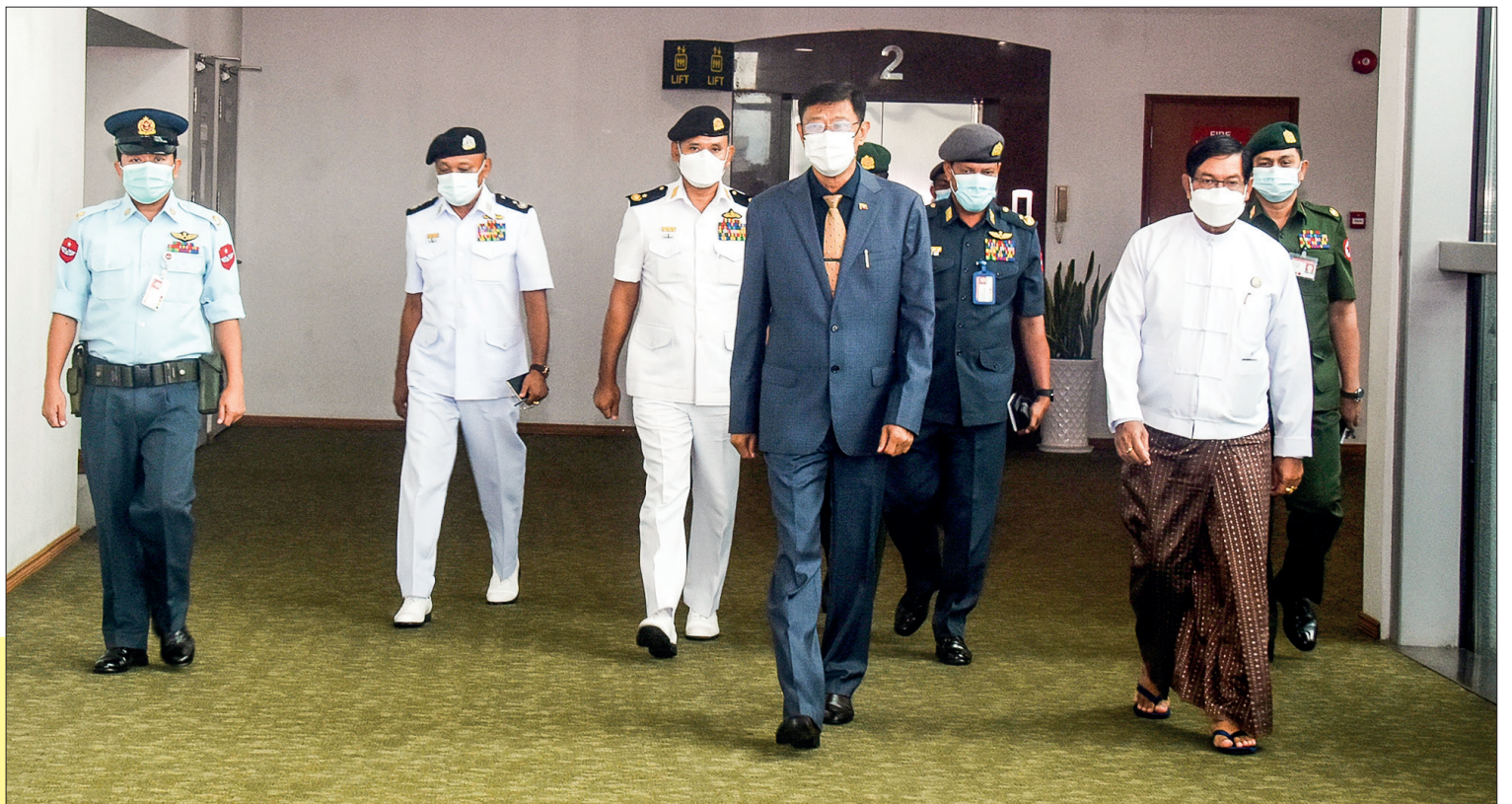
MoD Union Minister General Mya Tun Oo is seen off at Yangon International Airport before departing for Cambodia.

The Union minister was accompanied by Deputy Director-General of the Department of International Affairs U Zaw Zaw Soe and officials. Yangon Region Chief Minister U Soe Thein and senior military officers saw the delegation off at the Yangon International Airport. — MNA