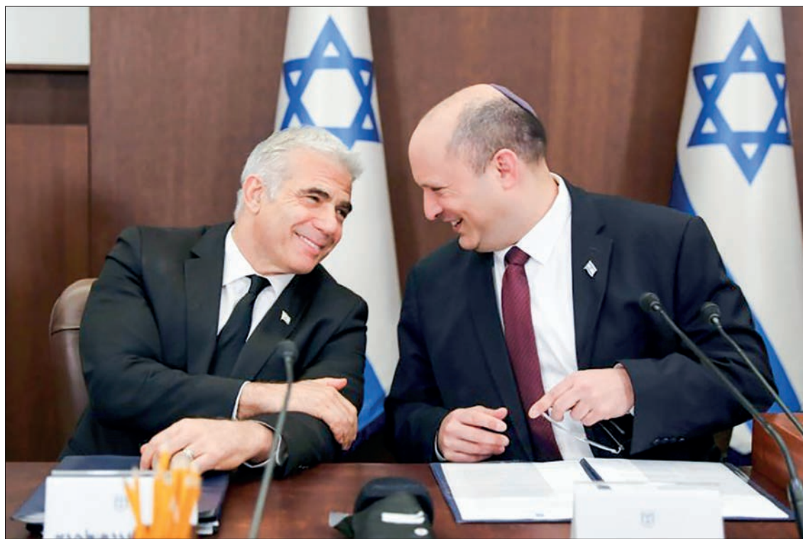
Israeli Prime Minister Naftali Bennett has said Foreign Minister Yair Lapid will take over as premier within days.

Bennett said that Lapid, a centrist, will take over as prime minister of the caretaker government in line with last year's power-sharing deal.—AFP