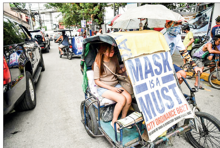
A passenger sits inside a tricycle covered with a reminder to wear a mask, part of the Covid-19 health protocols in Manila on 16 Febautry 2022.

Infectious diseases expert Edsel Maurice Salvana downplayed the spike in COVID-19 cases, saying the uptick in cases is expected due to the detection of the new, more transmissible coronavirus variants. Salvana said the country's COVID-19 cases "remains manageable at this time due to the low health-care utilization rate." The DOH blamed the slight increase of COVID-19 infections on the spread of the more transmissible variants, the increase in people's mobility, and the people's "waning immunity".—Xinhua