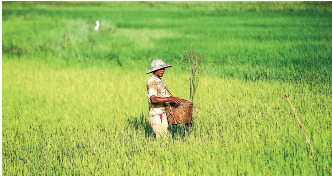
Urea fertilizer is imported from Indonesia and Iran and it is priced at K83,500 per bag.

Those interested can buy them through the contact num-