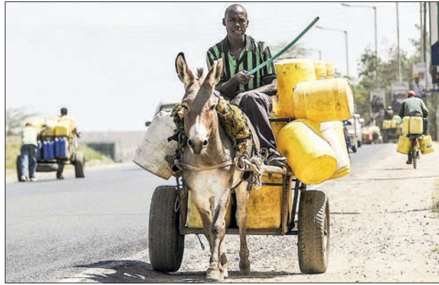
A Kenyan vendor relies on his donkey to transport water.

That is still a relative bargain in China where donkey hides that sold for $473 in 2018 now sell for $1,160. The ejiao produced from them can sell for up to $360 per kilogramme.— AFP