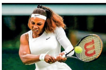
Serena Williams in action at Wimbledon in 2021.

ONS Jabeur said Monday she "cannot wait" to team up with Serena Williams as the American star prepares to return to tennis at the Eastbourne International after nearly a year away. Williams, a 23-year-time Grand Slam singles champion, was last week handed a singles wildcard entry to Wimbledon, which starts next Monday.