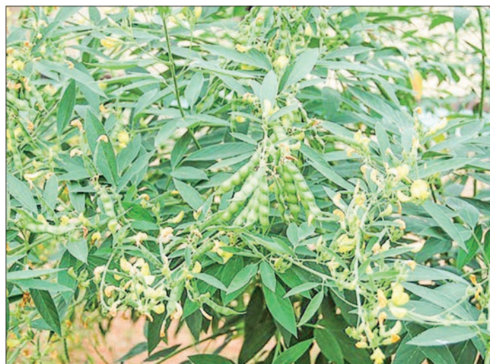
Pieces of pigeon peas (top right) and a plantation of pigeon peas (above).

there were no exports to India after August 2017, the prices of pigeon pea and black gram dropped, and the relevant authority set the price at K400,000 for a tonne of black gram and K500,000 for a tonne of pigeon pea.