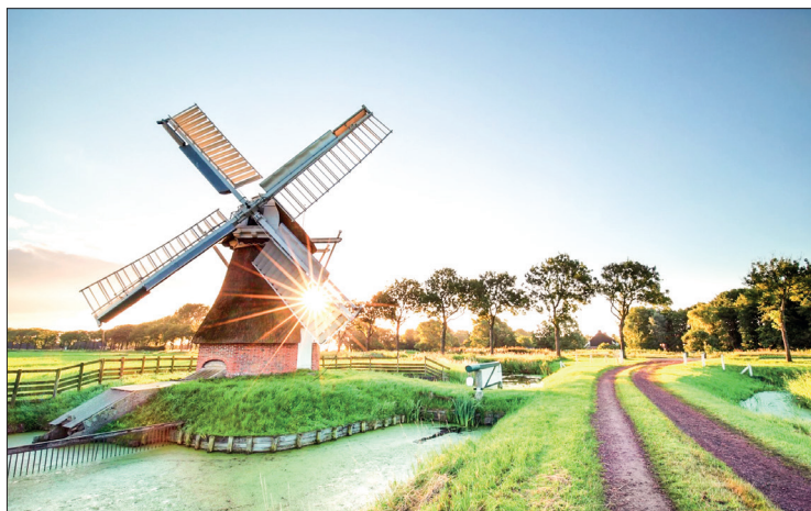
Several Dutch villages are known for their concentration of windmills, including Kinderdijk, Zaanse Schans, and Schiedam, home to the tallest windmill in the world.