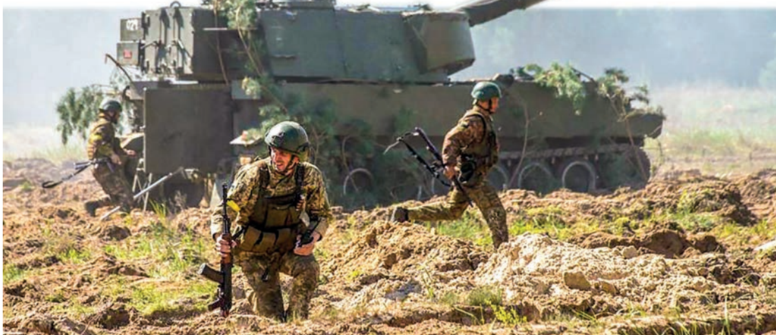
Self-propelled howitzers M109A3 shooting on the front line with Russian troops in an unknown place of Ukraine.