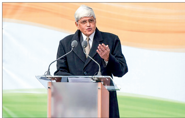
Gandhi was governor of West Bengal state between 2004 and 2009 after being appointed by the then-ruling Congress party.

The BJP is likely to announce its own candidate this week and may again put forward the incumbent, Ram Nath Kovind, a member of India's marginalised Dalit community, to serve another term.—AFP