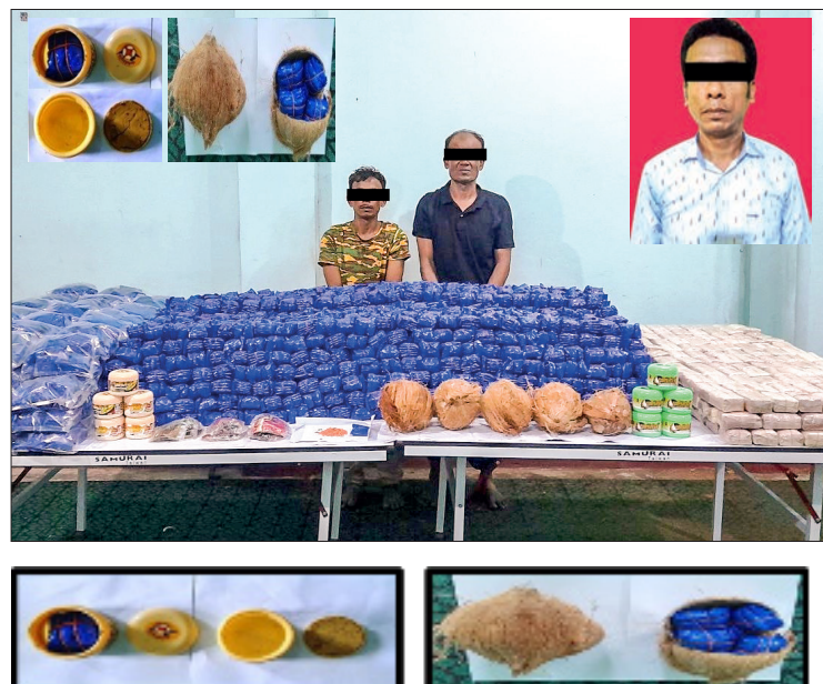
Arrestees are seen along with seized stimulant pills.

The suspects are prosecuted under the Narcotic Drugs and Psychotropic Substances Law and police are carrying out the investigation, the Myanmar Police Force stated. — MNA