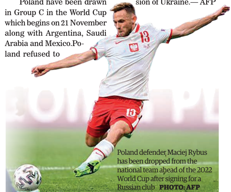
Poland defender Maciej Rybus has been dropped from the national team ahead of the 2022 World Cup after signing for a Russian club.

play Russia in their scheduled World Cup play-off semi-final in March following the invasion of Ukraine.— AFP