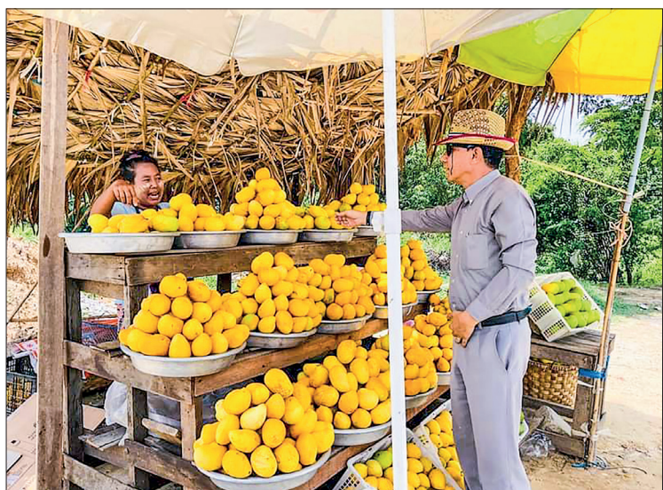
A consumer is seen buying mangoes from a street vendor.

"If mango meets quality criteria in Muse border, it is priced at K200 per piece. If they are ripe in Muse, it is worth only K80-100 per piece. If it takes five to six days to transport the mangoes to Muse, the over-ripe mangoes are discarded. Some growers make losses either. Yet, most of the farmers generate a certain profit," U Than Tun Oo stated. — Lu Lay/GNLM