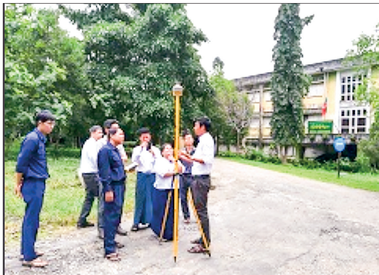
Yangon's first Informative Digital Map project is underway.

Urban planning staff and JICA Team staff were divided