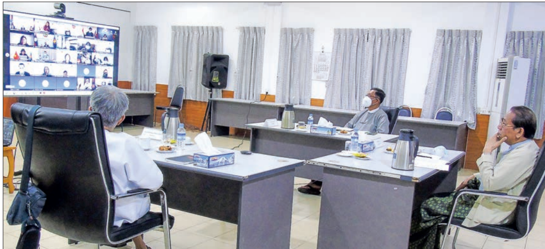
A virtual meeting of the AICHR and SEANF is in progress.

THE ASEAN Intergovernmental Commission on Human Rights (AICHR) and the Southeast Asia National Human Rights Forum (SEANF) held a virtual meeting today.