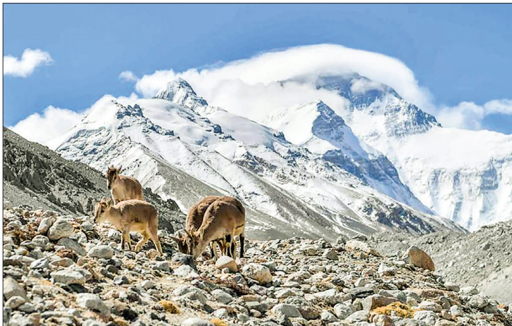
Animals live wild on the slopes of Qomolangma, the Tibetan name for Everest.

A repeatedly postponed UN summit tasked with protecting nature and halting accelerating