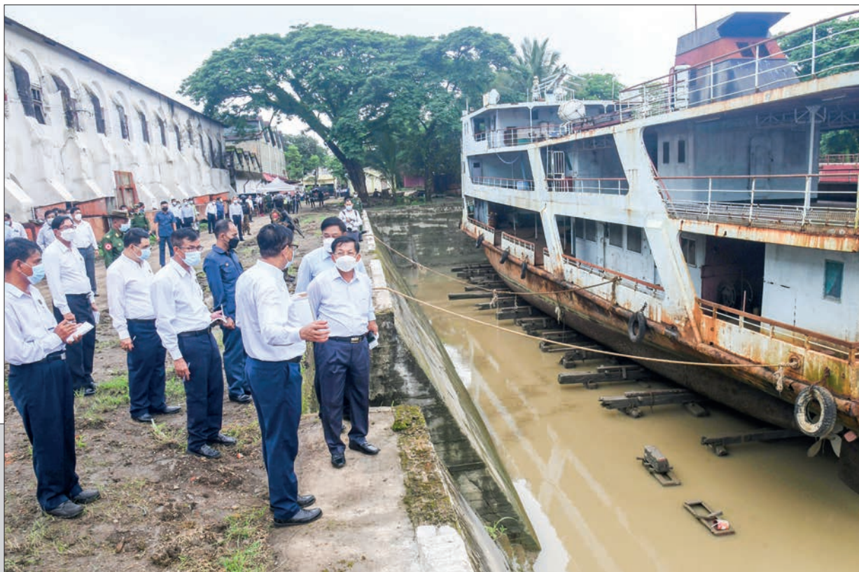
The Senior General views round the Dala Shipyard in Yangon Region on 2 July 2022.

Then, the Senior General and party viewed the Dala Shipyard and instructed the necessary things. He also provided gifts and cash prizes to the IWT staff.