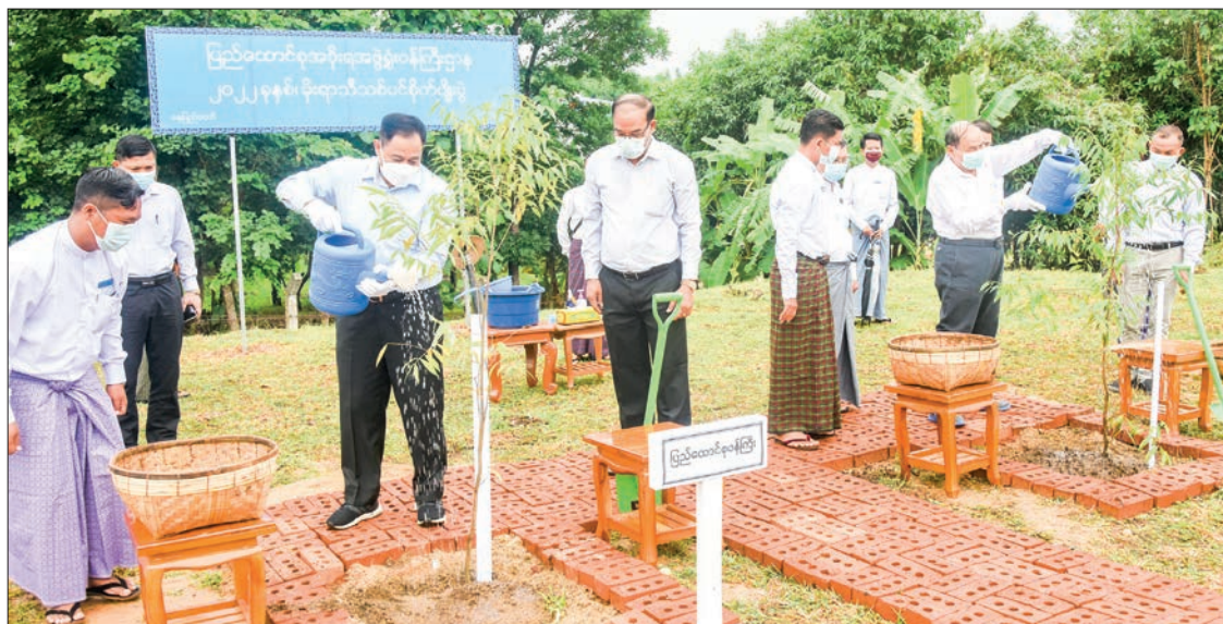
The monsoon tree-growing event 2022 of the Ministry of the Union Government Office (1) and (2) is in progress in Nay Pyi Taw yesterday.

Afterwards, indoor plants are handed out to participants as commemorative gifts, it is learnt. — MNA