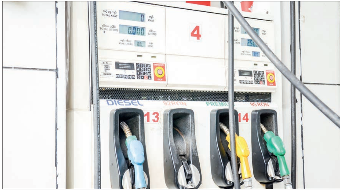
People can file any complaints about services at petrol stations through contact numbers (067-409881, 067-411129, 09-699611116, 09-440433533).

states other than Yangon are evaluated after adding the transportation cost and the reference rates daily covered on the state-run newspapers and are posted on the media and official website and Facebook page of the department on a daily basis starting from 4 May.