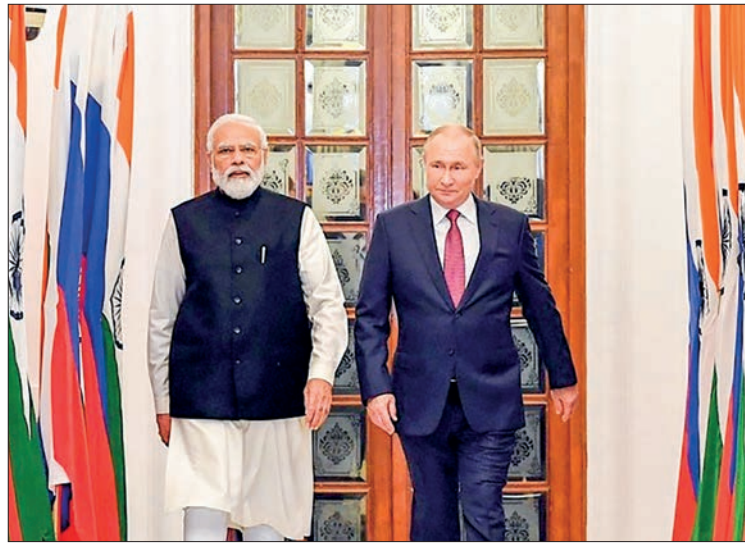
Indian Prime Minister Narendra Modi (L) meets with Russian President Vladimir Putin at Hyderabad House in New Delhi, India, on 6 December 2021.