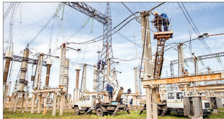
The Ukrainian electricity grid was connected to the European network in mid-March, helping to keep supplies flowing despite the war.

UKRAINE has started exporting electricity to the European Union, via Romania, President Volodymyr Zelensky said, as Russia reduces gas supplies to