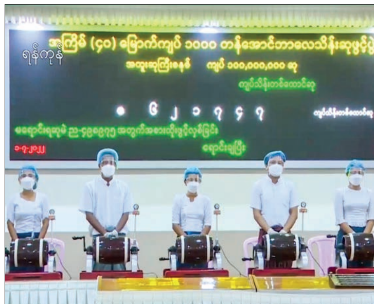
The 40 th Aung Bar Lay lottery results are announced on 1 July 2022

Moreover, the government gave five prizes at K1 million, 50 prizes at K300,000 and 400 prizes at K200,000 using K100.900 million in confiscated finance. — TWA/GNLM