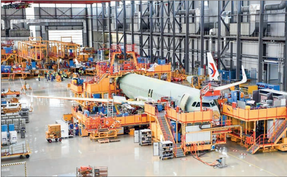
Photo taken on 27 September 2018 shows staff members working at Airbus' Tianjin final assembly line for the A320-family of jets in north China's Tianjin

The orders will enter the backlog after the