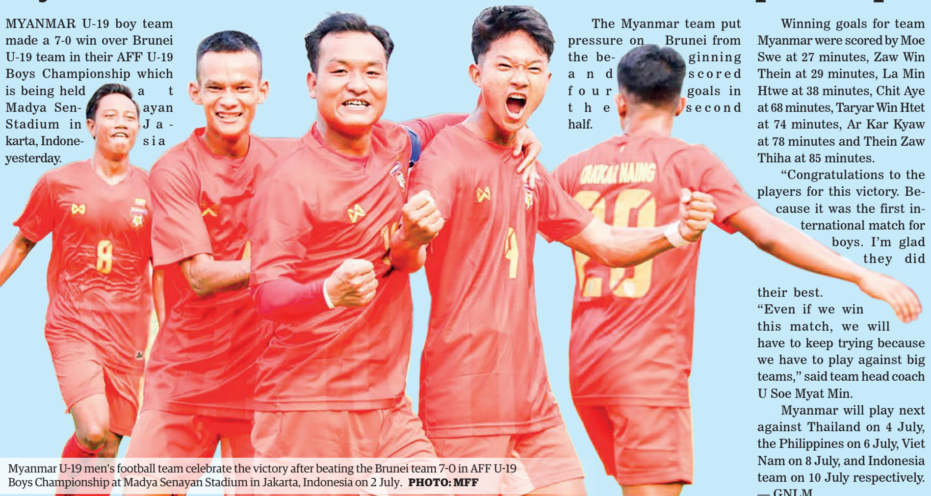
Myanmar U-19 men's football team celebrate the victory after beating the Brunei team 7-0 in AFF U-19 Boys Championship at Madya Senayan Stadium in Jakarta, Indonesia on 2 July.

MYANMAR U-19 boy team made a 7-0 win over Brunei U-19 team in their AFF U-19 Boys Championship which is being held at Madya Senayan Stadium in Jakarta, Indonesia yesterday.