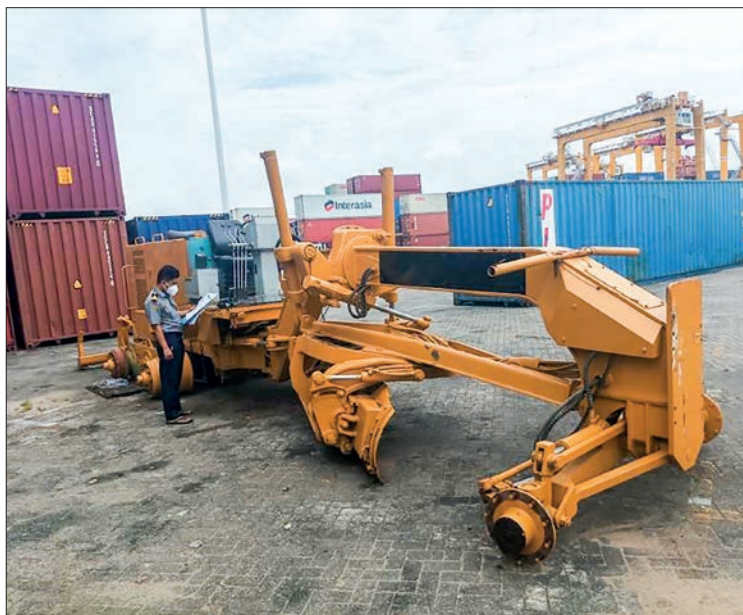
An official checks illegal machinery at the container terminal of Asia World Port.

Therefore, 10 arrests (approximately K201,600,444) were made on three consecutive days from 30 June to 2 July, according to the Anti-Illegal Trade Steering Committee.— MNA