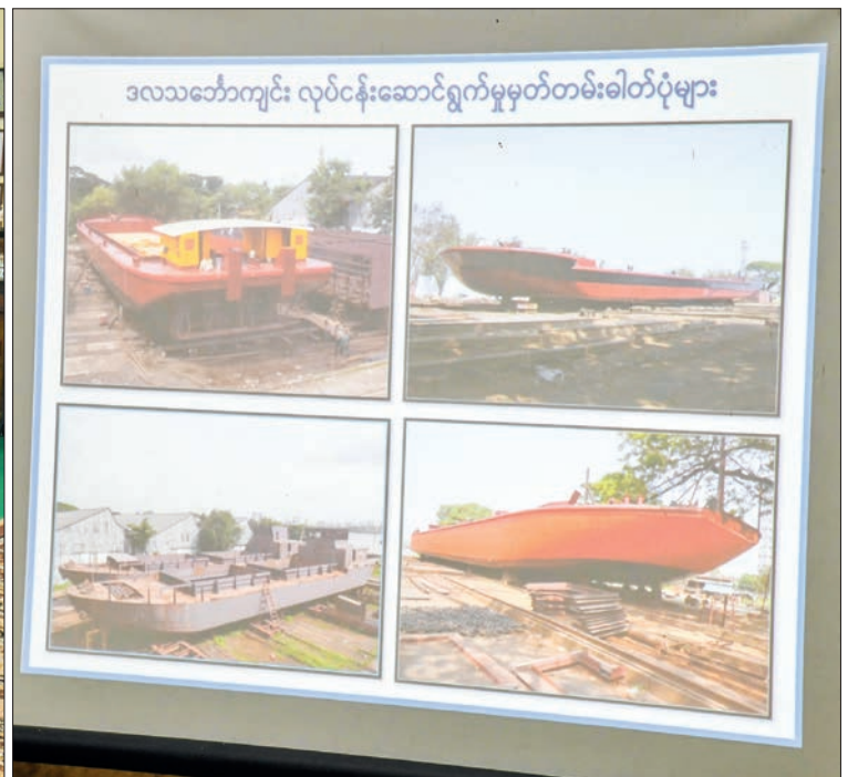
State Administration Council Chairman Prime Minister Senior General Min Aung Hlaing hears the report on the history of the Inland Water Transport and the Dala Shipyard in Yangon Region yesterday.

THE Inland Water Transport-IWT should stand as a leading organization for the water transport sector of the country, said State Administration Council Chairman Prime Minister Senior General Min Aung Hlaing while inspecting the Dala Shipyard in Yangon yesterday. He was accompanied by the Yangon Region chief minister, the commander of the Yangon Command, the mayor and relevant officials.