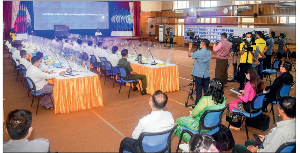
May-General Zaw Min Tun is seen answering questions raised by one correspondent at the 17 th press conference.

THE country repays about $700million of local and foreign loans every year, said Deputy Minister for Information Maj-Gen Zaw Min Tun during the 17th press conference held yesterday.