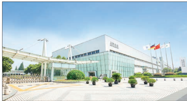
The factory in Urumqi produces about 20,000 cars a year, a fraction of that from other VW plants in China.

“less growth, well-being and employment”, Diess warned. Inflation would also “explode” without trade with China, the CEO said, as Western countries ride a wave of consumer price rises driven by the coronavirus pandemic and