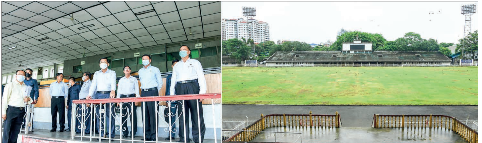
State Administration Council Chairman Prime Minister Senior General Min Aung Hlaing looks into the miniature version of Aung San Stadium (top) and inspects the stadium (above and below) in Yangon on 2 July 2022.

The Senior General and party inspected the Aung San Stadium