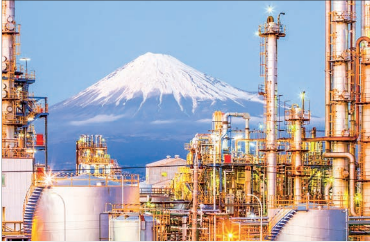
Confidence among Japan's largest manufacturers sagged for a second quarter on rising costs and supply constraints, though the service sector was boosted by economic reopening.

CONFIDENCE among Japan's largest manufacturers sagged for a second quarter on rising costs and supply constraints, though the service sector was boosted by economic reopening, a key survey showed Friday.