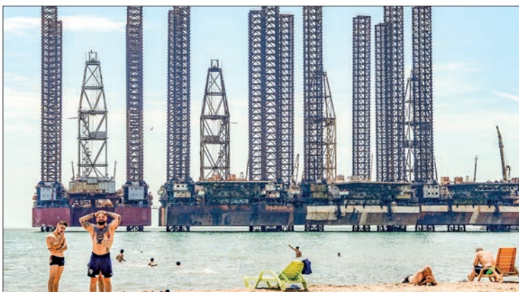
Men rest on a beach on the shore of the Caspian Sea in front of oil rigs following the easing of strict quarantine measures against the spread of the coronavirus disease in Baku on 5 August 2020.