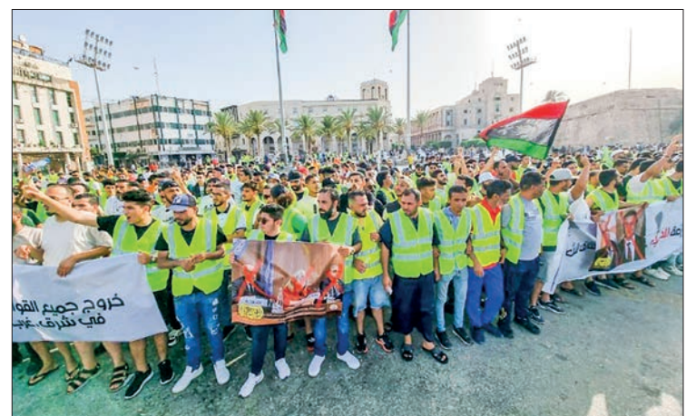
Libyans on Friday gathered in Tripoli to protest against the political situation and dire living conditions.

Black smoke billowed as men burned tyres and torched cars after one protester had smashed through the compound's gate with a bulldozer and others attacked the walls with construction tools, local media reported.—AFP