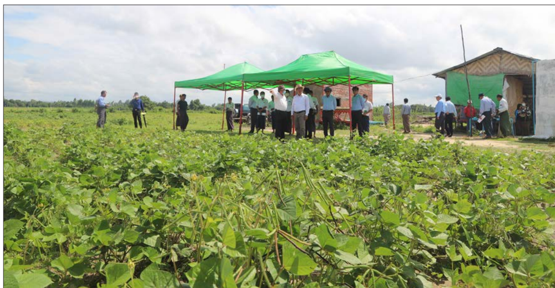
The MoALI Union Minister inspects the high-tech demonstration farms in Nay Pyi Taw Council Area on 2 July 2022.

UNION Minister for Agriculture, Livestock and Irrigation U Tin Htut Oo inspected the establish-