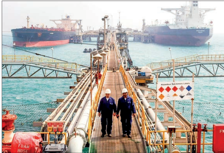
Oil tankers are anchored at Basra harbour, 550 kms (340 miles) south of Baghdad.

The average crude oil exports in June reached 3.37 million barrels per day, it added.