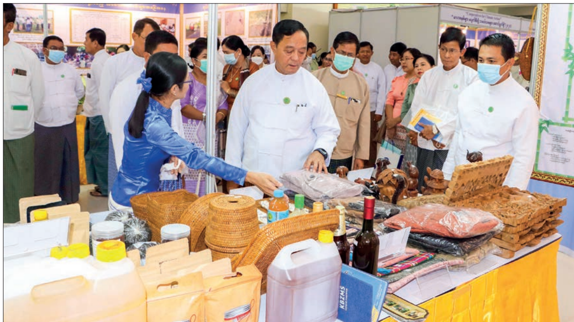
The Ministry of Cooperatives and Rural Development marks the 100 th International Day of Cooperatives in Nay Pyi Taw on 2 July 2022.

The cooperative associations have created job opportunities for over 12 per cent of the