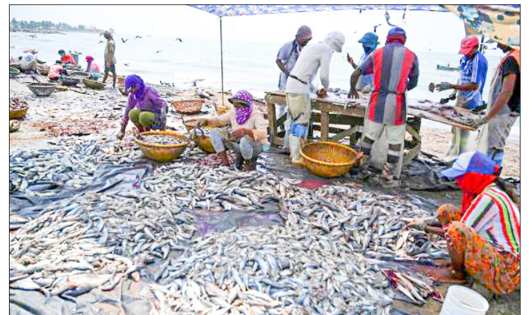
Sri Lanka's headline inflation quickened more than expected in May amid continuing food and fuel shortages. The fisheries sector plays a key role in Sri Lanka's social and economic life.

According to an economist at Johns Hopkins university, Steve Hanke, who tracks price increases in the world's troublespots, Sri Lanka's current inflation is 128 per cent, second only to Zimbabwe's 365 per cent.—AFP