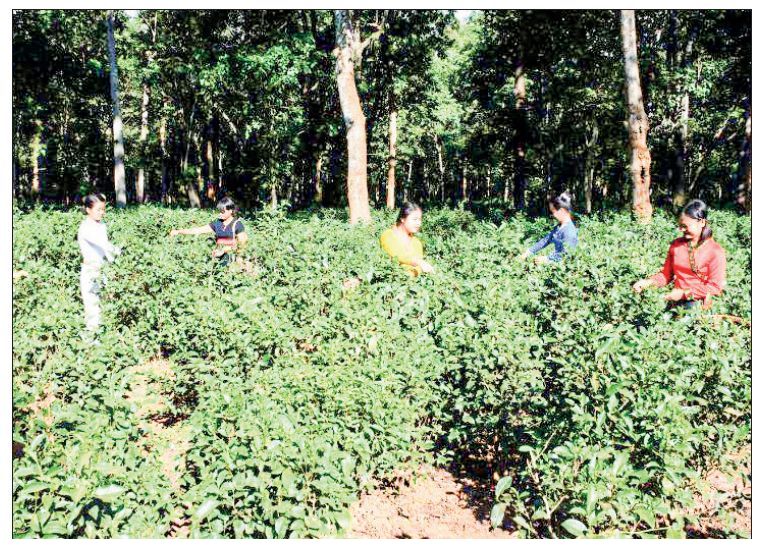
The wholesale prices of fresh tea leaf are estimated at K1,000-1,200 per viss, while the price declines to K800 per viss when tea leaf quality is low in the rainy season.

systematically. Earlier, the growers removed crossing branches and weeds with their hands. Now, some of them are using weed killers. The department encourages them not to use chemicals but to use machines to control them," said Daw Su Su Htway. — Lu Lay/GNLM