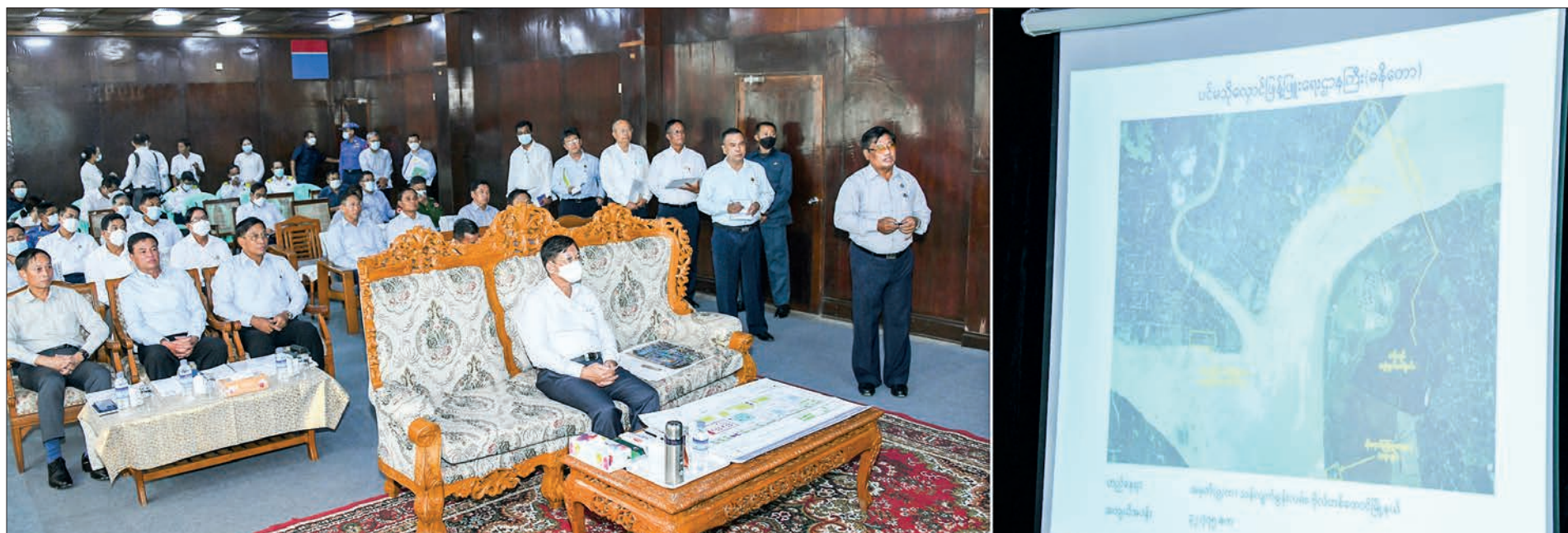
State Administration Council Chairman Prime Minister Senior General Min Aung Hlaing hears the report on the main fuel terminal Danidaw in Yangon Region on 2 July 2022.

STATE Administration Council Chairman Prime Minister Senior General Min Aung Hlaing inspected the main fuel terminal Danidaw of the Myanmar Petrochemical Enterprise in Botahtaung Township of Yan-