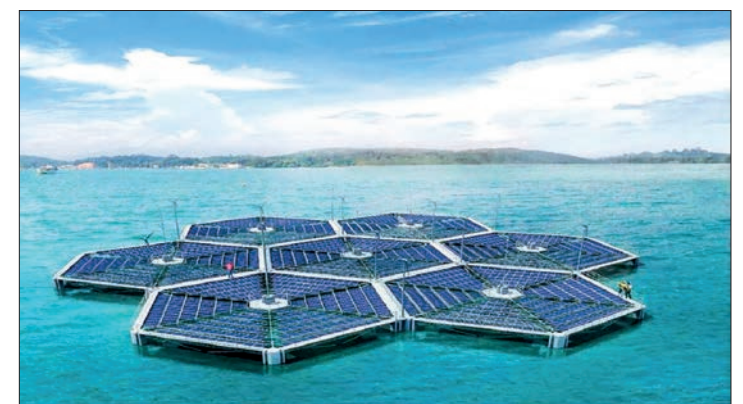
The floating solar PV project in India of 25MW power on the reservoir of its Simhadri thermal station in Visakhapatnam, Andhra Pradesh. PHOTO: CURRENTAFFAIRS.ADDA247/XINHUA /FILE

The floating platform consists of one inverter, transformer, and a high tension (HT) breaker. The solar modules are placed on floaters manufactured with high density polyethylene (HDPE) material.—Xinhua