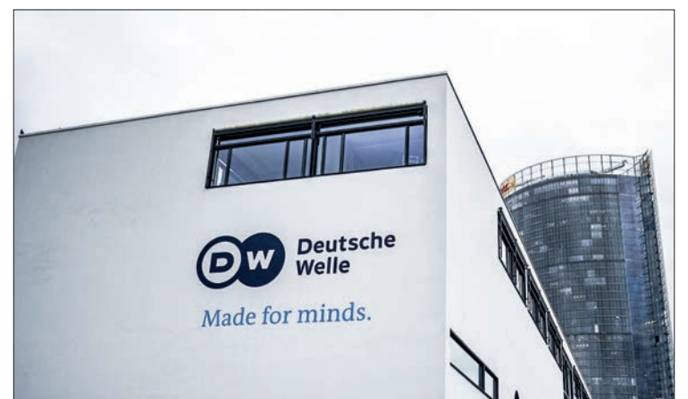
A picture shows the logo of German international broadcaster Deutsche Welle (DW) on a wall at their head office in Bonn, western Germany, on 8 February 2022.

On Friday, both news portals were inaccessible in Türkiye without the use of VPN technology that hides users' location.—AFP