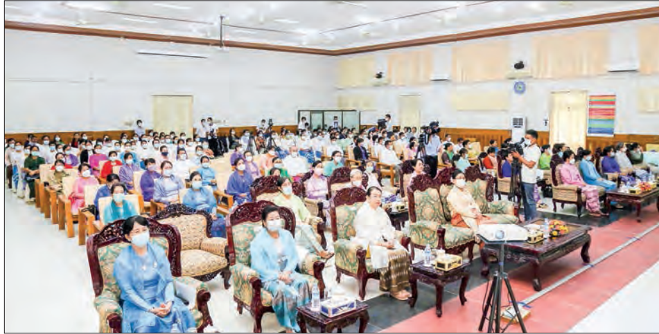
SAC Vice-Chairman Deputy Prime Minister Vice-Senior General Soe Win, on behalf of the SAC Chairman Prime Minister, gives a video message to Myanmar Women's Day Ceremony on 3 July.

The committee needs to take a leading role in implementing the national strategic plan for advancement of women (2013-2022). As such a plan will conclude in 2022, the committee needs to