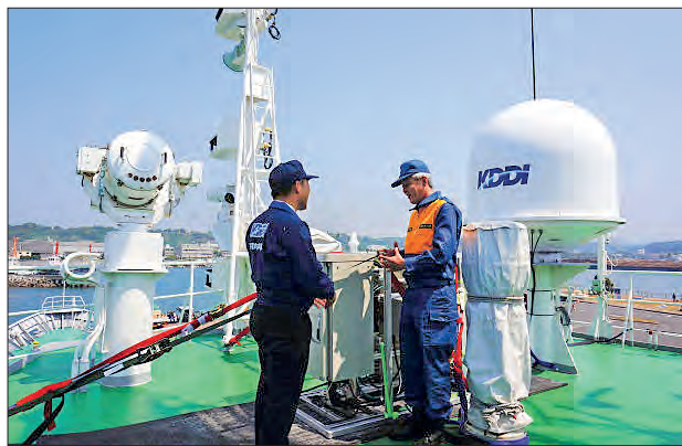
Coast Guard members inspect KDDI's cellphone base station equipment installed on their patrol vessel on 23 May 2014 in Shibushi, Kagoshima, Japan.

KDDI Corp, one of Japan's top three cellular carriers, said Sunday up to 39.15 million mobile connections