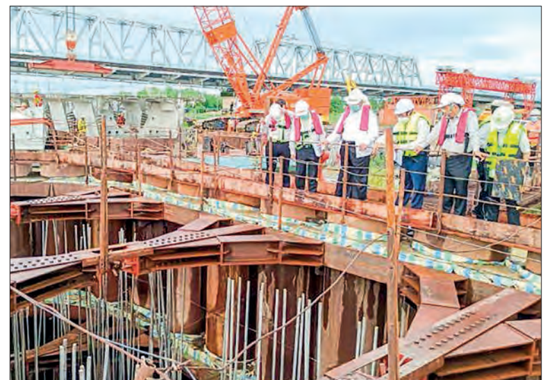
Union Minister for Construction U Shwe Lay inspects progress of Thanlyin Bridge No. 3 on 2 July.

The Thanlyin Bridge No 3 under construction on the Bago River is located near the Yangon-Thanyin Bridge No 1. The bridge will be 1,928-meter long and the 24 meters wide motor road. The facility will withstand 75 tonnes of load.—MNA