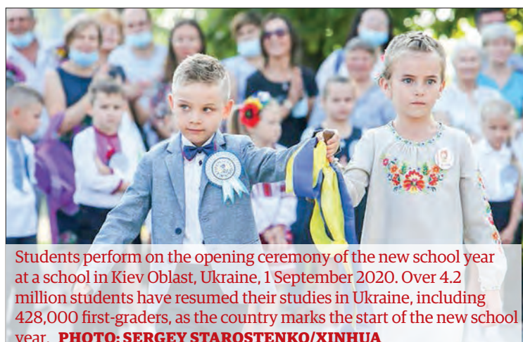
Students perform on the opening ceremony of the new school year at a school in Kiev Oblast, Ukraine, 1 September 2020. Over 4.2 million students have resumed their studies in Ukraine, including 428,000 first-graders, as the country marks the start of the new school year.

SCHOOLS in Ukraine's capital Kyiv will re-open for classes at the start of the school year on 1 September; the city's authorities said Friday.