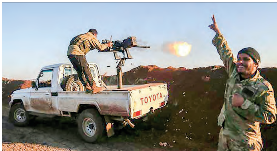
Free Syrian Army (FSA) was positioned as the official army of the opposition during Syrian civil war.

In recent weeks, Erdogan said he planned to launch a military offensive against Kurdish fighters in Syria waging an insurgency against his country.