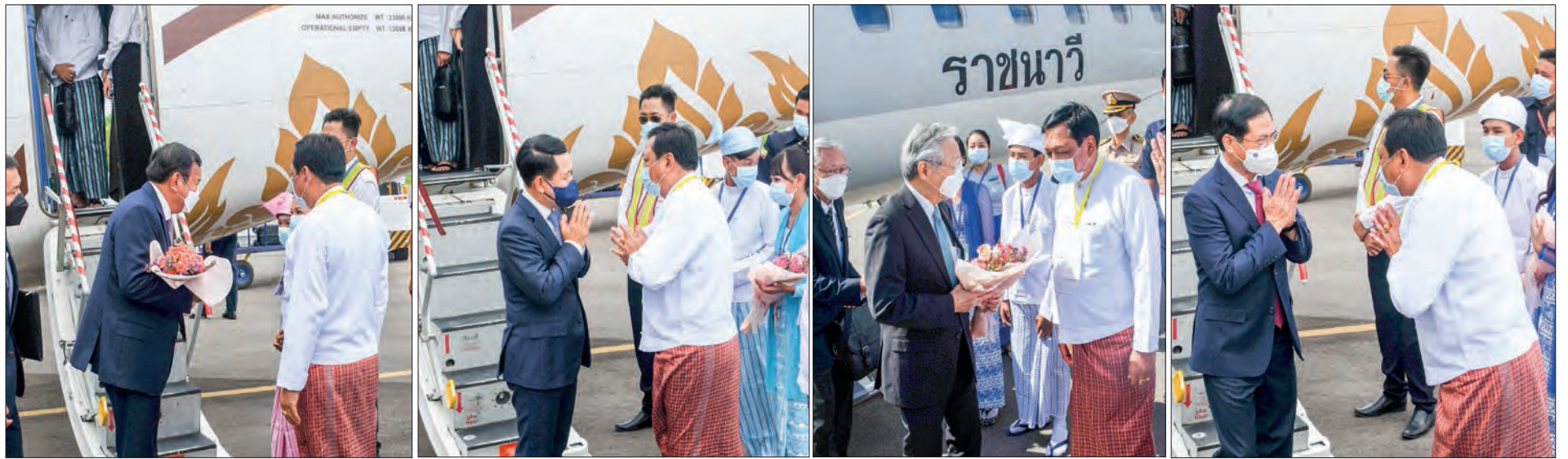
Foreign Minister of 7th Mekong-Lancang Cooperation Foreign Ministers' Meeting are being welcomed by officials at NyaungU airport on 3 July.