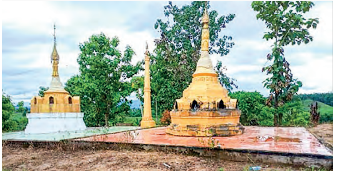
A record photo where terrorists took positions at pogodas and religious buildings to attack Tatmadaw column.

During the security measures in the vicinity of the camp, it was found that the KNLA and so-called PDF terrorists took religious buildings and residential buildings to cover them during their attacks. Tatmadaw troops are continuing to provide the necessary security measures so as to prevent terrorists from taking refuge in the Ukarithta area.—MNA