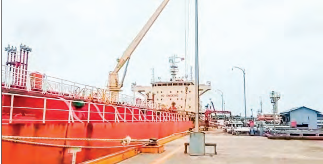
A tanker is seen docking at Thilawa Port.