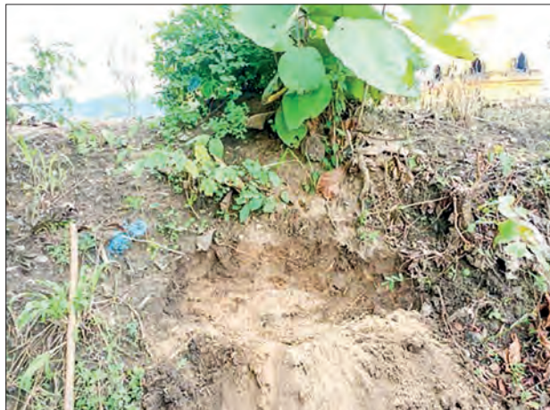
Record photos show the sites where terrorists took positions at residential buildings in the village to attack Tatmadaw column.