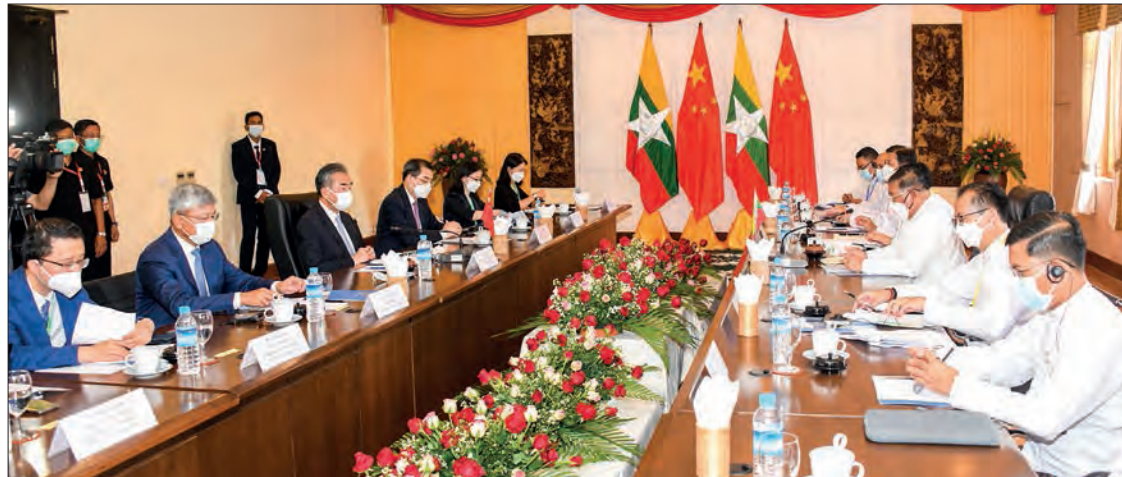
Union Minister for Foreign Affairs U Wunna Maung Lwin holds talks with State Councilor and Foreign Minister of China Mr. Wang Yi on 3 July.

At the meeting, they cordially exchanged views on further consolidation of the existing Pauk Phaw relations, the continued implementation of Myanmar-China bilateral projects, importation of fertilizer from China to Myanmar, exportation of Myanmar's agricultural and marine products to China, the re-entry of Myanmar scholars to China, maintenance of peace and stability along the Myanmar-China border, smooth flow of border trade between Myanmar and China. They also cordially exchanged views on closer