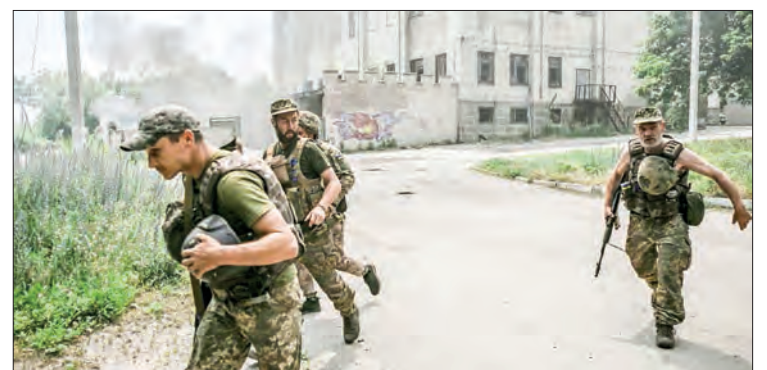
Fighting raged for the strategic Ukrainian city Lysychansk on Saturday. Ukrainian servicemen run for cover during an artillery duel between Ukrainian and Russian troops in the city of Lysychansk, eastern Ukrainian region of Donbas, on 11 June 2022.

The city's capture would allow Russian forces to push deep-