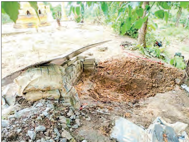
A record photo where terrorists took positions at pogodas and religious buildings to attack Tatmadaw column.