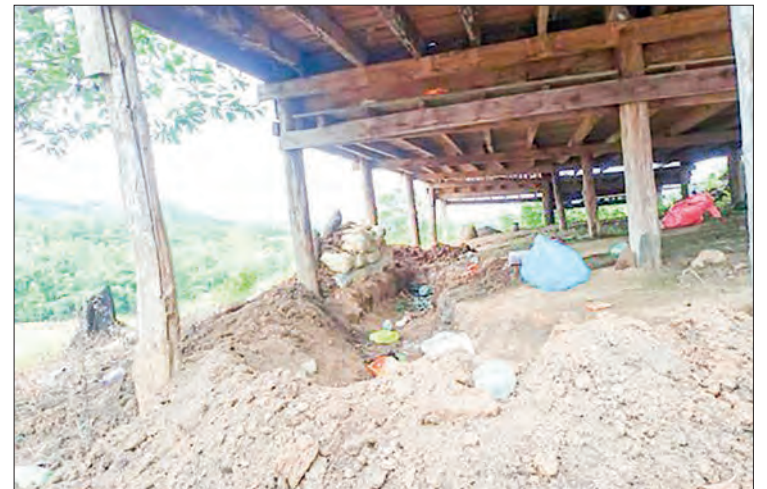
Record photo shows the sites where terrorists took positions at residential buildings in the village to attack Tatmadaw column.