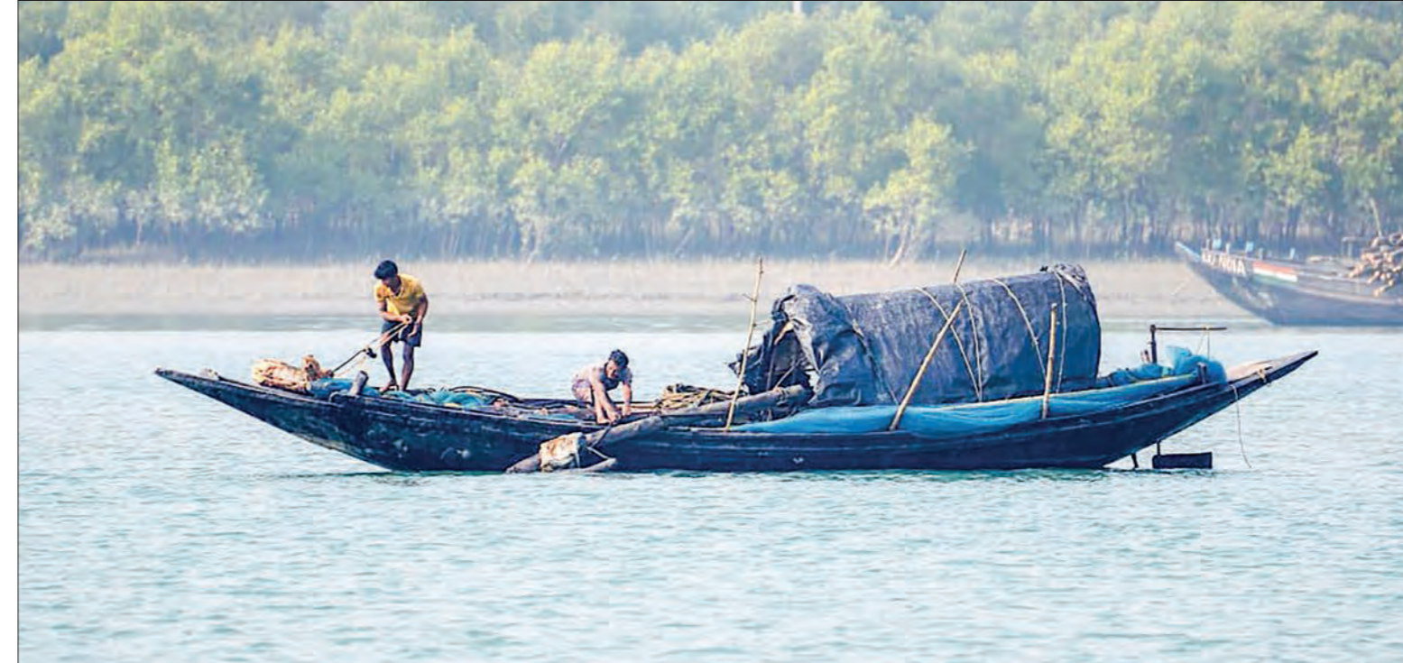
From the mangroves of West Bengal to the vast archipelago that makes up Indonesia, and from the bustling port city of Guayaquil, Ecuador, to the tropical shores of southern Togo, systemic risks from the COVID-19 pandemic have been exposed in stark human terms. Indian Fishermen catch fish on a foggy morning on the Matla river in the Sundarbans delta, some 120 kms southeast of Kolkatta.

The report, "Rethinking risks in times of COVID-19" shows how, in each of these four locations – part of five field studies carried out in 2021 by the UN University's Institute for Environment and Human Security (UNU-EHS) and the UN Office for Disaster Risk Reduction (UNDRR) – a clear picture emerges of a domino effect, resulting from the outbreak of COVID-19, that rippled across