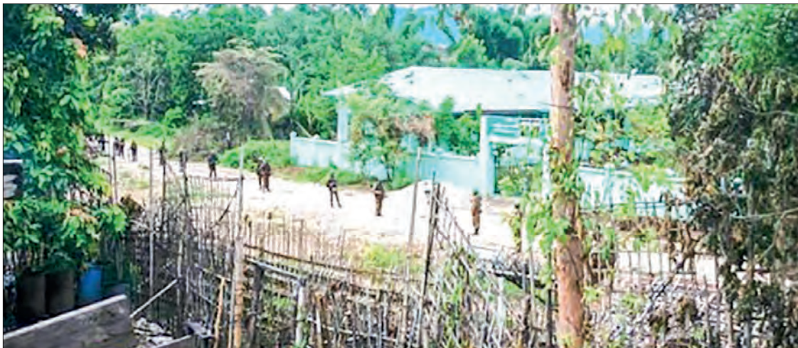
Tatmadaw members of Ukarithta Camp and those from reinforcement troops conduct defence duty together in front of the camp.