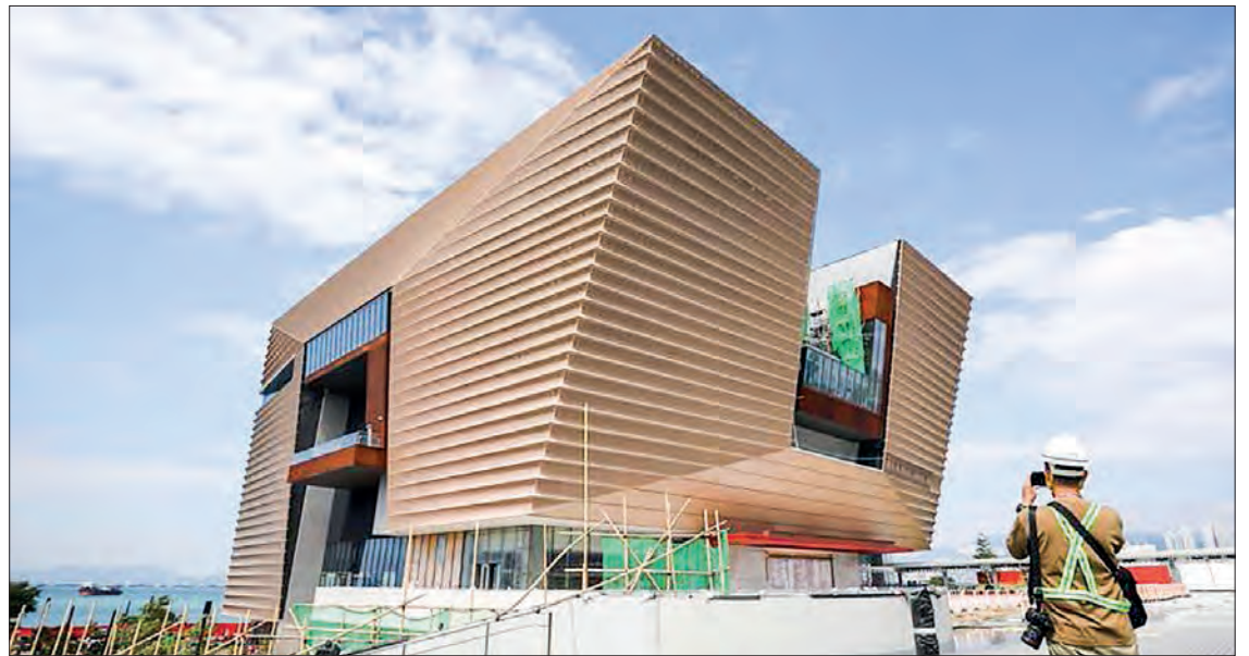
The Hong Kong Palace Museum presents over 900 priceless treasures from the Palace Museum.

Despite its highly anticipated arrival after nearly six years in the making, the museum has garnered heavy criticism due to the government's failure to