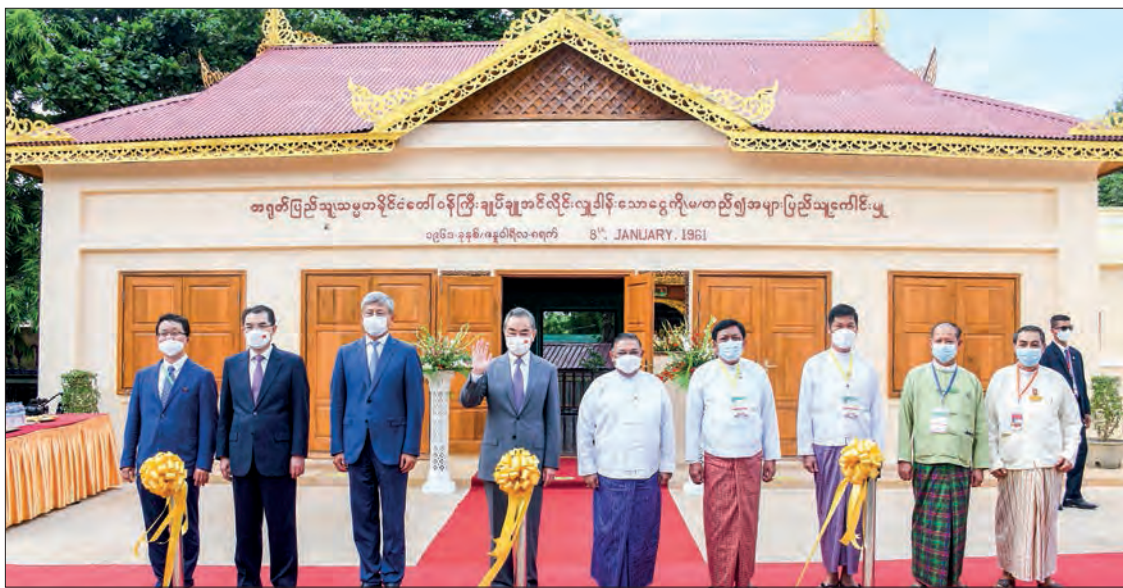
Union Minister U Wunna Maung Lwin, State Councilor and Foreign Affairs Minister of China Mr. Wang Yi pose for documentary photo in front of Zhou Enlai prayer hall on 3 July.

THE reopening ceremony of the renovated Zhou Enlai Prayer Hall took place yesterday morning in the precinct of Shwezigon Pagoda in Bagan Ancient Cultural Zone. The ceremony was attended by Union Minister for Foreign Affairs U Wunna Maung Lwin, State Councilor of the People's Republic of China and Foreign Affairs Minister Mr. Wang Yi, Deputy Minister U Kyaw Myo Htut, Chinese Ambassador to Myanmar Mr Chen Hai, Mandalay Region Natural Resources and Environmental Conservation Minister U Myo Aung and officials.