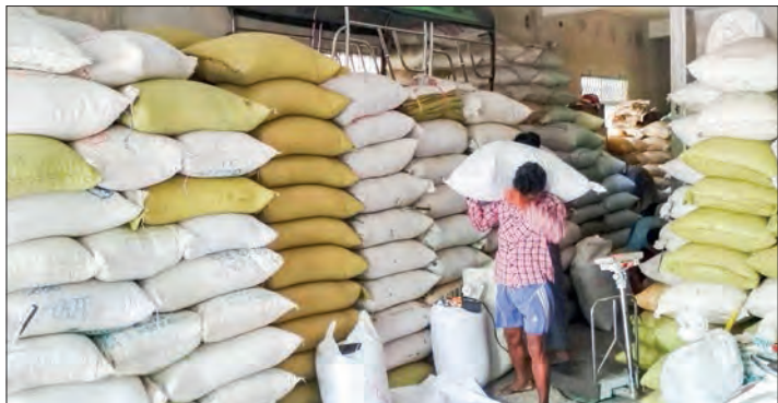
Bags of green gram are stored in warehouse.

China accounts for 60 per cent of Myanmar’s green gram exports. China prefers green gram (golden) varieties. China makes value-added products from green grams and re-exports them to foreign markets. Moreover, it produces bean by-products as feedstuffs. Myanmar conveyed US$176.7 million worth over 230,239 tonnes of green grams to foreign trade partners between 1 April and 26 June of the current financial year 2022-2023, according to the Ministry of Commerce’s trade data.—KK/GNLM