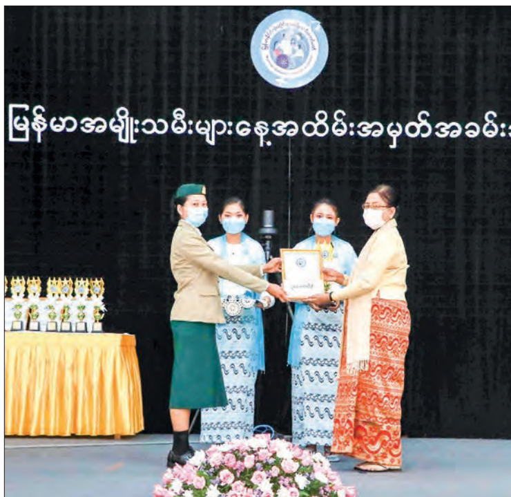
An outstanding woman was awarded on 3 July.

review the advantages and disadvantages of the plan while cooperating with relevant ministries and organizations to draw the national strategic plan for advancement of women (phase II).