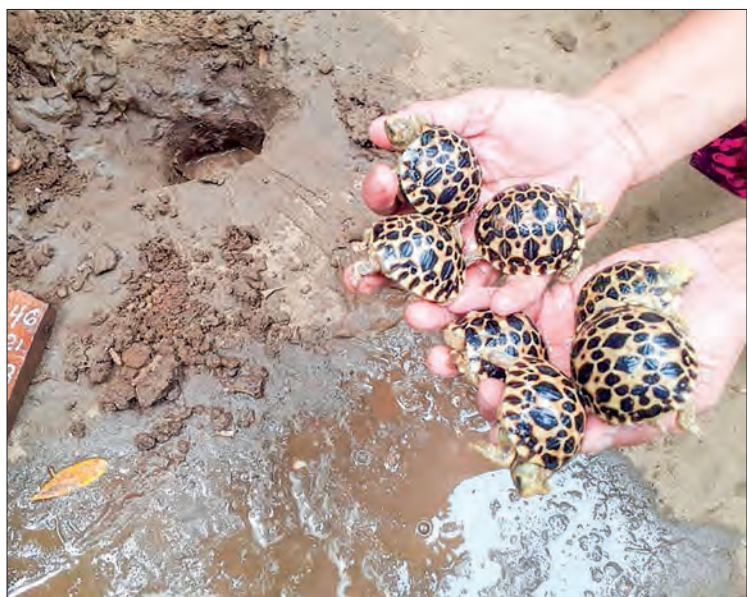
Star tortoises are being released into natural water at Lawkananda Wildlife Sanctuary.

A total of 1,576 baby tortoises hatched at Lawkananda Sanctuary this year and the number of star tortoises was up by 266 against the year-ago period, according to the Forest Department in NyaungU Township, Mandalay Region.