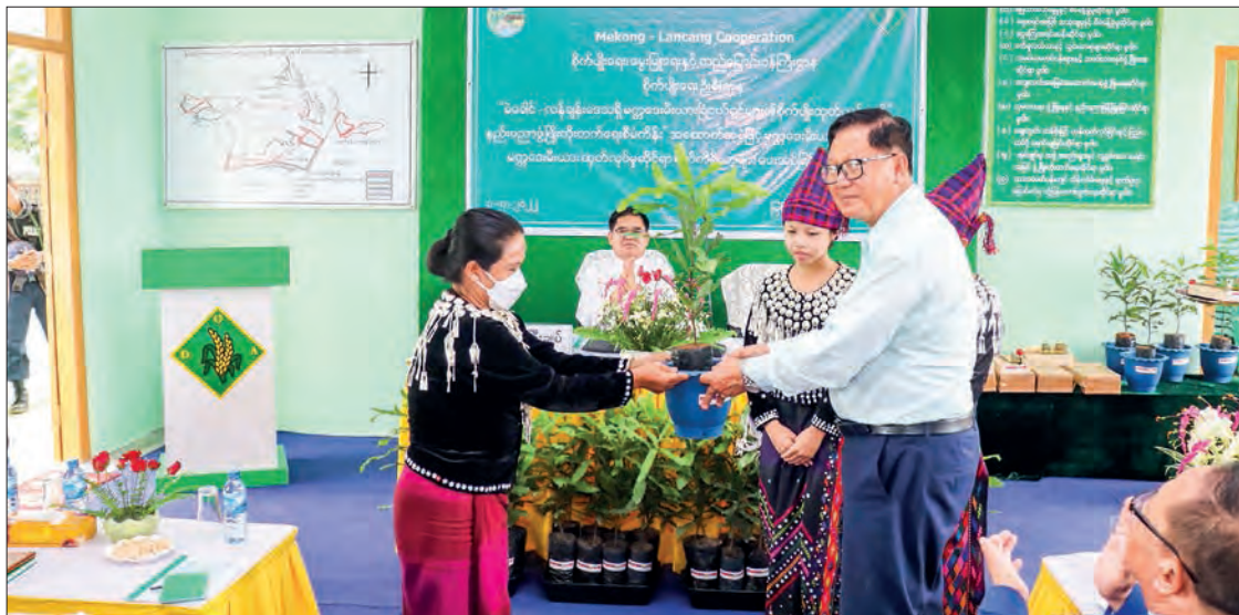
A macadamia sapling was presented to a local farmer.

Next, 14,820 macadamia saplings, two crushers for nuts of plants from 100 acres of farmlands, and one peeling machine were given to the