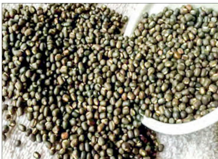
Sample of black gram is seen at brokerage.

In case of insufficient rainfall, black gram accounted for 52.1 per cent, red beans for 54.9 per cent, and green peas