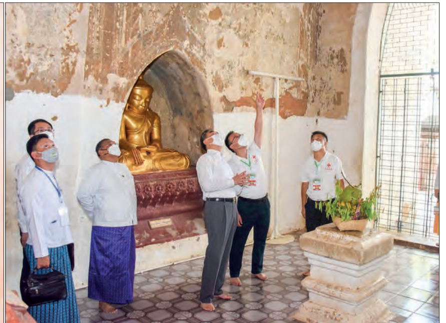
Union Minister U Wunna Maung Lwin and State Councilor and Foreign Affairs Minister of China Mr. Wang Yi view round renovation at Thabbyinnyu Pagoda in Bagan on 3 July.