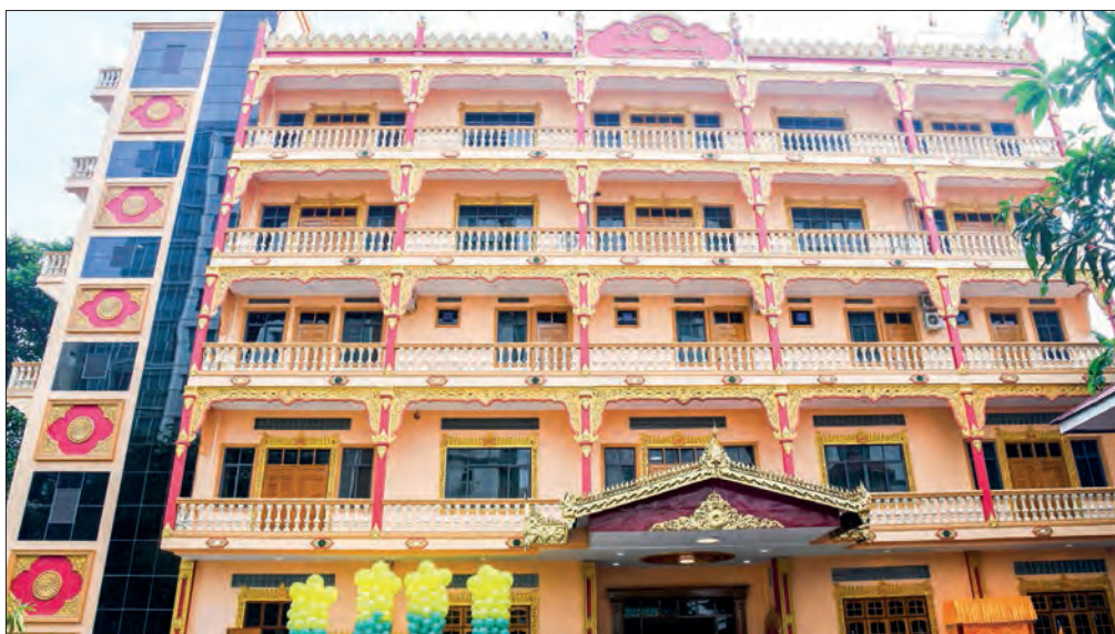
SAC Chairman Prime Minister Senior General Min Aung Hlaing sprinkles scented water on the plaque of five-storey Ananta Thukha Dhamma Beikman building on 3 July.