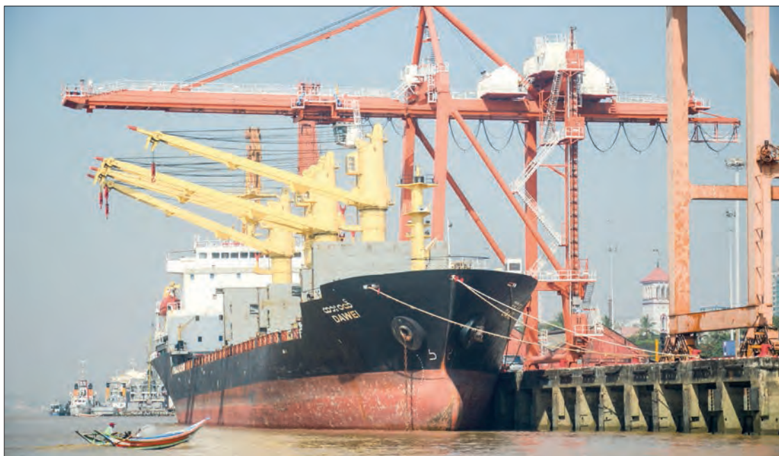
An oceanliner docks at Yangon port.

The Myanmar Port Authority and Yangon inner terminals are providing services to ensure the