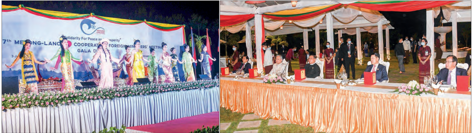
Foreign Ministers of Mekong-Lancang Cooperation enjoy entertainments of artistes at Gala dinner on 3 July.