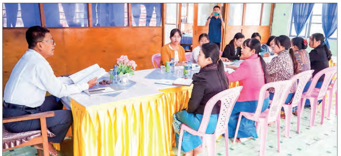
Deputy Minister for Information U Ye Tint meets staff of IPRDs on his inspection tour in Shan State (South) on 3 July.

During the meetings, the deputy minister called for emphasizing information and awareness of state stability and future tasks, cooperation