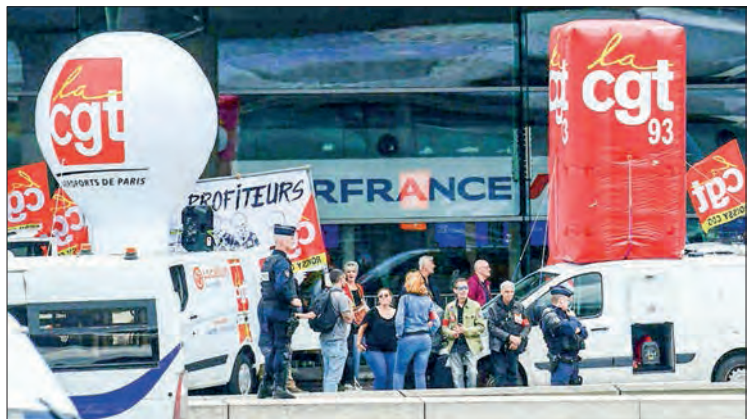
Airport workers striking for a third consecutive day on Saturday said they would stage another walkout at the French capital's main international hub from 8 to 10 July to press their pay demands, signalling further disruption for early summer travellers. Airport workers gather outside a terminal as they stage a strike at Roissy-Charles De Gaulle Airport, north of Paris, on 1 July 2022.

DUE to a technical problem at the Paris Charles de Gaulle airport (CDG) since Friday, at least 50 percent of passengers' baggages were stuck at the airport,