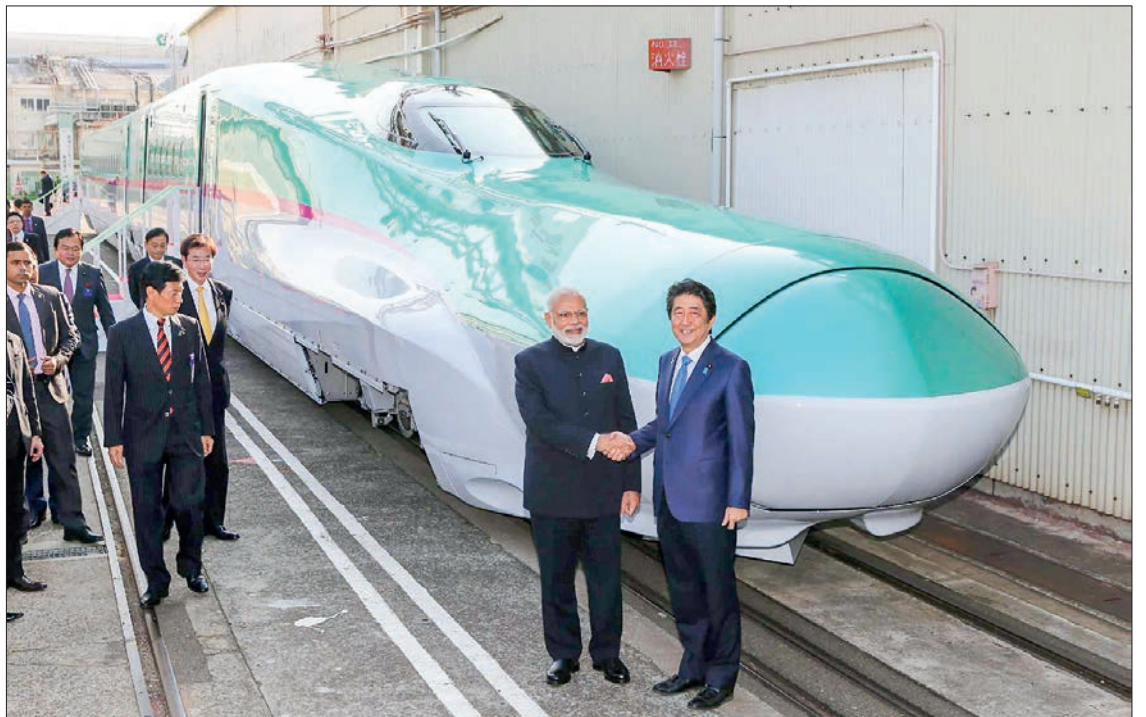
This photo taken in November 2016, shows India's Prime Minister Narendra Modi and his Japanese counterpart Shinzo Abe shaking hands in front of a Shinkansen train during their inspection of a bullet train manufacturing plant in Kobe, Hyogo prefecture.

The NHSRCL is a joint venture between the federal government and participating states for implementing high-speed rail projects including the touted Mumbai-Ahmedabad bullet train project, which is expected to be completed by 2028.—Xinhua