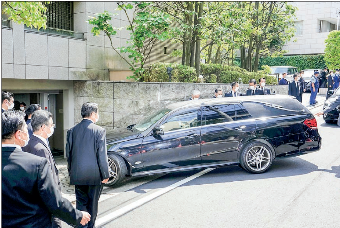
A car carrying the body of former Japanese Prime Minister Shinzo Abe arrives at his home in Tokyo's Shibuya ward on 9 July 2022, a day after he was shot dead in Nara, western Japan, while delivering a stump speech for the 10 July House of Councillors election.

JAPAN on 9 July mourns the assassination of former prime minister Shinzo Abe, whose body was moved to Tokyo from