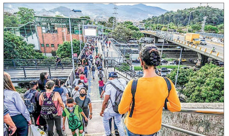
People queue on a bridge as they travel near a metro station on their way home before a curfew amid the COVID-19 pandemic in Medellin, Colombia, 31 March 2021.

because a significant group has not been vaccinated, and in older adults, the issue of the booster is extremely important,” he explained. Ruiz also stressed the need to accelerate testing to identify new cases in time, emphasizing that although the Omicron variant of the virus is dominant in the country and less lethal than others, it can still cause complications.—Xinhua