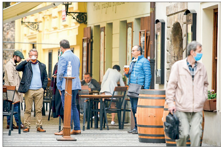
People enjoy drinks in the outdoor space of a restaurant in Prague, the Czech Republic, 11 May 2020.

THE Czech Republic has recorded 1,549 COVID-19 cases in the past 24 hours, the highest daily count since the start of May, data from the country’s Health Ministry showed Friday. The daily number of infections in the Czech Republic started rising at the end of June. Last week, the country reported more than 1,000 daily