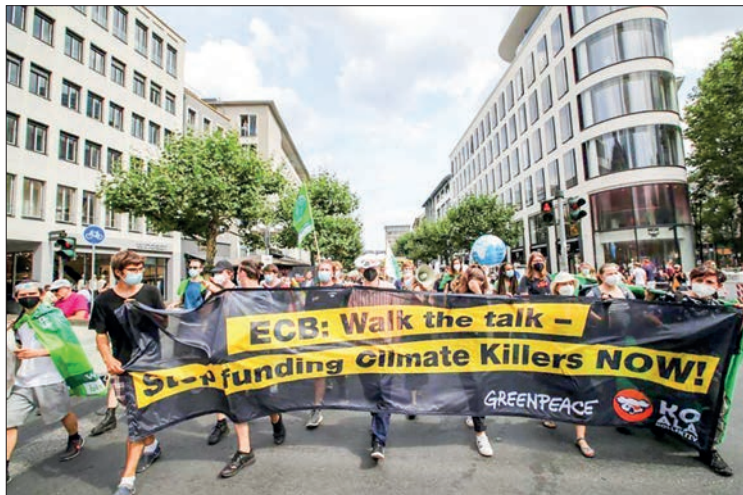
Climate activists in Germany walk with a banner calling on the ECB to "stop funding climate killers now" to protest against bank investments in fossil fuels.

THE European Central Bank on Friday called on banks to improve their preparations for future environmental risks as it published the results of its first "climate stress test".