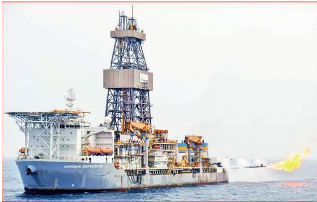
An undated photo shows an offshore oil rig vessel.

In order to avoid delays during the operation, a Notice to Mariners has been issued, prohibiting the passing or anchoring of any type of boat and vessel within four kilometres of the offshore blocks, it is reported. — TWA/GNLM