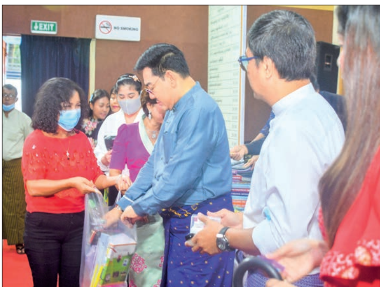
The ceremony to provide school supplies to MMPO members' children is in progress on 8 July.

MMPO members and artists representing ten film strata attended the ceremony. — MNA