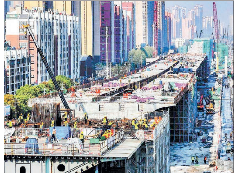
Workers are seen at the construction site of Baogong Main Road, a key urban transportation project in Hefei, Anhui province, in April.

year's government work report, aligning with the major strategic deployment and the 14th Five-Year Plan. The country's renewed calls for infrastructure investment were reiterated at a recent State Council executive meeting, which decided to raise up to 300 billion yuan (about 44.71 billion US dollars) through financial bond issuance for the capital replenishment of major projects, among other measures.—Xinhua