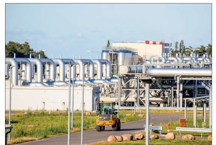
Germany is heavily dependent upon Russian gas that is delivered via the Nord Stream pipeline. The Nord Stream 2 gas line landfall facility in Lubmin, north eastern Germany.

Speaking at a press conference after a cabinet meeting, Le Maire also proposed new measures to help low-income families struggling with rising inflation that he said amounted to "around 20 billion euros."—AFP