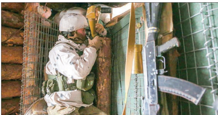
An Ukrainian Military Forces serviceman, watches through spyglass in a dugout on the frontline with Russia-backed separatists near Gorlivka, Donetsk region on 23 January 2022.