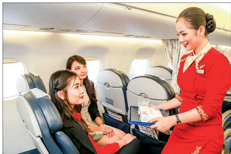
An MNA flight attendant is pictured serving air passengers.

MYANMAR National Airlines MNA will resume flights to the Republic of Korea (Yangon-Incheon-Yangon) from 22 July.