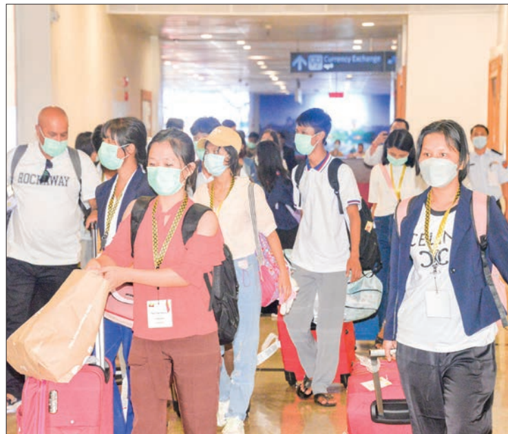
The highest-scoring students for the matric exam 2022 arrive back in Yangon on 8 July.

The trip was designed to enable students to gain domestic and international experiences and cultivate patriotism at the Nay Pyi Taw Council Area from 27 June to 1 July, in Thailand from 4 to 6 July, and in Singapore from 6 July to 8 July. — MNA