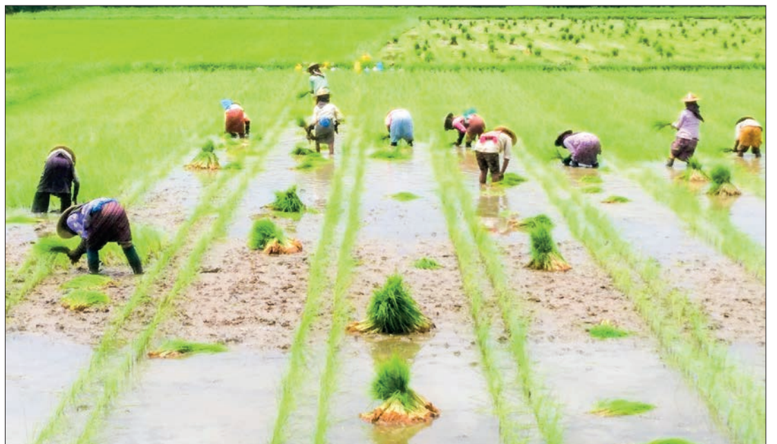
The department targets a total of 1,361,097 acres across 11 districts of the Mandalay Region.

The department targets a total of 1,361,097 acres across 11 districts of the Mandalay Region; PyinOoLwin, Kyaukse, NyaungU, TadaU, Maha Aungmye, Meiktila, Myingyan, Yamethin, Thabeikkyin, Amrapura and Aungmyaythazan.