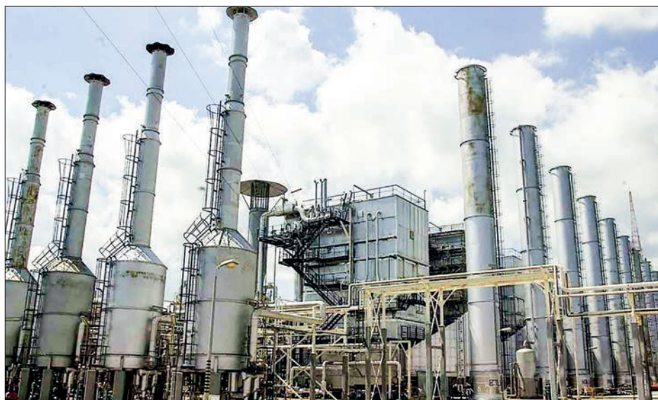
Oil and natural gas account for almost 90 per cent of Brunei's exports. Other exports include machinery and transport equipment (5 per cent) and chemicals (5 per cent). This photo shows the Brunei liquefied natural gas (LNG) processing plant located in Lumut, Brunei.

Of Brunei's imports in February, Kazakhstan accounted for 32.3 per cent, followed by Iraq with 17.4 per cent and Australia with 10.9 per cent. (1 Brunei dollar equals about 0.71 US dollar)—Xinhua