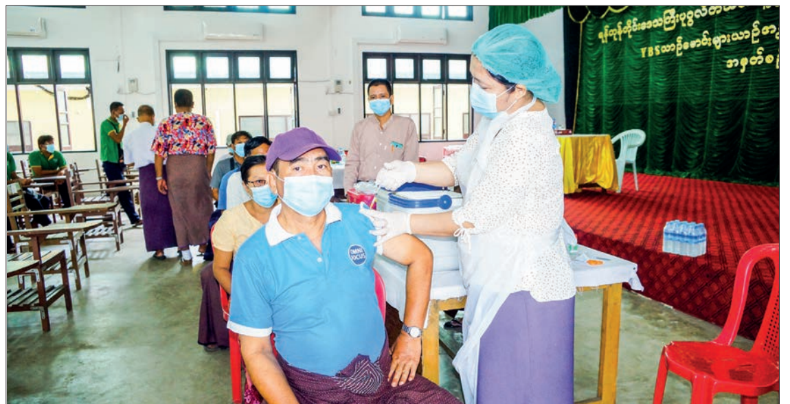
YBS drivers get booster doses at the YRTC office on 6 July 2022.

Currently, drivers of YBS bus lines operating in the Yangon Region, employers and their families are being vaccinated with the COVID-19 booster doses. To