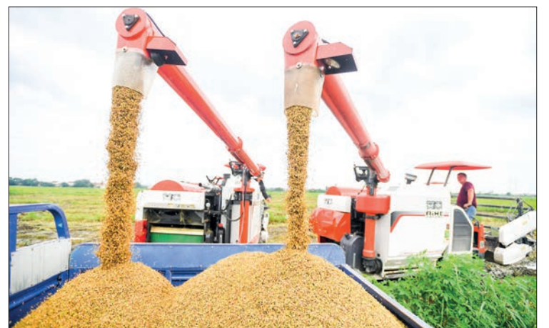
Members of the G20 have expressed concerns about soaring global food and energy prices triggered by the war between Russia and Ukraine.

diplomat said all participants were concerned about soaring prices of food and energy, and reiterated that the current crisis, including issues related to their accessibility, affordability, and sustainability, will continue to hinder global recovery. She said developing countries will be the most affected, particularly low-income countries and small island developing countries.—Xinhua