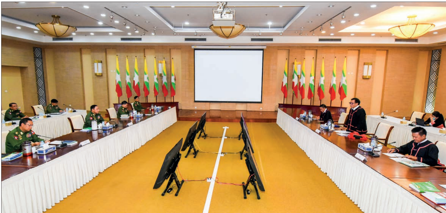
The second-day meeting between the State Peace Talks Team and the Lahu Democratic Union-LDU is in progress in Nay Pyi Taw on 9 July 2022.

THE State Peace Talks Team met representatives from the Lahu Democratic Union-LDU at the meeting room of the National Solidarity and Peacemaking Centre in Nay Pyi Taw yesterday morning.