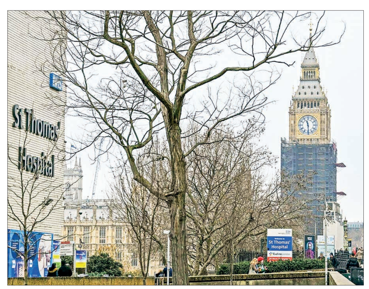
The previous record for persistent infection — rather than repeated bouts of Covid — is thought to be 335 days, the team from King's College London and Guy's and St Thomas' NHS Foundation Trust said.

But two patients had persistent infections for more than a year.