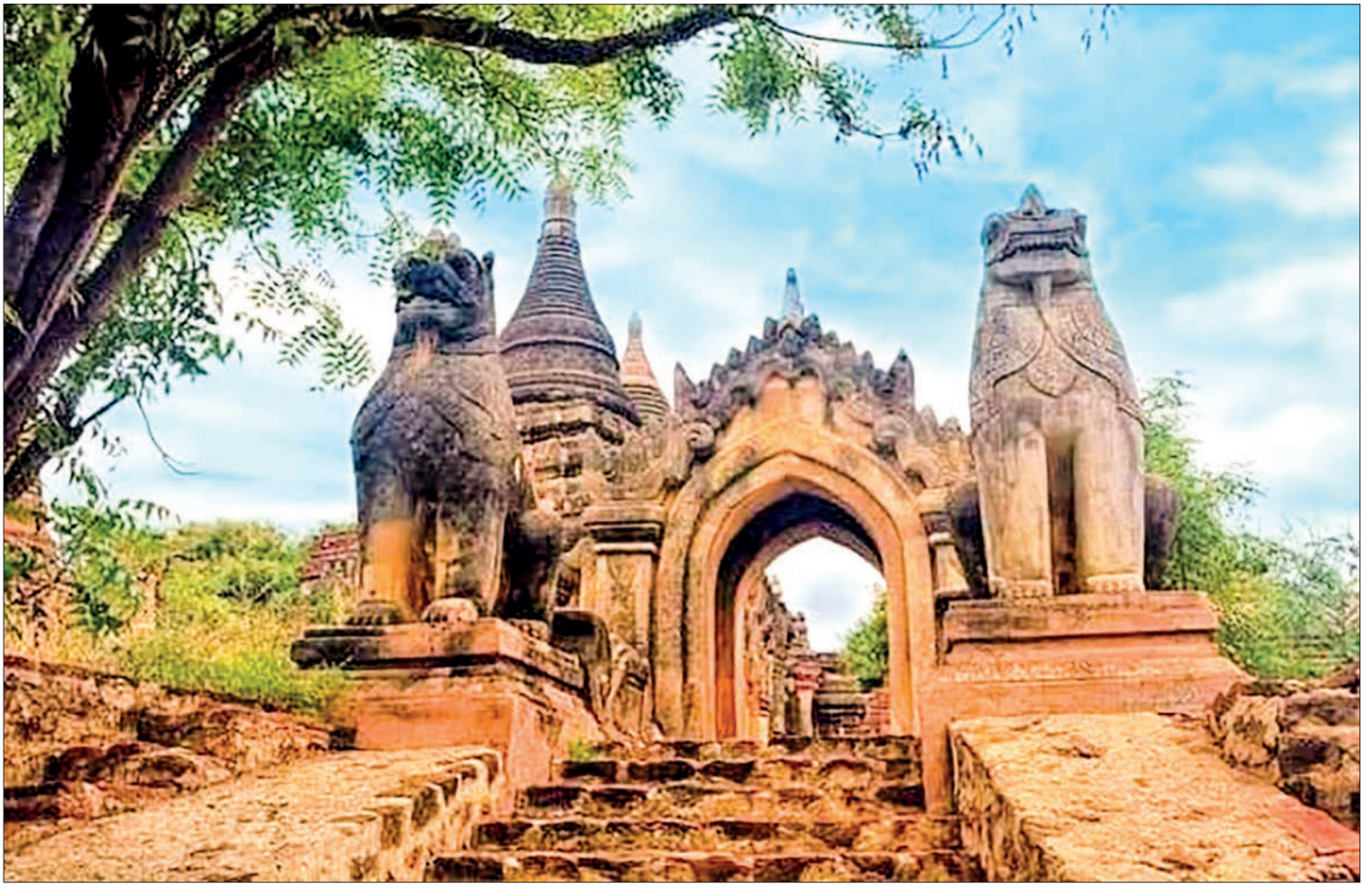
One of the cultural heritage pagodas in the Bagan area.

Bagan has been boasting its cultural heritage with the ancient temples and pagodas from the 12<sup>th</sup> Century AD. It's the invaluable treasure of the country with its architectural wonders and historical features. King Anawrahta of the first Myanmar Empire founded Bagan as well. The visitors can feel the historical significance,