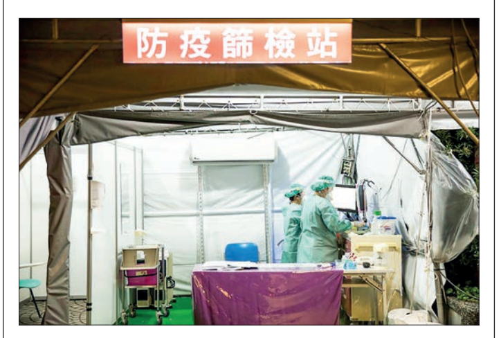
Medical workers are busy at the screening station for possible COVID-19 cases at a hospital in Taipei on 30 March 2020.

With no fresh death reported in the past 24 hours, the death toll remained unchanged at 856 including 842 fatalities from local cases and the other 14 from imported cases. – ANI