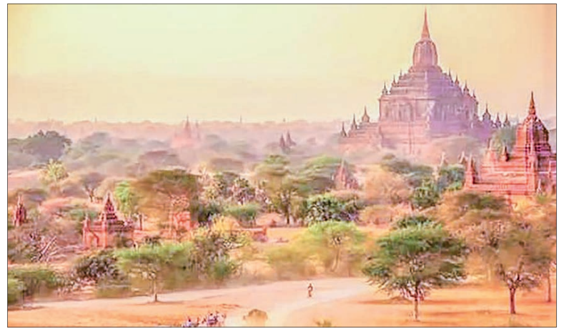
Myanmar's ancient cultural heritage lies in Bagan – the heart of the country.

Preserving and protecting the lacquerware arts to date and maintaining temples and pagodas from the Bagan dynasty is a price of the Bagan zone. The locals have been preserving it as vocational education and passing on the future generation is a national responsibility. Lacquerware College (Bagan), operated under the Department of Cooperative and the Depart-