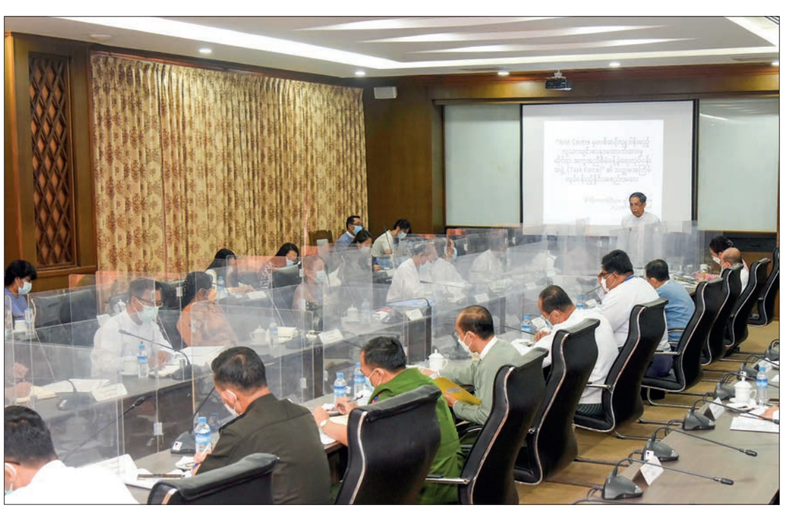
The seventh Coordination Meeting of the Task Force to facilitate the provision of Humanitarian Assistance to Myanmar through the AHA Centre is convened in Nay Pyi Taw yesterday.

The Meeting reaffirmed continued support to facilitate swift and effective implementation of the whole process in close coordination with Cambodia, the ASEAN Secretariat and the AHA Centre. —MNA