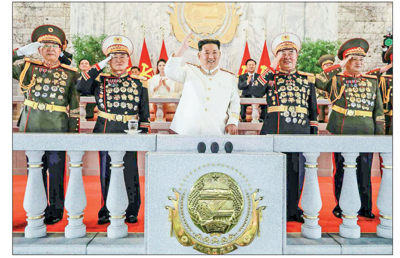
North Korean leader Kim Jong Un (C) attends a military parade in Pyongyang on 25 April 2022, as reported in North Korea's Rodong Sinmun the following day.

In recent years, North Korea has held military parades, aimed at enhancing national pride, at night to liven up the festive mood through colourful lights, foreign affairs experts said.—Kyodo