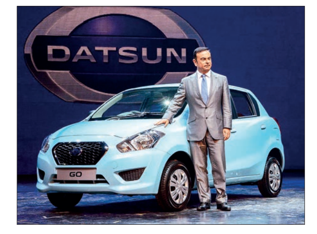
Nissan Motor Co. has ended the production of its Datsun brand vehicles for emerging markets amid poor sales. PHOTO: KYODO

"Crypto evangelists promise heaven on earth, using an illusory narrative of ever-rising crypto-asset prices to maintain inflows and thus the momentum fuelling the crypto bubble," said Panetta. —AFP