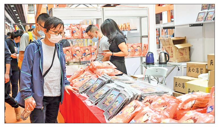
Visitors learn about food from Malaysia at the 6th China (Quanzhou) Maritime Silk Road International Brand Expo in the city of Shishi in Quanzhou, southeast China's Fujian Province, 30 October 2020.

ASIAN nations, like the rest of the world, are being battered by countervailing forces such as the war in Ukraine that are raising prices while holding back growth,