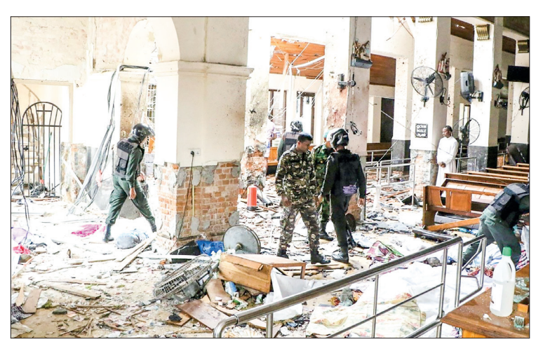
Security forces inspect a church hit by a bomb in Colombo, Sri Lanka in April 2019.

Lankans in Italy, including some of the victims, the pope also said he prayed that Sri Lanka will also be able to ride out the worst economic crisis in its history.