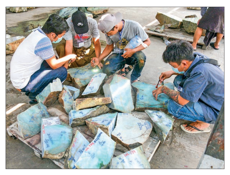
Gemstone traders are seen evaluating jade lots at the 57th Myanma Gems Emporium yesterday.

The Myanma Gems Emporium has been successfully held since 1964 to earn foreign income and develop the economy for the citizens, reaching its 57<sup>th</sup> event. The local and foreign gemstone merchants peacefully observed the displayed pearl lots and jade lots during the event. — MNA