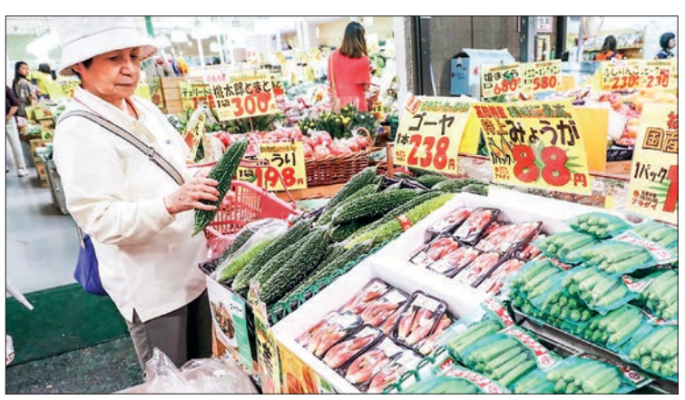
The relief measures, compiled before a House of Councillors election in July, come as rising fuel costs and food prices are threatening to hurt consumer sentiment.

The relief measures, compiled before a House of Councillors election in July, come as rising fuel costs and food prices are threatening to hurt consumer sentiment, with the economy yet