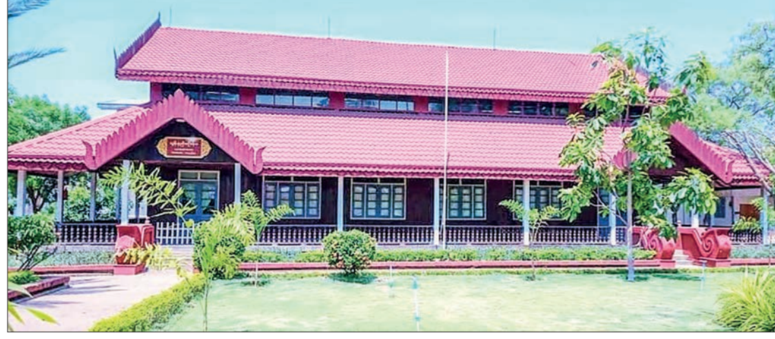
Lacquerware technology Hall in the campus.