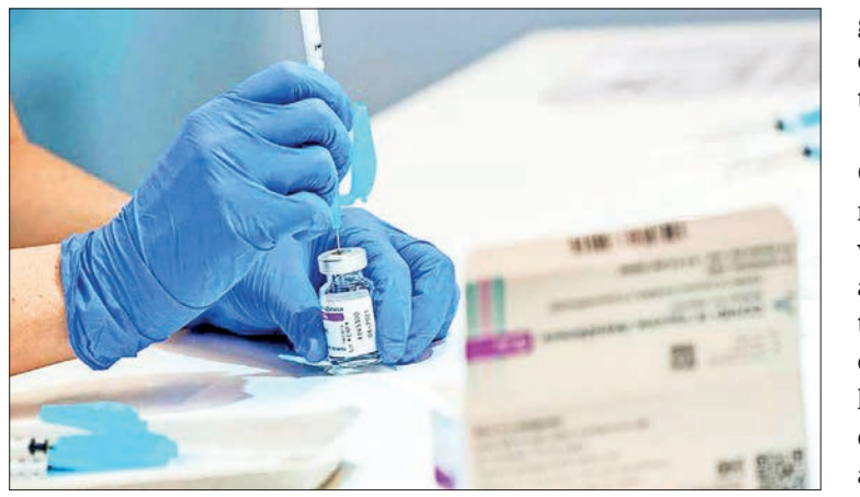
AstraZeneca is committed to working with all parties to bridge the vaccine gap and strengthen exchanges on anti-pandemic experience through digital means.

ASTRAZENECA, a multinational biopharmaceutical company, is keen to cooperate with China on a wide range of topics, including global anti-epidemic cooperation and promoting healthcare innovations, said the head of the company at the Boao Forum for Asia Annual Conference 2022.