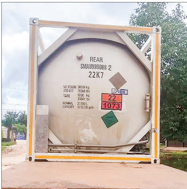
The Ministry of Commerce has permitted the import of COVID-19 protective equipment and liquid oxygen, which do not require an import licence or to apply for the licence.

THE Ministry of Commerce has permitted the import of COVID-19 protective equipment and liquid oxygen, which do not require an import licence or to apply for the licence, officials said.