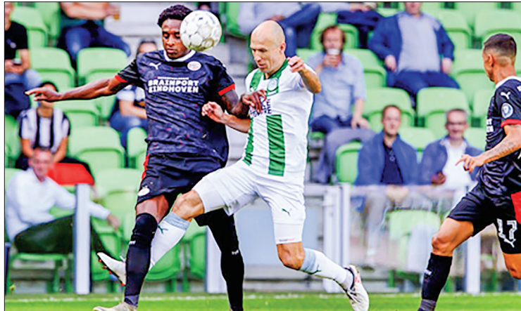
PSV Dutch midfielder Pablo Rosario (L) fights for the ball against Groningen's Dutch midfielder Arjen Robben during the Dutch Eredivisie league football match between FC Groningen and PSV at the Hitachi Capital Mobility stadium on September 13, 2020 in Groningen.

skillful dribblers in his prime, with a devastating left foot, Robben scored more than 200 goals at club level and 37 for the Netherlands, the last against Sweden in Amsterdam in October 2017.