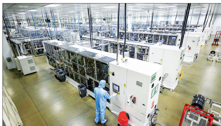
Nissan employees make final checks to cars on the production line at Nissan's plant in Sunderland, north east England on July 1, 2021.

The UK's Unite union welcomed the plans and potential jobs as a "huge shot in the arm" for the West Midlands economy. "The promise of 6,000 jobs and thousands more in the supply chain is exactly what we need to bring stability to the sector during these rocky times," Unite assistant general secretary Steve Turner said. Construction of Nissan's £2.6-billion plant in Blyth was announced in December and construction is to start soon, with the potential creation of 6,200 jobs. — AFP ■