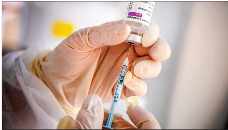
The European Medicines Agency said that evidence suggests that "both doses of a two-dose Covid-19 vaccine... are needed to provide adequate protection against the Delta variant".

Calling it a "variant of concern", the EMA said the Delta strain, first detected in India, was "spreading fast in Europe and may seriously hamper ef-