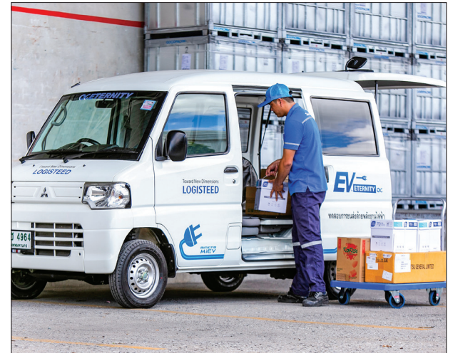
Photo shows Mitsubishi Motors Corp.'s battery-driven Minicab MiEV, which will be used to deliver goods in Thailand under a pilot study to be implemented by the Thai subsidiaries of the Japanese automaker and Hitachi Transport System Ltd.