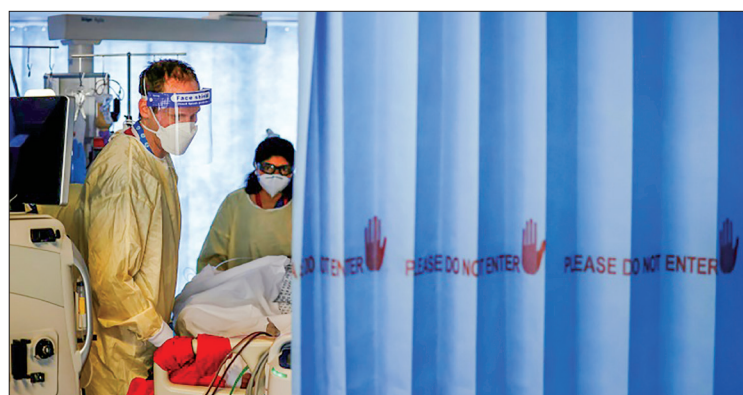
Authors of the study said their findings showed a "profound" short- and long-term health impact on Covid-19 patients as well as on health and care services.

AS many as one in every two people hospitalized with severe Covid-19 go on to develop other health complications, according to comprehensive new research