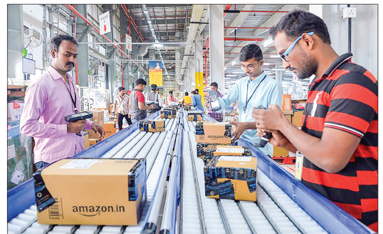
Employees of Amazon scan packages at an Amazon's Fulfillment Centres (FCs) situated in the suburban area of Bengaluru.

US Treasury Secretary Janet Yellen said Thursday she is "not certain" if Amazon will have to pay up under a worldwide minimum tax she is encouraging countries, including her own, to adopt.