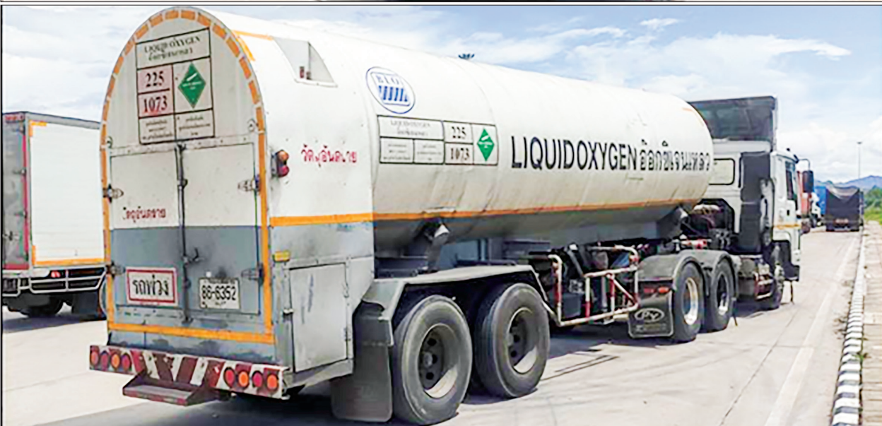
Two bowsers with a capacity of 20 metric tons of liquid oxygen each, the first batch of 26 similar bowsers purchased from foreign countries, arrives in Yangon yesterday.

AS the country needs oxygen supplies in COVID-19 control operations, the officials make efforts to produce oxygen from the government and Tatmadaw-owned oxygen plants, private-owned oxygen plants and import oxygen-related products with the donations of donors.