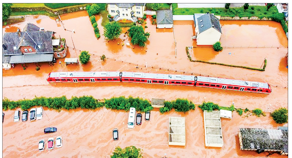
Some towns in Germany were completely underwater.

But Germany's toll was by far the highest at 81, and likely to rise with large numbers of people still missing in North Rhine-Westphalia and Rhine-