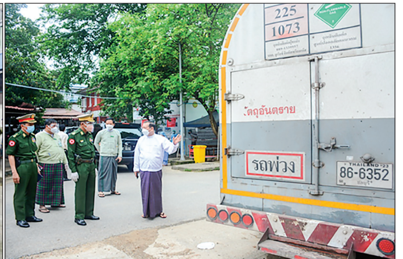
The Chairman of the Yangon Region Administration Council and Commander of Yangon Command are inspecting the arrivals of two bowsters of liquid oxygen at the North Okkalapa Hospital and Yangon General Hospital, respectively.