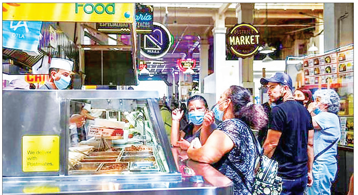
Mandatory indoor mask use returns to Los Angeles.

On Thursday the county reported 1,537 new cases of infection — the highest number since early March, and seventh straight day of new cases numbers topping 1,000. — AFP ■