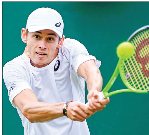
Australian tennis player Alex de Minaur will miss the Olympics after testing positive for Covid-19, according to the country's Olympic officials.