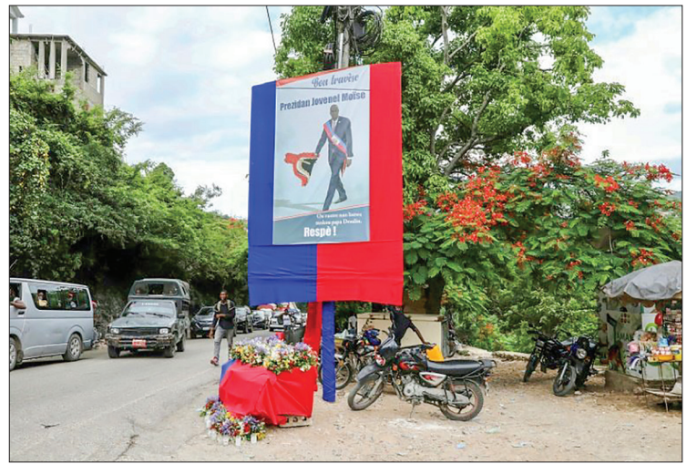
A tribute to late Haitian President Jovenel Moise is seen outside his home in Port-au-Prince.

In October 2017 a police mission -- the United Nations Mission for Justice Support in Haiti -- took over and lasted until October 2019. Any fresh UN operation would have to be authorized by the UN Security Council, according to several diplomats. — AFP ■