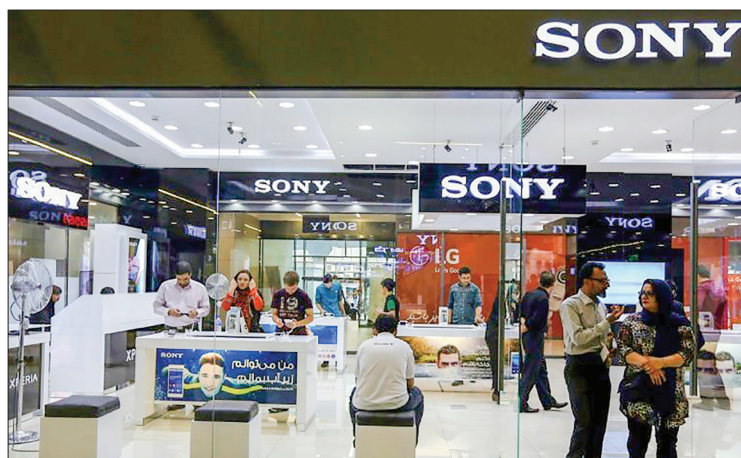
Iranians shop for electronics from Japanese tech giant Sony at a Tehran mall in 2015 amid hopes for sanctions relief.

90 days as "these repayment transactions can sometimes be time-consuming," a State Department spokesperson said. — AFP ■