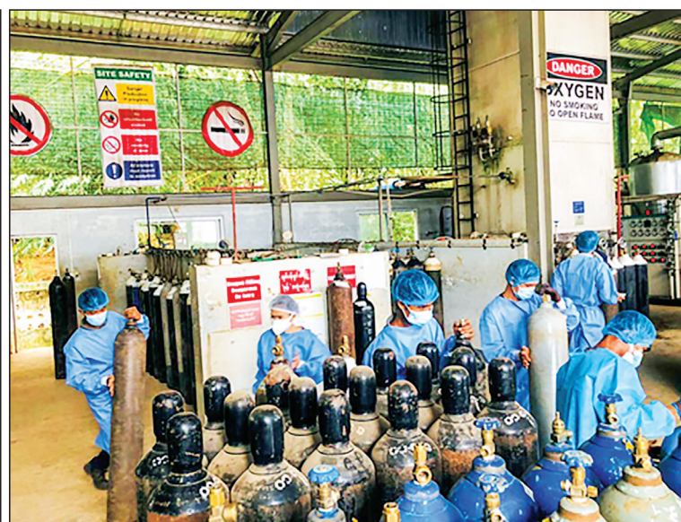
Distribution of oxygen cylinders produced by Myanmar Economic Corporation.

Factory operated by the Myanmar Economic Corporation in Insein Township.