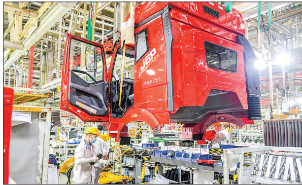
Workers work at the general assembly line of truck maker FAW Jiefang in Changchun, northeast China's Jilin Province, July 7, 2021.