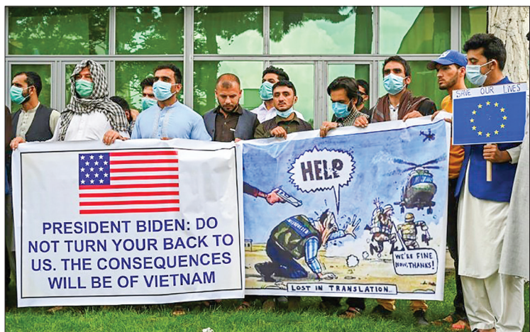
Afghan former interpreters for the US and NATO forces demonstrate in Kabul in April after US President Joe Biden announced the US withdrawal from the country.

ABOUT 20,000 Afghans who worked as interpreters for the United States during its war in