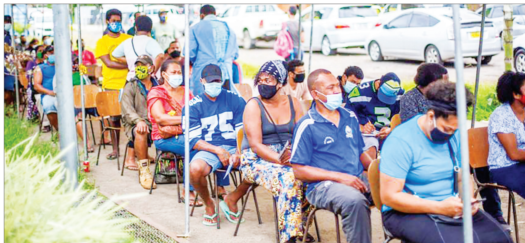
Residents waiting for their Covid-19 vaccine in Suva, Fiji, on July 9, 2021.

The Pacific archipelago of Wallis and Futuna has declared itself Covid-free, with no cases among the French remote island's 11,500 inhabitants since 1 April, authorities said.