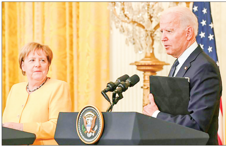
US President Joe Biden and German Chancellor Angela Merkel had warm words but the visit was overshadowed by deadly floods.

Despite the Biden administration's insistence that this was a "working visit", Merkel's one day stay at the White House had the hallmarks of a valedictory farewell for one of Europe's key political figures.