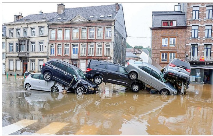
According to the federal police, dozens of road sections remained closed to traffic, as well as most of the railways in Wallonia.

AS of Friday morning, the floods in East and South Belgium have led to the deaths of at least twelve people while five others are missing.