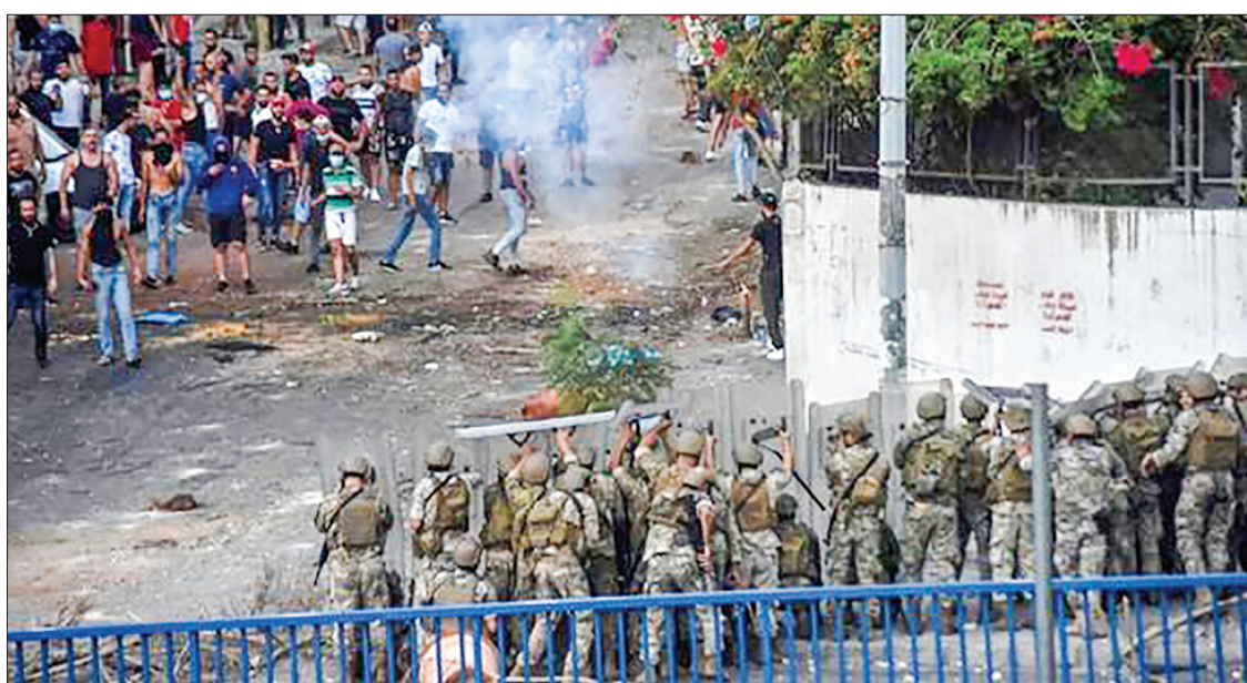
Lebanese soldiers fire rubber bullets during sporadic clashes with supporters of Lebanon's prime minister-designate Saad Hariri, who stepped down saying he was unable to form a government, in the capital Beirut on Thursday.

Hariri's announcement -- nearly a year after a deadly