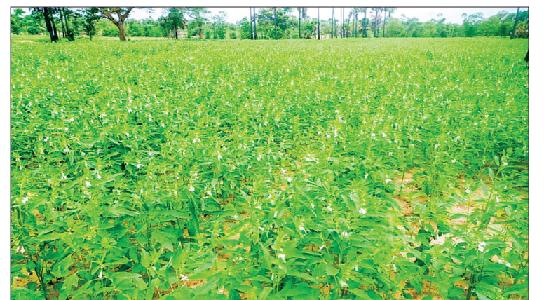
The growers from NyaungU Township are mainly relying on oil crops such as peanut and sesame. The growers are expecting a good price at the harvest time.

ed sesame enter the market, U Maung Htay elaborated.