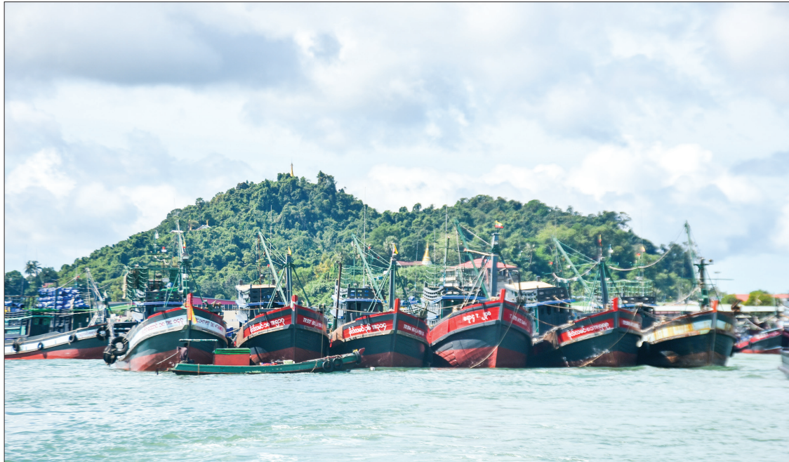
This month, about 50 per cent of offshore fishing vessels will be allowed to go fishing, depending on fishing equipment.

This month, about 50 per cent of offshore fishing vessels will be allowed to go fishing, de-