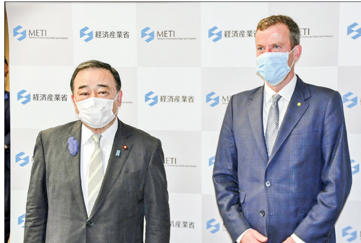
Japanese Economy, Trade and Industry Minister Hiroshi Kajiyama (L) and Australian Trade, Tourism and Investment Minister Dan Tehan pose in Tokyo on July 15, 2021, before the start of Japan-Australia economic dialog, also involving Australian Energy and Emission Reduction Minister Angus Taylor, who is to take part in the meeting remotely.

Voicing expectations for early enforcement and full implementation of the RCEP by all 15 member states, the ministers