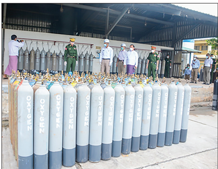
Production of oxygen cylinders at Ywama Steel Factory, Insein.