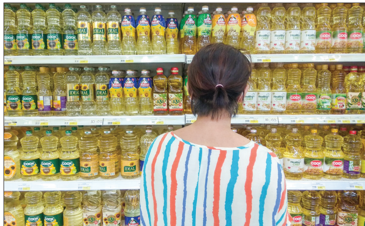
The association will act accordingly not to have oil shortage problems and to distribute the quality oil at an affordable price to the consumers.

THERE is no need to spark concern for the edible oil shortage in the country, Myanmar Edible Oil Dealers' Association released a statement on 15 July.