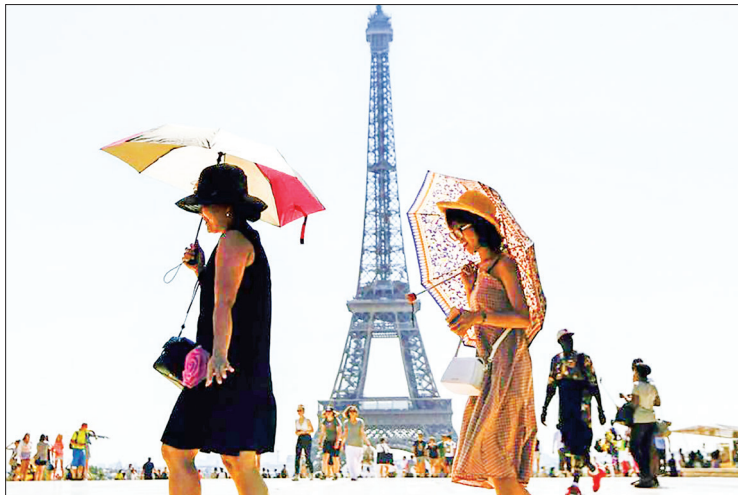
Daily capacity is set to be restricted to 13,000 people, about half of the normal level.

THE Eiffel Tower is to reopen to visitors on Friday for the first time in nine months following its longest closure since World War II.