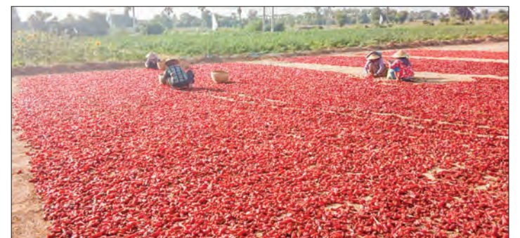
The prevailing price of exported dried chilli without stem is ranging K4,000-K4,500 per viss (a viss equals 1.6 kg), while the price of dried chilli with stem is K3,200 per viss, the domestic market's data indicated.