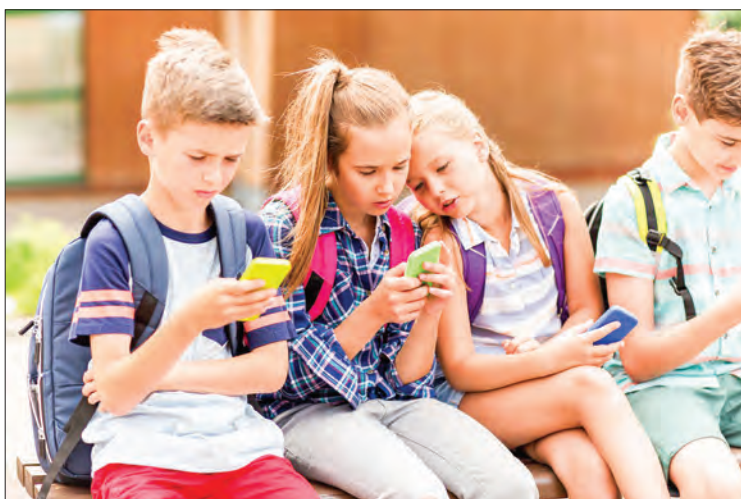
A consortium of US states announced a joint probe Thursday of Instagram's parent company Meta for promoting the app to children despite allegedly knowing its potential for harm, in fresh regulatory trouble for the scandal-hit network.

A consortium of US states announced a joint probe Thursday of Instagram's parent company