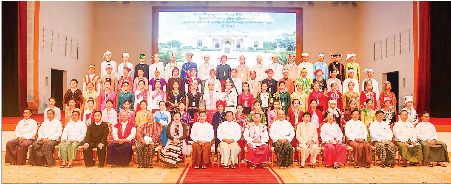
The Prime Minister and Deputy Prime Minister pose for the documentary photo with the SAC members, Union ministers, officials and students.