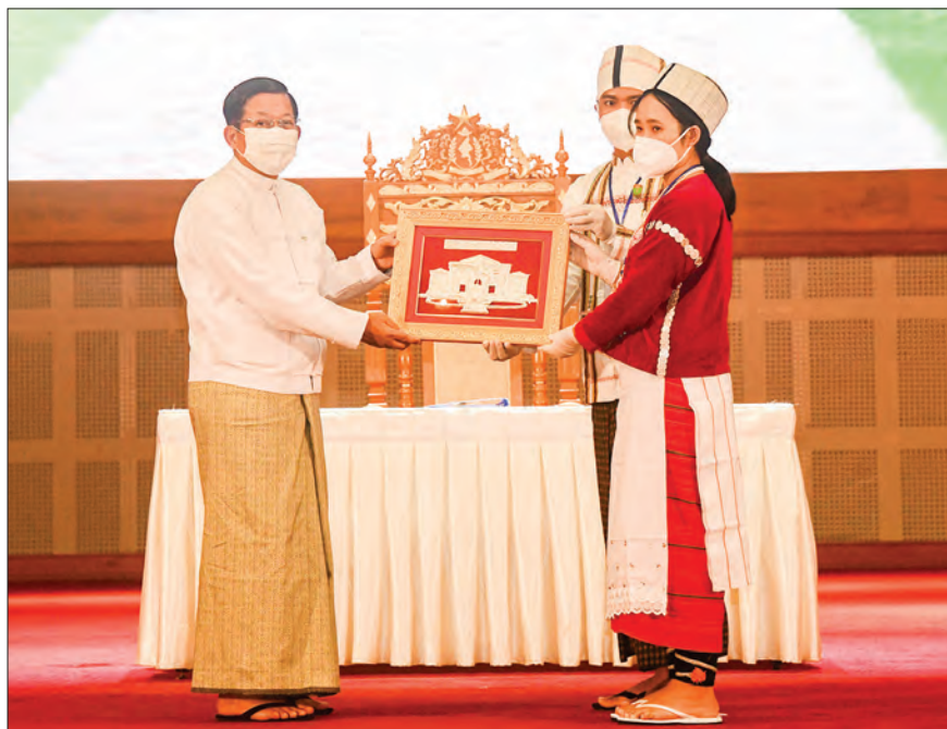
The Senior General receives the gift from the university.