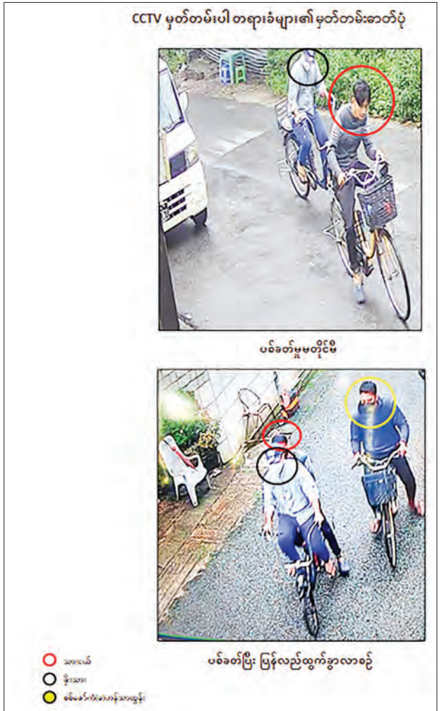
Culprits are seen by the CCTV.