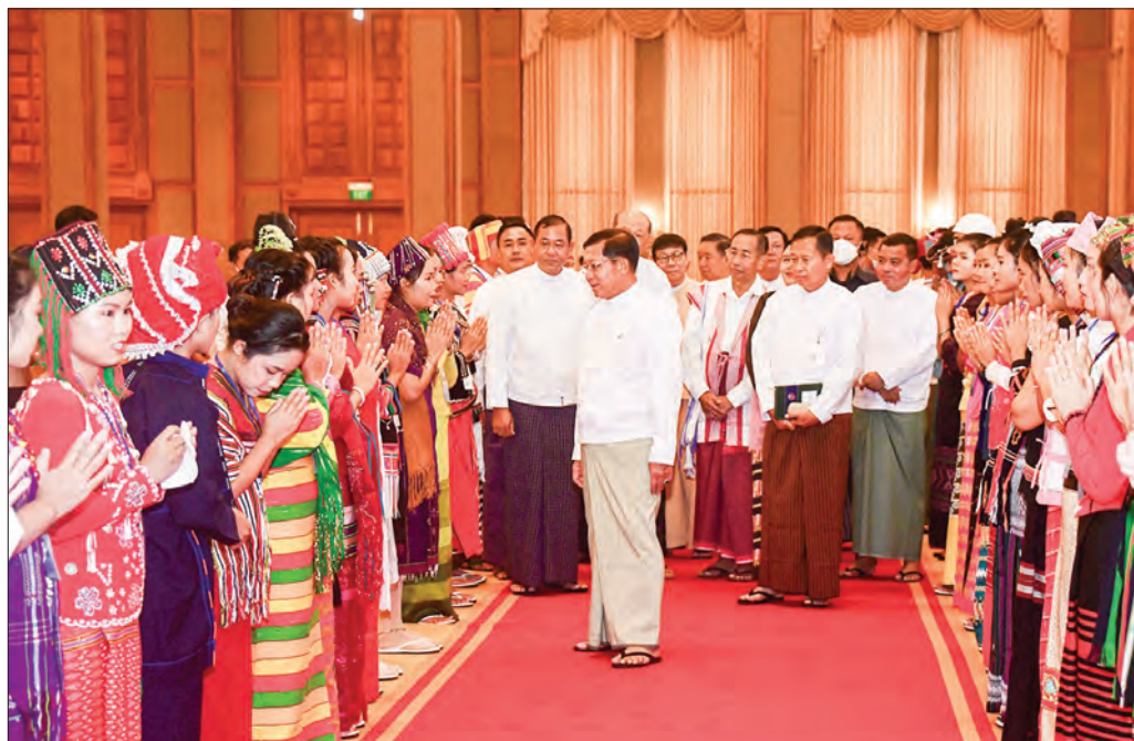
The Senior General is seen warmly greeting the university students.

ened with physical and mental health for ensuring the beauty of the nation in the future. Hence, the graduates of the UDNR need to nurture the students to be healthy and fit.