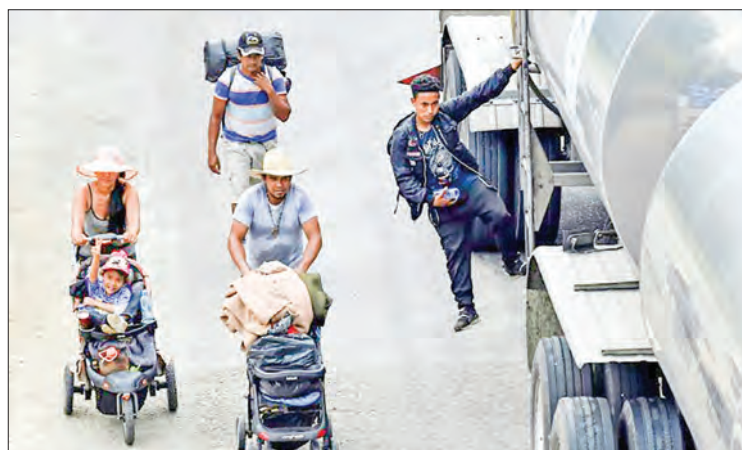
Thousands of migrants from Central America, Haiti and Venezuela have entered Mexico, with many aiming to reach the US border to the north. PHOTO: AFP

Several members of the earlier caravan, which now stands at about 800 people, have accepted documents providing them temporary residence in Mexico, although others plan to continue their way towards the United States.—AFP ■