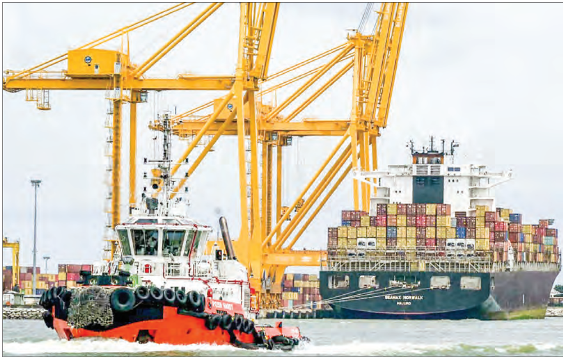
Sri Lanka is the biggest so-called transshipment hub in South Asia, meaning that some of the world's biggest ships dock in Sri Lanka to load and unload containers.

U.S. Commerce Secretary Gina Raimondo said Wednesday the United States will start negotiations with allies early next year on a new Indo-Pacific economic framework.