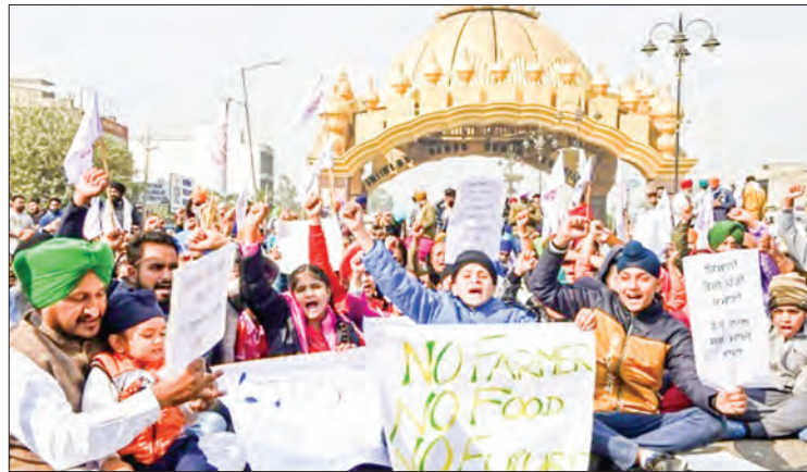
Farmers staged a protest against the three central agriculture laws at Jandiala Guru Dana Mandi in Amritsar on 24 April 2021.

"The intention was that the country's farmers, especially the small farmers — who are almost 80 per cent of all farmers, and have the smallest landhold-