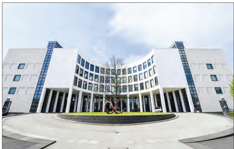
The Federal Public Prosecutor's Office (Bundesanwaltschaft) in Karlsruhe, southwestern Germany, where the majority of top officials were former Nazis into the 1970s, according to the new report.

GERMANY'S justice system was still filled with former Nazis well into the 1970s, as the Cold War coloured efforts to root out fascists, according to a damning official inquiry presented Thursday.