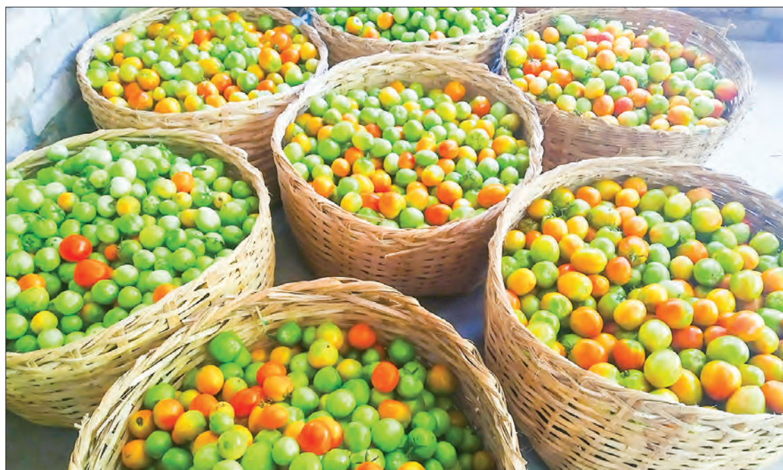
Now, the local growers are making a good profit from their plantations. Although the rain was the mainstay of the early tomato cultivation, later, the farmers rely on dew to grow winter tomatoes. Late monsoon period, the plants get well water.

Some growers are facing problems with their plants being restored by the infestation. According to the local growers, they are taking care of their plants using fertilizer and pesticides.