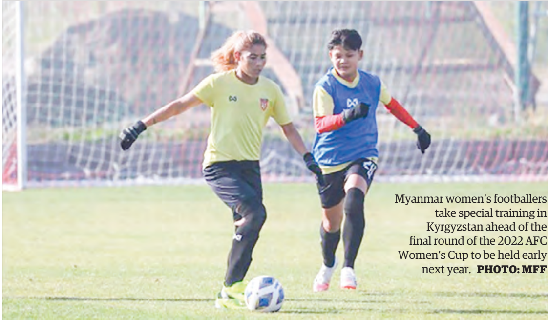
Myanmar women's footballers take special training in Kyrgyzstan ahead of the final round of the 2022 AFC Women's Cup to be held early next year.

THE Myanmar women's team will play international friendly matches before the final round of the 2022 AFC Women's Cup to be held early next year.