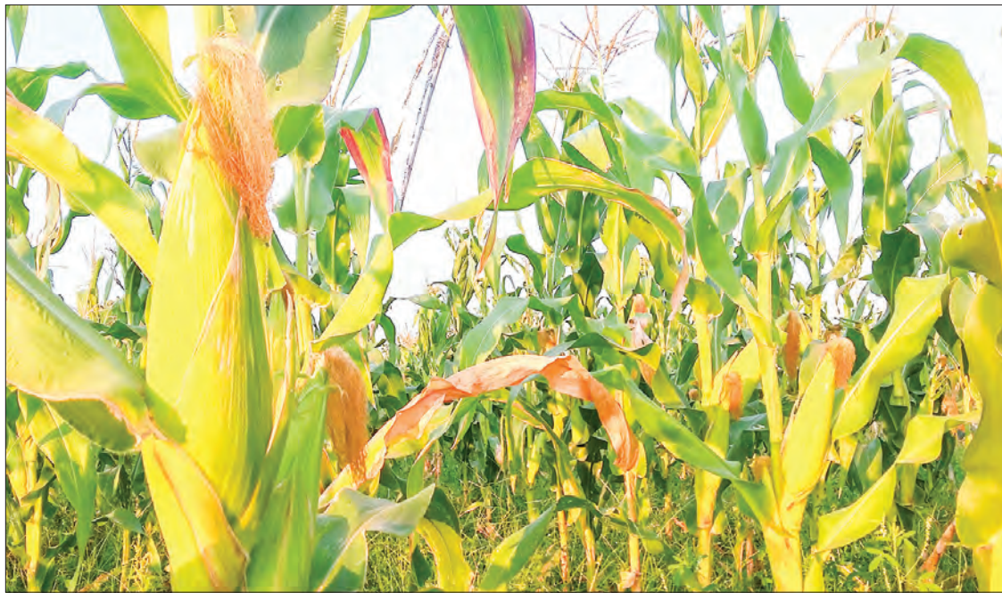
Sagaing Region Agriculture Department projected to proceed with planting the corn as a winter crop after a successful yield of the corn as a monsoon crop in the financial year 2020-2021 growing season.

awareness of fall armyworm invasion in the farms. It distributed 5,000 insecticides for natural pest management, the department stated.