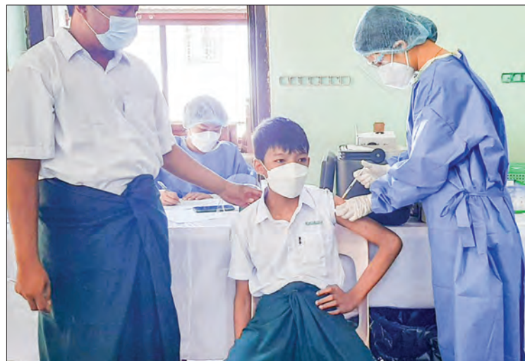
An above 12-year-old student gets jabbed in Mawlamyine.

fessionals, education officers and civil society association.