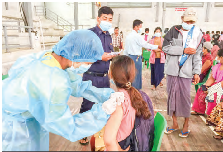
Inoculation drive in Madaya.

HEALTHCARE officials gave COVID-19 vaccines to local people aged 18 and above at Aung San Hall of Basic Education High School (Madaya), Township Gymnasium, and Villages in Madaya Township, PyinOoLwin District, Mandalay Region, respectively, on 19 November.