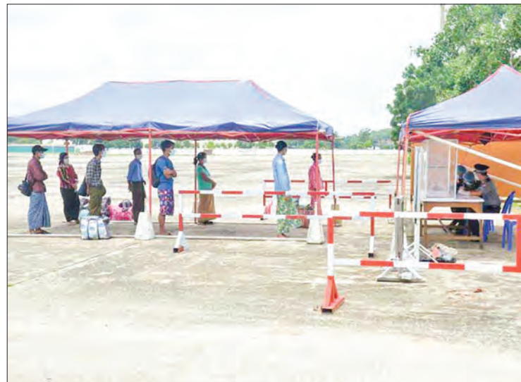
Covid tests are underway at one of the COVID-19 centres.

COVID-19 positive patients and those required to be monitored are systematically ad-