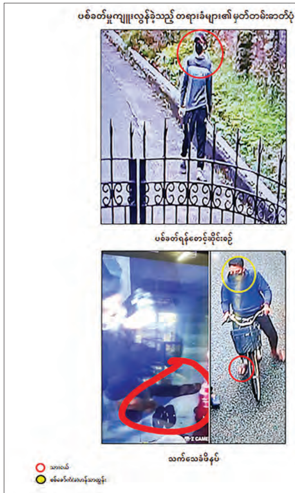
Culprits are seen waiting for killing the Mytel's GM.