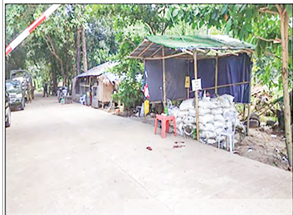
Incident site in Mingaladon Township.