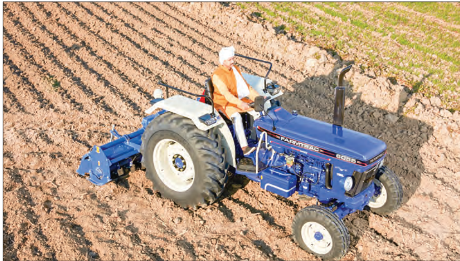
A tractor made by India's Escorts Ltd., in which Kubota Corp. will acquire a majority equity stake

MAJOR agricultural machinery maker Kubota Corp. will obtain a majority stake in Indian peer Escorts Ltd. as a step toward becoming a main player in the country's tractor