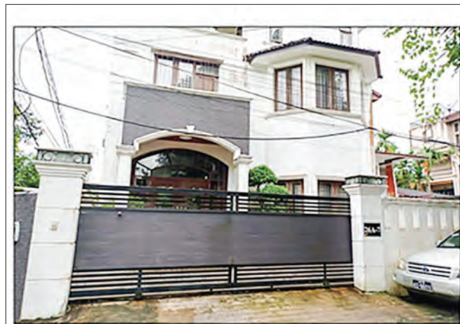
The shooting site in front of the house in Mayangon Township.

It is reported that the arrested suspects will be taken action under the law, and the people are requested to work together for the peace and safety of the towns and villages by covertly providing information about the connected suspects to the relevant authority.—MNA