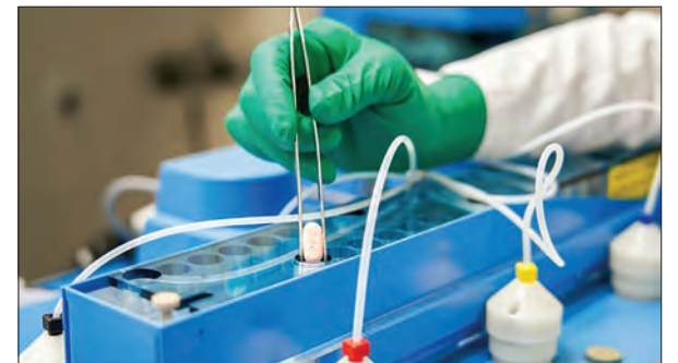
Pfizer will begin delivering Covid-19 treatments to the US government later this year and through the end of 2022.

"We were thrilled with the recent results of our Phase 2/3 interim analysis, which showed overwhelming efficacy of PAXLOVID ...and are pleased the US government recognizes this potential," Pfizer Chairman and CEO said Albert Bourla said in a statement.—AFP ■