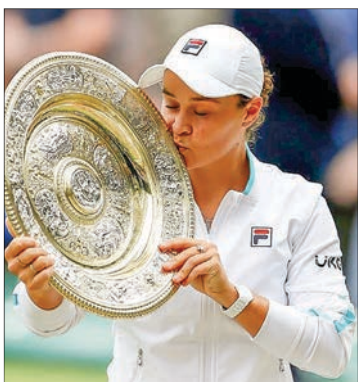
World number one Ashleigh Barty has got engaged to her long-time boyfriend.