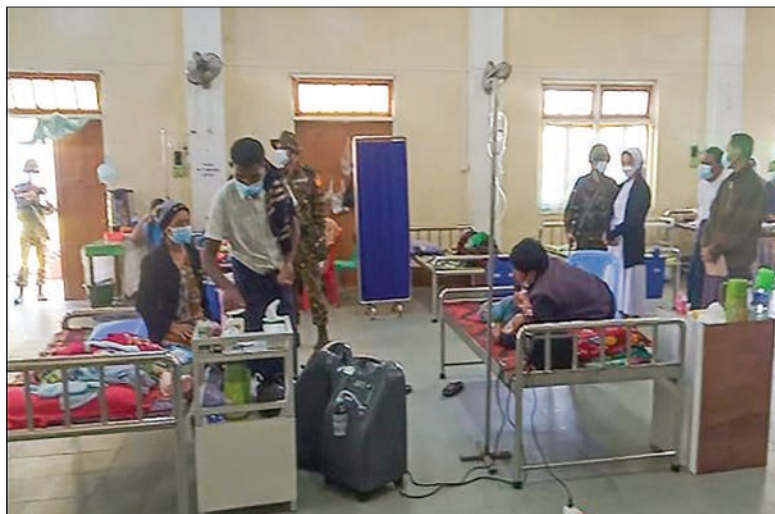
Patients under unofficial medical treatment.