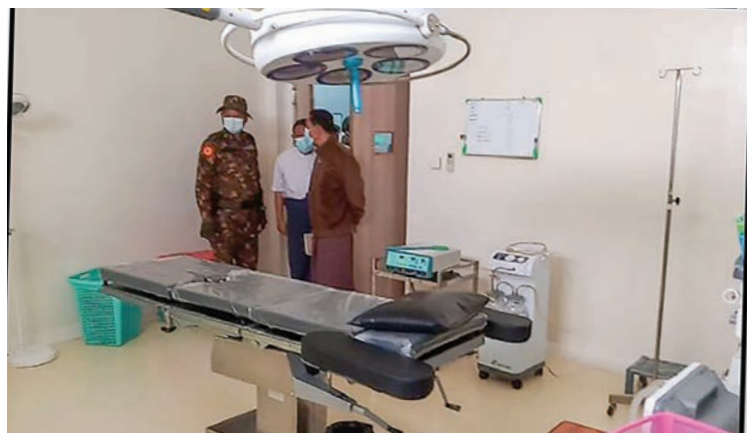
Unofficial operating theatre.