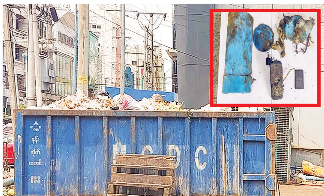
Two sound bombs blast in Chanayethazan and Maha Aungmye townships.

The people are urged to work together to prevent terrorist acts such as mine planting and setting fire by the terrorists for ensuring development, peace and stability of the State, and if