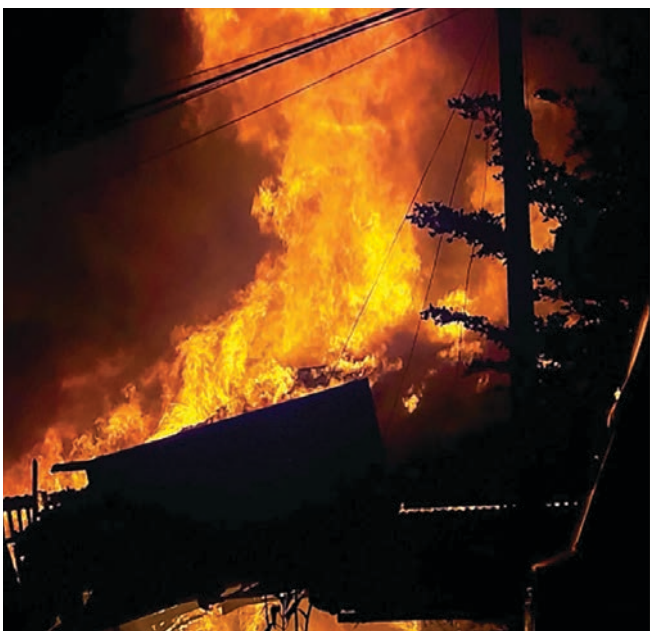
Arson attack on Kangyidaunt Myoma market on 1 June 2021.