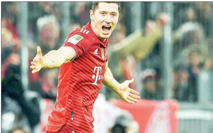
Robert Lewandowski set a new single-season Bundesliga record with 41 goals.

ROBERT Lewandowski is in the running to retain his Best FIFA Men's Player award after he was named Monday on an 11-man shortlist alongside Karim Ben-