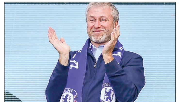
Chelsea's Russian owner Roman Abramovich turned his club into a superpower.

He brought Jose Mourinho to Stamford Bridge in 2004, with the Portuguese boss winning the Premier League title in his first season in charge as the Blues ended a 50-year wait to be crowned champions of England. — AFP ■