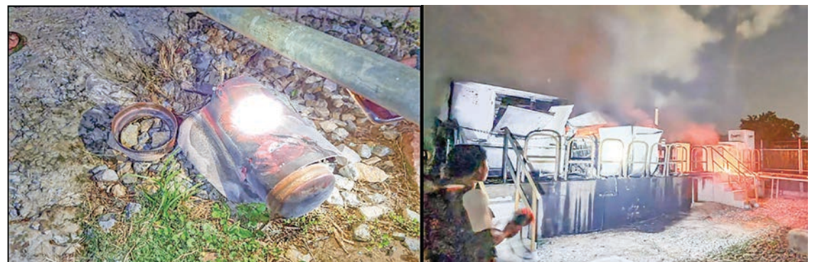
Ravages are seen after handmade bomb blast at Mytel tower in Amarapura Township.