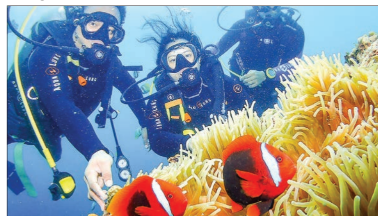
After more than a year in the doldrums, tourism in the coastal Mabini town, known as the "birthplace" of scuba diving in the Philippines, is enjoying a rebound with visitors returning to see the beautiful seaside scenery and explore rich species underwater.