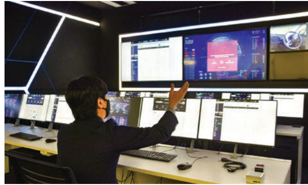
A Panasonic Corp. official talks about the company's security system to monitor cyberattacks against internet-connected cars at a mock-up surveillance centre in Tokyo on 22 Oct 2021.

the company's system is capable of doing just that.—Kyodo