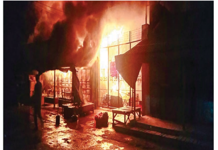
Fire on stalls at Nawngkhio market on 8 June 2021.