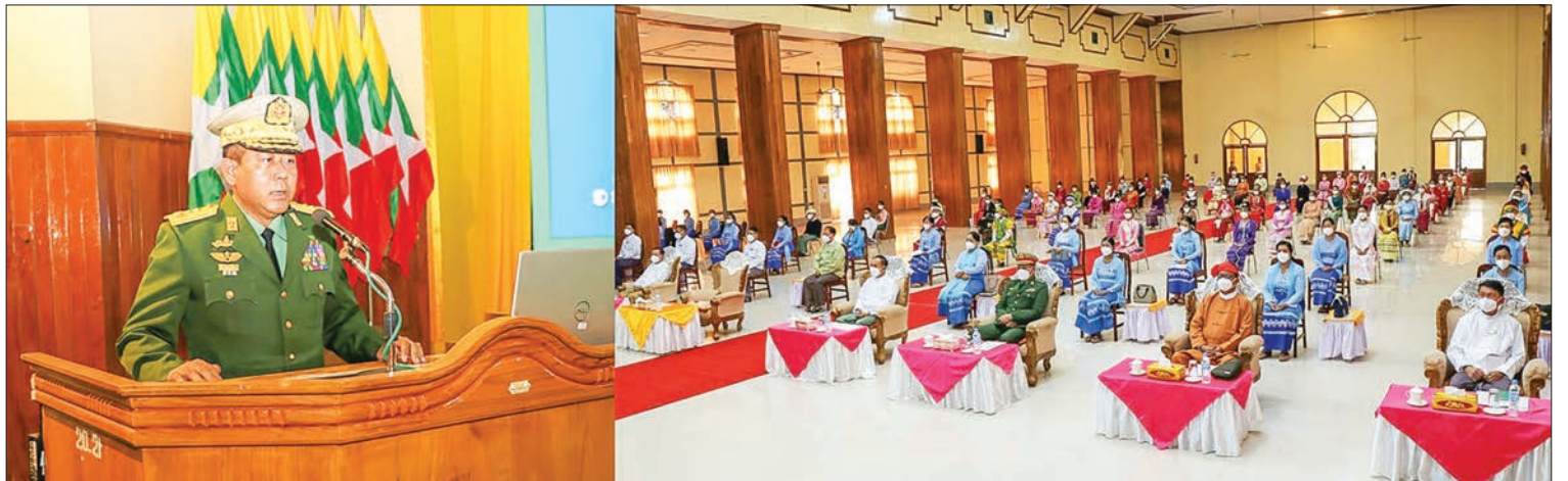
The graduation ceremony of the 5-year Education Degree Course No 4 of the University for the Development of the National Races of the Union in progress.

He said the University for the Development of the National Races (Sagaing) was established to provide the national races with higher education to develop education officers who would involve in the develop-