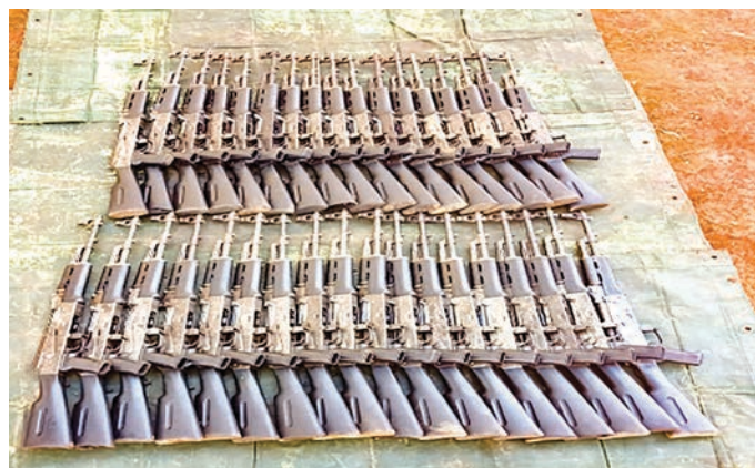
Seized 35 Type56 assault rifles.