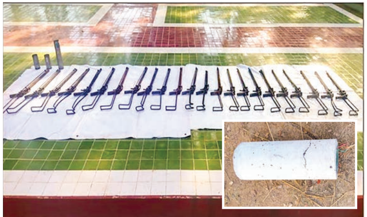
Seized percussion lock firearms and handmade mines in Amarapura Township.