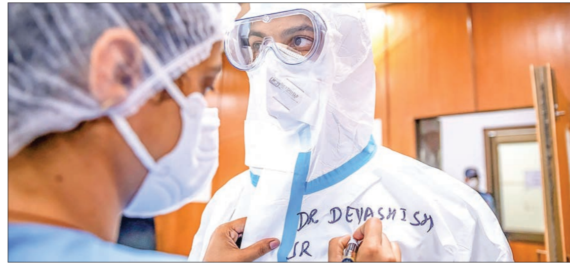
A nurse prepares a physician for the COVID ward at a hospital in New Delhi, India.

The co-chairs highlighted a growing momentum for a UN global summit as well as increasing support for a new top-level political leadership Global Health Threats