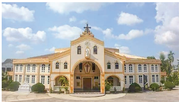
Christ the King Cathedral.

All 48 patients were systematically handed over to the Loikaw People's Hospital for medical treatment, it is reported. — MNA