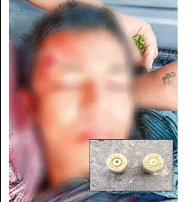
Chit Ko (dead).