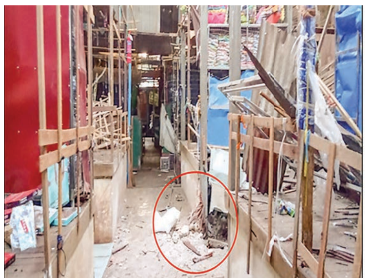
Sound bomb blast at Thaton Myoma market on 4 May 2021.