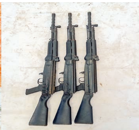
Seized 3 Type81 assault rifles.

heavy and small arms, including an FN-6 shoulder-to-air missile, were recovered from Homin village, 7 kilometres north of Man Mai Mong Kwan village.