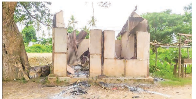
Arson attack on market committee office in Ottarathiri Township on 26 June 2021.