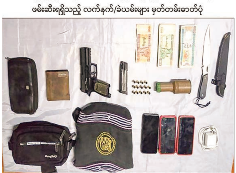
Seized firearms and ammunition in Amarapura Township.