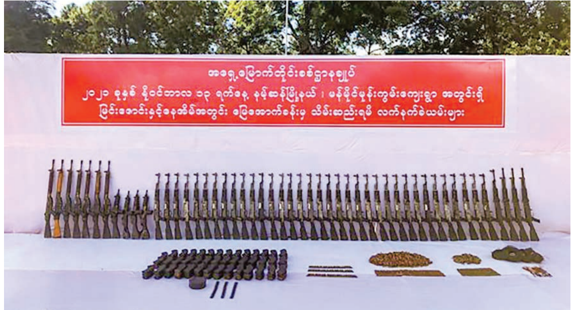
Confiscated weapons and ammunition in Namsang.