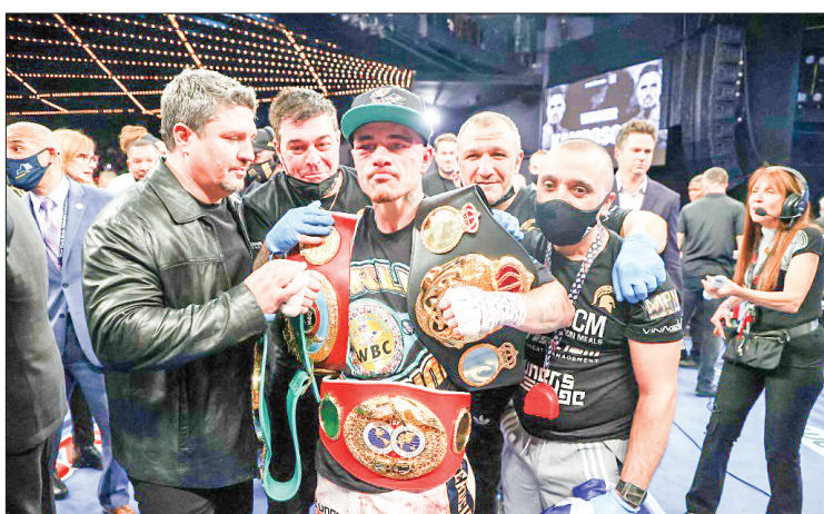
George Kambosos celebrates his split decision win against Teofimo Lopez during championship bout for Lopez's undisputed lightweight title at The Hulu Theater at Madison Square Garden on November 27, 2021 in New York, New York.

AUSTRALIA'S George Kambosos used a high-energy attack and a stinging overhand right to become the unified lightweight boxing champion with a shocking