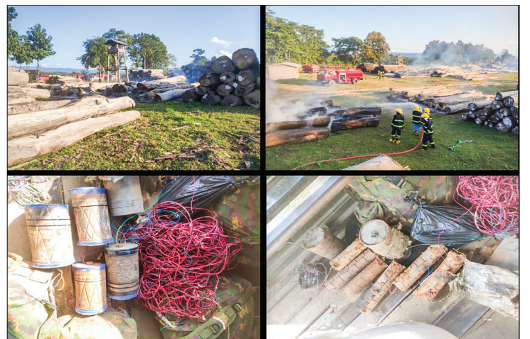
Piles of timber logs of government were set on fire in Kalay Township.