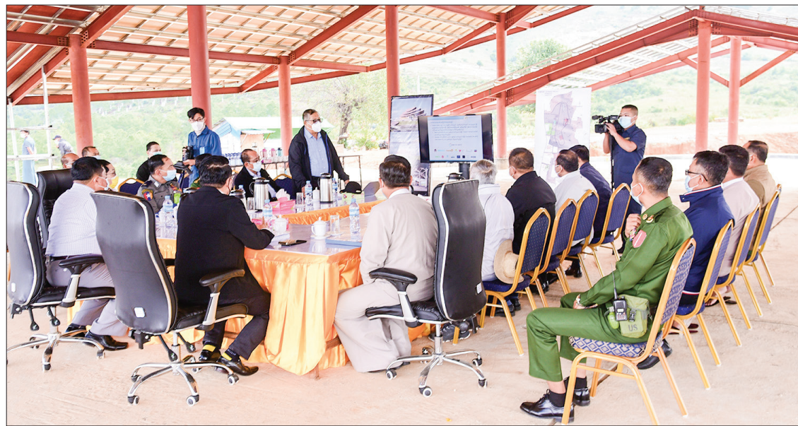
Union Minister for Information U Maung Maung Ohn meets local authorities and officials of Forever Yay Wati Company Ltd in Pindaya.

his pleasure for turning out the new generations of fine arts arenas in production of film and TV broadcasting in Pindaya. He urged all to systematically produce the films meeting the international standard and to seek the foreign market. He said he believes successful process of television broadcasting in Pindaya endowed with natural scenes, peace and tranquility and smooth transport facilities. But, it is necessary to maintain the soil damage due to erosion. The Union Minister pledged to give aid for improvement of the film industry together with Shan State government as success in the work process at Pindaya will reflect the development of the region. The Shan State Chief Minister explained plans of the state government for imple-