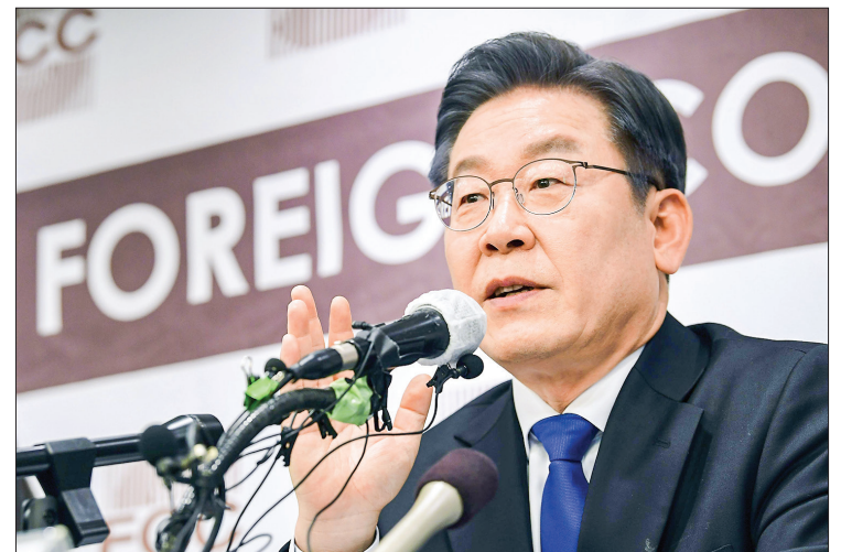
Lee Jae Myung, the presidential candidate of South Korea's ruling Democratic Party, speaks at a press conference with foreign media in Seoul on 25 November 2021.

tions have sunk to their lowest point in decades following South Korean Supreme Court rulings in 2018 that ordered Mitsubishi Heavy and another Japanese company to compensate groups of Koreans for forced labor during its 1910-1945 colonial rule of