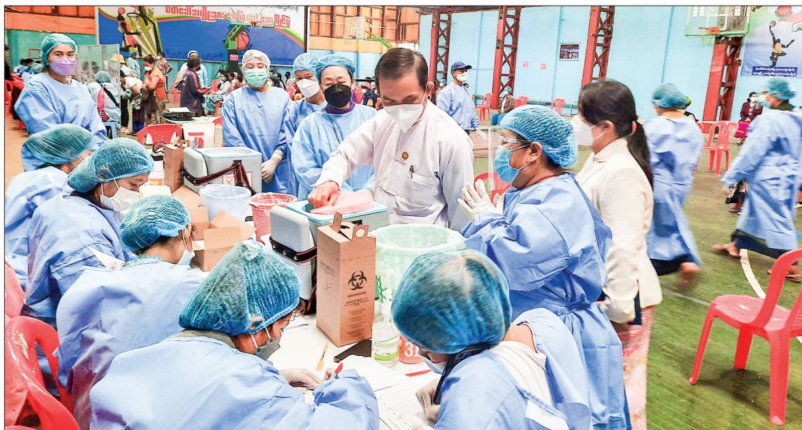
Health officials take preventive measures of COVID-19 in meeting with health staff in Shan State.

The Deputy Minister and field study team met the Shan State Chief Minister and Ministers, military commanders, relevant administration bodies, departmental officials of respective districts and townships and health officials. During the meeting, the deputy minister stressed the neces-