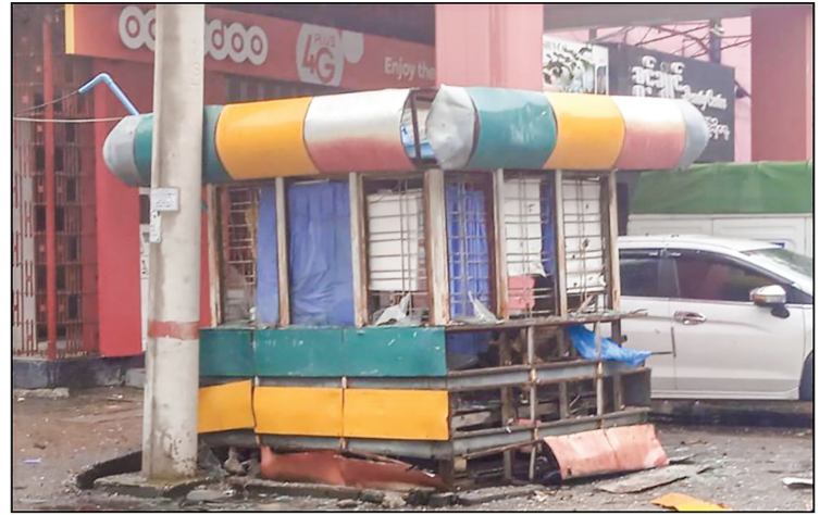
A traffic police post was damaged in homemade bomb blast in Lanmadaw Township.

The people is urged to work together to prevent terror acts such as mine planting and setting fire to the State owned and private property by the terrorists for ensuring development, peace and stability of the State, and if they receive information about the terrorist activities, they should secretly contact the nearest security forces and cooperate with them until the terrorists can no longer stand.—MNA