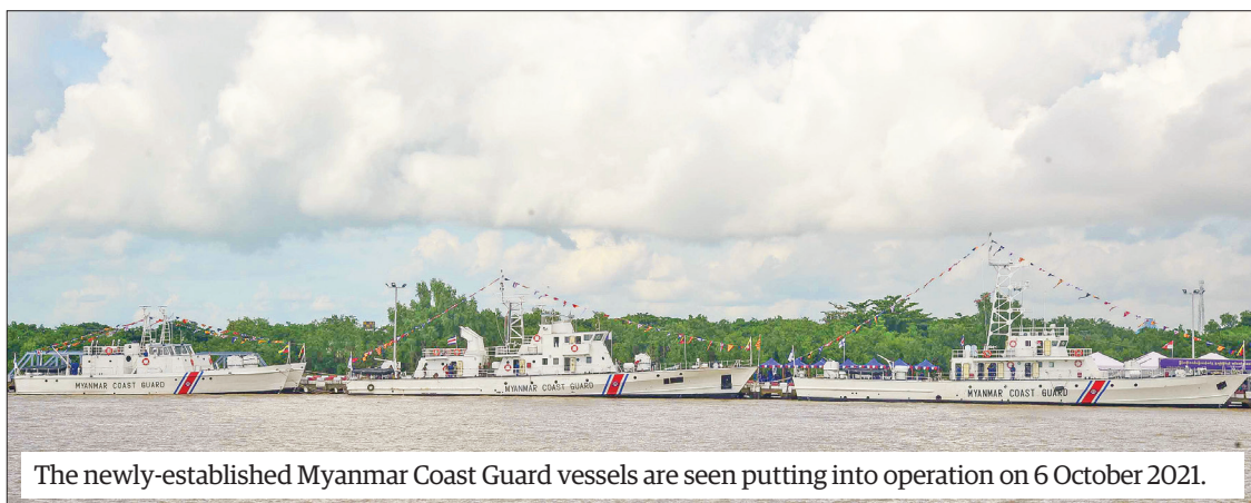
The newly-established Myanmar Coast Guard vessels are seen putting into operation on 6 October 2021.