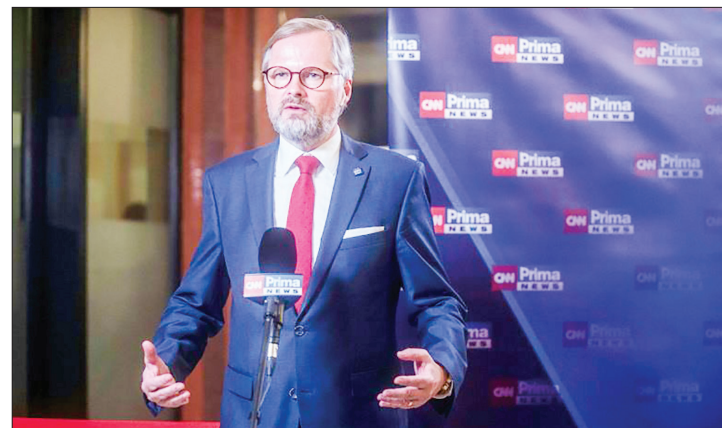
The Czech Republic's Civic Party leader Petr Fiala is to take over as prime minister after forming the centre-right Together alliance.

Zeman, a left-winger with a soft spot for Russia and China, had originally been expected to name Fiala as prime minister on Friday, a day after he was released from Prague's military hospital. But he was rushed back to hospital on the same day after testing positive for Covid. — AFP ■