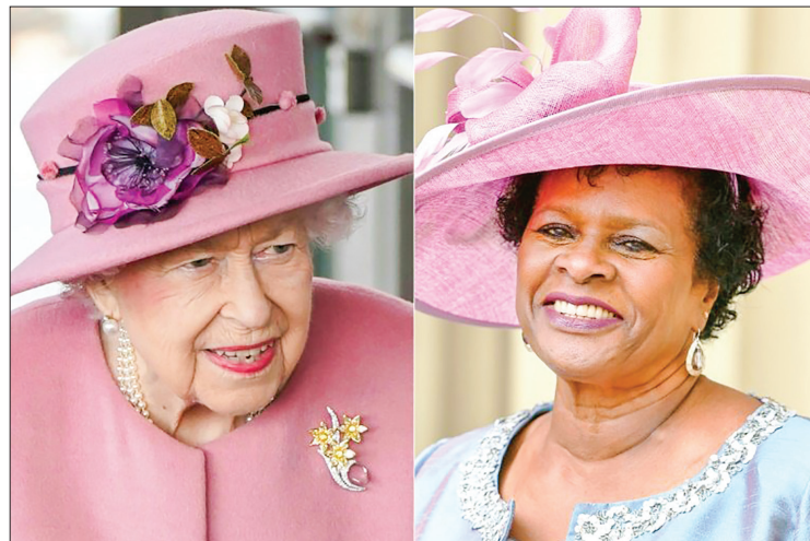
Britain's Queen Elizabeth II will be replaced as head of state of Barbados by Dame Sandra Mason, the island's governor general.