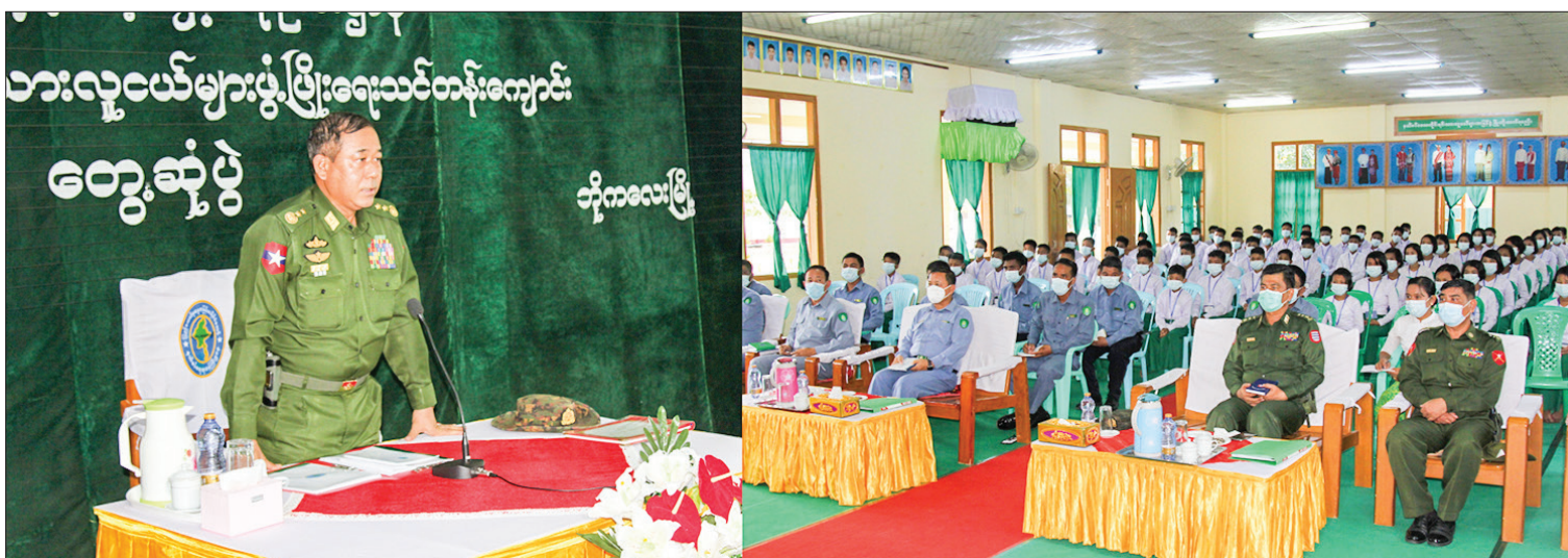
Union Minister Lt-Gen Tun Tun Naung meets principal, teachers and students of Border Area National Race Vocational Training School in Bogale on 27 November 2021.

UNION Minister for Border Affairs Lt-Gen Tun Tun Naung, Ayeyawady Region Minister for Security and Border Affairs Colonel Kyaw Swa Hlaing and officials inspected training schools in Ayeyawady Region from 26 to