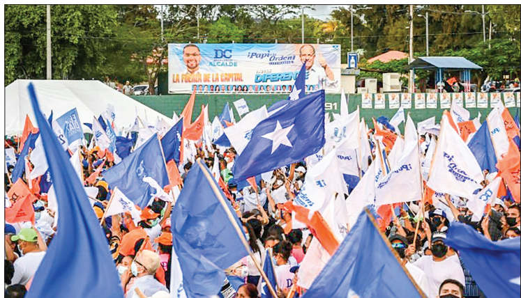
Supporters of Tegucigalpa's mayor and presidential candidate for the ruling National Party Nasry Asfura, aka 'Papi a la Orden' attend the campaign's closing event.

HONDURAS is bracing itself for potential violence as more than five million people vote on Sunday to replace President Juan Orlando Hernandez, a controversial figure accused of drug trafficking in the United States.