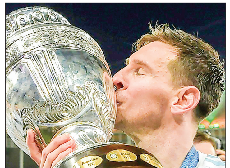
Argentina's Lionel Messi kisses the trophy after winning the 2021 Copa America.

ROBERT Lewandowski threatens to deny Lionel Messi a record-extending seventh Ballon d'Or title as the prestigious awards ceremony returns Monday after it was cancelled last year because of the pandemic.