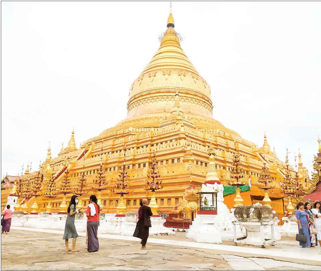
Pilgrims and visitors are seen on terrace of Shwezigon Pagoda in Bagan Cultural Heritage Zone.