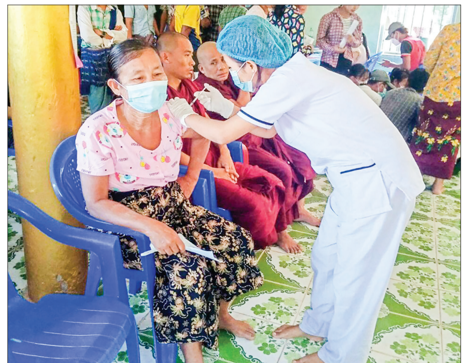
Health staff injects Sinopharm COVID-19 vaccine to over 18-year-old people and Buddhist monks in Ngaputaw Township on 27 November.

The village administrators supervised the vaccination site and members of the fire brigade; healthcare officials and clerks provided necessary assistance, according to the Rural Health Centre.—Nu Nu Aye (IPRD)/GNLM