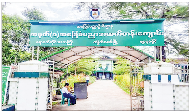
Entrance to Kyaiklat BEHS-1.

The people are urged to work together to prevent killing of good service personnel by the terrorists for ensuring development, peace and stability of the State, and if they receive information about the terrorist activities, they should secretly contact the nearest security forces and cooperate with them until the terrorists can no longer stand.—MNA