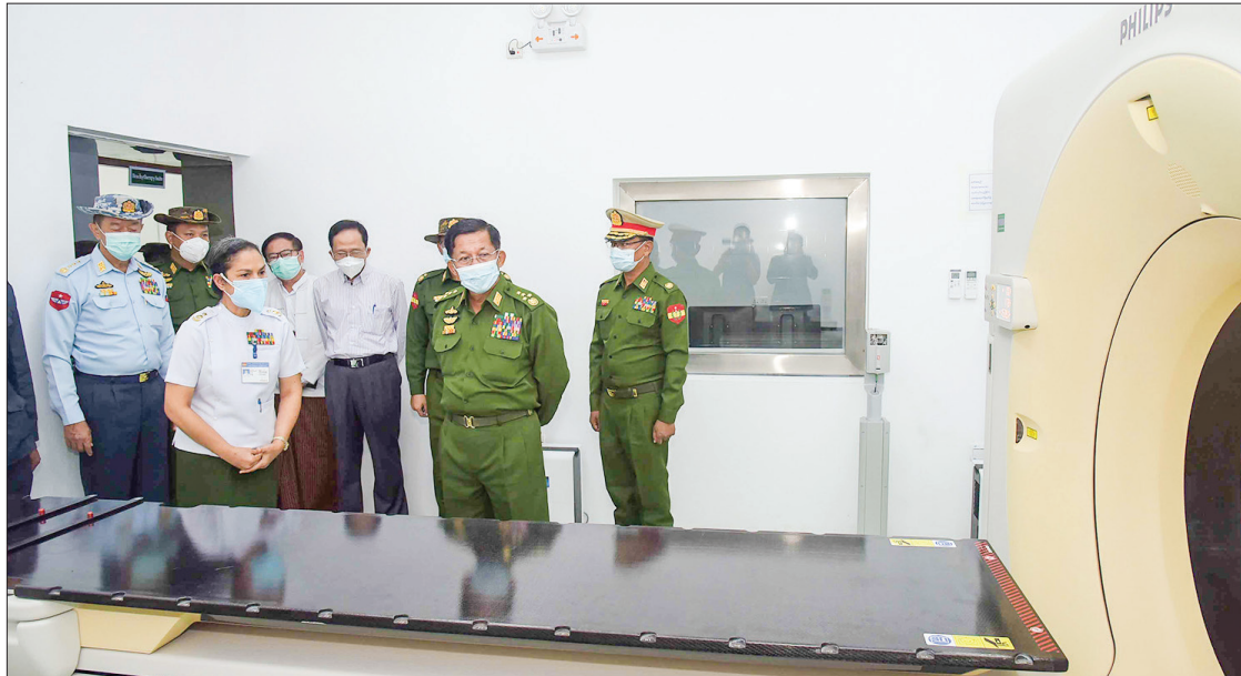
SAC Chairman Commander-in-Chief of Defence Services Senior General Min Aung Hlaing visits radiation department of military hospital in Aungban, Shan State on 2 October 2021.

The Commander-in-Chief of Defence Services also visited the Eastern Command headquarters to meet with Tatmadaw officers, other ranks and families of