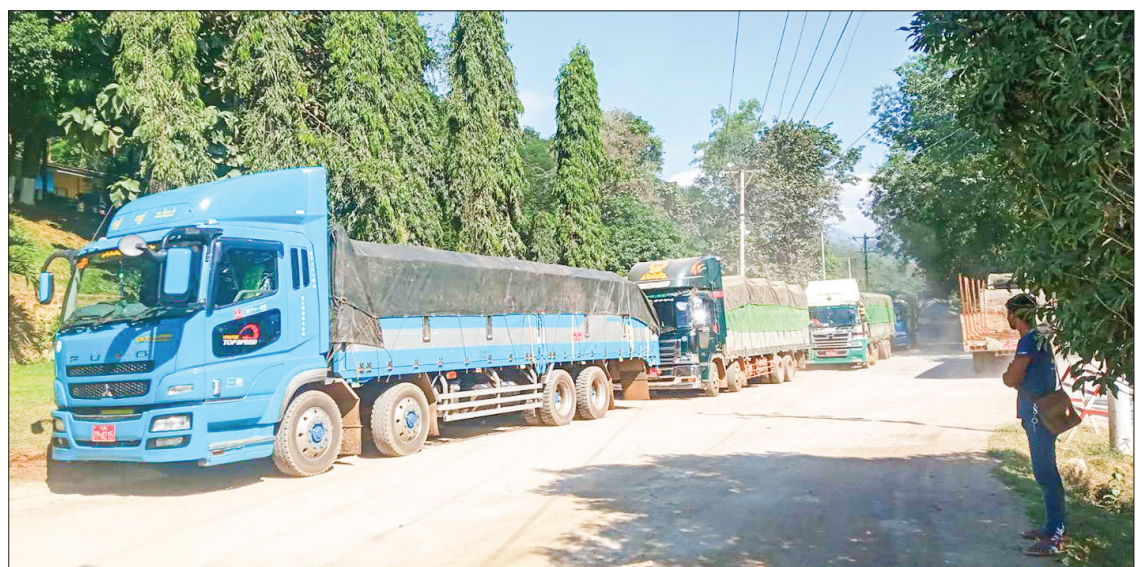
Cargo trucks carrying medical equipment rolling on the road in a row are leading to regions and states.

It is reported that the Ministry of Commerce is coordinating with relevant departments, treatment of COVID-19, as well as contact persons for inquiries can be reached through the Ministry's Website— www.commerce.gov.mm . — MNA