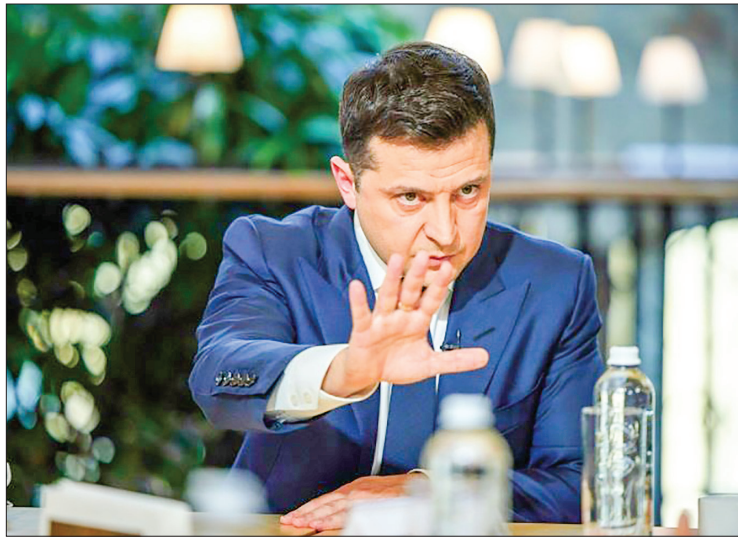
Ukrainian President Volodymyr Zelensky.

UKRAINIAN President Volodymyr Zelensky said on Friday that he is ready for a dialogue with Russia over the Donbas crisis, the government-run Ukrinform news agency reported.