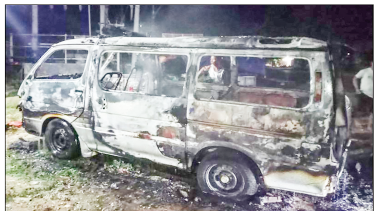
An ambulance of social welfare association was set in blaze in Thabeikkyin Township.