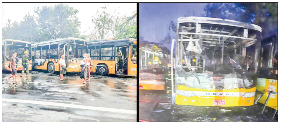
Five buses of YBS (89) were set on fire in Kyimyindine Township.