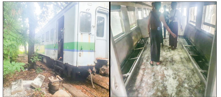
Damaged locomotive was burnt in Pyinmana.