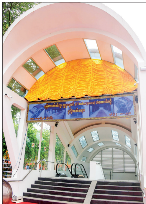
State Administration Council Chairman Prime Minister Senior General Min Aung Hlaing presses the ceremonial button to open the Underpass on Pyay Road in Yangon on 7 October 2021.

Hlaing inspected the Tatmadaw Heavy Industries facilities. During the inspection tour, he stressed the importance of having the capacity to manufacture adequate numbers of utility vehicles, such as oil bowsers, water tankers, garbage trucks, sprayers and fire trucks, not only for the Tatmadaw but also for municipal work and firefighting.