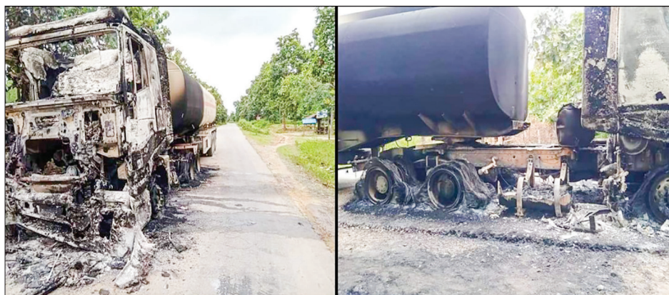
A fule bowser burnt by PDF terrorist group was seen in Htigyaying Township.