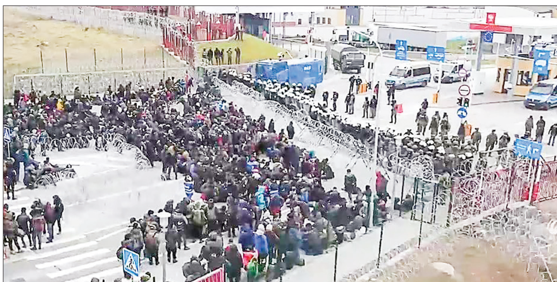
Thousands of migrants are stuck on the Polish-Belarusian border. Poland has refused to let the migrants enter EU territory.

PRESIDENT of Belarus Alexander Lukashenko on Friday met with refugees stranded on the border between Belarus and Po-