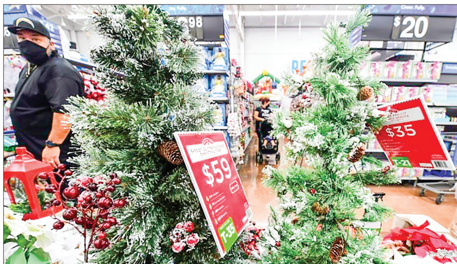
Shoppers in Rosemead, California on November 22, 2021.

But consumer advocates say they carry the same risks as credit cards