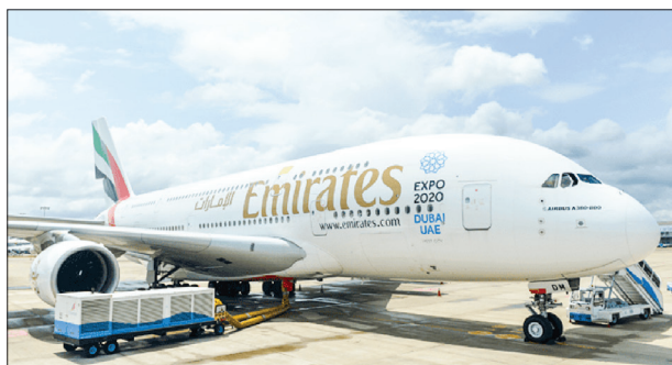
The Nigerian government has lifted the suspension it placed on the Emirates from flying to and from the West African country without conditions.

According to reports by local media, Emirates subjected Nigerian travelers to additional rapid antigen tests as against its stipulated negative PCR test at the Lagos and Abuja airports before departure.