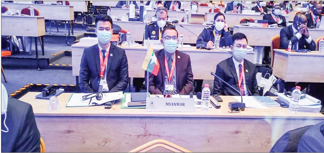
Deputy Minister for Home Affairs Chief of MPF Lt-Gen Than Hlaing attends 89 th session of INTERPOL General Assembly in Istanbul.

A Myanmar delegation led by Deputy Minister for Home Affairs Chief of Myanmar Police Force Lt-Gen Than Hlaing attended the 89 th Session of INTERPOL General Assembly in Istanbul, Turkey, between 23 and 25 November at the invitation of INTERPOL.