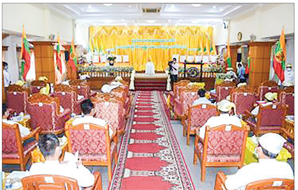
YMBA's 101 st National Victory Day ceremony takes place at Zabuthiri Beikman in Mayangon Township on 28 November 2021.

The ceremony ended with singing the Zartiman song.—MNA