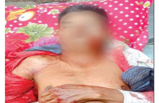
An innocent citizen was shot to dead in Chanmyathazi Township on 25 September.