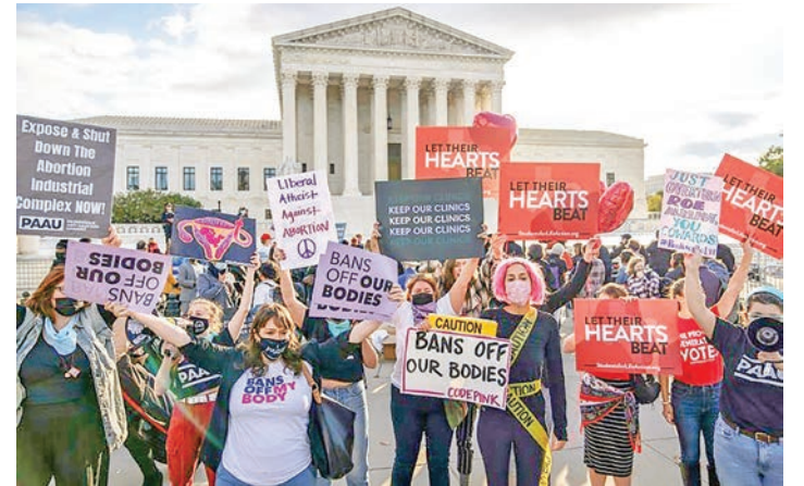
Abortion rights and anti-abortion demonstrators rally outside the US Supreme Court.

"We recognize the magnitude of what we are asking," Mississippi Attorney General Lynn Fitch wrote in The Washington Post .—AFP ■