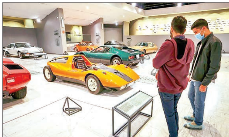
Visitors look at a 1972 MPV automobile by the three famous German car manufactures Mercedes-Benz, Porsche and Volkswagen at the Iran Historical Car Museum.

BEFORE they were ousted by the 1979 Islamic revolution, Iran's royal family enjoyed a lavish lifestyle with a taste for fast cars quite unlike any ever built. Now, after half a century hidden away, the royal racers are back on show, with the Iran