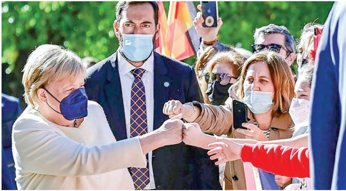
Angela Merkel has been lauded for her steady hand in steering the bloc through crisis after crisis.