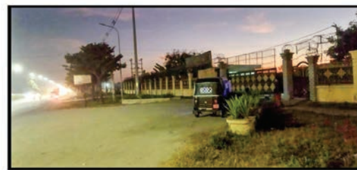
A handmade bomb blast nearby Royal One KTV at the roadside in Mahaangmyay on 31 October.