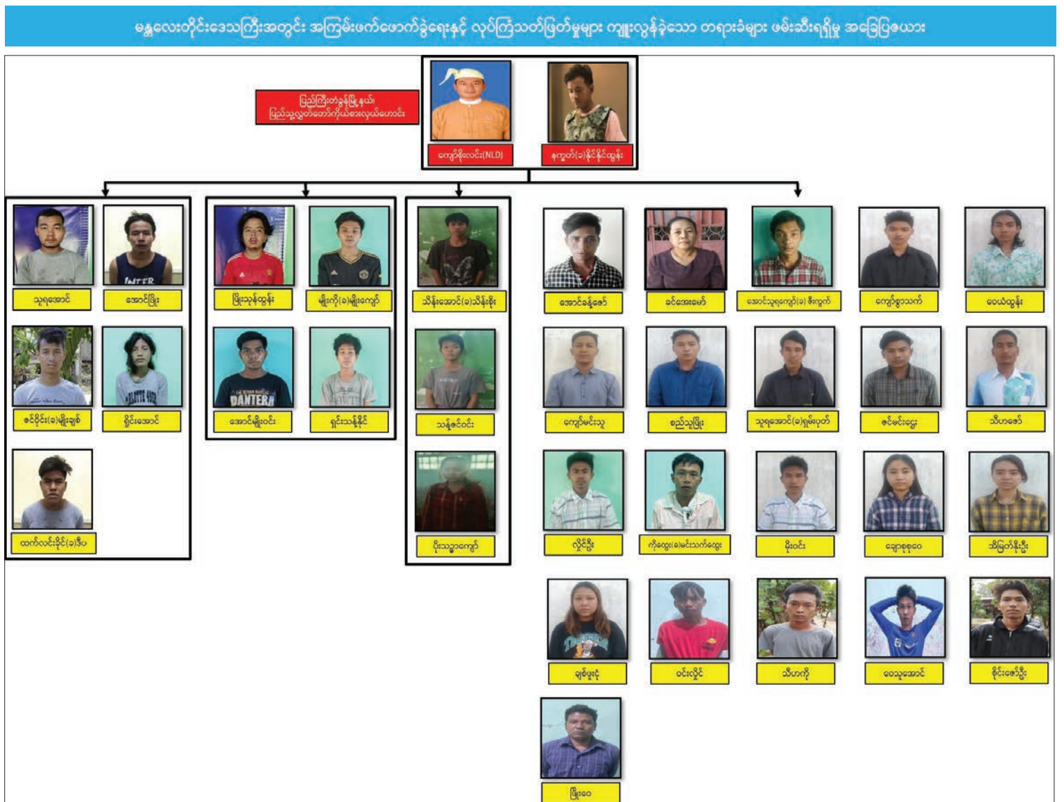
Arrestees for bombings and killings in Mandalay Region.