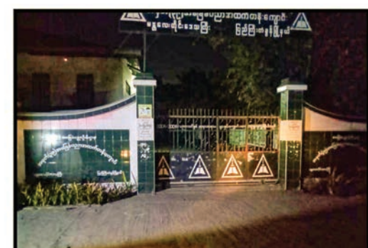
A handmade bomb blast at No 39 Basic Education High School in Pyigyidagun on 5 September.