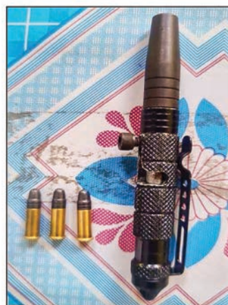
Seized handmade firearm and bomb along with arrestees.