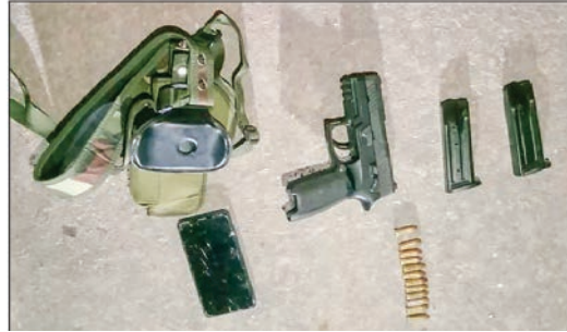
Seized weapons and ammunition.

The arrested suspects will be taken action under the law and the people are requested to work together to fight against the terrorists and to secretly report any information or movement of them to the relevant authority and that they will be rewarded, it is reported.— MNA