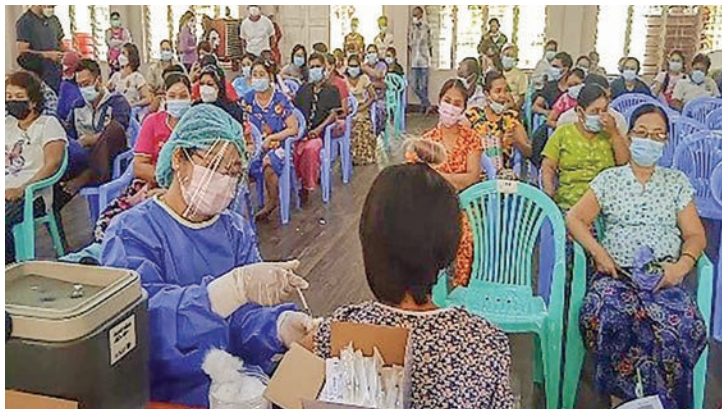
Inoculation is underway for locals in Mon State.