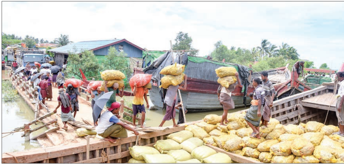
Cargoes are loaded on board the ship on the Myanmar-Bangladesh border.

to Bangladesh through both maritime and land routes. Bi-