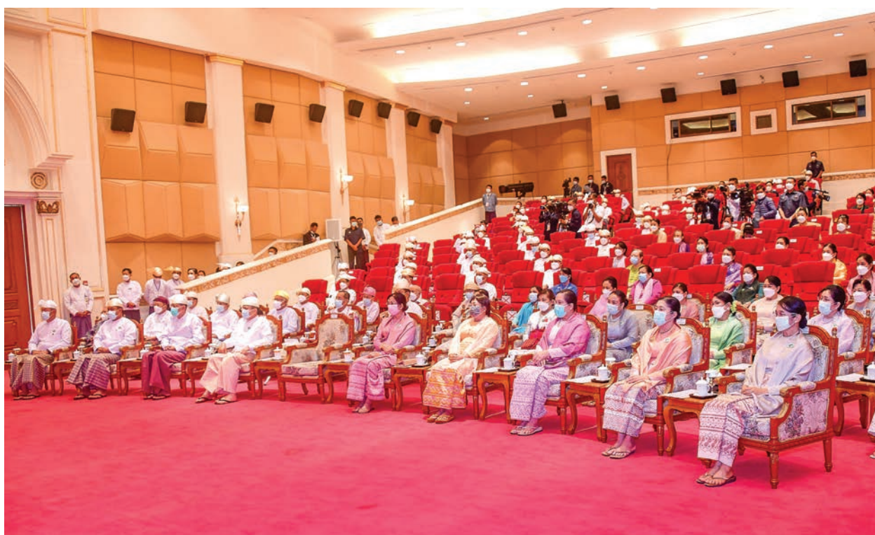
State Administration Council Chairman Prime Minister Senior General Min Aung Hlaing speaks on the occasion of conferring the Sasana Nuggaha titles to laypersons in Nay Pyi Taw on 1 December 2021.

C HAIRMAN of the State Administration Council Prime Minister Senior General Min Aung Hlaing conferred Sasana Nuggaha titles on recipient persons at Thabin Hall of the SAC Chairman Office yesterday afternoon.