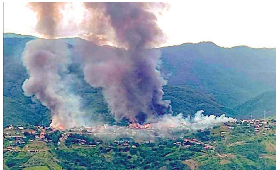
Setting fire in Thantlang.