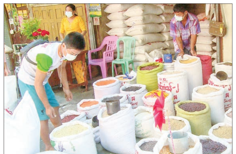
Last September, the prices hit an all-time high of K2 million per tonne tracking Kyat weakening against the US dollar in the local forex market when the black gram was highly demanded by the foreign trade partners.

Myanmar conveyed US$1.57 billion worth of over 2 million tonnes of various pulses to foreign trade partners last financial year 2020-2021. The country shipped $966.4 million valued at 1.24 million tonnes of pulses and beans to foreign markets through the sea route, and $604.3 million valued 786,920 tonnes were sent to the neighbouring countries through land borders. — NN/GNLM