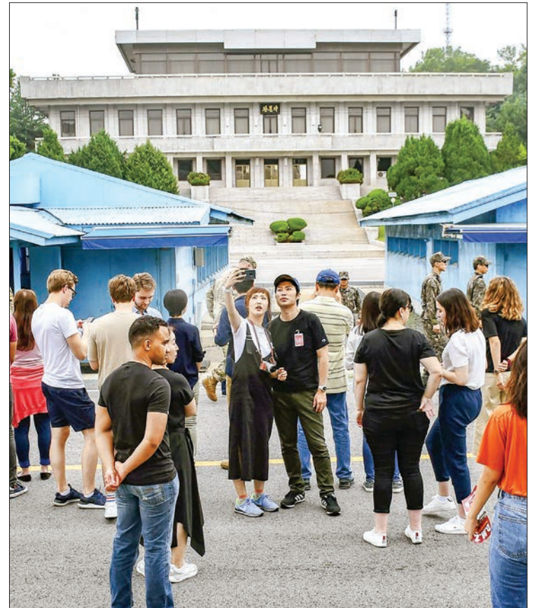
Tourists take a selfie in front of a North Korean facility at the truce village of Panmunjeom from the South Korean side on 23 July 2019.

Concerned about the virus's spread, North Korea continues to keep its border with China closed.—Kyodo ■