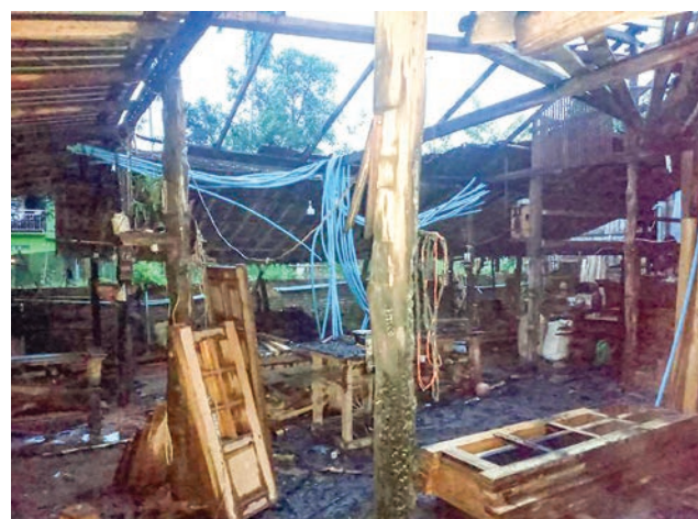
Arson attack in Launglon.