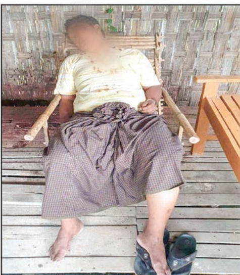
An innocent resident in Pyigyidagun Township was shot to dead on 24 September.