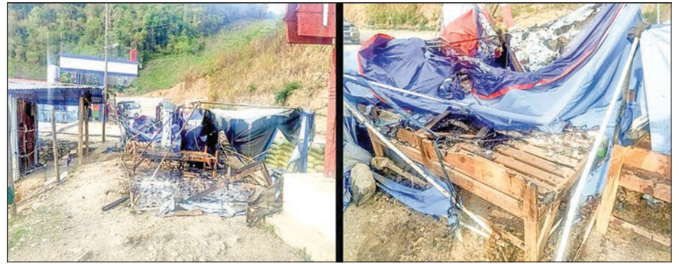
Arson attack on security checkpoint in Tiddim.