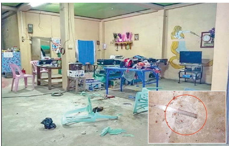
Mine blast in Mongyawng.