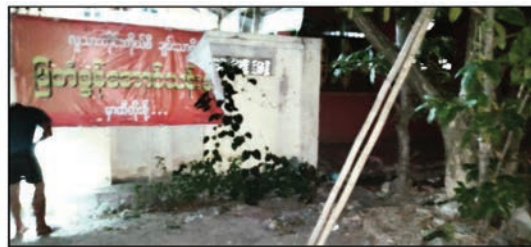
A handmade bomb blast at the lottery shop of U Shwe Win in Chanayethazan on 22 October.