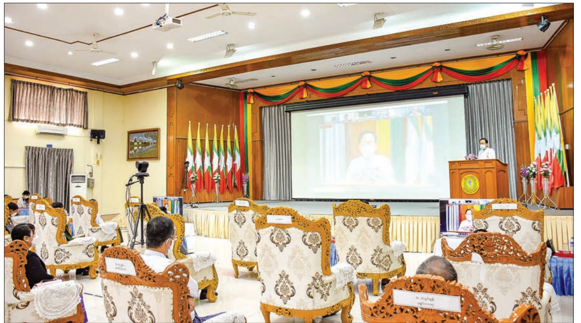
World AIDS Day 2021 in progress in Nay Pyi Taw.

In 2021, 362 ART clinics were opened in 273 townships to provide treatment for HIV/AIDS patients, making the ART medical services more accessible. In addition, prevention of mother-to-child transmission of HIV (PMTCT) has been extended to 330 townships nationwide this year. Preventive care and treatment have been stepped up since 2021 with increased funding from the government, he said. The government has been increasing the allocation of funds from the 2016-2017 financial year to make sure that there is no shortage of medicines and related medical supplies for ART medical services. In the 2020-2021 FY, up to US$ 15 million was allocated and more are planned to be allocated in the coming years, he continued. As a result, out of an estimated 240,000 people living with HIV, more than