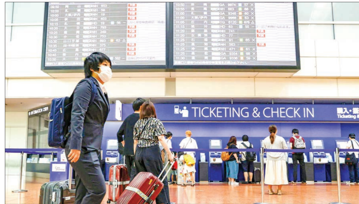
Japan has asked airlines to stop new incoming flight bookings for a month because of the Omicron coronavirus variant. Airline passengers check in at Tokyo International Airport on 4 July 2020.

Asked how long travel restrictions that took effect Monday on South Africa and seven other southern African countries