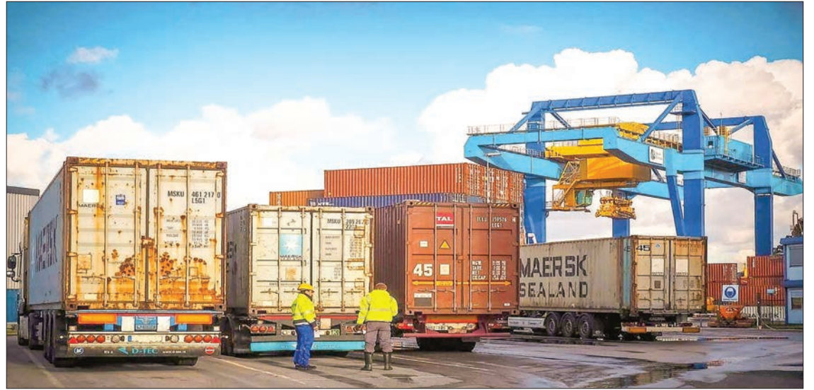
Economists had forecast growth would drop around 2.8 per cent, but increased exports appear to have come to the rescue — buoyed by high coal and gas prices.

said the strain “poses new risks to the global economic growth and inflation outlook”.