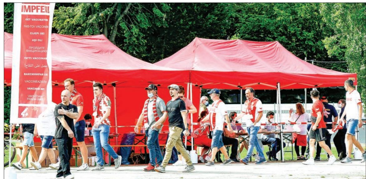
Visitors walk past stands offering the opportunity for free vaccination shots to fans and residents ahead of a German Bundesliga football match in Cologne, western Germany.