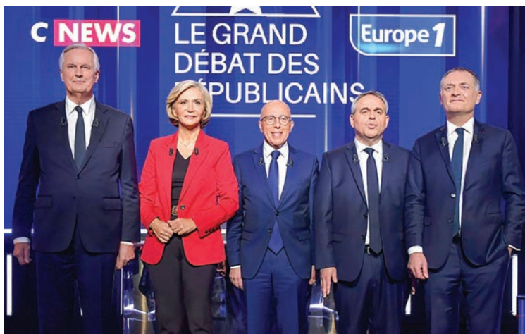
Five contenders from France's conservative Republicans party crossed swords in a final debate on Tuesday ahead of party members choosing its candidate to take on President Emmanuel Macron in next year's elections.

FIVE contenders from France's conservative Republicans party crossed swords in a final debate on Tuesday ahead of party members choosing its candidate to take on President Emmanuel Macron in next year's elections.