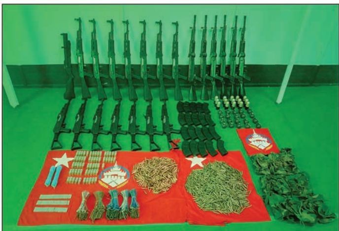
Seized weapons and ammunition in Madaya.