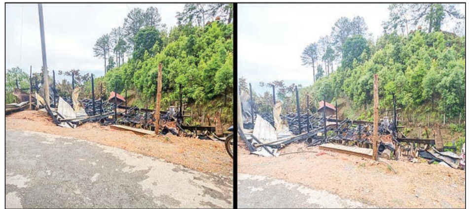
Setting fire in Kanpetlet.