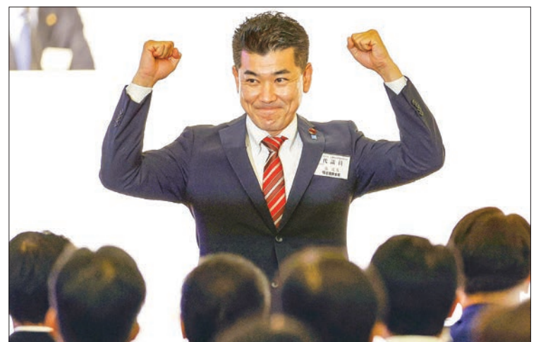
Kenta Izumi, policy chief of the Constitutional Democratic Party of Japan, celebrates at an extraordinary meeting of party members in Tokyo after being elected leader of the main opposition party on 30 November 2021. Izumi beat Seiji Osaka, a former special adviser to the prime minister, in a runoff held after voting on four contenders.

Izumi expressed willingness to cooperate with the Democratic Party for the People on topics the two parties agree on. But he suggested reviewing the building of an alliance with the Japanese Communist Party and other opposition parties as they did for the Oct. 31 House of Representatives election. Despite election cooperation among the opposition camp, the CDPJ lost 14 lower house seats it held prior to the vote, leaving it with a total of 96, in comparison to the LDP's 261.—Kyodo ■