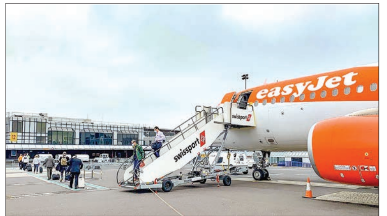
Easyjet and other airlines face renewed challenges as the Omicron coronavirus variant prompted fresh travel restrictions.

The emergence last week of Omicron, a new concerning Covid variant first detected in southern Africa, has prompted some nations including Britain to tighten travel curbs. “It's too soon to say what impact Omicron may have on European travel and any further short-term restrictions that may result,” EasyJet said in a results statement. “However, we have prepared ourselves for periods of uncertainty such as this.” Elsewhere in Europe, Scandinavian airline SAS expressed optimism despite the emergence of Omicron — but cautioned over “prevailing uncertainties” in the industry.