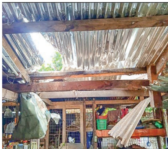
One handmade bomb blast in Kyaikto.