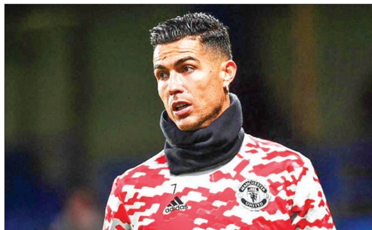
Manchester United striker Cristiano Ronaldo.