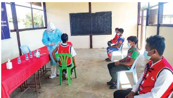
Immunization drive is in progress in Shan State.

DOCTORS and nurses from public hospitals, Tatmadaw medical teams, healthcare workers and volunteers are working hard to give COVID-19 vaccines in different states and regions as the vaccination programme is one of the most important activities in the prevention, control and treatment of