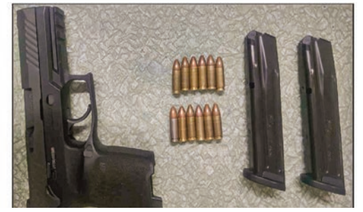
Seized weapons and ammunition in Chanmyathazi Township on 20 October.