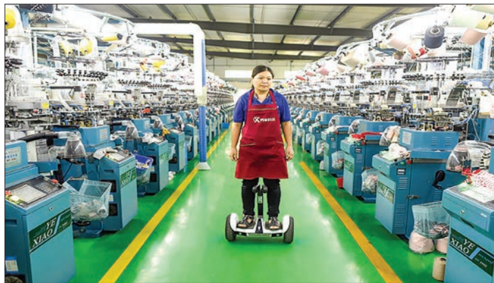
A worker rides an electric self-balancing vehicle to check the production status of machines in a smart manufacturing workshop of a socks company in Zhuji, east China's Zhejiang Province, on 23 October.

IN the blink of an eye, a laptop is churned out from the busy production lines at LCFC (Hefei) Electronics Technology Co., Ltd., the largest PC R&D and manufacturing base of Chinese tech giant Lenovo.