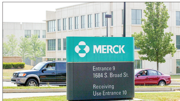
The pharmaceutical giant is making its oral antiviral drug widely available for all the world.

THE Japanese arm of US pharmaceutical giant Merck & Co. said Friday