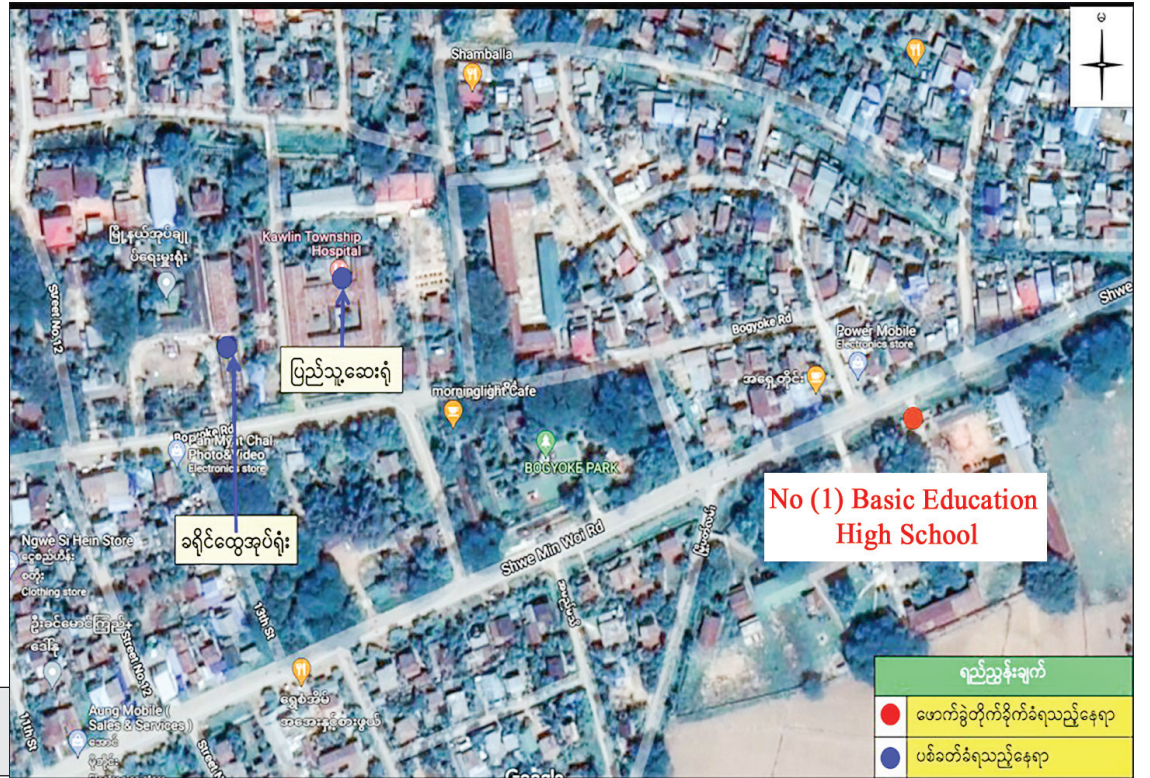
Terrorists attack with grenades, homemade bombs and mines, and destroy schools and training schools.

It is reported that security forces are investigating to identify the perpetrators and take action against them under the law. — MNA