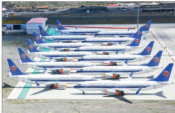
Chinese authorities cleared the way for the 737 MAX to resume after a lengthy grounding.

Aviation insiders expect it will be another four to six weeks before the jets