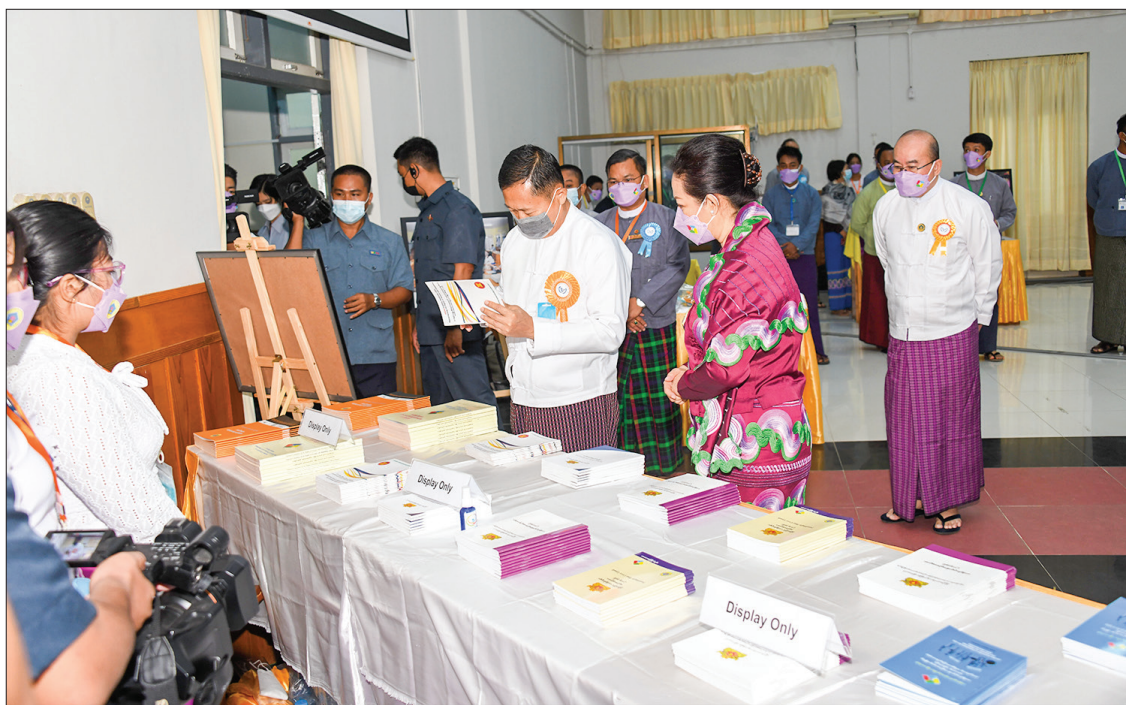
The Vice-Senior General views the books and documentary photos at the event.

Myanmar has been annually holding the ceremony to mark the International Day of Persons with Disabilities 28 times as of 1994. Myanmar signed the UN Convention on the Rights of Persons with Disabilities on 7 December 2011.