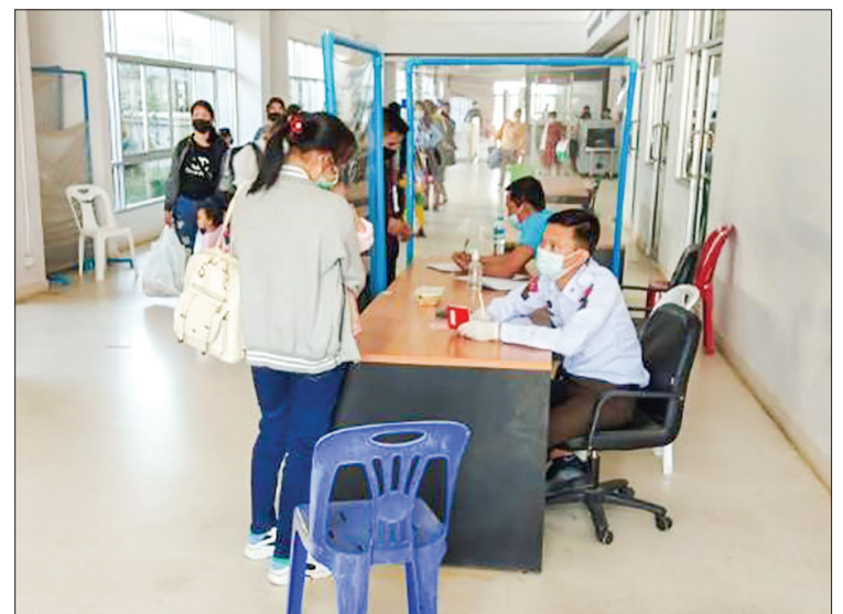
Returnees check in at the reception desk.

are isolated at the designated places.