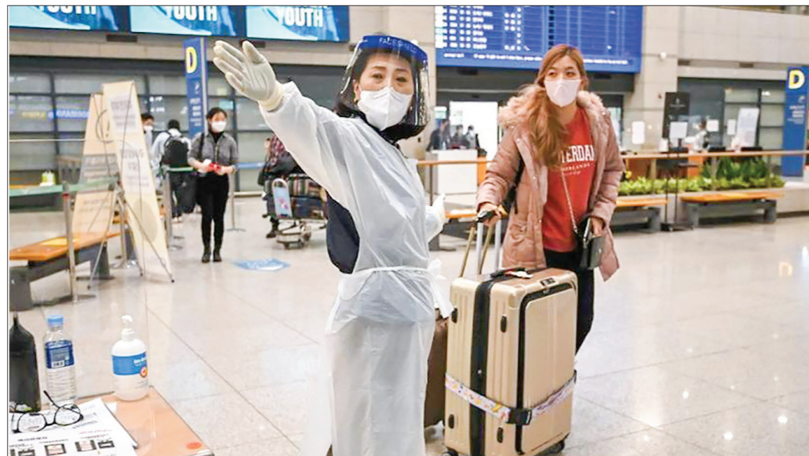
The first confirmed case of the Omicron variant was in South Africa on 9 November, with infections spreading rapidly in the country.

of the infected people are young, and younger people have generally shown milder symptoms throughout the pandemic.