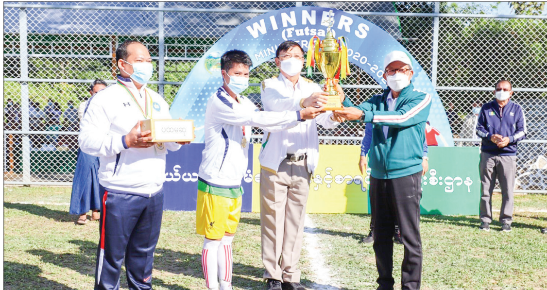
The Union Minister's Cup is awarded at the Ministry Futsal Stadium yesterday.

"We are encouraging professional training in various sports to develop good team-