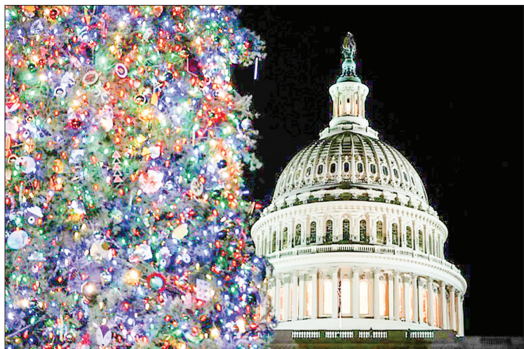
Avoiding a government shutdown is one of a number of urgent priorities Congress must deal with before Christmas.

THE US Congress approved a stopgap funding bill Thursday in a rare show of cross-party unity to keep federal agencies running into 2022 and avert a costly holiday season government shutdown.