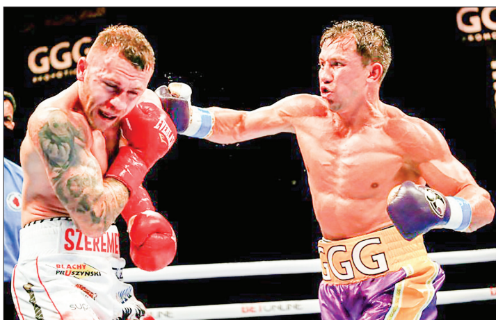
Gennady Golovkin's world title fight against Ryota Murata has been postponed.

IBF middleweight champion Golovkin, also known as "GGG", tweeted that he was "deeply disappointed", but "the health and safety of the public must always be the priority". "I look forward to returning to the ring against Ryota as soon as possible," added the 39-year-old. — AFP ■