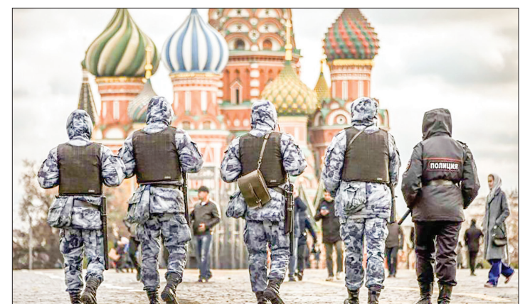
Russian police and National Guard servicemen patrol Red Square in Moscow on 20 October 2021.

It did not specify where or when the attack was to take place.—AFP ■