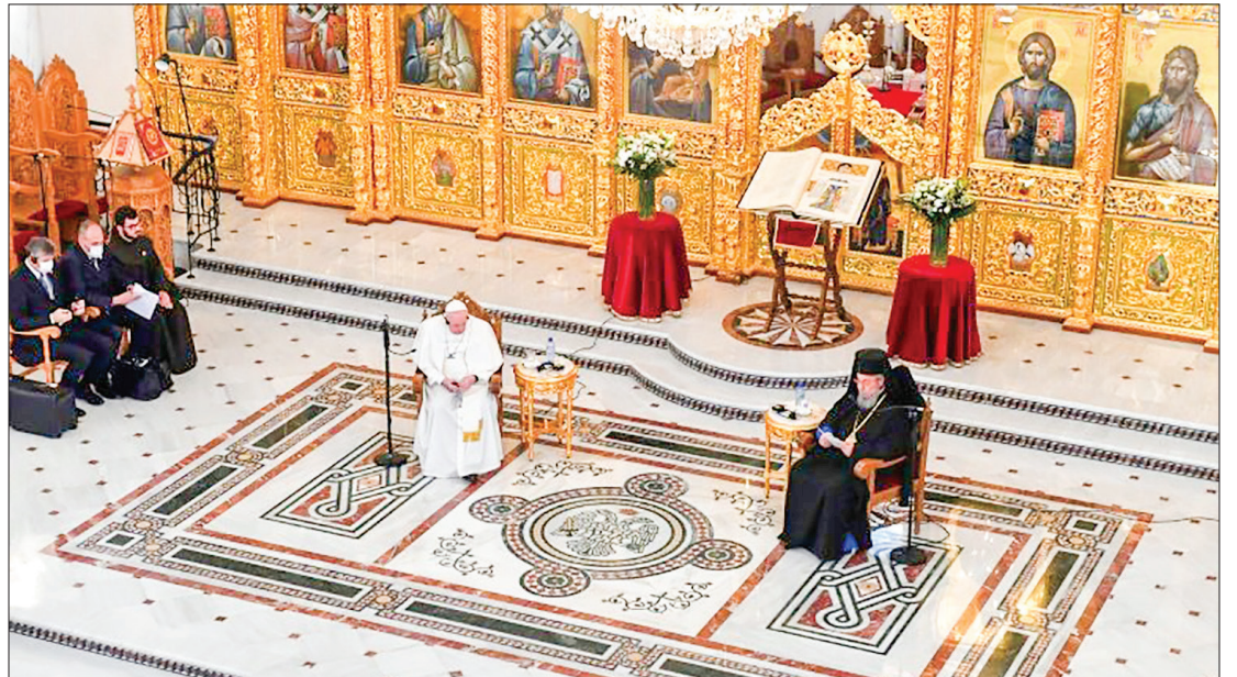
The pope is seeking to improve historically difficult relations between the Roman Catholic and Greek Orthodox Churches.

Ahead of the mass, the pope visited the Holy Archbishopric of the Greek Orthodox Church of Cyprus in Nicosia, seeking to improve historically difficult relations between the Roman