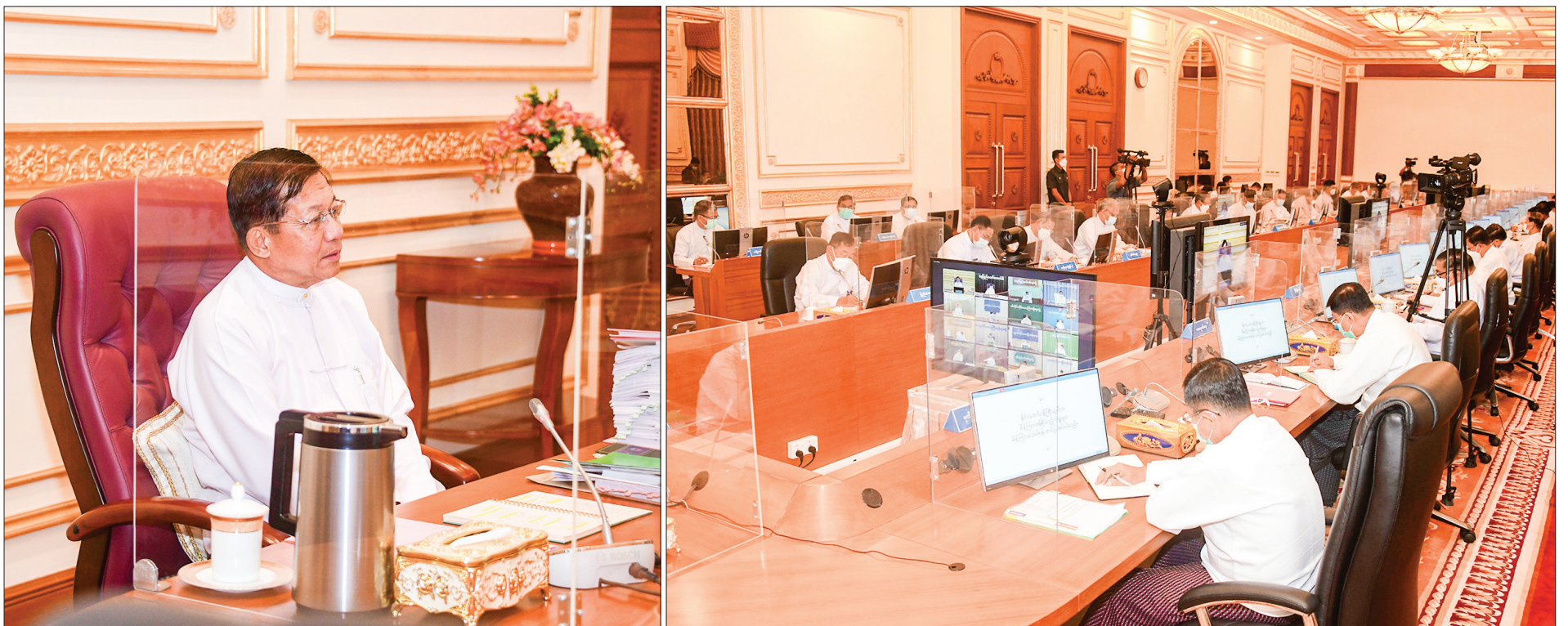
State Administration Council Chairman Prime Minister Senior General Min Aung Hlaing addresses the meeting 3/2021 of the Union government in Nay Pyi Taw on 3 December 2021.

DURING the surging of COVID-19, Myanmar implemented the five-point consensus of the ASEAN amid various difficulties, said Chairman of the State Administration Council Prime Minister Senior General Min Aung Hlaing at the meeting 3/2021 of the Union government at the office of the SAC Chairman in Nay Pyi Taw yesterday afternoon.