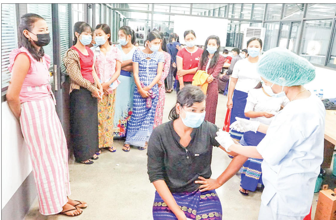
Inoculation drive for workers in Pakokku Township, Magway Region.

OFFICIALS gave COVID-19 vaccines (1st dose) to insured workers who are covered by the social security system under the social security programme at Myanmar Efforts Garment Factory Company, Pantaingchyon Village, Pakokku Township, Magway Region on 2 December.