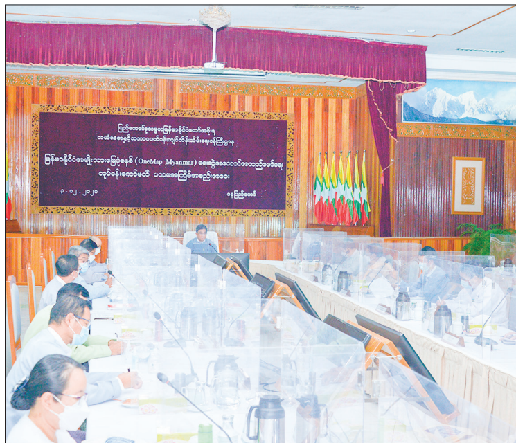
The Myanmar National Mapping System Implementation Working Committee holds the first meeting virtually.

THE Department of Forest held the first meeting of the National Land Use, Myanmar National Mapping System (OneMap Myanmar) Implementation Working Committee yesterday afternoon through videoconferencing.