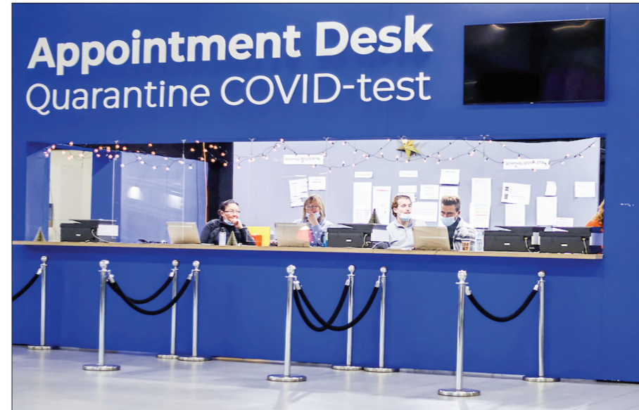
An appointment desk for a COVID-19 test.

The variant's detection and spread represent a major challenge to efforts to end the pandemic, with several nations