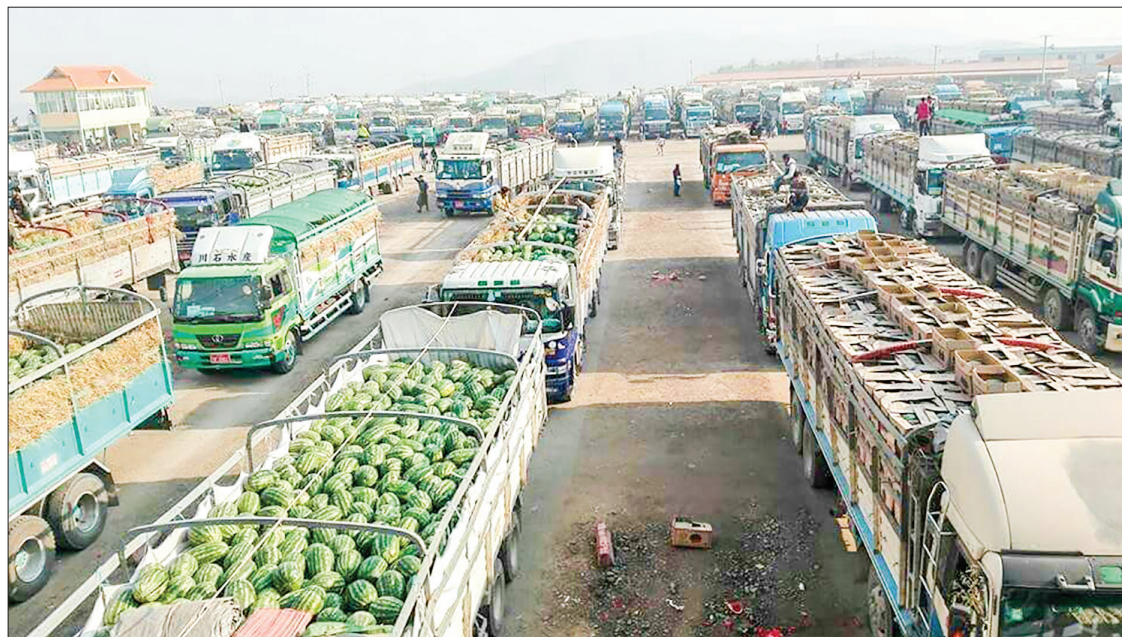
Sino-Myanmar border trade expects revival as lorries full of watermelon are exporting them to China.

Besides, the Chinese's customs system has been transformed from a border trade system to a normal trade system. It has been also reported that the export tax will be levied on the overseas shipping system which has been delayed due to the pending changes in China's