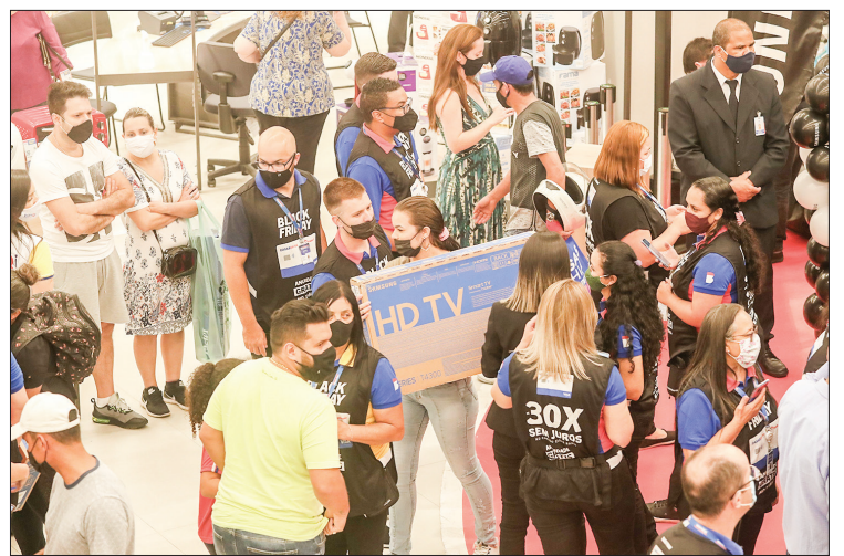
Shoppers buy TV sets at a megastore during a Black Friday sale in Sao Paulo, Brazil, on 25 November 2021.

Agricultural production fell 8.0 per cent, while manufacturing was flat and the services sector grew 1.1 per cent. Brazil's services industry was boosted by an improvement in the health situation in a country hard hit by the global pandemic.