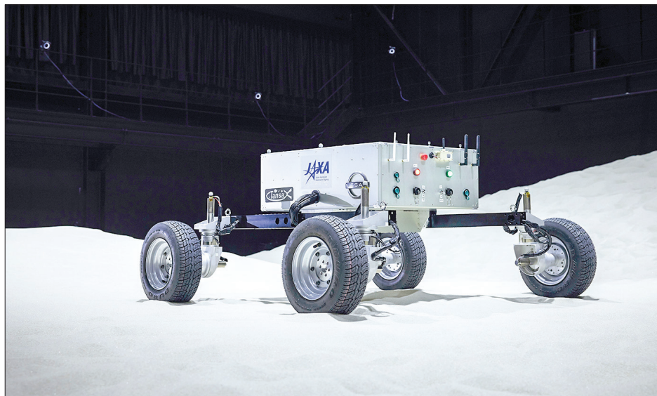
A prototype of a lunar rover developed by Nissan Motor Co. and the Japan Aerospace Exploration Agency.

Honda Motor Co. has been studying a circulative renewable energy system to provide oxygen, hydrogen and electricity for use in long-term extraterrestrial exploration projects.—Kyodo ■