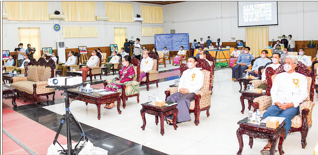
State Administration Council Vice-Chairman Deputy Prime Minister Vice-Senior General Soe Win speaks on the event to mark the International Day of Persons with Disabilities 2021 in Nay Pyi Taw yesterday.

COVID-19. A national committee and a working committee were formed for effectively implementing the Rights of Persons with Disabilities Law, 2015 and the Rights of Persons with Disabilities Rules 2017 in Myanmar with adopting the decisions at their meetings to fulfil the education, employment, healthcare, social and legal needs of the persons with disabilities in the projects and work procedures.