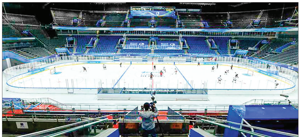
The National Indoor Stadium in Beijing will host men's hockey at the Games.

SPECTATORS attending a major venue for the Beijing Olympics must be vaccinated but fans could be barred from the arena entirely if the coronavirus worsens in China, state media says.