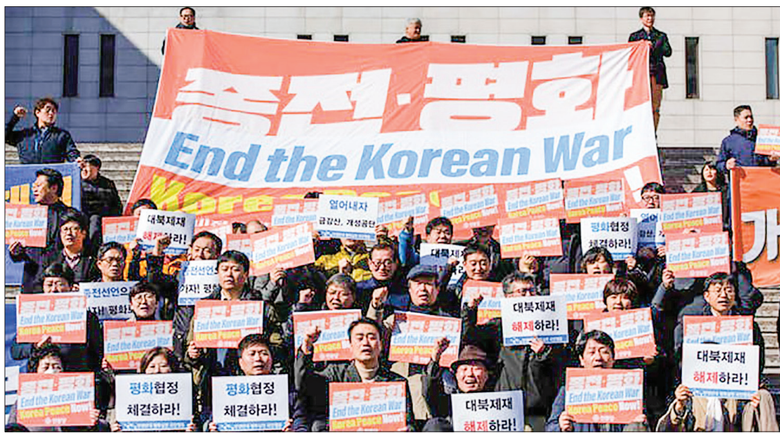
Pro-peace activists attend a rally calling for a formal end to the Korean War in central Seoul on 26 February 2019. - US President Donald Trump and North Korean leader Kim Jong Un will meet for dinner in Hanoi before their previously announced talks the next day, the White House said.

CHINA'S top diplomat, Yang Jiechi, has expressed support for Seoul's push for the declaration of a formal end to the 1950-1953 Korean War, Yonhap News Agency reported Friday, citing South Korea's Embassy in Beijing.