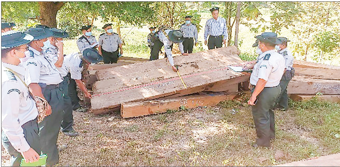
Confiscated timber is seen due to the efforts of the Forest Department.

wood and 28.5204 tonnes of others in regions/states, including the Nay Pyi Taw Council Area and arrested seven suspects with seven vehicles, according to the department. —Nyi Nyi Than (Nay Pyi Taw)/GNLM