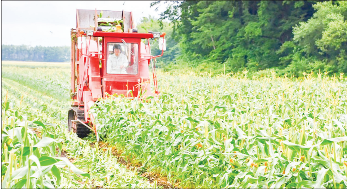
The export value of Japanese agriculture, forestry and seafood products this year is certain to surpass 1 trillion yen ($8.8 billion) for the first time, the agricultural ministry said Friday.

THE export value of Japanese agriculture, forestry and seafood products this year is certain to surpass 1 trillion yen ($8.8 billion) for the first time, the agricultural ministry said Friday.