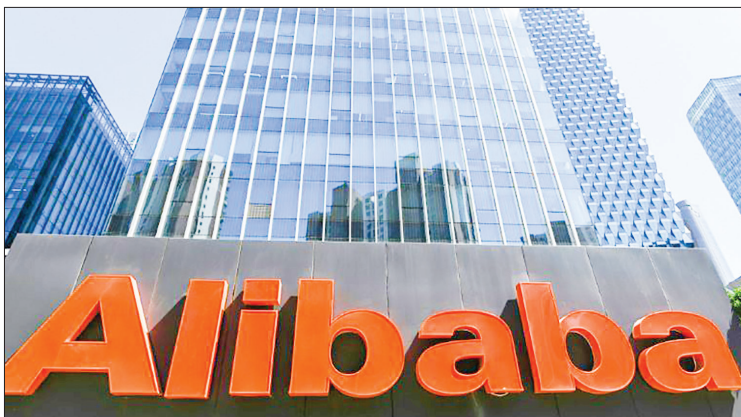
Any data held by Alibaba can be accessed by the Chinese government.

CHINESE e-commerce leader Alibaba Group's role as a "worldwide partner" of the Paris 2024 Olympic Games has sparked a behind-the-scenes battle to prevent it from hosting and accessing sensitive data.