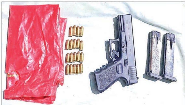
Seized weapons and ammunition in Pathein Township on 4 December 2021.