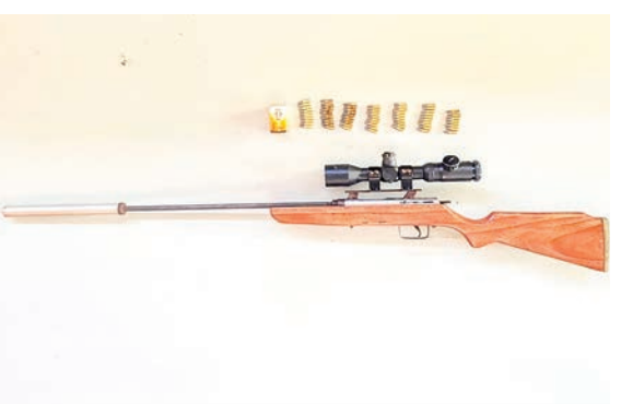
Seized firearms and ammunition in Pathein on 5 December 2021.