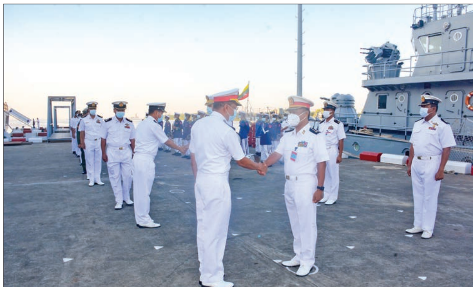
Warship Kyansittha arrives back in Yangon.