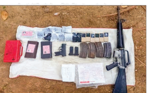
Seized weapons and ammunition in Ngaputaw Township on 5 December 2021.