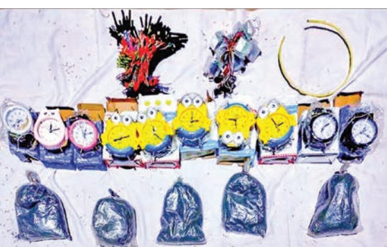
Confiscated explosives in Pathein on 4 December 2021.