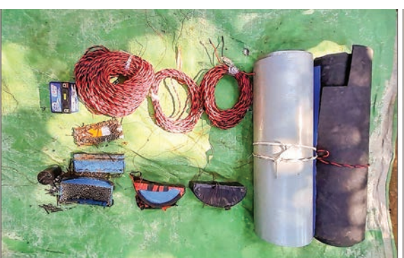
Confiscated items in Ngaputaw Township on 5 December 2021.