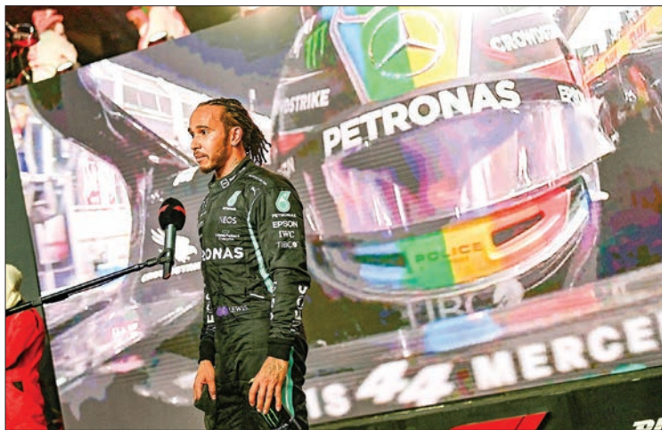
Mercedes' British driver Lewis Hamilton speaks to the press after winning the Formula One Saudi Arabian Grand Prix at the Jeddah Corniche Circuit in Jeddah on 5 December 2021.

LEWIS Hamilton kept his hopes of an eighth world championship title alive with a thrilling victory