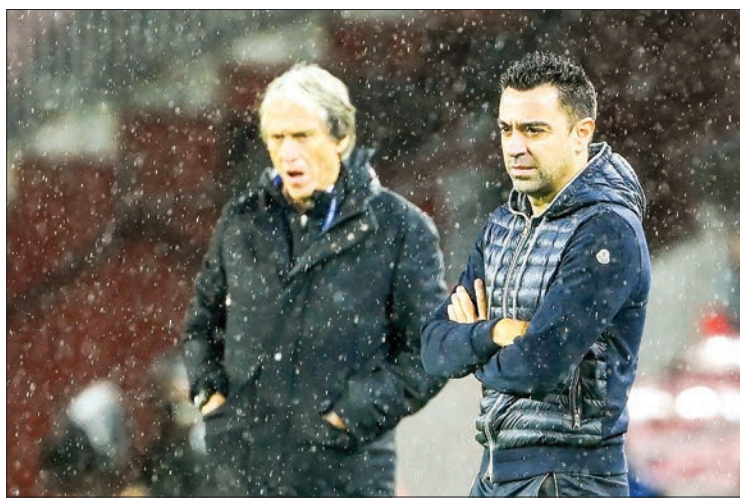
Barcelona's Spanish coach Xavi (R) attends the UEFA Champions League Group E football match between FC Barcelona and SL Benfica, at the Camp Nou stadium in Barcelona on 23 November 2021.