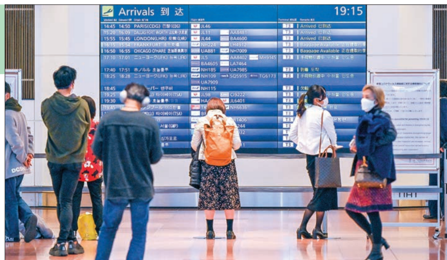
People stand in front of an arrivals board at Tokyo’s Haneda international airport on 1 December 2021, as Japan suspended all new flight bookings into the country in response to the Omicron Covid variant.

The Omicron variant has already been detected in dozens of countries including the United States, Australia and parts of Europe since being first reported by South Africa last month. — Kyodo ■