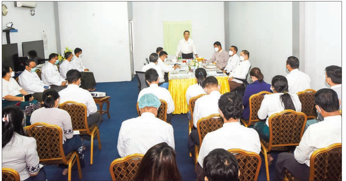
The MoI Union minister provides guidance to the staff of The Global New Light of Myanmar newspaper yesterday.

forts of MRTV for broadcasting modern, active and interesting