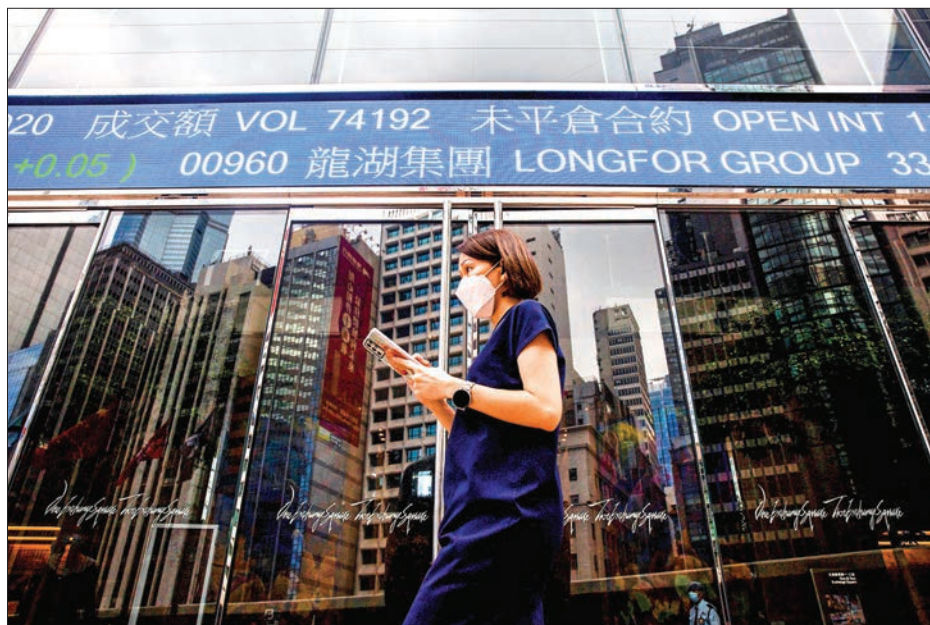
A woman walks past a digital sign showing stock market information in the Central district of Hong Kong on 5 November 2021.

Tracking virus fears — as well as signs of a looming hawkish shift in