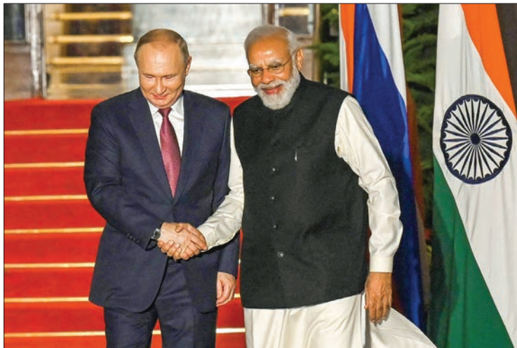
India's Prime Minister Narendra Modi (R) greets Russian President Vladimir Putin before a meeting at Hyderabad House in New Delhi on 6 December 2021.

In its efforts to address a rising China, Washington has set up the QUAD security dialogue with India, Japan, and Australia, raising concerns in both Beijing and Moscow. India was close to the Soviet Union during the Cold War, a relationship that has endured, with New Delhi calling it a "special and privileged strategic partnership". "The friendship between India and Russia has stood the test of time," Modi told Putin at a virtual summit in September. "You have always