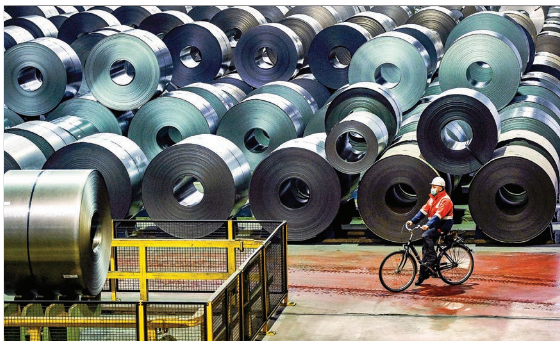
An employee cycles past cold-rolled steel on coils in a hall at the ThyssenKrupp plant in Duisburg, western Germany on 16 November 2021.

Wearing a traditional Chinese dress known as a hanfu, passing from one stand to another with her phone at the end of a cane, the 32-year-old has racked up around 60,000 subscribers. — AFP ■