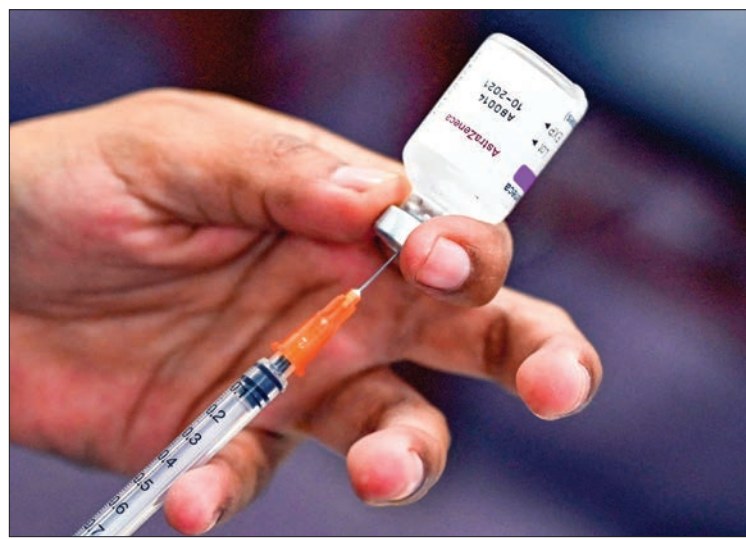
A health worker prepares a dose of the AstraZeneca/Oxford Covid-19 vaccine in Santa Cruz, Bolivia on 18 October 2021, as the country began giving third doses to all health workers, adults over 60 and people with underlying diseases.

It is significantly cheaper and easier to deliver than others, and is credited with increasing vaccine access in poorer countries. — AFP ■