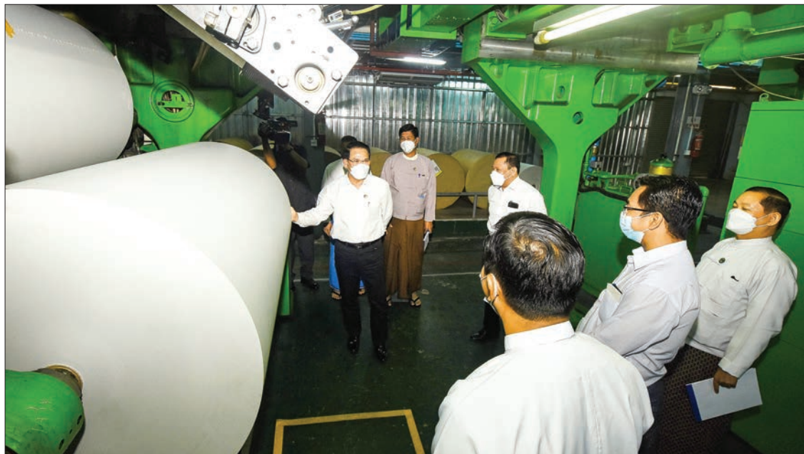
The MoI Union minister inspects the newspaper printing machine of The Global New Light of Myanmar.

The News and Periodicals Enterprise runs state-owned daily newspapers The Myanmar Alinn and The Mirror and The Global New Light of Myanmar newspaper, a joint venture with a private company. —MNA