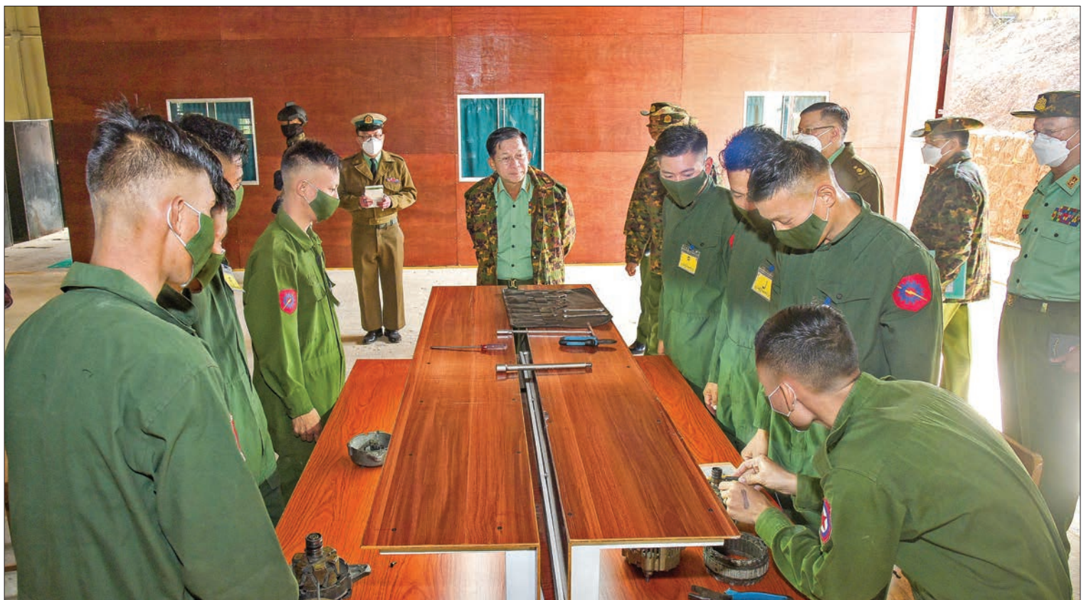
State Administration Council Chairman Commander-in-Chief of Defence Services Senior General Min Aung Hlaing views the practical works of the trainees with the use of teaching aids at the local mechanical engineering school in PyinOoLwin yesterday.