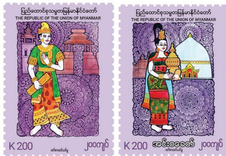
New postage stamps.

IN a bid to portray Myanmar's cultural heritage, rediscover the traditional costume of men and women from generation to generation and draw the attention of the youth, Myanmar Post under the Ministry of Transport and Communications will issue two new postage stamps (worth K200 each) at 9:30 am on 8 December 2021 (5 th Waxing of Nadaw 1383 ME), depicting the costumes of men and women in Inwa era. The new series will be sold at Central Post Office in Nay Pyi Taw, General Post