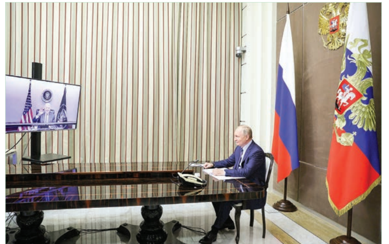
Russian President Vladimir Putin attends a meeting with US President Joe Biden via a video call in the Black Sea resort of Sochi on 7 December 2021.

Moscow calls invasion talk “hysteria”. Instead, Putin intends to tell Biden that he sees Ukraine’s growing alliance with Western nations as threat to Russian security — and that any move by Ukraine to join NATO would be crossing a red line. — AFP ■