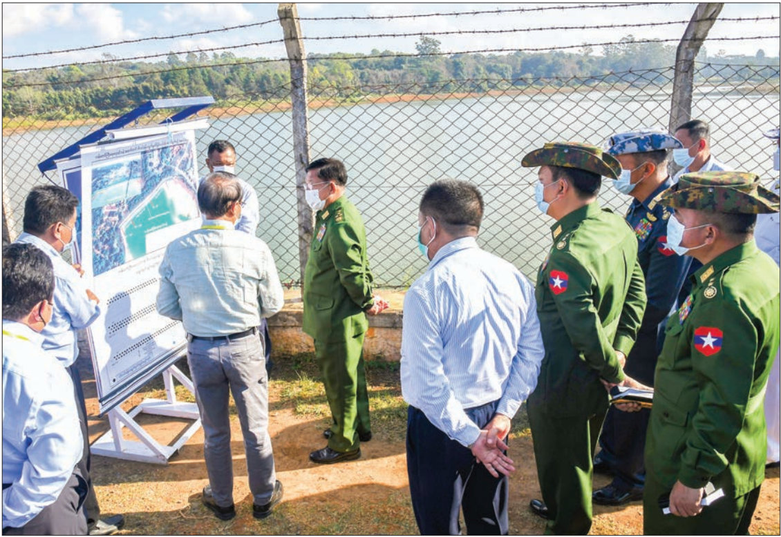
The Senior General inspects the maintenance works of Kandawgyi Lake.

In his speech, the Senior General instructed officials to research the drugs to be used in the prevention, control and treatment activities of COVID-19, manufacture quality products, conduct marketing researches for sufficient production of drugs at home, produce medicines essential for common diseases, focus on the production of medicines for fulfilling the public needs, and meet the local demand of medicines in line with the policy “nothing is more important than human life” during the outbreak of COVID-19. The Senior General viewed medicines produced by the factory visited there and attended to the needs reported by officials. After viewing the sections of