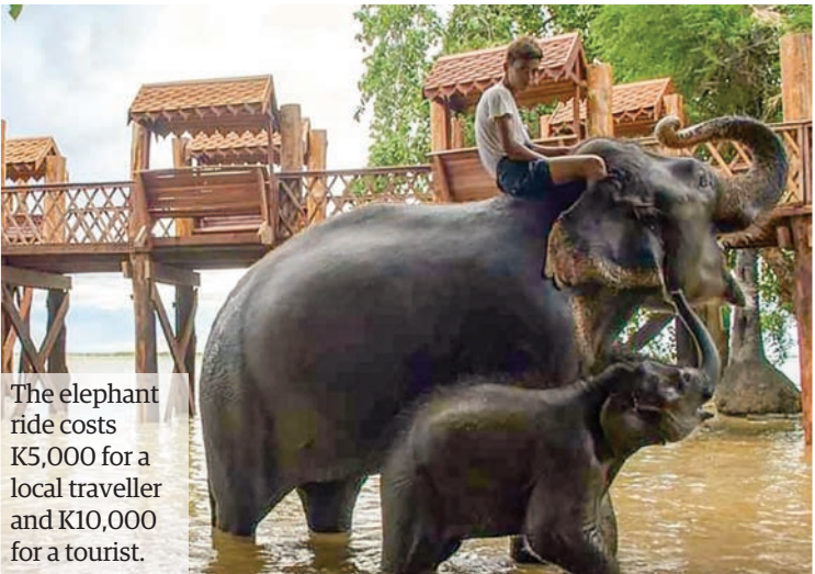
The elephant ride costs K5,000 for a local traveller and K10,000 for a tourist.

There are seven elephants at Palin Riverview Elephant Camp. Myanmar implemented elephant-based tourism, developed eco-tourism sites and opened elephant camps near rivers and mountain ranges.—Ko Htein(KPD)/GNLM