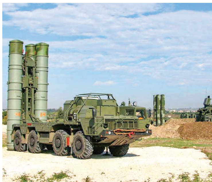
Russia's S-400 air defence missile systems at the Hmeimim air base in the Syrian province of Latakia.

The deal has been implemented. We witnessed at times on part of the United States to undermine this cooperation and to make India obey US orders to follow American vision to how this region should develop, and our Indian friends clearly and firmly explained that they are a sovereign country and they will decide whose weapons to buy and who is going to be a partner of India in this and other areas," Lavrov said.—ANI ■