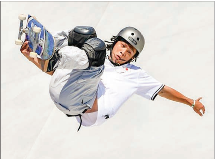
Japan’s Ayumu Hirano became a dual Olympian when he competed in the skateboard park event at the Tokyo Games this year.

Hirano made his Olympic debut as a 15-year-old at the 2014 Sochi Games, finishing second behind Iouri “iPod” Podladtchikov in the snowboard halfpipe. He claimed silver again in Pyeongchang four years later, losing out to American legend Shaun White for gold.