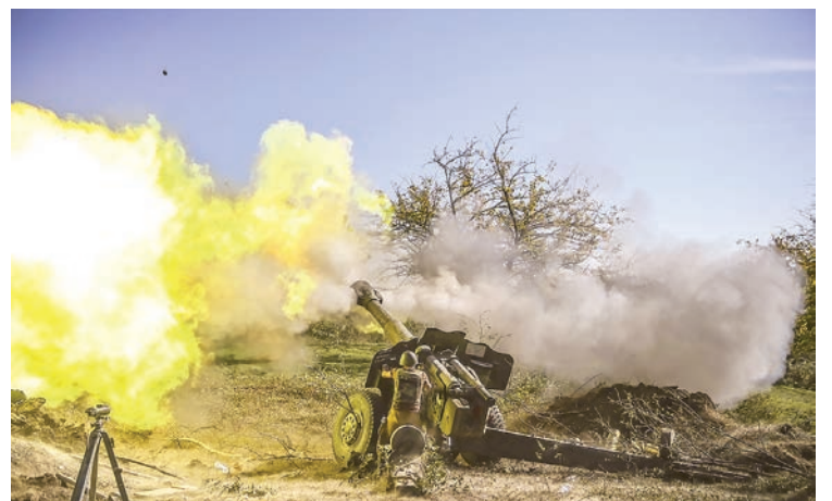
An Armenian soldier fires artillery on the front line on 25 October 2020, during the ongoing fighting between Armenian and Azerbaijani forces over the breakaway region of Nagorno-Karabakh.

Nagorno-Karabakh is an ethnic Armenian region of Azerbaijan that broke away from Baku’s control in the early 1990s after the collapse of the Soviet Union.—AFP ■