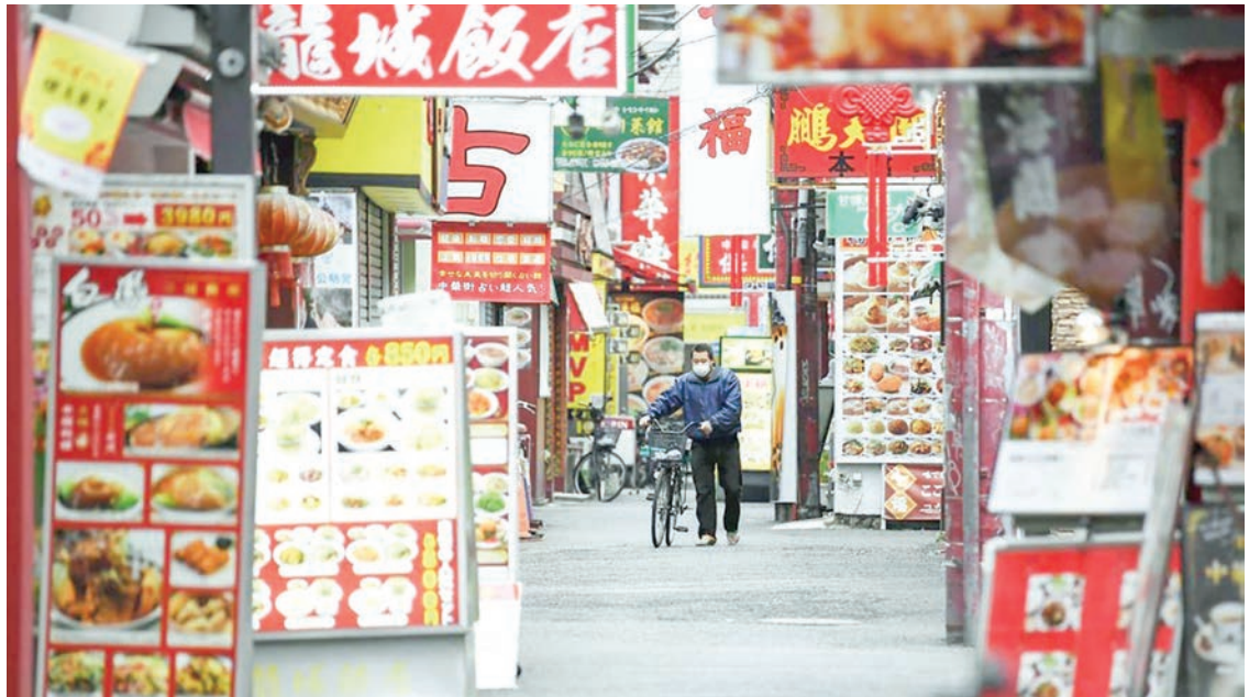
Expenditure on food, including on eating out, fell 0.9 per cent for the third straight month of decrease, as people bought less seafood, meat and vegetables to cook at home. A man walks a bicycle through an almost empty street in Yokohama, near Tokyo, on Sunday afternoon.

By component, spending on furniture and household amenities such as tables, sofas and washing machines dropped 16.7 per cent from a year earlier as purchases were lifted last year by the 100,000 yen per person cash handouts aimed at easing