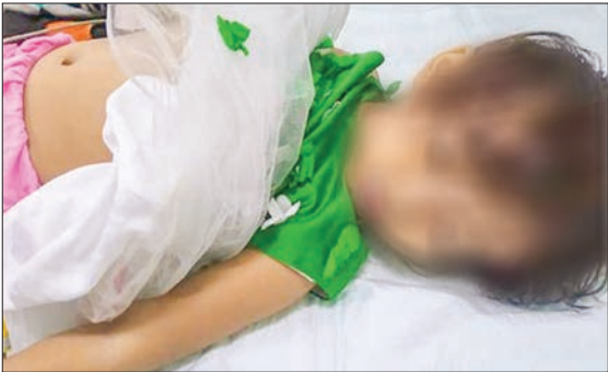
A child is dead due to a bomb blast by terrorists.

A five-year-old girl was killed in a grenade attack by terrorists in Chanmyathazi Township, Mandalay Region.