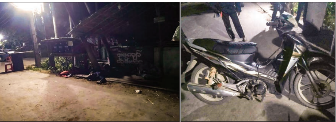
Attack on the police outpost in Kawhmu Township.

Kawhmu Township in Yangon Region, and they ran away, to Dala. Then, members of security forces found one unlicensed motorcycle, an empty bullet shell and a male dead body with gunshot wounds, who was identified as a stranger in the village. Similarly, at about 3:30 am yesterday, terrorists attacked Kan Kaung police outpost beside the Yangon-Mandalay Expressway in Meiktila Township of Mandalay Region using grenades and homemade bombs.