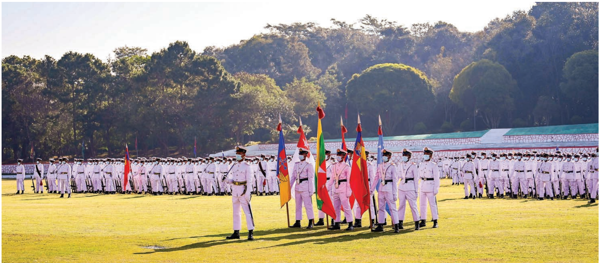
State Administration Council Chairman Commander-in-Chief of Defence Services Senior General Maha Thray Sithu Min Aung Hlaing addresses the cadet company at the DSA parade ground in PyinOoLwin on 7 December 2021.

As the State and the Tatmadaw turned out those cadets to become good leaders in the future, they have to dutifully serve their assignments with loyalty based on training from the DSA and control themselves so as to repay the debt of gratitude to the State and the Tatmadaw. They themselves need to uplift their lives for meeting the goals. They all have to be loyal to the State and the Tatmadaw as well as their families along their lives applying the good practices. — MNA