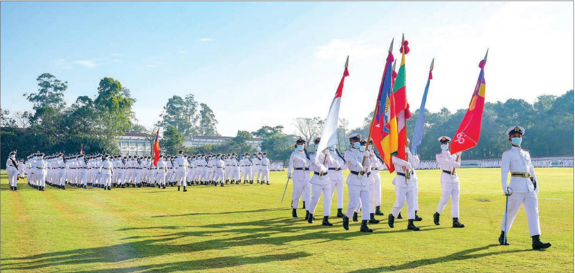
State Administration Council Chairman Commander-in-Chief of Defence Services Senior General Maha Thray Sithu Min Aung Hlaing takes the salute of the cadet companies at the DSA parade ground in PyinOoLwin on 7 December 2021.