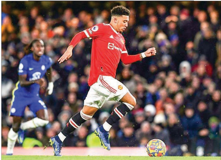
Jadon Sancho’s move from Borussia Dortmund to Manchester United led to a profit for Bundesliga clubs in the latest transfer window.

AS Barcelona and Spanish champions Atletico Madrid scrap for a place in the Champions League last 16 this week, the Premier League’s four participants can take it easy knowing their places in the knockout stages are already guaranteed.