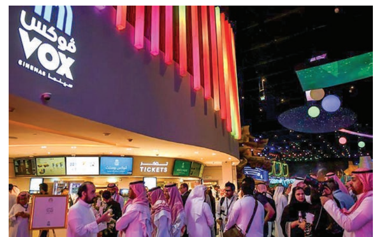
Saudi Arabia only allowed cinemas to reopen in 2018 after a decades-long ban.

"The thought of organising a film festival in Saudi Arabia was unimaginable just five years ago," said Egyptian art critic Mohamed Abdel Rahman.—AFP ■