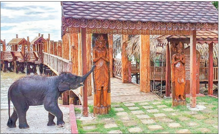
The Elephant Riverview Camp officially began on 28 March 2018, and about 22 elephant camps have been opened in states and regions so far to reinforce the connection between the humans and animals.