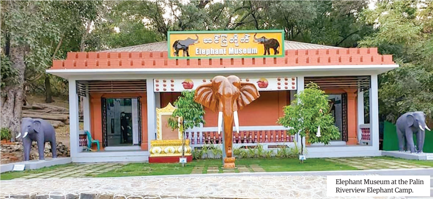
Elephant Museum at the Palin Riverview Elephant Camp.