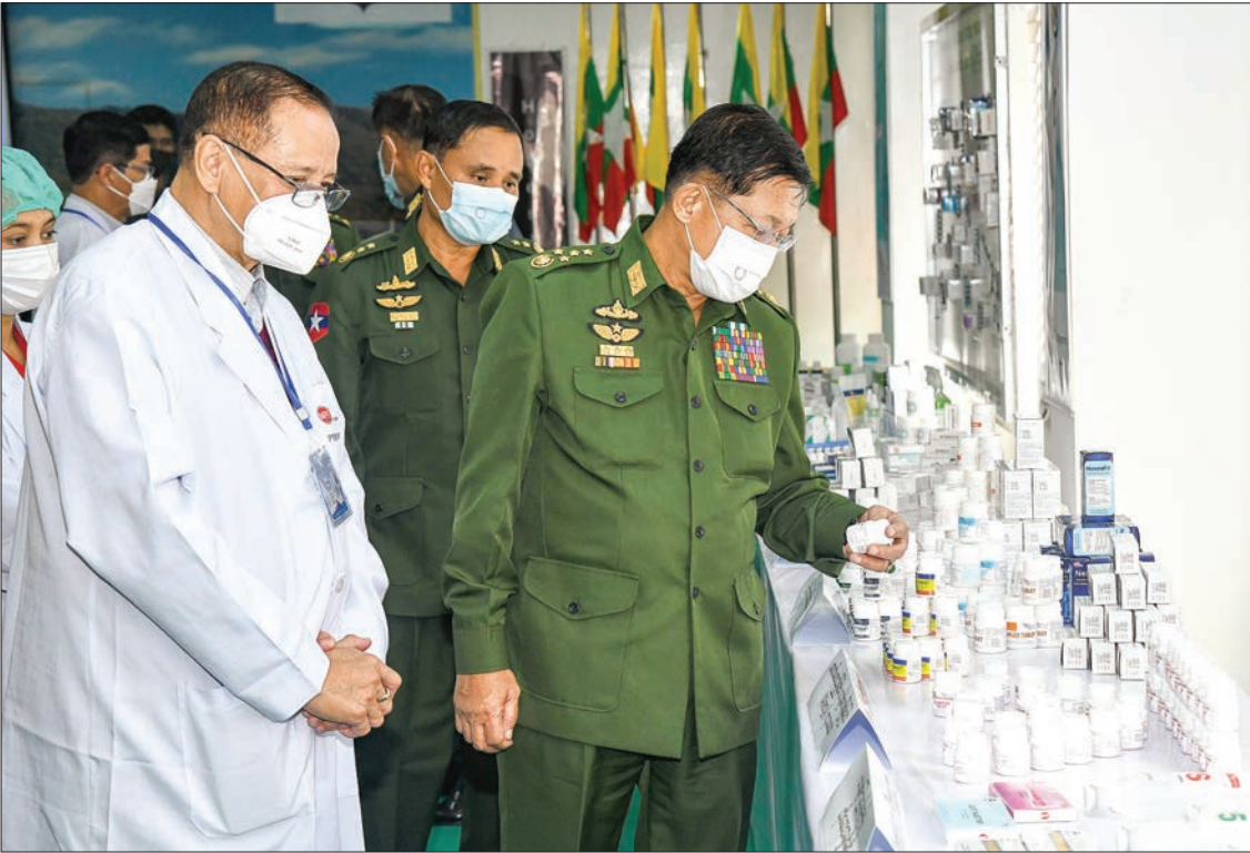
The Senior General views the medicines manufactured by the Myanmar Pharmaceutical Factory (PyinOoLwin).

the factory, the Senior General underlined the need for manufacturing and distribution of quality medicines and for raising the public awareness on side effects of combined drugs easily used by the people. The pharmaceutical factory (PyinOoLwin) manufactures medicines for neurological and diabetes diseases, drugs for cardiac and hypertension diseases, vitamin B, antibiotic drugs, hand gel and electrolyte with the use of modern machines. The Senior General visited the PyinOoLwin railway station. In his speech, the Senior General said that efforts should be made for upgrading rail tracks and carrying out systematic maintenance for reduction of