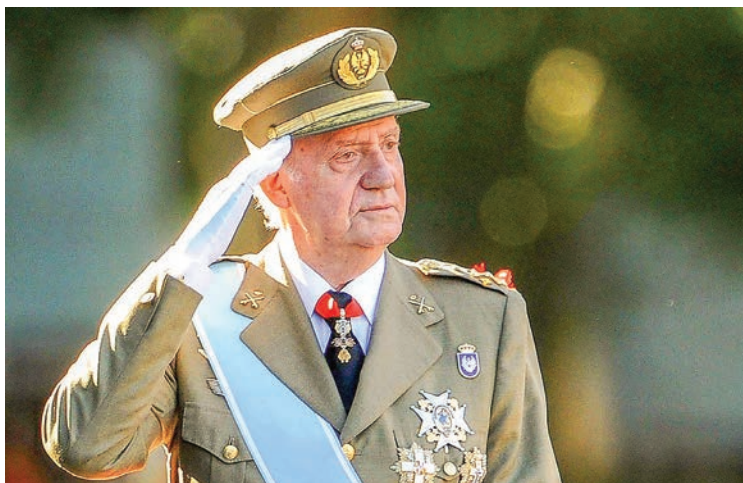
Lawyers for Spain’s former king Juan Carlos I are arguing he has immunity from English courts in a civil case brought by his former lover.

SPAIN’S former king Juan Carlos I is seeking immunity from the English courts after his ex-lover accused him of spying on and harassing her, a London court was told on Monday.