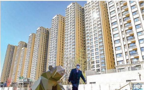
Evergrande is China's second-largest developer by volume. A housing complex in Beijing developed by China Evergrande Group, on 21 October 2021.

EMBATTLED property giant Evergrande is planning what could become China's biggest ever debt restructuring, wrapping in all its offshore obligations, reports said, as it faced the prospect Tuesday of defaulting on a key payment. The Chinese government, which sparked the crisis when it launched a drive last year to curb excessive debt among Evergrande and other real estate firms, is poised to take a leading role in the restructure, analysts told AFP. Evergrande, with a debt pile of over $300 billion, is the most prominent firm to have buckled under the crackdown, but others have also suffered. The real estate industry is a top growth driver for the world's second biggest economy and the debt crisis has raised fears of a spillover into other key sectors.—AFP ■