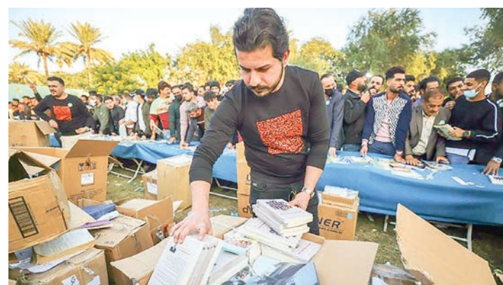
Volunteers at the 'I am an Iraqi, I read' festival in Baghdad listened to requests and distributed books to visitors for free.

Galleries have opened and festivals have blossomed, attracting crowds eager to make up for lost time. The Gallery opened its doors barely a month ago, but visitors queue around the corner on opening night of any show.—AFP ■