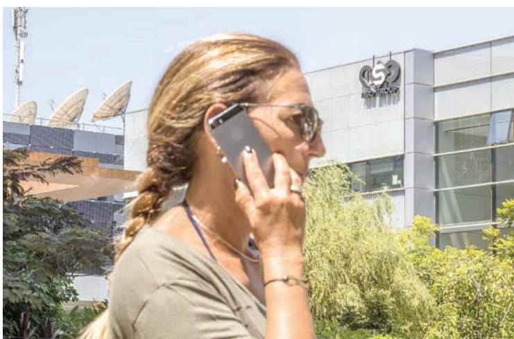
Israeli woman uses her iPhone in front of the building housing the Israeli NSO Group near Tel Aviv, Israel, on 28 August 2016.

ISRAEL laid down the law Monday on the use by foreign governments of its cyber exports, after the private Israeli developer of Pegasus spyware became engulfed in scandal abroad.