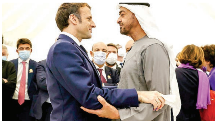
French President Emmanuel Macron (L) is greeted by Abu Dhabi's Crown Prince Mohammed bin Zayed al-Nahyan in Dubai on the first day of his Gulf tour, before the signing of the arms deal.