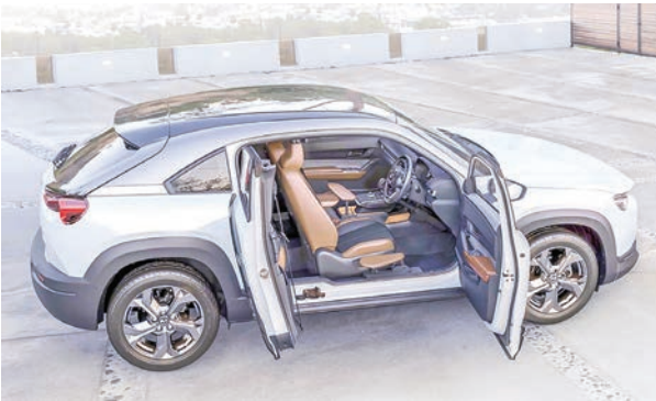
Supplied photo shows Mazda Motor Corp.'s MX-30 Self-empowerment Driving Vehicle that can be driven using hands only.

MAZDA Motor Corp. on Thursday began accepting reservations for purchase of a modified SUV that can be controlled solely with the use of hands by drivers who are physically disabled. The MX-30 Self-empowerment Driving Vehicle, a modified version of the MX-30 SUV that is set to be released in January, is equipped with a lever on the left side of the driver that can be depressed by hand to act as a break and a ring on the steering wheel that can function as an accelerator. The car can also be driven using pedals by able-bodied users. It also includes a board that wheelchair users can sit on in the process of moving into the driver's seat. The additional equipment costs 528,000 yen ($4,640) on top of the cost of the original MX-30 model. Mazda is considering developing disabled-friendly equipment for other models as well.—Kyodo ■