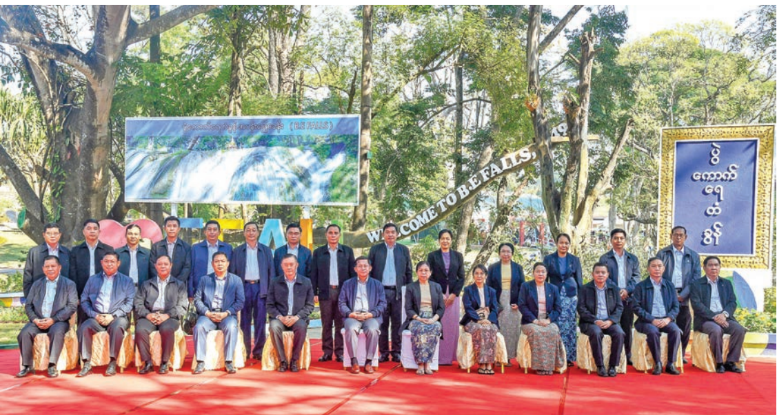
The Senior General and party take the group photo.

The artists of the Myawady Music Band performed songs to the Chairman of the State Administration Council Prime Minister, and party. A documentary on the formation of the Pwekauk Waterfall Resort and upgrade works which were carried out following the guidelines of the Prime Minister was displayed. Afterwards, the Chairman of the State Administration Council Prime Minister awarded cash awards to the performers and the production team. The Chairman of the State Administration Council Prime Minister, and party posed for group photo and took a tour of the BE Fall which includes the construction of the world-class LED glass bridge, motorcars