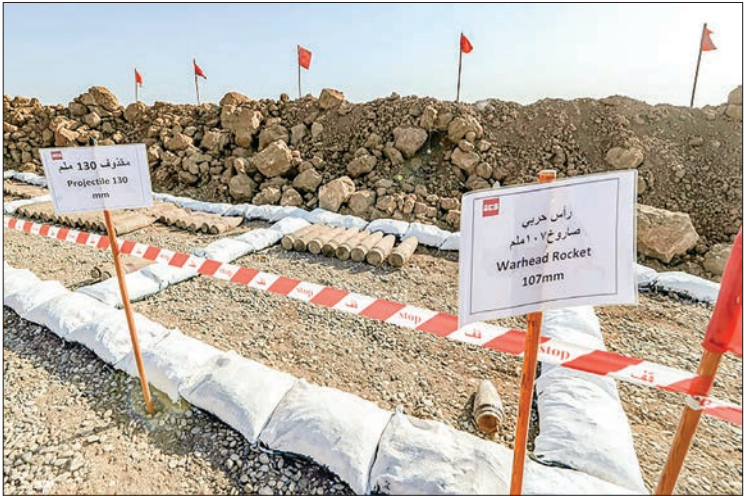
Munitions recovered by Global Clearance Solutions (GCS), a private demining company, near the northern Iraqi hamlet of Hassan-Jalad. the Iran-Iraq war of the 1980s, and the defeat of IS in late 2017. —AFP ■

50 homes. Two of Qado’s nephews were killed while tending to their herd. His son was injured and a fourth man’s legs were severed in the blast that also killed some livestock. Across Iraq, about 100 children were killed or injured between January and September as a result of remnants of conflict, according to the UN. In a country that has one of the world’s highest UXO “contamination rates”, almost one in four people is exposed to risk from unexploded ordnance, say non-governmental groups. Iraq’s successive conflicts have left a deadly legacy, from