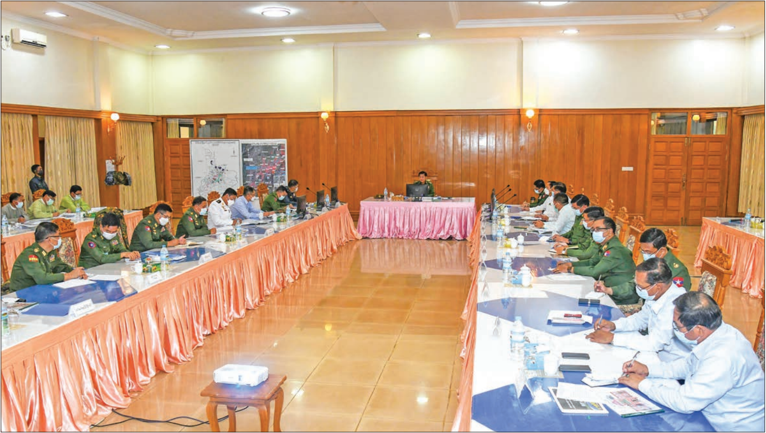
State Administration Council Chairman Prime Minister Senior General Min Aung Hlaing makes the speech at the meeting with the Mandalay Region cabinet members and departmental officials yesterday.

PyinOoLwin must be shaped as a clean city and green city as well as a beautiful city. It is necessary to ensure proper flow of water in the creek which flows from Kandawgyi and Kandawgale in PyinOoLwin and Gelaung Creek. Keeping