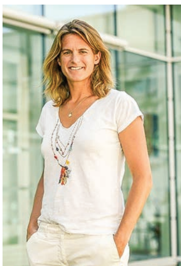
French former world number one Amelie Mauresmo.