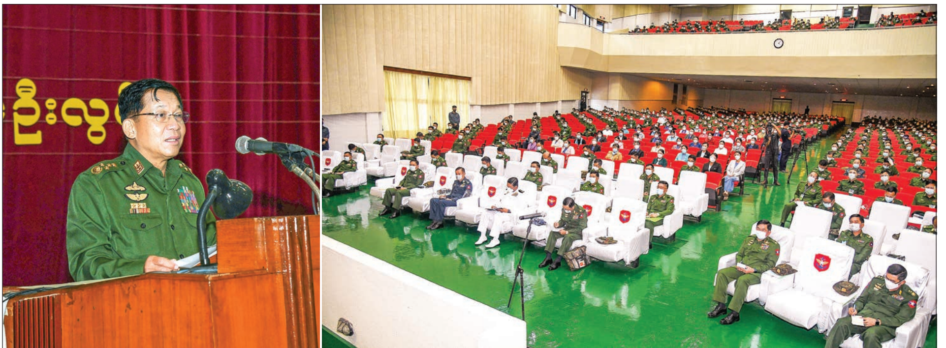
Chairman of the State Administration Council Commander-in-Chief of Defence Services Senior General Min Aung Hlaing addresses the meeting with the commandants of the Defence Services Academy and Defence Services Technological Academy and senior officer instructors in PyinOoLwin on 9 December 2021.

It is necessary to turn out qualified, good leaders for the future endowed with good morals and disciplines