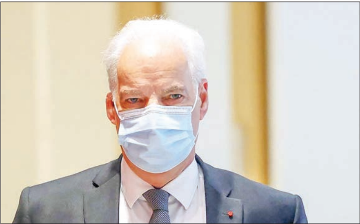
Alain Griset, who worked in the Finance Ministry and oversaw relations with small and medium-sized businesses, was convicted of submitting an incomplete wealth declaration to the government transparency authority.

THE French minister in charge of small and medium-sized companies resigned on Wednesday after being convicted for failing to declare all of his assets. Alain Griset was handed a six-month suspended prison term and a suspended ban on holding public office for three years by a court in Paris on Wednesday, which found he had deliberately hidden his financial holdings when entering the government in July 2020. All ministers are required to declare their wealth to a regulator in charge of public transparency, but the court found Griset had concealed an account holding €171,000 worth of shares, as well as direct shareholdings in other companies. The 68-year-old former taxi driver was also found to be actively managing 130,000 euros worth of assets for the Cnams business association from northern France which had deposited the money in his account. A statement from Prime Minister Jean Castex noted that Griset’s resignation had been accepted while hailing the “spirit of responsibility which was behind this decision.” —AFP ■