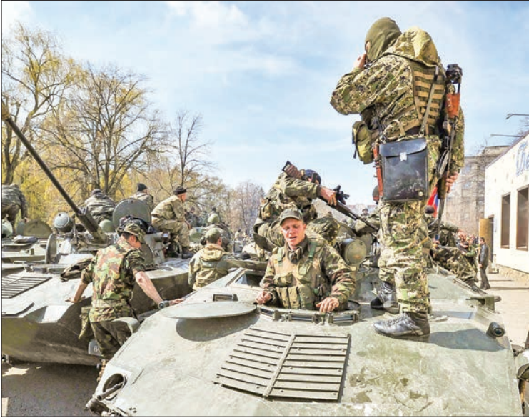
Armed men wearing military fatigues gathered on armoured personnel carriers in the eastern Ukrainian city of Slovyansk in this undated picture. The White House said Biden would be holding the conference call after he speaks to Ukraine’s President Volodymyr

US President Joe Biden will call NATO’s Eastern European members on Thursday to discuss his video summit with Russian President Vladimir Putin and fears of war in Ukraine, the White House said. Biden “will convene a call with the leaders of the Bucharest Nine group of our eastern flank NATO Allies to brief them on his call with President Putin, hear their perspectives on the current security situation, and underscore the United States’ commitment to transatlantic security,” a statement said Wednesday. The Bucharest group comprises Bulgaria, the Czech Republic, Estonia, Hungary, Latvia, Lithuania, Poland, Romania and Slovakia.