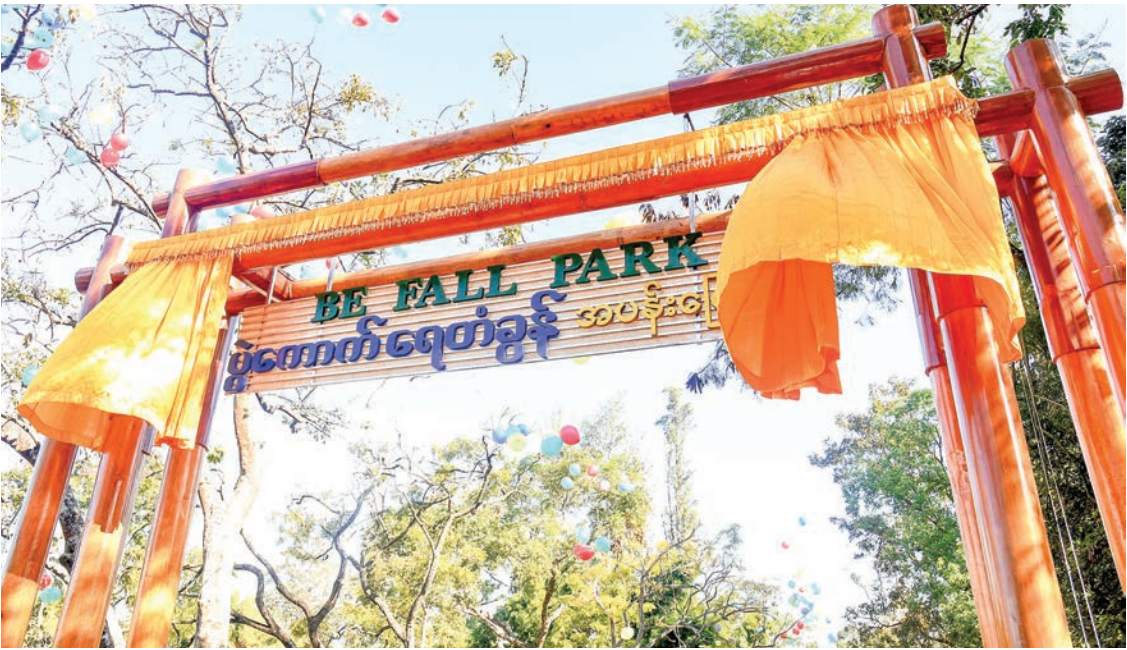
State Administration Council Chairman Prime Minister Senior General Min Aung Hlaing formally inaugurates the upgraded Pwekauk Waterfall Resort (BE Fall) in PyinOoLwin on 9 December 2021.