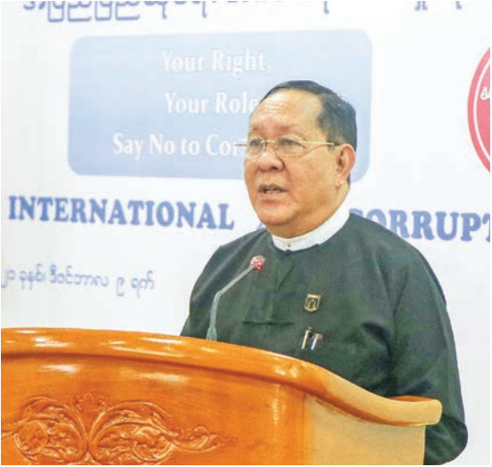
Union Chief Justice U Htun Htun Oo.