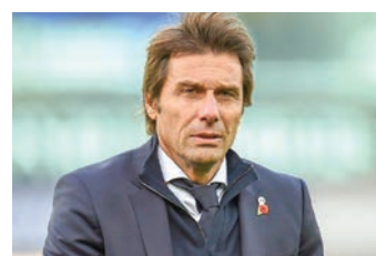
Tottenham manager Antonio Conte.

TOTTENHAM Hotspur announced the postponement of Thursday's Europa Conference League clash with Rennes following a severe coronavirus outbreak at the Premier League club, but their French opponents called into question the decision.