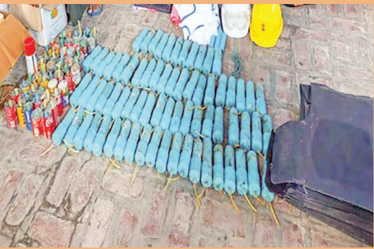
Seized homemade mines.