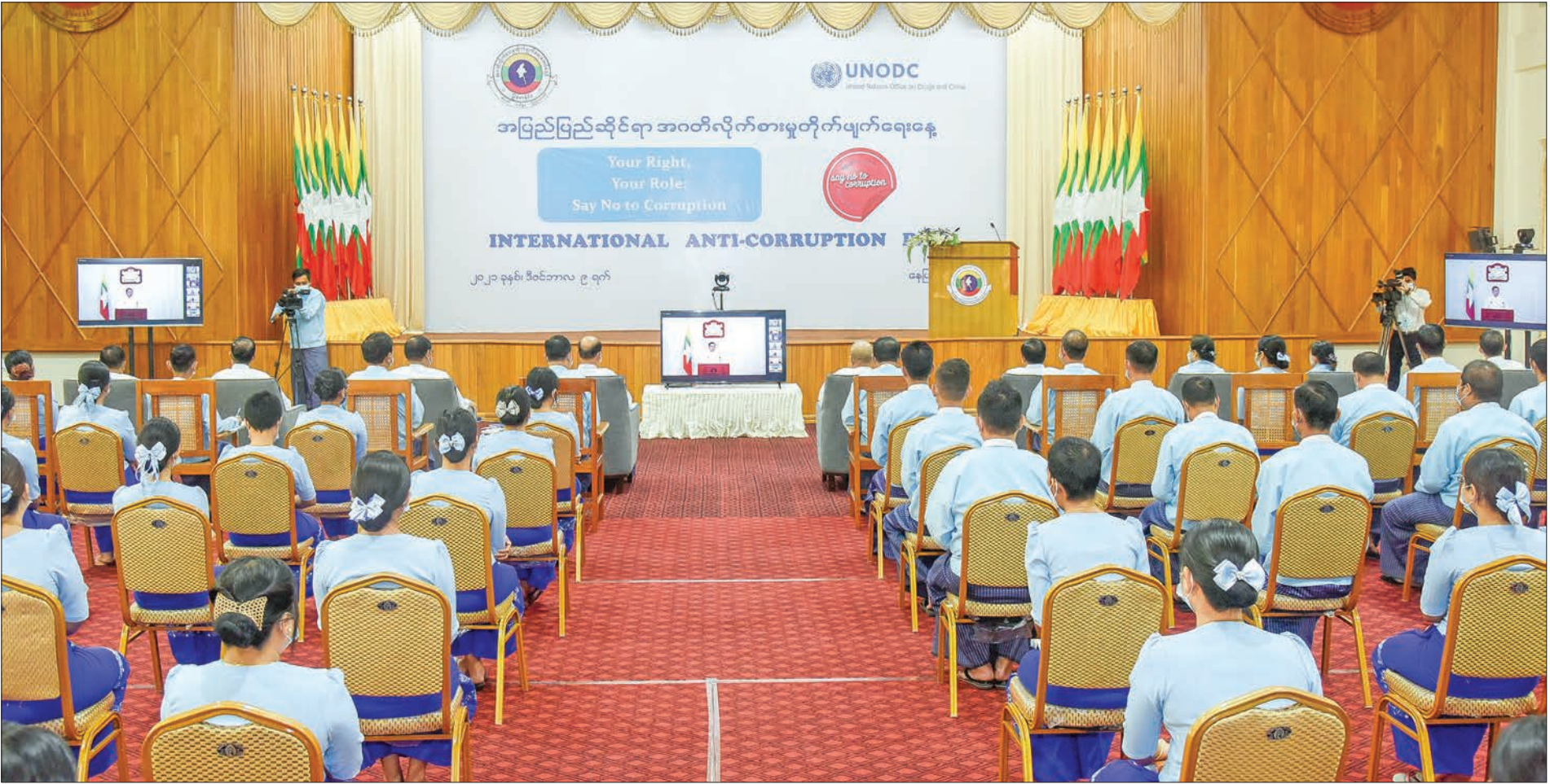
International Anti-Corruption Day 2021 event is underway in Nay Pyi Taw yesterday.