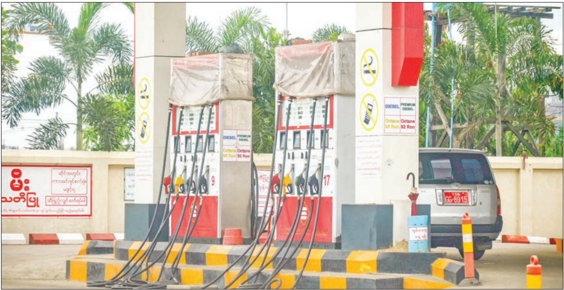
A local fuel filling outlet in Yangon.

THE Consumer Affairs Department under the Ministry of Commerce stated that fuel oil valued at US$20 million will be sold at the subsidized price in the third batch. The fuel importers directly spent $20 million at the reference rate of the Central Bank of Myanmar (CBM) to distribute 30 million tonnes of fuel oil. So far, over 26 million tonnes of fuel oil have been sold. Over 11 million litres of 92 Ron, over four million litres of diesel and 10 million litres of premium diesel have been sold. At present, the oil is distributed through 136 filling stations in Yangon, Mandalay, Nay Pyi Taw, Ayeyawady, Magway, Bago and Sagaing regions, Mon, Shan, Rakhine and Kachin states. The consumers can complain about overcharging for fuel