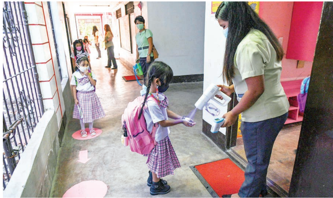
A teacher (R) disinfects and checks the temperatures of students before classes at Ricardo P. Cruz elementary school in Taguig city, suburban Manila on 6 December 2021, after authorities loosened Covid-19 coronavirus restrictions to allow limited in-person classes in the capital city.

Even if it does turn out that Omicron causes less severe disease, Tedros warned against slack-