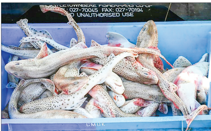
Relations between France and Britain have soured over a post-Brexit fishing rights dispute.

AN EU deadline for Britain to grant licences to dozens of French fishing boats appeared to expire Friday without a final breakthrough in talks, despite France's threat to seek European legal action.