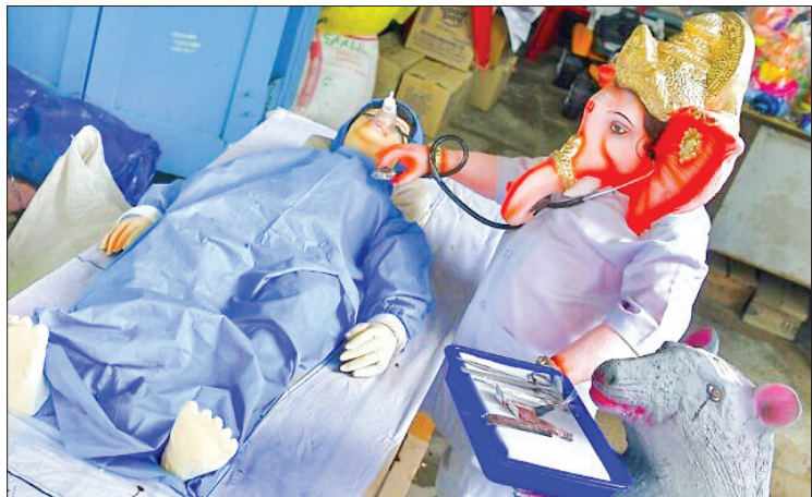
Plasters of Paris (PoP) idols depict the Hindu god Ganesh treating a COVID-19 patient, ahead of the Ganesh Chaturthi Festival, in Bangalore on August 1, 2020.

DESPITE significant progress since the adoption of the Universal Declaration of Human Rights (UDHR) 73 years ago, the COV-