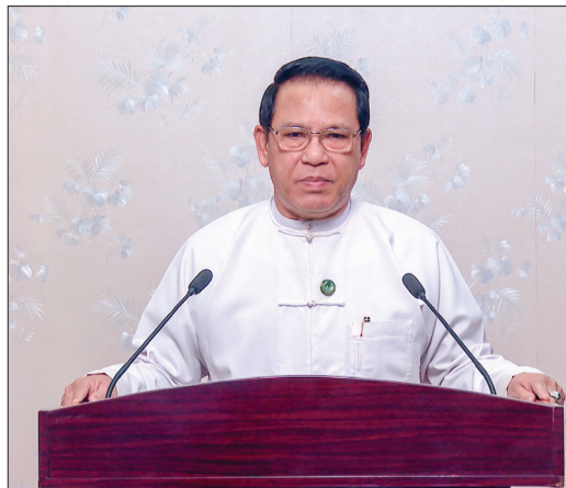
MoI Union Minister U Maung Maung Ohn.