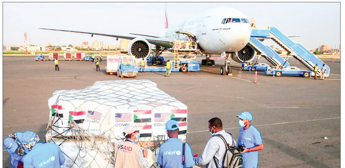
Wealthy countries have received over 16 times more Covid-19 vaccines per person than poorer nations that rely on the Covax programme backed by the World Health Organization.

On so-called “breakout infections” among individuals already