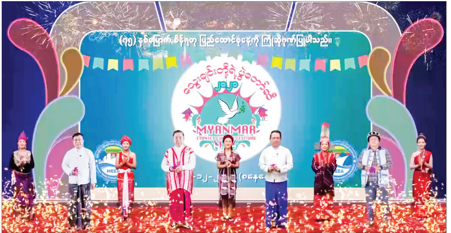
Union Ministers U Saw Tun Aung Myint and U Maung Maung Ohn, Deputy Minister U Zaw Aye Maung and MEEA Chair U Yaw Set virtually cut the ribbon to inaugurate the 3 rd Myanmar Ethnic Cultural Festival 2021 in Nay Pyi Taw yesterday.

(The full text of the opening address delivered by Chairman of