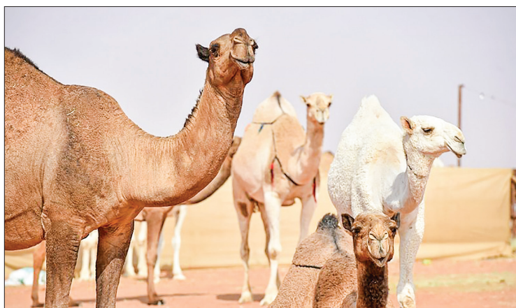
The King Abdulaziz Camel Festival is an annual bedouin event held in the desert northeast of Riyadh that lures breeders from around the Gulf with prize money of up to $66 million.

A high-stakes camel beauty pageant in Saudi Arabia has been hit by a cheating scandal after 43 entrants were disqualified for botox injections and other cosmetic enhancements.