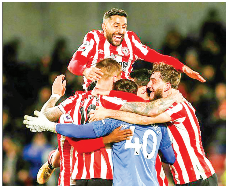
Brentford produced a late fightback to beat Watford 2-1.

"The Brentford team were ready for the battle and some of my players weren't. Every situation is a fight and we have