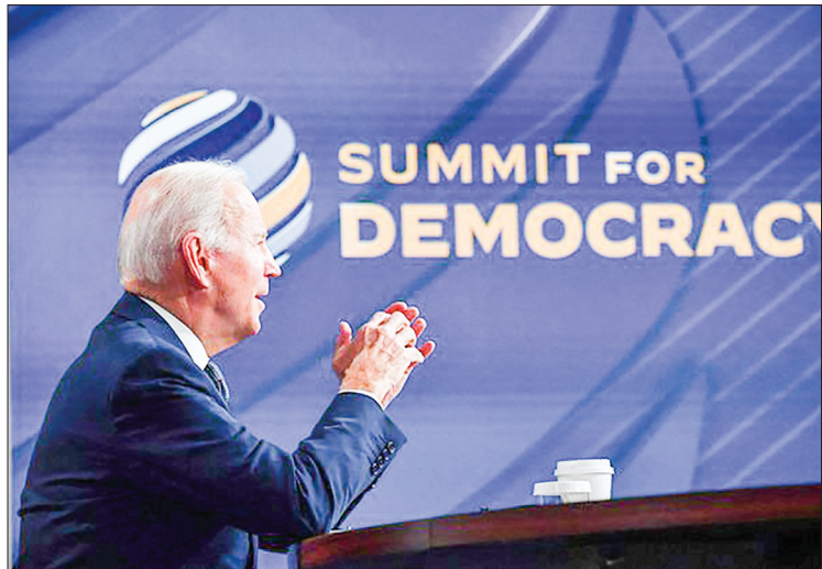
US President Joe Biden speaks to representatives of more than 100 countries during a virtual democracy summit at the White House in Washington, 9 December 2021.

CHINA branded US democracy a “weapon of mass destruction” on Saturday, following the US-organized Summit for Democracy which aimed to shore up like-minded allies in the face of autocratic regimes.