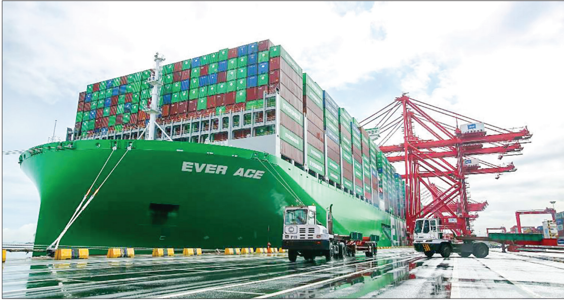
Photo taken on 6 October 2021 shows the world's largest container vessel "Ever Ace" at the Colombo Port in the Sri Lankan capital.

SRI Lankan exporters are optimistic about growth in exports, despite increases in global freight and shipping costs, local media citing a survey reported here Friday. According to data from the bi-annual Export Barometer Survey by the Ceylon Chamber of Commerce (CCC) and the United States Agency for International Development (USAID), 48 per cent of respondents expected moderate to high growth in exports, while 45 per cent expected a moderate to high increase in capacity utilization in the next six months.