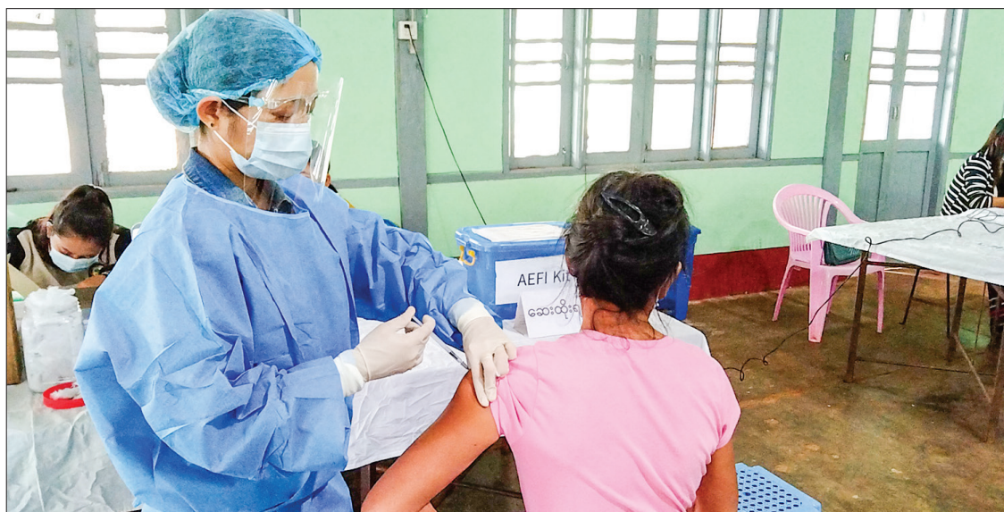
Inoculation drive in Namtu.

HEALTH officials gave the second dose of Sinopharm COVID-19 vaccines to over 18-year-old IDPs at township hall of Namtu in Pamheit Quarter, Namtu Township, Kyaukse District, northern Shan State yesterday morning.