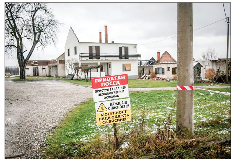
Access forbidden -- danger! warns a sign in front of a house sold to Rio Tinto, which has been paying top dollar to buy property where it wants to mine.

Billions are at stake with Anglo-Australian mining giant Rio Tinto boasting that the project has the potential to add a full percentage point to Serbia’s gross domestic product and provide thousands of jobs. In a matter of years, this impoverished corner of Serbia nestled against the Bosnian border could be transformed into one of the industrial engines turbocharging Europe’s transition to lower-car-