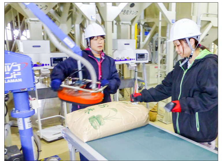
Photo taken on 9 November 2018, shows rice grown in Fukushima being measured for radioactive substances in Kawauchi village in Fukushima Prefecture.

proof of having passed a check for radioactive materials when these products are shipped into Britain. The eight prefectures are Miyagi, Yamagata, Ibaraki, Gunma, Niigata, Yamanashi, Nagano and Shizuoka. If the restrictions are lifted, the certificates of origin now required for these farm products harvested or processed in Japanese prefectures other than the nine will also become unnecessary for exporting to Britain.—Kyodo ■