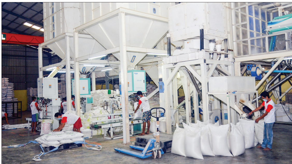
This year, the rice price has been rising steadily since last May, and only the price stabilized in October.

The Pawkywe (80 marks) is priced at K32,500 per bag while the Pawkywe (90 marks) is selling for K33,800 per bag. The price of Eaimahta rice (80