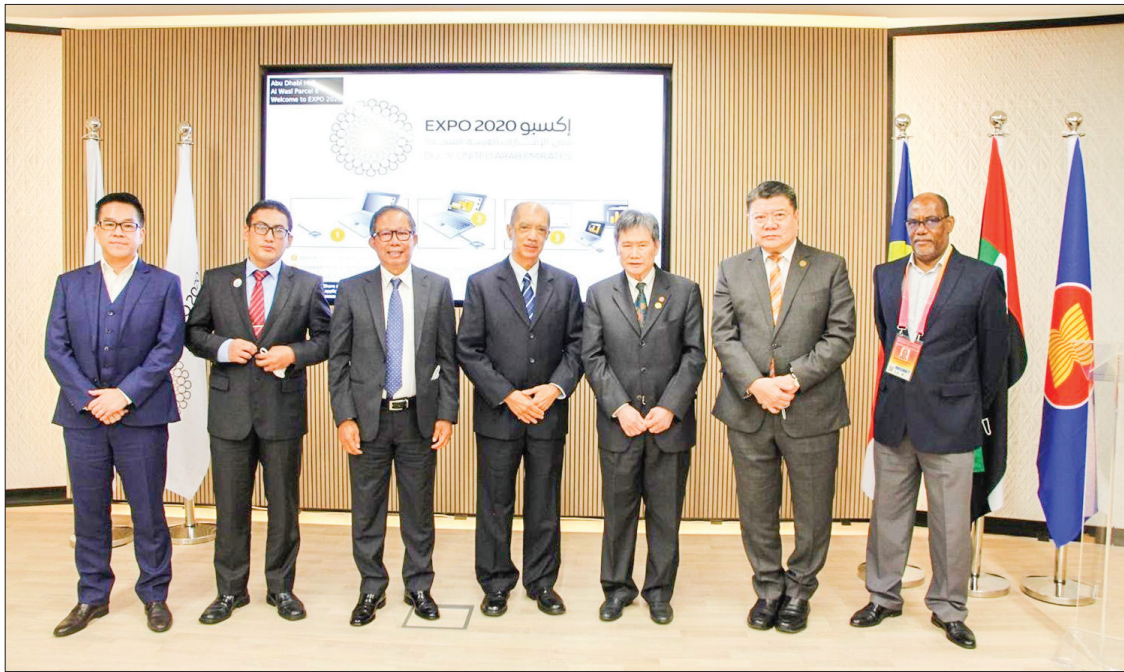
Myanmar delegation led by the MoALI Union minister, Secretary-General of ASEAN Dato Lim Jock Hoi, Mr James Alix Michel Founder and Executive Chairman of James Michel Foundation take the documentary photo.

THE High-Level Forum on Ocean Sustainability in ASEAN was organized at Dubai Expo 2020 (Business Concert Centre) of United Arab Emirates (UAE) on 10 December.