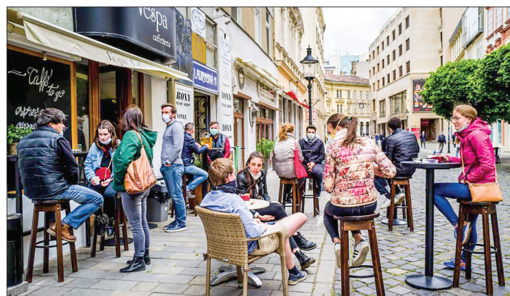
People sit at a terrace cafe in Bratislava, Slovakia, after the government loosened restrictions to contain the coronavirus on 6 May.

THE Slovak government allowed shops, ski resorts and churches to reopen Friday to those who are vaccinated or have recovered from Covid, despite having the highest infection rate in the world. The EU member of 5.4 million people, which went into partial lockdown late last month, registered 1,099 cases per 100,000 people over the past seven days, according to an AFP tally. The decision to ease restrictions came after public criticism of the government’s policies over not being able to go Christmas shopping or make plans for the holidays. “The Covid situation is still very seri-