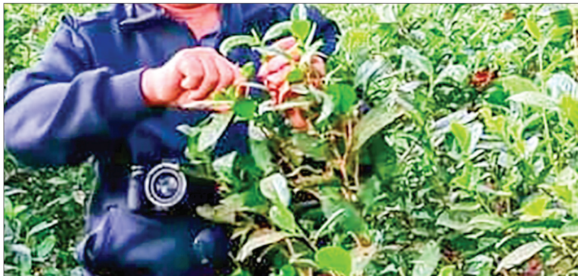
The dried tea leaves from Homalin township are conveyed to Kalay, Tamu, Mawlaik, Monywa and Mandalay markets.