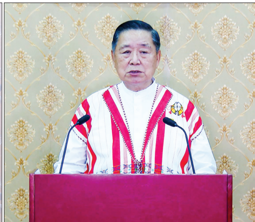
MoEA Union Minister U Saw Tun Aung Myint.