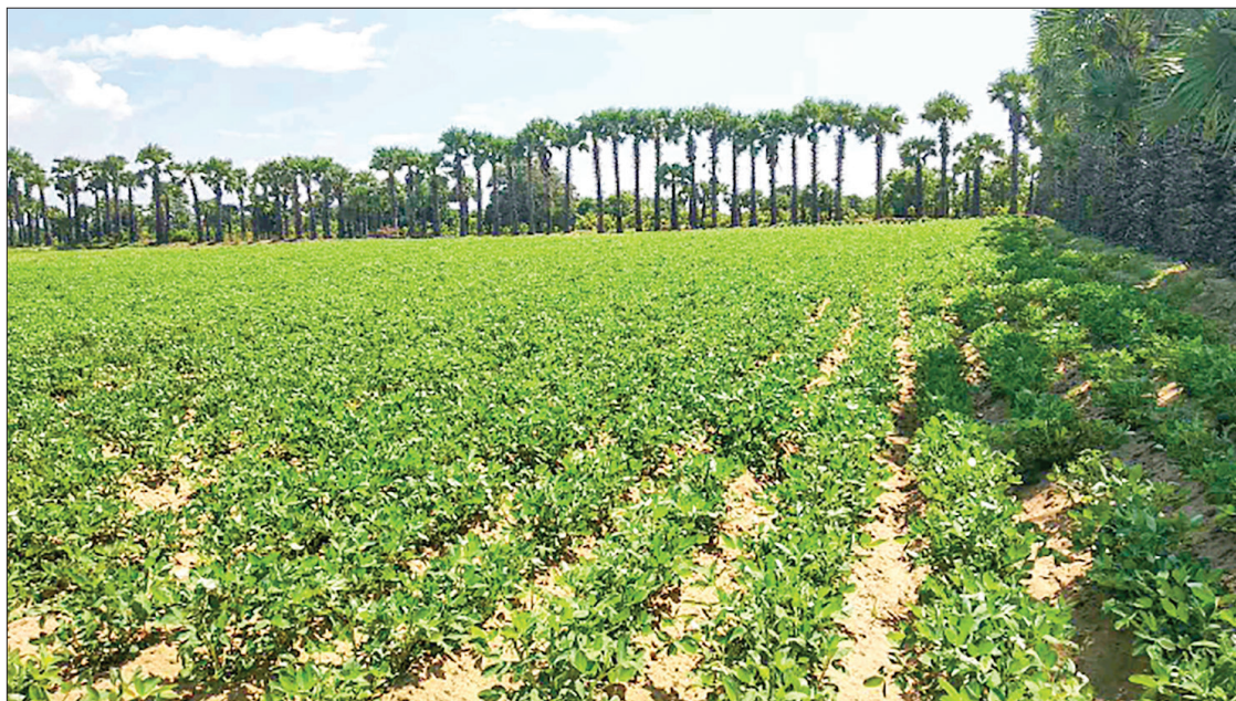
To date, a total of over 217,000 acres of winter oil crops have been planted in the region.

“Oilseeds are grown with the main goal of ensuring sufficient cooking oil in the region. There is enough cooking oil in the region. Oil crops are grown