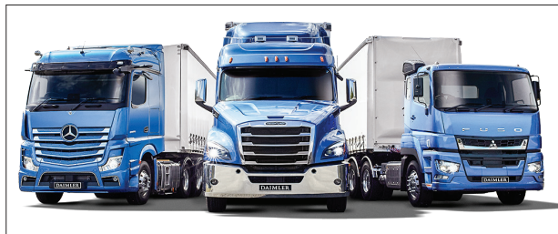
All European Daimler Trucks & Buses plants should produce co2-neutral by the year of 2022. Within Daimler Trucks, FUSO has been a front-runner in the light-duty truck segment, selling its iconic Canter for the past 50 years.

DAIMLER Truck launched on the Frankfurt Stock Exchange on Friday after the heavy-goods operation was spun off from its holding group, soon to be renamed as Mercedes-Benz.