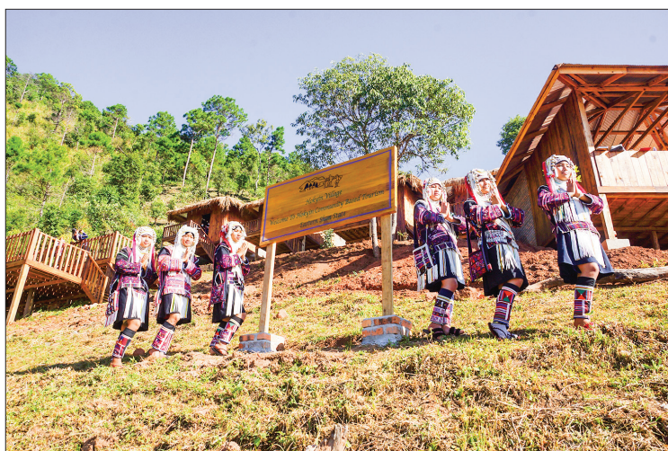
Ethnic Akha people.

UNDER the guidance of the Shan State government and the arrangement of the Directorate of Hotels and Tourism, a course conclusion ceremony of Tourism Awareness Training for Tourism