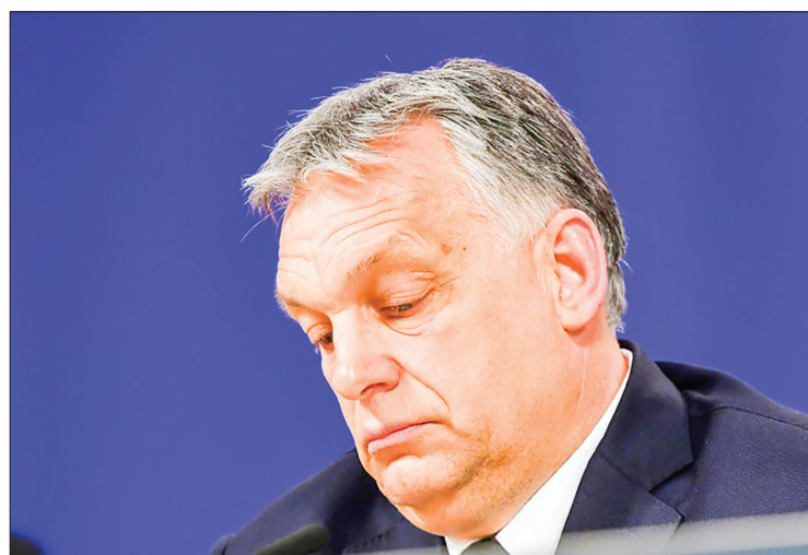
The ruling is the latest chapter in a string of tussles that Orban's government has had with Brussels over legislation on issues such as LGBTQ people, independent media and civil society.

of Justice (ECJ) that it broke EU law by allowing police to deport or physically “push back” asylum-seekers across the Serbian border. The ruling is the latest chapter in a string of tussles that Hungary, like ally Poland, has had with Brussels over legislation that has also targeted LG-BTQ people, independent media and civil society. In December 2020 the ECJ ruled that Hungary must suspend its practice of pushing back asylum-seekers to the Serbian side of its border fence erected in 2015 without launching any formal procedure.