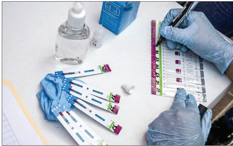
A health worker verifies the process of rapid HIV/AIDS tests taken from passersby at Morelos Square in Caracas, Venezuela, on 3 December 2021.

AN experimental HIV vaccine based on mRNA -- the same technology used in two highly successful Covid-19 vaccines -- has shown promise in experiments in mice and monkeys, according to a study published Thursday in Nature Medicine .