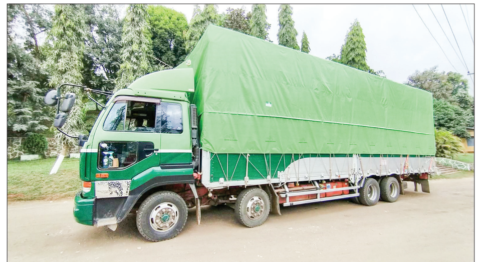
Anti-Covid devices are transported by a lorry to where necessary.

It is reported that the Ministry of Commerce is coordinating with relevant departments and treatment of COVID-19 as well as contact persons for inquires can be reached through the Ministry's Website —www.commerce.gov.mm. — MNA