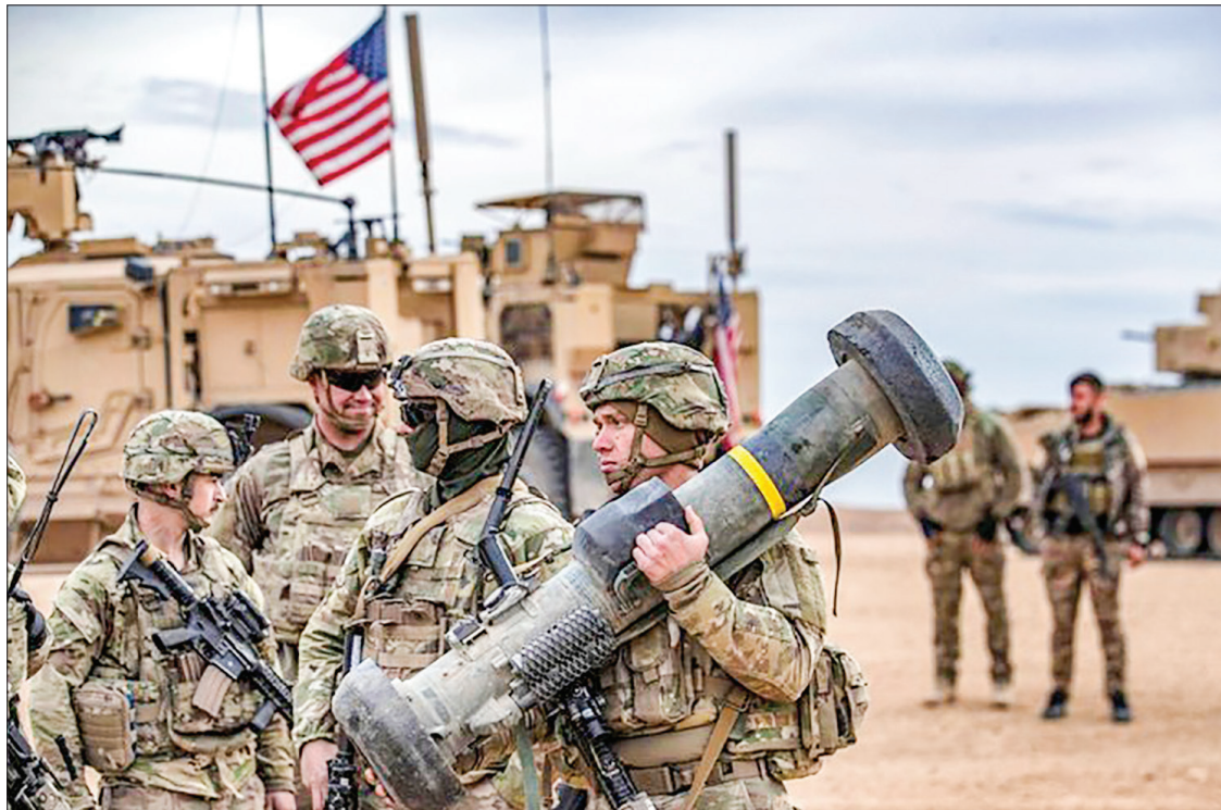
A US soldier carries a javelin launcher during a military exercise between the Syrian Democratic Forces and the US-led international coalition against the Daesh group, in the countryside of Deir Ezzor in northeastern Syria on 7 December 2021.

IRAQI National Security Adviser Qasim al-Araji announced on Thursday the end of the combat mission in Iraq and the with-