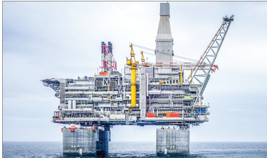
ExxonMobil is one of the world's largest publicly traded international oil and gas companies.

consortium discovered a huge natural gas reserve off Cyprus in Block 10, the island's largest find to date, holding an estimated five