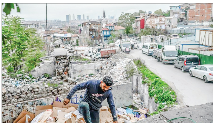
Refugees dig up plastic bottles, glass and other waste they then sort and sell in bulk.

SHROUDED by acrid smoke, a young Afghan crouches sorting waste he has pulled from the trash bins of Istanbul, anxious that Turkey will soon strip him of even this subsistence.