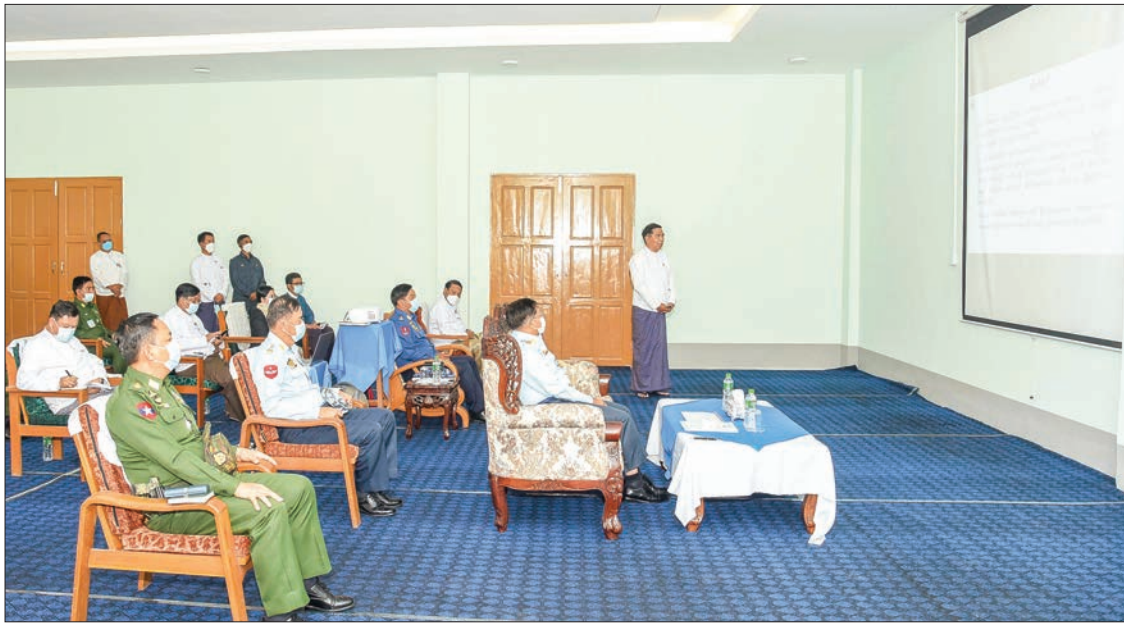
The Senior General hears the report on the progress of Myanmar's earth observation.

TECHNOLOGIES taught with funds of the State must be efficiently applied at home, said Chairman of the State Administration Council Prime Minister Senior General Min Aung Hlaing in inspecting the Myanmar Aerospace Engineering University in Meiktila yesterday afternoon.