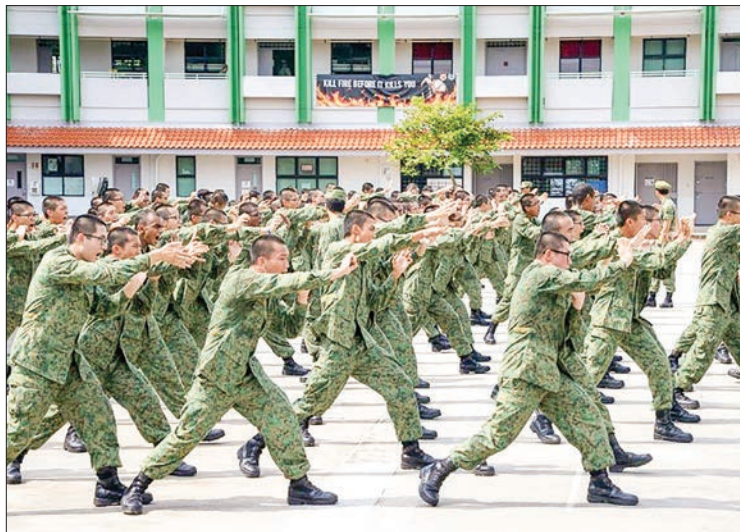
National service in Singapore is a decades-old policy that leaders say remains necessary to defend the city-state.