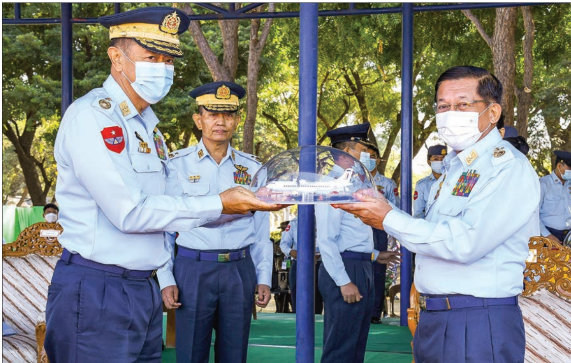
The Commander-in-Chief (Air) presents the miniature aircraft to the Senior General.