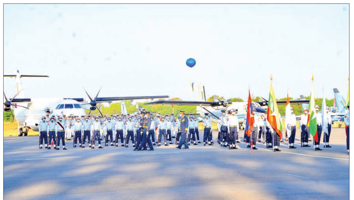
A military parade is held to mark the 74 th Anniversary of Tatmadaw (Air) in Meiktila yesterday.

First, the Commander-in-Chief (Air) and those present at the ceremony received the Five Precepts from the Sayadaw of Sasana Waiponla Learning Centre and