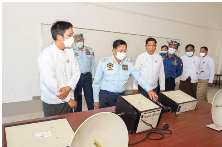
The Senior General and party view around the Myanmar Aerospace Engineering University in Meiktila on 15 December 2021.