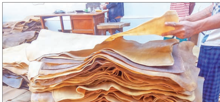
More than 200 acres of rubber has been cultivated in Homalin Township since 2015. The acres grew year over year, and the number of rubber acres reached 8,187 in 2021, according to the township Agriculture Department.

More than 200 acres of rubber has been cultivated in