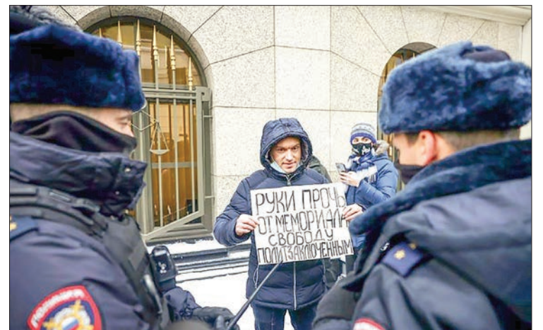
Russia's Supreme Court is hearing a request to shut down Memorial, the country's most prominent right group.

ard saying "Hands off Memorial" was detained, the group said.