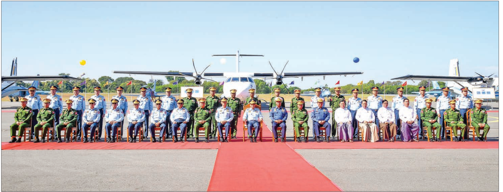
State Administration Council Chairman Commander-in-Chief of Defence Services Senior General Min Aung Hlaing poses for the group documentary photo at the event yesterday.