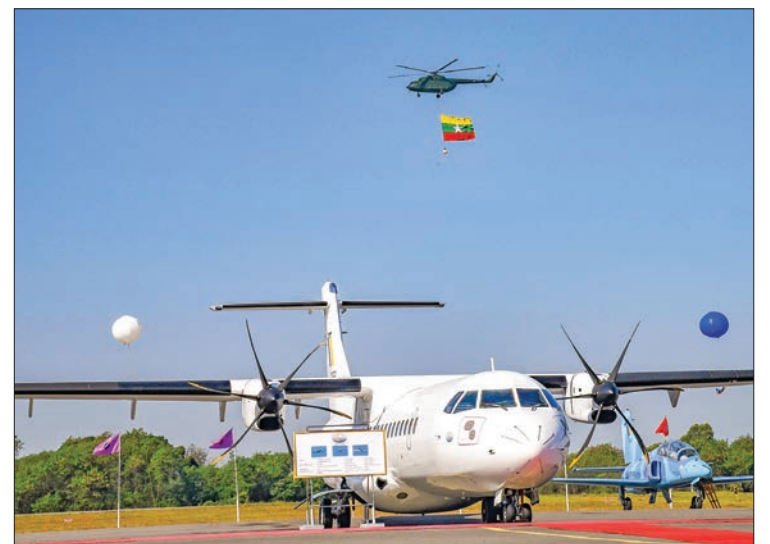
One transport helicopter hanging State Flag salutes the Senior General.