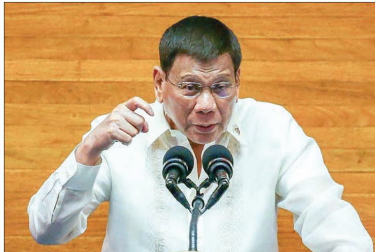
Rodrigo Duterte is constitutionally barred from seeking re-election as president.

Duterte decided to withdraw from the May elections to "better focus" on the government's pan-