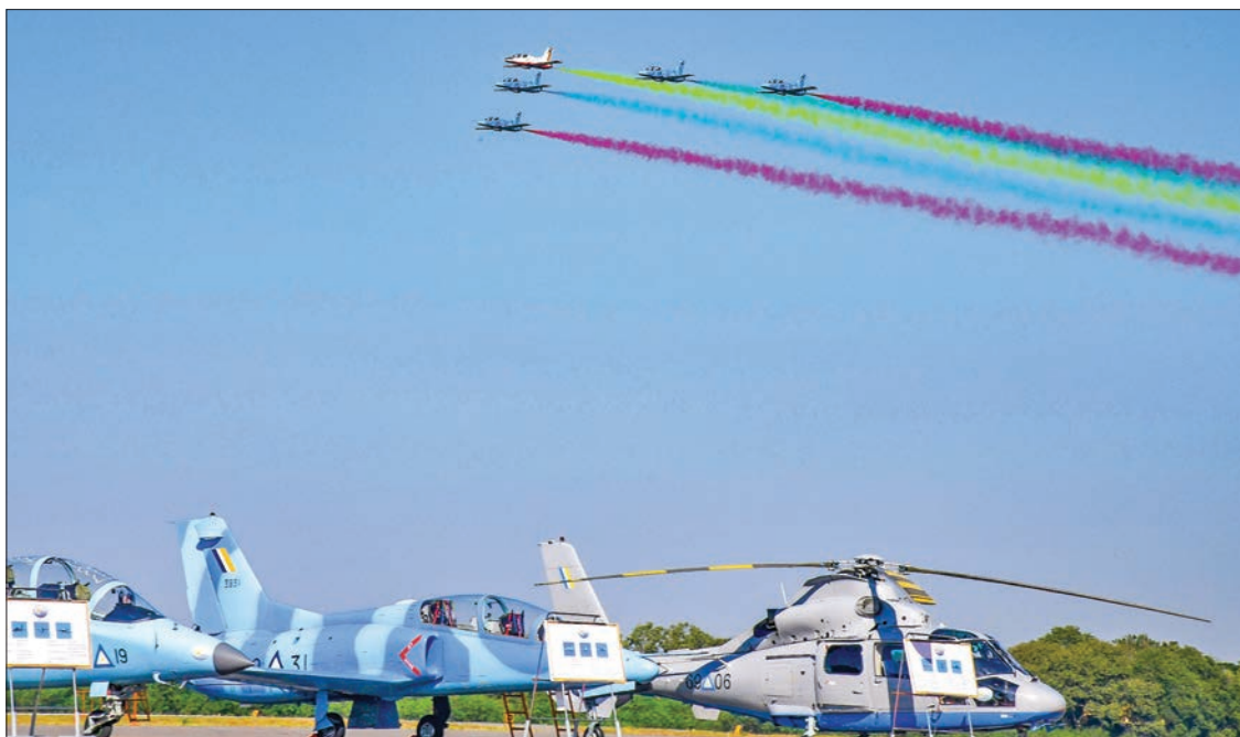
Fighters are seen saluting the Senior General in a composite arrow formation.