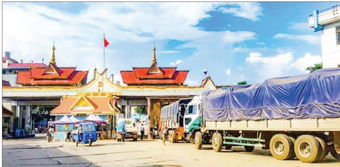
Myanmar conducted US$4.057 billion worth of cross-border trade through Muse posts in the financial year 2020-2021, with exports valued at $2.9 billion and imports worth $1.15 billion, the trade data indicated.

Myanmar conducted US$4.057 billion worth of