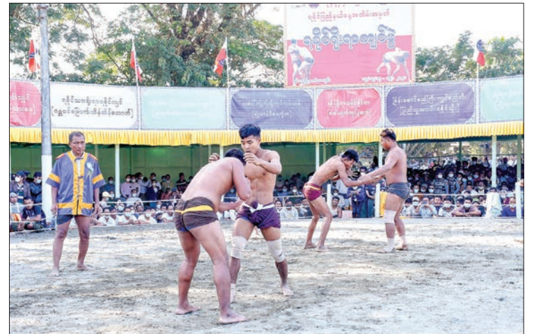
Rakhine's traditional wrestling contest.

The SAC members and party also visited Sakka Muni Thunzetta Pagoda in Lawka Nanda Pagoda precinct and inspected the renovation works on Lawka