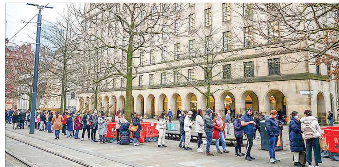
Members of the public wait for a dose of a COVID-19 vaccine, as they queue outside Manchester Town Hall, which is being used as a COVID-19 walk-in vaccination centre, in Manchester, north west England, on 14 December.

The announcement came as a real-world study from South Africa showed two doses of the Pfizer-BioNTech vaccine was 70 per cent effective in stopping severe illness from the new variant, a result called encouraging by researchers, though it represents a drop compared to earlier strains. Data for the new pill, which hasn't yet been authorized any-