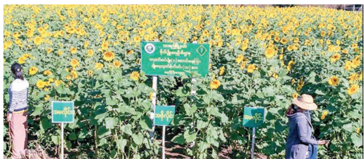
About 25 acres of winter sunflower for seed production have been cultivated in Thazi Township, Mandalay Region to boost the edible oil production.