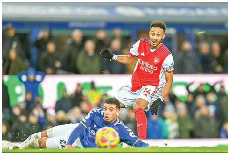
Arsenal striker Pierre-Emerick Aubameyang.

clear he could not let one individual's behaviour influence the mood of the entire club.