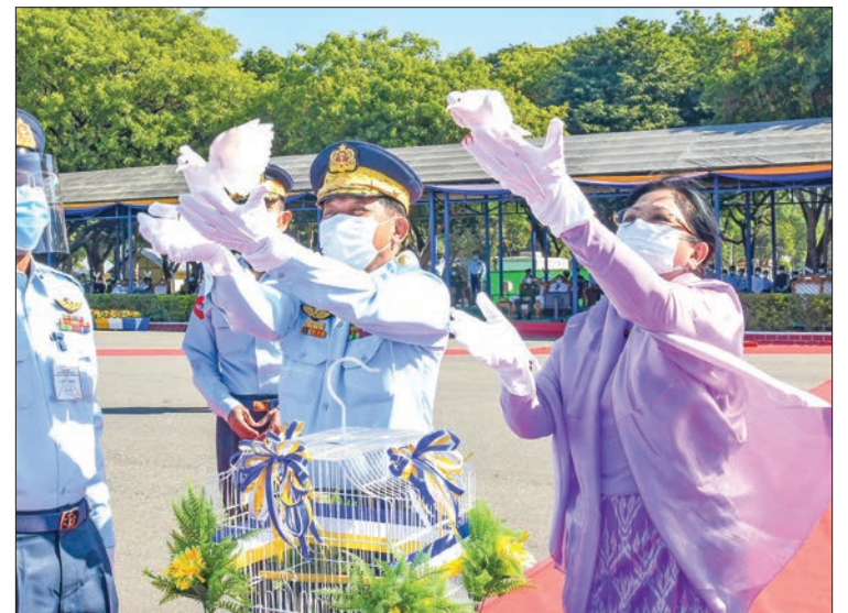
The Senior General and wife release 74 birds.