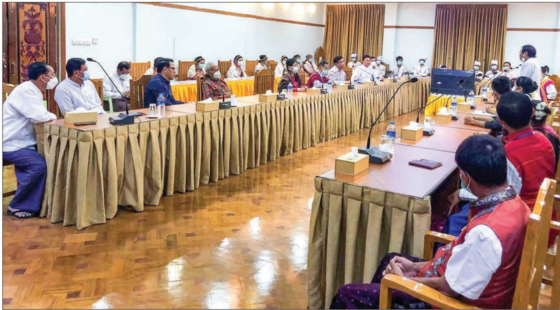
The State Administration Council members and Union ministers meet representatives of Rakhine, Mro, Khami, Dainet and Thet ethnicities.