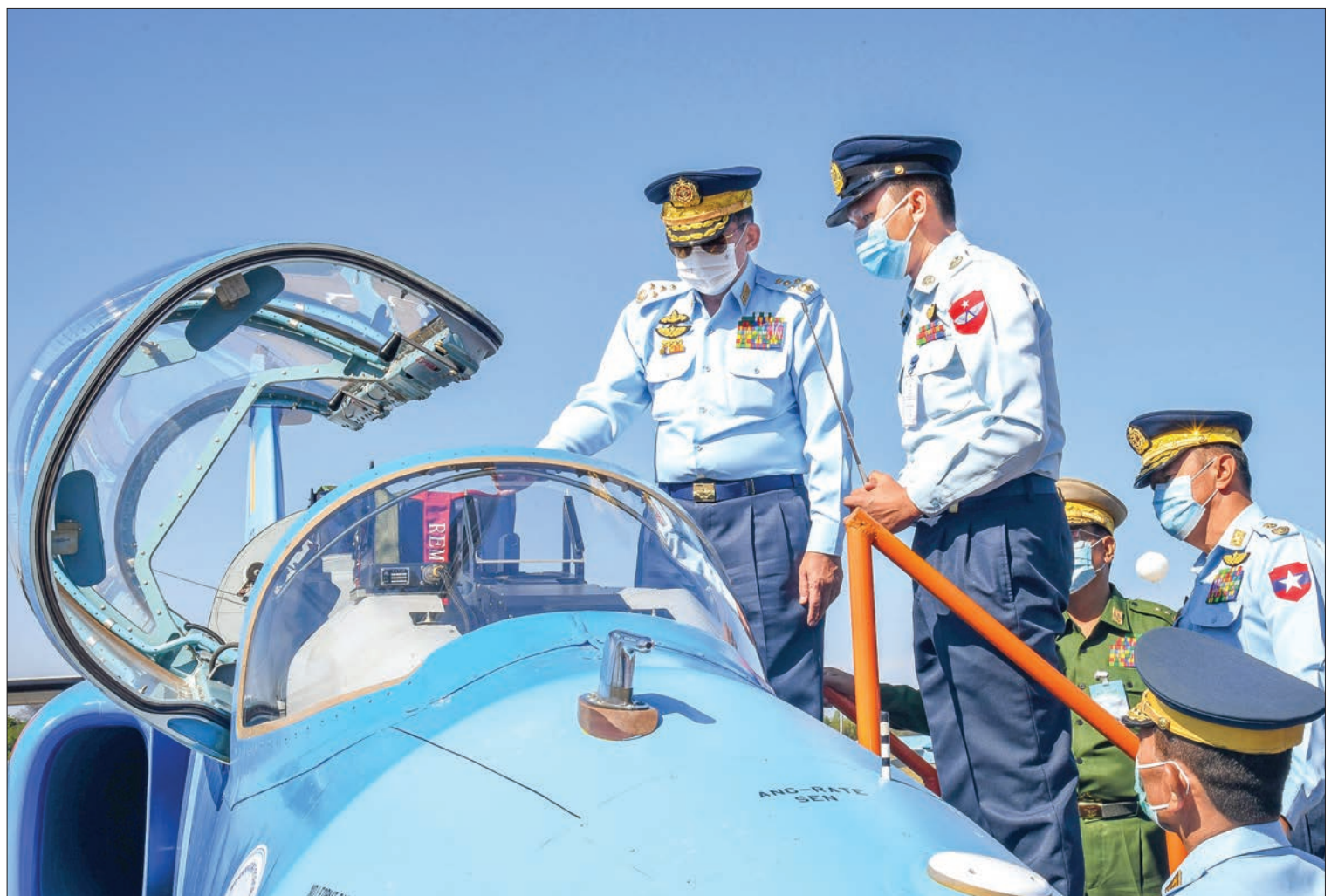
Chairman of the State Administration Council Commander-in-Chief of Defence Services Senior General Min Aung Hlaing observes one of the training jets at the 74 th Anniversary of the Tatmadaw (Air) event in Meiktila on 15 December 2021.