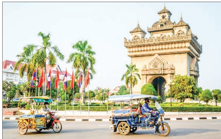
Laos was receiving about 4.7 million foreign tourists each year before the pandemic.

LAOS has announced plans to partially re-open to foreign travellers in the new year, throwing a lifeline to the tourism industry after borders were sealed for more than 18 months to keep out Covid.