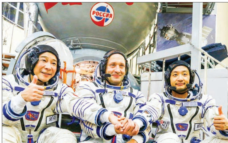
Roscosmos cosmonaut Alexander Misurkin, centre, and space flight participants Yusaku Maezawa, left, and Yozo Hirano pose for a picture during a training session ahead of the expedition to the International Space Station at the Gagarin Cosmonauts' Training Center in Star City outside Moscow, Russia, 14 October 2021.

AFTER a decade-long hiatus, Russia is relaunching an ambitious bid for dominion over the