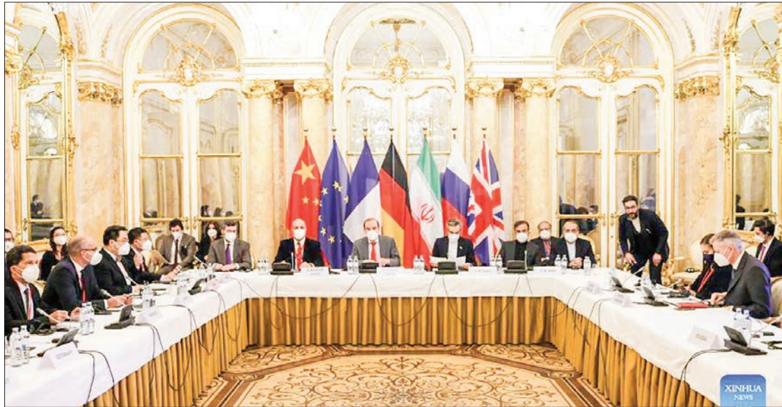
Photo taken on 17 December 2021 shows a meeting of the Joint Comprehensive Plan of Action (JCPOA) Joint Commission in Vienna, Austria.

“First, We have incorporated in our work, the new Iranian delegation. They have come to a negotiation that was ongoing before the summer ... We es-