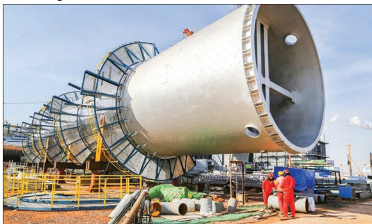
Workers carry out tasks relating to construction of a refinery project at a petrochemical industry base in Lianyungang, Jiangsu province on 27 January.

CHINA’S centrally-administered state-owned enterprises (SOEs) saw robust growth in net profits in the first 11 months of the year, said the country’s top state assets regulator on Saturday.