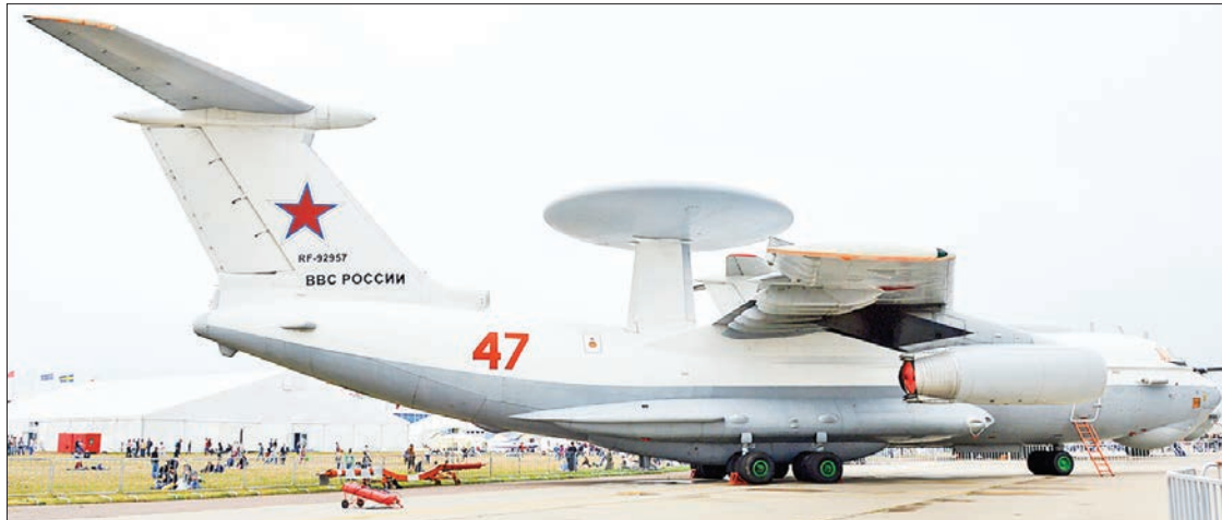
The Treaty on Open Skies establishes a program of unarmed aerial surveillance flights over the entire territory of its participants. Russian Air Force, RF-92957, Beriev A-50 Mainstay airborne early warning and control aircraft

The ministry mentioned that during Russia’s participation in the treaty, the country has conducted 646 flights, and allowed for 449 flights to be