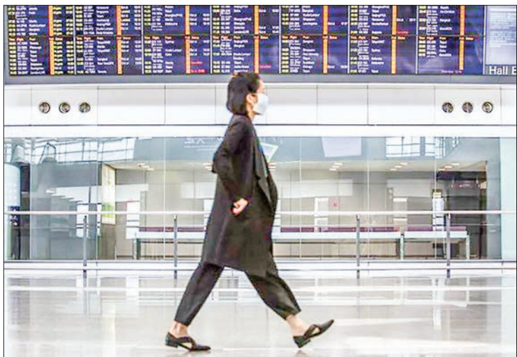
In this 11 August 2021 photo, a woman wearing a face mask walks past a flight information board at Hong Kong International Airport.

HONG Kong's strict adherence to a zero-Covid strategy is damaging the hub's aviation industry and "killing" Cathay Pacific, a major shareholder in the city's home carrier told local media.