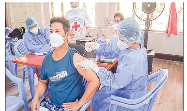
A health staff vaccinates a people in anti-COVID-19 vaccination programme.

MEDICAL doctors and nurses from public hospitals, Tatmadaw medical teams, healthcare workers and volunteers are working hard to give COVID-19 vaccines to the people in various states and regions as the vaccination programme is one of the most important activities in the prevention, control and treatment of COVID-19 disease.