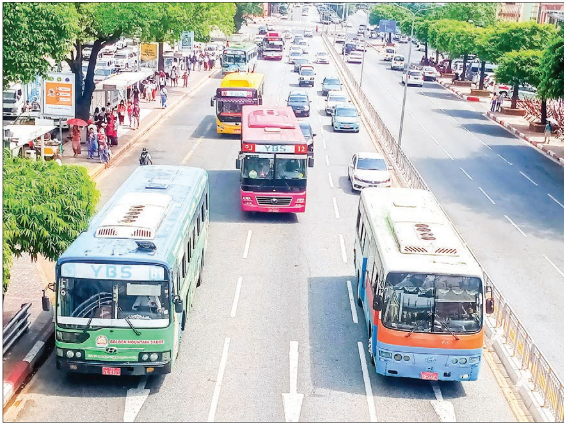
YBS buses running in Yangon.

TE Yangon Region Transport Committee (YRTC) stated it would lead a project to resume the YPS card system for YBS passengers in Yangon City.