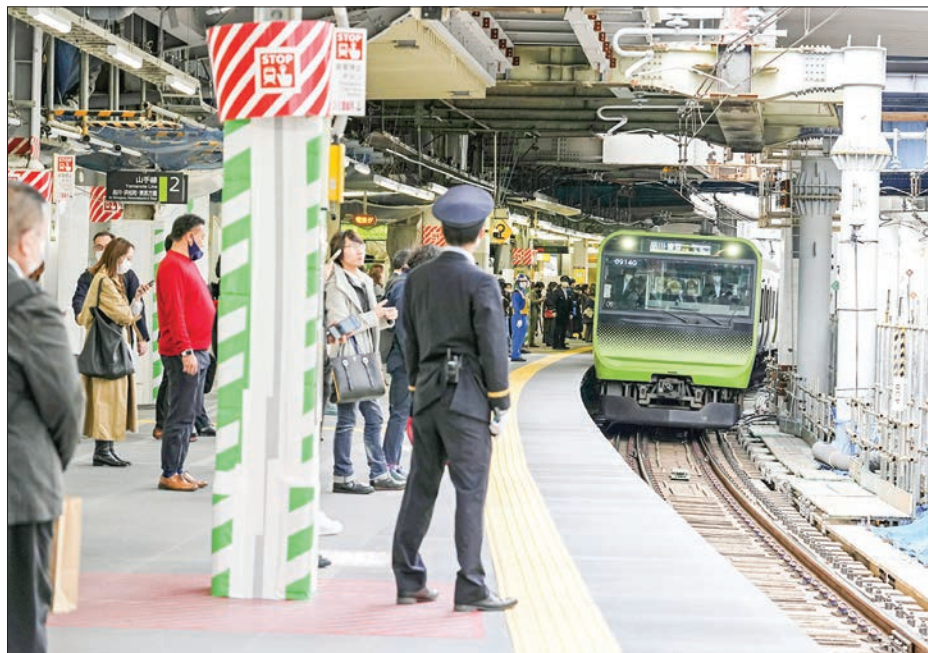
People wait on a platform as a train arrives at Shibuya Station in Tokyo on 25 October 2021.

As for its shinkansen bullet train services, JR East will reduce the num-