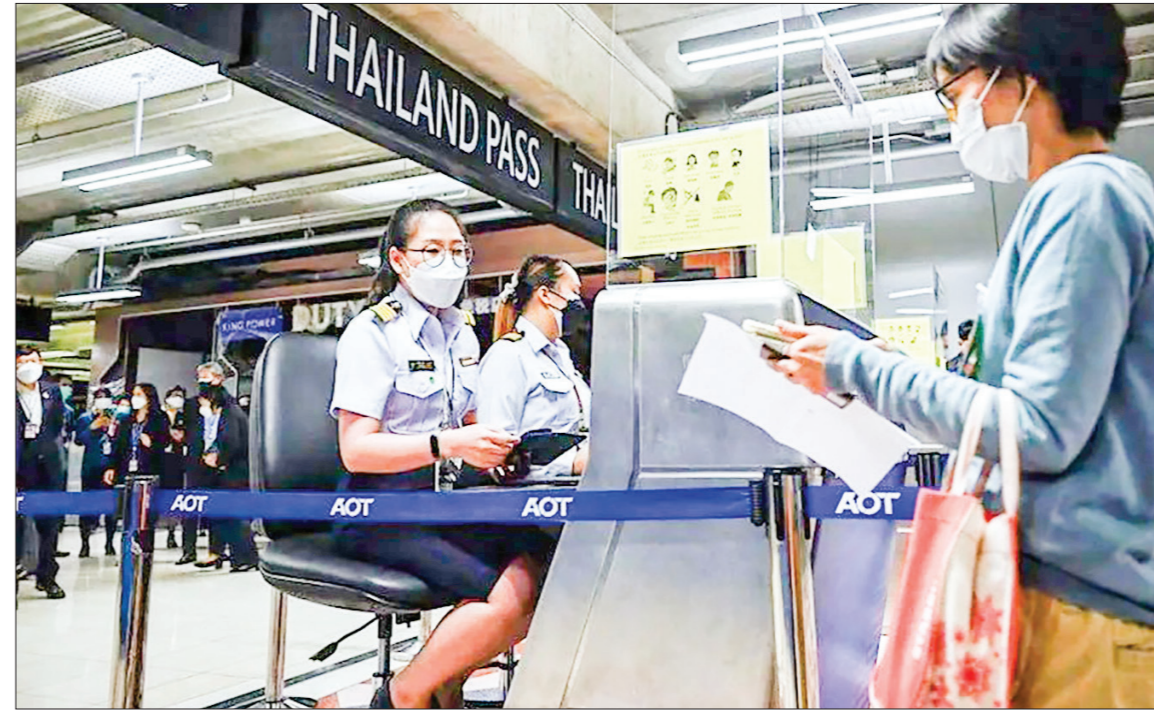
Thailand's authorities said on 27 November they are going to ban entry of people travelling from eight African countries in the wake of the new Omicron variant of the novel coronavirus.