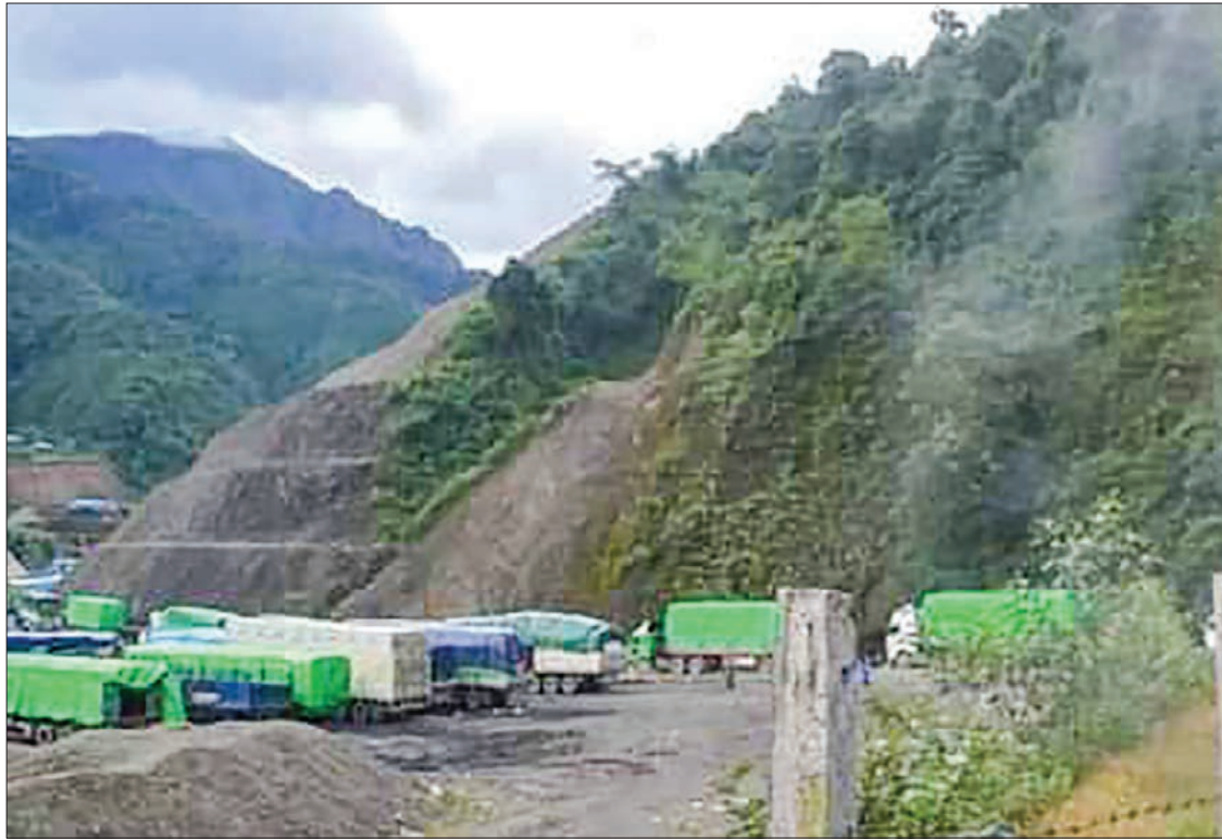
Cargo trucks carrying load of tissue banana are ready to enter China as part of border trade process.

Myanmar exporters had to seek approval first from Kachin State government and then, they exported them to China as per instruction of the state