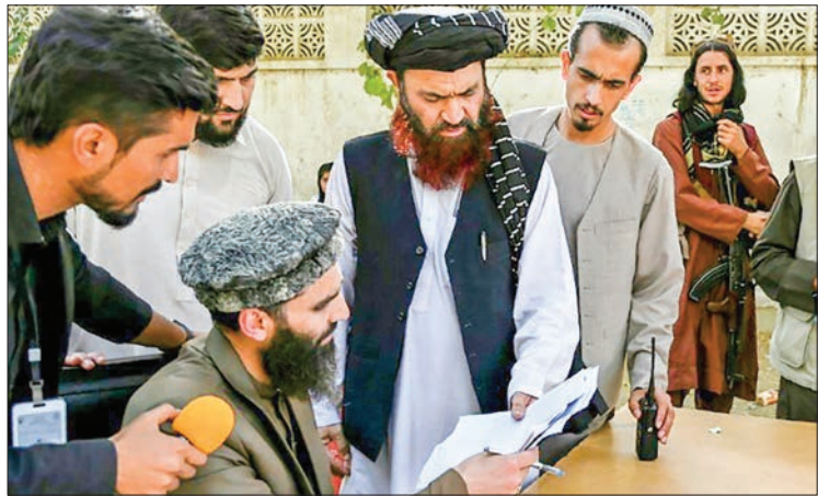
Alam Gul Haqqani (C), head of the passport office, says the Taliban will resume issuing passports after a deluge of applications caused biometric equipment to break down.

AFGHANISTAN’S Taliban authorities said Saturday they will resume issuing passports in Kabul, giving hope to citizens who feel threatened living under the Islamists’ rule.