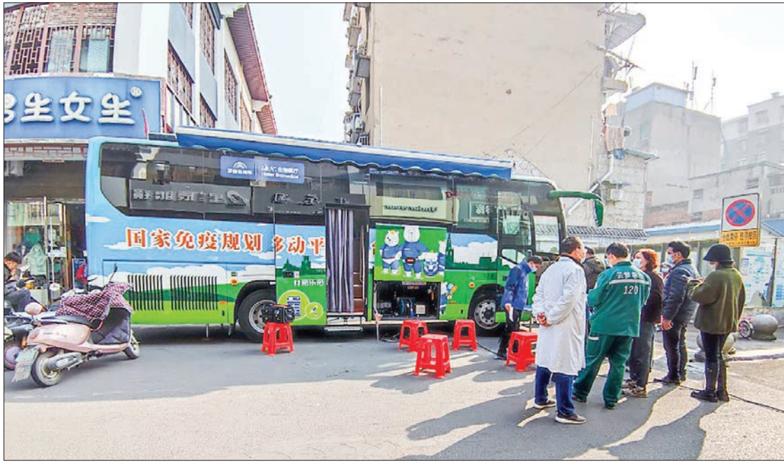
Residents wait in line to get a booster vaccine dose in front of a mobile vaccination bus in Yunmeng County, Xiaogan City, Hubei Province, 10 December 2021.