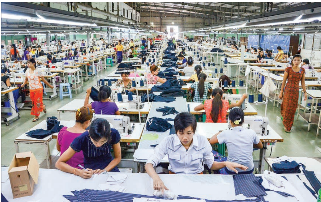
Female workers focus on production of CMP products in garment factory of manufacturing sector.

MAJORITY of foreign enterprises eye the manufacturing sector for investments, pumping the estimated capital of US$75.6 million into eight projects in the past two months of the current mini-budget period, the Directorate of Investment and Company Administration stated.