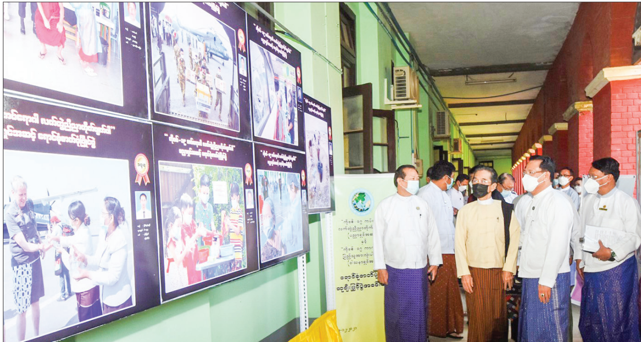
Union Minister for Information U Maung Maung Ohn views prize winning works of colour-photo contest.