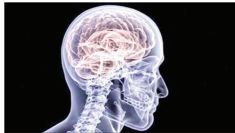
Representation Image: The immune system is made of many cell types, but the two types relevant for this University of Tokyo research project are white blood cells called CD4+ follicular helper T cells and B cells.

Scientists from Japan have discovered a fundamental part of the immune system's long-term memory, detailing how to design better vaccines for diseases, ranging from COVID-19 to malaria.