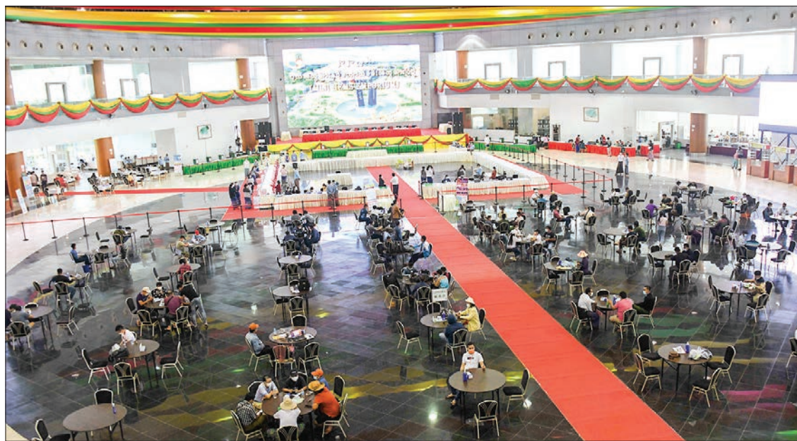
Gems merchants are attending third day of Mini Gems Emporium at Mani Yadana Jade Hall in Nay Pyi Taw

THE third day of the Mini Gems Emporium 2021 was held yesterday at the Mani Yadana Jade Hall in Nay Pyi Taw in accordance with the COVID-19 preventive guidelines.