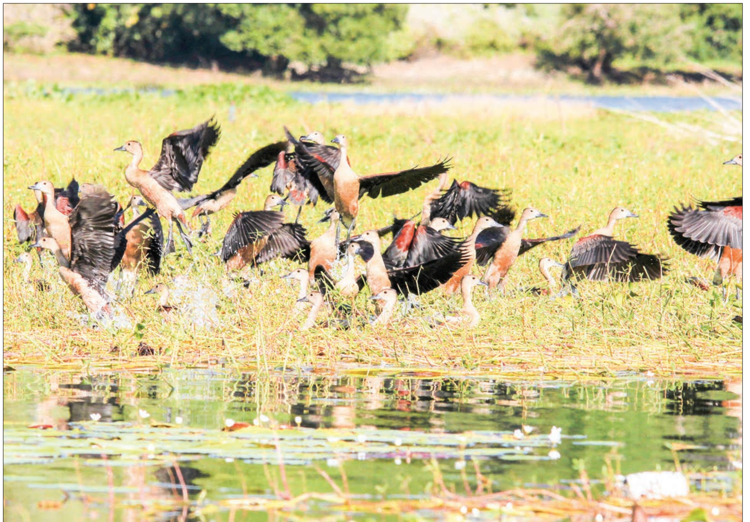
Various species of migratory birds hibernate at Indawgyi Wildlife Sanctuary in Mohnyin Township, Kachin State.