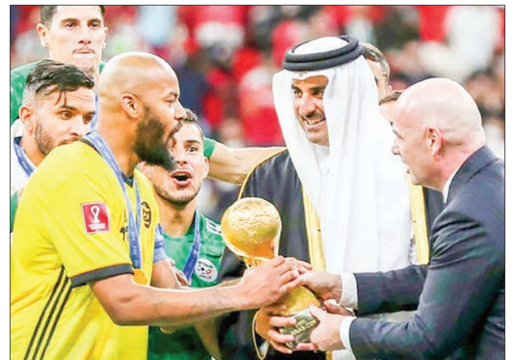
Qatar's Emir Sheikh Tamim bin Hamad al-Thani (C) and FIFA President Gianni Infantino (R) present Algeria's goalkeeper and captain Rais M'Bolhi with the the Arab Cup.

QATAR passed their first test with a successful hosting of the Arab Cup but bigger challenges lie ahead when 1.2 million fans and 32 international teams arrive for the World Cup one year from now. Algerian rejoicing at Saturday's 2-0 extra-time win over Tunisia in the final — exactly a year before the 2022 World Cup decider, and with FIFA president Gianni Infantino in the stands — will have been accompanied by satisfaction from Qatari officials.