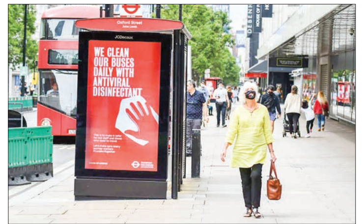
British Prime Minister Boris Johnson told Sky News Friday that Omicron is a "very serious threat" and that the country is seeing a "very serious wave coming through."

The latest data came as a study by Imperial College London showed that the risk of reinfection from Omicron is more than five times higher than Delta and shows no sign of being milder than the previous coronavirus variant. — ANI ■