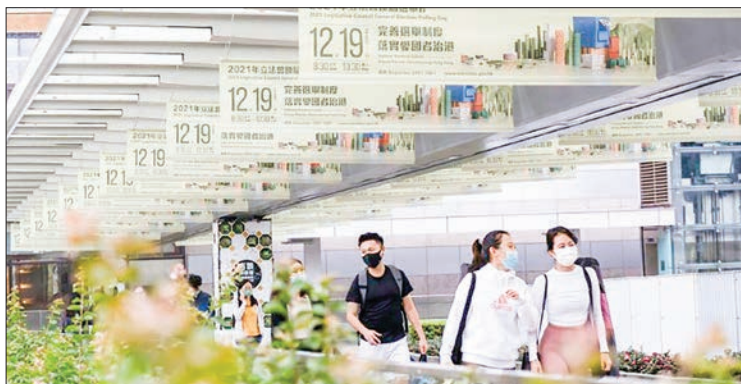
Hong Kong leader Carrie Lam and her ministers have tried to drum up public enthusiasm for the polls.

Voting centres opened at 8:30 am (0030 GMT) for some