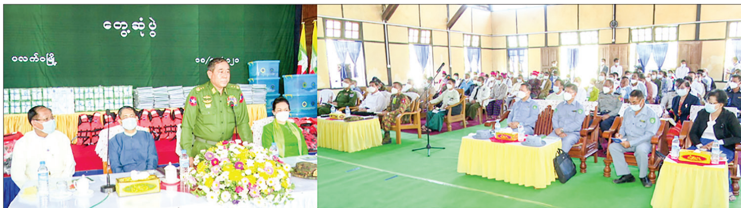
Union Minister for Border Affairs Lt-Gen Tun Tun Naung and party meet town elders, departmental personnel and people from IDP camp in Paletwa.

UNION Minister for Border Affairs Lt-Gen Tun Tun Naung, in his capacity as Chairman of Coordination Committee on the Implementation of Peace and Stability and Development in Rakhine State, accompanied by Vice-Chairman (1) Union Minister for International Cooperation U Ko Ko Hlaing and Vice-Chairperson (2) Union Minister for Social Welfare, Relief and Resettlement