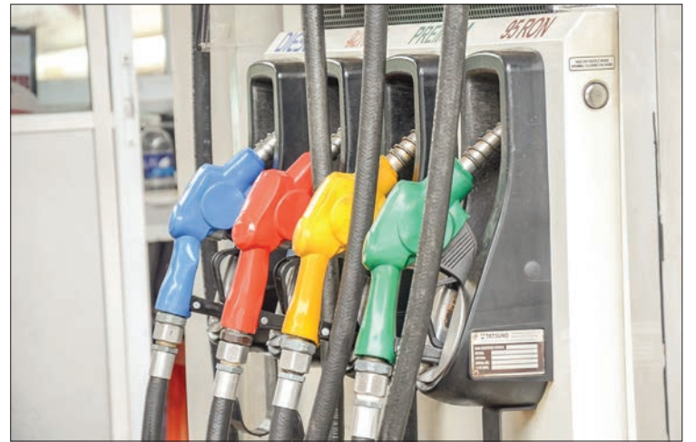
On 1 December, the prices stood at K1,250 for Octane 92, K1,300 for Octane 95, K1,230 for diesel and K1,240 for premium diesel, whereas it jumped to K1,340 for Octane 92, K1,390 for Octane 95, K1,315 for diesel and K1,325 for premium diesel.

The CBM has directly sold $53.4 million to the fuel oil sector so far. Normally, Myanmar yearly imports six million tonnes of fuel oil from external markets, the Ministry of Commerce stated. — NN/GNLM