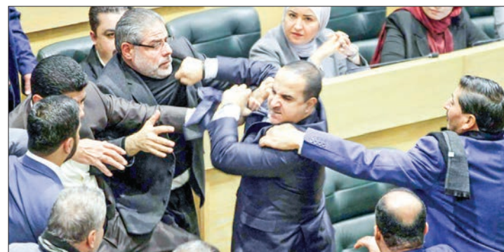
Jordanian MPs are separated during a heated row in parliament in the capital Amman.

Among other constitutional reforms to be discussed are the creation of a "National Security Council", and the halving of the house speaker's mandate to one year from the current two-year terms.—AFP ■