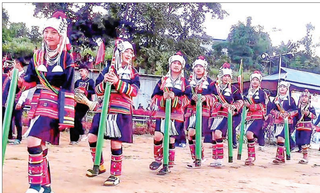
Akha damsels are performing their traditional dances.

"The Akha people, although different in their dress code, respect only the highest form of genealogy, culture, and language. All the Akha people are urged to preserve this tradition. Let the Akha people be socially and economically prosperous," the National Day message said. —Maung Maung Naing (Kengtung)/GNLM