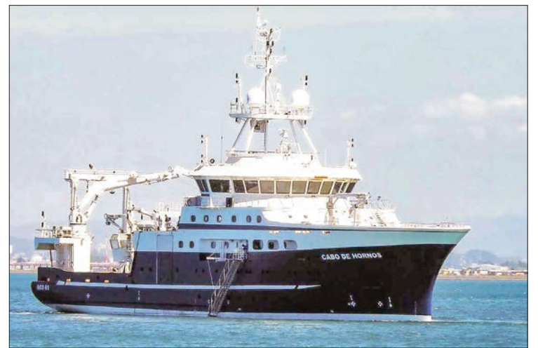
A recent expedition on board the oceanographic research vessel Cabo de Hornos in the far south of Chile sought to investigate harmful organisms and how they are impacting climate change.

Scientists believe the conditions found in the water will appear in other parts of the world in the coming decades, as the impact of climate change mounts.—AFP ■