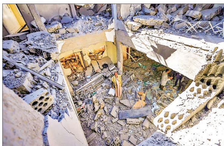
Yemen's Huthi rebels say a Saudi-led coalition air strike on Sanaa airport last week forced the halt to UN aid flights into the rebel-controlled capital.

Manila has since acquired two former US Coast Guard cutters and three landing craft from Australia, as well as coast guard patrol vessels from Japan.—AFP ■