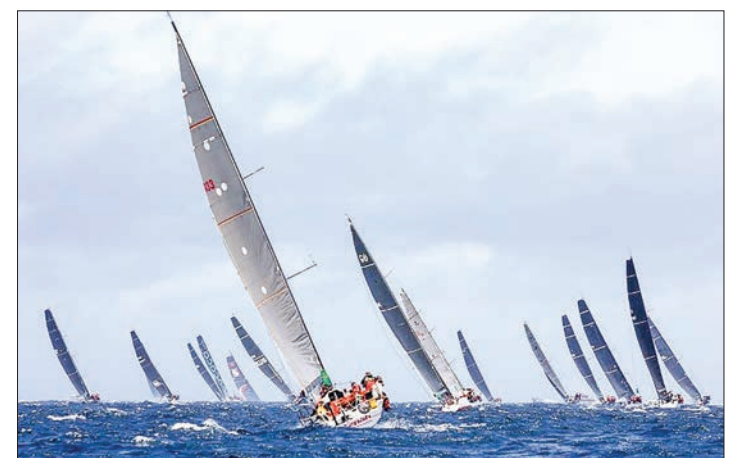
The Sydney to Hobart yacht race is one of the most challenging ocean events in the world.

Indeed Harburg had been on board when it finished second (2018), third (2017) and fifth (2019) — the latter occasion it led before being overtaken by four other boats.—AFP ■