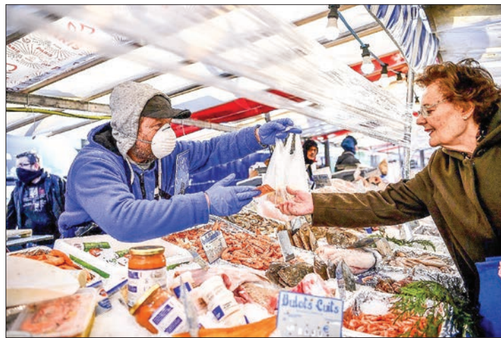
Studies show the switch to the euro did not cause the price increases that consumers have denounced.

Around 88 per cent of adults in Vietnam have been fully vaccinated, the country's health ministry said.—AFP ■