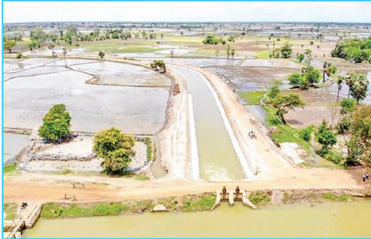
During the 2021-2022FY winter crop season, the Sagaing region has cultivated the summer paddy since October 2021 and about 887 acres of paddy have been developed so far.

SAGAING region has targeted to grow more than 300,000 acres of summer paddy, it is learnt.