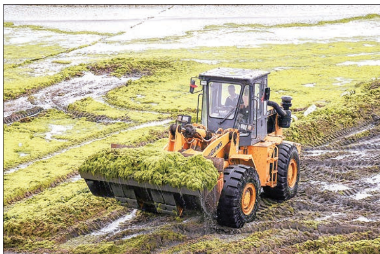
A staff worker driving a wheel loader clears algae along the beach in Qingdao, east China's Shandong Province, 17 July 2021.

Algae are primary producers of the earth's biosphere, accounting for 30 per cent to 40 per cent of all life, and playing an important role in maintaining biosphere stability. The conditions on Mars are very similar to those on early Earth, Liu said. And algae might be useful for human exploration of the red planet.—Xinhua ■