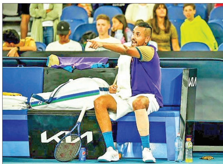
Nick Kyrgios says tennis still needs the 'Big Three'.

“I hope he's had a good Christmas and I hope he's able