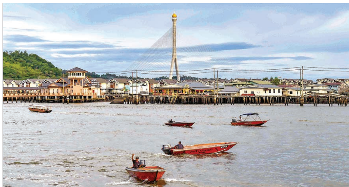
Kampong Ayer in the heart of Brunei's capital city Bandar Seri Begawan.

"With over 74,000 tourist arrivals in 2019, China has always been regarded as one of the top three source markets for Brunei. We hope to welcome