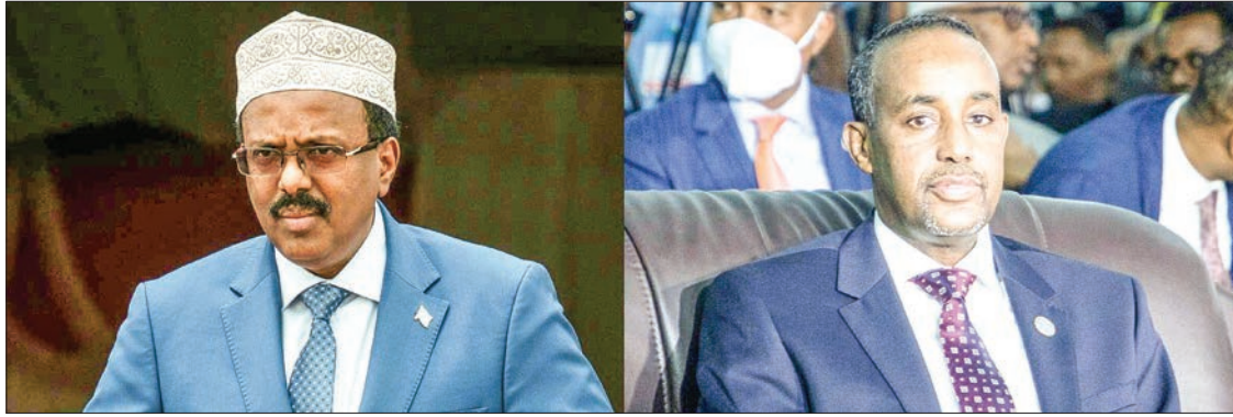
Bustup: President Mohamed Abdullahi Mohamed, left, and Prime Minister Mohamed Hussein Roble.