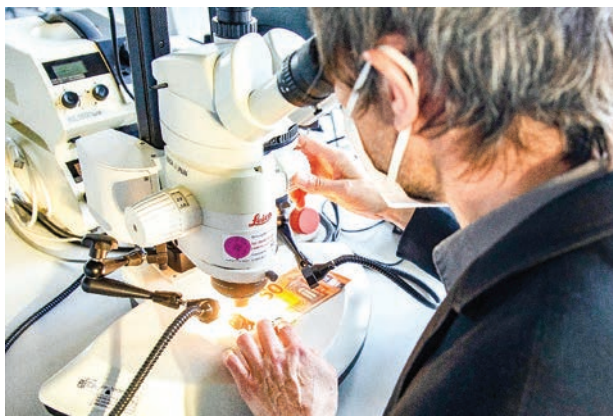
European Central Bank experts spot fake euro notes with 3D microscopes, ultra-sensitive scales and special devices.

Lined up on the workbenches are 3D microscopes, ultra-sensitive