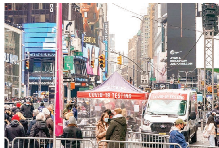
The Omicron variant of the coronavirus has fuelled surges in case numbers around the world, including the United States and Europe.

Portugal all reported record daily case numbers on Tuesday. France reported almost 180,000 infections over 24 hours.