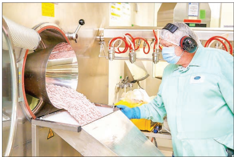
Manufacturing Pfizer's Covid treatment, Paxlovid, at a centre in Freiburg, Germany.

'PAXLOVID,' the COVID-19 oral treatment developed by a global pharmaceutical company Pfizer, received emergency use authorization from the Ministry of Food and Drug Safety (MFDS) on 27 December. It is expected to be