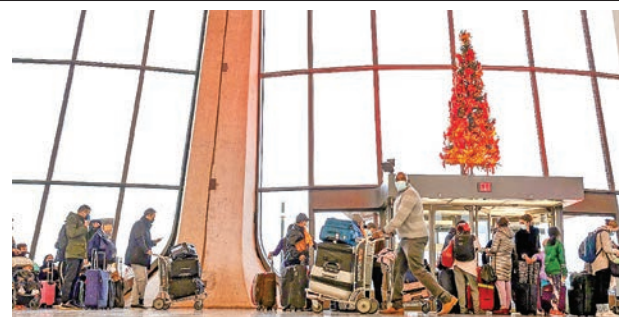
After airlines cancelled thousands of flights due to Covid-19 cases, the Biden administration moved to cut the isolation time for Covid-positive workers.

by airlines and hospitality industries, but sharply criticized by labour unions who question whether public health concerns have been short-changed.—AFP ■