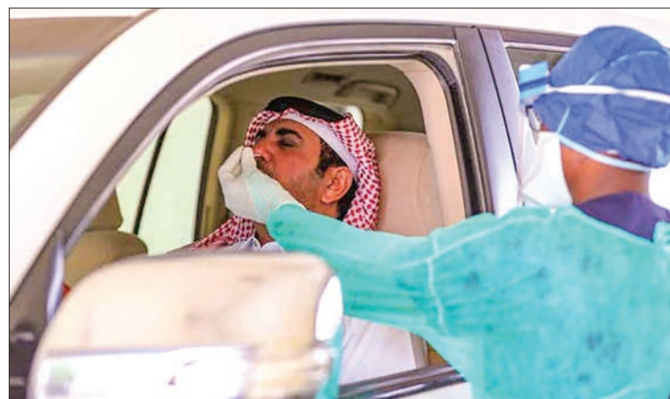
A health worker, wearing personal protective equipment, collects a swab sample from a man at a drive-thru testing service for COVID-19 coronavirus in the Qatari capital Doha.

It said staff would be compensated for working overtime, as the country gears up to host the 2022 World Cup. — AFP ■