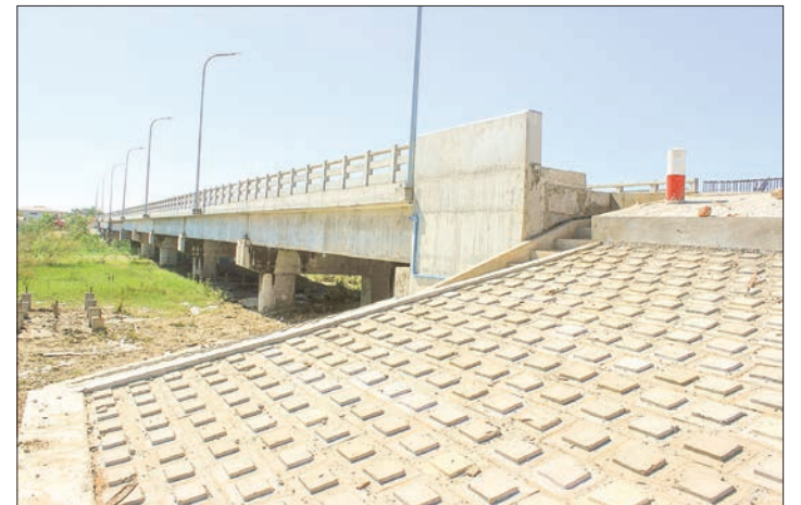
So far, the new Thakhut River Bridge has now completed 100 per cent. The bridge will be able to connect Dala, Kawhmu and Kungyan-gon townships from the Yangon District (South).

It will also greatly help the socio-economic life traveling and trade flow.