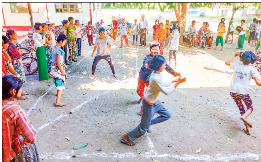
Myanmar traditional games are held to welcome the 74 th Independence Day.

The sports events were held for the purpose of training and physical fitness in order to make students appreciate independence and collaborate with one another. The winners will be awarded on the 74 th Anniversary of Independence Day, officials said.