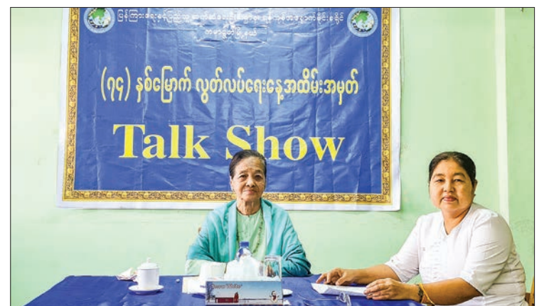
Talk Show in commemoration of the 74 th Independence Day.

The talk show was held following the rules and regulations of COVID-19 issued by the Ministry of Health. — Sein Lei (IPRD)/GNLM