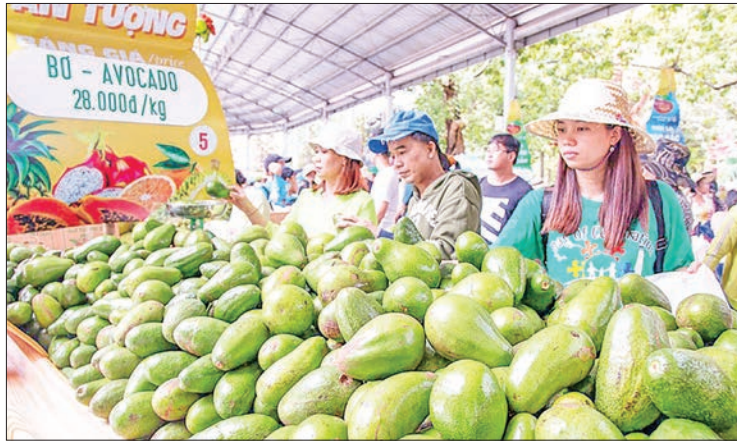
Vietnam has long been a success story among Asian economies, posting growth of seven per cent in 2019. Photo taken on 1 June 2018 shows fruits on display and sold during the 2018 Southern Fruit Festival in Ho Chi Minh City, Vietnam.

The General Statistics Office (GSO) in Hanoi said fourth quarter growth was at 5.22 per cent, but the annual figure was dragged down by a contraction