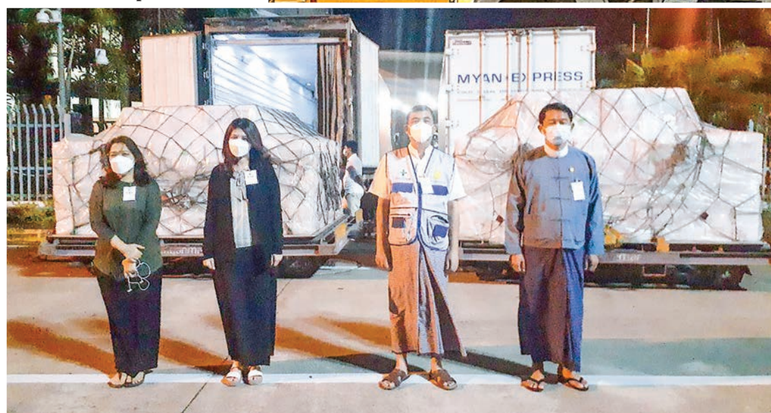
MoH officials receive the second delivery of Covishield vaccines.

population as there are about 19.15 million people over 18 who were immunized more than one time.