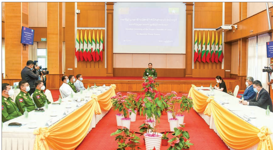
A donation ceremony in progress.

Chairman of the National Unity and Peace Restoration Coordination Committee, Chairman of the Joint Monitoring Committee on the Union-level Ceasefire (JMC-U), Union Minister at the Union Government Office (1) Lt-Gen Yar Pyae and members, Union-level Joint Monitoring Committee on Ceasefire (JMC-U) Vice-Chairman (2) U