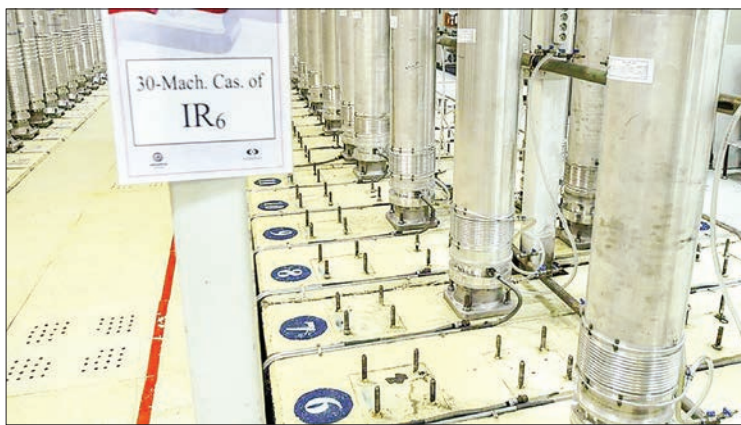
This photo released 5 November 2019, by the Atomic Energy Organization of Iran, shows centrifuge machines in the Natanz uranium enrichment facility in central Iran.

President Joe Biden supports a return to the agreement but Iran has kept taking steps away from compliance as it presses for sanctions relief.