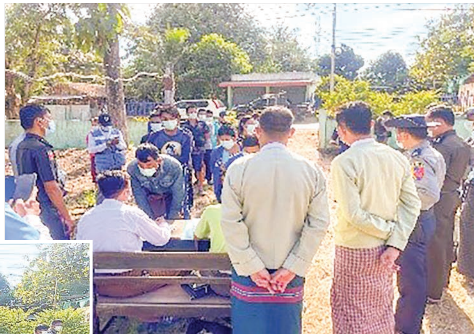
Villagers from Lay Kay Kaw and its vicinity line up for the reception process.

SECURITY forces arrested NUG and PDF terrorists in Lay Kay Kaw town of Kayin State and after that case, the armed engagement broke out between security forces and NUG and PDF terrorists, including members of KNU/KNLA, who want to break NCA, starting 15 December. The innocent residents