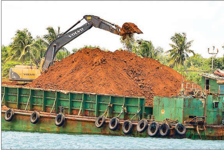
This photo taken on 16 June 2016 shows a barge being loaded with nickel ore at a private port in Infanta town, Pangasinan province, north of Manila.

THE Philippines has lifted a four-year ban on new open-pit mines, an official said Wednesday, in a bid to revitalize the country's coronavirus-battered economy slammed by activists as "short-sighted".