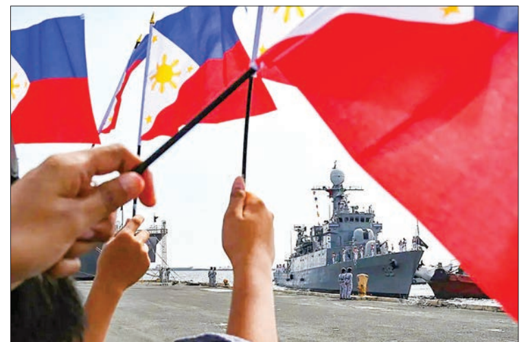
Relatives of Philippine Navy sailors wave their national flags as the navy's newly-acquired vessel, the Pohang-class corvette BRP Conrado Yap (PS39), docks at the international port in Manila on 20 August 2019.

"This project will give the Philippine Navy two modern