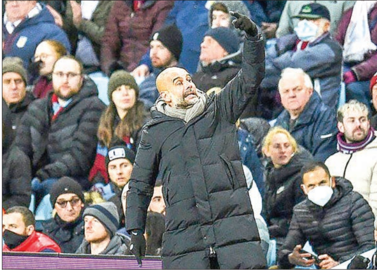
Manchester City manager Pep Guardiola.

MANCHESTER City boss Pep Guardiola says winning the Premier League would be sweeter than ever given the intense schedule faced by top-flight teams this season.