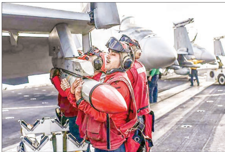
Crew members of US aircraft carrier USS Harry S Truman lift a missile into place on the wing of an F18 Hornet fighter jet on the flight deck of the ship in the eastern Mediterranean Sea in 2018.

President Joe Biden's administration has insisted on working in lockstep with European allies, with NATO representatives also slated to meet with Russia.