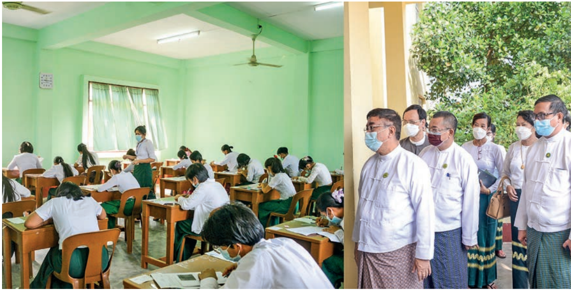
The MoE Union Minister and party inspects one of the matriculation exam room in Nay Pyi Taw yesterday.

UNION Minister for Education Dr Nyunt Pe, together with Deputy Ministers Dr Zaw Myint and U Zaw Win, Permanent Secretary Dr Soe Win, and Director-General of the Department of Basic Education U Kyaw Swa Thwin visited the Matriculation Examination Centre at No (6) Basic Education High School (Nay Pyi Taw) yesterday. They inspected students sitting the first-day Matriculation Examination in Myanmar Subject.