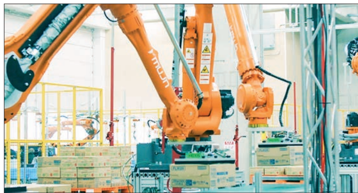
Japan employs over a quarter of a million industrial robot workers.

JAPAN’S industrial output edged slightly higher in February from a month earlier, inching up 0.1 per cent to mark the first rise in three months, the government said in a report on Thursday. According to the Ministry of Economy, Trade and Industry (METI), production at factories and mines stood at 95.8 against the 2015 base of 100, on a seasonally adjusted basis, following an upwardly revised 0.8 per cent decline in January.