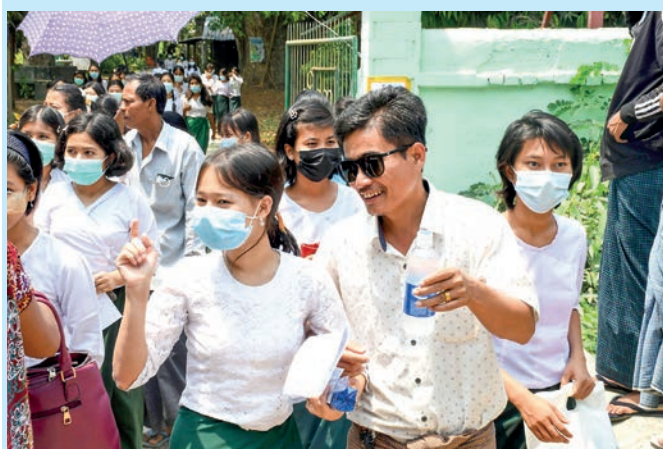
Sittway Township, Rakhine State.