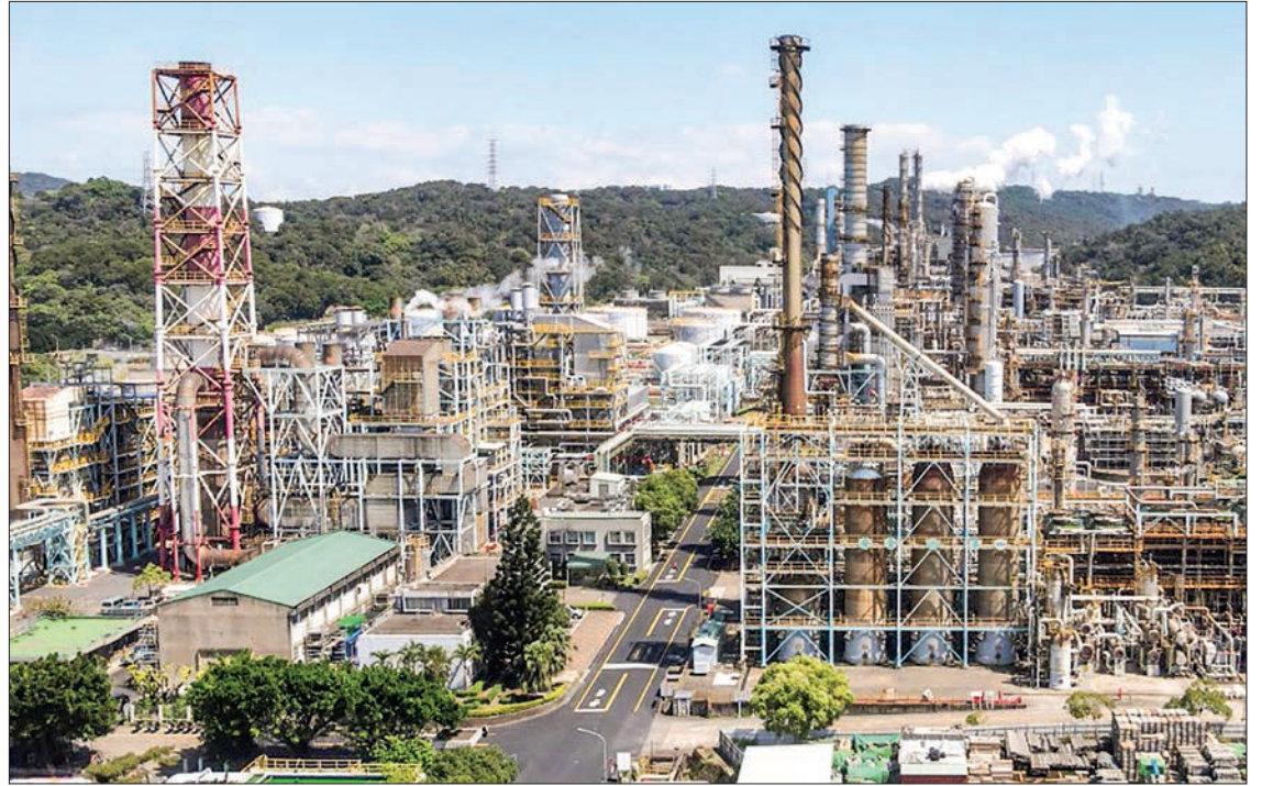
The Indo-Pacific region has become the world’s hotbed of economic activity and integration.

The Biden administration has vowed to launch the Indo-Pacific Economic Framework early this year, which it defines as a “new partnership” that will promote high-stand-