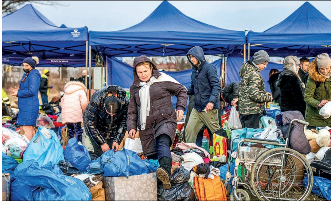
Poland has become by far the largest recipient of refugees. Volunteers provide help for Ukrainian refugees as they arrive with buses from the Medyka pedestrian border crossing, in Przemsyl, eastern Poland on 26 February 2022.

JAPAN is considering either postponing the justice minister's trip to Poland from Friday or sending a substitute as a special envoy ahead of accepting more Ukrainian refugees following the Russian invasion, the government said Thursday.