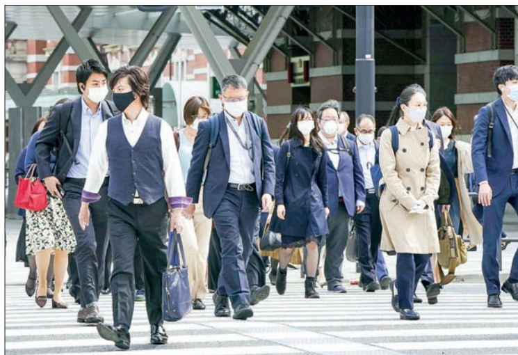
Japan's unemployment rate slipped to 2.7 per cent in February as would-be new job seekers opted to stay in their existing jobs owing to uncertainty caused by a resurgence in COVID-19 infections.

The job availability ratio equates to there being 121 available jobs for every 100 people seeking them. — ANI ■