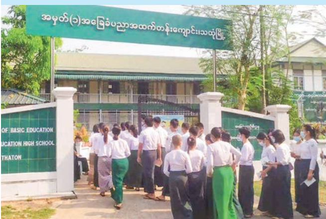
Thaton Township, Mon State.