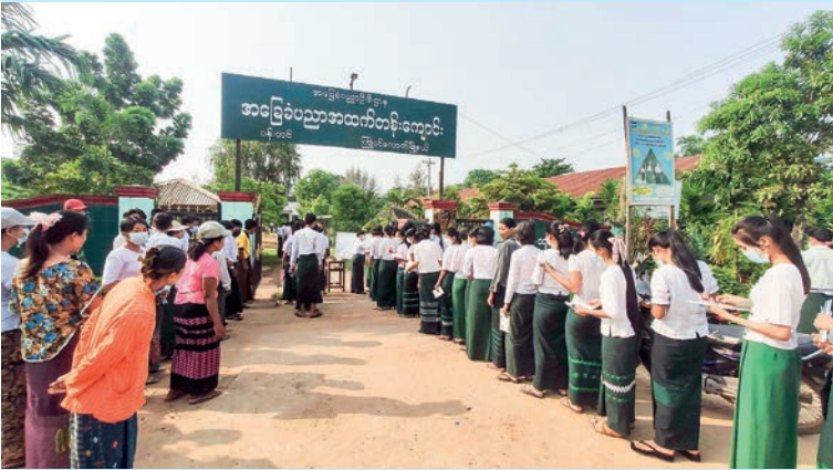
Gyobingauk Township, Bago Region.