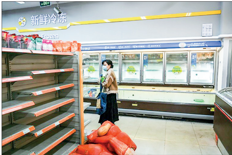
Shoppers among empty shelves in a supermarket before lockdown in Shanghai.

The measures concerning tax rebates target businesses with operating fund shortages.