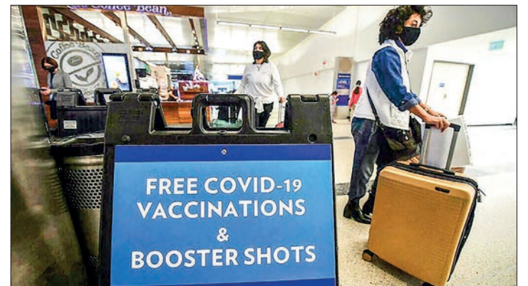
United States health officials have given the green light for Pfizer's COVID-19 booster shot to be administered to children as young as 12.

THE United States on Tuesday authorized a fourth dose of either the Pfizer-BioNTech or Moderna COVID-19 vaccines for people 50 and older, as authorities warn of a possible new wave driven by the BA.2 variant.