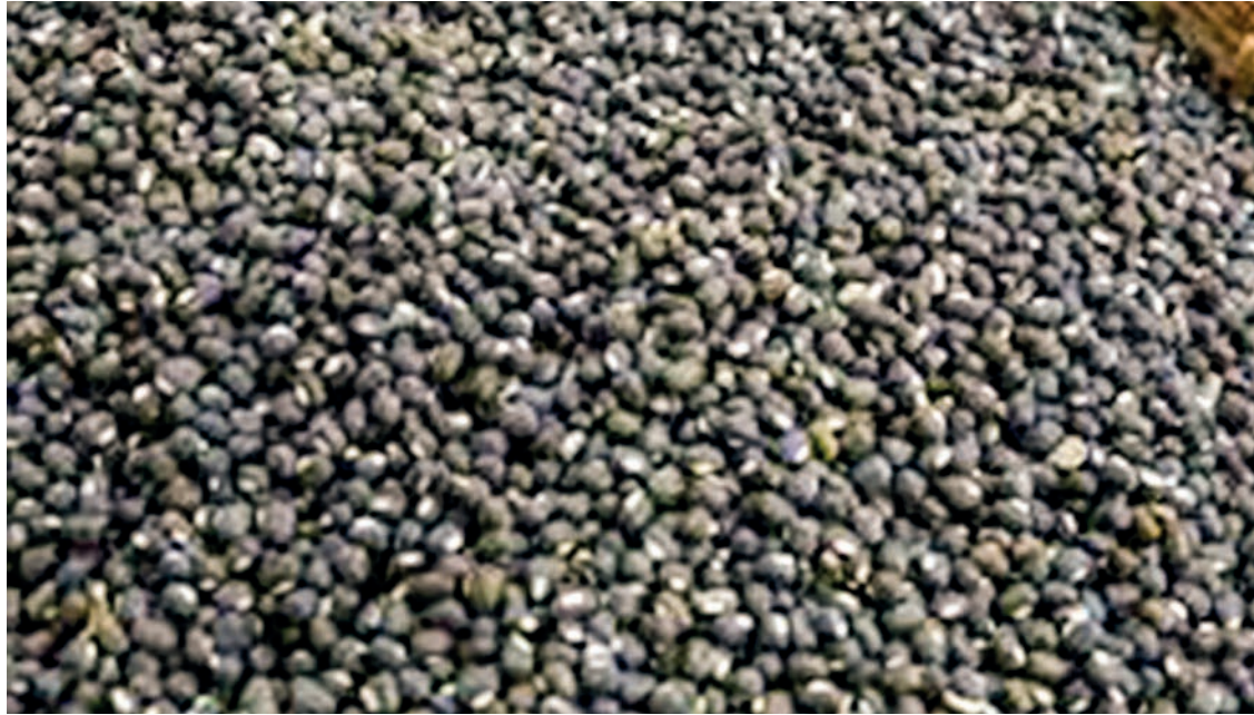
Earlier, the import deadline for black gram and pigeon peas with the relaxation of conditions is to expire on 31 March 2022.

Next, the price of black gram is estimated at around K50,000 per basket depending on the local currency value against the US dollar exchange rate and gold price. A drastic drop of these