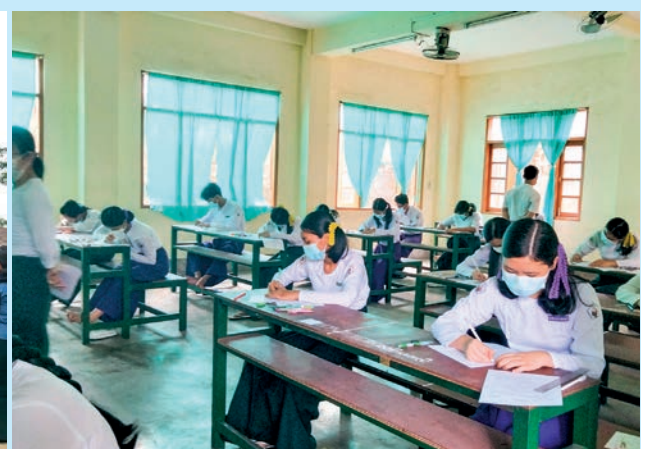
Mawlamyine Township, Mon State.