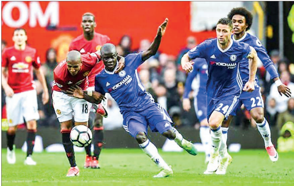
Manchester United's English midfielder Ashley Young (L) vies with Chelsea's French midfielder N'Golo Kante (R) during the English Premier League football match between Manchester United and Chelsea at Old Trafford.

LIVERPOOL and Manchester United will meet in a high-profile friendly in Bangkok in July, the clubs said on Thursday, as Premier League teams resume lucrative pre-season tours which stopped when Covid hit.