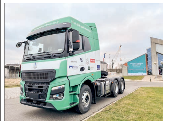
The world's first M100 heavy truck fueled by e-methanol started trial runs in Port of Aalborg, northwest of Denmark on 28 March 2022.

The team at Sky Mavis, maker of battle and trading game Axie Infinity, discovered the security breach on Tuesday after a user was unable to withdraw ether, according to the company.—AFP ■