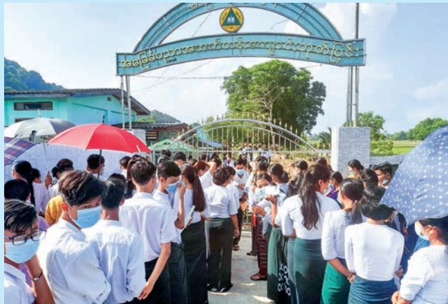
Bokpyin Township, Taininthyai Region.