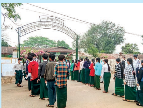
Hsenwi Township, Shan State (North).