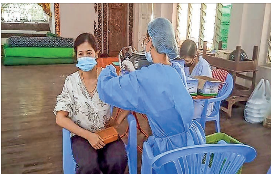
A woman gets jabbed against COVID-19.

DOCTORS and nurses from public hospitals, Tatmadaw medical teams, healthcare workers and volunteers are working hard to give COVID-19 vaccines in different states and regions as the vaccination programme is one of the most important activities in the prevention, control and treatment of COVID-19 disease.