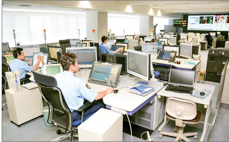
Police officers in Kanagawa Prefecture, near Tokyo, use predictive policing, a method of anticipating the occurrence of crimes and accidents using artificial intelligence, as the first force in Japan to do so.

It is the first time the police agency will be directly involved in investigating crimes, although the affiliated Imperial Guard