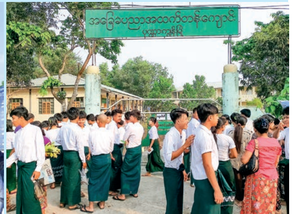
Ponnagyun Township, Rakhine State.