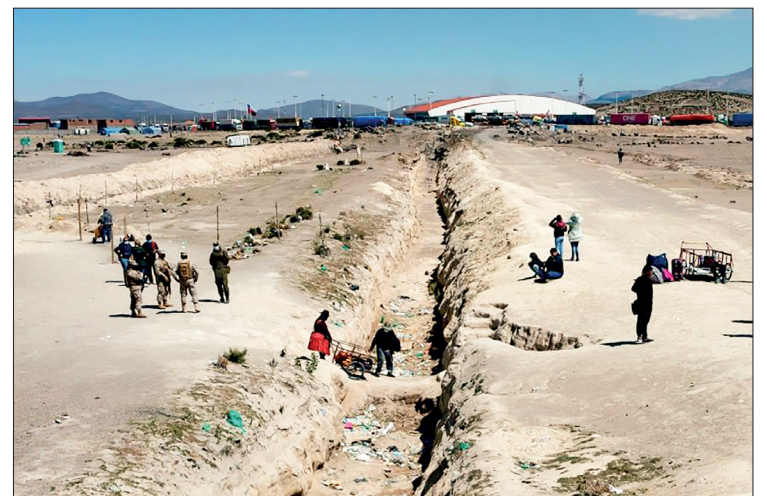
Migrants cross the the border trench near Pisiga from Bolivia into Chile.

The trench, at around one and a half meters wide, has been guarded by Chilean soldiers