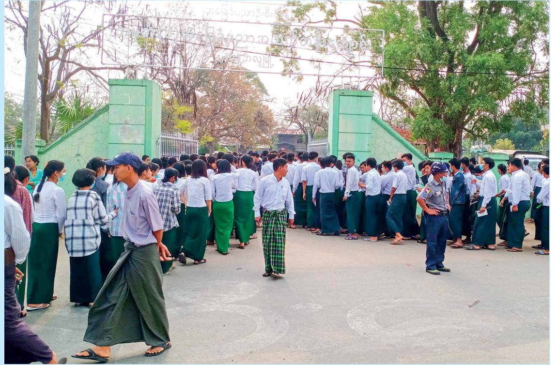
Kanbalu Township, Sagaing Region.

local exam centres. A total of 281,741 students out of 312,424 students registered to take the first day of the exam took the Myanmar language exam, accounting for 90.18 per cent, according to the Ministry of Education. —MNA