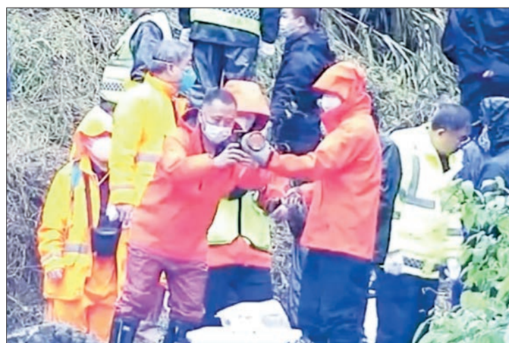
Both flight recorders, or black boxes, of the China Eastern Airlines passenger plane that crashed in south China on 21 March are being decoded.

BOTH flight recorders, or black boxes, of the China Eastern Airlines passenger plane that crashed in south China on 21 March are being decoded, an aviation official said Thursday.