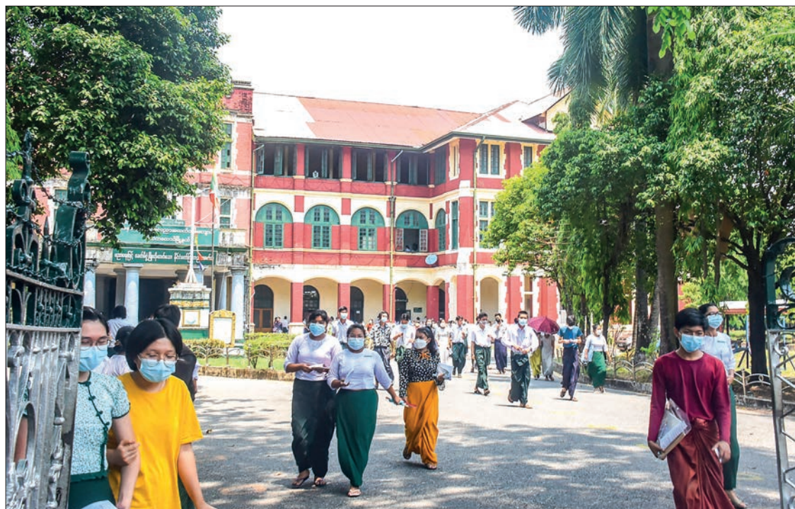
Students are seen joyfully coming out after sitting for the first day of Matriculation Exam yesterday.

Similarly, the students sat the exam at two exam centres in Putao Township of Kachin State and the respective high schools in Kayah State, Taninthayi Region, Magway Region, Yangon Region, Shan State (South) and Ayeyawady Region, in addition