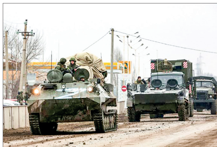
Russian army military vehicles are seen in Armyansk, Crimea, on 25 February 2022.

Motuzanyk suggested that Russian forces may renew