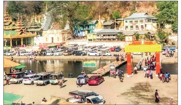
Mann Shwesettaw Pagoda.

“Over 1,000 pilgrims enter the Mann Shwesettaw Pagoda Festival in a day although they are allowed to enter after checking their vaccinated certificates,”