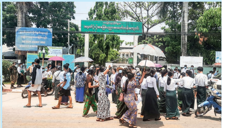
Myawady Township, Kayin State.