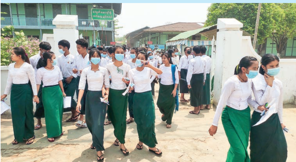
Kyaukdaga Township, Bago Region.