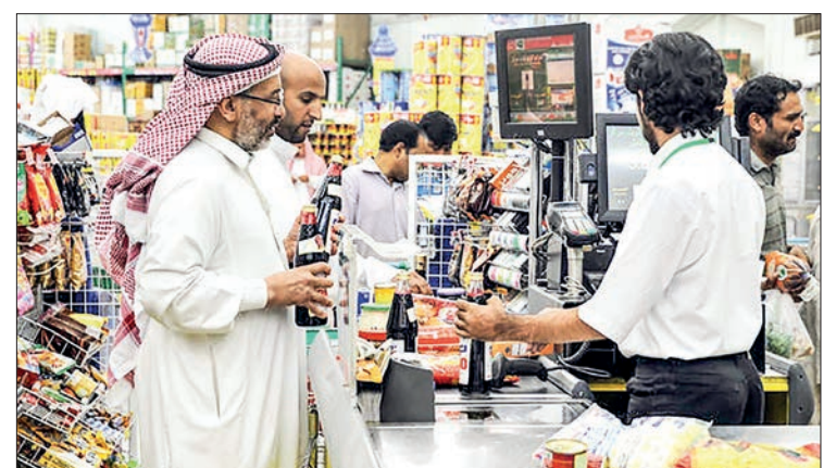
Investments of more than 936 million U.S. dollars will facilitate the access of international companies into the Saudi Arabian markets.

The GEC, which opened on 27 March, attracted entrepreneurs from more than 180 countries and hosted over 145 sessions with the participation of 293 speakers.—Xinhua ■