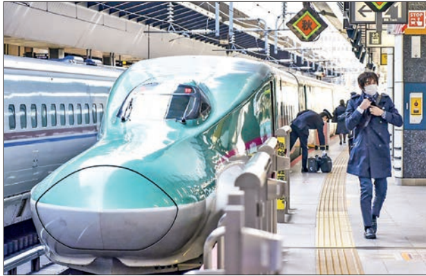
East Japan Railway Co. will effectively raise ticket prices of shinkansen bullet trains during the high season, and Kyushu Railway Co. will lift the prices of some coupon tickets for the bullet trains.

JAPANESE consumers are expected to face more challenges amid the ongoing coronavirus pandemic, as a wave of price hikes will hit essential items such as food and daily goods in the new fiscal year beginning