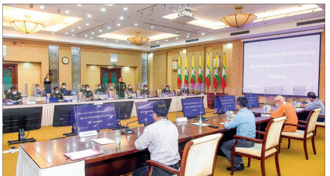
The National Solidarity and Peacemaking Negotiate Committee meets the Shan State Progressive Party-SSPP representatives at the National Reconciliation and Peace Centre in Nay Pyi Taw yesterday.

current situations of ethnic armed groups in Shan State,