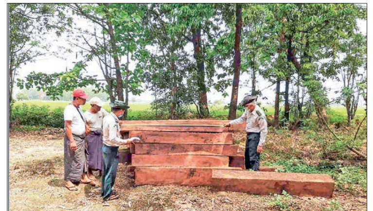
Officials confiscate illegal timbers.

A combined inspection team under the management of the Sagaing Region Anti-Illegal Trade Task Force carried out inspections and seized foodstuffs and utensils (estimated at K5,688,000)