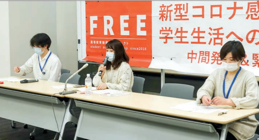
The survey also showed the number of foreign students enrolling at universities, Japanese language schools and other educational institutions in Japan. Members of a university student group advocating free tuition at Japanese colleges hold a press conference in Tokyo on 22 April 2020, to call for a cut in tuition for students losing revenues from part-time working amid the coronavirus pandemic.