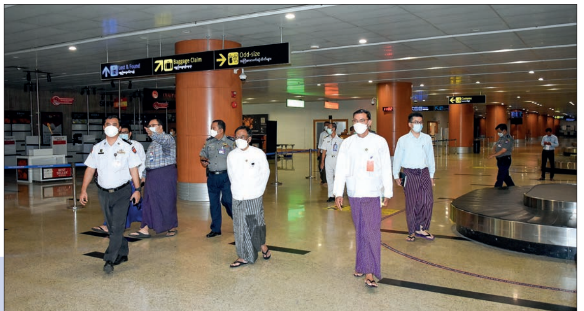
The MoHT Union Minister views inside the Yangon International Airport.

Afterwards, the Union Minister cordially met responsible persons from the immigration counter, the Customs Department, and the Department of Public Health at the airport and urged them to work together to facilitate international tourists' arrival. — MNA