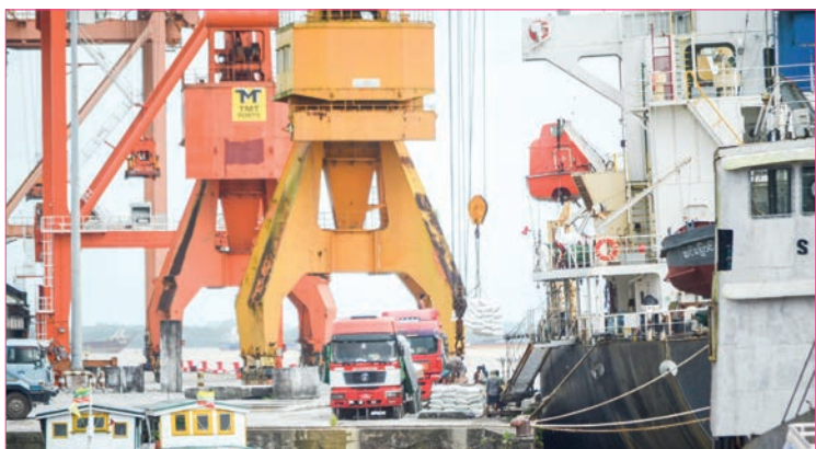
The photo catches a scene of Yangon port.

About 80 per cent of mineral products are shipped to external markets through sea trade, while 20 of them are sent to neighbouring countries through border trade channels.—KK/GNLM