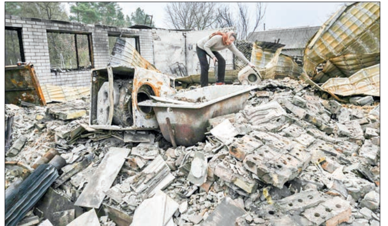
A woman examines the debris of her destroyed house in the Ukrainian village of Rusaniv, just east of Kyiv, on Saturday.

Smoke rose from the Darnytsky district in the southeast of the capital after what Moscow said were "high-precision long-range" strikes on an armaments plant, killing one person and wounding