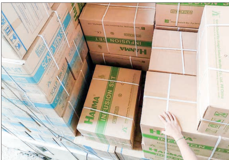
Cartons of masks are kept aboard the truck at Chinshwehaw trade post on 17 April.

It is reported that the Ministry of Commerce is coordinating with relevant departments and treatment of COVID-19 as well as contact persons for inquires can be reached through the Ministry's Website—www.commerce.gov.mm. — MNA