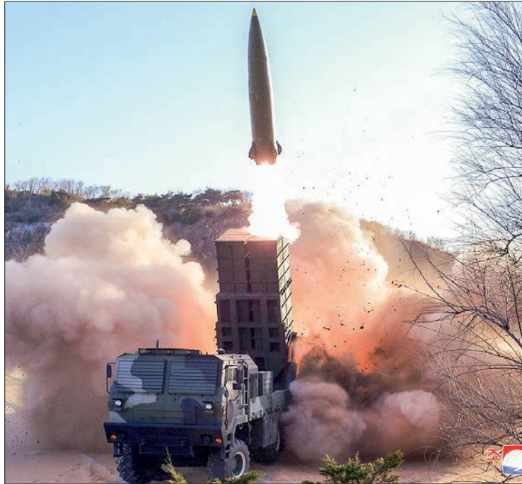
Undated photo shows North Korea’s test-firing of a “new-type tactical guided weapon.”

On Friday, North Korea marked the 110 th anniversary of the birth of its founder Kim