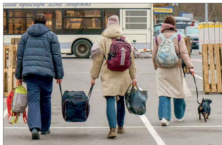
The Red Cross said it hoped to lead an evacuation of thousands of civilians from Mariupol on 1 April 2022.

THE entire urban area of Mariupol city in eastern Ukraine has been fully cleared of the Ukrainian Armed Forces and foreign