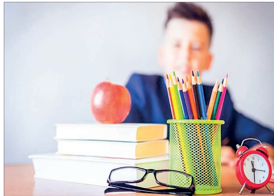
The findings of a recent study suggest that those who went to a private school in England were no happier with their lives in their early 20s than their state-educated peers.

The findings surprised the researchers who point out that private schools, which educate