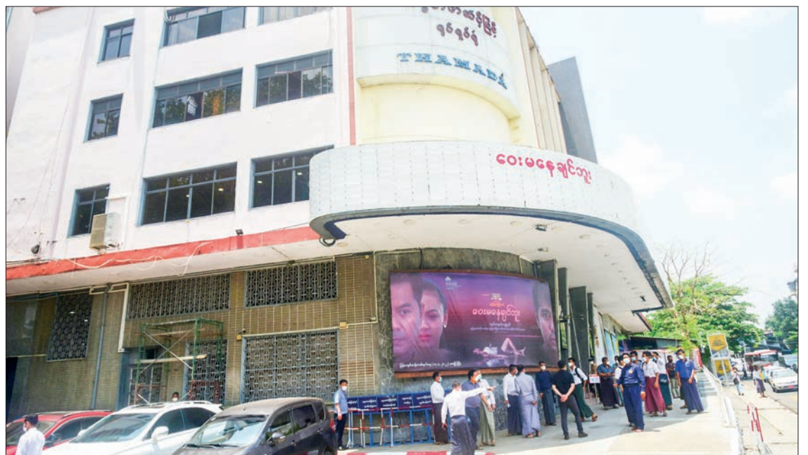
The billboard on new film to be presented is seen at Thamada Cinema in Yangon on 17 April.

On the first day of the Myanmar New Year yesterday, 48