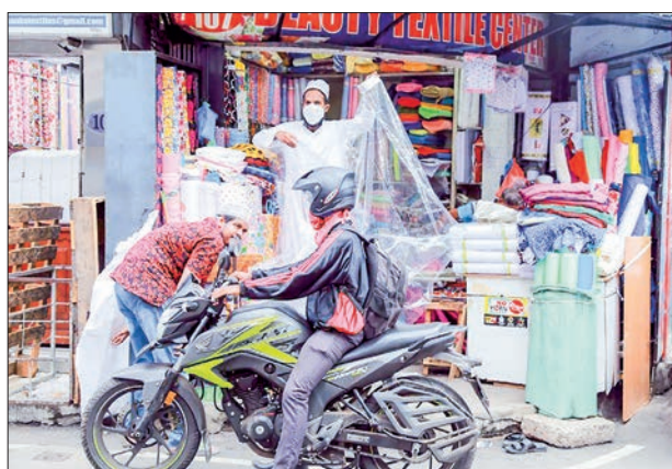
Traders work at a business hub in Colombo, Sri Lanka, on 11 May 2020.

The CSE has been adversely affected by the economic woes in the South Asian country and the index has fallen 26 percent by the end of March compared to the end of 2021. — Xinhua