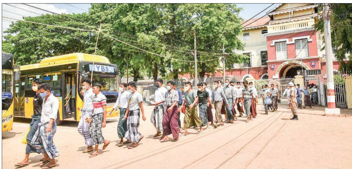
Already-released prisoners leave Insein Central Jail on 17 April.