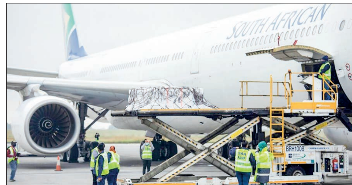
Workers unload a shipment of the Johnson & Johnson COVID-19 vaccine from an airplane at O. R. Tambo International Airport in Johannesburg, South Africa, 27 February 2021.

COVID-19 cases in Africa have fallen for the past 16 weeks, and deaths have dropped during the last eight, marking the longest-running decline in infections on the continent since the start of the pandemic, the World Health Organization (WHO) said on Thursday. Infections have plummeted from over 308,000 cases weekly at the start of the year to