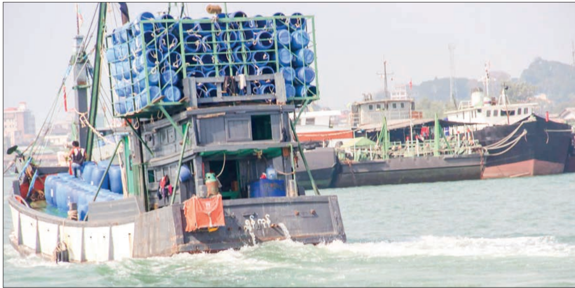
Trawlers are seen with necessary fishing facilities at the port of Kawthoung.

Between 1 October 2021 and 31 March 2022 in the mini-budget period, fishery exports valued over $160 million were delivered from Kawthoung of Myanmar under the FOB sys-