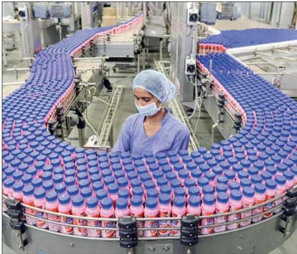
A worker at a bottle factory near Ahmedabad, India.

“India, as a major economic power and the world’s largest democracy, is a highly valued strategic partner for the UK in these uncertain times,” said Johnson. Trade and security partnerships will top the agenda in the PM Modi-Johnson bilateral talks.