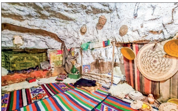
The interior of a ‘damous’, a dwelling carved into Libya’s arid Nafusa mountains, in Gharyan town, southwest of the capital Tripoli.