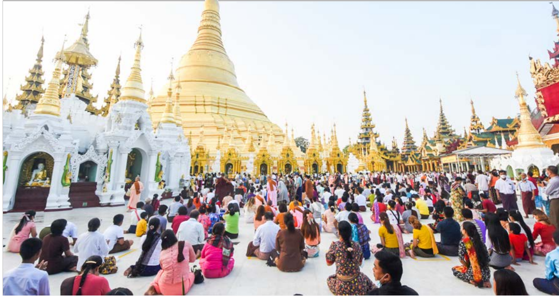
Pilgrims are seen at Paritta recitation ceremony on platform of Shwedagon Pagoda on 17 April.