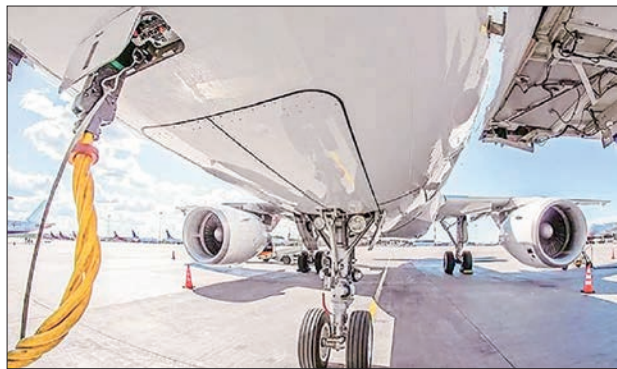
The price of aviation turbine fuel (ATF) or jet fuel in India was hiked by a marginal 0.2 percent to an all-time high on Saturday.

Saturday's ATF price hike marked the eighth straight increase this year, reflecting a global energy price surge. Earlier, the ATF price saw a steepest