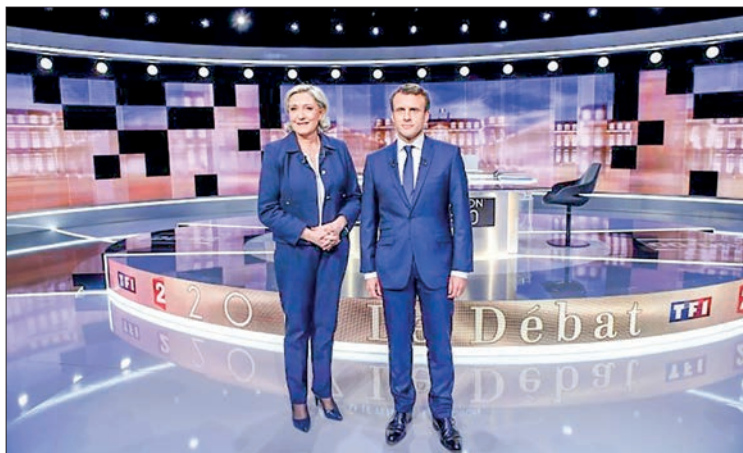
Le Pen and Macron will trade blows from 1900 GMT Wednesday in a clash set to be watched by millions of French nationwide ahead of the April 24 run-off election.

The two were neck-and-neck in the polls but the patrician Mitterrand’s attempts to lecture his reform-minded opponent on wealth redistribution backfired. “It’s a matter of heart not just intelligence,” Mitterrand argued, to which Giscard retorted: “You don’t have a monopoly on the heart, Mr. Mitterrand.” — AFP