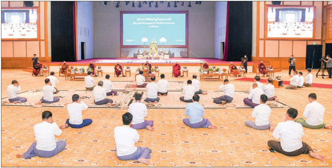
State Administration Council holds Paritta recitation to mark Myanmar New Year Day on 17 April.

THE State Administration Council held a ceremony to listen to the Paritta recitation on the occasion of the Myanmar New Year yesterday morning in Nay Pyi Taw.