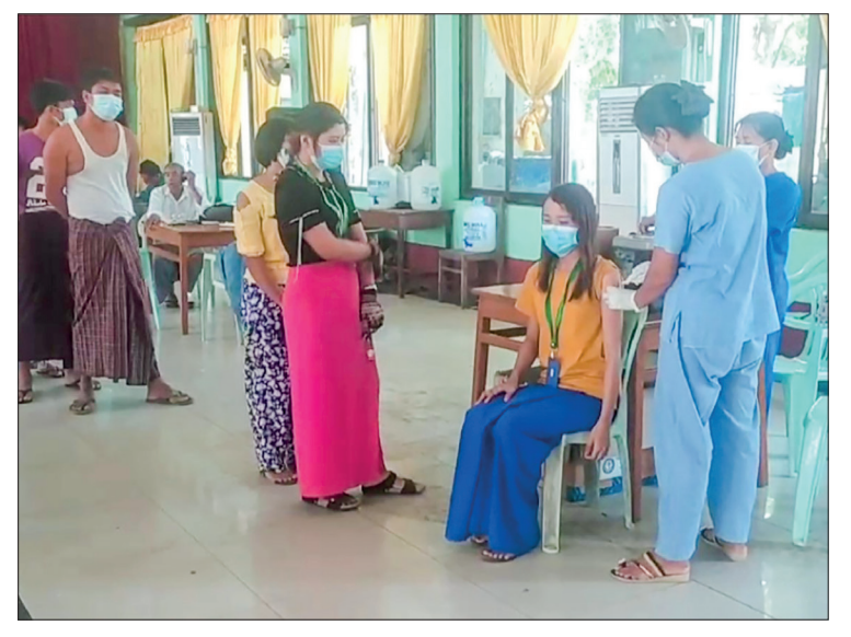
Locals get vaccinated against COVID-19 in Bago Township in Bago

Yesterday, doctors and nurses from People's hospitals, medical teams from the Tatmadaw, relevant healthcare workers in collaboration with volunteers gave COVID-19 vaccines to 8,273 people from