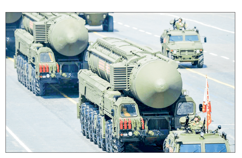
A few years ago Russian President Vladimir Putin had boasted of developing a number of "invincible" weapons that can surpass existing system.

RUSSIA'S test of a new nuclear-capable intercontinental ballistic missile is not seen as threatening to the US and its allies, the Pentagon said Wednesday.