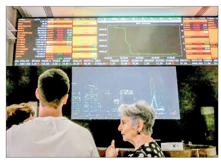
A woman points to a screen at a stock market in Sao Paulo, Brazil, 12 March 2020.

At the same time, 54 per cent of those surveyed said their financial situation was "very affected" by the pandemic, up from 45 per cent in November of last year. According to the Brazilian Institute of Geography and Statistics, the official inflation index rose to 11.30 per cent in the 12 months ending in March. The survey showed 87 per cent of Brazilians believe that prices for goods have "increased a lot" in the past six months, and