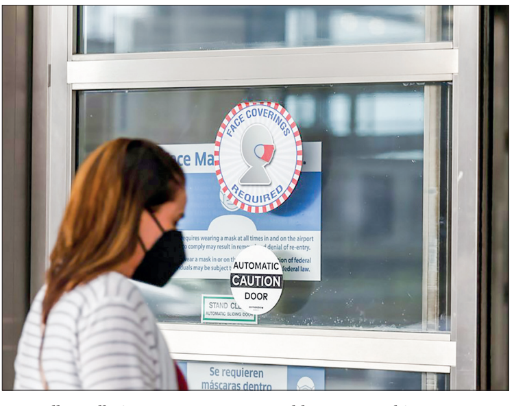
A traveller walks into an entrance at Ronald Reagan Washington National Airport in Arlington, Virginia, the United States, 14 April

The United States is now averaging about 35,000 new infections daily, up 19 per cent from the previous week and 42 per cent from two weeks prior, CDC data show.— Xinhua