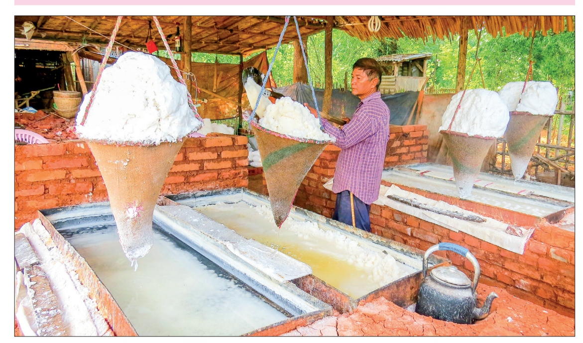
The torrential rain in March 2022 damaged the salt yard, resulting in the price rise of K320 per viss (a viss equals 1.6 kilogrammes).

SALT prices are expected to remain high in the coming months, according to salt farmers.