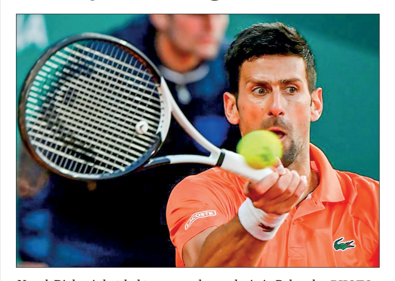
Novak Djokovic battled to a second-round win in Belgrade.

NOVAK Djokovic battled back from a set and a break down to beat Laslo Djere in his opening match of the ATP event in Belgrade on Wednesday, avoiding a third consecutive defeat.