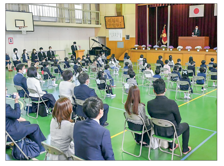
An enrollment ceremony is held for new students at an elementary school in Nagoya, central Japan, on April 6, 2022.

Record figures were seen for all grade levels, with 43.1 per cent of fourth- to sixth-graders expressing a lack of motivation to study and 58.6 per cent of junior high school students having the same view. Among senior high schoolers, 61.3 per cent said they are not eager to learn.—Kyodo