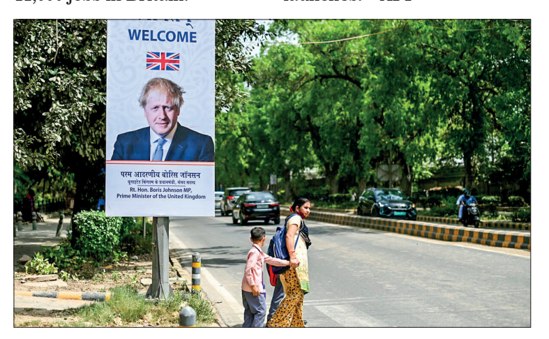
Britain's Prime Minister Boris Johnson visits Gujarat on Thursday and New Delhi on Friday.

Downing Street said the visit would yield new partnerships on defence, artificial intelligence and green energy, along with investment deals in areas including robotics, electric vehicles and satellite launches.—AFP