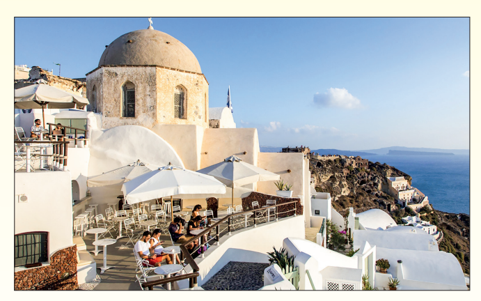
An outdoor restaurant in Santorini Island in Greece.

GREECE aims to "coexist" with Covid-19, its health minister said Wednesday as the country prepared to further relax restrictions to boost its key tourism industry.