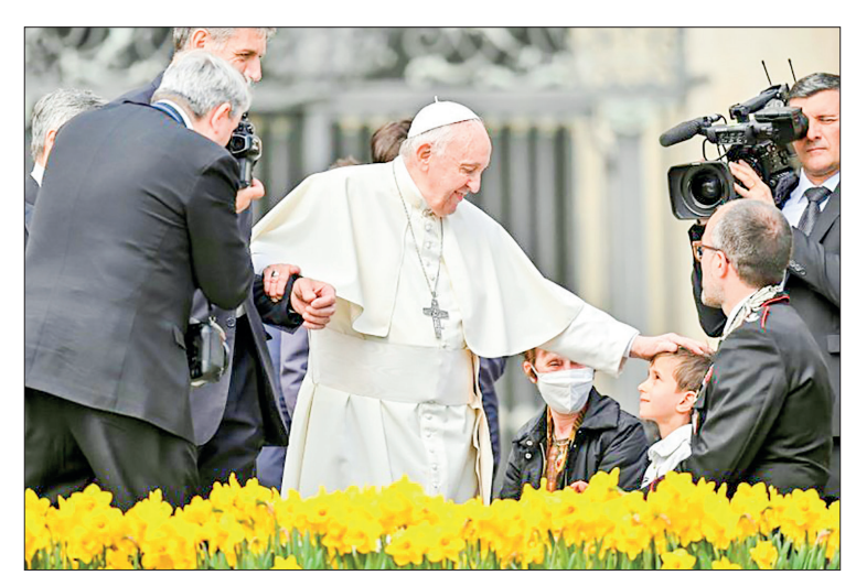
The 85-year-old pontiff was met with cries of "Long live the pope" as he arrived in his white popemobile into the square still decorated with 40,000 flowers.

THOUSANDS of pilgrims from around the world gathered at the Vatican Wednesday as Pope Francis held his first weekly audience in St Peter's Square since coronavirus hit in early 2020.