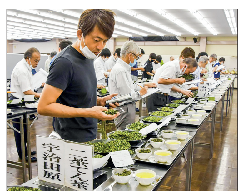
Photo taken in July 2021 shows buyers selecting tencha tea leaves, the raw ingredient for making matcha, at the Japan Agriculture Cooperatives' tea market auction site in Joyo, Kyoto Prefecture.

JAPAN posted a goods trade deficit of 5.4 trillion yen ($42.4 billion) in fiscal 2021 after logging a surplus the previous year, amid increased energy imports inflated by high prices, the Finance Ministry said Wednesday.