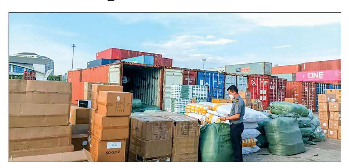
Seized commodities at the Myanmar Industrial Port

gal Trade Steering Committee, action is being taken under the law against illicit trades.