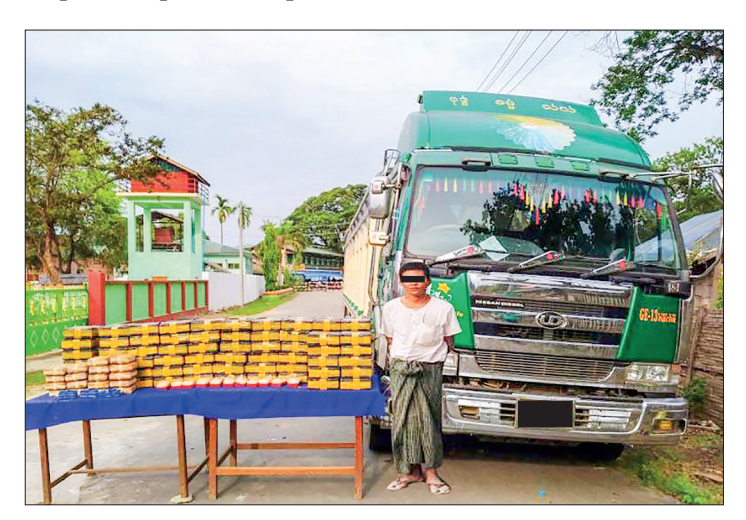
An arrestee is pictured along with seized drugs and vehicle.

According to the inspection, these drugs are heading to Kachin State from Mandalay Region, and the police are investigating to arrest further suspects. The action is taken against the detained person under the Narcotic Drugs and Psychotropic Substance Law.