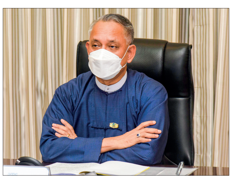
MIFER Union Minister U Aung Naing Oo.

He highlighted that today's press statement would be used after 12:15 pm Myanmar standard time. Generally, the energy and economic sectors are interrelated, and some development can be seen in Myanmar. The prices of oil and natural gas trig-