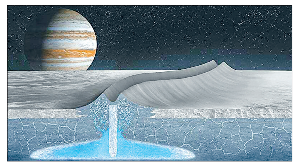
An artist's rendering, provided by Stanford University, shows how double ridges on the surface of Jupiter's moon Europa may form over shallow, refreezing water pockets within an ice shell.

RIDGES that criss-cross the icy surface of Jupiter's moon Europa indicate there are shallow pockets of water beneath, boosting hopes in the search for extra-terrestrial life, scientists said Tuesday.