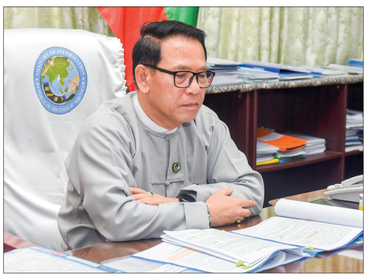
MoI Union Minister U Maung Maung Ohn.

UNION Ministers U Maung Maung Ohn and U Aung Naing Oo virtually replied to queries raised by reporters from AP, Reuters, the South China Morning Post and Straits Times, China Central Television (CCTV), People's Daily and Xinhua news agencies at the respective halls of the Union Minister's offices yesterday morning.