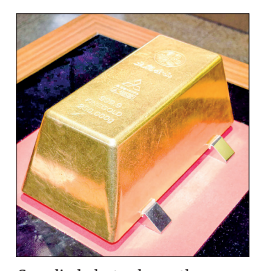
Supplied photo shows the world's largest gold bar, which is displayed at the Toi Gold Mine theme park in Izu, Shizuoka Prefecture.

As of Wednesday, 1 gramme of gold was worth 8,969 yen including tax, according to gold bar manufacturer Tanaka Kikinzoku Kogyo K.K. Gold is generally seen as