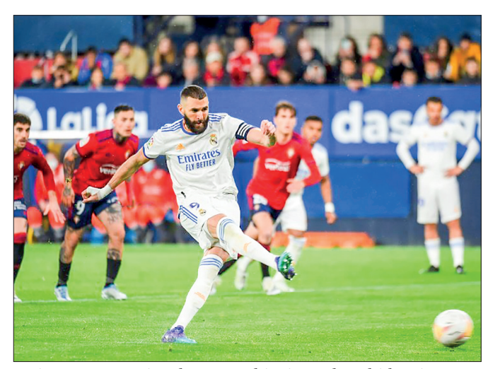
Karim Benzema missed two penalties in Real Madrid's win over Osasuna on Wednesday.

KARIM Benzema missed two penalties in seven minutes on Wednesday but Real Madrid still had enough to defeat Osasuna 3-1 as they continued their march towards the La Liga title.