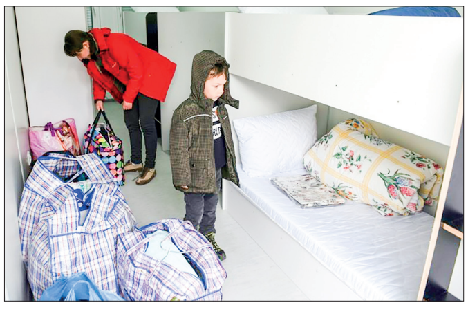
Evacuees arrive at a village of prefabricated houses set up in the western Ukrainian city of Lviv.

NORTH Atlantic Treaty Organization (NATO) member countries are doing everything to prolong the armed conflict in Ukraine, Russian Foreign Ministry spokesperson Maria Zakharova said Wednesday.