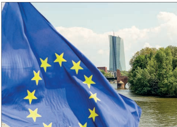
The headquarter of the European Central Bank (ECB) is pictured with a European flag in Frankfurt am Main, western Germany, on 8 May 2022.

THE global surge in inflation has brought to an end a long period of low interest rates and forced central banks around the world to try to bring prices under control by raising