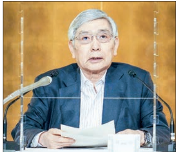
Bank of Japan Governor Haruhiko Kuroda delivers a speech in Tokyo on 6 June 2022.

MONETARY tightening is not a “suitable” measure at all for the Bank of Japan as the domestic economy is still in the midst of a recovery from the COVID-19 pandemic while higher commodity prices are adding downward pressure, Governor Haruhiko Kuroda said Monday.