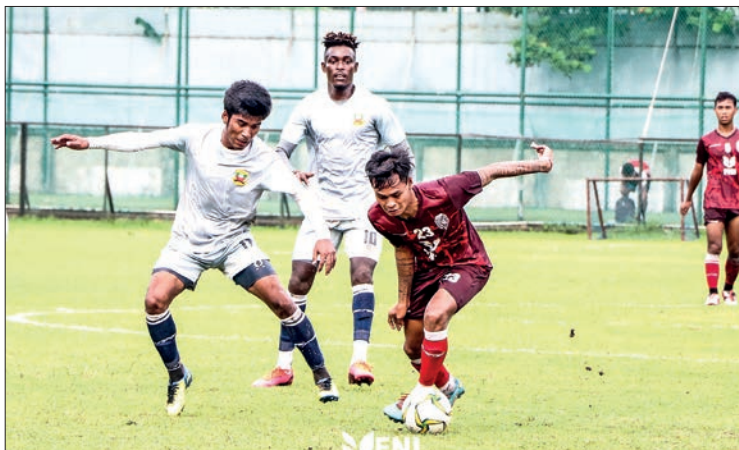
Yangon United player (red) tries to pass over the Shan United players (white) during their friendly match at Yangon United stadium on 4 June 2022.

YANGON United played a friendly match against Shan United at Yangon United Sports Complex on 4 June and the match was ended with a goalless result.