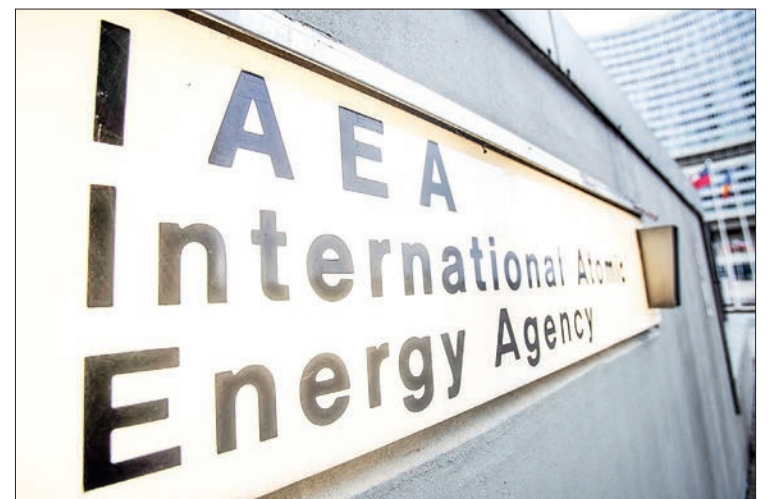
The sign of the International Atomic Energy Agency (IAEA) is pictured in front of the headquarters, photographed in Vienna on 17 December 2021.

MAJOR European countries and the United States are expected to seek to censure Iran as the UN atomic watchdog started meeting on Monday amid stalled talks to revive the 2015 nuclear deal.