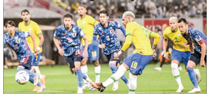
Neymar (10) of Brazil scores a goal from a penalty kick in the second half of an international friendly against Japan held at the National Stadium in Tokyo on 6 June 2022, as a warm-up for the World Cup finals that begin in November in Qatar.

JAPAN went down 1-0 against Brazil in an international friendly Monday after Neymar scored a 77 th -minute penalty for the dominant South Americans. Japan, 23 rd in the FIFA rankings, had hung on until Wataru Endo was penalized for bringing down substitute Richarlison at a rainy National Stadium in Tokyo, with Neymar sending keeper Shuichi Gonda the wrong way.