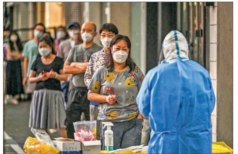
A health worker prepares to take swab samples in front of a residential area under a Covid-19 lockdown in the Huangpu district of Shanghai on 4 June 2022.

Shanghai has creaked back to life in recent days, as commuters have begun to return to