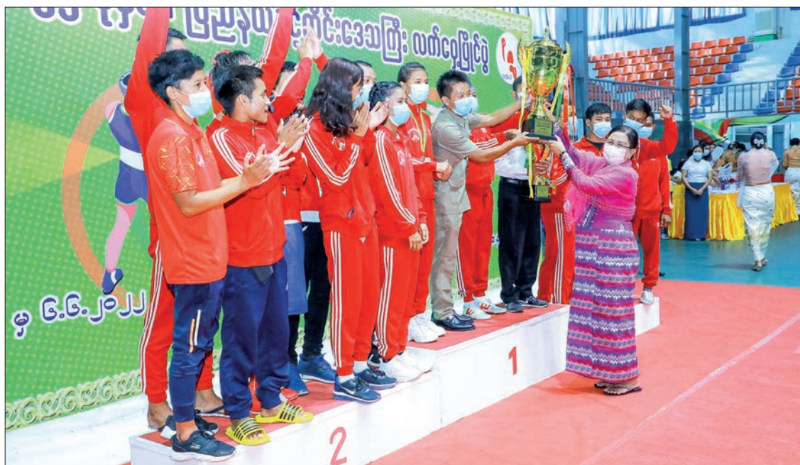
The SAC member presents the championship cup at the event.