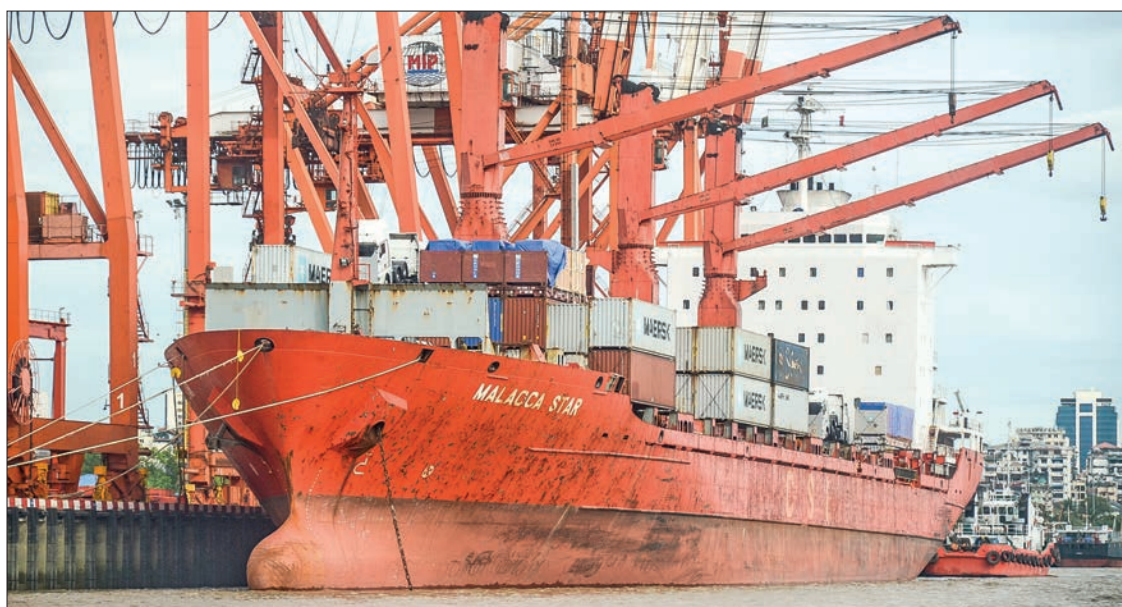
One of the container vessels at Yangon Port.

Terminals in Yangon Port received over 250 cargo ships