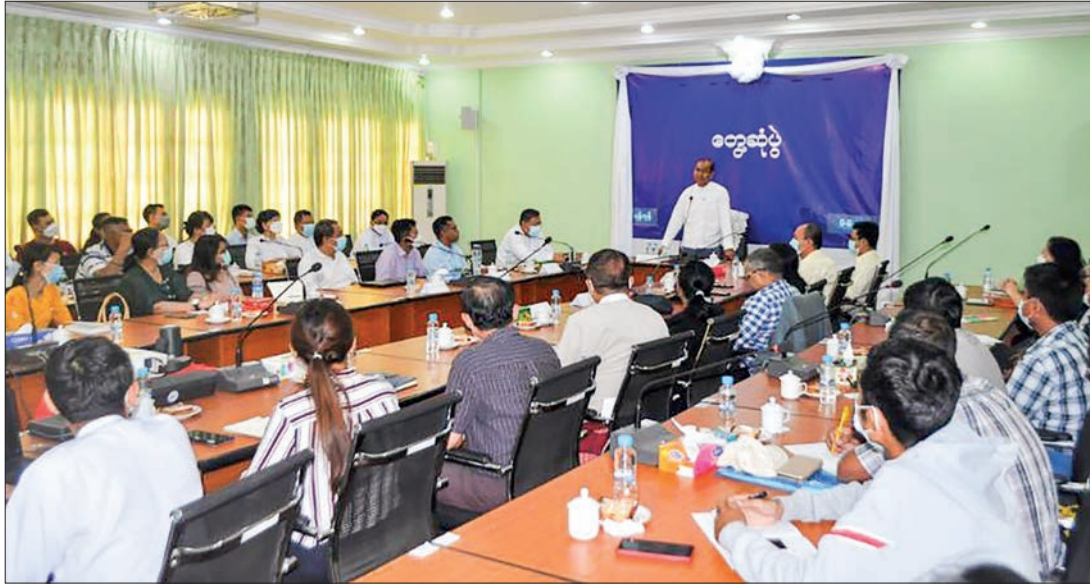
The MoL deputy minister meets the occupational safety and health officials yesterday.

A meeting with occupational safety and health officials from the workplaces/factories was held yesterday morning at the Skills Training School in Yangon to prevent injuries and occupational diseases in workplaces and to increase workers' safety and productivity.