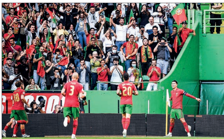
Portugal's forward Cristiano Ronaldo (R) celebrates with teammates after scoring a goal during the UEFA Nations League, league A group 2 football match between Portugal and Switzerland at the Jose Alvalade stadium in Lisbon on 5 June 2022.

"It is wonderful to be able to say that we are disappointed to lose points against Spain," said Czech captain Tomas Soucek.