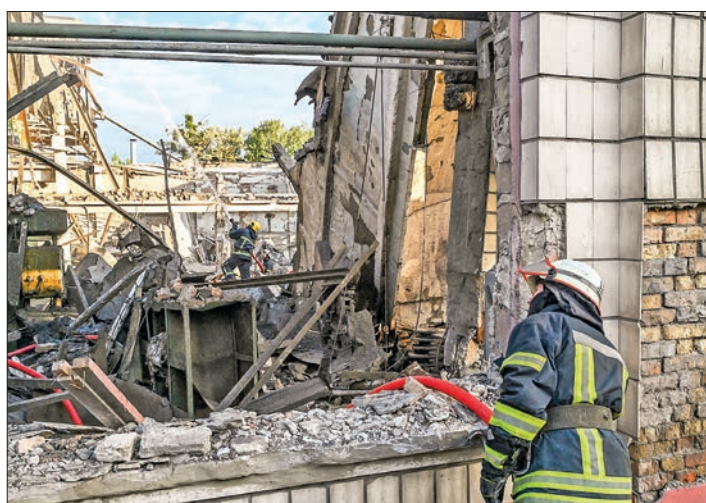
Firefighters intervene in a destroyed production depot of the Darnytsia freight cars repair plant, which was targeted early morning by Russian missile strikes in Kyiv, on 5 June 2022.

RUSSIAN forces have destroyed T-72 tanks and other armoured vehicles supplied by Eastern European countries near Kyiv, Russian Defence Ministry spokesman Igor Konashenkov said Sunday.