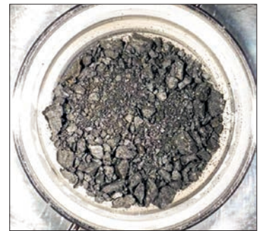
File photo shows samples brought to Earth by the Hayabusa2 space probe from the Ryugu asteroid.

The full-fledged investigation of the sample was launched in 2021 by the Japan Aerospace Exploration