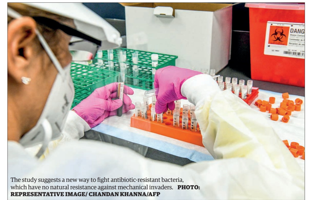
The study suggests a new way to fight antibiotic-resistant bacteria, which have no natural resistance against mechanical invaders.

The lab is working toward better targeting of bacteria to reduce damage to mammalian