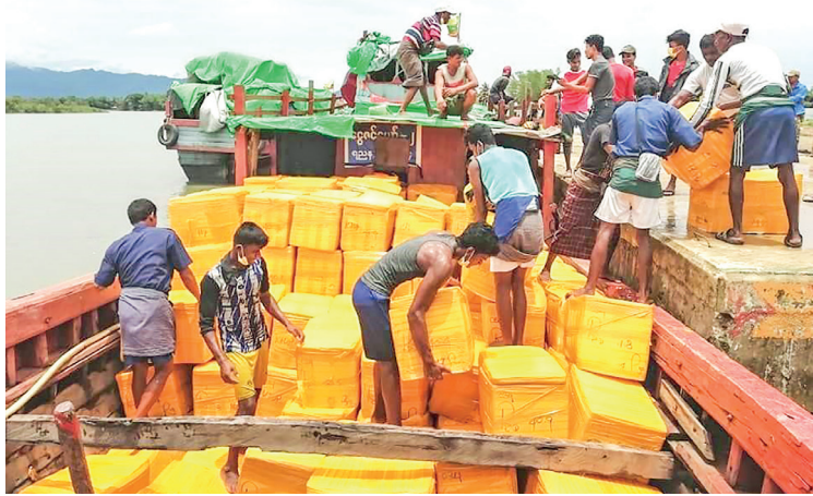
Export cargoes are seen loading onto the craft at the Myanmar-Bangladesh border.

THE two Myanmar-Bangladesh border trade camps — Sittway trade camp and Maungtau border trade camp — earned $3.56 million from border trade in May 2022 and that amount was higher than in April, according to the Rakhine State Chambers of Commerce and Industry.