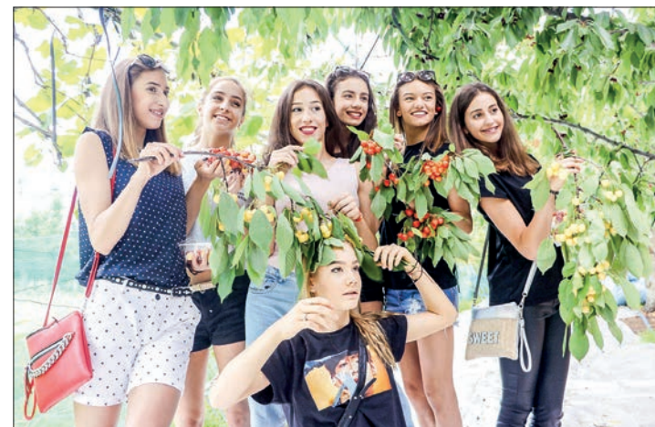
File photo shows Bulgarian gymnasts posing for a photo with cherries in hand at a fruit farm in Murayama, Yamagata, in June 2018.

Before the Olympics and Paralympics, 533 cities, towns and villages across Japan registered for an initiative led by the government to promote exchanges between them and participating foreign athletes as well as their home countries. —Kyodo