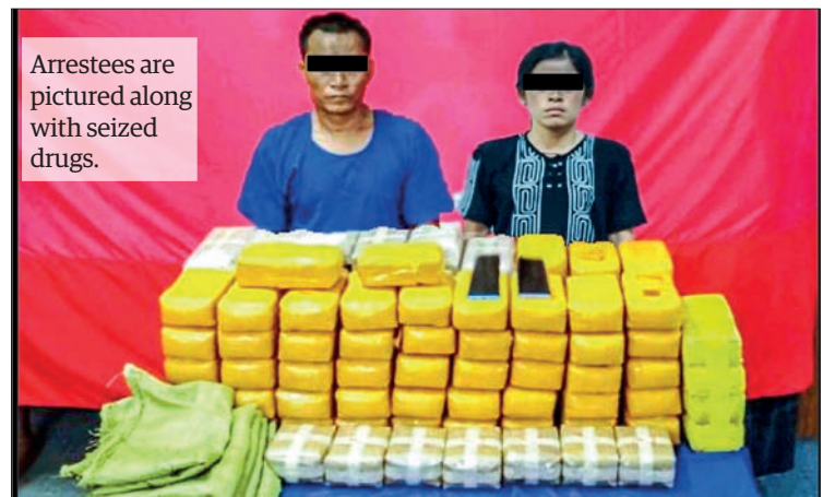
Arrestees are pictured along with seized drugs.

K1 billion worth of stimulant tablets were captured in Thingangyun township of Yangon Region, according to Myanmar Police Force stated.