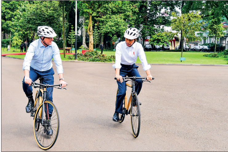
This handout photo taken and released by the Presidential Palace on 6 June 2022 shows Indonesia's President Joko Widodo (R) and Australia's Prime Minister Anthony Albanese (L) riding bamboo bicycles at the Presidential Palace in Bogor, West Java.

AUSTRALIA'S new prime minister and Indonesia's president rode bamboo bicycles together on Monday as they held talks to boost ties, with Canberra embarking on a diplomatic charm offensive to counter China's expanding assertiveness in the Asia-Pacific region.