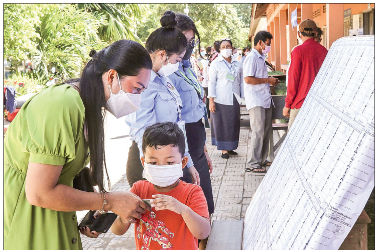
Voters gather at a polling station in Phnom Penh, Cambodia, for local elections on 5 June 2022.

CAMBODIA'S ruling party of Prime Minister Hun Sen won Sunday's local elections by a landslide.