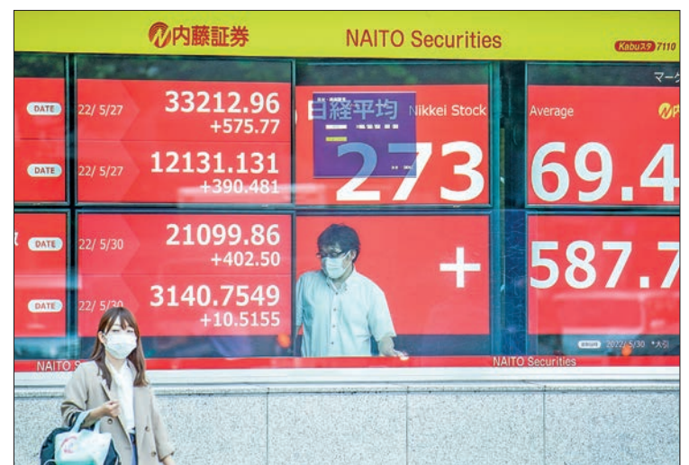
A woman walks past an electronic share price board showing the closing numbers on the Tokyo Stock Exchange in Tokyo on 30 May 2022.