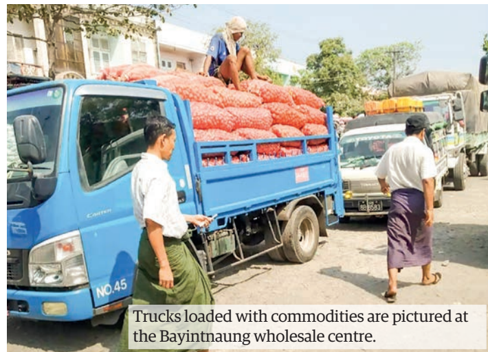
Trucks loaded with commodities are pictured at the Bayintnaung wholesale centre.

TRUCK owners are making less profit since the fare prices can't be changed while the fuel prices are rising, according to U Htaw Gyi, a truck owner from the Yangon-Pathein Freight Forwarding.