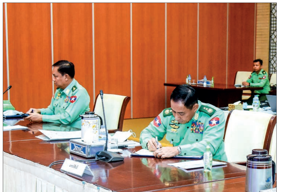
The NDAA Vice-Chair (left photo) and the government Peace Talks Team leader (right photo) sign the agreements deliberated during the three-day peace talks.