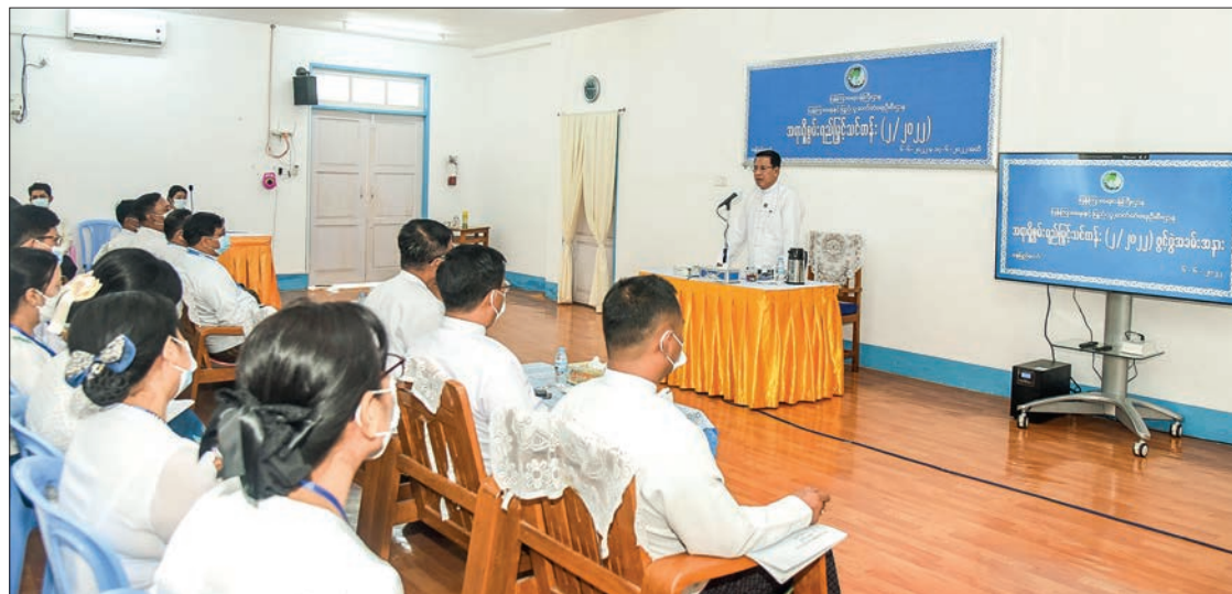
The MoI Union Minister opens the IPRD officer capacity-strengthening training course 2/2022 in Nay Pyi Taw yesterday.

He said that not only the subjects taught in the officer capacity-strengthening course