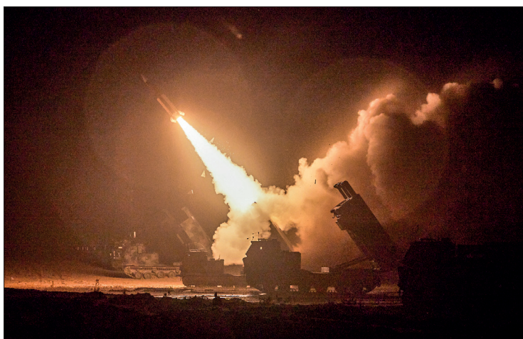
This handout photo taken on 6 June 2022 and released by South Korea's Joint Chiefs of Staff via Yonhap news agency in Seoul shows the Army Tactical Missile System (ATACMS) firing a missile from an undisclosed location on South Korea's east coast during a South Korea-US joint live-fire exercise aimed to counter North Korea's missile test.

spond decisively and sternly to any provocations from North