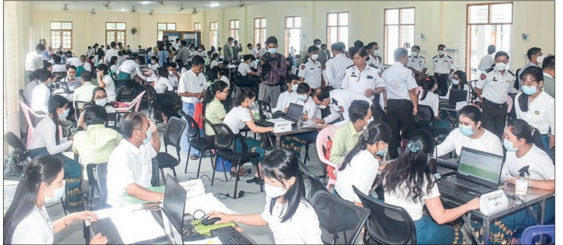
Inspection on the ground population census is underway.

UNION Election Commission Chairman U Thein Soe inspected the work processes to verify the ground population census for the accuracy of the basic voter lists at Thuwunna Youth Training Centre in Yangon to-