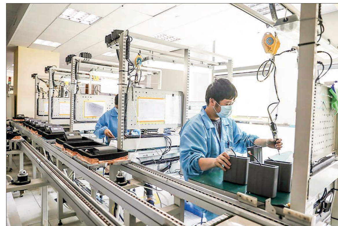
Staff members work at a workshop in an industry park in Qingpu District of Shanghai, east China, 17 May 2022.

C HINA'S cabinet has rolled out a policy package this week, with a prominent part contributing to bolstering micro, small and medium-sized enterprises (MSMEs).