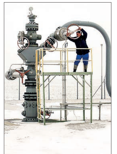
An employee controls a valve at a natural gas storing facility in Bad Leuchstادت, eastern Germany.

Russia's fossil fuel revenues come first from the sale of crude oil (46 billion), followed by pipeline gas, oil products, liquefied natural gas (LNG) and coal. —AFP