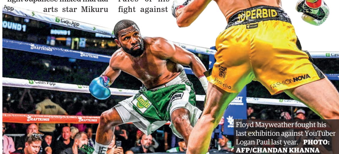
Floyd Mayweather fought his last exhibition against YouTuber Logan Paul last year.

Abu Dhabi last month. The date, venue and rules of his fight against