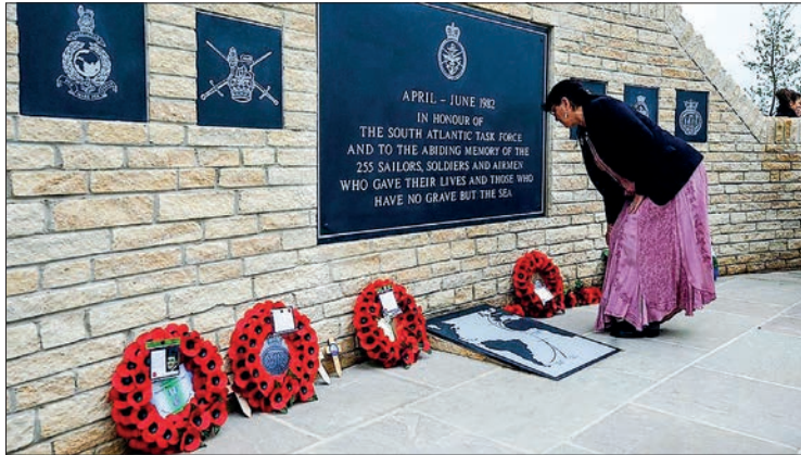
A woman laid a wreath after the dedication ceremony of the Falklands Memorial.

Britain's prime minister at the time, Margaret Thatcher, announced the surrender to parliament on the same day, vindicating for many her high-risk decision to send nearly 30,000