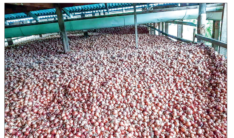
An abundant supply of summer onions from Myingyan, Pakokku, Monywa and Meiktila is seen in the Mandalay market.

Myanmar exports onions to external markets beyond self-sufficiency. The onions are commonly grown in Mandalay, Sagaing and Magway regions. It is cultivated near the riverbank with an irrigation system in the upper Myanmar region. — Min Htet Aung (Mandalay Sub-Printing House)/GNLM