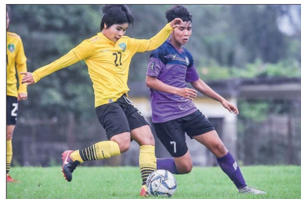
One tourney of the women's league in 2018-2019.

Mayweather called himself the "pioneer of exhibitions" and promised to "put on a show" for fans when he returns in September. "We're going to treat him nice, we're going to let him go three rounds, we're going to let him try to land his shot," Mayweather said of his opponent. —AFP