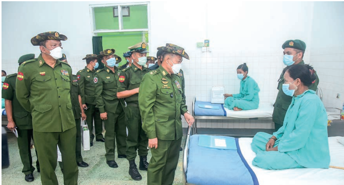
The Vice-Senior General comforts the patients at the military hospital in Sittway.

The Vice-Senior General and party offered flowers, water