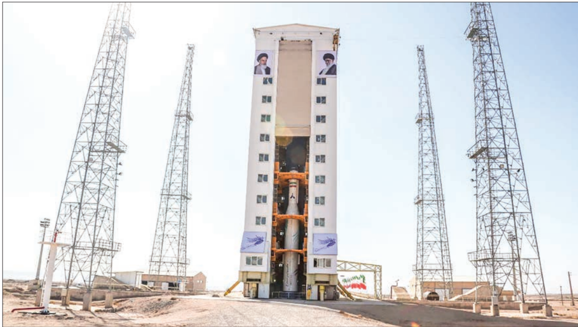
The Semnan Space Centre is home to the Iranian Space Agency's satellite launch site and ballistic missile testing.

TWO Iranian aerospace officials, including a member of the Revolutionary Guards' Corps, were "martyred while on mission" in separate incidents inside the country, the Fars news agency reported today.