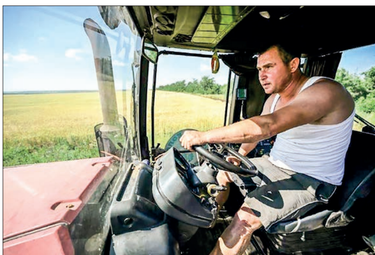
A farmer drives a tractor as he mows grass on a field of a farm in southern Ukraine's Mykolaiv region, on 11 June 2022, amid the Russian invasion of Ukraine.

Despite the significant loss of land to the Russians, "the cur-