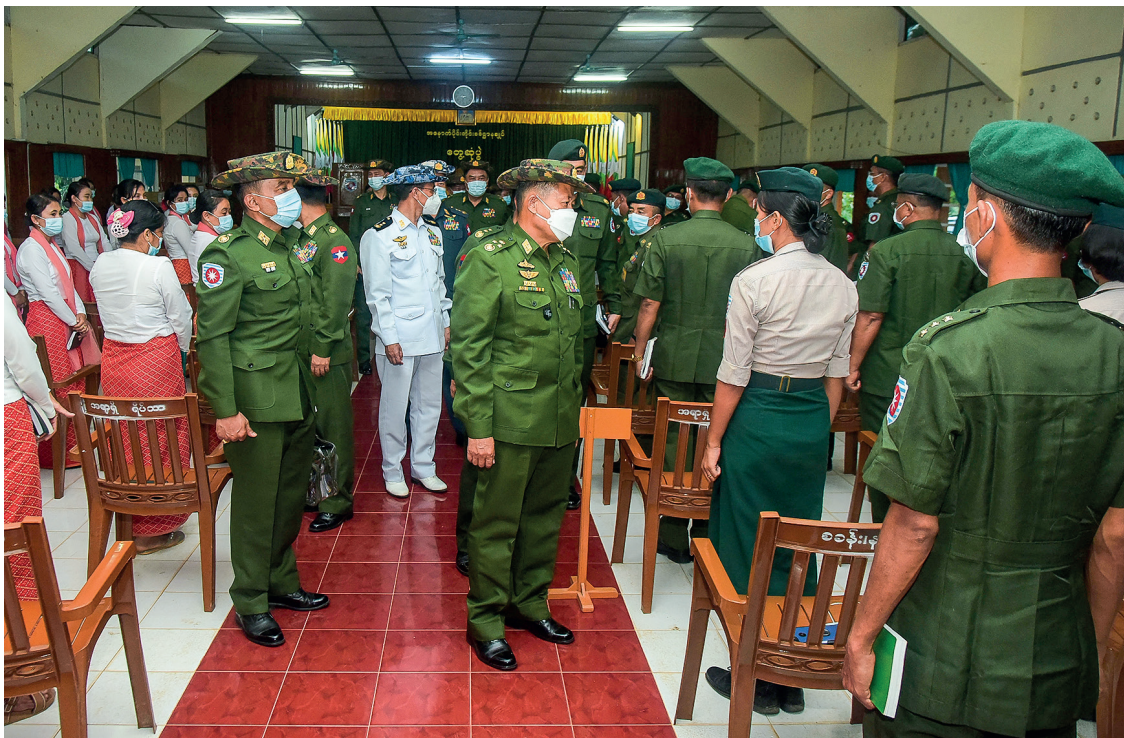
The Vice-Senior General cordially greets Tatmadaw members and families from An Station.

the dangers threatening the country. Despite an unwillingness to cause fighting and armed conflicts due to their experiences, Tatmadaw members sacrifice their lives and limbs in discharging important duties of defending the State.