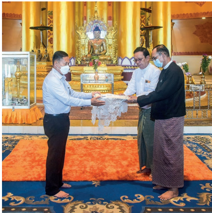
The Vice-Senior General donates at the Sakyamuni Thunsettaw Pagoda.

and oil lights to Lawkananda and Sakyamuni Thunsettaw pagodas in Sittway and made cash donations. They also viewed round the strand road and urban area of Sittway by car. — MNA