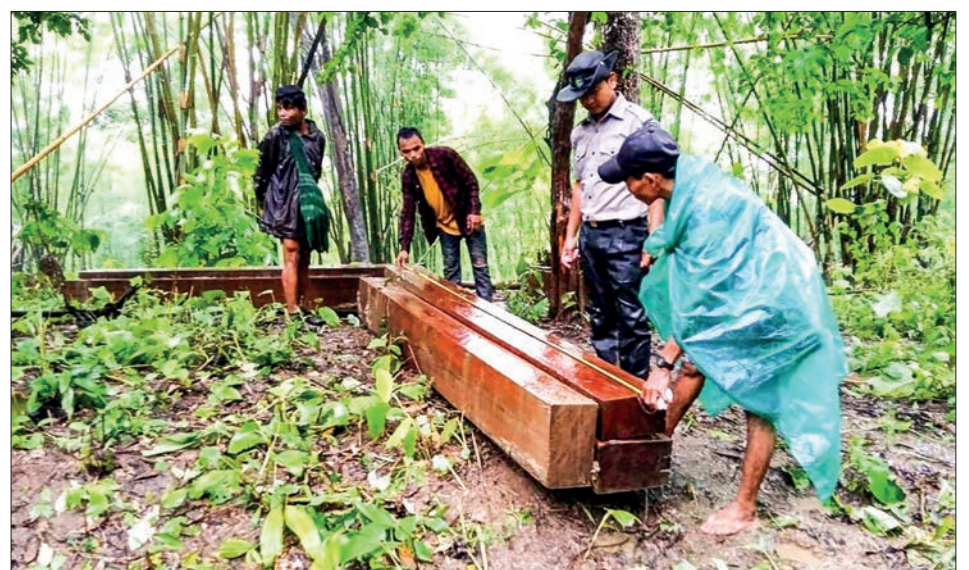
Officials confiscate illegal timbers.

Seventy cartons of Mevius cigarettes and foodstuffs at an estimated