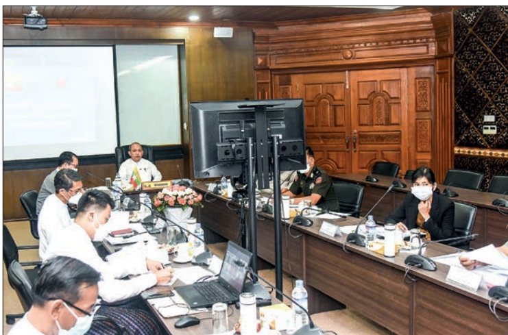
The fifth Myanmar-Bangladesh JWG meeting is in progress online.

THE Fifth Meeting of the Myanmar-Bangladesh Joint Working Group (JWG) on the repatriation of displaced persons from Rakhine State was held via videoconference at the Ministry of Foreign Affairs in Nay Pyi Taw on 14 June 2022.