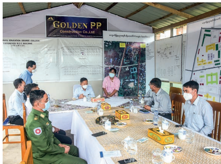
The Vice-Senior General meets responsible personnel at the Kyaukpyu Education Degree College.

sibility (CSR) tasks related to the health and education of local people and on timely implementation of the project in accordance with the required standards.