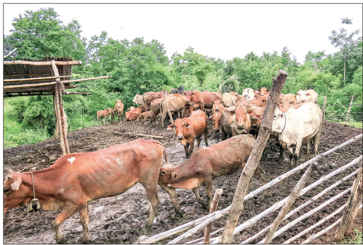
The value of animal product exports dropped by $100 million in the 2019-2020FY as against a year-ago period, following the negative impacts of the COVID-19.