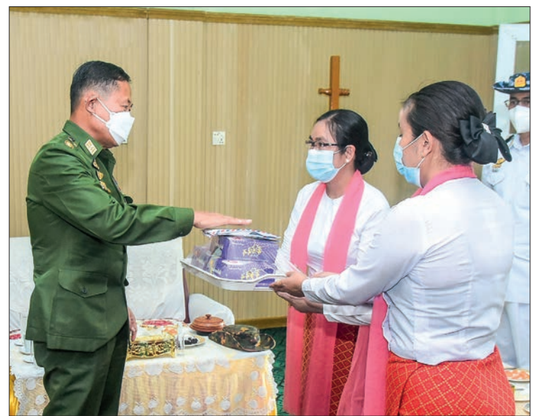
The Vice-Senior General gives foodstuffs to family members of the Kyaukpyu Station.