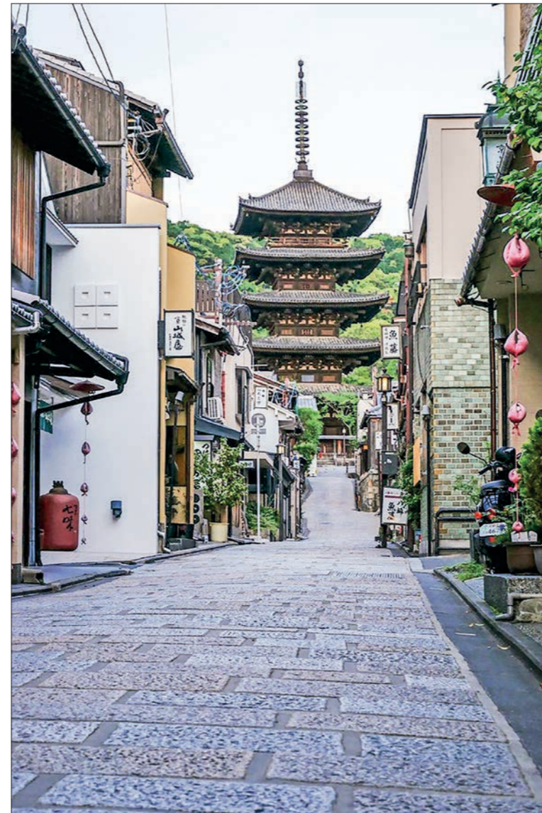
The road in front of temples is paved by Kyoto city for tourists/visitors to make it easier to walk. But temples do not pay the income tax.

On the other hand, expenditures are 32.0 per cent (320.7 billion yen ≈ $2.47 billion) of social welfare expenses, which is higher than the tax revenue collected from residents, and the amount is increasing year by year as the ageing of Kyoto residents progresses. The next largest are industrial-economic expenses 24.1 per cent (241.1 billion yen ≈ 1.85 billion dollars), education and culture expenses 11.7 per cent (116.4 billion yen ≈ 900 million dollars), and urban construction expenses 7.8 per cent (77 billion yen ≈ 600 million dollars). Health and hygiene expenses continue to be 6.5 per cent (64.9 billion yen ≈ 500 million dollars). Expenditures include subway construction costs and bus route maintenance costs. There is still debate about whether