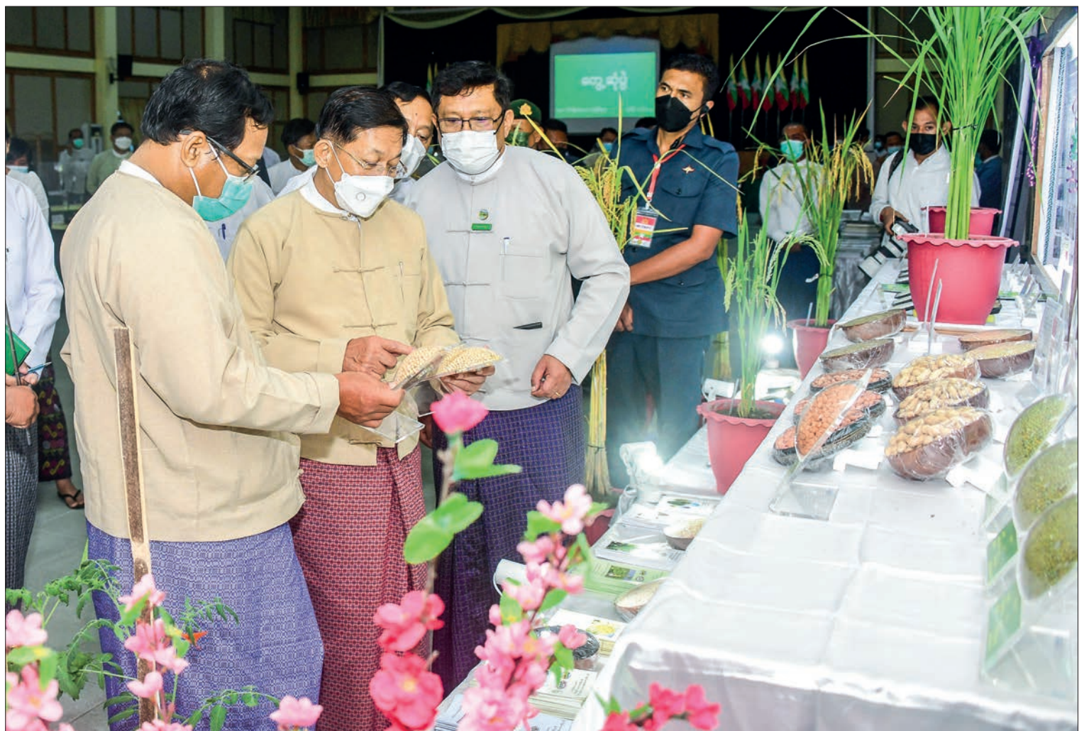
State Administration Council Chairman Prime Minister Senior General Min Aung Hlaing views round the booths at the Agricultural Research Department in Zeyathiri Township of Nay Pyi Taw Council Area on 14 June 2022.