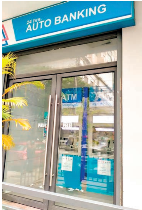
Reoperating ATM machines of the KBZ Bank.

THE interest on the daily withdrawal of cash by Kpay is growing despite the cash availability in the KBZ ATMs. KBZ Bank has announced that K300,000 per week can be withdrawn from the ATMs of 50 KBZ branches in Yangon, Mandalay, Nay Pyi Taw, and Taunggyi from 9 June.