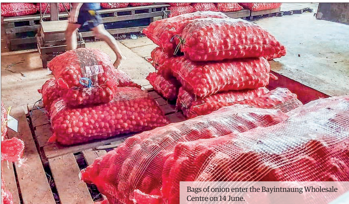
Bags of onion enter the Bayintnaung Wholesale Centre on 14 June.

and 2021. When the winter onion entered the summer market, the production rate dropped by half for rainfalls and other reasons in 2021, and the rotten rate showed 25 per cent, said onion dealer U Hla Ngwe.