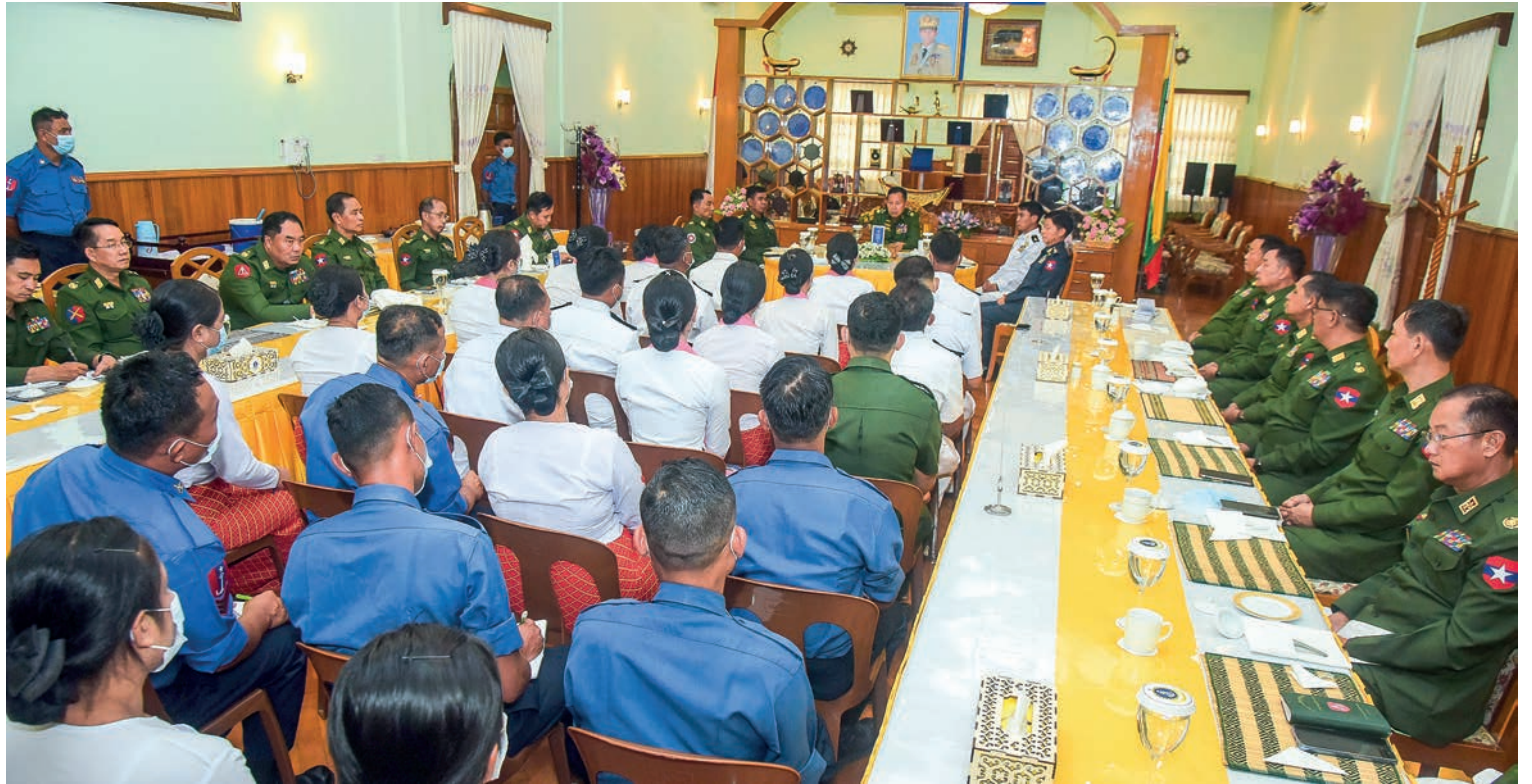
The Vice-Senior General meets Tatmadaw members and families of the Danyawady Naval Region Command Headquarters yesterday.

In his speeches, the Vice-Senior General stressed the need to continuously assess the advancement of international affairs and technologies and cautiously monitor