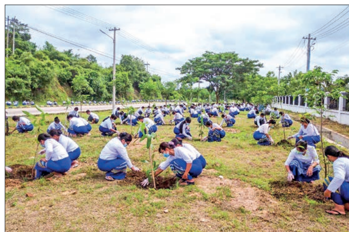
The MoL monsoon tree-planting event in action.

THE monsoon tree-planting ceremony of the Ministry of Labour was held yesterday morning in Nay Pyi Taw.