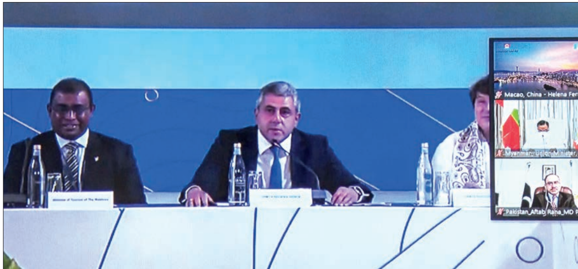
The MoHT Union Minister joins the 34 th Joint Commission for East Asia Pacific and South Asia meeting held by the WTO.

Myanmar's tourism industry, like other countries, was affected by the COVID-19 crisis, and is trying to recover as soon as possible. Efforts are being made to turn pandemic challenges into opportunities to become more resilient and revitalize tourism in