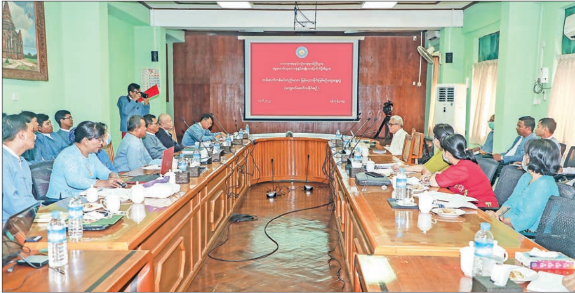
The coordination meeting on the Stone Age historical process was held on 13 and 14 June 2022.

A coordination meeting on the Stone Age historical process took place at the Yangon Branch of the Department of Archaeology and National Museum on 13 and 14 June.