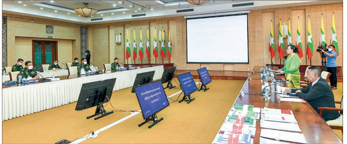
The peace talks between the government's Peace Talks Team and the delegation led by the ALP Vice-Chairperson is in progress.

They then discussed peace and development-related matters. The discussion will continue on 15 June. — MNA