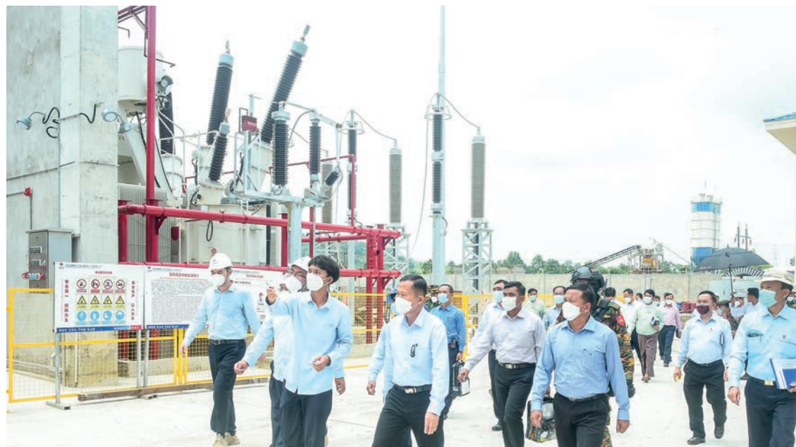
The Vice-Senior General pays inspection tours at the construction site of the power plant project.

When it comes into operation, the plant will generate 135 MW. The State Administration Council Vice-Chairman gave suggestions on measures to be taken to safeguard the natural environment and contribute to Corporate Social Respon-