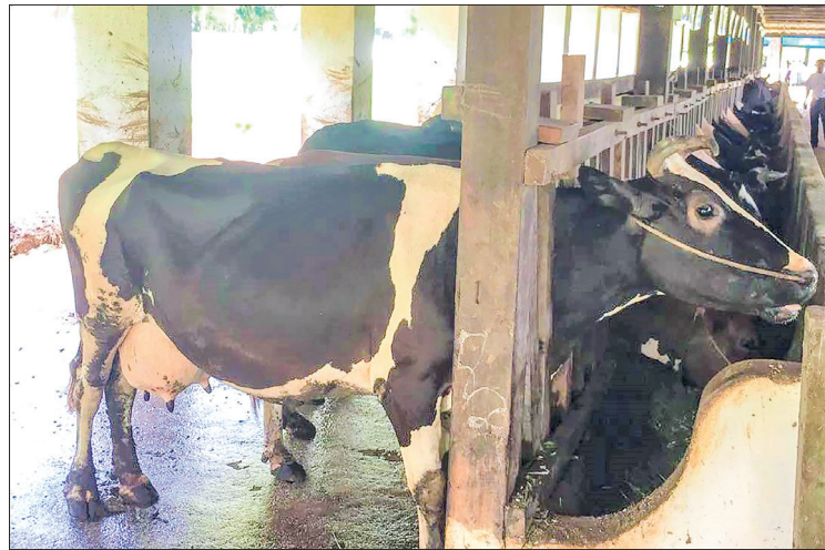
There are approximately 16,000 heads of dairy cattle in Yangon Region, with Jersey accounting for 20 per cent and Friesian constituting 80 per cent.

in dairy farming. In Myanmar, the price of milk evaluates on the measurement mostly. Friesian cattle produce a high milk yield but cow milk contains only 3.5 per cent milk fat. Friesian can produce 10 visses (a viss equals 1.6 kilogrammes) while the milk yield of Jersey is estimated at eight visses. Jersey cow has five per cent milk fat. There are taste differences. However, Friesian cattle are primarily farmed here. Milk composition depends on the types of breed although the same feedstuffs are utilized in dairy farming. We have to look forward to the outlook of the future for milk consumers,” said U Min Nyunt Oo, deputy director of the Yangon Region Livestock Breeding and Veterinary Department.