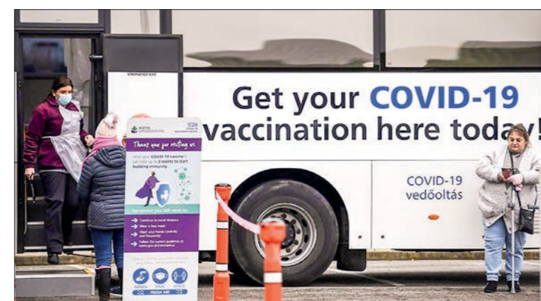
Members of the public wait to receive their Covid-19 vaccine or booster at a National Health Service bus outside a supermarket in the town of Farnworth, near Manchester in north-west England on 20 December 2021.

T HE WTO's search for a role in fighting the pandemic sharpened up on Monday as ministers seek a compromise to lift intellectual property rights on Covid-19 vaccines.