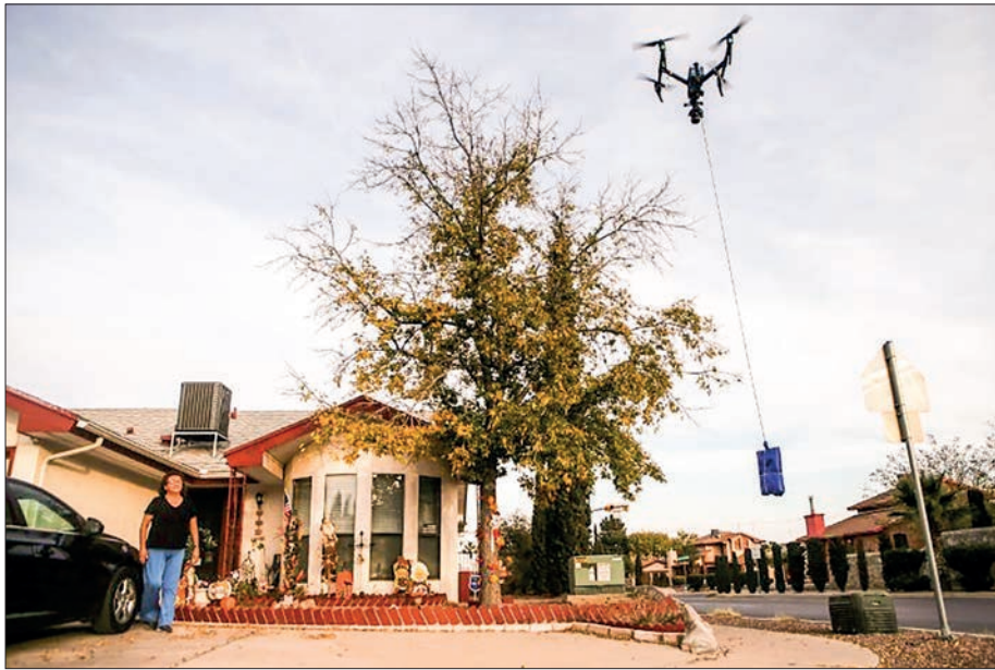
The drones can carry loads as heavy as five pounds (2.2 kilogrammes) in packages about the size of a large shoe box.

AMAZON plans to start flying some purchases to customers later this year, the e-commerce giant said Monday, announcing drone delivery that will debut in a California town.