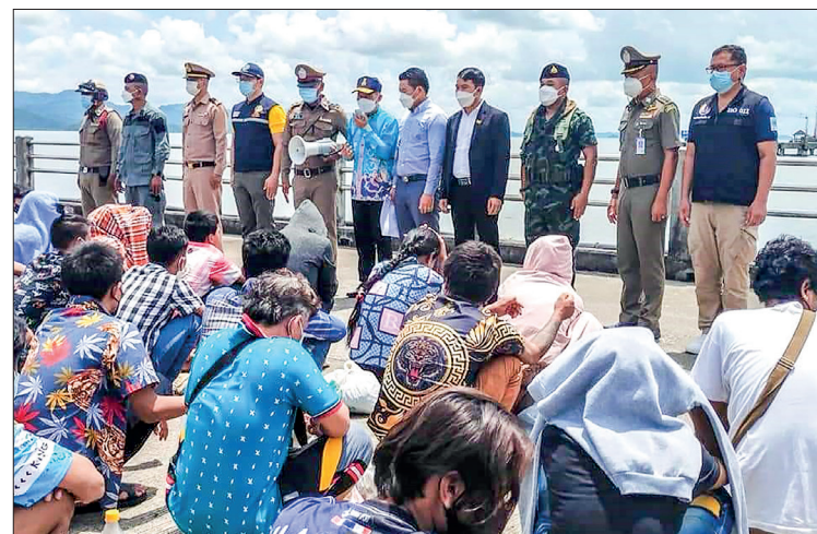
The transferred Myanmar migrants are seen on the Ranong-Kawthoung border.

THAI authorities handed over 155 Myanmar workers to Myanmar authorities on 17 June, said officials.