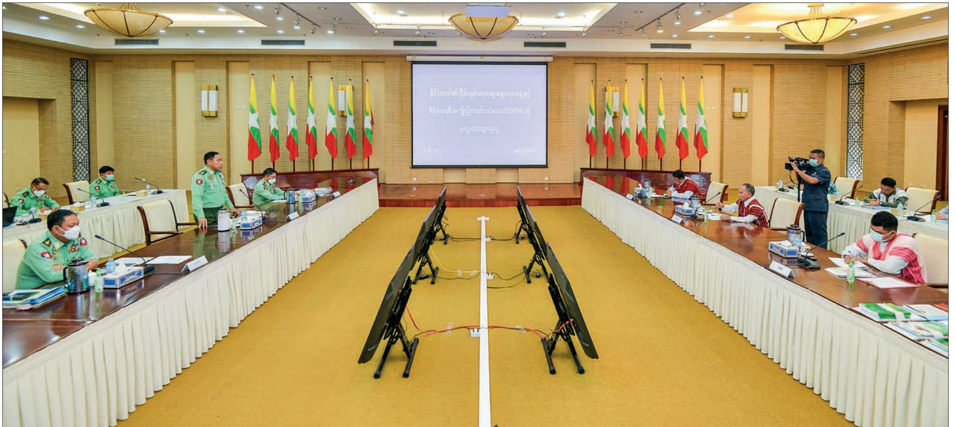
The discussion between the government Peace Talks Team and the DKBA delegation is in progress in Nay Pyi Taw on 20 June 2022.

A MEETING between the Peace Talks Team of the State and the Democratic Karen Benevolent Army-DKBA delegation was held at the National Solidarity and Peacemaking Centre in Nay