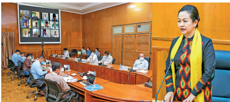
The coordination meeting on emergency response to floods is in progress.

THE Ministry of Social Welfare, Relief and Resettlement held a coordination meeting to respond quickly to possible floods due to weather conditions, in Nay Pyi Taw yesterday.