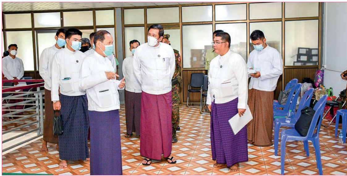
Union Minister U Ko Ko inspects the Myanmar-Korea friendship school in Hlinethaya Township.

At noon, the Union Minister attended the discussion on the history of Pyu Era and contiguous