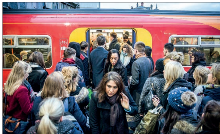
(FILES) In this file photo taken on 10 January 2017 Commuters attempt to board a full South West Train carriage toward central London as others alight at Clapham Junction station in London after strike action by Southern Rail caused another morning of travel disruption in the British capital.

BRITAIN’S railway network this week faces its biggest strike action in more than three decades in a row over pay as soaring inflation erodes earnings.