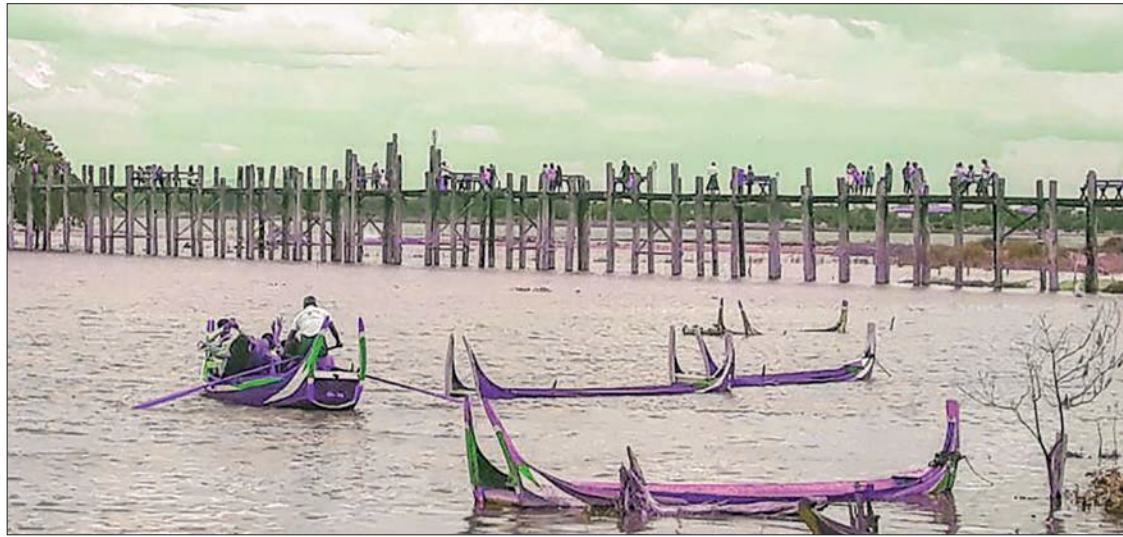
Domestic tourists enjoy boat rides in Taungthaman Lake.

vice does a roaring business with foreign tourists. At present, the tourist arrival is rarely witnessed. local visitors seldomly ride the