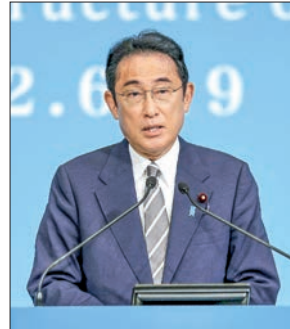
Japanese Prime Minister Fumio Kishida makes a speech during an inaugural meeting in Tokyo on 19 June 2022, of a national council tasked with making policy proposals for sustainable finances in Japan.

Ichiro Matsui, leader of the Japan Innovation Party, and Yuichiro Tanaka, head of the Democratic Party for the People, called for the acquisition of a nuclear-powered submarine to boost deterrence and reconnaissance capacity.—Kyodo