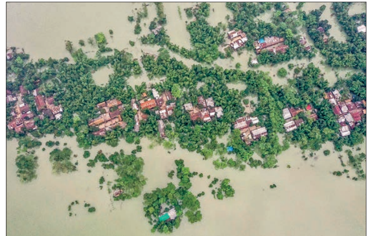
This aerial picture shows a flooded area following heavy monsoon rainfalls in Goyainghat on 19 June 2022.

Assam continued to reel under severe flooding, with 5,140