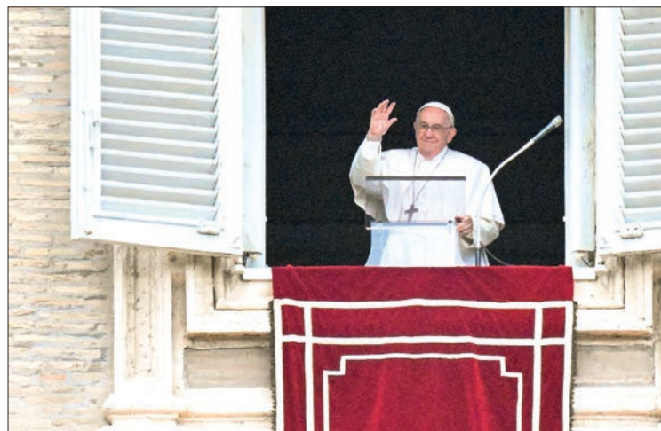
Pope Francis waves from the window of the apostolic palace overlooking St. Peter’s square during the weekly Angelus prayer on 19 June 2022 in The Vatican.

As a child, Francis had one of his lungs partially removed.