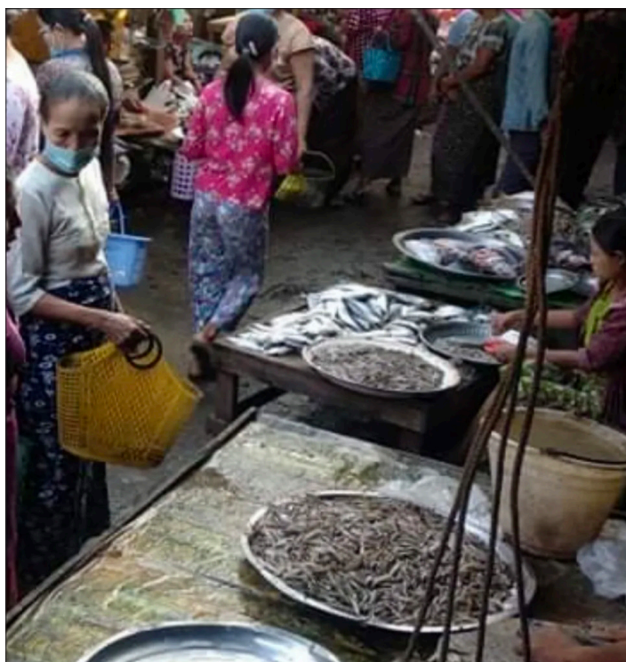
The decrease in prices of fishery products also makes the chicken price drop in the market.

The decrease in prices of fishery products also makes the chicken price drop in the