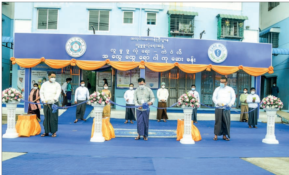
The Social Security Board of the Ministry of Labour opens a clinic in Dagon Myothit (Seikkan) Township.

There are 33,868 workplaces covered by the social security benefits and 1,107,338 insured workers. The insured workers are entitled to receive free medical treatment for any illness, financial benefits for illness, maternity and death, access to healthcare for children under a year old of an insured woman, financial benefits for injuries, temporary/permanent disability and death in the workplace, financial benefits for the death of the insured worker, funeral, and his/her family.