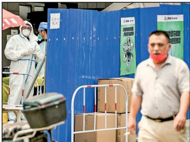
A health worker (L) wearing a personal protective equipment (PPE) works inside a fenced residential area under lockdown due to Covid-19 coronavirus restrictions in Beijing on 20 June 2022.

"We hope that China is really waking up," Bettina Schoen-Behanzin, vice-