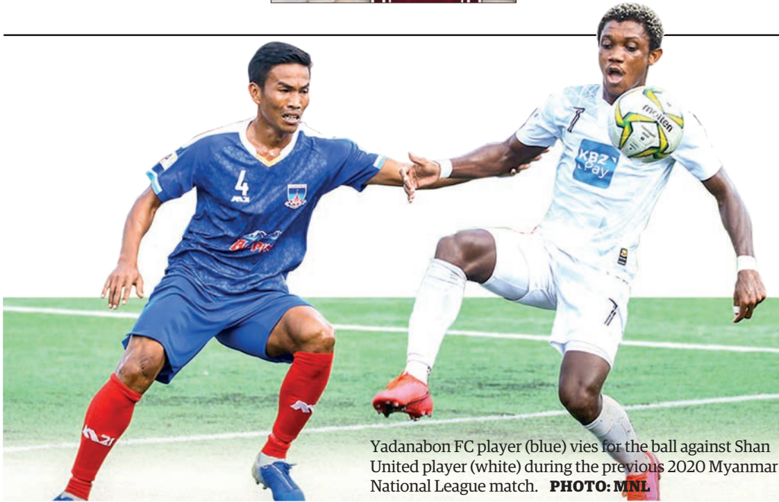
Yadanabon FC player (blue) vies for the ball against Shan United player (white) during the previous 2020 Myanmar National League match.