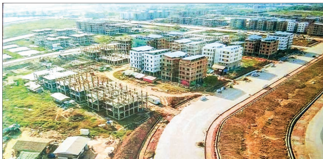
One of the Public Rental Housing projects in Yangon Region.

Maha Bandoola Public Rental Housing is located at the corner of Maha Bandoola Road and No.2 Highway in Dagon Myothit (South) Township. The housing includes 50 eight semi-detached buildings with five floors (1,200 apartments). Yangon Region government supervised the housing project with the fund of K20 billion allocated by the Union Government in the 2015-2016FY and apartment units are rented out. The Department of Urban and Housing Development takes the role of supervising the housing.