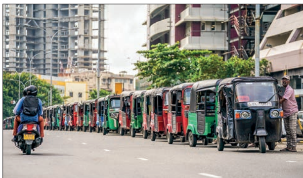
Autorickshaw drivers queue along a street to buy petrol from a Ceylon petroleum corporation fuel station in Colombo on 17 June 2022.

SRI Lanka closed schools and halted all non-essential government services on Monday, beginning a two-week shutdown to