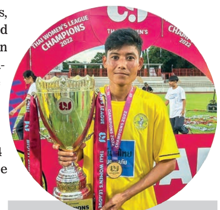
Myanmar female football star Khin Malar Tun is seen with 2022 Thai Women’s League Championship trophy.

Khin Malar Tun is the first Myanmar female footballer to play for a Thai wom-