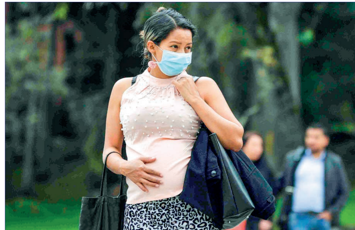
A pregnant woman wears a face mask as a preventative measure against the spread of the new coronavirus, COVID-19, as she waits for the bus in Bogota, on 16 March 2020.

A subtle molecular change allows immunoglobulin to take on an expanded protective role during pregnancy, according to a study by the Cincinnati Children’s Hospital Medical Centre.