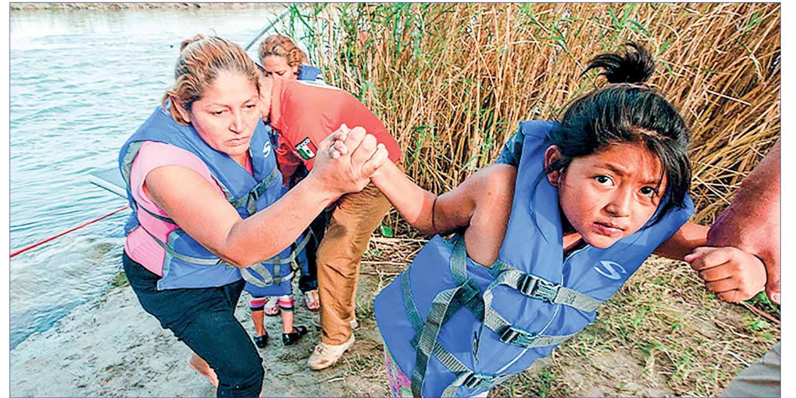
Migrants and refugees can be exposed to various stress factors which affect their mental health and well-being. Central American migrants cross the Rio Bravo into Texas.

“We need to transform our attitudes, actions and approaches