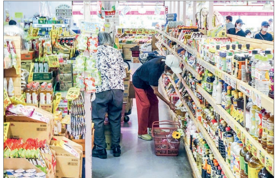
Customers shop at a supermarket in Tokyo on 20 June 2022.

Raw material and crude oil costs have risen in line with higher demand as economies recover from the coronavirus pandemic and due to global supply chain disruptions. Japan has also seen the