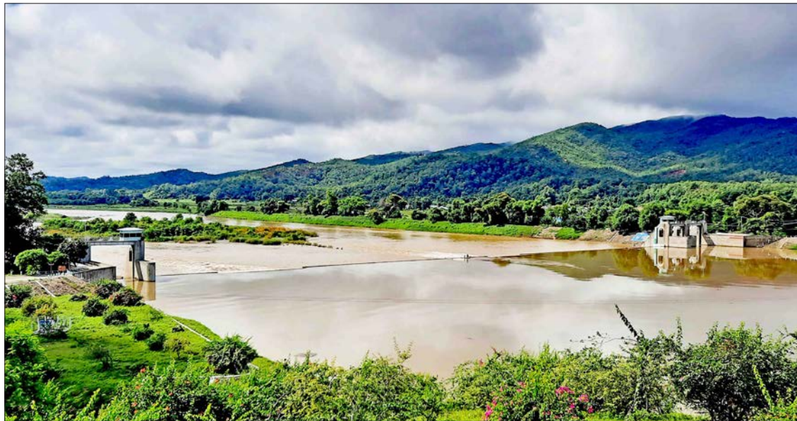
An undated photo shows the scenic view of the Mezali diversion weir in Magway Region.

“Our department has been irrigating farming acres since 15 June. We distribute agricultural water through a network of canals and ditches from the dam so that the locals efficiently utilize the water supply and meet