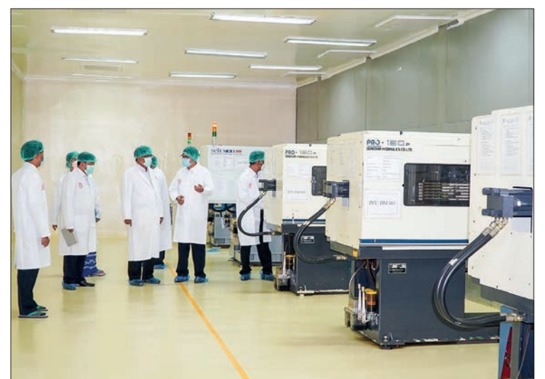
Union Industry Minister Dr Charlie Than inspects the Myanmar Pharmaceutical Factory (Inyaung) in Kyaukse on 19 June.

In the afternoon, the Union minister arrived at the Soap Factory (Yamethin) and the factory manager and officials concerned elaborated on the factory operation management. The Union minister instructed them to carry out market research on Shwe Wah soap and boost product quality. Finally, he asked them to make concerted efforts to keep the factory operational for the long term and inspected Shwe Wah branded soap bars and machines and equipment at the factory. —MNA