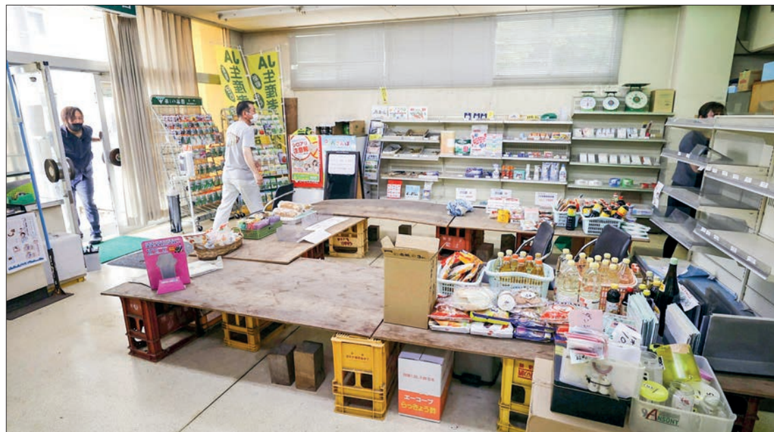
People call on others to evacuate as a strong earthquake hit Suzu, Ishikawa Prefecture, at 10:31 am on 20 June 2022, just as they were cleaning up merchandise that had fallen off the shelves due to another strong quake a day earlier.

At around 3 pm Sunday, an earthquake with an estimated magnitude of 5.4 struck the region, leaving at least six people injured in Ishikawa. It registered lower 6 on the Japanese intensity scale in Suzu. —Kyodo