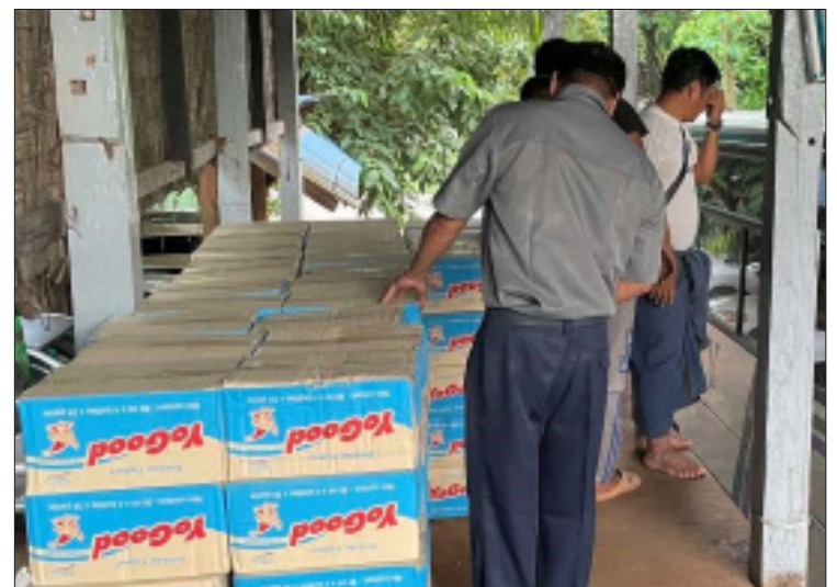
Seized illegal commodities in Mon State.

Therefore, seven arrests (approximately K51,711,644) were made on three consecutive days from 18 to 20 June, according to the Anti-Illegal Trade Steering Committee. — MNA