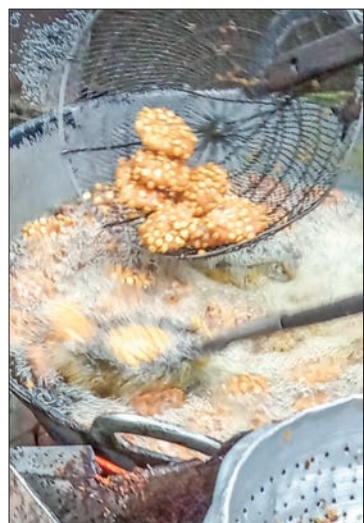
Palm oil is seen at one retail outlet (top). A vendor is frying snacks with palm oil.

THE palm oil price outside Yangon was K8,400 per viss last week and the price fetched about K7,200 per viss this week on 20 June, according to the purchasers.