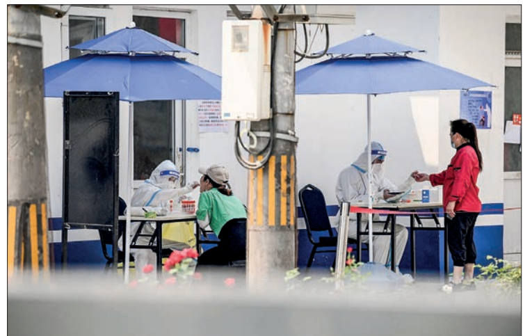
A health worker takes a swab sample from a woman inside a fenced residential area under lockdown due to Covid-19 coronavirus restrictions in Beijing on 20 June 2022.

Each positive case — typically a few dozen a day nationwide — unspools a trail of used test kits, face masks and person-