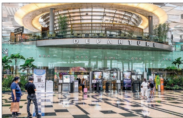
A traveller enters the departure area on her way to her flight from Changi International Airport in Singapore on 11 March 2022.

AIR passengers are expected to hit 83 per cent of pre-pandemic levels this year and the aviation industry's return to profit is "within reach" in 2023, the International Air Transport Association said on Monday.