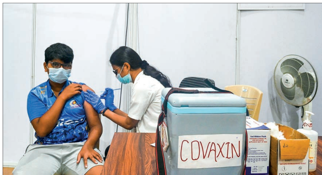
A health worker inoculates a teenage boy with a dose of the Covaxin vaccine against the Covid-19 coronavirus at a vaccination centre in Mumbai on 9 June 2022.

So far, 42,707,900 people have been successfully cured and discharged from hospitals, of whom 8,537 were discharged during the past 24 hours. —Xinhua