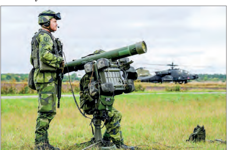
Swedish air defence practice for the first time against helicopters attack as part of the military exercise Aurora 17 on the Swedish island of Gotland, Sweden, on 19 September 2017.

"We don't have problems with Sweden and Finland like we do with Ukraine," Putin told a news conference in the Turk-