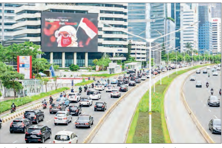
The death toll from the coronavirus in Indonesia rose by three to 156,728 on Wednesday, while 1,282 more people recovered during the past 24 hours, bringing the total number of recoveries to 5.91 million, according to the ministry's data.

He made the prediction after observing South Africa, which first spotted the emergence of the sublineages. According to Sadik-