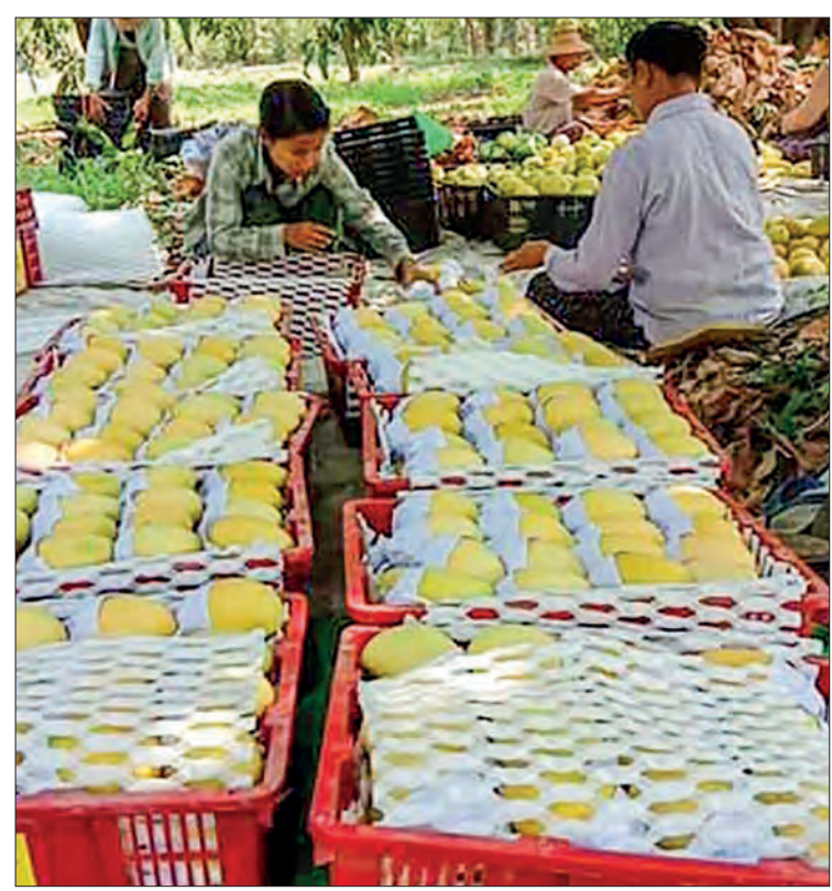
The agricultural exports were valued at $2.4 billion in the past minibudget period (October 2021-March 2022).

The country requires specific export plans for each agricultural product, as they are currently exported to external markets based upon supply and demand. The G-to-G pact