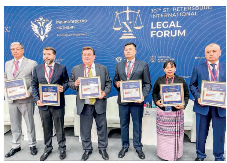
The Union Minister for Legal Affairs and Union Attorney-General takes the documentary photo at the forum.

A Myanmar delegation led by Union Minister for Legal Affairs and Union Attorney-General Dr Thida Oo attended the 10<sup>th</sup> St Petersburg International Legal