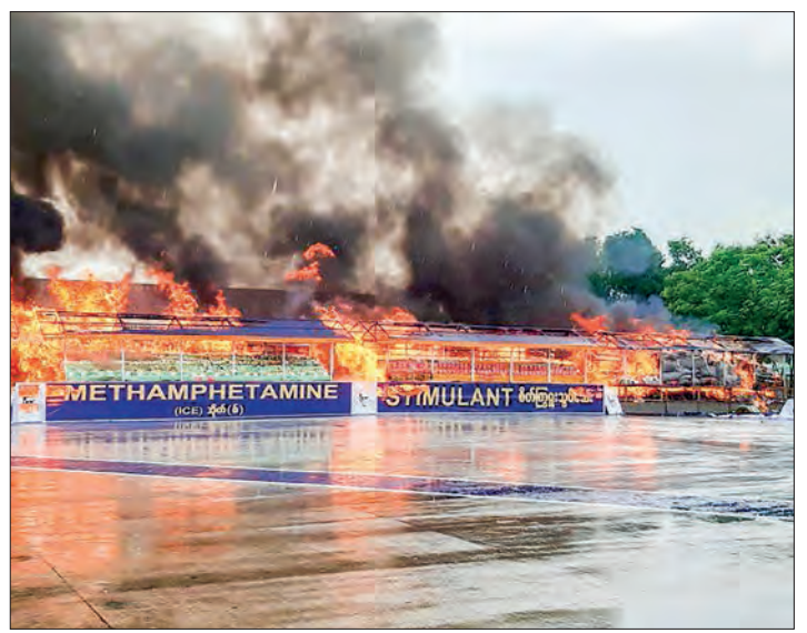
This photo taken on 26 June 2022 shows authorities are destroying

On 26 June 2022, a total of 79 seized narcotics and precursor chemicals worth K118,882 billion (more than USD 642.60 million) were destroyed in Mandalay, Yangon, and Taunggyi. — TWA/GNLM