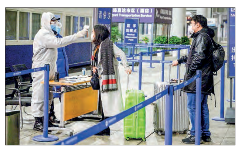
A security personnel checks the temperature of passengers arriving at the Shanghai Pudong International Airport in Shanghai on 4 February 2020.

DESPITE the palpable anger from the public, China on Wednesday retained its strict "zero-Covid" policy, while easing its quarantine policy for international arrivals from fourteen to seven days. China slashed the period by more than half in the biggest relaxation of entry restrictions in the country since the pandemic began, reported CNN.