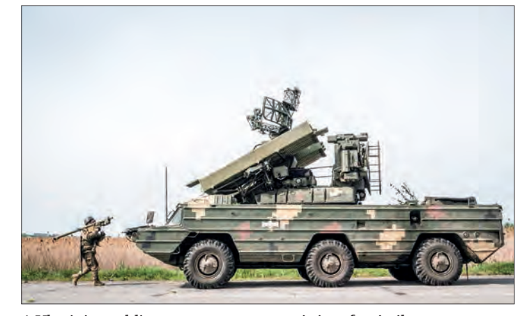
A Ukrainian soldier gestures past an anti aircraft missile system near Sloviansk, eastern Ukraine on 11 May 2022, amid the Russian invasion of Ukraine.

This is not the first time that the Syrian government, which since 2015 has been heavily backed by Russia in its own civil war, has supported Moscow's recognition of breakaway states.— AFP