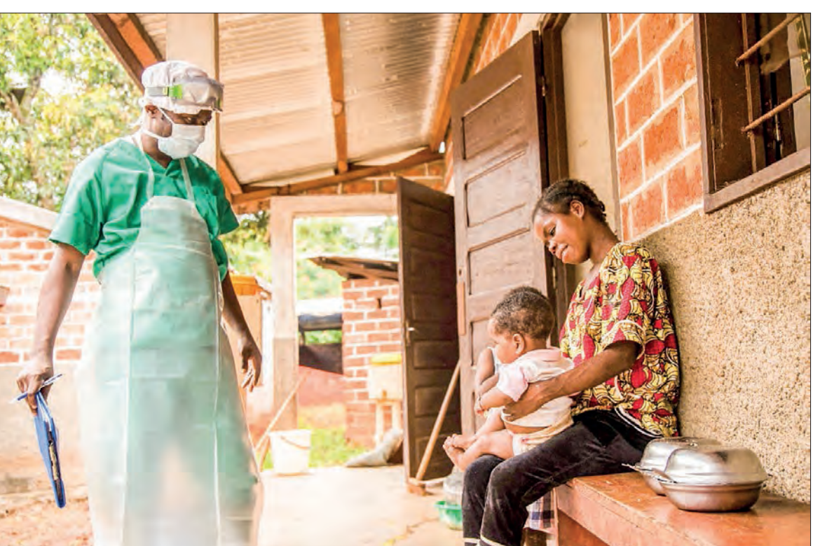
A woman and her child await treatment for monkeypox at a facility run by Doctors Without Borders in the Central African Republic in 2018.

As of 22 June this year, 3,413 laboratory-confirmed monkeypox cases and one death have been reported to the WHO, from and the United States (142).