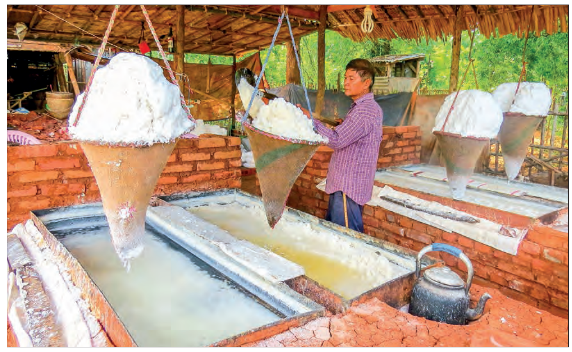
A worker is processing the seawater salt at one production farm in Mon State.

The prices of raw salt were worth K80-110 per viss in the