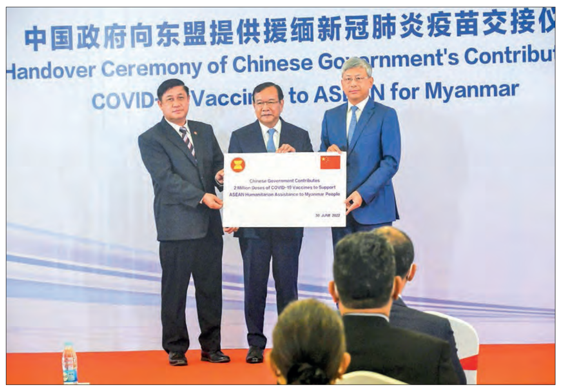
The Chinese ambassador presents two million vaccines donation to the special envoy of the ASEAN Chair and the ASEAN's deputy secretary-general yesterday.

THE handover ceremony of the Chinese Government's contribution of COVID-19 vaccines to ASEAN for Myanmar to the special envoy of ASEAN Chair on Myanmar was held at the residence of the Chinese ambassador to Myanmar in Yangon yesterday.