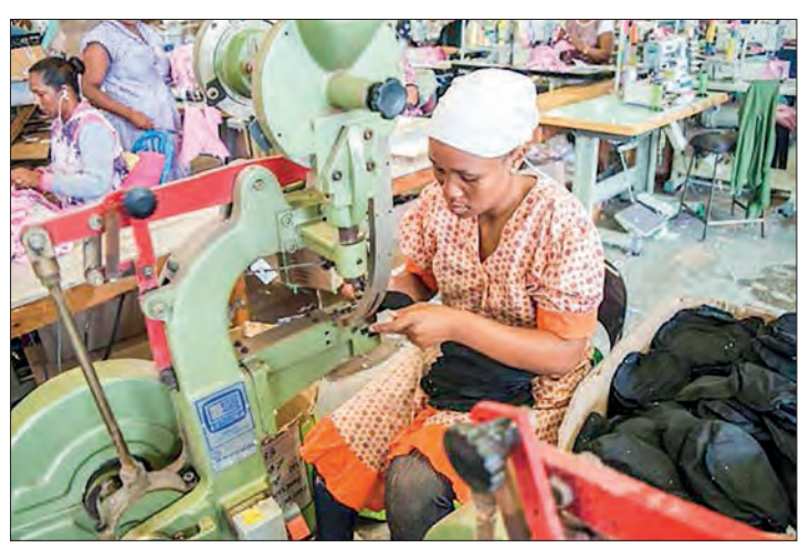
South Africa's gross domestic product grew by 1.9 per cent in the first quarter.

"The size of the economy is now at pre-pandemic levels, with real GDP slightly higher than what it was before the Covid-19 pandemic," it said. The report said manufacturing, finance, business services and trade made gains during the first quarter, while agriculture was subdued and mining and construction contracted.—AFP