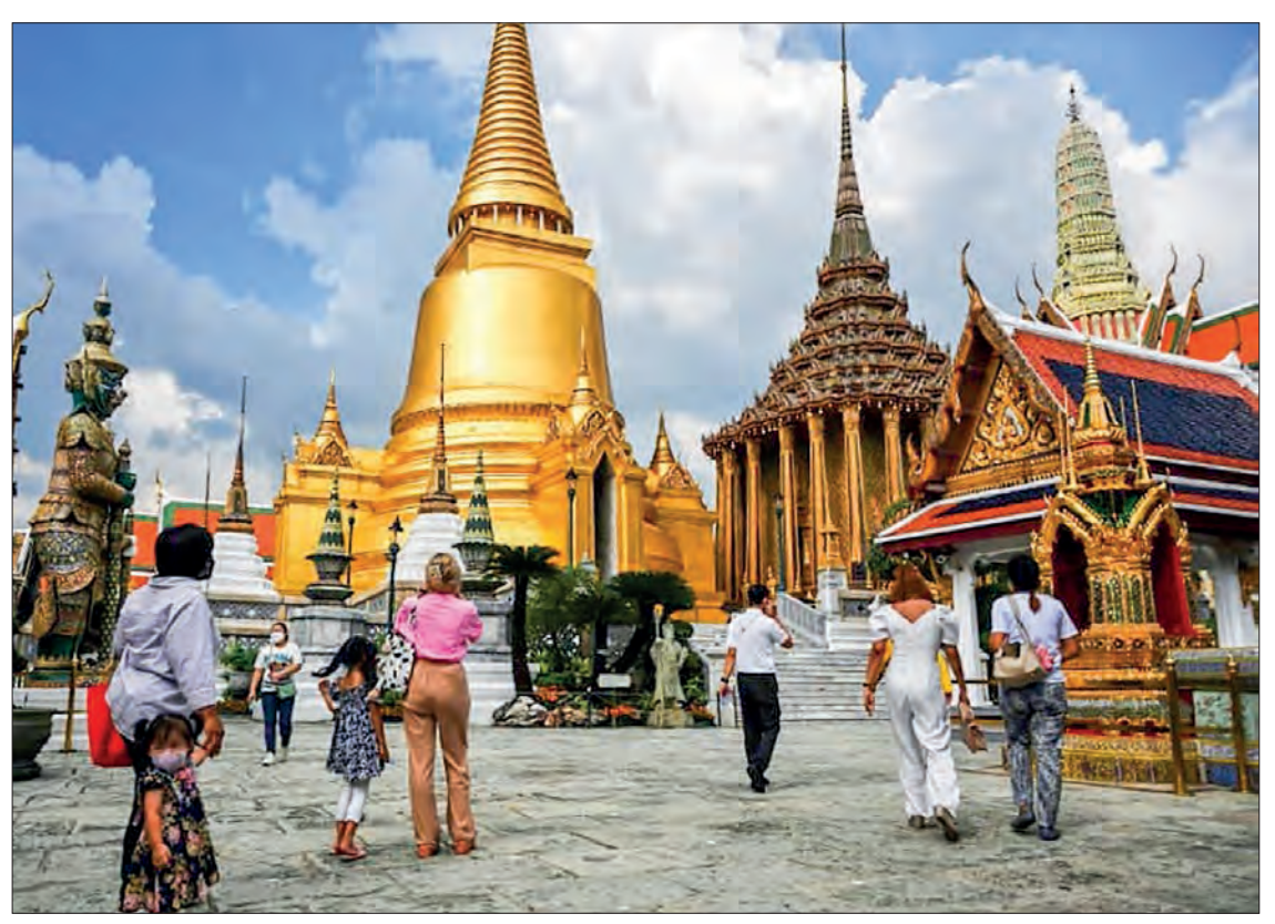
Local visitors enter the Grand Palace on the day of reopening in Bangkok on 1 Nov 2021, as Thailand welcomes the first groups of tourists fully vaccinated against the Covid-19 coronavirus without quarantine.