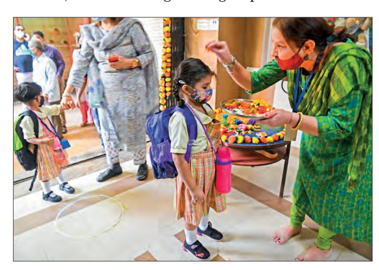
A teacher traditionally welcomes a student upon her arrival at a school in Mumbai on 24 January 2022, after schools were reopened that were closed as a preventive measure to curb the spread of the Covid-19 coronavirus.

Besides, 39 deaths due to the pandemic since Wednesday morning took the total death toll to 525,116. The daily positivity rate stood at 4.16 per cent, while the weekly positivity rate was 3.72 per cent, revealed the ministry. So far, 42,822,493 people have been successfully cured and discharged from hospitals, of whom 13,827 were discharged during the past 24 hours.—ANI