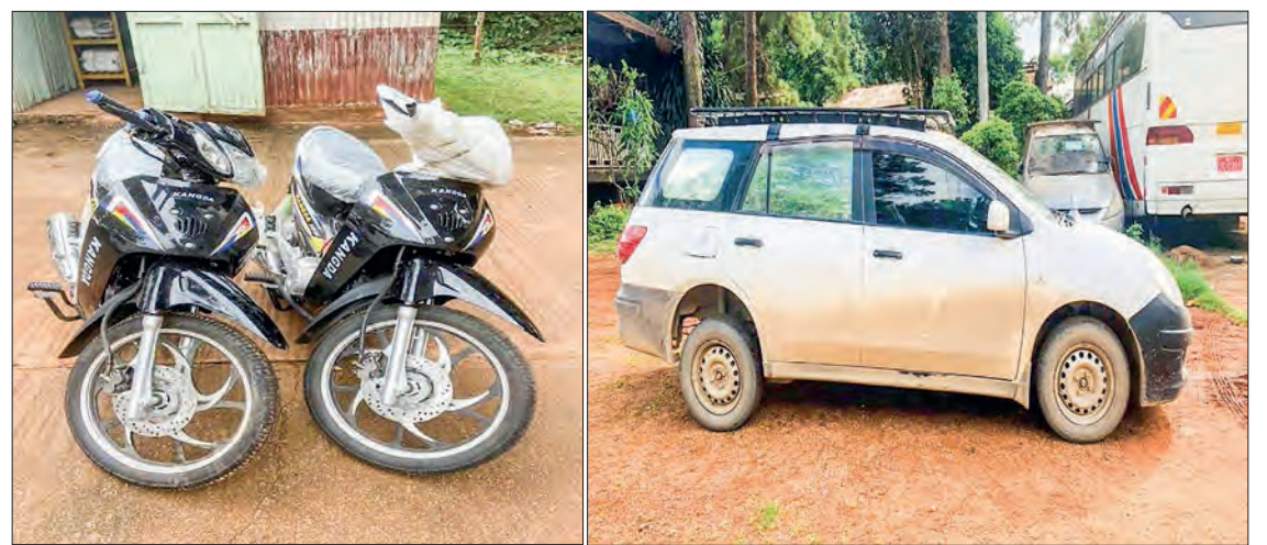
Seized motorbikes and a vehicle.

Therefore, 18 arrests (approximately K102,099,964) were made on three consecutive days from 28 to 30 June, according to the Anti-Illegal Trade Steering Committee. — MNA