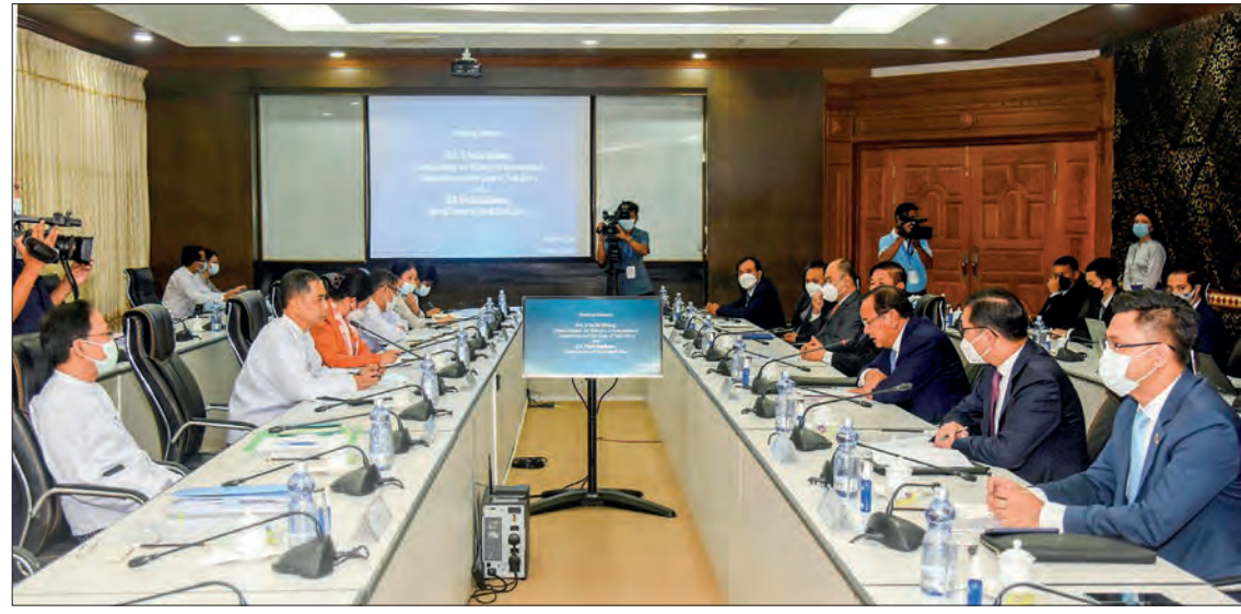
Union Minister U Ko Ko Hlaing meets Mr Prak Sakhonn, Deputy Prime Minister, Minister of Foreign Affairs and International Cooperation of Cambodia in Nay Pyi Taw yesterday.

The meeting was attended by Dr Thet Khaing Win, Union Minister for Health and Vice-Chairman of the Task Force, Dr Daw Thet Thet Khine, Union Minister for Social Welfare, Relief and Resettlement and Vice-Chairperson