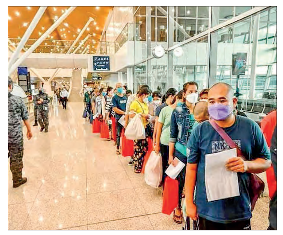
Myanmar nationals are seen at the Malaysian airport before repatriating to Myanmar.

Officials from the Myanmar Embassy to Malaysia help repatriate them to Myanmar by the Myanmar Airways International (MAI) relief aircraft. —TWA/