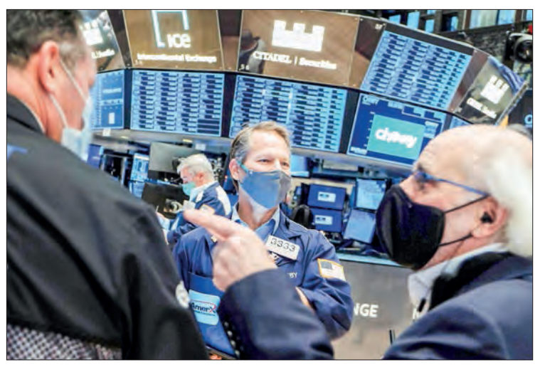
The US economy in the first quarter of 2022 shrank 1.5 per cent from the previous quarter on an annualized basis, according to the second estimate by the US Department of Commerce.

In an interview with Fox Business on Monday, Moore said that people's incomes in real terms are falling fast at a rate of