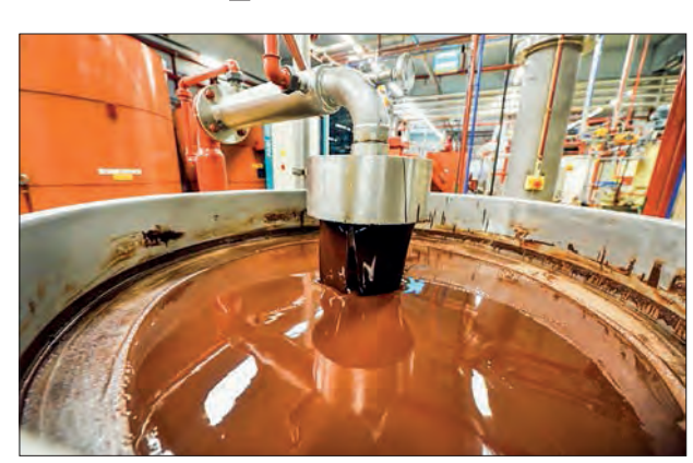
Barry Callebaut's plant in Wieze, Belgium, produces liquid chocolate in wholesale batches for 73 clients making confectionaries.

The scare comes a few weeks after a case of chocolates contaminated with salmonella in the Ferrero factory in Arlon in southern Belgium manufacturing Kinder chocolates.—AFP