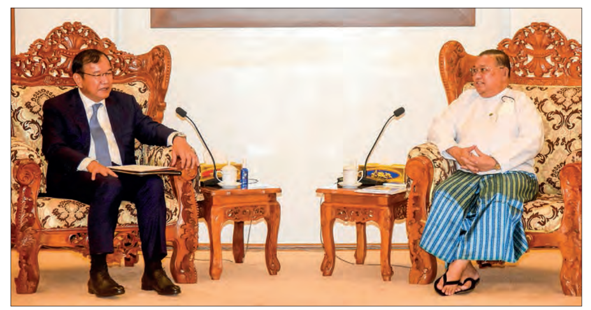
Union Minister U Wunna Maung Lwin receives Mr Prak Sokhonn, Deputy Prime Minister, Minister of Foreign Affairs and International Cooperation and special envoy of the ASEAN Chair Cambodia.

During the meeting, the Union minister exchanged views with the special envoy on the ongoing implementation of the five-point consensus, and way forward in delivering humanitarian assistance to Myanmar in cooperation with the AHA Centre, current ASEAN Chair, and the ASEAN Secretariat.