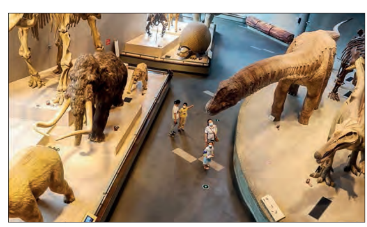
People visit Shanghai Natural History Museum in Shanghai, east China, 1 July 2022.

Meanwhile, the daily positivity rate in the country stood at 3.40 per cent, while the weekly positivity rate had been 3.59 per cent, revealed the federal health ministry. So far, 42,836,906 people have been successfully cured and discharged from hospitals, including 14,413 discharged during the past 24 hours. — Xinhua