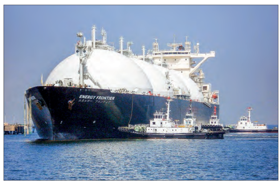
Japanese government spokesman Seiji Kihara said Friday morning that Tokyo was "closely examining the impact on liquified natural gas (LNG) imports". A liquefied natural gas (LNG) tanker arrives at a gas storage station at Sodegaura city in Chiba prefecture, east of Tokyo.

"Speaking generally, we believe our resource interests must not be