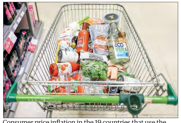
Consumer price inflation in the 19 countries that use the euro soared to 8.6 per cent in June, up from the prior record of 8.1 per cent in May.

The EU's Eurostat data agency said annual consumer price inflation in the 19 countries that