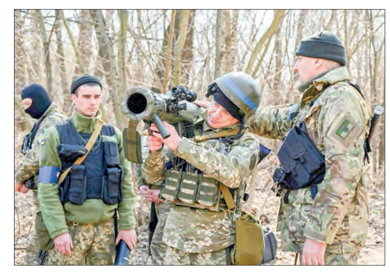
Members of the Ukrainian Territorial Defence Forces attend tactical, combat and first aid training course during Russia's military invasion launched on Ukraine.

Konashenkov said of the troops returned to Russia: "near-