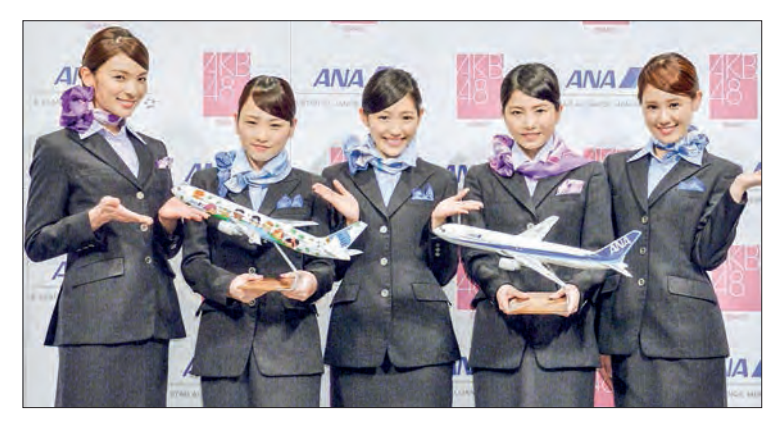
All Nippon Airways Co. launched a project Wednesday in collaboration with Japanese all-girl pop group AKB48 to push young Asians to travel.

ALL Nippon Airways Co. said Thursday that it will resume direct flight operations from Beijing to Narita airport near Tokyo from 11 July, after being suspended for more than two years against a backdrop of the novel coronavirus spread.