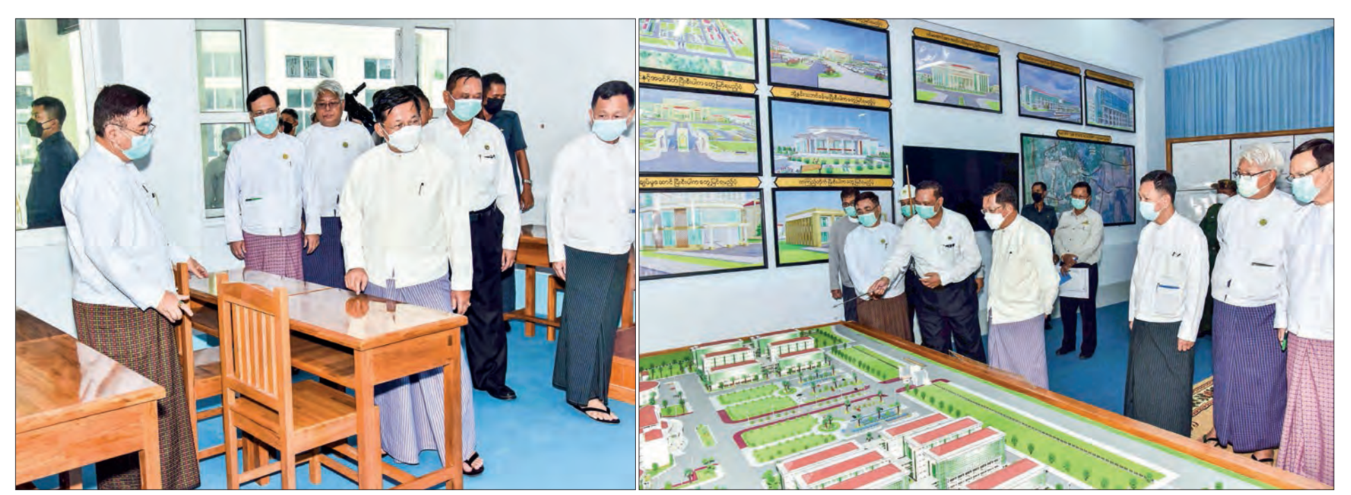
The Senior General inspects lecture halls of the Naypyitaw State Academy and looks into the miniature version of the Naypyitaw State Academy.