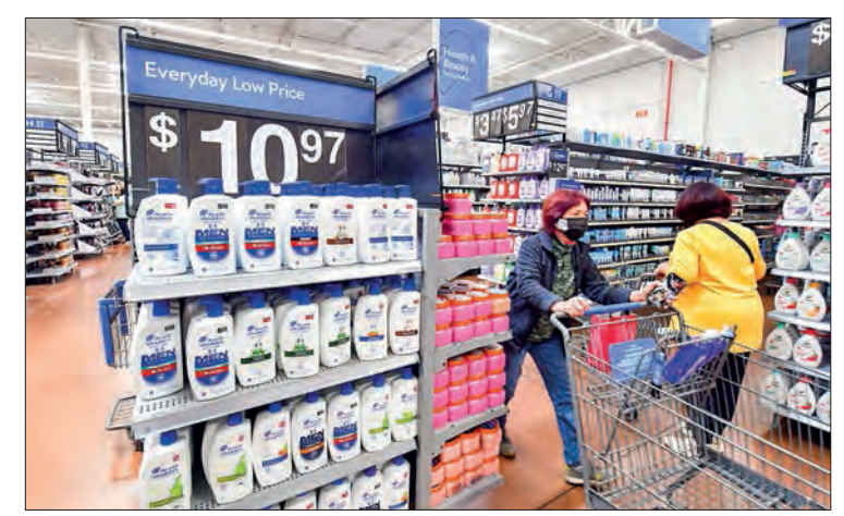
A key US inflation measure showed price increases held steady in the 12 months ended in May, while consumer spending growth slowed sharply, a good sign in the battle against soaring prices.

Excluding volatile food and energy prices, PCE rose 0.3 per cent in the month, the same as in April, and slowed slightly to 4.7 per cent over the past year, the report said.—AFP