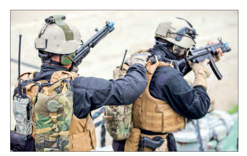
The prime minister stressed that, during the NATO summit, Portugal reaffirmed that it intends to reach 2 per cent "during the decade", reiterating that the country "does not like to make commitments that are not certain and secure".

PORTUGAL'S prime minister said on Thursday that Portugal could "speed up convergence" towards the target of 2 per cent of GDP reserved for defence if Community funds were made available, committing only to reaching that target "over the decade".