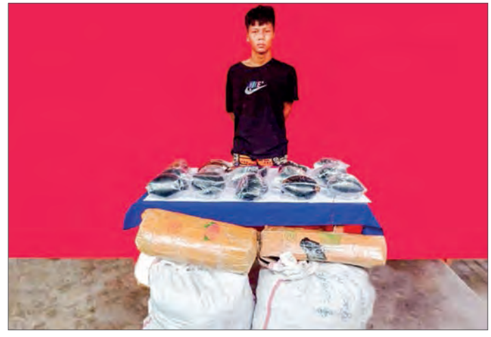
An arrestee is seen along with seized drugs.

DRUGS were seized in Mohnyin and Mongmit townships, Myanmar Police Force