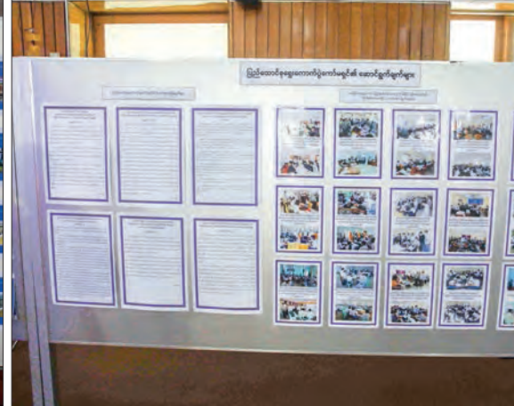
The local and foreign media personnel record the panel boards displaying photos and documents at the 17th press conference yesterday.