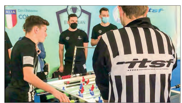
The International Table Soccer Federation (ITSF) has targeted the use of technology and digital connectivity to aid its growth. PHOTO: AFP/FILE

Traditionally played in bars or outdoors, and often accompanied with alcohol, cigarettes and shouting, table football is usually seen as a bit of fun.—AFP