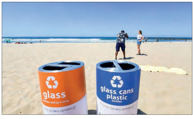
Recycling bins are seen at Venice Beach in Los Angeles, California in June 2021.

"California won't tolerate plastic waste that's filling our waterways and making it harder to breathe. We're holding polluters responsible and cutting plastics at the source," Governor Gavin