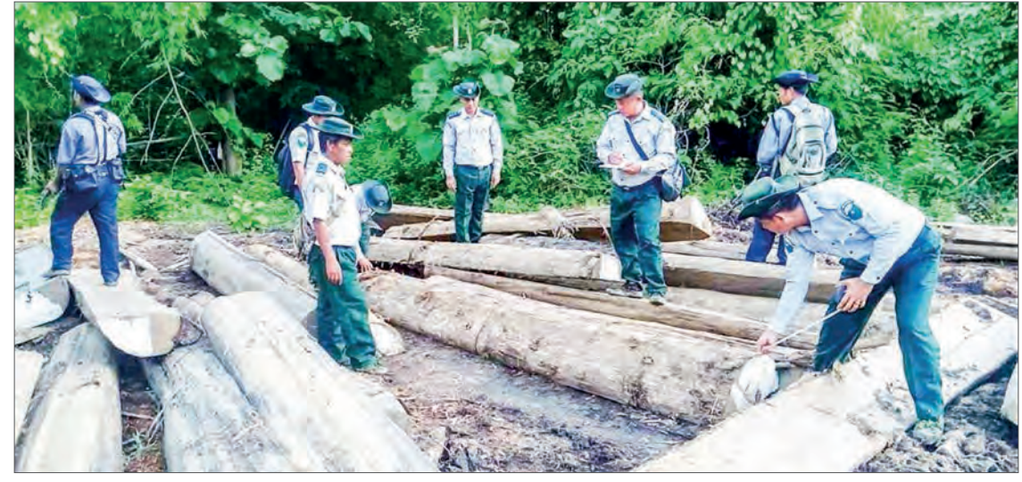
Officials confiscate illegal teak, hardwood and timbers.

In addition, a total of 22.2116 tonnes of teak and hardwood timber at an estimated value of K9,026,672 were captured in Bago and Toungoo districts on 1 July.