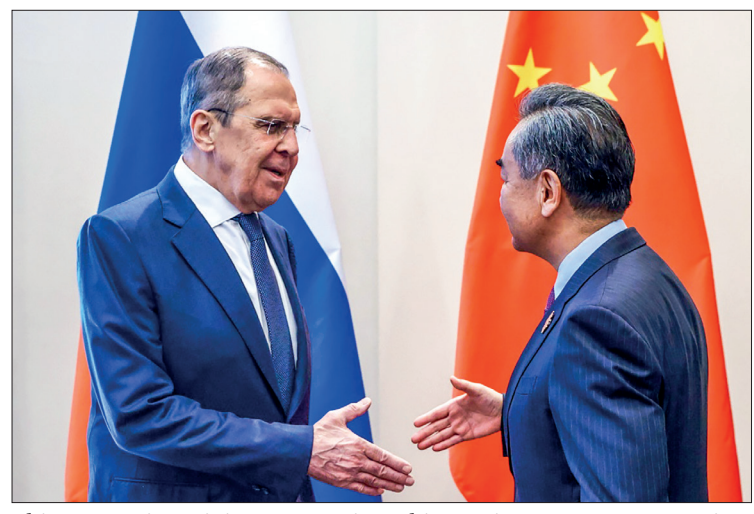
Chinese Foreign Minister Wang Yi met his Russian counterpart Sergei Lavrov in Bali on Thursday for talks ahead of a G20 ministerial meeting marred by Moscow's invasion of Ukraine.

CHINESE Foreign Minister Wang Yi met his Russian counterpart Sergei Lavrov in Bali on Thursday for talks ahead of a G20 ministerial meeting marred by Moscow's invasion of Ukraine.