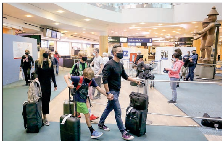
Travellers wearing face masks are seen at the arrival hall of Vancouver International Airport in Richmond, British Columbia, Canada, 10 June 2022.

The results are based on population seropositivity, or "the proportion of people with antibodies to SARS-CoV-2 in their blood", the report explained, adding that the research differentiated between antibodies that occurred naturally as a reaction to being infected by the virus and antibodies creat-