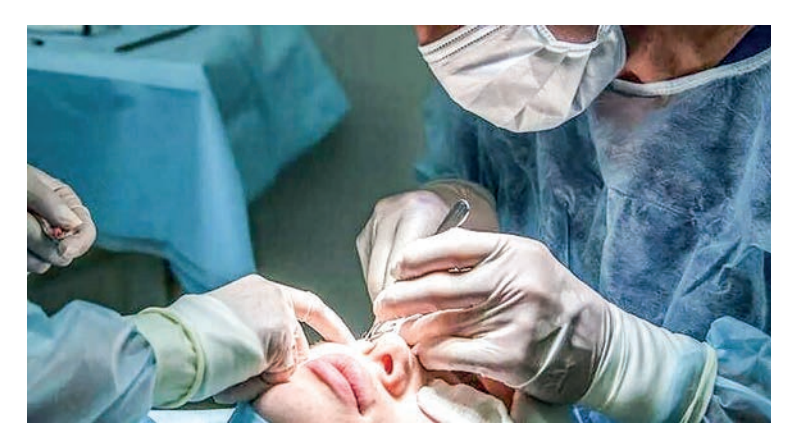
Russia ranks ninth globally in the number of aesthetic procedures carried out annually — 621,600 in 2020, according to the International Society of Aesthetic Plastic Surgery.

WHEN it comes to looking good, Russian women are happy to splash out, even on a bit of nipand-tuck plastic surgery.