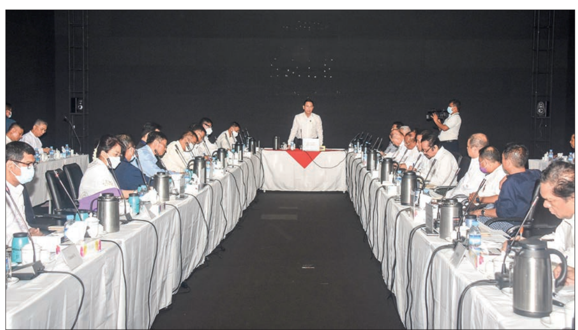
Union Information Minister U Maung Maung Ohn addresses the third coordination meeting to organize the film, music and theatre variety show, in Yangon yesterday.

THE Myanmar Comedians Association (Central) performed the 12th respect-paying ceremony to senior comedians at MRTV Studio (A) on Pyay Road in Yangon yesterday.