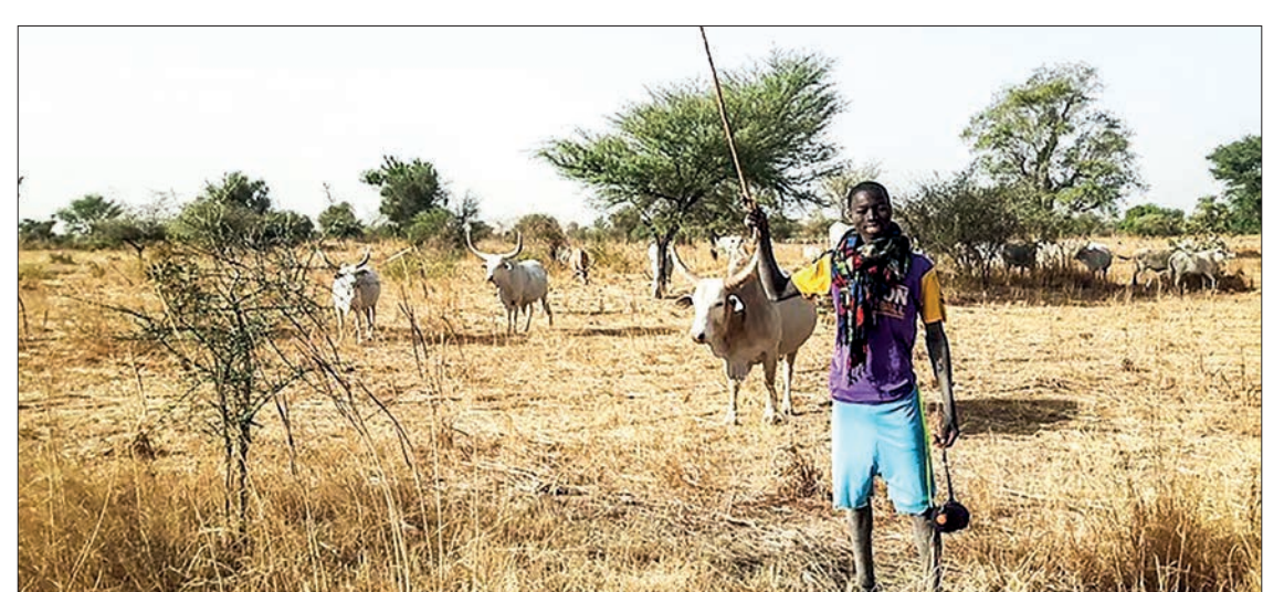
Non-governmental groups in Niger Wednesday urged Nigeriens to use less wood to grill their mutton during the Muslim festival of Eid al-Adha this year to save precious trees.

NON-GOVERNMENTAL each year for the feast, the groups in Niger Wednesday environment ministry has said. urged Nigeriens to use less wood to grill their mutton during the Muslim festival of Eid al-Adha this year to save precious trees.