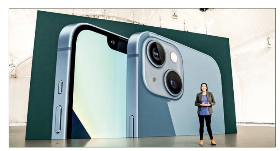
A new 'Lockdown Mode' will let iPhone users block capabilities or features that could be exploited by spyware planted on devices.

Concerns over digital snooping have been fuelled by media outlets reporting that Pegasus spyware made by NSO Group in Israel was being used by governments to surveil opponents, activists and journalists. Apple is suing NSO Group in US federal court, saying the Israeli firm's spyware was used to attack a small number of iPhone users worldwide. -AFP