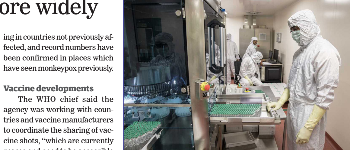
A technician waits to collect vials containing vaccine after they pass through a machine that checks for bottling and vaccine substance deficiencies.

WHO is also working closely with civil society and the LG-BTIQ+ community, especially to break the stigma around the virus and spread accurate and reliable information so people can protect themselves, he added.