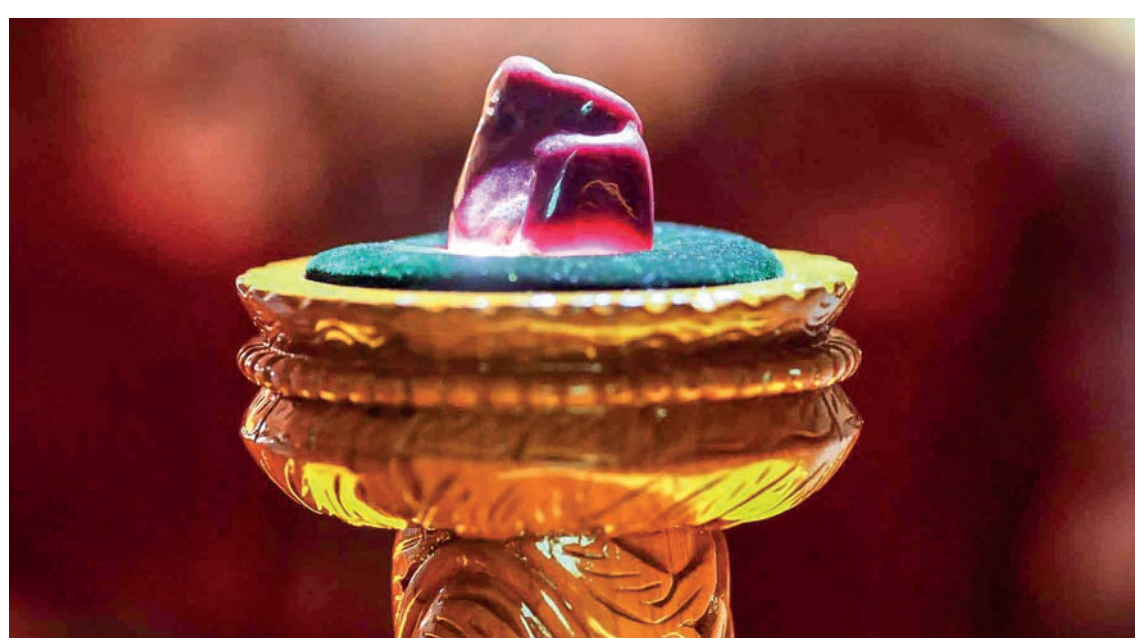
The 2,789.25-carat ruby.