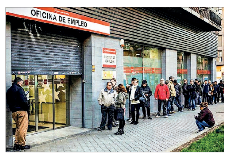
By the end of June, the number of jobseekers in Spain stood at 2.88 million down from 2.92 million a month earlier and the lowest monthly figure since the start of the financial crisis in 2008.

SIX months after Spain pushed through a key reform aimed at reducing labour market insecurity, the number of temporary contracts has fallen sharply, giving