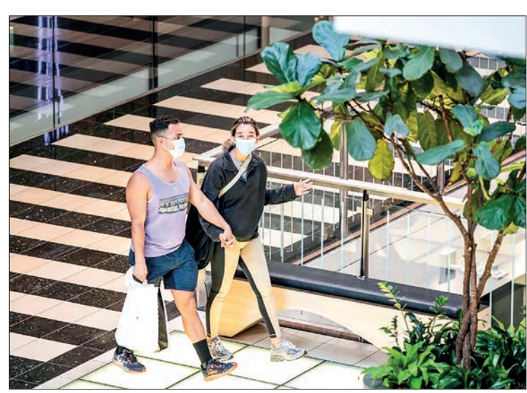
Customers wearing face masks visit a shopping mall in San Francisco, the United States, 3 August 2021.

is currently averaging nearly 110,000 new cases each day, which is about 10,000 more infections than the average a week prior, said the report.—Xinhua