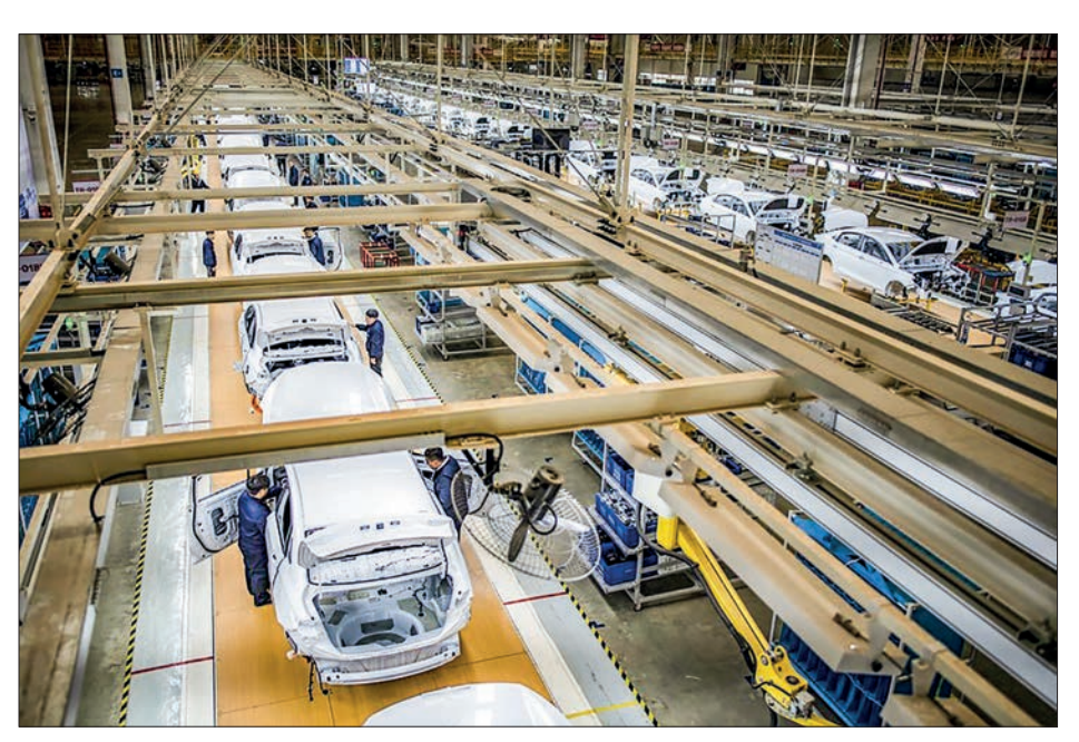
Photo taken on 3 December 2020 shows a production line of new-energy vehicles in Kunming, southwest China's Yunnan Province.