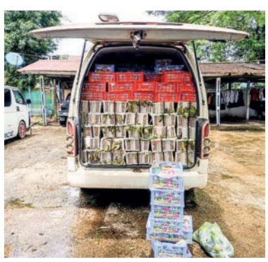
Seized goods in Mon State.

Officials confiscated K27,150,000 worth of car parts that exceeded the Import Declaration (ID) from a 22-wheel truck (approximately K80 million) heading from Myawady to Yangon. The action was filed under the Customs Procedures.