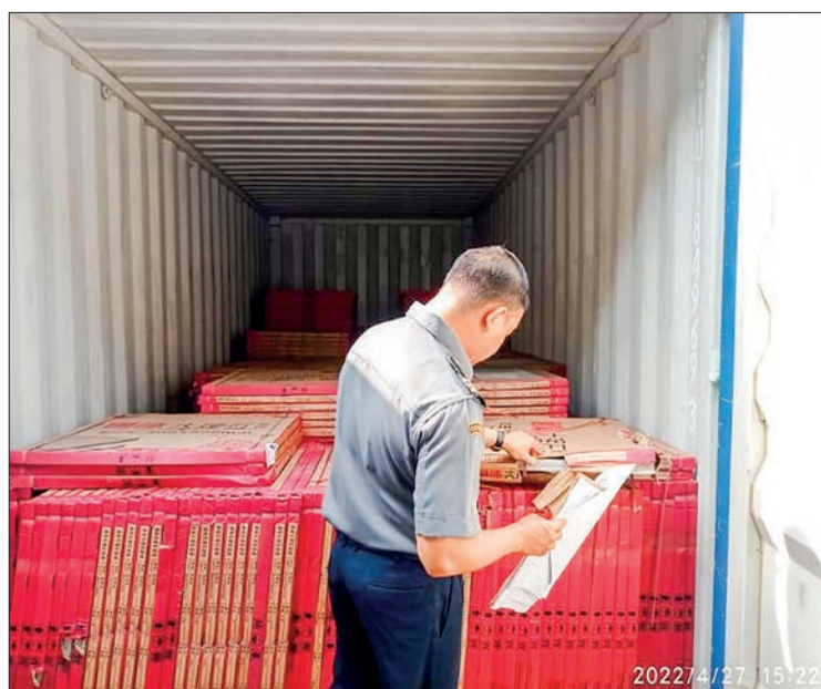
Confiscated illegal items.

Therefore, 52 arrests (estimated value of K835,851,454) were made from 27 to 29 April, according to the committee. — MNA