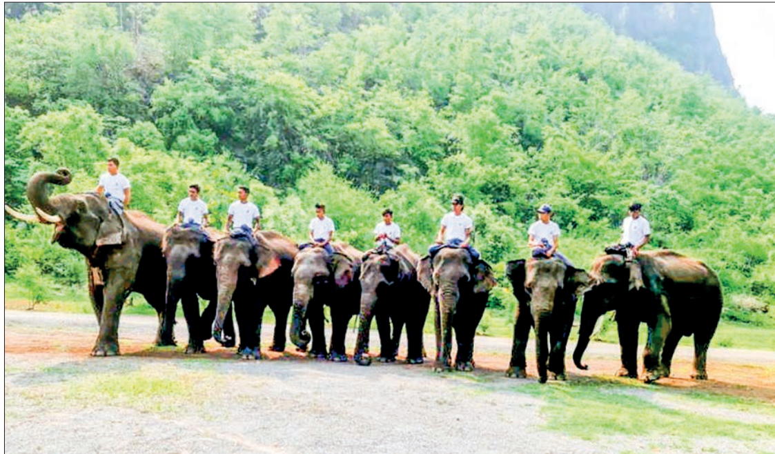
Resumption of its tourism service for tourists and domestic visitors at the Wanat Elephant Camp.

The COVID-19 consequences shut down the camps temporarily. As the COVID cases have dropped and the camp has been prepped for the visitors to enjoy the natural scenery with the best facility and services, officials concerned called for ease of tourism restrictions at the camp, and the regional government