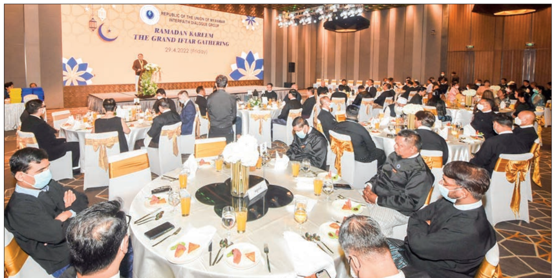
The break-fast dinner (Iftar) event in progress.

THE Muslim community's break-fast dinner (Iftar), organized by the Interfaith Friendship and Solidarity Committee, was held yesterday evening at Wyndham Grand Hotel in Yangon.