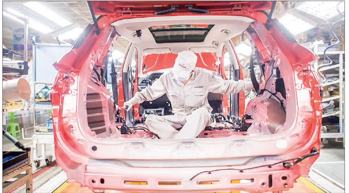
China has a complete manufacturing system, superior infrastructure and a gradually-improving business environment.

Yu expressed the belief that the steady growth of imports and exports highlights the vitality of China's foreign trade and the