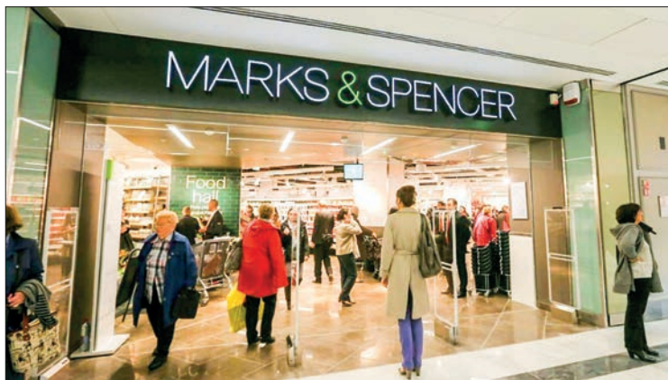
Customers arrive at a Marks & Spencer store in the So Ouest shopping centre in Levallois-Perret, outside Paris.

THE French economy flatlined in the first quarter as households reduced their consumption due to rising inflation and the war in Ukraine, the national statistics