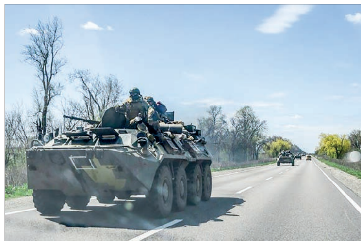
Ukrainian servicemen ride on an armoured personnel carrier (APC) as they make their way along a highway on the outskirts of Kryvyi Rih.

He also called on the UN chief to make efforts to stop the "deportation" of Ukrainian citizens to Russia and return home Ukrainians from Russia.