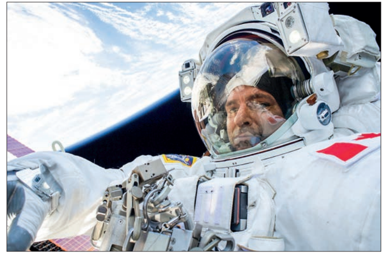
8 April 2019: Expedition 59 Flight Engineer David Saint-Jacques of the Canadian Space Agency participates in a six-and-a-half hour spacewalk with NASA astronaut Anne McClain (out of frame).

The Canadian Space Agency is participating in the NASA-led Lunar Gateway project, along with the European Space Agency and the Japan Aerospace Exploration Agency. —AFP