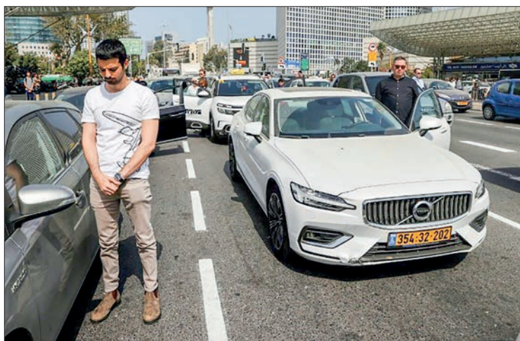
Israeli drivers, including these in Tel Aviv, stopped and stood in silence beside their vehicles to remember victims of the Holocaust.

the Holocaust. But no. Even the most difficult wars today are not the Holocaust and are not comparable to the Holocaust," he said.