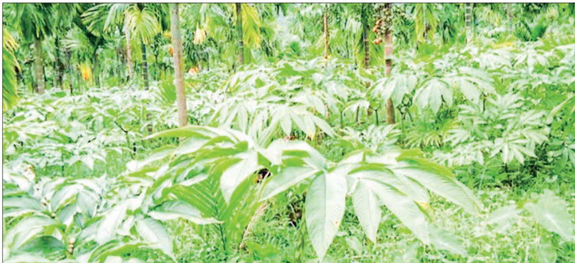
About 300,000 tonnes of rubber are produced annually across the country. Seventy per cent of rubber made in Myanmar goes to China.

The market is quite sluggish in the post-Thingyan period. The price slips to around K1,100 per pound at the end of April. Rubber is commonly produced in Mon and Kayin states and Taninthayi, Bago, and Yangon regions. About 300,000 tonnes of rubber are produced annually across the country. Seventy per cent of rubber made in Myanmar goes to China. — GNLM