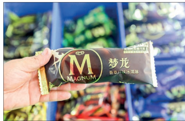
Magnum, a well-known ice cream brand owned by consumer products company Unilever, offers a different list of ingredients for China and Europe.

Inflation, which was accelerating sharply as economies reopened from Covid lockdowns, has worsened following Russia’s invasion of Ukraine. Consumers are “willing to pay more for the things we missed in lockdown, like going out for ice cream, but beyond that Unile-