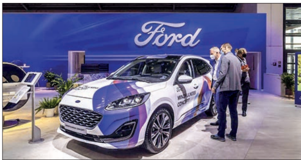
Visitors at a Ford stand in IAA Mobility in Munich, Germany, 6 September 2021.

Chen Xi, a financial freelancer and a pet keeper in Beijing, spotted the niche when she found herself in need.—Xinhua