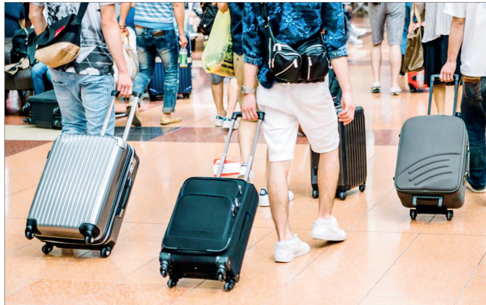
Image of young people travelling abroad on the departure floor

JTB, Japan's top travel industry company, conducts a preliminary questionnaire on the Golden Week plan every year. According to the results, the number of people who answered "go" (the sum of "go" and "and maybe go") about whether to go on a trip during the period was 17.2 per cent at the time of the survey, an increase of 6.9 points