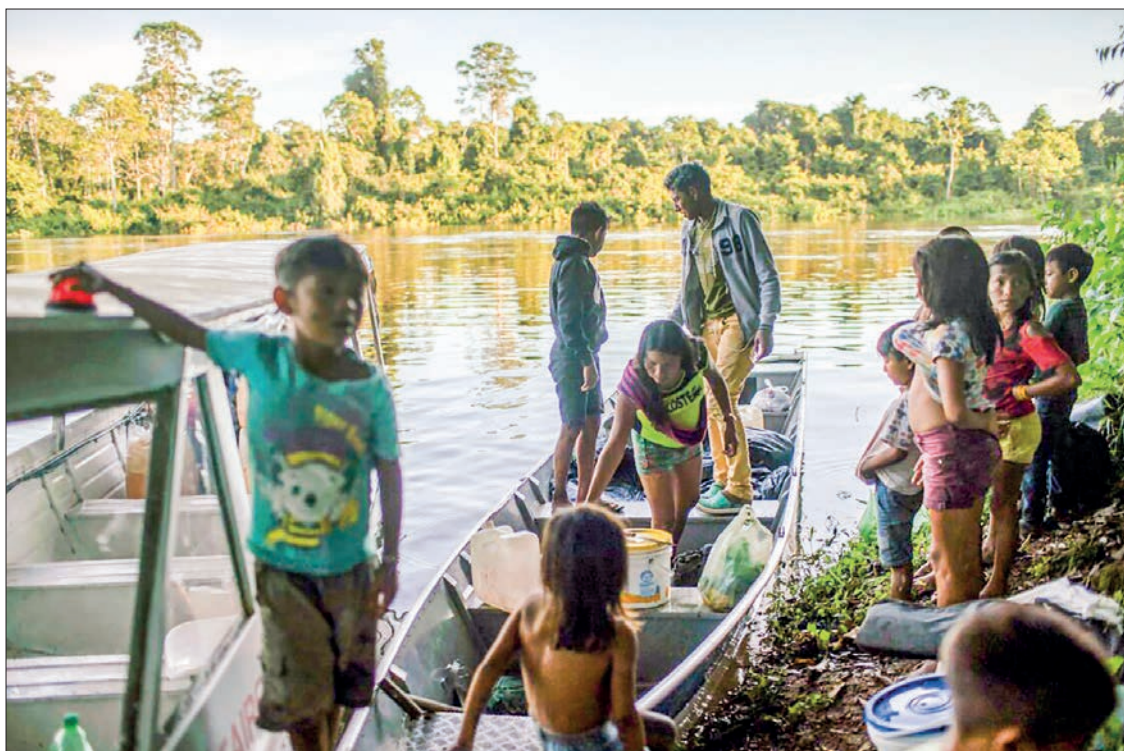
In this file photo taken on 14 March 2019, Arara indigenous walk down a boat on the riverbank of Iri river as they arrive to the Laranjal tribal camp, in Arara indigenous land, Para state, in the northern Brazilian Amazon rainforest.

While the latest report showed a slight overall reduction in the rate of primary tropical forest loss in 2021, down 11 per cent on a year earlier, researchers said rates remain unsustainably high. —AFP