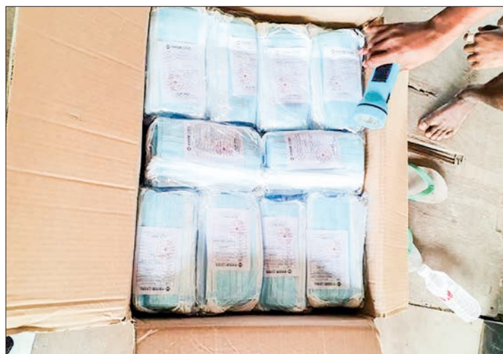
The imported anti-Covid items through Chin Shwe Haw.

It is reported that the Ministry of Commerce is coordinating with relevant departments to prevent COVID-19, and contact persons for enquiries can be reached through the Ministry's Website - www.commerce.gov.mm. — MNA