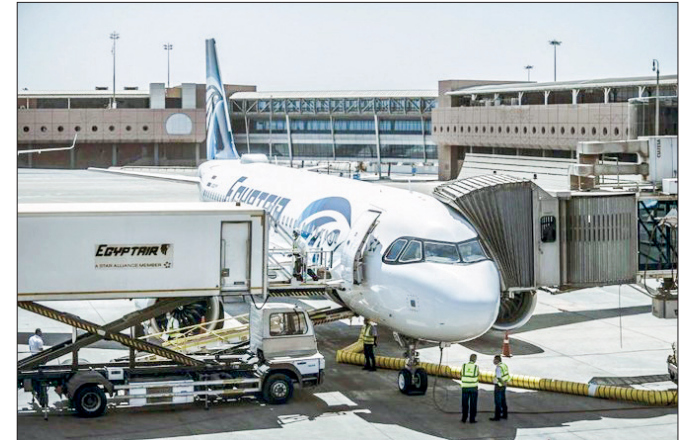
EgyptAir flight MS804 suddenly disappeared from radar screens on 19 May 2016 on its way to Cairo from Paris.

AN EgyptAir crash in 2016 that killed 66 people in the Mediterranean was likely caused by a fire that started in the cockpit, according to the conclusions of French experts contained in documents revealed on Wednesday.