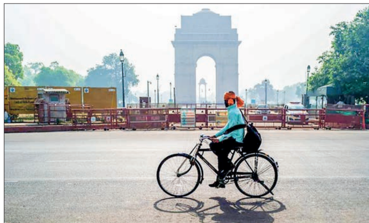
The daily Covid-19 cases in Delhi have been on the rise over the last few days and the positivity rate has jumped from 0.5 per cent to 2.7 per cent in a week.

According to the Delhi government’s health bulletin on Monday, the national capital logged 1,204 new COVID-19 cases taking the total number of active cases in the national capital to 4,508. — ANI