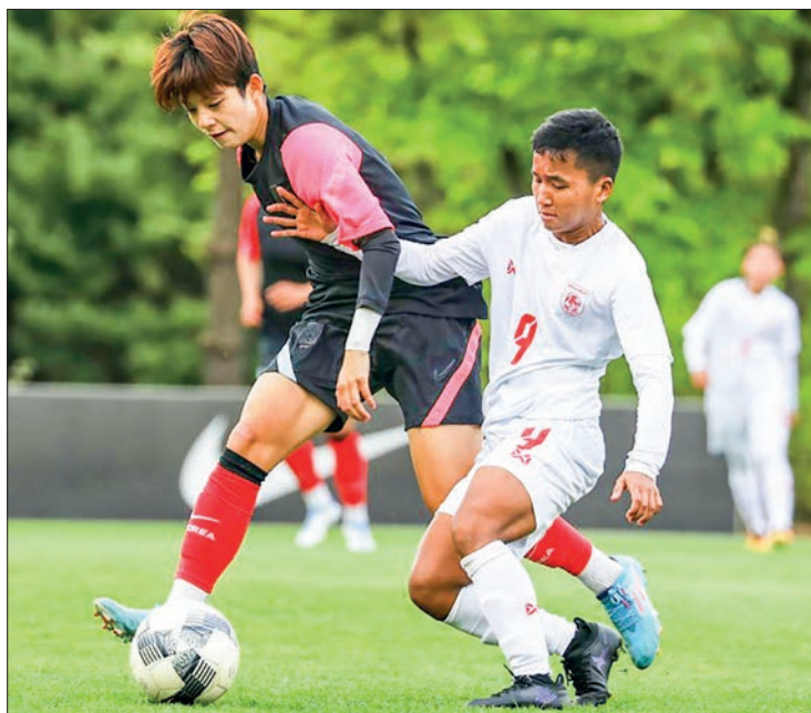
Myanmar women team player (white) tries to cut the ball against the South Korean U-20 youth team during their friendly match on 29 April 2022.

The Myanmar women's team will play three friendly matches on the tour of South Korea, and the second match will be against the South Korean women's club Seoul City on 1 May. — Ko Nyi Lay/GNLM