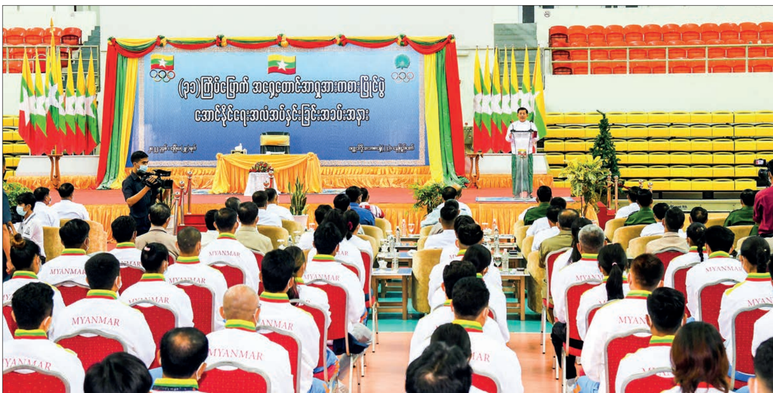
State Administration Council Chairman Prime Minister Senior General Min Aung Hlaing speaks on the occasion of handing the triumphant flag over to Myanmar's sports teams competing in the 31 st SEA Games in Viet Nam, in Nay Pyi Taw yesterday.

A LL athletes should notice that members of the Myanmar sports contingent shall shoulder the national duty to secure victories in all events so as to uplift the prestige of the State through the triumph of sports, said Chairman of the State Administration Council Prime Minister Senior General Min Aung Hlaing in handing over the flag to ensure victory to the Myanmar sports teams which will take part in the XXXI SEA Games in Viet Nam, at Wunna Theikdi Gymnasium B in Nay Pyi Taw yesterday morning.