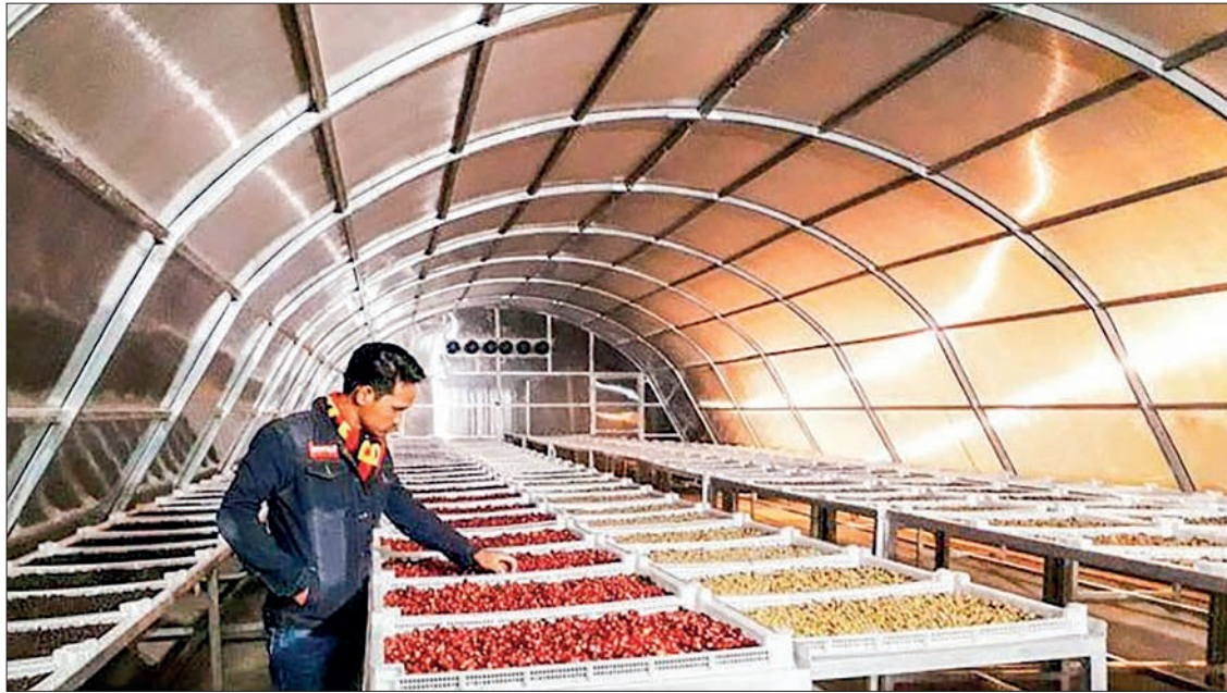
There are 40,000 acres of highland coffee (Arabica) plantations and about 10,000 acres under lowland coffee (Robusta) in Myanmar, totalling 50,000 acres. Shan State is the leading producer of coffee beans.

"Coffee exports are quite early this year. Normally, the transaction happens in June