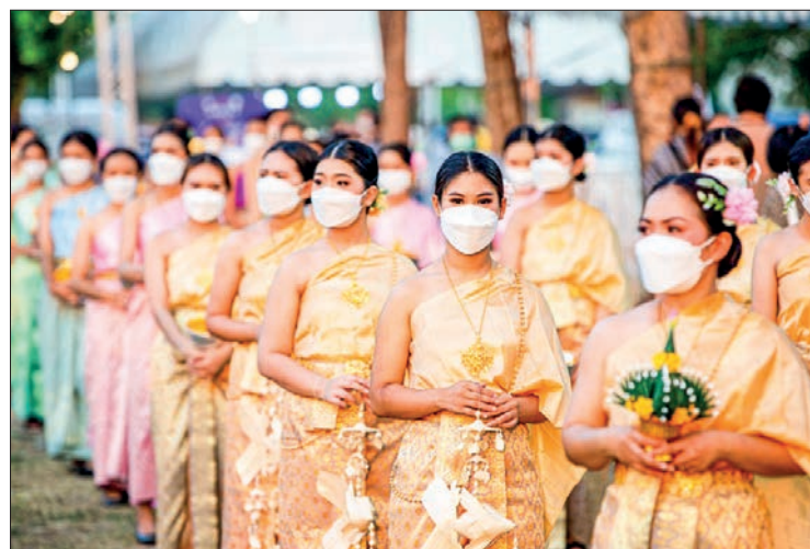
Performers participate in a street parade celebrating the Songkran Festival in Ayutthaya, Thailand, 13 April 2022.

“The fact is that we’re not out of this yet,” he said. Maria van Kerkhove, technical lead for the WHO’s Health Emergencies Programme, said that despite the recent positive trends, she had “little confidence in the number of cases being reported around the world” due to the massive changes in testing strategies and the huge reductions in the number of tests being performed around the world.—Xinhua