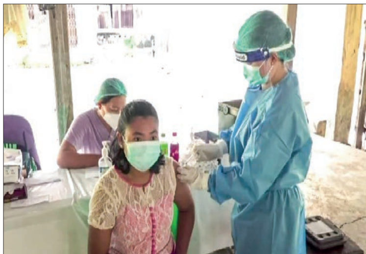
A local in Mon State gets jabbed against COVID-19.

DOCTORS and nurses from public hospitals, Tatmadaw medical teams, healthcare workers and volunteers are working hard to give COVID-19 vaccines in different states and regions as the vaccination programme is one of the most important activities in the prevention, control and treatment of COVID-19 disease.