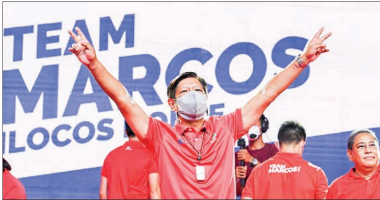
Presidential candidate Ferdinand Marcos Jr. greets supporters during the proclamation rally in Laoag, Ilocos Norte province, north of Manila on 25 March 2022.

PRESIDENTIAL hopeful Ferdinand Marcos Jr has been hounded in previous election debates over questions related to his father's rule of the country.