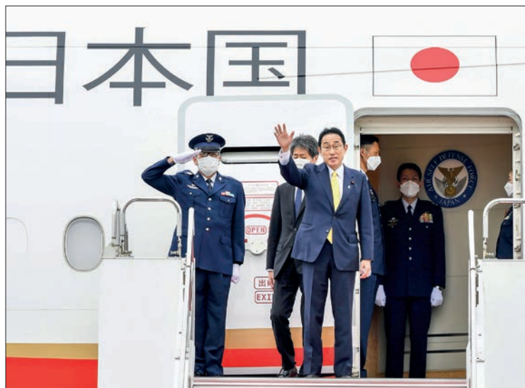
Japanese Prime Minister Fumio Kishida waves before boarding a plane to depart for Indonesia on 29 April 2022, at Tokyo's Haneda airport.

With Japan and other Group of Seven nations taking a tough line on imposing sanctions on Russia following its attack on Ukraine, Kishida also plans to ask ASEAN members, most of