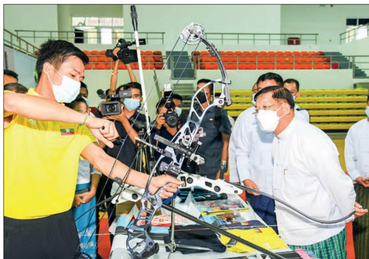
The Senior General looks into the sports equipment.

lion for the silver medalist team and K3.5 million for the bronze medalist team, K10 million for gold medalist coach, K5 million for silver medalist coach and K3 million for bronze medalist coach, K10 million for the gold medalist management team, K5 million for the silver medal and K3 million for the bronze medal respectively.