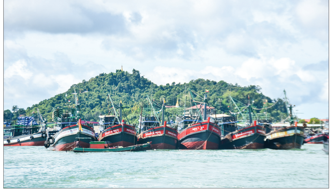
This month, about 50 per cent of offshore fishing vessels will be allowed to go fishing, depending on fishing equipment.

This month, about 50 per cent of offshore fishing vessels will be allowed to go fishing, de-