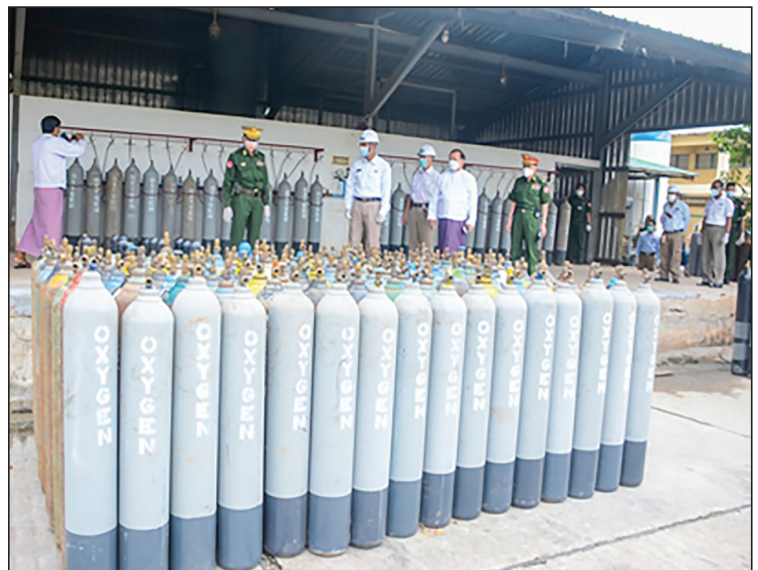
Production of oxygen cylinders at Ywama Steel Factory, Insein.

Factory operated by the Myanmar Economic Corporation in Insein Township.