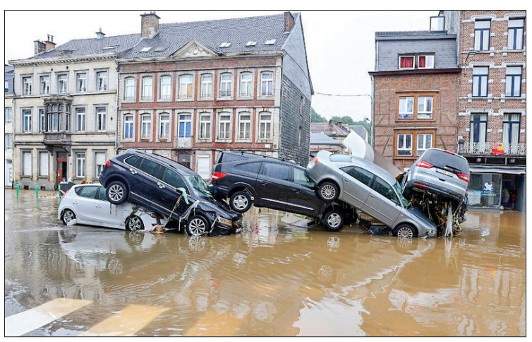
According to the federal police, dozens of road sections remained closed to traffic, as well as most of the railways in Wallonia.

AS of Friday morning, the floods in East and South Belgium have led to the deaths of at least twelve people while five others are missing.