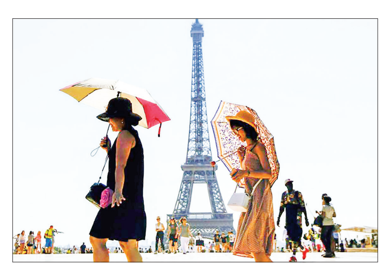
Daily capacity is set to be restricted to 13,000 people, about half of the normal level.

THE Eiffel Tower is to reopen to visitors on Friday for the first time in nine months following