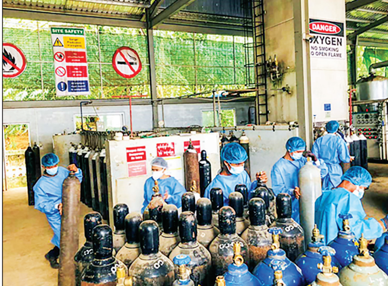
Distribution of oxygen cylinders produced by Myanmar Economic Corporation.

Similarly, the oxygen plants are being established at the 1000-beds and 300-beds public hospitals and 300-beds Tatmadaw Gynaecological and Children Hospitals in Zabuthiri, Pobbathiri and Zeyathiri townships of Nay Pyi Taw