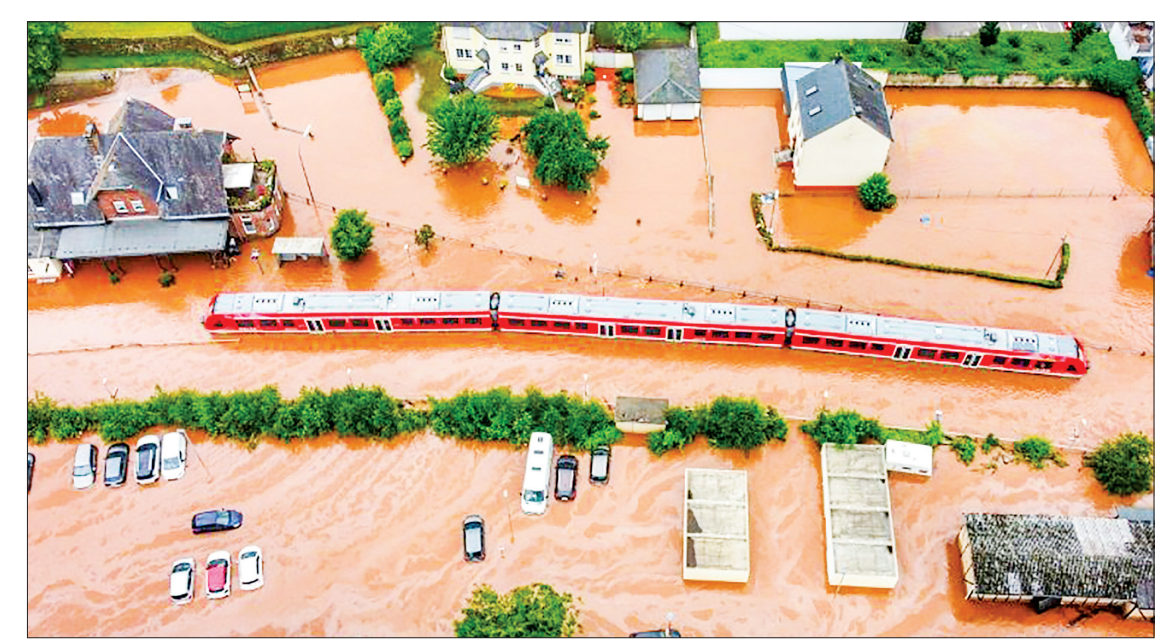
Some towns in Germany were completely underwater.

But Germany's toll was by far the highest at 81, and likely to rise with large numbers of people still missing in North Rhine-Westphalia and Rhine-