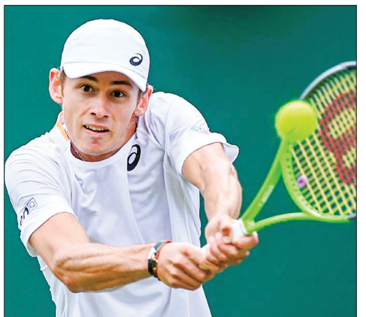
Australian tennis player Alex de Minaur will miss the Olympics after testing positive for Covid-19, according to the country's Olympic officials.