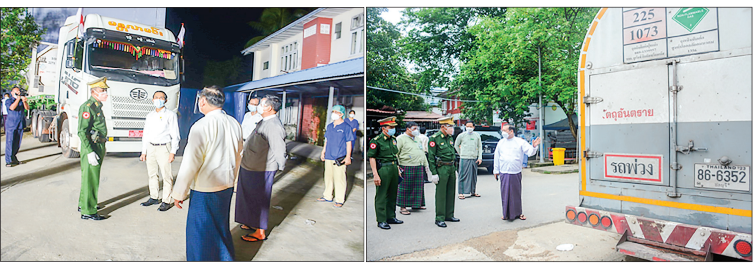
The Chairman of the Yangon Region Administration Council and Commander of Yangon Command are inspecting the arrivals of two bowsers of liquid oxygen at the North Okkalapa Hospital and Yangon General Hospital, respectively.

The Yangon Region Administration Council Chairman and Commander then checked the liquid oxygen distribution processes of Myanma Dockyards in Kamayut Township and production of various oxygen cylinders at Ywama Steel