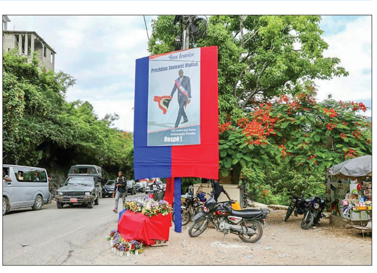
A tribute to late Haitian President Jovenel Moise is seen outside his home in Port-au-Prince.

In October 2017 a police mission -- the United Nations Mission for Justice Support in Haiti -- took over and lasted until October 2019. Any fresh UN operation would have to be authorized by the UN Security Council, according to several diplomats. ■