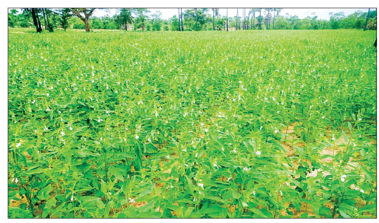
The growers from NyaungU Township are mainly relying on oil crops such as peanut and sesame. The growers are expecting a good price at the harvest time.

ed sesame enter the market, U Maung Htay elaborated.