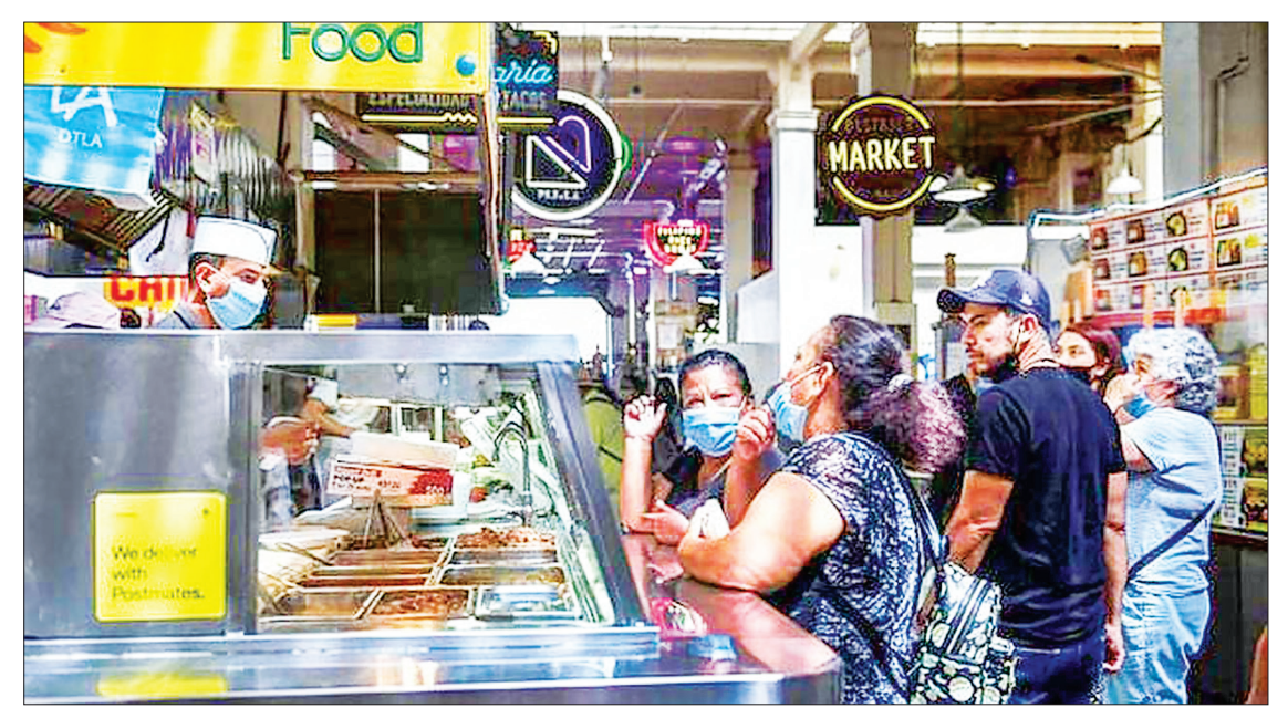
Mandatory indoor mask use returns to Los Angeles.

On Thursday the county reported 1,537 new cases of infection — the highest number since early March, and seventh straight day of new cases numbers topping 1,000. — AFP ■