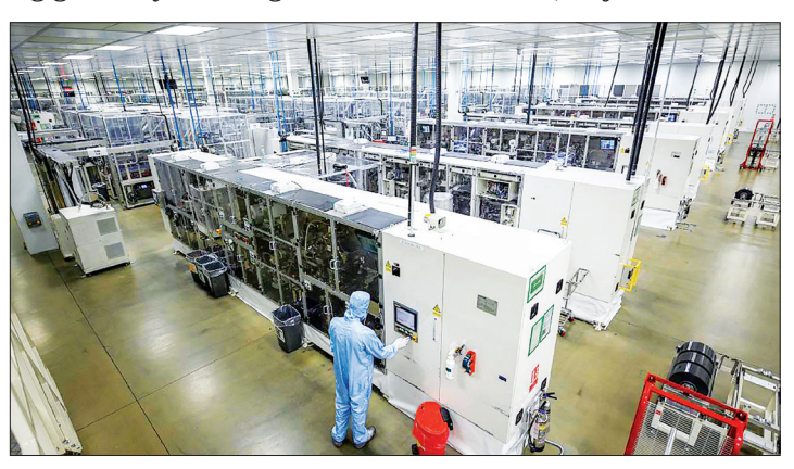
Nissan employees make final checks to cars on the production line at Nissan's plant in Sunderland, north east England on July 1, 2021.

The UK's Unite union welcomed the plans and potential jobs as a "huge shot in the arm" for the West Midlands economy. "The promise of 6,000 jobs and thousands more in the supply chain is exactly what we need to bring stability to the sector during these rocky times," Unite assistant general secretary Steve Turner said. Construction of Nissan's £2.6-billion plant in Blyth was announced in December and construction is to start soon, with the potential creation of 6,200 jobs. —AFP ■