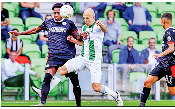
PSV Dutch midfielder Pablo Rosario (L) fights for the ball against Groningen's Dutch midfielder Arjen Robben during the Dutch Eredivisie league football match between FC Groningen and PSV at the Hitachi Capital Mobility stadium on September 13, 2020 in Groningen. PHOTO:

skillful dribblers in his prime, with a devastating left foot, Robben scored more than 200 goals at club level and 37 for the Netherlands, the last against Sweden in Amsterdam in October 2017.