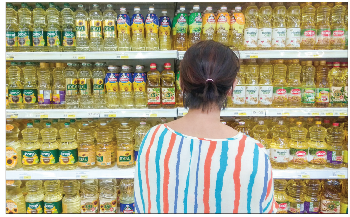
The association will act accordingly not to have oil shortage problems and to distribute the quality oil at an affordable price to the consumers.

THERE is no need to spark concern for the edible oil shortage in the country, Myanmar Edible Oil Dealers' Association released a statement on 15 July.