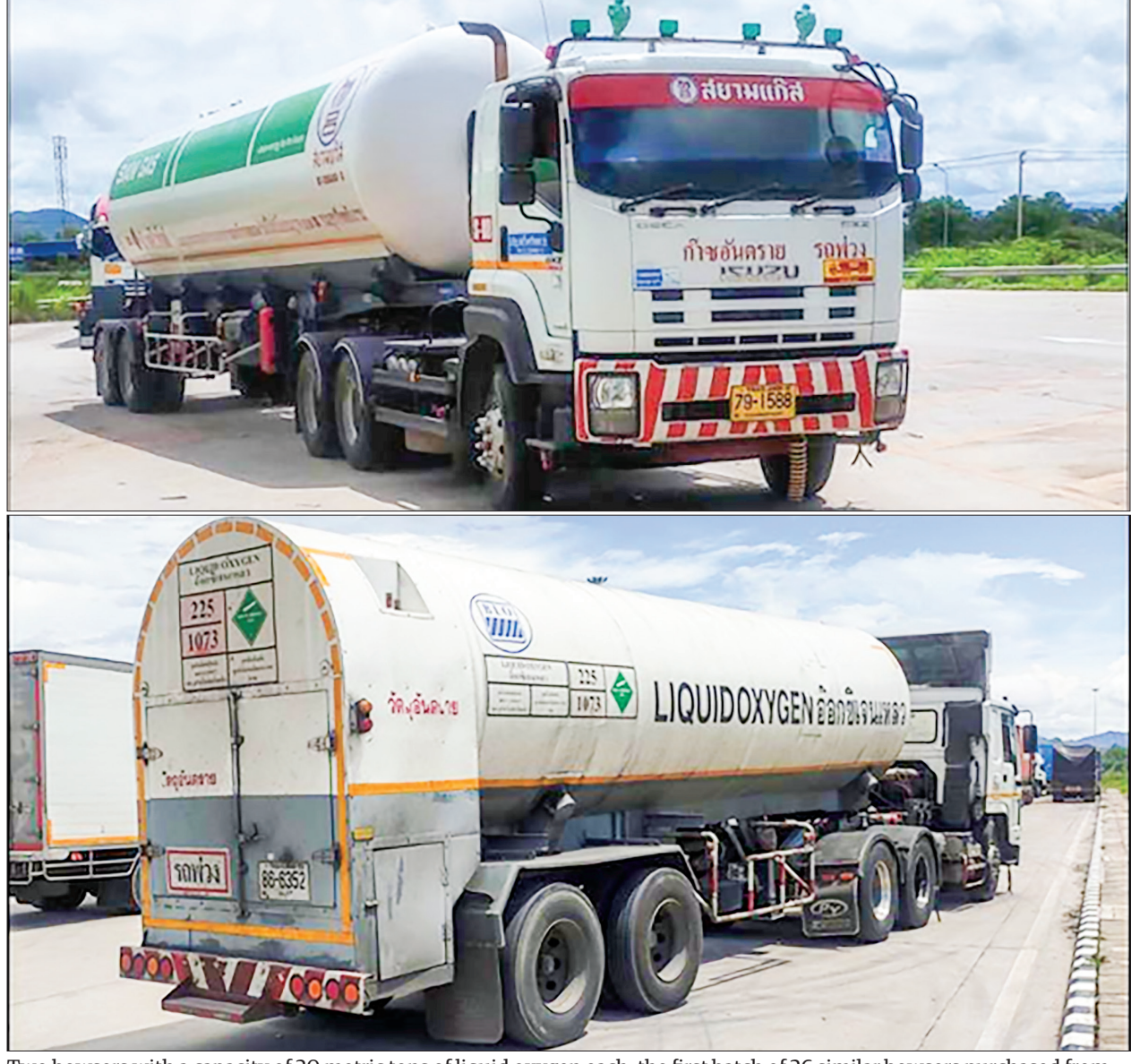
Two bowsers with a capacity of 20 metric tons of liquid oxygen each, the first batch of 26 similar bowsers purchased from foreign countries, arrives in Yangon yesterday.

AS the country needs oxygen supplies in COVID-19 control operations, the officials make efforts to produce oxygen from the government and Tatmadaw-owned oxygen plants, private-owned oxygen plants and import oxygen-related products with the donations of donors.