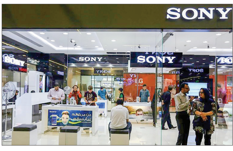
Iranians shop for electronics from Japanese tech giant Sony at a Tehran mall in 2015 amid hopes for sanctions relief.

90 days as "these repayment transactions can sometimes be time-consuming," a State Department spokesperson said. — AFP ■