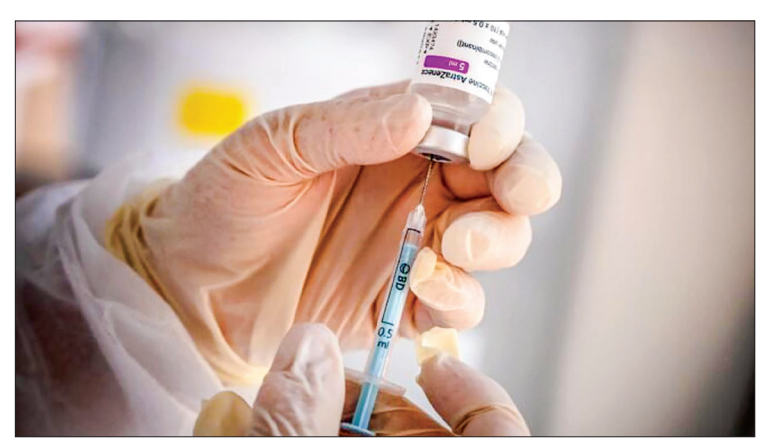
The European Medicines Agency said that evidence suggests that "both doses of a two-dose Covid-19 vaccine... are needed to provide adequate protection against the Delta variant".

Calling it a "variant of concern", the EMA said the Delta strain, first detected in India, was "spreading fast in Europe and may seriously hamper ef-