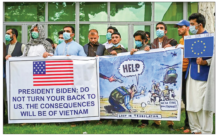
Afghan former interpreters for the US and NATO forces demonstrate in Kabul in April after US President Joe Biden announced the US withdrawal from the country.

ABOUT 20,000 Afghans who worked as interpreters for the United States during its war in