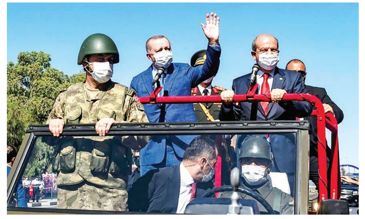
Turkish President Recep Tayyip Erdogan (C-L) and Turkish Cypriot leader Ersin Tatar (C-R) wave as they take part in a parade in the northern part of Cyprus' divided capital Nicosia.

Turkey's foreign ministry hit back, accusing Borrell of "acting as a spokesperson or advocate for the Greek Cypriot