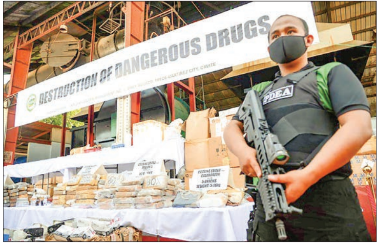
An armed agent of the Philippine Drug Enforcement Agency stands guard next to seized illegal drugs during a news conference.

As leases run out, a Catholic charity is helping families unable to afford the renewal fee to retrieve the bones of their loved ones with the aim of having them cremated and put in a permanent burial site. "I don't want his remains thrown away,"