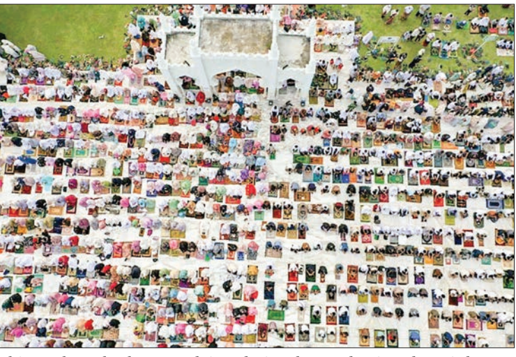
This week marks the second time during the pandemic Indonesia has celebrated Eid al-Adha, which signals the end of the annual pilgrimage to Mecca.

overtaking India and Brazil as a 1,338 on Monday. global Covid-19 hotspot and its