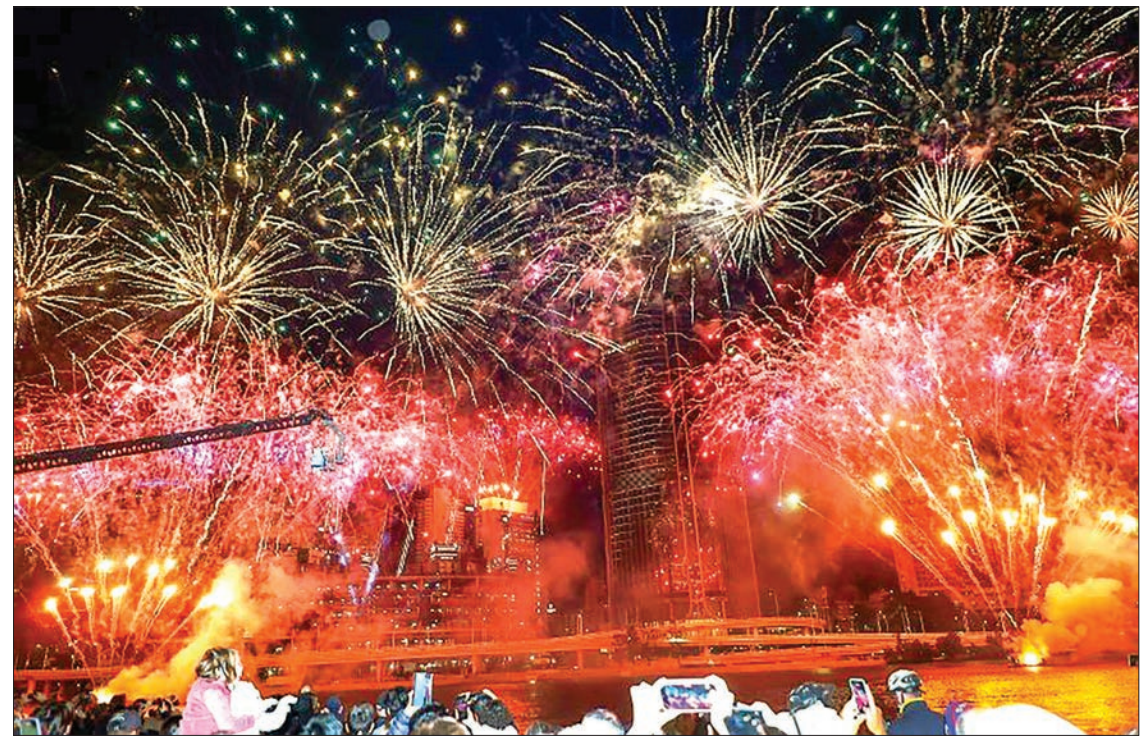
Fireworks filled the sky after Brisbane was named host of the 2032 Olympics.