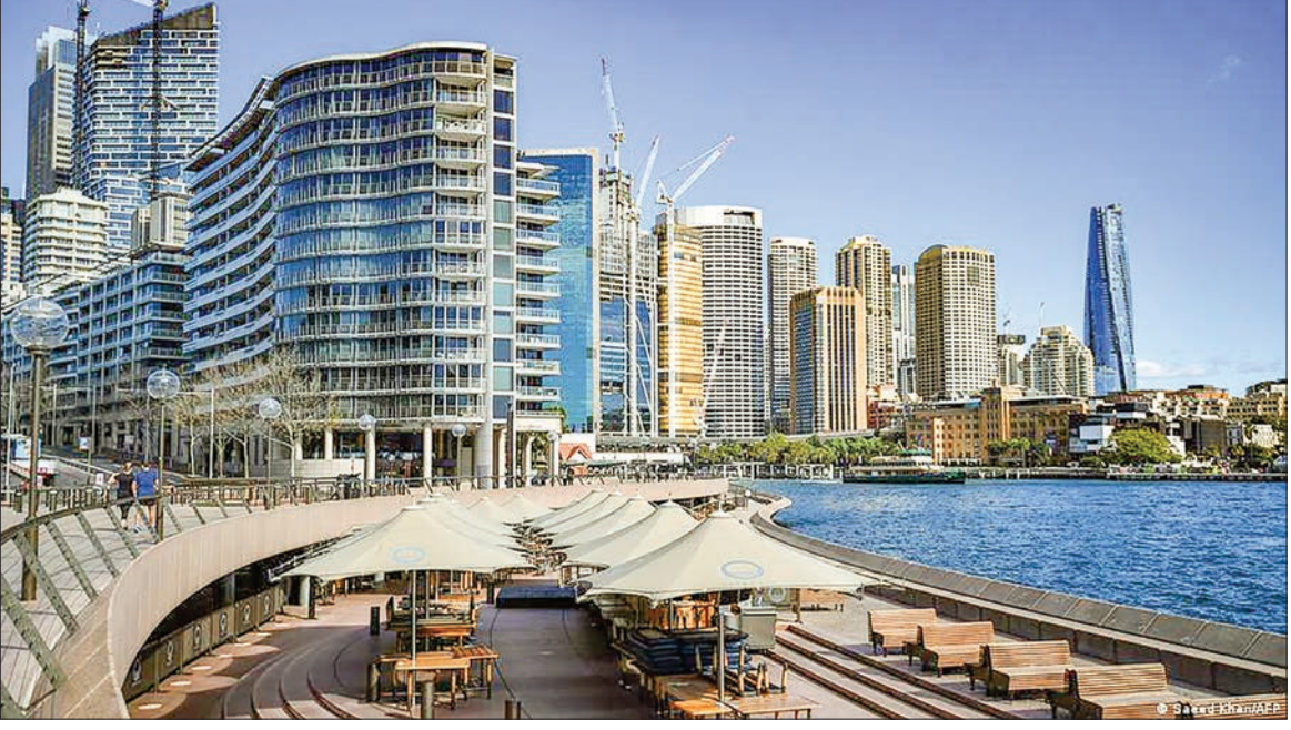
Sydney and some surrounding areas entered a hard two-week Covid-19 lockdown on Jun 26, 2021.

The findings indicate that, while there may be multifaceted