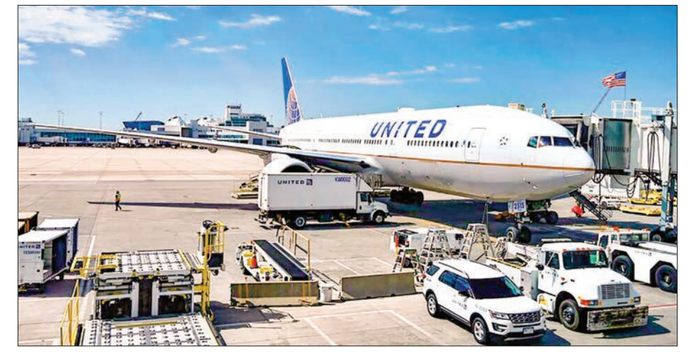
A United Airlines plane sits at the gate at Denver International Airport. The airline industry has been hit hard by the coronavirus pandemic.

"Thanks to the professionalism and perseverance of the United