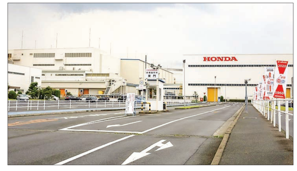
Honda Motor Co.'s Suzuka factory in Mie Prefecture in June 2020.

A global chip crunch has disrupted the production plans of many Japanese and overseas carmakers. Semiconductors have been in high demand for use not only in cars but also a variety of products including laptops and game consoles.-Kyodo 🔳