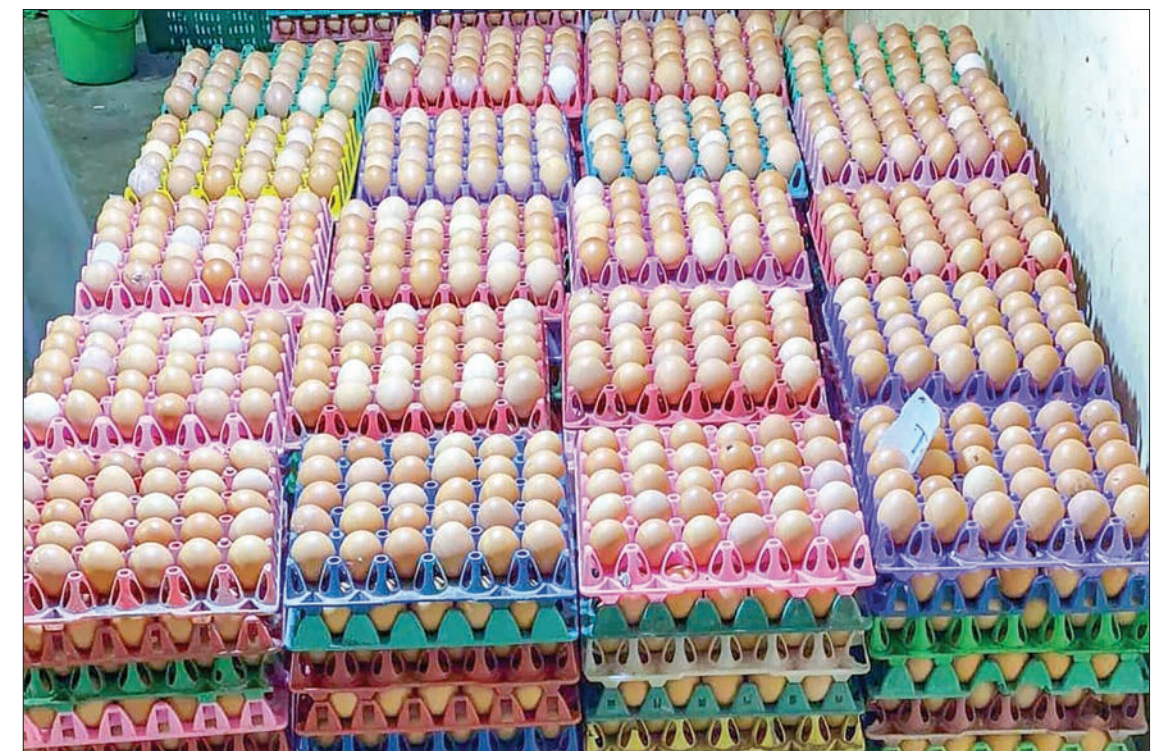
Regarding poultry farming, the breeders are making less profit because the cost of the poultry farm is very high. Besides, sometimes, they are facing loss when the boiler chicken died due to climate changes. Temperatures of 18 to 25 Celsius are best for poultry chick farming.

There are three or four poultry farms in each village. Some of the local breeders are self-raising while some are joint-farming with foreign companies. Now, the local breeders are happy due to a good price of eggs this year," said U Myint Aung, a local breeder from Hsin Gaung village. — Zeya Htet (Minbu)/GNLM`