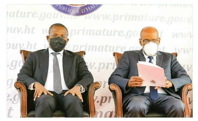
Rivals for power -- Haiti's former interim leader Claude Joseph (L) and new Prime Minister Ariel Henry in Haiti's capital Port-au-Prince as Henry and his new government are sworn in.

HAITI'S new prime minister Ariel Henry took office Tuesday in the aftermath of the president's assassination two weeks ago,